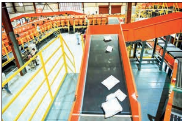
Photo taken on 13 October 2022 shows employees working at the smart distribution centre in Karachi, Pakistan.

Hong Kong tanked 15.5 per cent and Shanghai dived 15.1 per cent in the biggest annual slumps since 2011 and 2018 respectively.—AFP