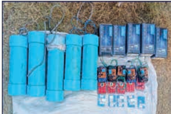
Explosive devices seized together with two suspects in Aungthaya Ward of Chammyathazi Township on 31 December.