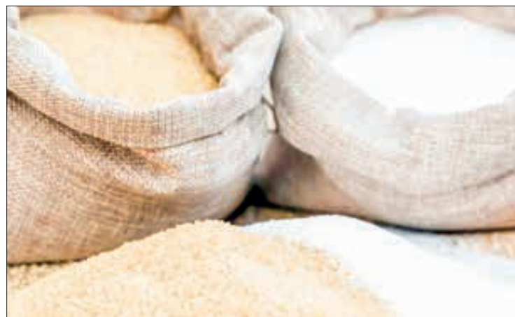
The undated picture shows brown sugar and white sugar found in markets.

THE price of sugar bounced back in the Yangon market when sugar mills are running at the end of the year 2022.