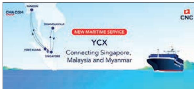
Route of Singapore-Malaysia-Myanmar in new maritime service.