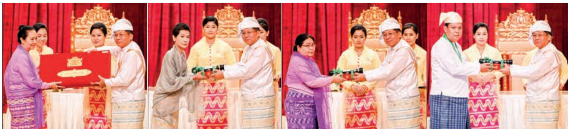
Agga Maha Thiri Thudhamma title and Agga Maha Thray Sithu title, Maha Thray Sithu title, Thray Sithu title and Sithu title were presented to respective title recipients through their family members on 1 January 2023.

After the ceremony, the Senior General cordially greeted the attendees, title winners and their families.—MNA