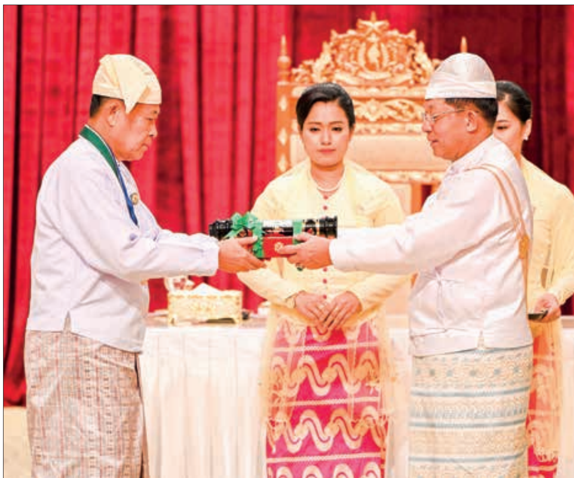
SAC Chairman Prime Minister Senior General Thadoe Maha Thray Sithu Thadoe Thiri Thudhamma Min Aung Hlaing presents Maha Thray Sithu title to SAC Vice Chairman Deputy Prime Minister Deputy Commander-in-Chief of Defence Services Commander-in-Chief (Army) Vice-Senior General Soe Win.