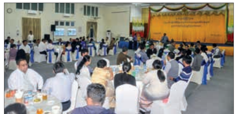
Union Minister for Industry Dr Charlie Than speaking at New Year gathering dinner on 31 December 2022.

Yesterday morning, the Union Minister enjoyed the lucky-draw programme for the employees of the Union Minister's office and had the lunch together with the staffs.—MNA/TS