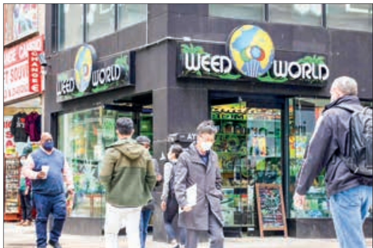
People walk past the Weed World store on 31 March 2021, in Midtown New York.

NEW York's first legal recreational marijuana dispensary opened on Thursday in the