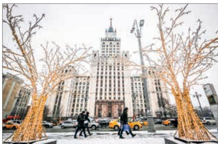
Pedestrians walk past Christmas and New Year decorations in front of the Red Gate Building Stalin-era skyscraper in Moscow, on 28 December 2022.