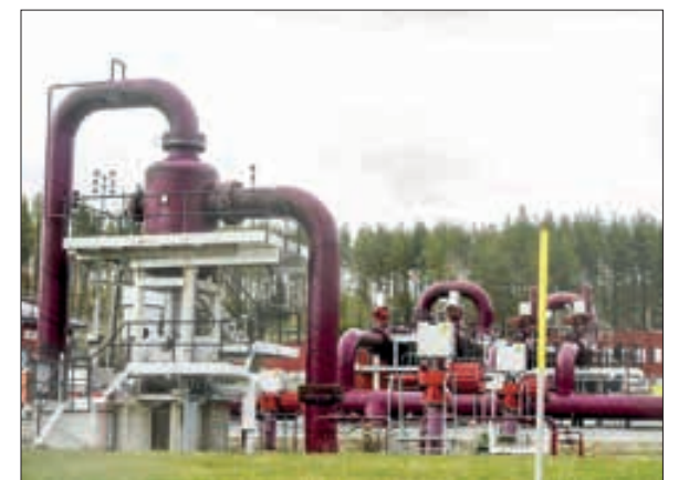
A photo taken on 12 May 2022 shows a general view of the Gasum plant in Raikkola, Imatra, Finland.

To cool the economy, the Federal Reserve embarked on an aggressive campaign to raise interest rates and lower demand.—AFP