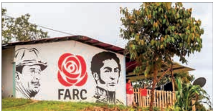
The truce was the main objective of Petro's "total peace" policy, which aims to end the country's armed conflict, which has persisted despite the dissolution of the Revolutionary Armed Forces of Colombia (FARC) in 2017.

The armed groups still operating in Colombia, the world's largest cocaine producer, are locked in deadly disputes over drug trafficking revenues and other illegal businesses, according to the Institute for Development and Peace Studies (Indepaz), an independent think tank.—AFP