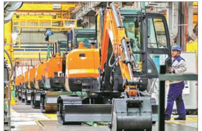
An employee works on the production line of an engineering equipment manufacturer in Yantai, Shandong province.

For more than two years, China had insisted on a ze-