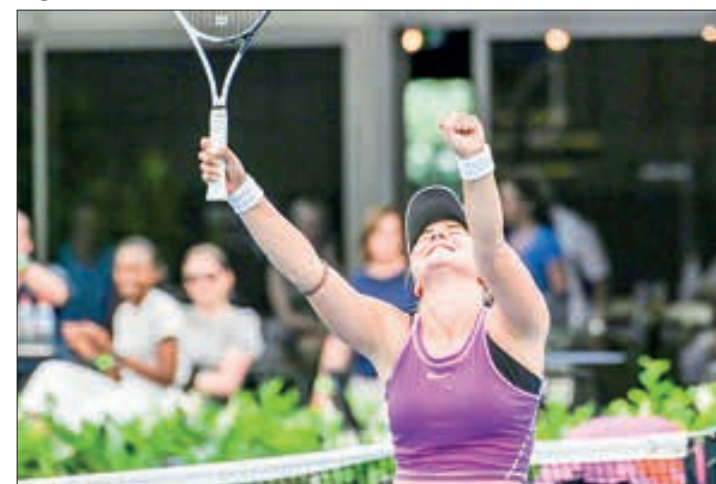
Bianca Andreescu celebrates beating Garbine Muguruza in Adelaide.

It maintained her perfect record against two-time Grand Slam winner and former world number one Muguruza, improving to 3-0.