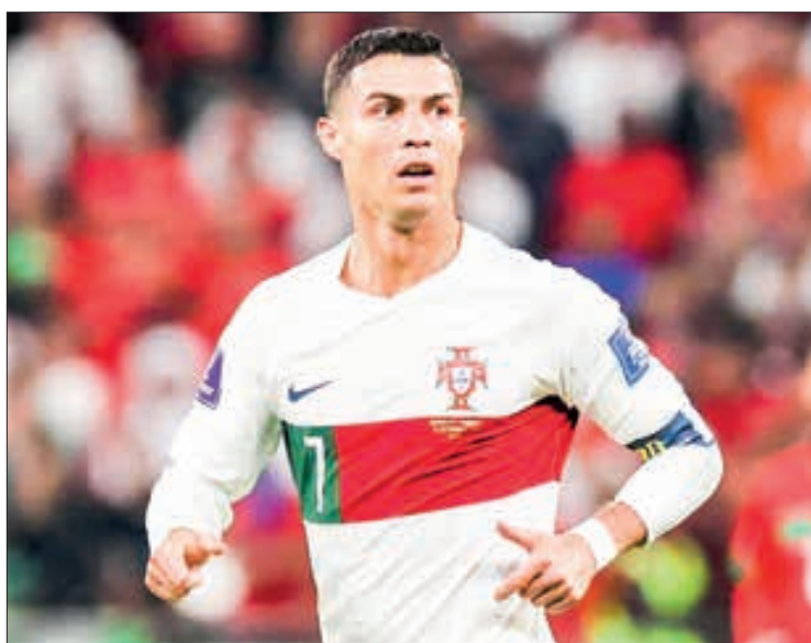
Cristiano Ronaldo penned a contract which will take him to June 2025.

"This is more than history in the making. This is a signing that will not only inspire our