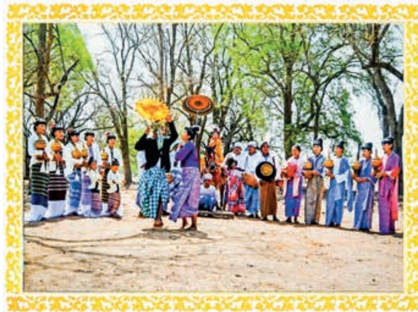
Myanmar Traditional Shinbyu, Novitiation Ceremony.

(Excerpt from the speech delivered by General Aung San at the All Burma Association of Fire Brigades in June 1947)