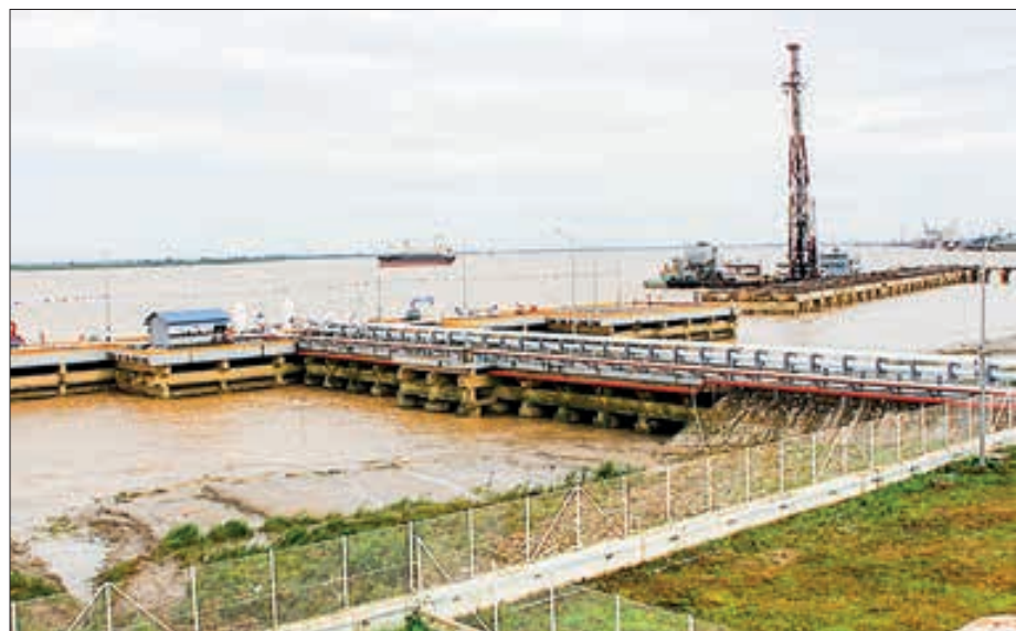
A jetty at Thilawa terminal admits docking of oil tankers.

In Thilawa port area, there are up to eight international wharves to accommodate large oil tankers and can store up to 76 million gallons of diesel and 95 million gallons of gasoline. —TWA/KZL