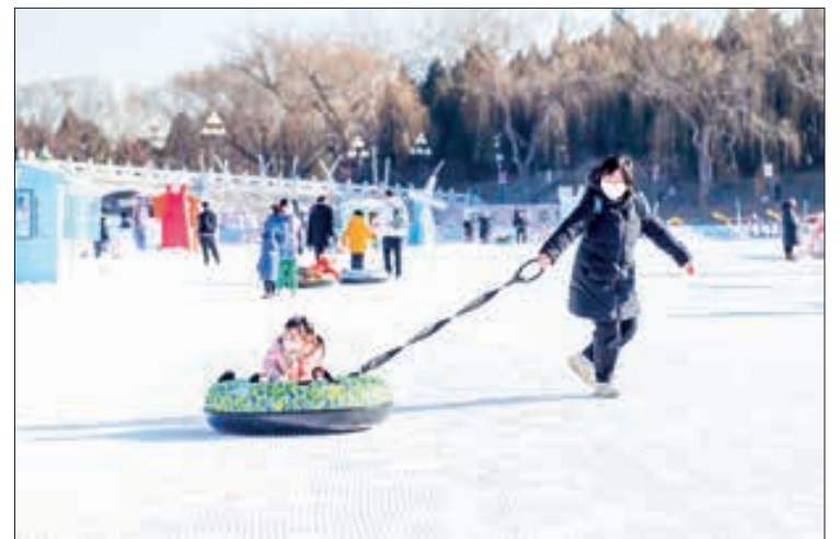
A mother plays with her child at an ice and snow carnival at Taoranting park in Beijing, capital of China, 28 December 2022.