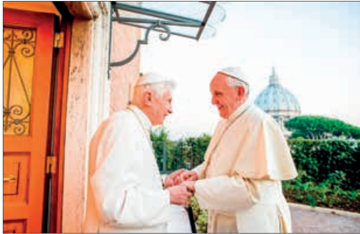
Pope Francis greets retired Pope Benedict XVI at the retired pontiff's Vatican residence on 23 December 2013.

way for the funeral on Thursday morning of Benedict at St Peter's, over which Francis will preside.