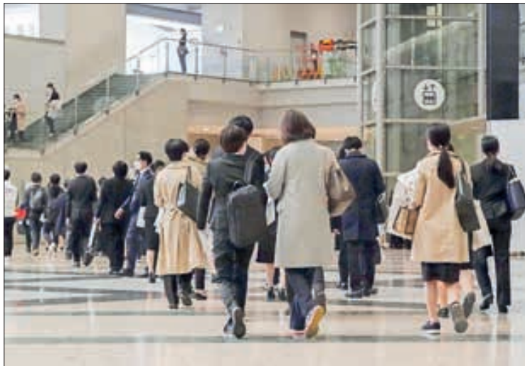
University students and other job seekers head into a venue holding a joint company job fair at Tokyo Big Sight in March 2022.

In a breakdown, Japan ranked 63 rd , or the lowest, for the international experience of senior managers and 62 nd for language skills, the International Institute for Management