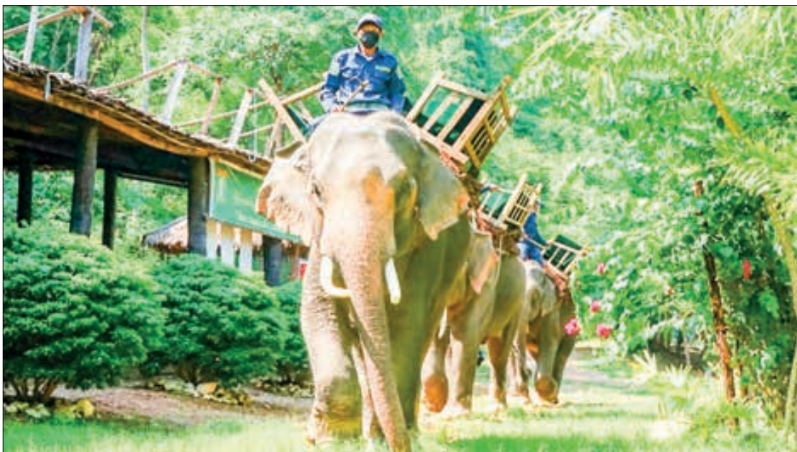
Elephants seen at Shwesettaw Manchaung elephant camp in Minbu township.