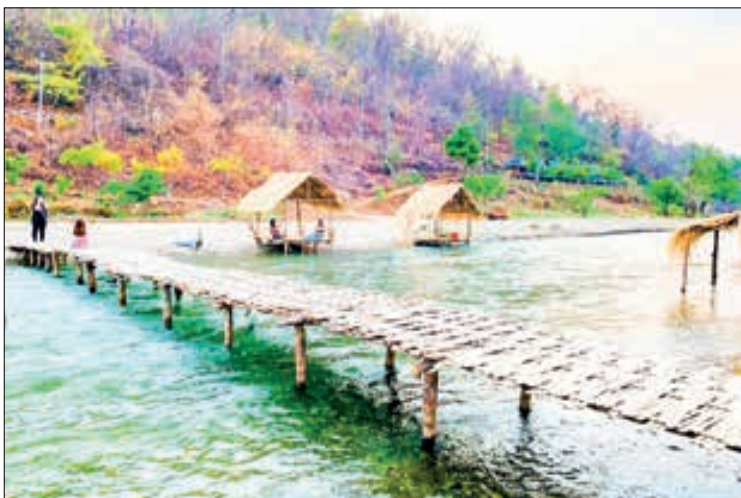
A bamboo bridge and temporary bungalows seen at the elephant camp.

The elephant camp is open from 6 am to 6 pm. Entrance fees are K 1,000 per local traveller and K 10,000 per foreign tourist. Eleven guesthouses are ready to give accommo-