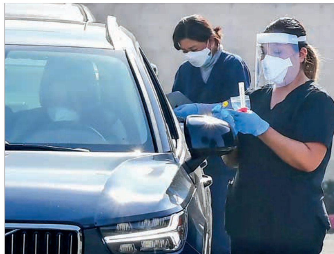
The COVID-19 vaccination campaign in the United States is mass immunization campaign for the COVID-19 pandemic in the United States. PHOTO: FOR REPRESENTATIONAL PURPOSE ONLY/FREDERIC J. BROWN/AFP

THE advantages of a Covid-19 booster vaccine dose have been discussed in recent research from the University of Virginia School of Medicine.