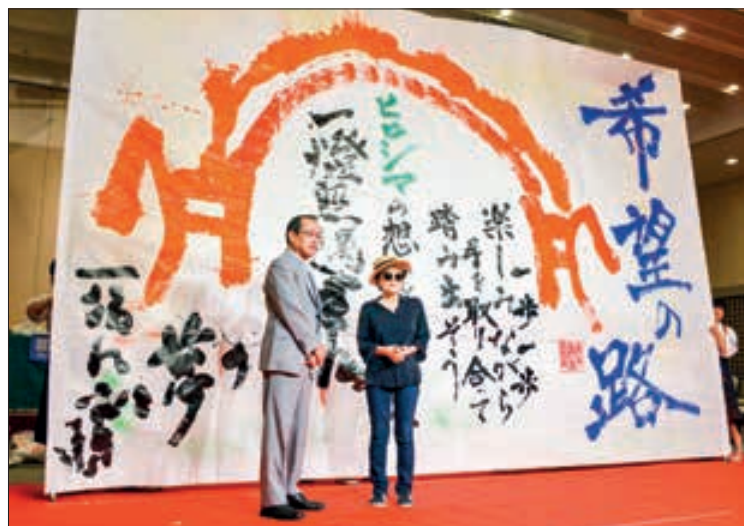
Artist Yoko Ono and Hiroshima Mayor Kazumi Matsui stand before a 4-meter-long, 6-meter-wide sheet with messages of peace written by local high school students in the city of Hiroshima on Wednesday, one week before the 69 th anniversary of the atomic bombing. PHOTO: KYODO

Writing at the height of the Cold War and during the Vietnam War, the two antiwar activists said, "In view of the uncertain world situation we feel it very important to show the uncut version of the above film to the rest of the world" in their letter seen by Kyodo News on Saturday. —Kyodo