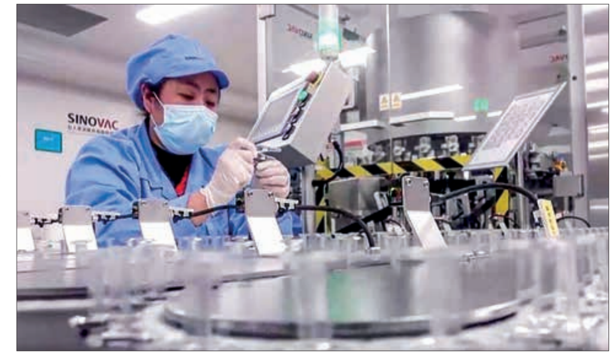
This undated photo shows a worker in the production line of Sinovac's COVID-19 vaccine.

The Chinese government has updated a work plan to