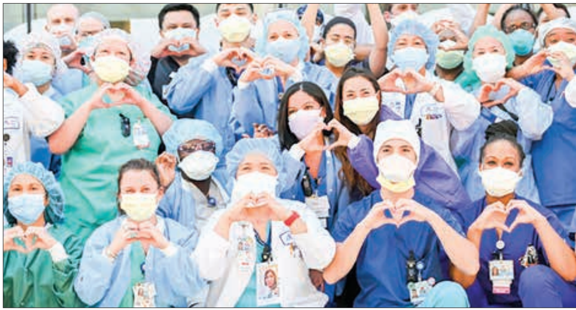
Cardiovascular disease (CVD), including heart disease and stroke, is the world's number-one killer, claiming more than 17.9 million lives each year.

Executive Director of the Victor Chang Cardiac Re-