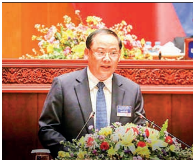
Sonexay Siphandone, Laos's former deputy prime minister, took leadership of the communist nation with 149 of 151 national parliamentary votes.

Laos has been hit by economic difficulties stemming