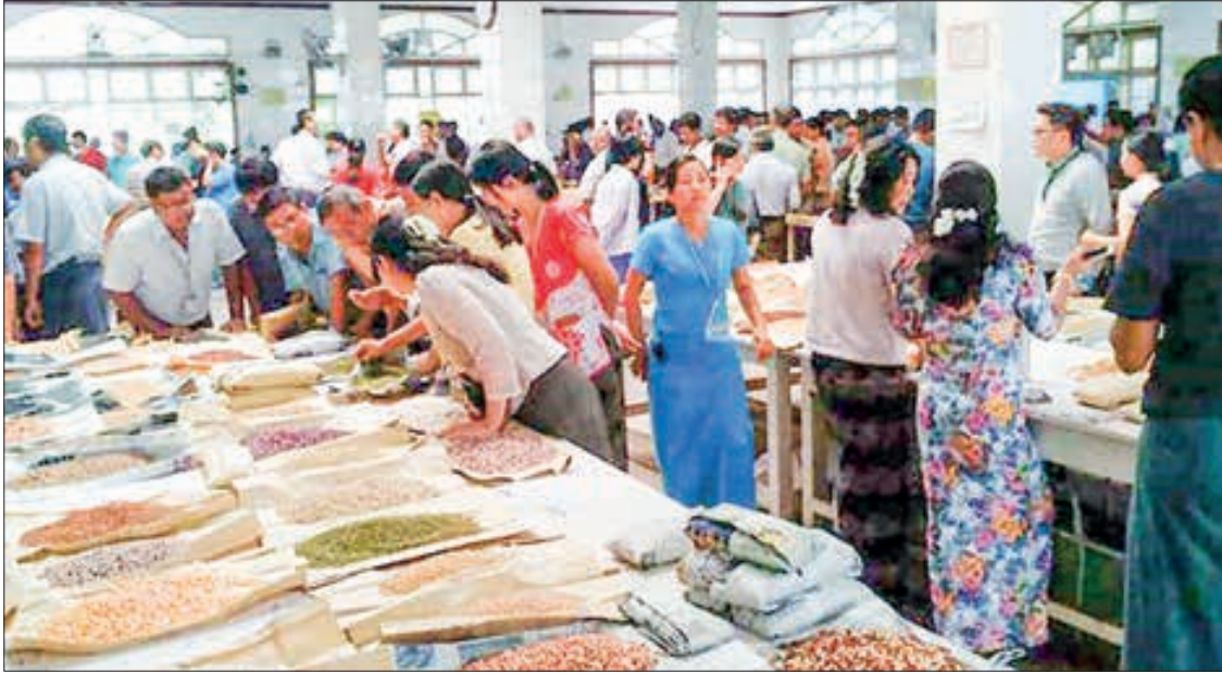
Merchants check quality of pulses and beans and oil seeds at brokerage in Mandalay recently.

The pulses and oil seeds are abundantly flowing into the bustling Mandalay markets. They are commonly grown in Mandalay, Sagaing and Magway regions throughout the year. However, they are cultivated as winter crops in Yangon, Bago and Ayeyawady regions.