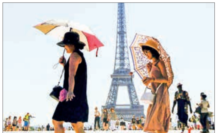
France and Britain on Friday joined a growing list of nations imposing Covid tests on travellers from China, and the World Health Organization pressed Beijing to be more forthcoming on real-time data amid an explosion of cases there.

"WHO stressed the importance of monitoring and the timely publication of data to help China and the global community... to inform effective responses," it said.