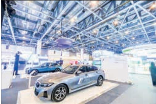
This photo taken on 11 December 2022 shows the first Global Digital Trade Expo in Hangzhou, east China's Zhejiang Province.

business delegation of Hubei Province, central China, set off to Germany and Sweden for an eight-day overseas investment