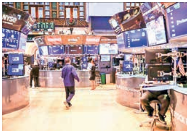
The United State’s key S&P 500 index is down almost 20 per cent over the past year.

WALL Street stocks saw their worst year since 2008 on Friday, after a