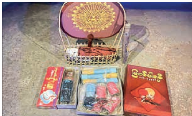
A robe basket comprised of homemade mines found from Malun monastery in Chamayethazan Township on 31 December.