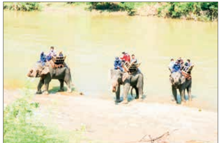
Travellers enjoying elephant-ride at the camp.

dation to those who want stay overnight at the elephant camp and it can charge K30,000 per room.