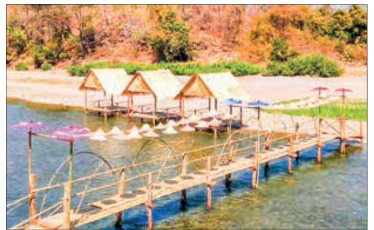
Scenic beauty of elephant camp seen with bamboo bridge and temporary bungalows.