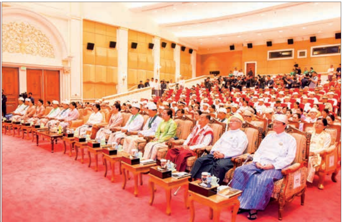
SAC Chairman Prime Minister Thadoe Maha Thray Sithu Thadoe Thiri Thudhamma Min Aung Hlaing addresses the ceremony to confer honorary titles on recipients to mark Diamond Jubilee Independence Day 2023 at SAC Chairman Office on 1 January 2023.

A ceremony to confer honorary titles on recipients to mark the Diamond Jubilee Independence Day 2023 took place at the Thabin Hall of the State Administration Council Chairman Office yesterday morning, attended by SAC Chairman Prime Minister Senior General Thadoe Maha Thray Sithu Thadoe Thiri Thudhamma Min Aung Hlaing who spoke on the occasion and presented honorary titles.