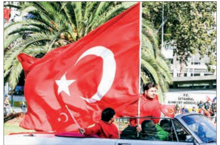
People attend a celebration marking the Republic Day in Istanbul, Türkiye, 29 October 2022.

Türkiye's most recent economic problems started when President Recep Tayyip Erdogan — a lifelong foe of high interest rates — pushed the central bank to start fighting persistent inflation by lowering borrowing costs in September 2021. The policy contradicted conventional economics and turned Turkey into a no-go zone for foreign investors. —AFP