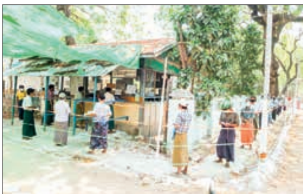
Pakokku locals are seen lining up to clear the electricity bill.

THE Yangon Electricity Supply Corporation (YESC) announced that electricity fee collection counters will be closed on International New Year's Day and the Diamond Jubilee Independence Day. Electricity bill collection counters will be shut down on 31 December 2022 and 1 January. On 2, 3, 5 and 6 January, electricity bill counters will be open from 8 am to 3 pm, according to the YESC's notification. — TWA/KZW