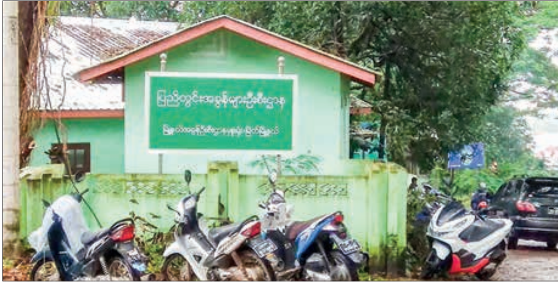
The Internal Revenue Department building in Myeik.

THOSE who evade, avoid and shelter tax liability will face legal actions under the existing tax laws and anti-money laundering law from 1 January 2023.