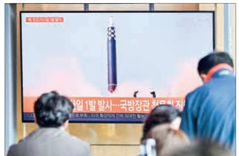
People watch a television screen showing a news broadcast with file footage of a North Korean missile test at a railway station in Seoul, South Korea, 4 May 2022.

Prime Minister Fumio Kishida instructed officials to swiftly provide necessary information to the public, ensure the safety of aircraft and ships and prepare for contingencies, according to his office. The government has lodged a protest with North Korea via the Japanese Embassy in Beijing over the latest launches in violation of UN Security Council resolutions.—Kyodo