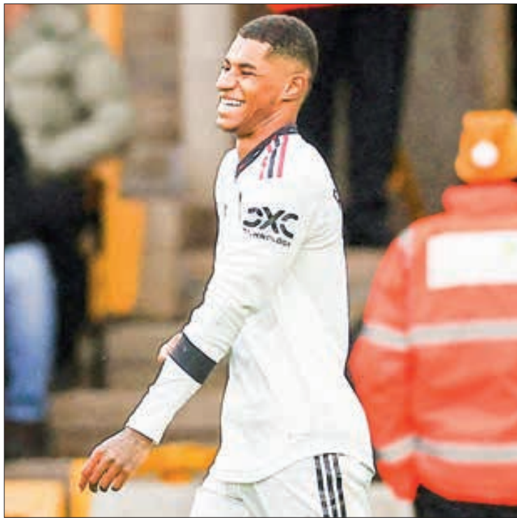
Manchester United's English striker Marcus Rashford smiles as he celebrates after scoring the opening goal of the English Premier League football match between Wolverhampton Wanderers and Manchester United at the Molineux stadium in Wolverhampton, central England on 31 December 2022.

Rashford looked determined to prove Ten Hag was wrong to drop him as he rampaged through the Wolves de-