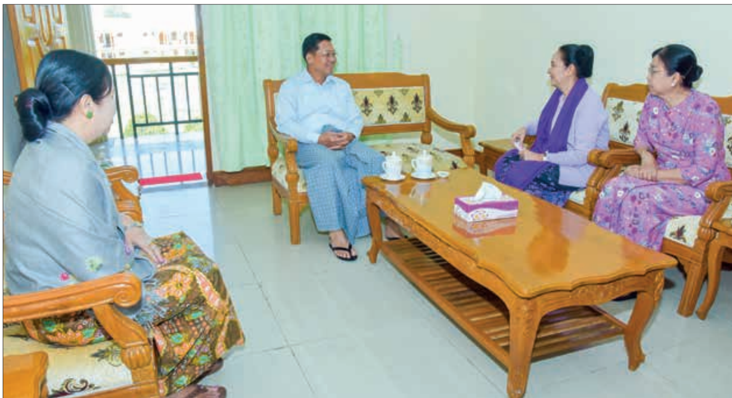
State Administration Council Chairman Prime Minister Senior General Min Aung Hlaing converses with family members of the Heads of State and senior military officers on 31 December 2022 in Nay Pyi Taw.