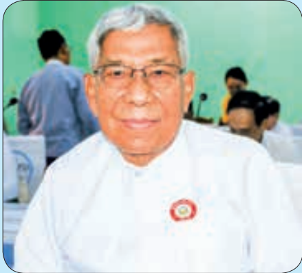
U Aung Lwin (Film Director/Actor)

As the year's old images are coming to an end, it shows the principle that things are impermanent. Based on a love for each other, mutual support and participation in the country's development, each unit is proud to fulfil its responsibilities. As the old year comes to an end, let all the people be happy in the new year 2023. May the people of the film world have peace of mind!