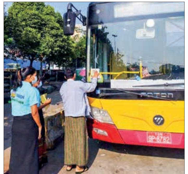
Stickers with Diamond Jubilee Independence Day commemorative texts are seen on the bus.

A total of 12,000 stickers with Diamond Jubilee Independence Day commemorative texts were put on YBS buses, express buses, taxis, vehicles, and at the bus stops of Sule, Thakin Mya Park, San Pya Zayy, Hledan Junction, Kaba Aye Pagoda, and Aung Mingala Bus Terminal to mark the Diamond Jubilee Independence Day. — TWA/KZL