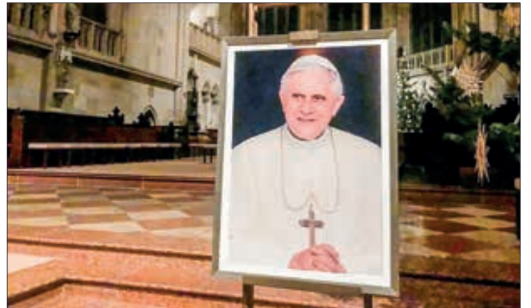
Former pope Benedict XVI has died at the age of 95, the Vatican announced Saturday. A portrait of Pope Emeritus Benedict XVI is seen near the altar at the Cathedral of Regensburg, southern Germany on 29 December 2022, during a church service.

His death brings to an end an unprecedented situation in