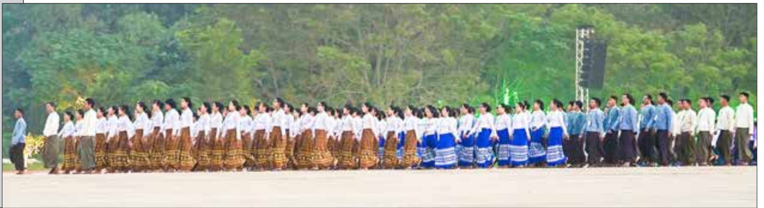
Vice-Senior General Soe Win and dignitaries watch the full-dressed rehearsal in Nay Pyi Taw on 31 December 2022.

The Vice-Senior General who is in his capacity as Chairman of the Central Committee on Organizing the Diamond Jubilee Independence Day ceremony was accompanied by members of the State Administration Council, central committee member Union ministers, and the chairman of Nay Pyi Taw Council, deputy ministers who are in the capacity of relevant subcommittee chairpersons, officials, and senior military officers from the Office of the Commander-in-Chief. The Vice-Senior General coordinated necessary measures with officials. — MNA