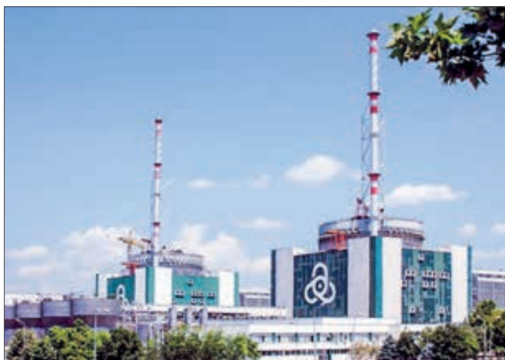
Kozloduy nuclear power plant in Bulgaria.

Under a 10-year agreement signed Friday, Framatome, a subsidiary of French energy giant EDF, will supply nuclear fuel