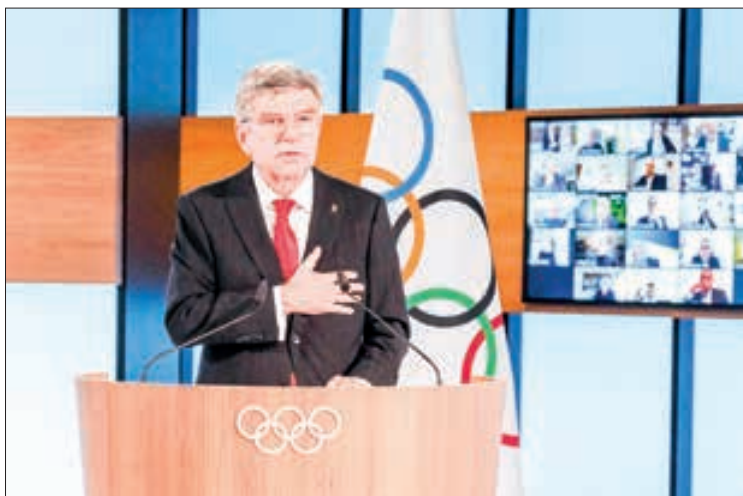
IOC president Thomas Bach.

THE sporting sanctions imposed on Russia and Belarus over the invasion of Ukraine must remain firmly in place in 2023, the head of the International Olympic Committee insisted Friday.