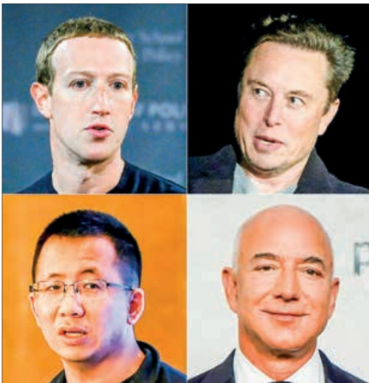
Facebook founder Mark Zuckerberg, Tesla CEO Elon Musk and Amazon founder Jeff Bezos saw their massive fortunes shrink over 2022, while Zhang Yiming bucked the trend with a rising share price of his company, TikTok-parent ByteDance.

THE fortunes of Silicon Valley billionaires took a beating in 2022 as share prices of the world's tech giants plummeted. Here are some of the worst hit by this year's tech stock downturn.