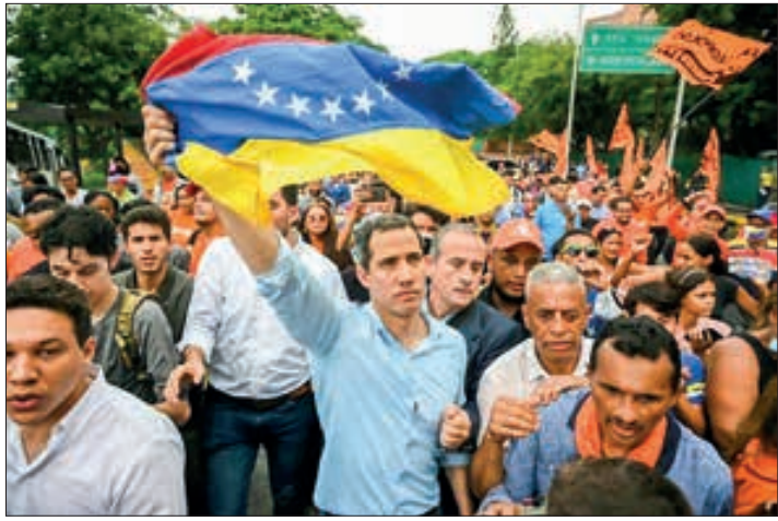
Venezuelan opposition leader Juan Guaido waves a national flag during a demonstration in October 2022.

THE Venezuelan opposition on Friday dissolved the “interim government” led by Juan Guaido, once the popular and internationally recognized face of a failed drive to oust leftist leader Nicolas Maduro.