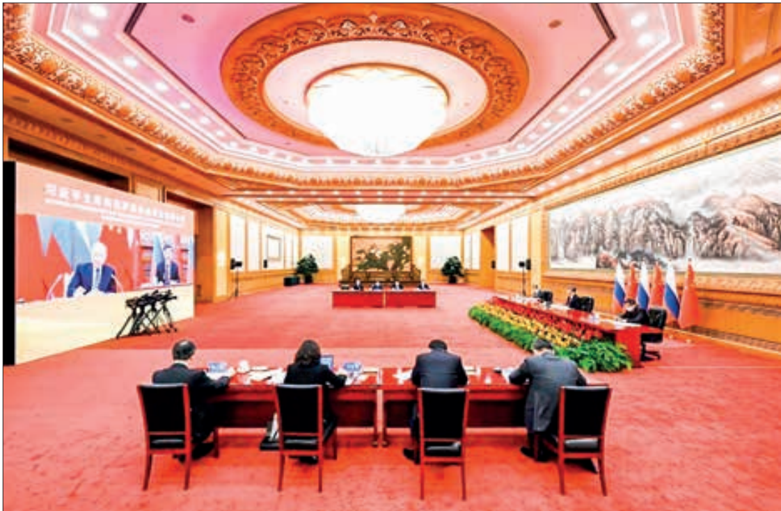
Chinese President Xi Jinping meets Russian President Vladimir Putin via video link in Beijing, capital of China, 30 December 2022.

CHINESE President Xi Jinping had a virtual meeting with Russian President Vladimir Putin in Beijing on Friday afternoon.