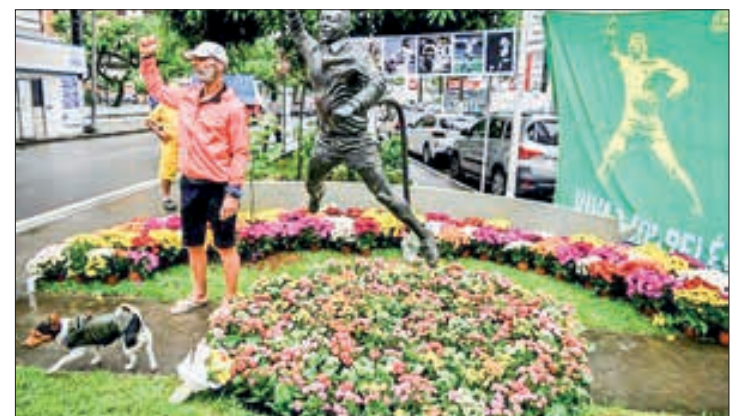
A man poses for a photo by the statue of late football legend Pele outside the Vila Belmiro stadium in Santos, Brazil.

"In the New Year, the Ukrainian athletes can count on the full commitment to this solidarity from the IOC and the entire Olympic Movement. We want to see a strong team from... Ukraine at the Olympic Games Paris 2024 and the Olympic Winter Games Milano Cortina 2026." —AFP