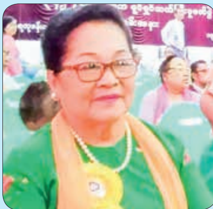
Daw Nwet Nwet Sann (Film Actress)

MAY the people of the world and all the people of Myanmar fulfil their own needs and desires! I am sending my prayers for the peace and prosperity of Myanmar. From the auspicious time of the New Year of 2023, I wish all the people in the film industry possess good health, long life, business growth and good fortune.