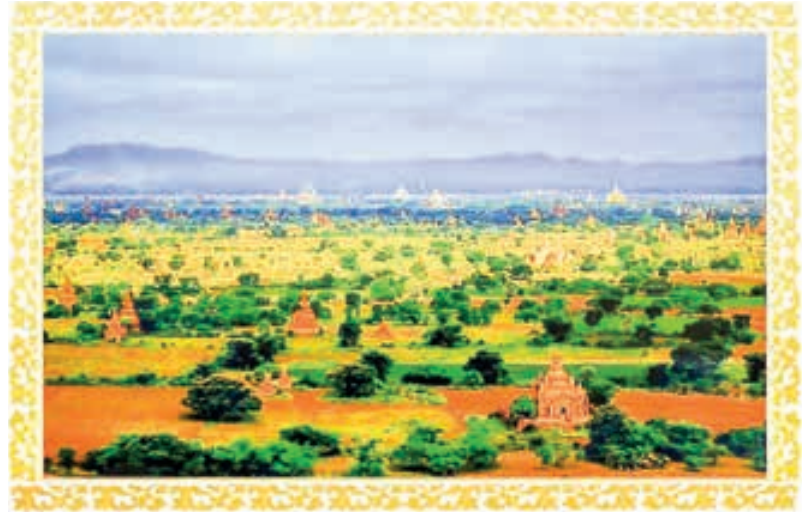
Scenic Beauty of Bagan.

(Excerpt from the message sent by Chairman of the State Administration Council Prime Minister Senior General Min Aung Hlaing to the 74 th Anniversary of the Shan State Day on 7 February 2021)