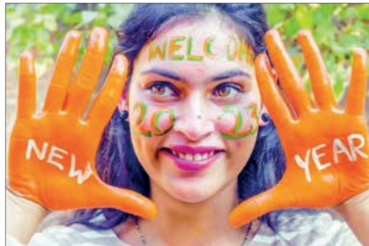
A woman poses for a picture after getting her hands and face painted ahead of New Year eve celebrations in Amritsar on 30 December 2022. PHOTO: AFP

About 16 million Ukrainians have fled their homes.—AFP