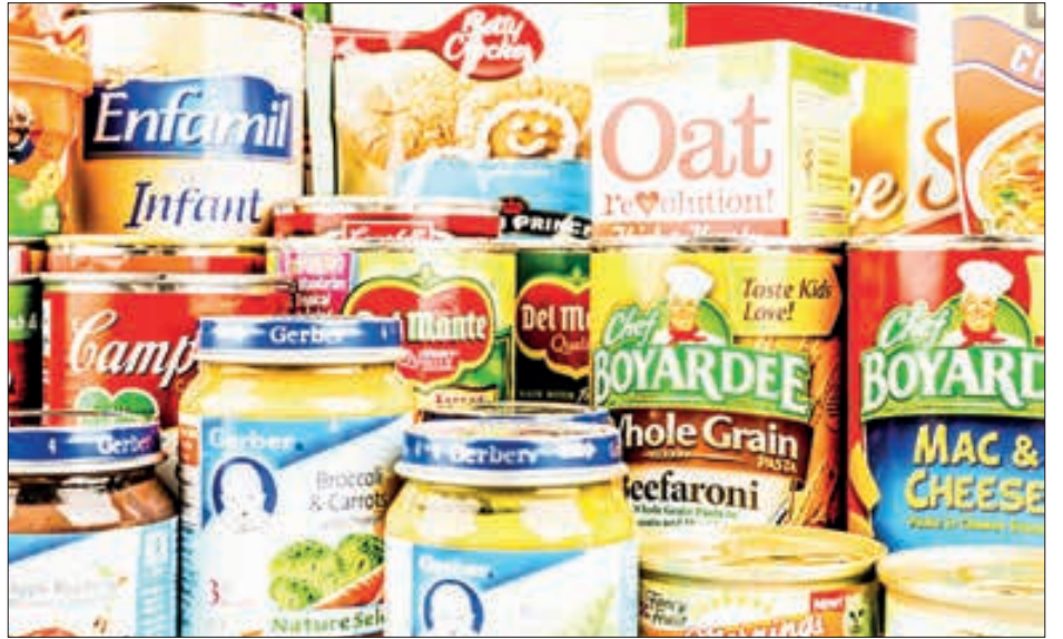
The overall exports of agricultural and processed food products rose to 17.43 billion US dollars during April-November from 15.07 billion dollars in the same period a year earlier.

INDIA'S exports of agricultural and processed food products rose by 16 per cent in the first eight months (April-November) of the current financial year 2022-23, in comparison to the corresponding period of the last financial year, said the federal Ministry of Commerce and Industry on Friday. The overall exports of agricultural and processed food products rose to 17.43 billion US dollars during April-November in the same period a year earlier, data released by the Directorate General of Commercial Intelligence and Statistics showed. Thus the country has achieved nearly 74 per cent