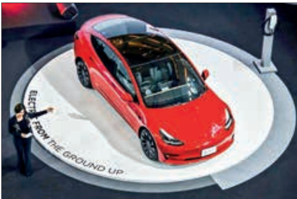
Tesla lost a staggering two-thirds of its market value in 2022.

But this is slower than the furious pace of growth that CEO Musk demands of his company with his stated ambition that Tesla unseat Apple as the world's most valued company. Even if the share price is subject "to a lot of emotional elements... Tesla will be by my best guess the most valuable company in the world in less than five years," a defiant Musk told a forum on Twitter this month.—AFP