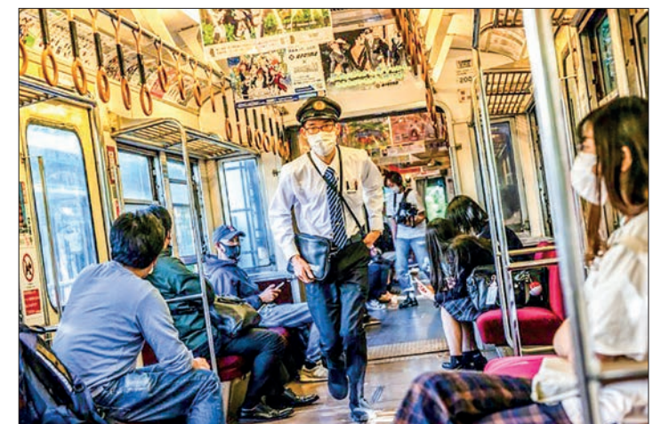
Tiny two-carriage trains servicing rural areas, a legacy of Japan’s former economic boom, are now struggling to stay afloat.

“If we leave things as they are and don’t do anything, it is clear to everyone that sustainable public transport systems will fall apart,” Transport Minister Saito said earlier this year.—Kyodo