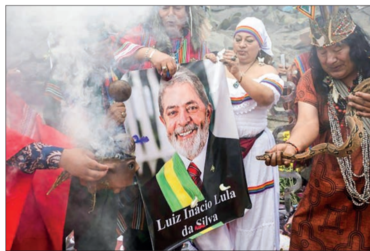
Peruvian shaman with a poster of Brazil's soon-to-be President Luiz Inacio Lula da Silva.

BRAZIL'S leftist icon Luiz Inacio Lula da Silva returns triumphant to the presidency Sunday after years out in the cold, with plans for a spectacular inauguration amid ultra-tight security.