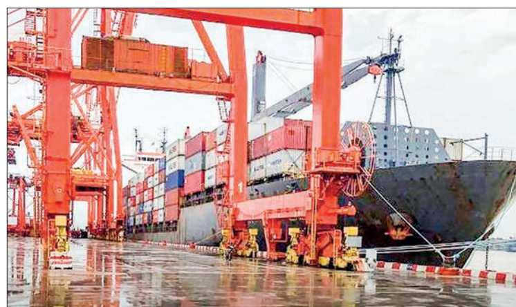
A container ship docks at Yangon Port.

After customs procedures by Myanmar Customs, exports are carried out under Myanmar Port Authority by presenting the necessary documents. The imported containers are temporarily stopped at the terminals and customers can claim them for withdrawal upon tax payments. — TWA/EMM