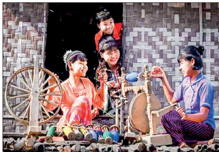
Village damsels are seen at the Myanmar traditional loom.

YEPOTEGYI Village in Pwintbyu Township, Magway Region, has become famous for its children who preserve the traditional "San-yit-wine" hairstyle (a style of hairdo with a top knot and a circular fringe) and the tourists from ASEAN countries, China, Japan, Korea and western countries visit there to observe their culture.