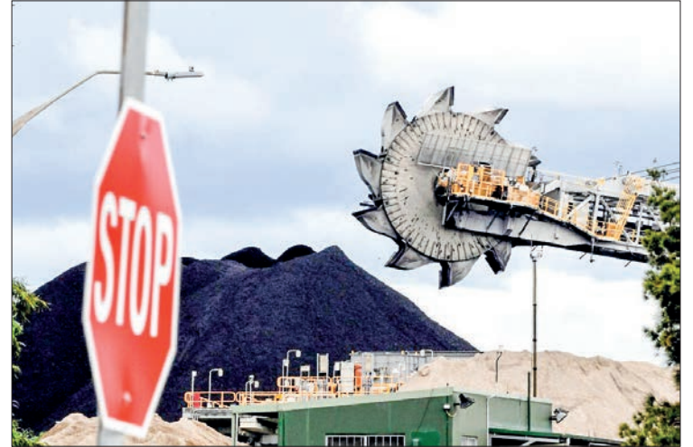
China has imposed a number of sanctions on Australian wine, barley and coal in recent years. A bucket-wheel reclaimer stands next to a pile of coal at the Newcastle Coal Port, in Newcastle, New South Wales, Australia, on 12 October 2020.

China has imposed a number of sanctions on Australian wine, barley and coal in recent years, after bilateral ties soured over a series of issues including human rights concerns and Canberra’s call for an independent investigation into the origins of COVID-19, first detected in the Chinese city of Wuhan. —Kyodo