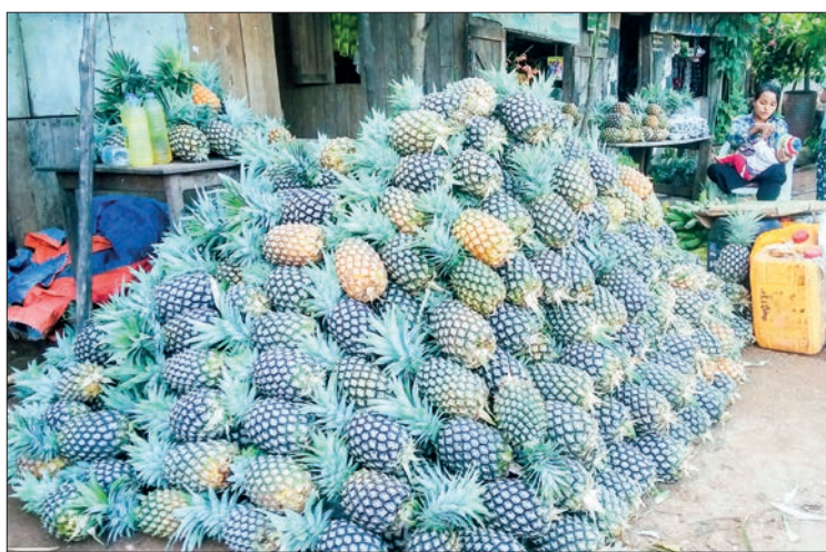
Pineapples are pictured at the wine production process workplace.

THE Linde Village in Ngaphe Township of Mibu District of Magway Region is located beside the Minbu-An road. The local Asho Chin people earn their annual income from pineapple plantations in addition to agricultural and perennial crops and manageable-scale production of pineapple wine, according to pineapple farmer Mai Mya Wutyi Aung.