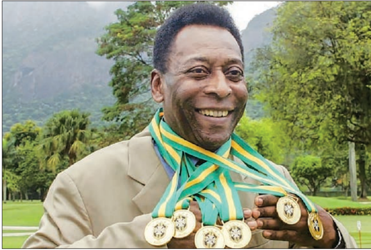
In this file photo taken on 22 December 2010, Pele poses with his six champion medals during a ceremony in Rio de Janeiro, Brazil.

HIS face appeared on televisions around the world and dominated the homepages of news outlets everywhere as global media bowed to the late, great Pele, the undisputed "King" of football.