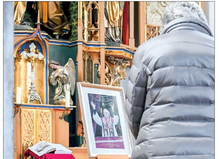
A handful of faithful in Regensburg braved the early cold to attend mass at the cathedral, where a large portrait of the pope emeritus sits on the altar.

The homage to Benedict is particularly poignant in the medieval city on the banks of the Danube, where the former pope lived and worked at the local university for years. On Wednesday, current Pope Francis called on all Catholics to say a "special prayer" for his predecessor, whose health had worsened considerably in recent days.