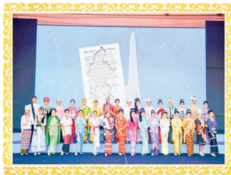
Union Ethnic People.

(Excerpt from the speech delivered by Chairman of the State Administration Council Prime Minister Senior General Min Aung Hlaing at the State Administration Council Meeting 4/2022 held on 12-5-2022)