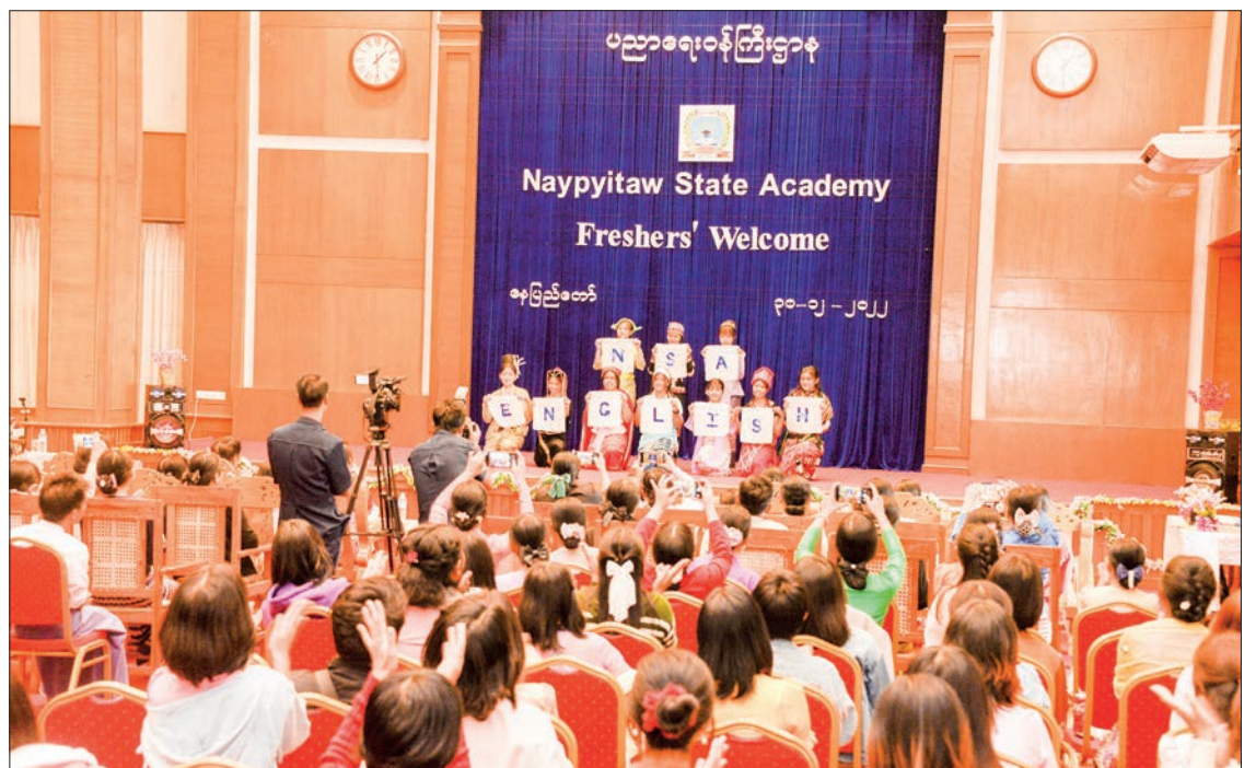
The fresher welcome event of the Naypyitaw State Academy for the 2022-2023 Academic Year is in action yesterday.

A welcome ceremony for students of the 2022-2023 academic year from the Naypyitaw State Academy was held at the multipurpose hall of the academy yesterday.