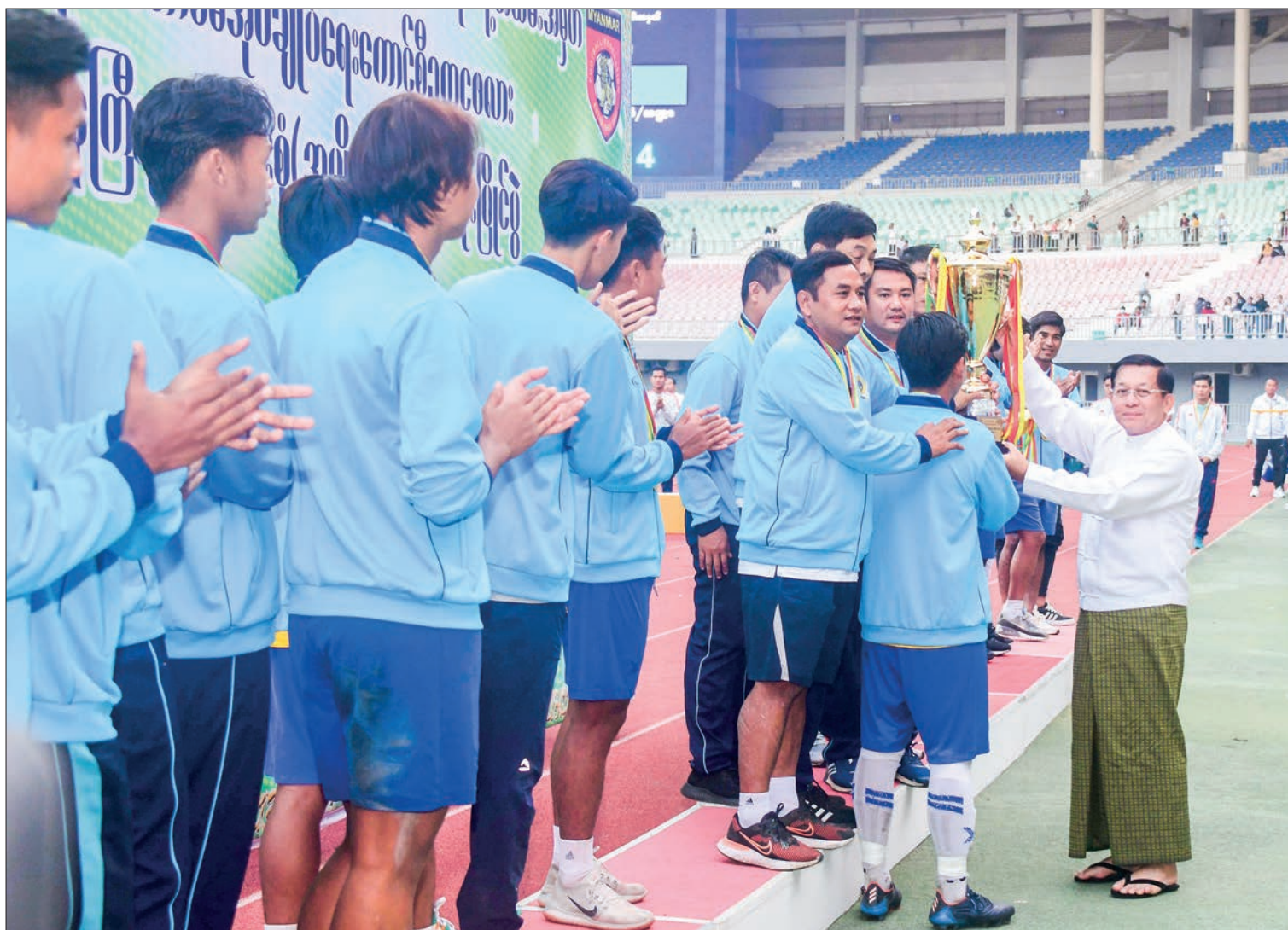
State Administration Council Chairman Prime Minister Senior General Min Aung Hlaing presents the trophy to the Ministry of Planning and Finance team at the event yesterday.

A s a gesture of hailing the Diamond Jubilee Independence Day, the final match of the State Administration Council Chairman's Trophy Inter-Ministry U-25 Men's Football Tournament took place in