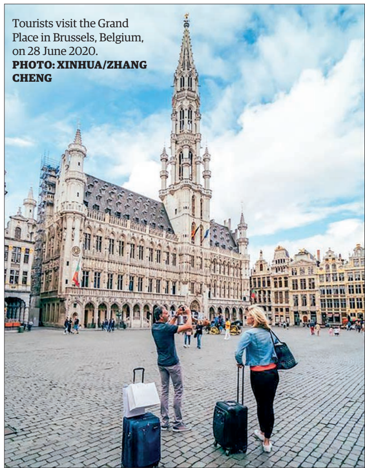
Tourists visit the Grand Place in Brussels, Belgium, on 28 June 2020.

THE mayor of Belgian tourist hub Bruges called Wednesday for Chinese visitors to face Covid tests or mandatory vaccine requirements after an explosion of cases in China, Belga news agency reported.