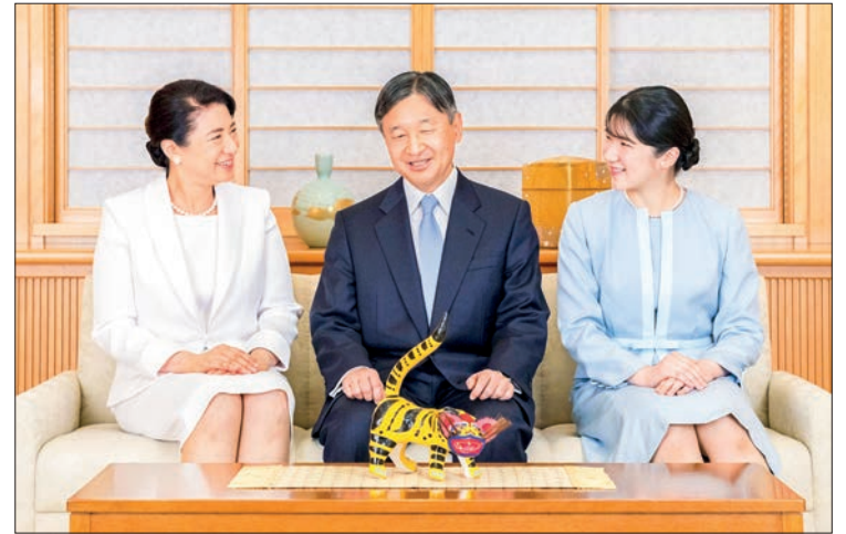
Emperor Naruhito (C), Empress Masako (L) and their daughter Princess Aiko gather at the Imperial Palace in a photo taken on 21 December 2021.

which, in addition to websites, has accounts on Twitter, Instagram, Facebook, and YouTube, each with more than a million followers. All accounts are updated almost daily with images of royal family members making visits or meeting people. Some conservatives in Japan are opposed to shining more of a light on the lives of imperial family members and bringing the emperor, once deemed a god, too close to the people. Under the Constitution, his role is defined as being "the symbol of the state and the unity of the people of Japan". — Kyodo