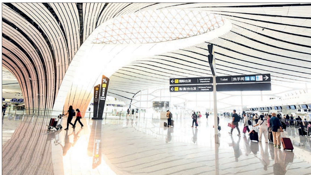
Beijing Daxing International Airport.

THE Embassy of the People's Republic of China to Myanmar announced that tourists who will visit China are no longer required to apply for the health code starting from 8 January 2023.