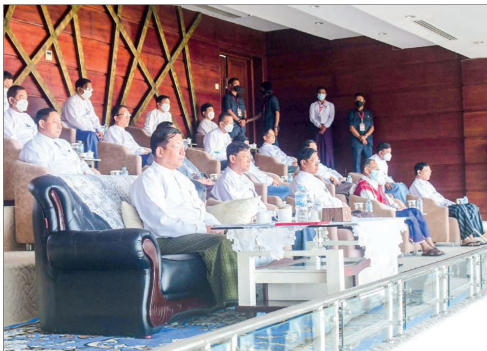
The Senior General and dignitaries watch the final match yesterday.