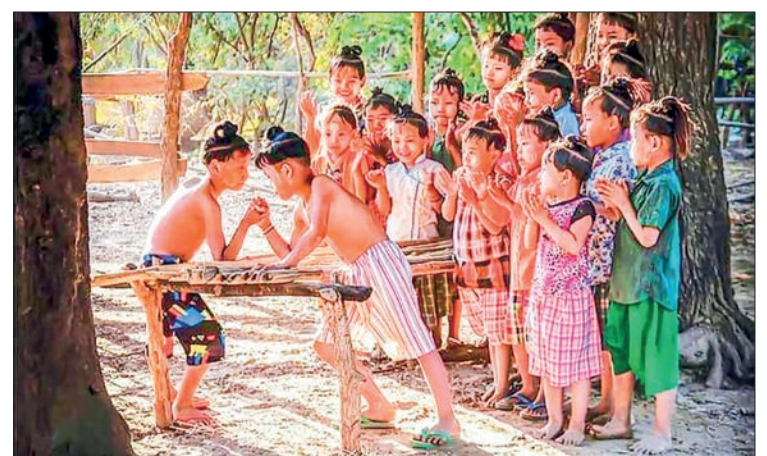
The Yepotegyi Village, San-yit-wine village as it is called, is located about seven miles northwest of Pwintbyu Township. Village children are pictured tackling each other in one of the Myanmar traditional games.

The boys and girls wear traditional topknot style with a circular fringe starting at five months