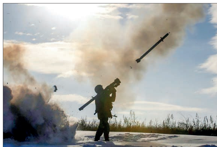
According to two possible leads considered by the authorities, the missile either deviated from its trajectory or was shot down by Belarusian air defences.

According to two possible leads considered by the author-