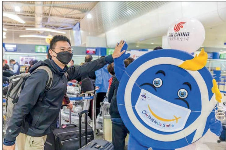
A passenger poses for a photo with an airport mascot at Athens International Airport in Greece, on 22 Dec 2022.

Data from Trip.com Group showed that the number of orders for outbound flight tickets soared 254 per cent on the morning of Dec. 27, compared with the same period a day earlier. Singapore, Republic of Korea, Japan and Thailand were among Chinese tourists' most popular destinations. —Xinhua