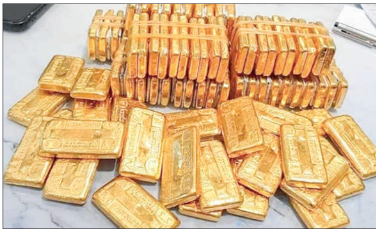
Gold bars were sold out.

At the meeting, the governor of the CBM remarked on the further coordination of the departments concerned, gold bar transactions to be made with the banking system and operations of the banks, further support of the ministries concerned and the CBM to achieve price stability, and further cooperation between gold businesspersons and the officials.