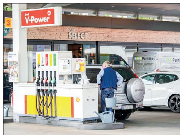
A man fuels a vehicle at a gas station in Berlin, capital of Germany, on 11 May 2022.

According to preliminary long-term forecasts, global gas consumption would grow by 20 per cent over the next 20 years, he said, adding that in this context, Gazprom is reflecting on the future, the company's new projects and energy security in general. — Xinhua