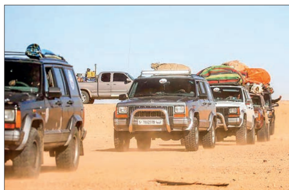
Algeria will allow foreign tourists heading to its vast desert south to obtain visas on arrival, part of efforts to "promote tourism in the Sahara", the interior ministry announced Wednesday.

Algeria, Africa's biggest country by surface area, comprises a major chunk of the Sahara including nature reserves and prehistoric sites. It also boasts 1,200 kilometres (745 miles) of Mediterranean coastline and several historical cities. But the North African country hosts far fewer tourists than its neighbours, Morocco and Tunisia, relying instead on its vast oil and gas revenues.—AFP