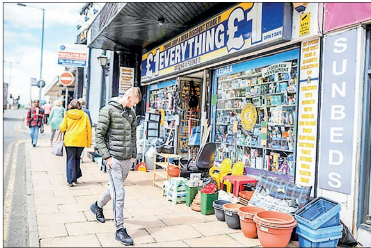
A man walks past a discount store in the city centre of Bradford in northern England.

THIS was supposed to be the comeback year for the world economy following the Covid pandemic.