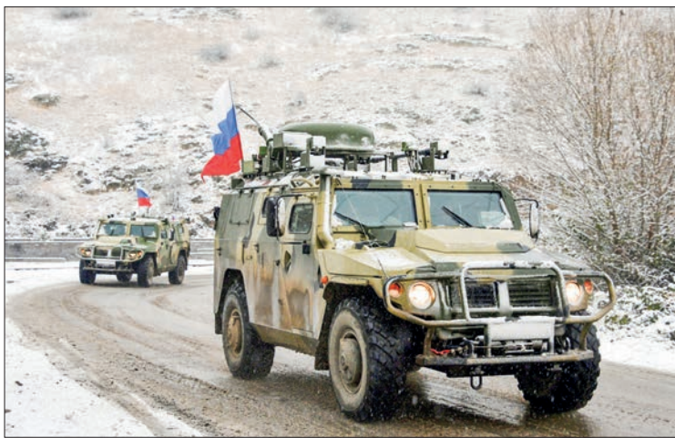
Military vehicles of the Russian peacekeeping force move on the road outside Lachin on 29 November 2020, after six weeks of fighting between Armenia and Azerbaijan over the disputed Nagorno-Karabakh region.

ARMENIA on Thursday accused Russian peacekeepers of failing to protect ethnic Armenians in