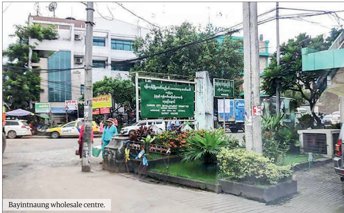
Bayintnaung wholesale centre.

In March 2022, the original price of palm oil was K6,445 per viss if it was calculated on the dollar exchange rate at K1,787. The reference price was set at