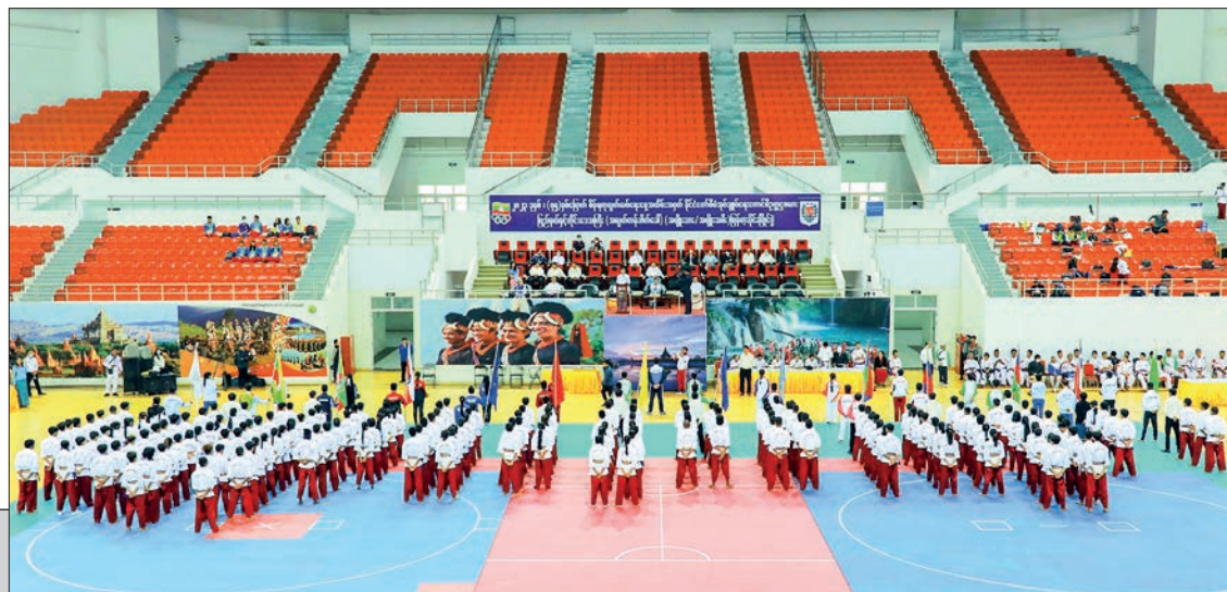
The Inter-Region and State Myanma Thaing competition 2023 kicks off yesterday.

The martial arts competition will be conducted from 30 December 2022 to 1 January 2023 and a total of 14 teams from regions and states will participate in the contest. — MNA/ MKKS