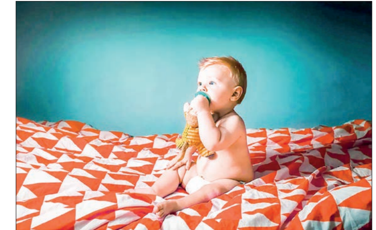
The findings of a recent study suggest that during the Covid-19 pandemic an increase in obesity was seen in children between the ages of three and four. ILLUSTRATION: FOR REPRESENTATIONAL PURPOSE ONLY/ HEALTHLINE

THE findings of a recent study suggest that during the Covid-19 pandemic an increase in obesity was seen in children between the ages of three and four.