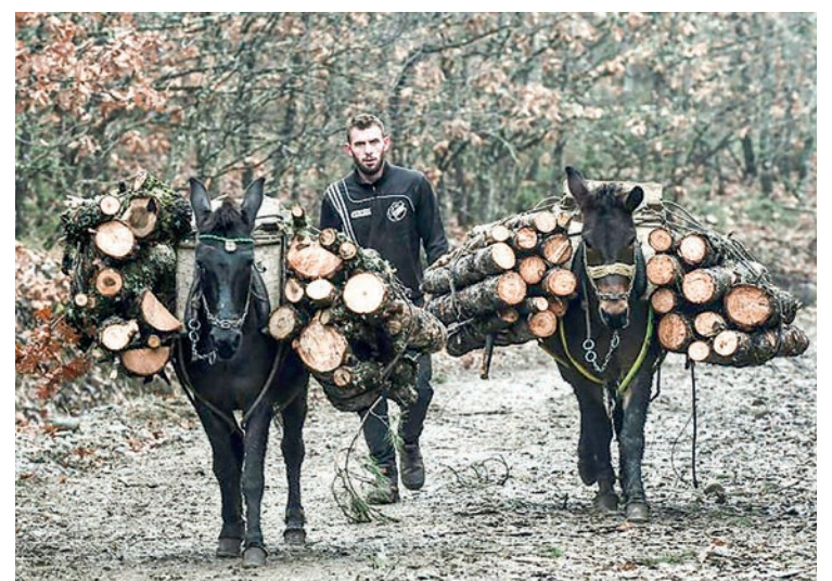
Most of the wood is still transported by mule. PHOTO: AFP

For now, an abundant local supply makes firewood the best option in the north of Greece where temperatures dip well below zero Celsius (32 Fahrenheit) in deep winter.—AFP