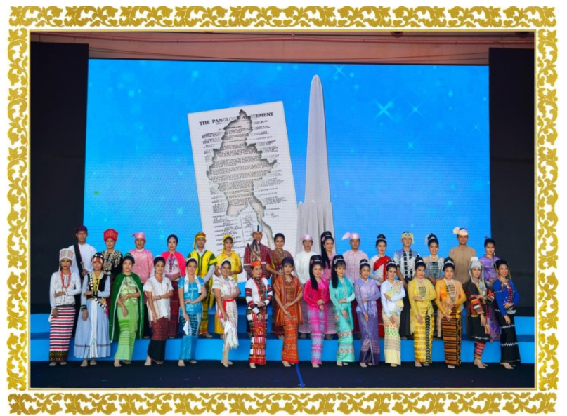
Union Ethnic People.

(Excerpt from the speech delivered by Chairman of the State Administration Council Prime Minister Senior General Min Aung Hlaing at the State Administration Council Meeting 4/2022 held on 12-5-2022)