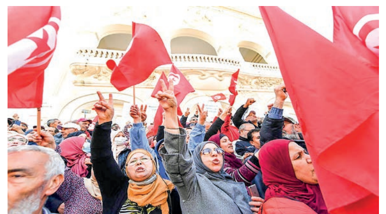
Tunisians raise national flags as they take to the streets of the capital to protest against their president, Tunis, Tunisia, 10 April 2022.

The figure is the lowest since the 2011 revolution that overthrew dictator Zine El Abidine Ben Ali, down from 70 per cent in 2014 legislative polls and just a third of the 30.5 per cent