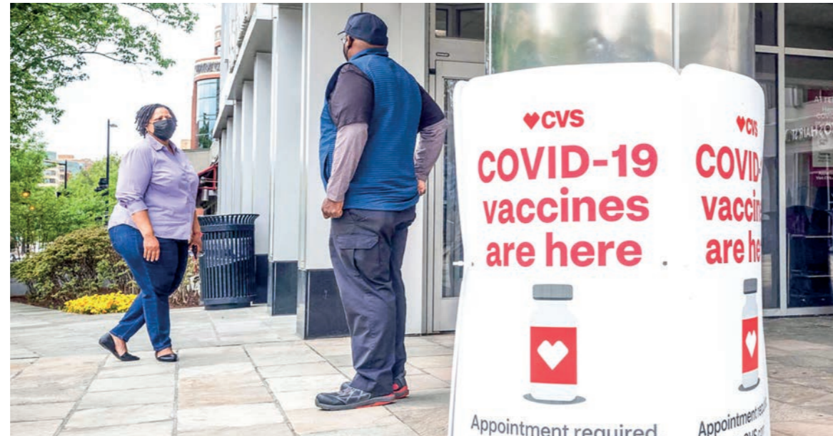
Signs offering COVID-19 vaccinations are seen outside of a CVS pharmacy in Washington, DC on 7 May 2021.

A RECENT study reveals that some older persons have resisted seeking medical help even when they felt they might need it because of concerns about how much emergency care might cost them.