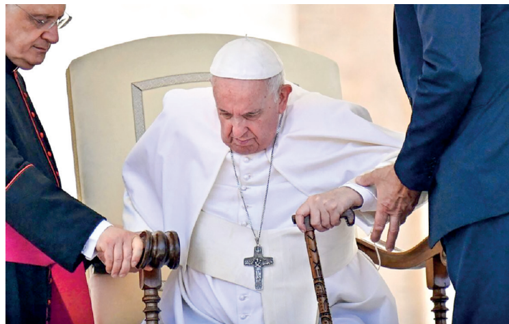
In this file photo taken on 8 June 2022 Pope Francis is helped get up from his seat at the end of the weekly general audience at St. Peter's Square in The Vatican. PHOTO: AFP

Francis's predecessor, Benedict XVI, quit over failing health in 2013. He now lives quietly in Vatican City. —AFP