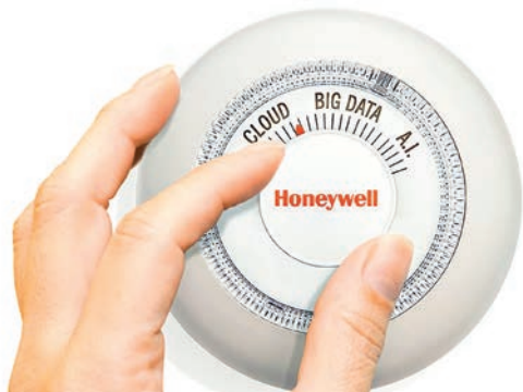
US industrial giant Honeywell will pay $160 million to settle criminal and civil probes in Brazil and the United States over bribes in order to win business from two national oil companies.