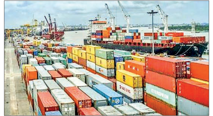
Containers to be exported to foreign markets are seen at the Port.

He was 72 and lived at the corner of 32 and 75 streets in Mawyagiwa Ward of Chanayethazan Township of Mandalay. He is survived by his wife and two children. —TWA/KTZH