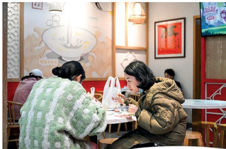
Customers enjoy dessert at a sweet shop in Liwan District of Guangzhou, capital of south China's Guangdong Province, 1 Dec 2022.

THE World Bank on Tuesday slashed its China growth forecast for the year as the pandemic and weaknesses in the property sector hit the world's second-largest economy.