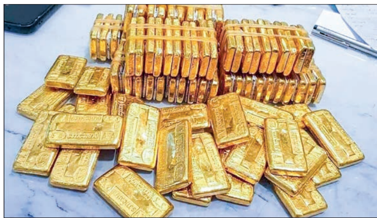
For the gold price to decline, the Ministry of Natural Resources and Environmental Conservation has been selling gold ingots in Yangon, Mandalay and Nay Pyi Taw under the auction system.

gap between the YGEA's price and the market price based on the black-market dollar rate.