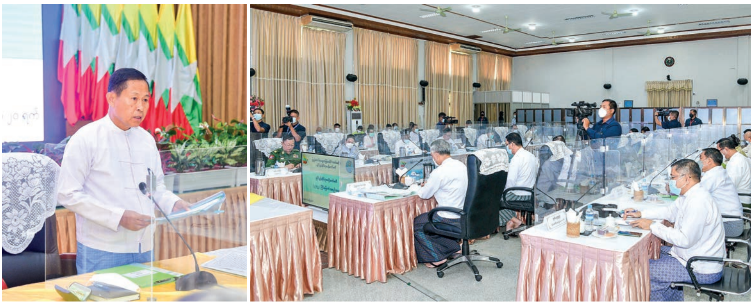
State Administration Council Vice-Chair Deputy Prime Minister Vice-Senior General Soe Win addresses the meeting 2/2022 of the Central Committee on Copyright in Nay Pyi Taw yesterday.

STATE Administration Council Vice-Chairman Deputy Prime Minister Vice-Senior General Soe Win addressed the 2/2022 meeting of the Central Committee on Copyright held at the conference hall of the Ministry of Commerce in Nay Pyi Taw at 2 pm yesterday.