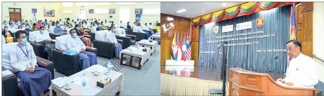
The third Regional Workshop on ASEAN Common Competency Standards for Tourism Professionals is in progress.

MYANMAR hosted the 3 rd Regional Workshop on ASEAN Common Competency Standards for Tourism Professionals in a hybrid system yesterday.