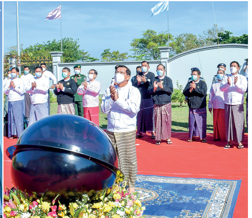
State Administration Council Chairman Prime Minister Senior General Min Aung Hlaing presses the electric button to inaugurate the High Court of Mon State yesterday.