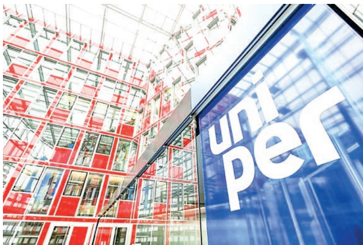
Lots of red: Uniper has reported a 40-billion-euro net loss for the first nine months of the year, one of the biggest losses in German corporate history.

SHAREHOLDERS of troubled German gas giant Uniper on Monday approved the company’s nationalization after it was pushed to the brink of collapse following Russia’s invasion of