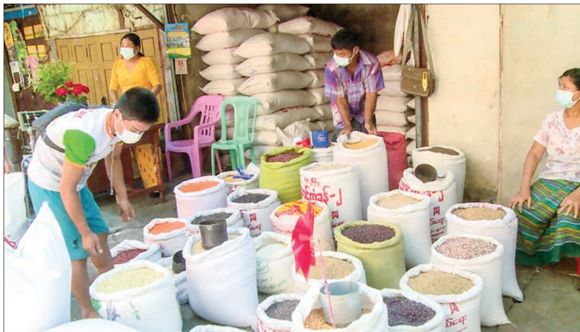
Myanmar is the top producer of the black gram that is primarily demanded by India, while pigeon peas, green grams and chickpeas are cultivated in Australia and African countries besides Myanmar.

Myanmar primarily exports black gram, green gram and pigeon peas. Of them, black gram and pigeon peas are mainly sent to India while green grams are