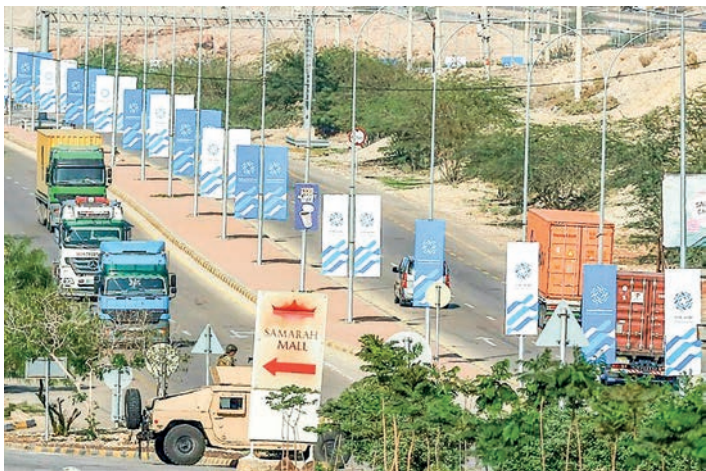
The Jordanian army has announced it will deploy forces on the road from Amman airport to the Dead Sea conference centre.

The meeting will also be attended by the EU’s top diplomat, Josep Borrell, who has been mediating talks aimed at reviving Iran’s nuclear deal with world powers. Syria continues to be a battleground for competing geopolitical interests and Lebanon remains in an economic and political quagmire.—AFP