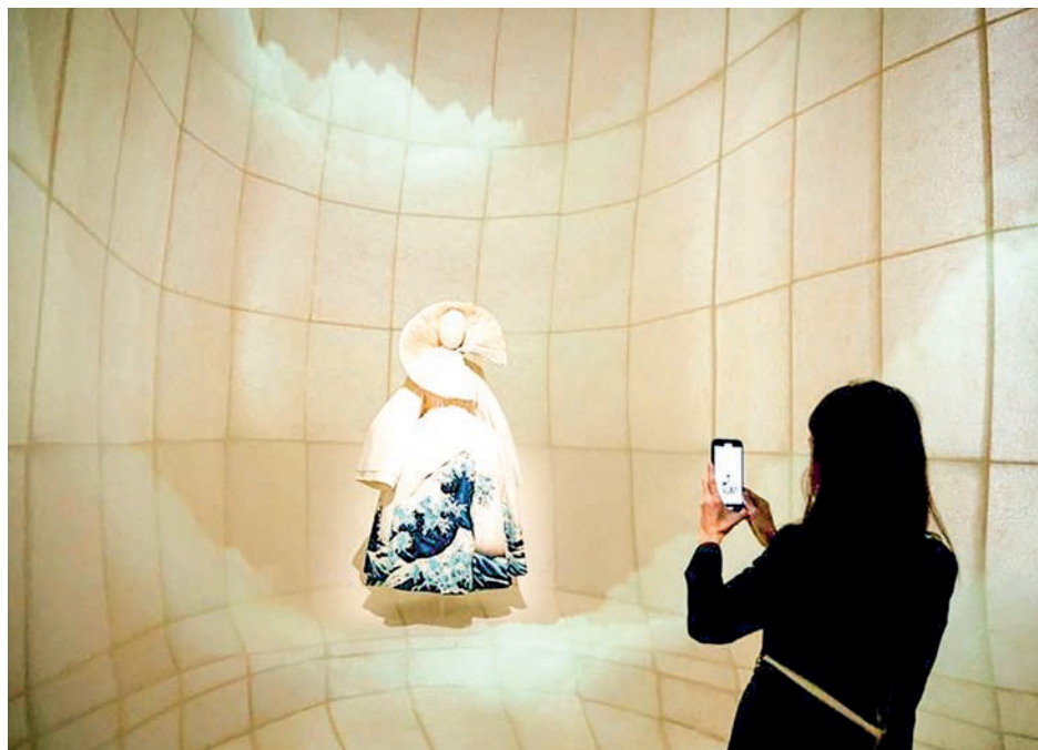
After runs in Paris, London and New York, an exhibition showcasing the work of Christian Dior has arrived in Tokyo.

A hit exhibition showcasing Christian Dior’s work opens in Tokyo this week with a focus on the French designer’s fascination with Japan and the country’s influence on his pieces.