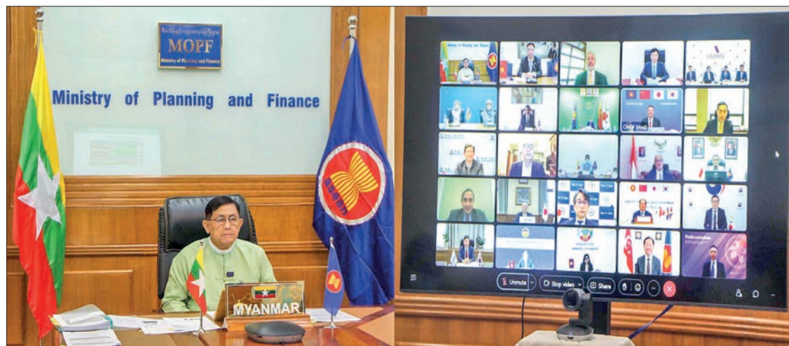
The China-hosted online ASEAN+3 Finance and Central Bank Deputies Meeting.

In the first informal session of the meeting, the 2022 economic situation analysis of ASEAN+3 regional countries was discussed by the International Monetary Fund (IMF) and the ASEAN+3 Macroeconomic Research Office (AMRO), and Financial Programmes to Ensure Long-term Sustainable Development in the Region" by the Asian Development Bank. Deputy ministers and deputy governors of the central banks exchanged their views and