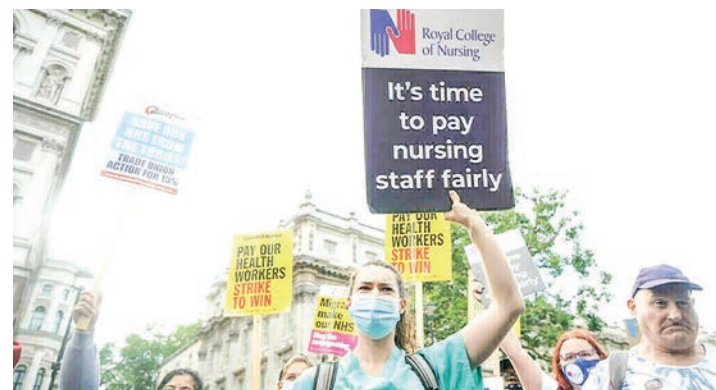
Up to 100,000 members of the Royal College of Nursing (RCN) in England, Wales and Northern Ireland are holding the latest one-day stoppage after walking out last Thursday for the first time in the union's 106-year history.