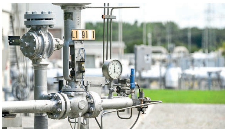
Germany has been struggling to fill its natural gas reserves ahead of the winter given the low level of Russian deliveries.