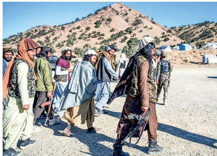
Taliban security personnel walk after a handover ceremony for the newly built houses.

Even before the earthquake, Afghanistan was in the grip of a humanitarian disaster made worse by the Taliban takeover in August 2021.—AFP