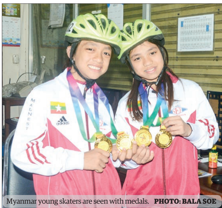
Myanmar young skaters are seen with medals.

It is reported that the two Myanmar skaters who participated in the Melaka Open Speed Skating Challenge (MOSC)-2022 held in Malacca, Malaysia, on 17 December won four