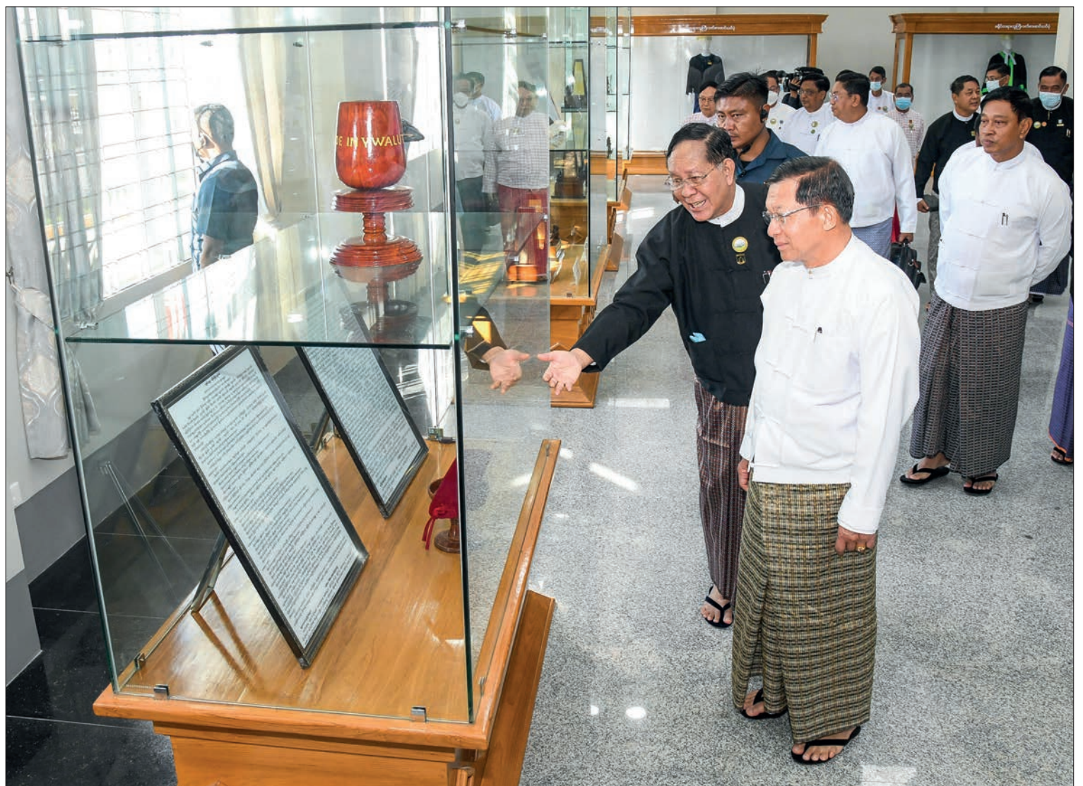
State Administration Council Chairman Prime Minister Senior General Min Aung Hlaing views round the new building of the Mon State High Court in Mawlamyine on 20 December 2022.

ion presented a scale model of the high court to the Senior General.