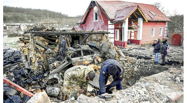
Local residents clear debris following a barrage of drone strikes from Russia in Stari Bezradychi village, Kyiv region, on 19 December 2022.

Guterres warned against further escalation of the conflict in Ukraine.—Xinhua