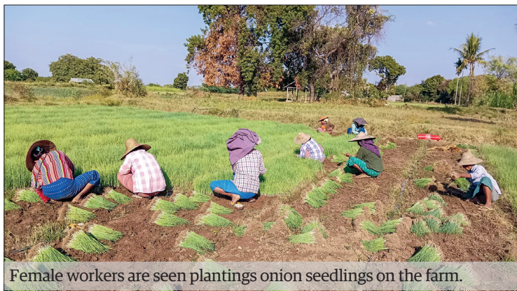
Female workers are seen plantings onion seedlings on the farm.

Normally, there are 100,000 acres of onions in the country, with the production of 600 million visses. They are commonly found in Mandalay, Sagaing and Magway regions. —TWA/EMM