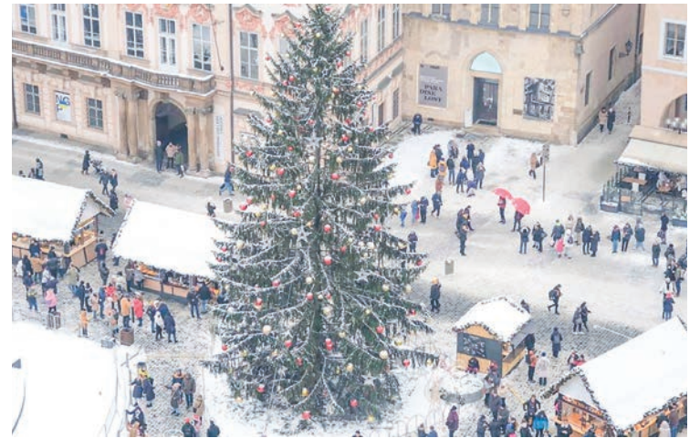
This photo taken on 16 December 2022 shows a Christmas market at the Old Town Square in Prague, Czech Republic.

“I will carefully consider whether I actually need or want the things I’m thinking of buying. That is how I can and will save money. The economy in general is going downhill — this is the message I get from my stock market investments.” —Xinhua