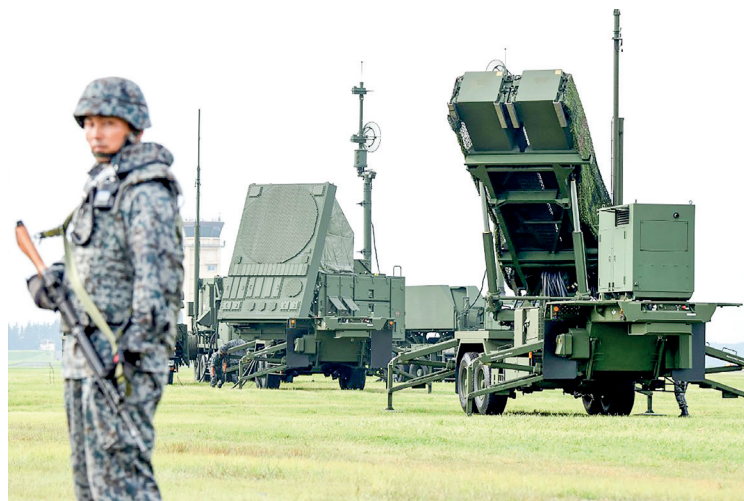
This file photo taken on 29 August 2017 shows soldiers from the Japan Air Self-Defence Force setting up PAC-3 surface-to-air missile launch systems during a temporary deployment drill at US Yokota Air Base in western Tokyo.

“The formalization of Japan’s new line of aggression has fundamentally changed the security environment in East Asia,” said the statement, which was carried by the official Korean