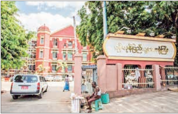
An entrance to Yangon General Hospital.

FROM 1 January 2023, patients wishing to receive medical treatment at the specialty outpatient department of Yangon General Hospital will be allowed only online booking, according to a statement from Yangon General Hospital.