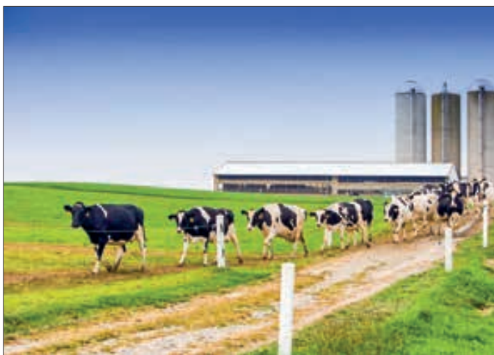
The agriculture and animal husbandry, especially the dairy industry, is a key area of economic and trade cooperation between China and New Zealand.

The cooperation in this field will further enrich and expand the pragmatic cooperation between both countries and contribute to the stable and healthy development of the comprehensive strategic partnership between the two sides, she added.—Xinhua