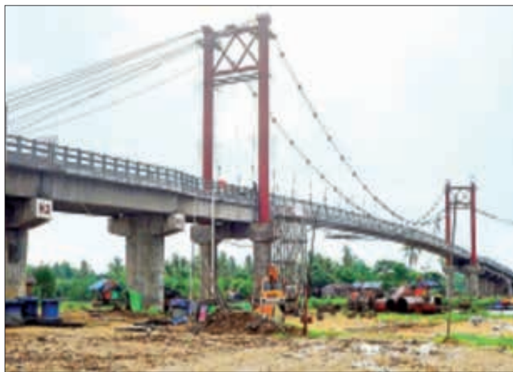
The construction site of Seikkyi-Khanaungto Bridge.

bridge will be built with reinforced concrete beams, the upper main bridge will be made of steel arch bridge and Steel Box Girder, and the approach bridges will be built of PC Girders.