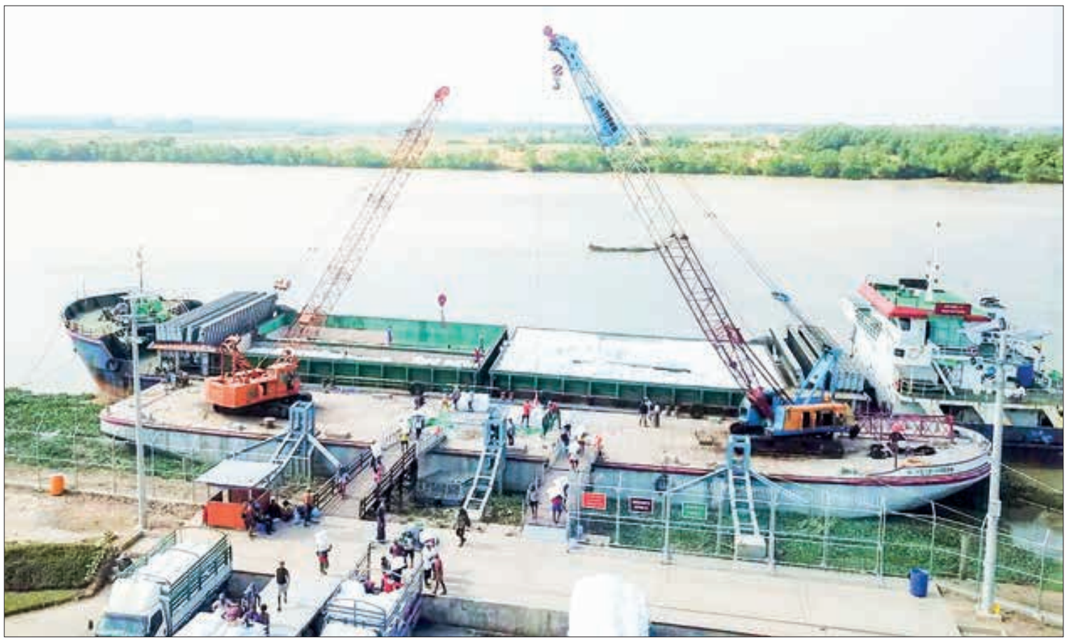
Bags of rice being loaded on vessel at Patheingyi Port for exportation to Bangladesh.

According to the government to government pact between Myanmar and Bangladesh, Bangladesh is to purchase 200,000 tonnes of rice. Myanmar sends rice to Bangladesh through Yangon Port and Thilawa terminals. Additionally, the country made a milestone to ship the goods via the Ayeyarwaddy International Industrial Port and sent 18,475 tonnes of rice with seven ships so far. When 2,650 tonnes of rice is exported by MCL-7 ship, the overall export