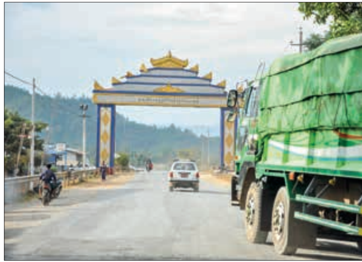
Cargo trucks rolling into China through Muse 105 th -Mile border point.

Prior to the pandemic, Kyalgaung was the busiest and biggest trade post and it per-