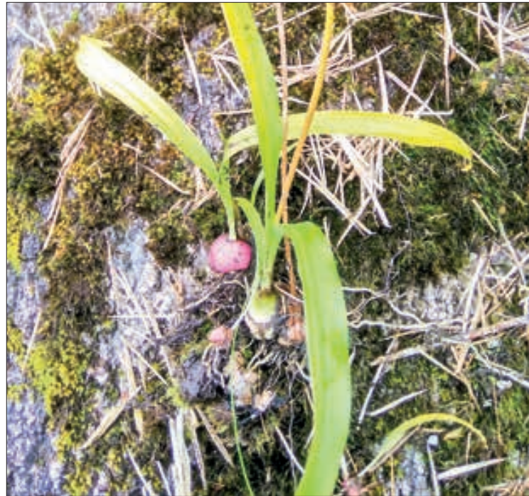
Langba plant seen with its yams.

tific name and on Google. So, if we make research, it will bring benefits to the country. Although it is used in preparation of cosmetics, it is also useful for pharmaceutical industries and other sectors. The purchasers (foreign countries) offer high prices as they might produce the species