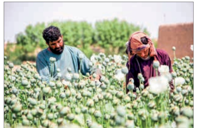
In this photograph taken on 13 April 2019, Afghan farmers harvest opium sap from a poppy field in the Gereshek district of Helmand province. Afghanistan is the world's top grower of opium, and the crop accounts for hundreds of thousands of jobs.

mated street value of $50 million, the police said.