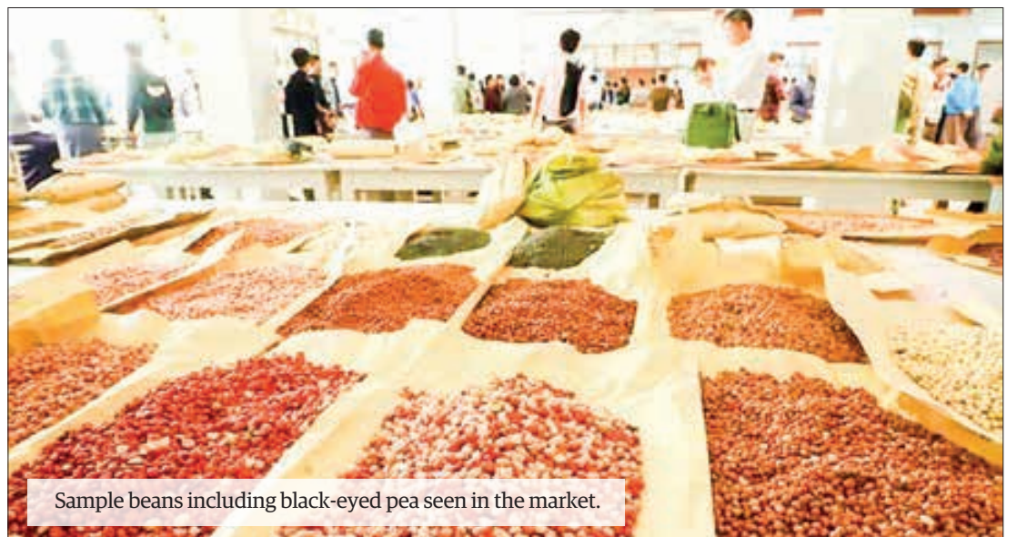
Sample beans including black-eyed pea seen in the market.

The foreign trade partners prefer Myanmar’s black-eyed peas due to the low content of chemical residues.—Min Htet Aung (Mandalay sub-printing house)/KK