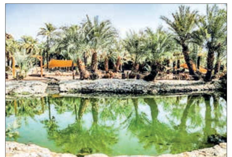
Situated in an oasis amid a volcanic field, the Saudi town of Khaybar was once home to thousands of Jews defeated by Prophet Mohammed's army.

At the centre, displays avoid mentioning the seventh-century battle and tourists can arrange hikes to nearby volcanoes, strolls through lush palm springs or helicopter tours over ancient tombs and desert kites, which are dry stone walls that served as animal traps. —AFP