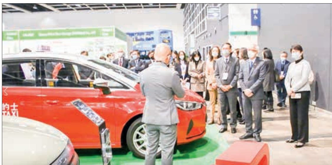
Union Minister for Natural Resources and Environmental Conservation U Khin Maung Yi views electric cars at 17 th Eco Expo in Hong Kong on 14 December.

The Union Minister and party returned to Yangon by air yesterday afternoon.—MNA