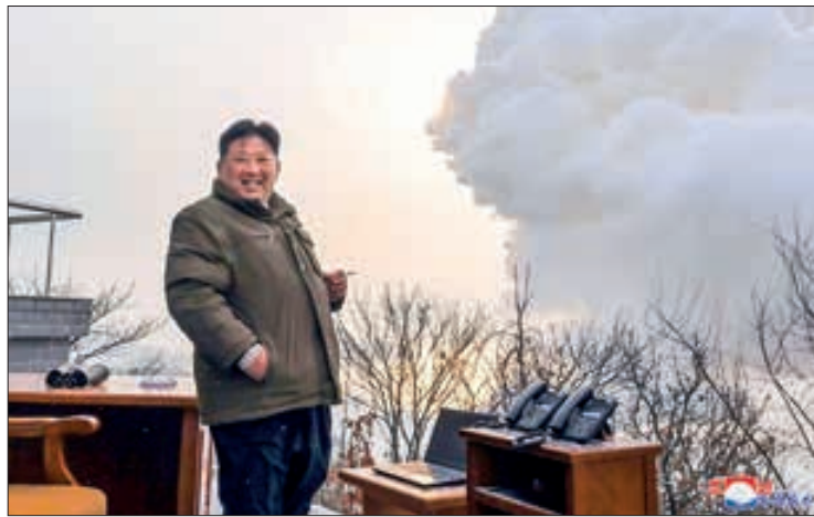
North Korea fired two ballistic missiles, Seoul's military said, days after Pyongyang announced a successful test of a solid-fuel motor for a new weapons system.

The latest launches came after Japan said Friday it will obtain "counterstrike capabilities" in three revised defense documents. In one of the three, the updated National Security Strategy, Pyongyang's military activities were described as an