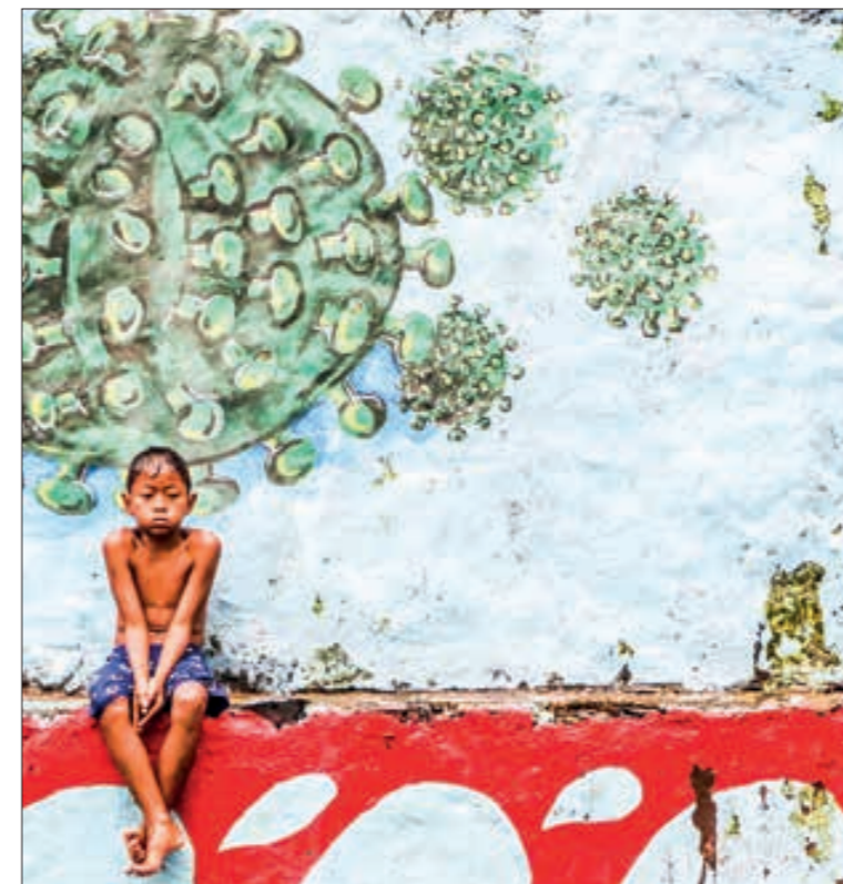
Scientists are aiming to develop a vaccine targeting a new "disease X" within 100 days.

Coronaviruses and influenza viruses will be among the main suspects because of their proven pandemic potential.