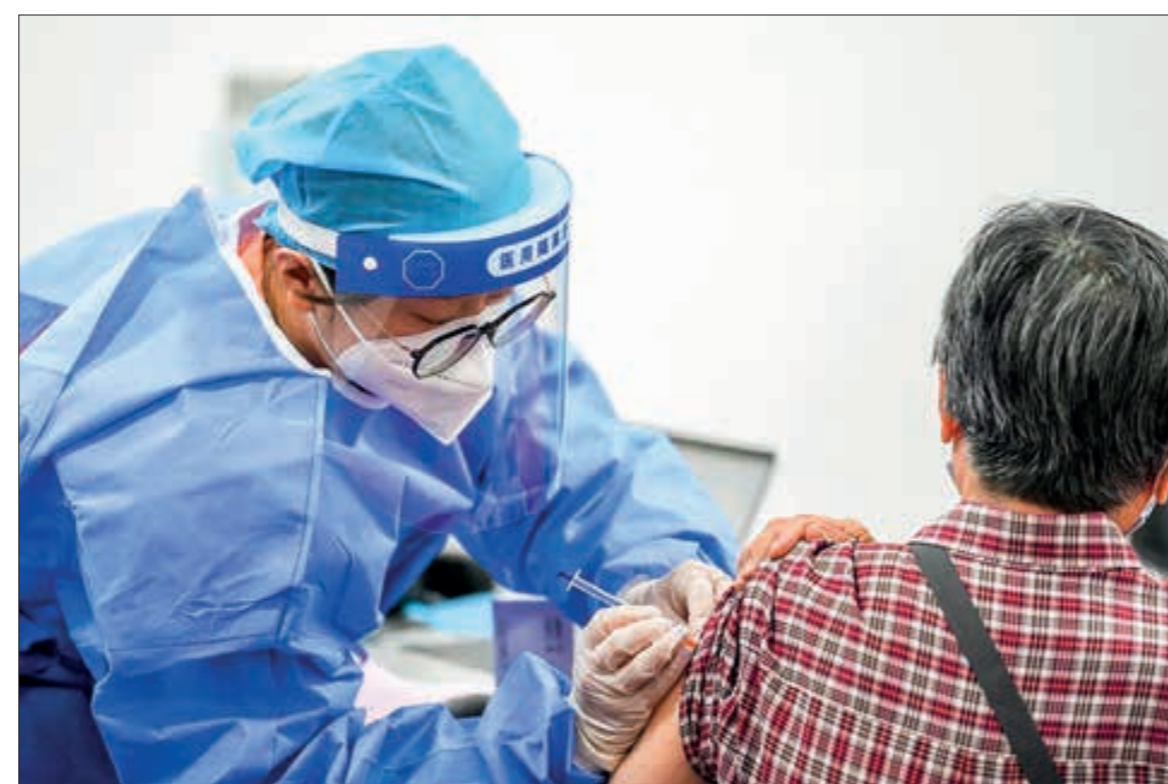
A medical worker injects a booster shot of the COVID-19 vaccine for a resident at Aoyuncun Subdistrict in Chaoyang District, Beijing, capital of China, 13 July 2022.

tal clear now: China has honored what it has always said it would do — putting the people and their lives above all else.