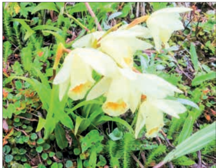
Langba medicinal plant.

language, which grows in Alpine forest, on the hills to sell at K1.2 million per viss to the merchants. The merchants resell the product to the neighbouring countries for years. Therefore, the local botanists are worried that the unnamed medicinal botanical plant species would disappear from the country.