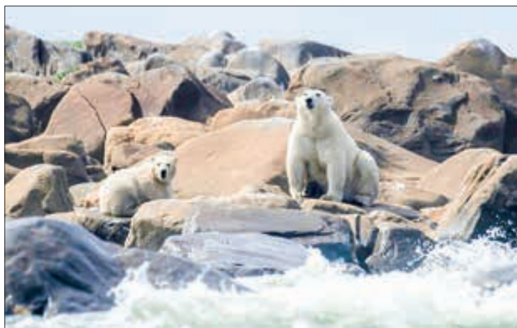
A female polar bear and her cub look for something to eat on the shoreline of the Hudson Bay, Canada.

TOP officials at high-stakes UN biodiversity negotiations said Saturday they were confident of