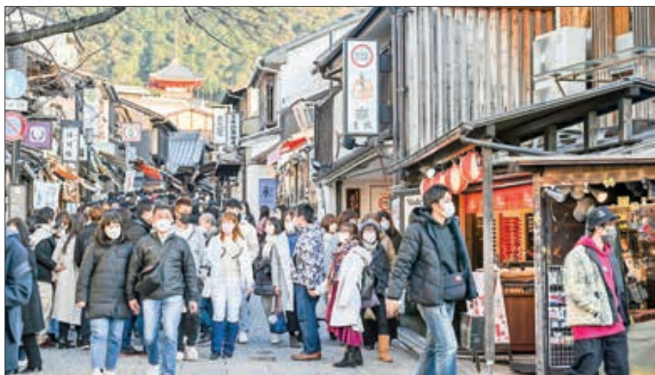
File photo shows tourists in the area around Kiyomizu-dera temple in Kyoto on 8 January 2022.

THE number of holiday-makers in Japan making domestic trips during the New Year vacation period is expected to rise by 3 million from a year earlier but remain at 71.8 per cent of