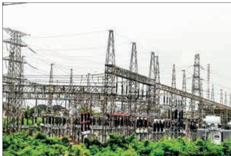
South Africa has endured power shortages for the past 15 years, but the cuts reached new extremes this year.

"Eskom can confirm that the SANDF (South African National Defence Force) is