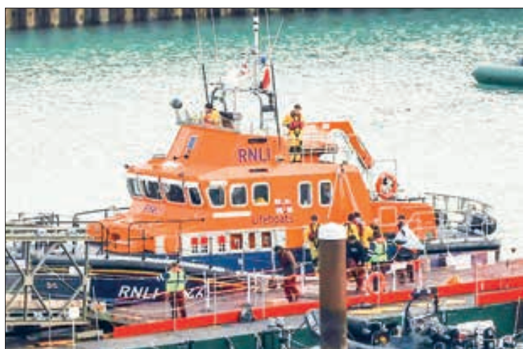
Coastguards brought 45 more people onshore in Calais after they issued a distress call, while a lifeboat went to the aid of a further 40 people nearby.

pal port of entry for products coming from Asia. For years, an influx of opioids into North America — much of it smuggled from Asia — has grown to the point of presenting a major public health challenge for Canada and the United States. —AFP