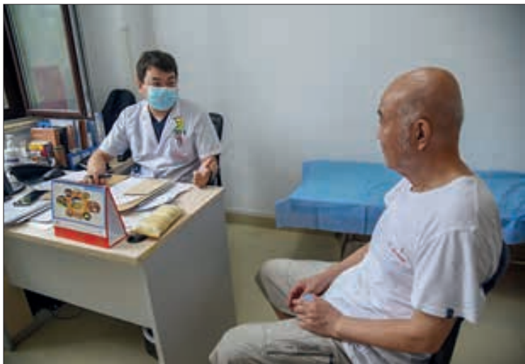
A medical worker at a nursing institution talks with a visitor in Qingdao, Shandong Province in east China, on 22 July.