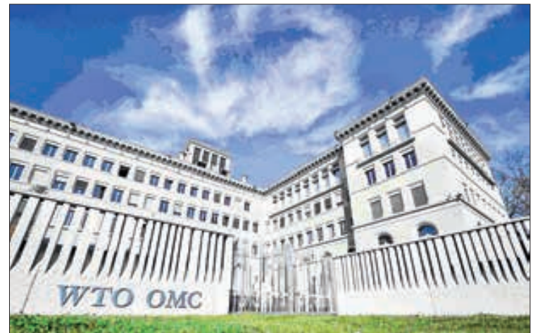
The World Trade Organization (WTO) headquarters are seen in Geneva on 12 April 2018.