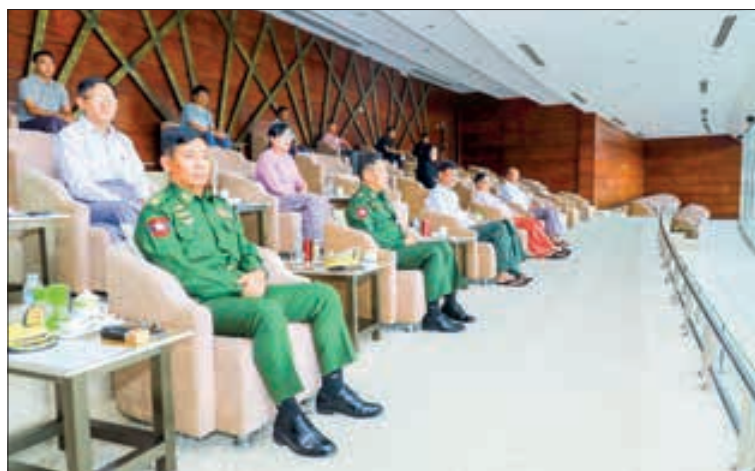
SAC members General Mya Tun Oo, Jeng Phang Naw Taung and Dr Banyar Aung Moe enjoy third-placed match of SAC Chairman's Trophy U-18 women's football tournament at Wunna Theikdi Stadium in Nay Pyi Taw on 18 December.