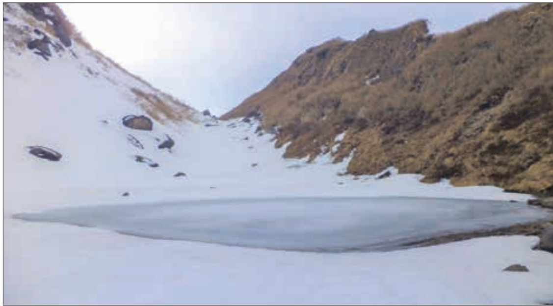
Snow-capped Hkakaborazi Mountain.

The Hkakaborazi National Park is 942,080 acres wide and the local residents search the medicinal orchid specie called Langba in Rawang and Tibet language and Pechi in Chinese