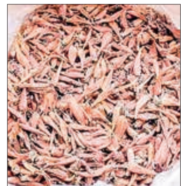
Dried Langba yams valved at K1.2 million per viss.