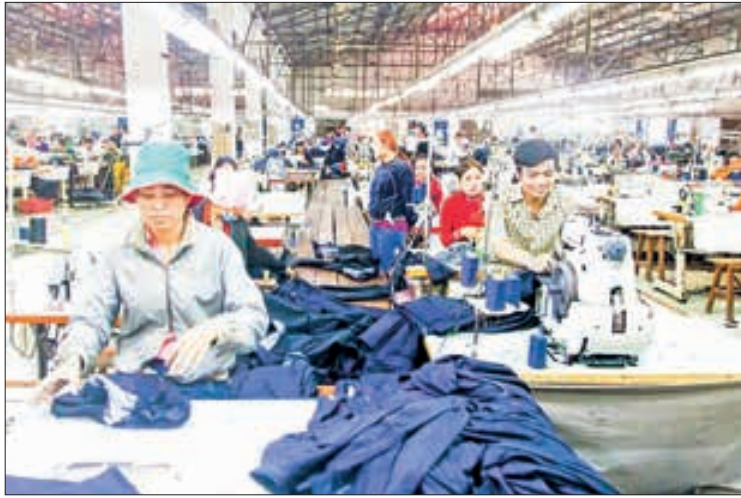
Garment factory workers are seen at the Kin Tai garment factory in the Chak Angre commune of Phnom Penh in May 2015.

CAMBODIA'S economy has recovered well from the impact of COVID-19 in 2022, with better