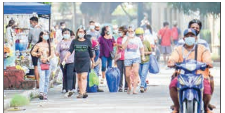
This file photo shows residents wearing government-imposed face masks and face shields to protect them from COVID-19 coronavirus disease in Manila.

The Philippines reported its highest COVID-19 single-day tally of 39,004 new cases on 15 January. The country, with a population of around 110 million, has fully vaccinated over