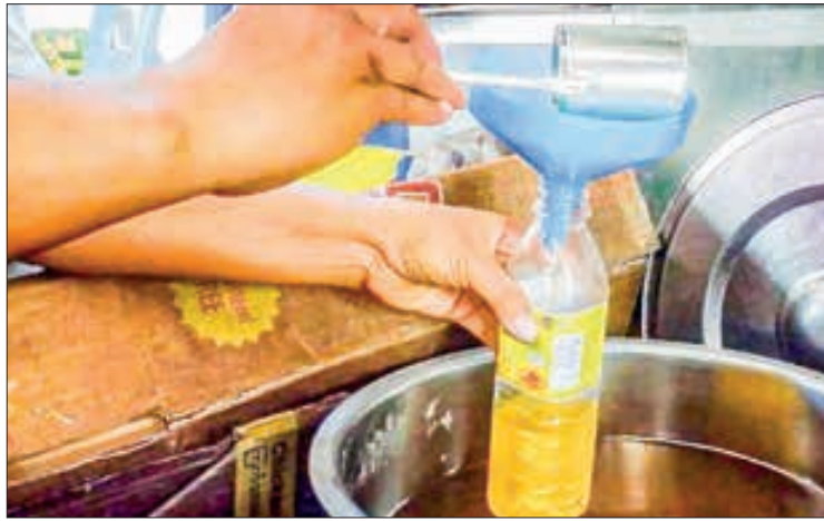
Edible oil is pouring into a bottle for a consumer at a shop.

The Malaysian palm oil price dipped from 3,926 Ringgit to 3,918 Ringgit on 16 December. The relevant authorities issue the wholesale reference price of palm oil on a weekly basis. The wholesale reference price