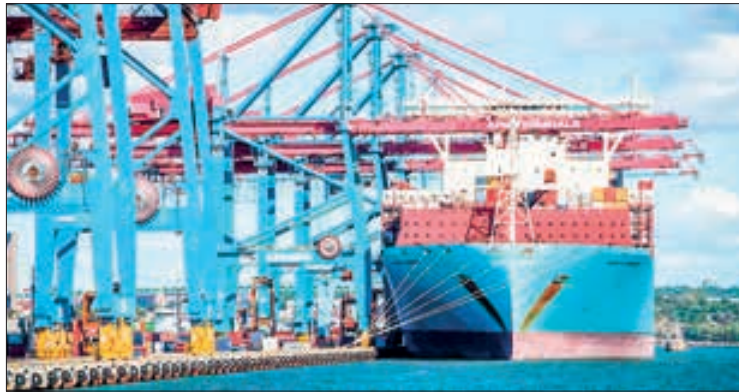
In a nutshell, carbon markets are trading systems in which carbon credits are sold and bought. The carbon market will be progressively extended to the maritime sector and intra-European flights. A container ship sits moored to a terminal in the port of Gothenburg, a busy shipping centre on the west coast of Sweden.

The deal means emissions in the ETS sectors are to be cut by 62 per cent by 2030 based on 2005 levels, up from a previous goal of 43 per cent. Concerned