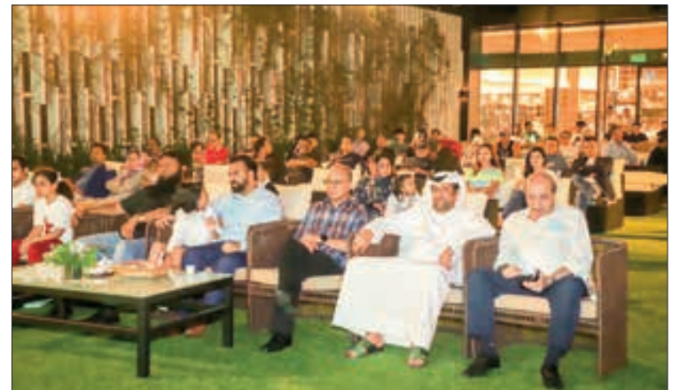
Qatar Embassy diplomats seen at the ceremony to mark the conclusion of the FIFA World Cup Qatar 2022 at Wydham Grand Hotel, Yangon on 18 December 2022.

“We are grateful for the support and praise for our success in organizing this major