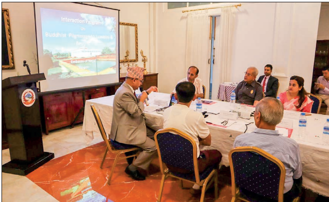
The "Interaction Programme on Buddhist Pilgrimage to Lumbini and Beyond" was held on 11 December 2022 at the Nepalese Embassy in Yangon.

In 2018, before the pandemic, about 50,000 pilgrims and tourists visited Nepal from Myanmar.