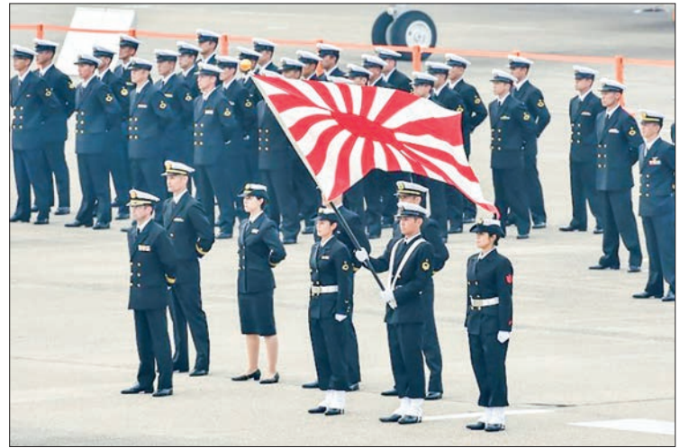
Japan's constitution limits military spending to nominally defensive capabilities.

Critics note that the Constitution only allows Japan to act in self-defence, but the NSS said the nation needs to have the ability to "make effective counterstrikes in an opponent's territory as a bare minimum self-defence measure."