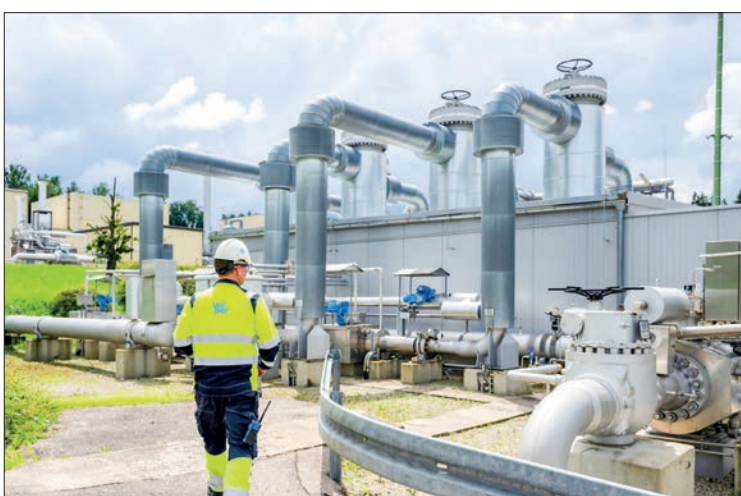
An employee of Uniper Energy Storage walks through the above-ground facilities of a natural gas storage facility in Bierwang, Germany, 10 June 2022.

GERMANY will not fall into recession due to relief measures that have lowered energy costs, an institute forecast Thursday, the latest indication an economic shock will be milder than feared.