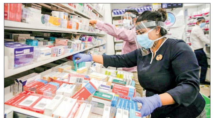
A local pharmacy in UK.

The government was working with manufacturers and wholesalers to speed up supplies, he added.—AFP