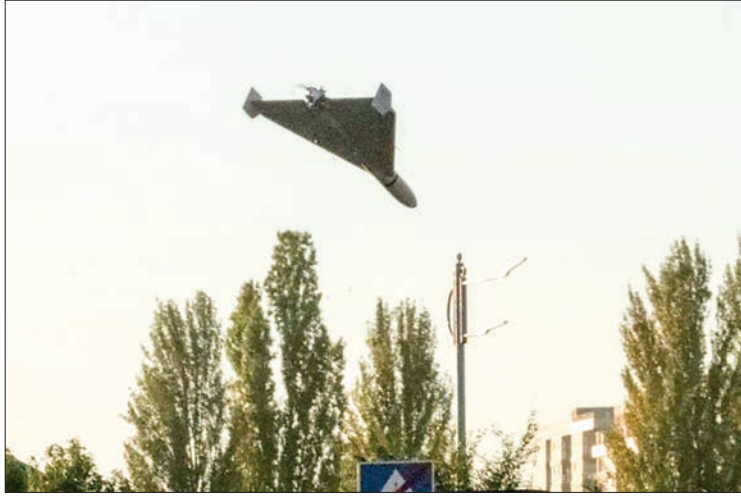
Drones and satellite imagery have changed the rules of the battlefield.