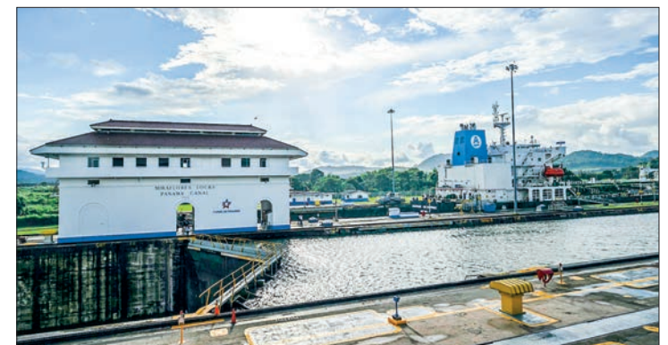
The Panama Canal (PC) is essential to global trade, wherein an estimate of over $270 billion worth of cargo crosses the canal each year.

The locks are huge concrete chambers that are filled with, then emptied of, millions of litres of water to raise or lower ships as they pass through the Canal linking the Atlantic and Pacific oceans. Five per cent of all global trade moves through the strategic waterway.—AFP