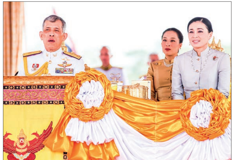
Thailand's King Maha Vajiralongkorn (left) is accompanied by Queen Suthida (right) and Princess Bajrakitiyabha Mahidol (centre) as he presides over the annual royal ploughing ceremony near the Grand Palace in Bangkok in May 2019.

She currently serves as a public prosecutor and is involved in humanitarian assistance projects, especially on promoting women's rights in the criminal justice system.—Kyodo