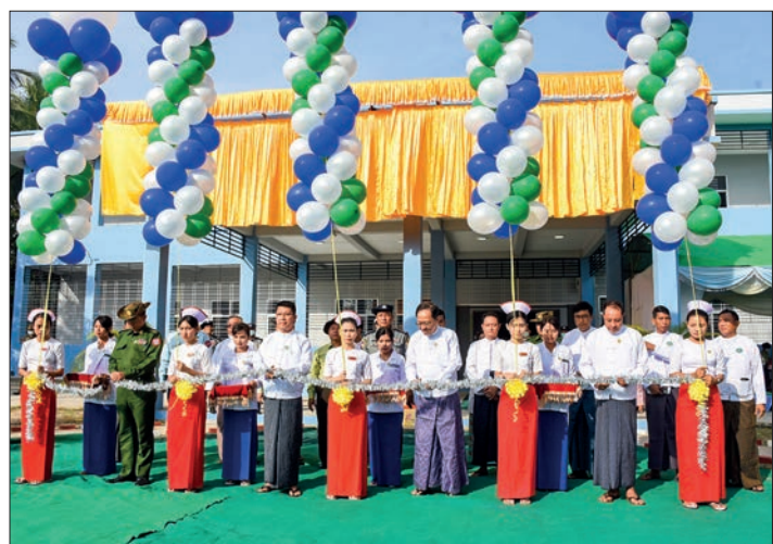
Union Health Minister Dr Thet Khaing Win and dignitaries cut the ceremonial ribbon to open the new two-storey extension building at Kyaiklat public hospital yesterday.

AS a gesture of hailing Diamond Jubilee Independence Day, the opening ceremony of Kyaiklat public hospital's two-storey annexe in Ayeyawady Region was held yesterday morning.