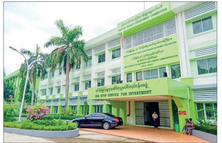
YRIC manages approval for investments in projects in Yangon Region with attraction of local and foreign investments.

Two enterprises from the Republic of Korea also pumped $5.4 million into Myanmar, with