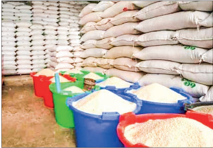
Rice bags are stockpiled at a warehouse.

THERE is a price difference of K100,000 between high-grade Pawsan paddy from the Shwebo area and those from the delta region.