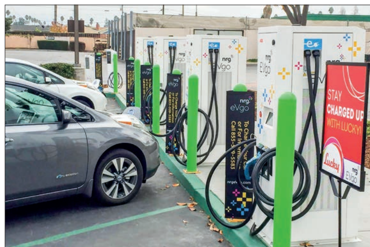
Battery electric cars (BEVs) are seen being charged at the charging station in the foreign country.