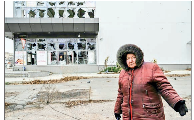
Much of Ukraine is struggling without heat or power after Moscow started targeting electricity and water systems nearly two months ago.

The International Committee of the Red Cross confirmed that a Ukrainian Red Cross worker had been killed by the strikes and urged that humanitarian “personnel and property” be spared.—AFP