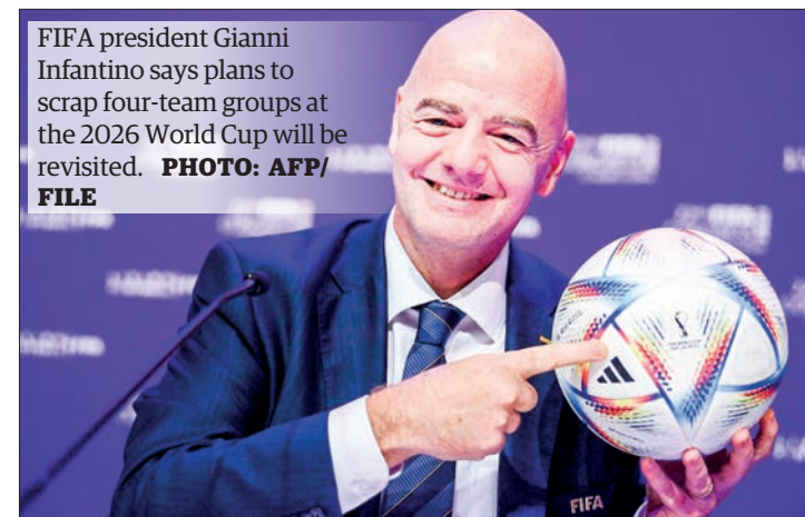
FIFA president Gianni Infantino says plans to scrap four-team groups at the 2026 World Cup will be revisited.

president Infantino said the thrilling success of the existing first-round format at the Qatar World Cup—where teams were divided into traditional groups of four—had prompted a rethink. Several groups in Qatar went down to the wire, with qualification hanging in the balance until the final whistle. “The groups of four have been absolutely incredible until the last minute of the last match,” Infantino told a press conference in Doha.—AFP