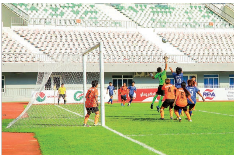
SAC members and dignitaries watch the semi-final second match of the SAC Chairman's Trophy U-18 women's football tourney in Nay Pyi Taw yesterday.

team trounced the Kachin State team 6-1 in the second semi-final match.