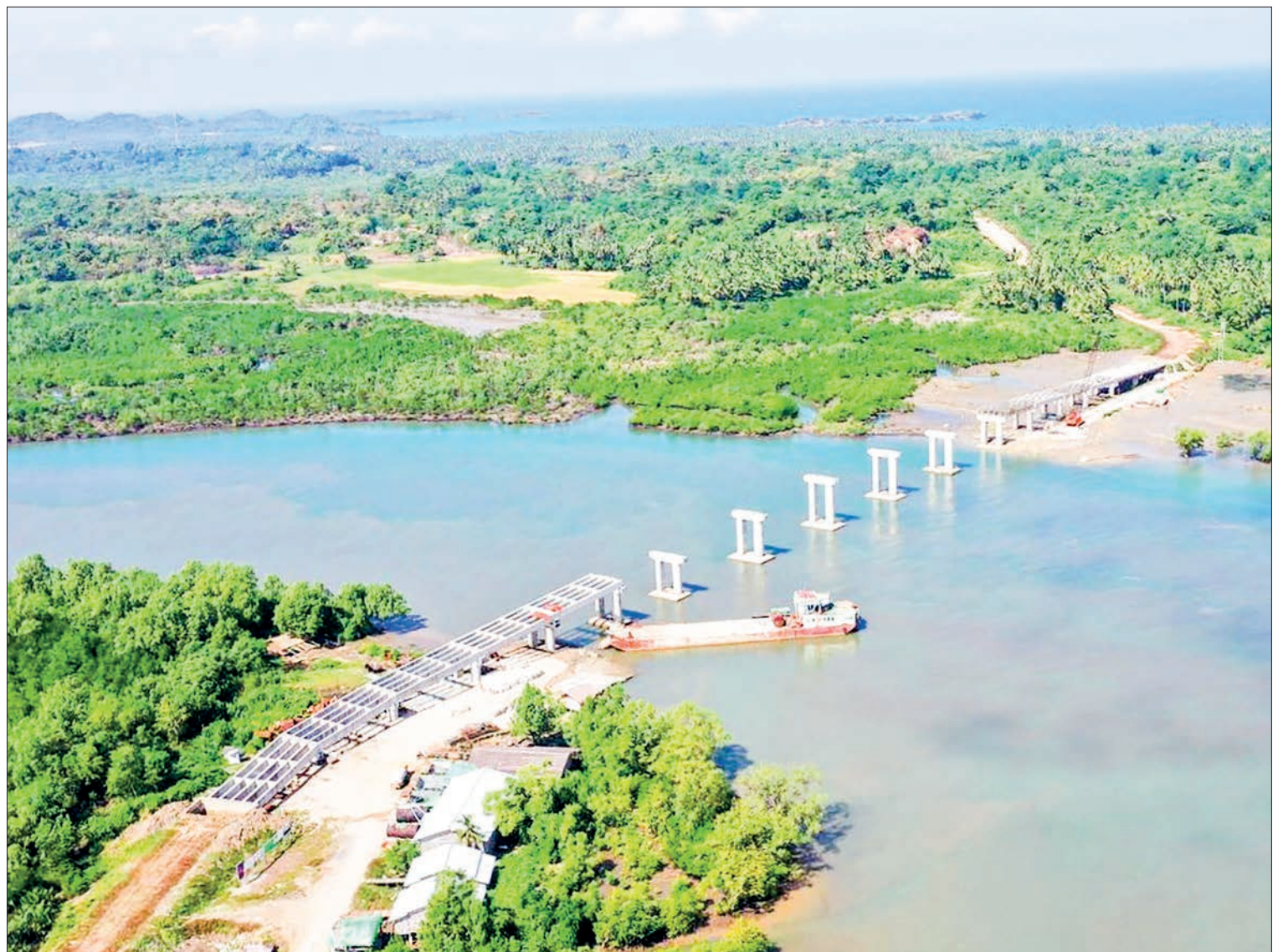
An aerial view of the Chaungwa Bridge under construction in Ngaputaw Township of Patheingyi District in Ayeyawady Region.

“We construct the bridge crossing the Chaungwa River on the Ngayokkaung-Goyangyi Island Road. Upon completion, it will benefit over 40,000 residents of Kywaychaing, Nathaphu, Natmaw, Yaykyaw, Thephyu, Kanchayoo, Kwinbat, Moetahmyin and Sabagyi villages. Locals can easily get the Ngayokkaung station hospital for health services. Local products can be also easily transported and so the bridge will be a key route for the region and locals,” said an official of Special Bridge Task Force 16 of the Ministry of Construction.