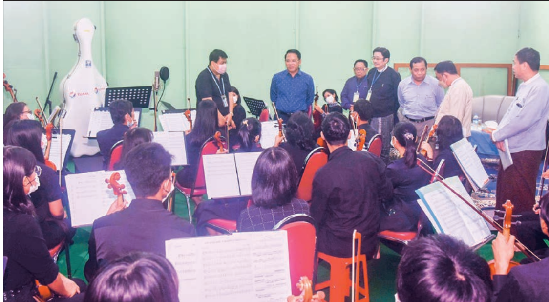
Union Minister U Maung Maung Ohn views the State Orchestra which is practising for the dinner party of Diamond Jubilee Independence Day.

Moreover, the Union minister inspected the medals and certificates of honour displayed at the ground floor of MRTV to be presented to the winners of the “Tu Shin Hnwal Pyaw Gita Pwal Taw” Season 2. — MNA/KTZH