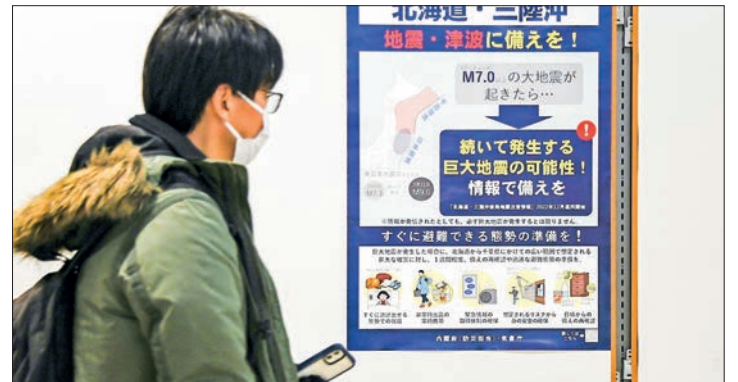
A poster for the newly introduced quake alert system that warns against powerful earthquakes in the Japan and Chishima trenches is displayed in the city of Aomori on Friday.

THE Japanese government implemented Friday a new alert system in seven coastal prefectures from Chiba to Hokkaido to warn against subsequent earthquakes should a quake of magnitude 7.0 or larger strike in either of two deep-sea trenches in the Pacific Ocean where massive temblors are feared.