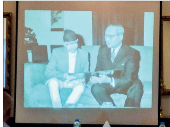
The late former UN Secretary-General U Thant took a key role in the development of Lumbini.