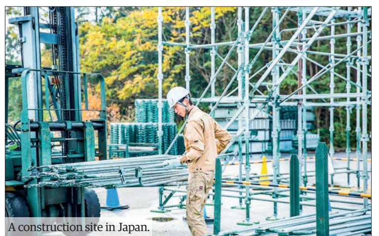
A construction site in Japan.

Myanmar nationals working in Japan are over 4,500 men and 5,100 women. Most apprentices are assigned to construction sites, garment factories, the agricultural sector, the food industry, industries and the manufacturing industry. Skilled workers are mostly recruited by elder care services, the food industry and the agricultural sector, according to employment agencies. — TWA/CT