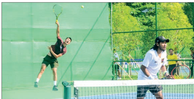
Tennis players compete in the Men’s Double event of the Myanmar Tennis Federation President’s Cup Tennis Tournament at Theinbyu Tennis Court in Yangon on 16 December 2022.

Tennis players from Yangon Region, Mandalay Region, Bago Region, and Kachin State are participating in the tour-