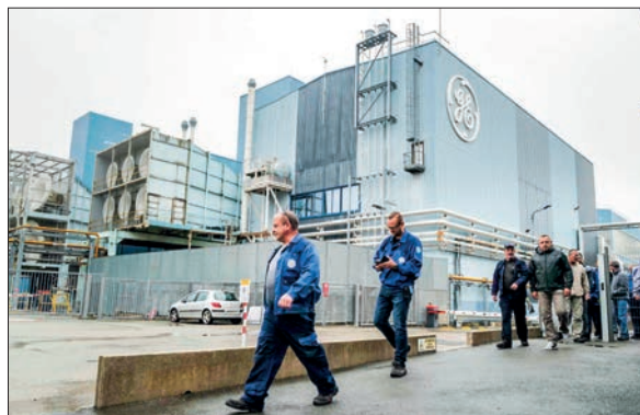
Employees of the General Electric (GE) company arrive for an inter-union general meeting in Belfort, eastern France, on 7 October 2019.

agement have run high in recent years as the company cut hundreds of French jobs on slumping demand for gas turbines and other power-generation equipment. The tax inquiry was opened after the head of France’s Communist Party, Fabien Roussel, told authorities in July 2019 of his “suspicions of tax optimisation and fraud” by the company.—AFP