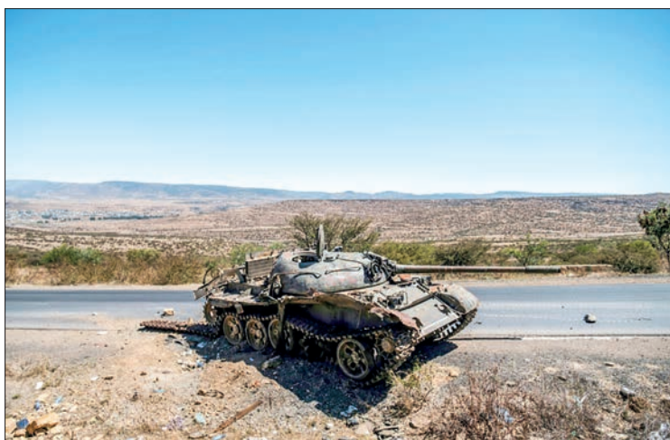
Fighting between government forces and rebels has left Tigray cut off from the outside world for two years.

US citizens trapped in war-torn Tigray are being detained and interrogated by Ethiopian authorities while trying to leave the country, interviews with fleeing people and family members show.