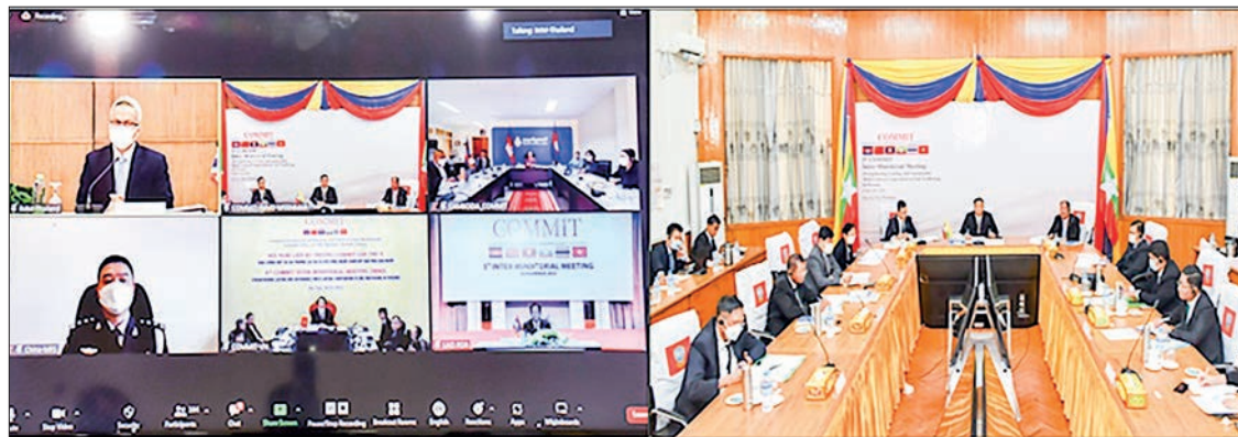
Screenshots of the fifth COMMIT Inter-Ministerial Meeting-IMM5.

Thailand chaired the meeting and gave an opening speech. At the meeting, member countries discussed the implementation of the Mekong sub-regional work plan - SPA IV, the effects of the work plan SPA