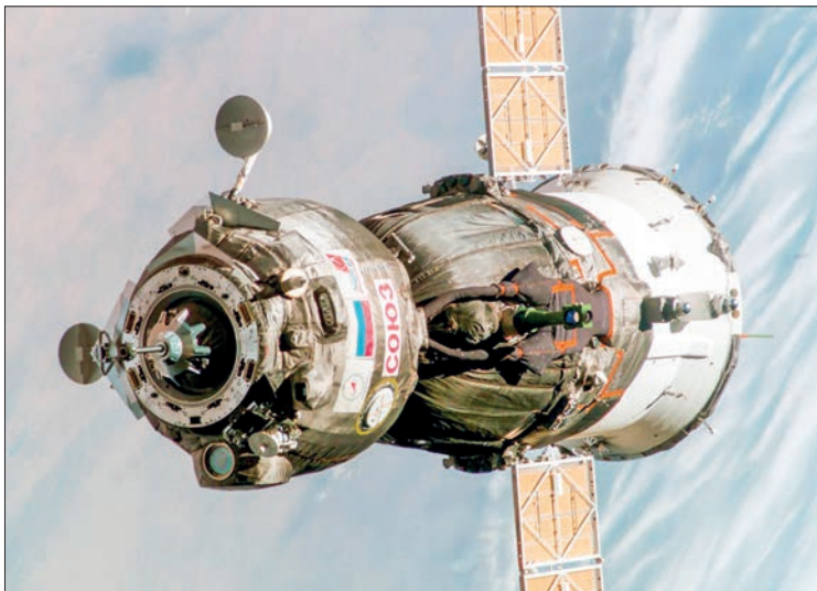
The leak on the Soyuz MS-22 spacecraft did not pose any danger to the astronauts and cosmonauts aboard the ISS.

"The cause of the leak may be a micrometeorite entering the radiator," TASS quoted Krikalev as saying. "Possible consequences are changes in the temperature regime." "No other changes in the telemetric parameters of either the Soyuz spacecraft or the (ISS) station on the Russian or American segments have been detected," Krikalev said.—AFP