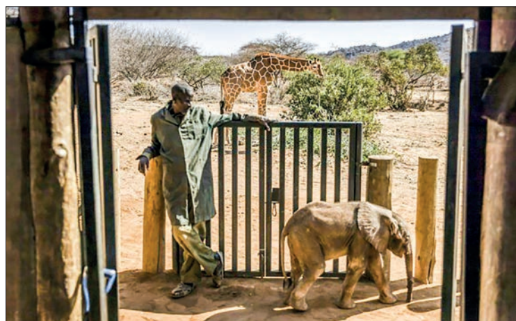
A wild giraffe grazes next to a quarantine area for elephant calves at Reteti Elephant Sanctuary in drought-hit Samburu, Kenya in October 2022.

The United States during the summit has laid out some $55 billion in funding over the next several years including to improve health infrastructure, promote green energy and stave off hunger.—AFP