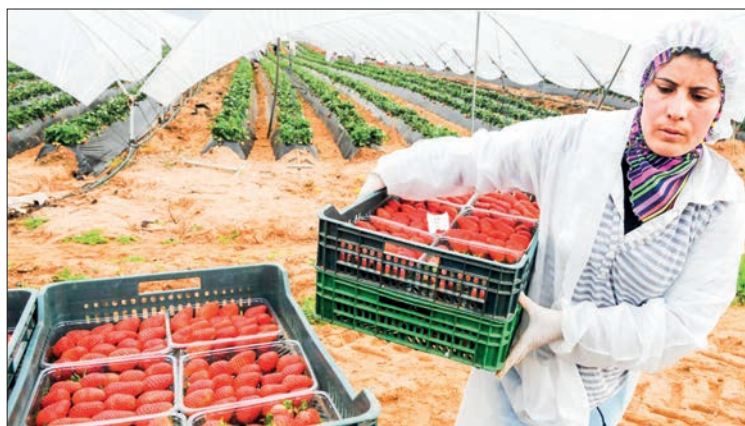
Annually, thousands of Moroccan seasonal workers go to Spain to harvest strawberries and secure additional income.

SPAIN'S cabinet on Tuesday approved a bill that grants paid medical leave for women who suffer from severe period pain, becoming the first European country to advance such legislation. Menstrual leave is currently offered only in a small number of countries across the globe, among them South Korea and Indonesia.