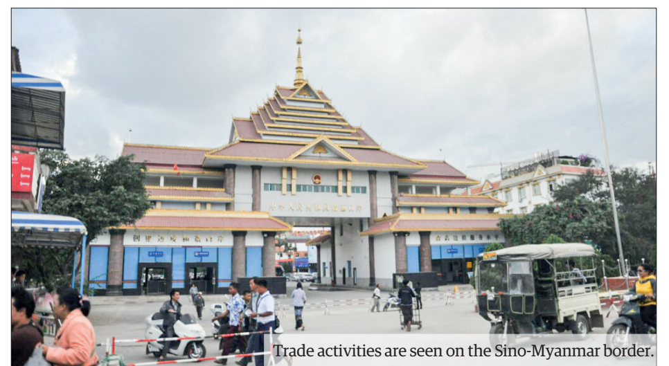
Trade activities are seen on the Sino-Myanmar border.

Rice, beans and pulses, corn, fruits and vegetables, fishery products, rubber, chilli peppers and other food commodities are exported to China, whereas machinery, plastic raw materials, consumer products and electronic appliances flow into Myanmar. – KK