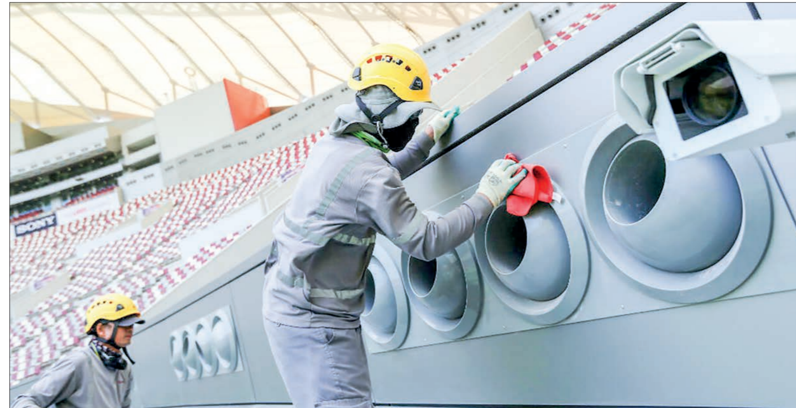
Qatar built seven stadiums for the World Cup finals as well as a new airport, metro system, series of roads and about 100 new hotels. In February 2021, the Guardian said 6,500 migrant workers from India, Pakistan, Nepal, Bangladesh and Sri Lanka had died in Qatar since it won its World Cup bid.

Geographically located in a desert, most parts of the Middle East including Qatar have an all-year-round dry climate with temperatures as high as 113 degrees Fahrenheit in summer. The workers are not allowed to work outdoors between 10:00 am and 03:30 pm from June to mid-September. Under extreme heat, workers are at risk of getting heat stress that can lead to heat stroke, heat exhaustion, heat cramps, or heat rashes straining the cardiovascular system. It is followed by heart attacks and other complications or at worst by loss of life succumbing to heat stress.