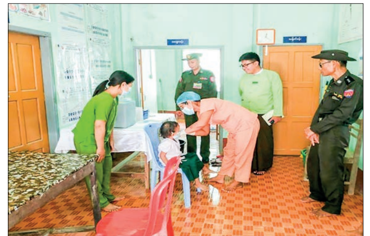
A child from Kyonpyaw Township in Ayeyawady Region gets jabbed against COVID-19 on 16 December 2022.

Similarly, on that day healthcare officials gave the vaccines to 476 from twenty-six townships in Ayeyawady Region, 90 students from seven