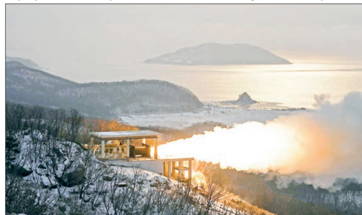
North Korea conducts a static firing test of high-thrust solid-fuel motor at the Sohae Satellite Launching Ground in Dongchang-ri in the country's northwest on 15 Dec 2022.

As for longer-range missiles, including the "Hwasong-17" ICBM, which could potentially travel over 15,000 kilometres and reach the US mainland, North Korea is thought to be concerned they could come under attack while liquid fuel is being injected to prepare for launch.—AFP