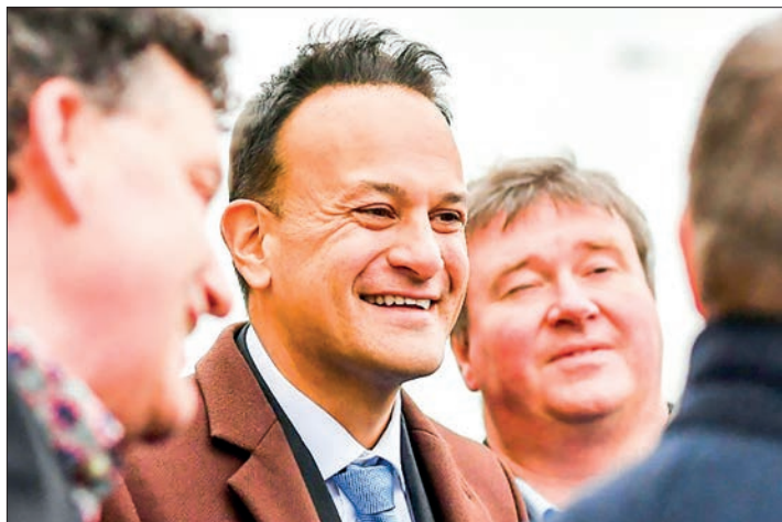
Ireland's deputy premier Leo Varadkar takes over as prime minister on Saturday under a coalition deal.

LEO Varadkar takes over for the second time as Ireland's prime minister this weekend, in a handover of power between the two main political partners in the three-party governing coalition.