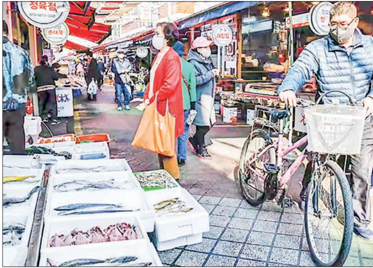
A fresh seafood stall in a street market in Seoul.

SOUTH Korea's monthly economic report on Friday warned of an economic slump for the seventh successive month with high inflation and sluggish export, according to the Ministry of Economy and Finance.