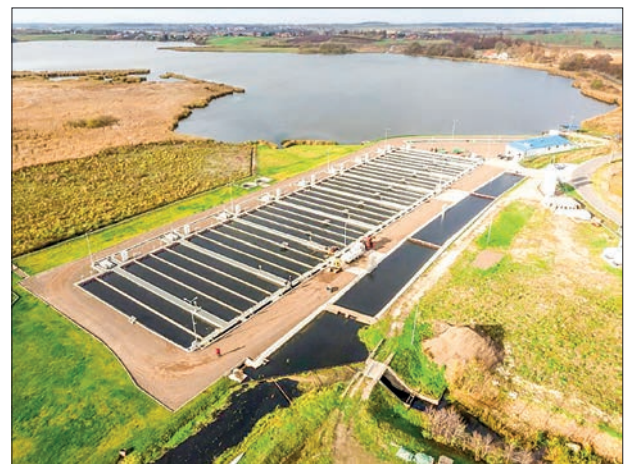
Most caviar is now farmed, with the sturgeon at Antonius Caviar's farms swim around in canals fed by the crystal clear water of a nearby river.

Paytm said it will buy shares back at 810 rupees ($9.80) each, a steep 62 per cent discount to the IPO price of 2,150 rupees, but a 50 per cent premium on Tuesday's closing price.—AFP