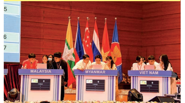
Competition of Malaysia, Myanmar and Viet Nam.