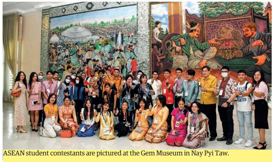
ASEAN student contestants are pictured at the Gem Museum in Nay Pyi Taw.