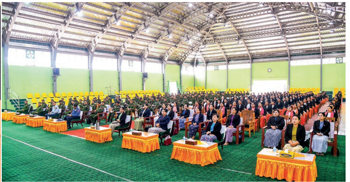
State Administration Council Chairman Commander-in-Chief of Defence Services Senior General Min Aung Hlaing holds the meeting with Tatmadaw members and families from PutaO Station of the Northern Command in Kachin State yesterday.

AS military units are formed with local ethnic nationals, these units must be united with local people in harmony. If they have united strength, anyone cannot harm the military units. Likewise, if security forces, departmental personnel and all local people are in unison, anyone cannot harm the region. So, they all have to build a united strength, said Chairman of the State Administration Council Commander-in-Chief of Defence Services Senior General