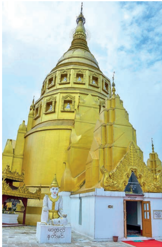
State Administration Council Chairman Prime Minister Senior General Min Aung Hlaing pays reverence to the Kaunghmulon Pagoda in Kachin State yesterday.

The Senior General and party viewed round the booths