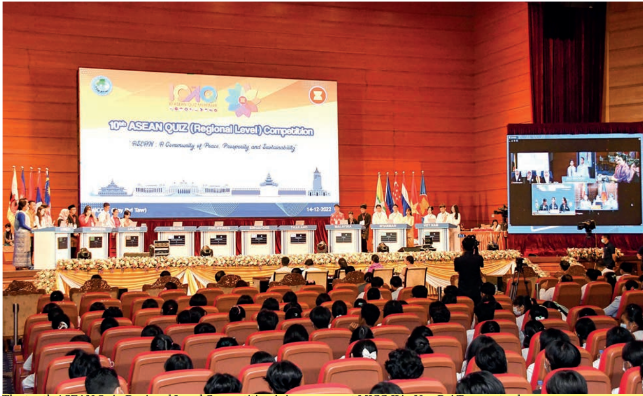
The tenth ASEAN Quiz-Regional Level Competition is in progress at MICC-II in Nay Pyi Taw yesterday.