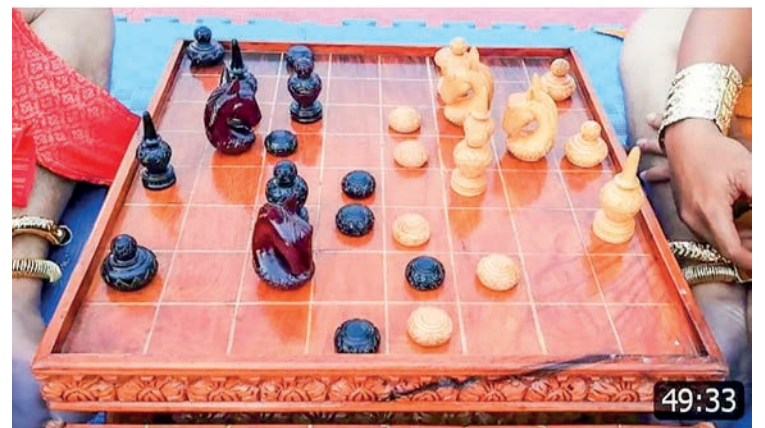
Cambodian Traditional Chess: Ouk Chatrang is similar to Myanmar Chess but the moves are different.

It is reported that those who wish to participate in the competition should contact 09 795889880 and send the list by 17 December. — Bala Soe/KZL