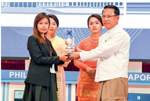
Commemorative gift to the office of the ASEAN Secretary-General.