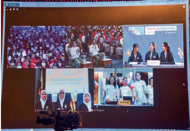
Brunei, the Philippines and Thailand compete in the contest online.

The photo display of the 10 th ASEAN Quiz-Regional Level Competition convened in Nay Pyi Taw on 14 December 2022.