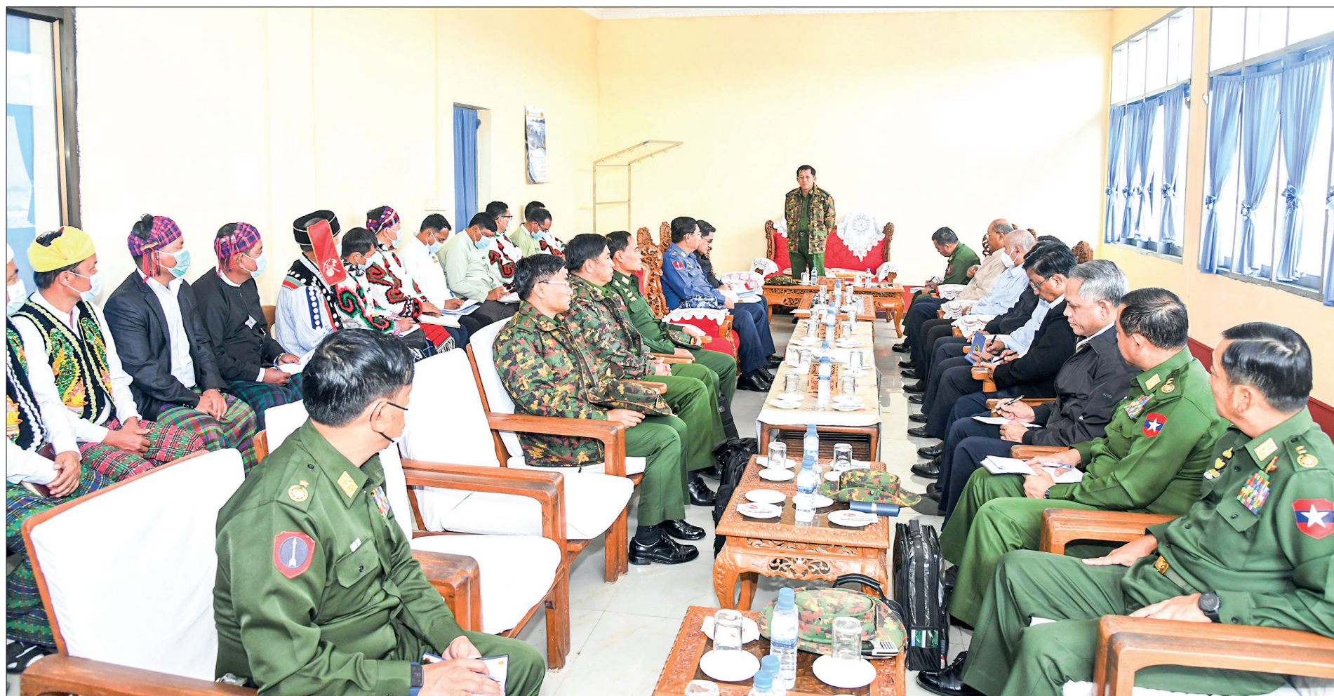
State Administration Council Chairman Prime Minister Senior General Min Aung Hlaing meets departmental officials and town elders of PutaO Township in Kachin State on 14 December 2022.

S TONE-FILLED fences should be created along streets and in residential