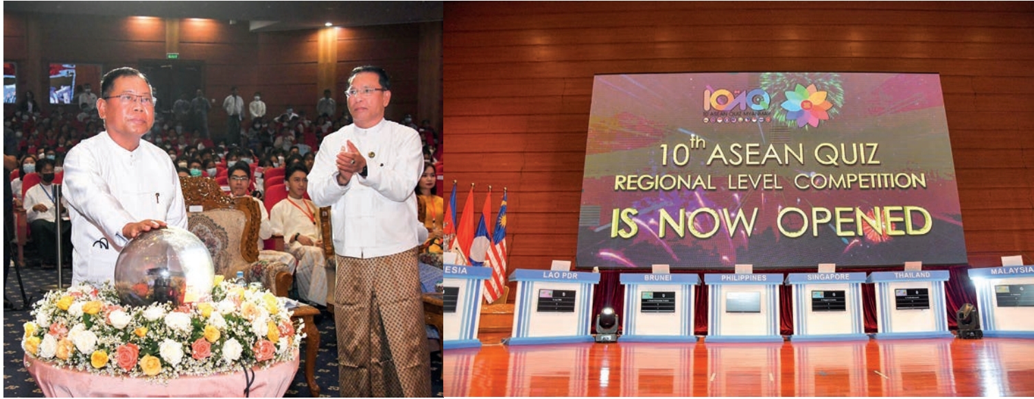
Union Minister Lt-Gen Soe Htut presses the electric button to open the tenth ASEAN Quiz-Regional Level competition in Nay Pyi Taw yesterday.

MYANMAR hosted the 10 th ASEAN Quiz-Regional Level at MICC-II in Nay Pyi Taw yesterday. Myanmar team stood first, Malaysia won second and Laos won third prizes in the competition.