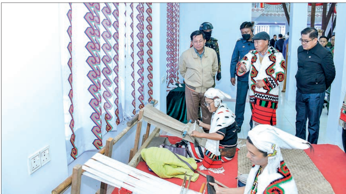
The Senior General views round the Rawang Cultural Museum in Machanbaw Township yesterday.