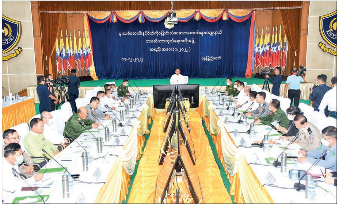
The meeting 1/2022 of the Central Committee on Drug Abuse Control is underway in Nay Pyi Taw yesterday.

Then, Secretary of CCDAC Deputy Minister for Home Affairs Chief of Myanmar Police