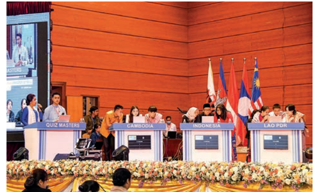
Competition of Cambodia, Indonesia and Laos.