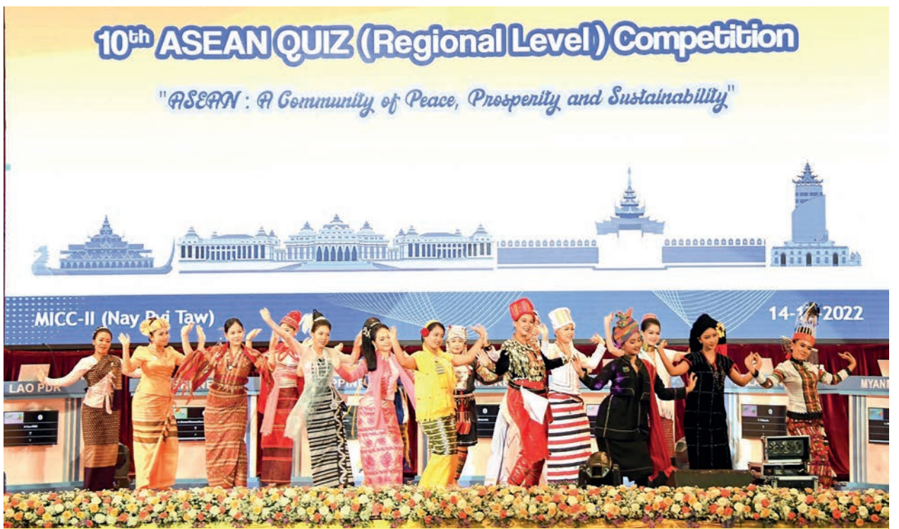
Entertainment of ethnic damsels at the event.