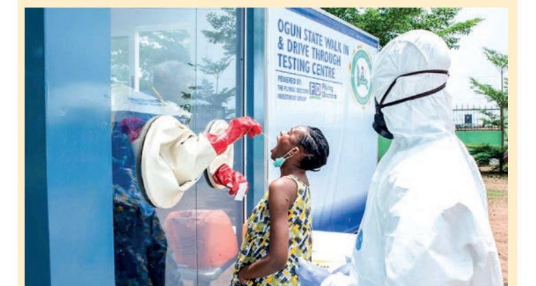
The Africa CDC said the conference comes at a critical time when many African countries continue to feel the impacts of the COVID-19 pandemic.

"It is time that countries should collectively invest in stronger health system governance, including multi-sectoral