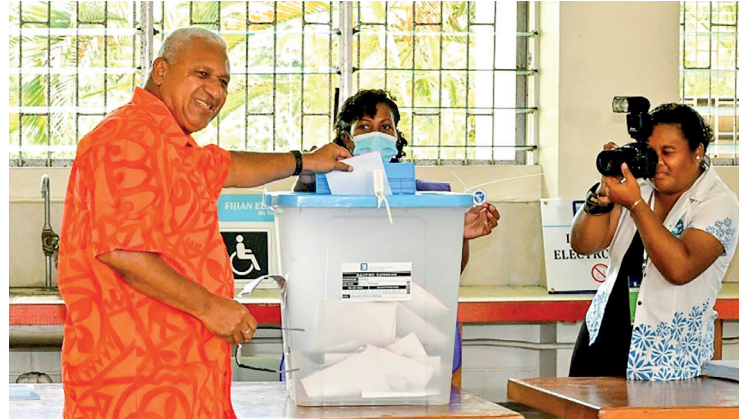
Fiji's Prime Minister Frank Bainimarama vowed to respect the outcome of the election that could end his 16 years in power and return a rival ex-coup leader to office.

Rabuka — who is also a former Fijian international rugby player and Commonwealth Games hammer thrower —