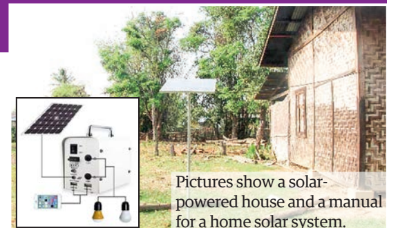
Pictures show a solar-powered house and a manual for a home solar system.

“Home solar systems have been widely used