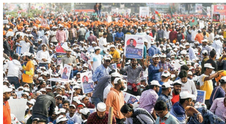
Supporters of the opposition Bangladesh Nationalist Party a huge rally in Dhaka on 10 Dec to press for a snap poll.

A spokesman for Jamaat — the country's third-largest political party, which has been banned from contesting elections since 2012 — condemned the 64-year-old's arrest, saying it was intend-