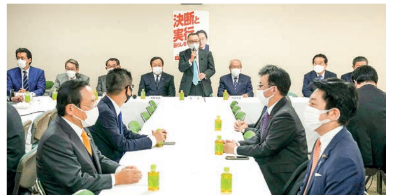
Members of the Liberal Democratic Party's tax commission meet at the party headquarters in Tokyo on 14 Dec 2022.

Senior members of the ruling party's tax panel affirmed at an unofficial meeting that revenues from the special tax for reconstruction as well as corporate and tobacco taxes will be used on