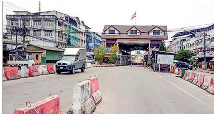
The photo shows the Myawady-Mae Sot Friendship Bridge I.

THE news that the Myawady-Mae Sot Friendship Bridge I on the Thailand-Myanmar border will be reopened before the end of this year is circulating, according to border-based traders.