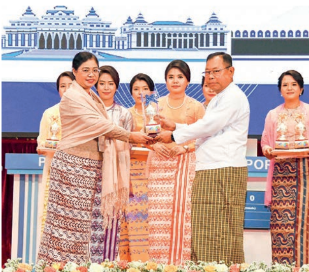
Gifts are presented to three judges (left to right).