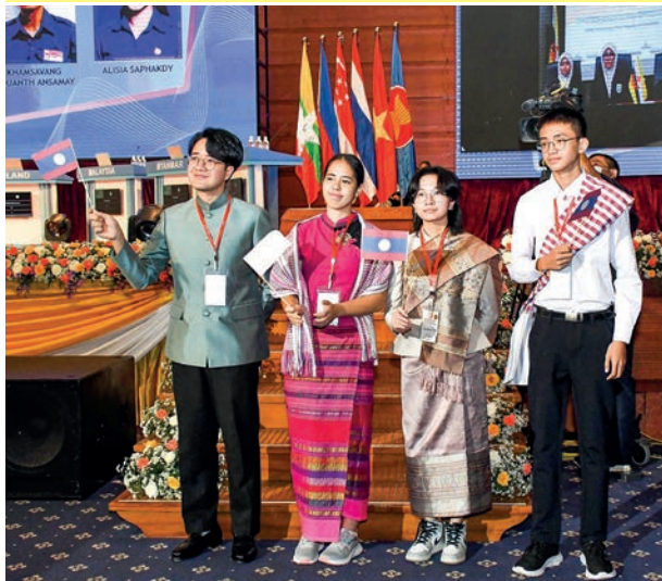
Contestants from Laos.