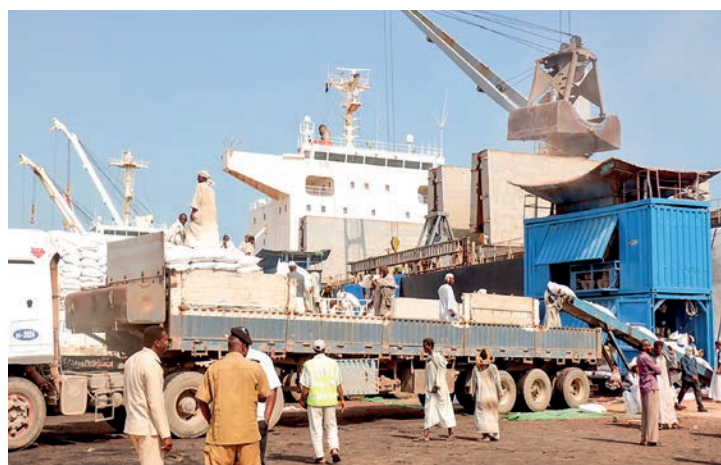
Sacks of corn are loaded onto trucks in the Sudanese Red Sea city of Port Sudan on November 20, 2022. A new deal has been signed to build a vast new port.

da has faced backlash over the plan, with his economic security minister raising questions about the timing and business leaders pushing back against tax hikes that would target the corporate sector.—Kyodo