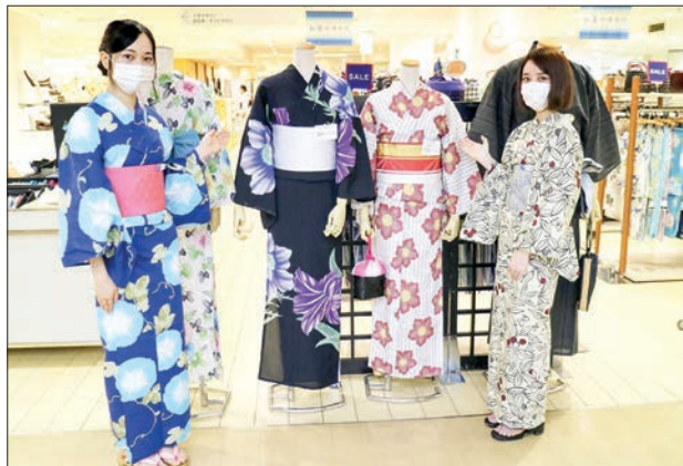
Yukata casual kimono are sold at Matsuya Ginza department store in Tokyo on 21 July 2020.

The BoJ's quarterly Tankan survey — considered the broadest indicator of how Japanese businesses are faring — showed that major manufacturers still feel much more upbeat