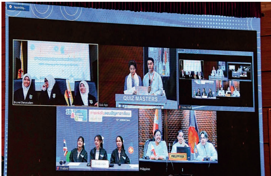
The screengrab of the competition.