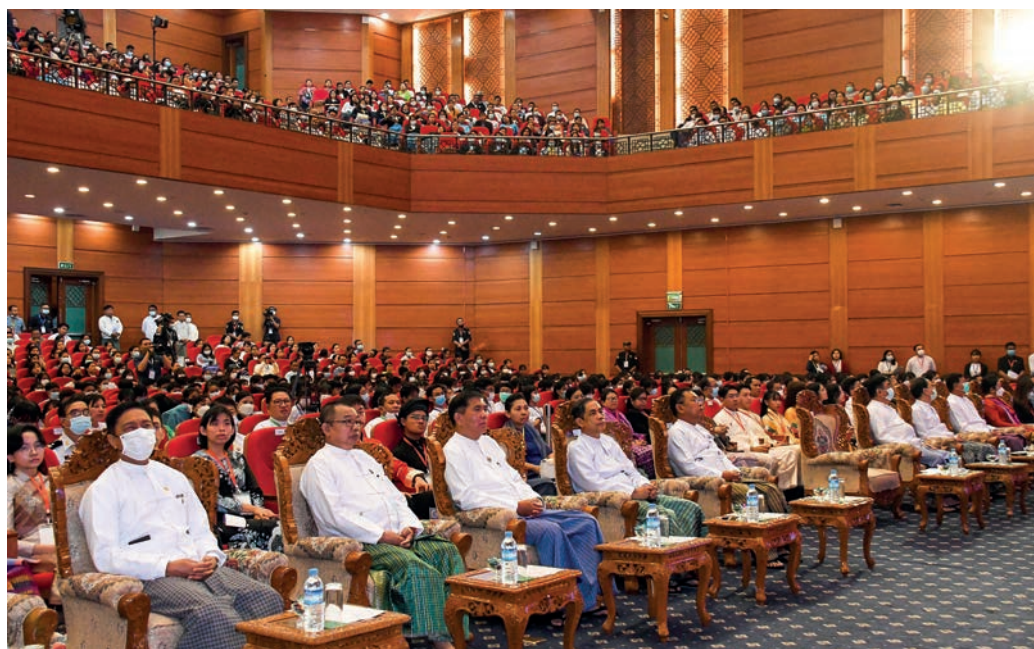
Union Minister U Maung Maung Ohn speaks on the launching occasion yesterday in Nay Pyi Taw.

Then, Daw Khin Swe Win, wife of Union Minister U Maung Maung Ohn, drew lots for Myanmar traditional food to give to the participants as presents. — MNA/KTZH