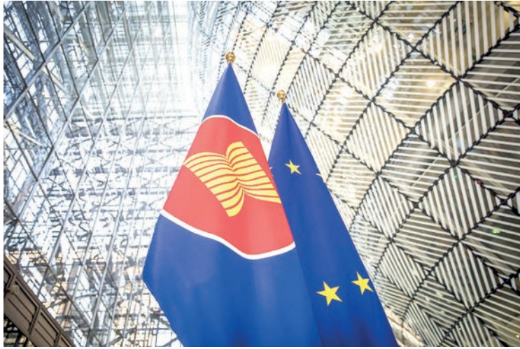
Europe is keen to boost trade with the Association of Southeast Asian Nations (ASEAN), which counts some of the world's fastest-growing economies.

EU leaders meet their counterparts from Southeast Asia for a summit in Brussels on Wednesday, looking to bolster ties in the face of the war in Ukraine and challenges from China.