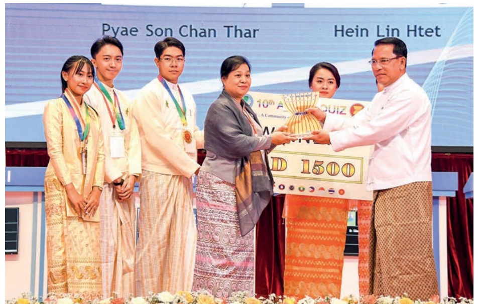
Union Minister U Maung Maung Ohn gives the first prize to Myanmar.