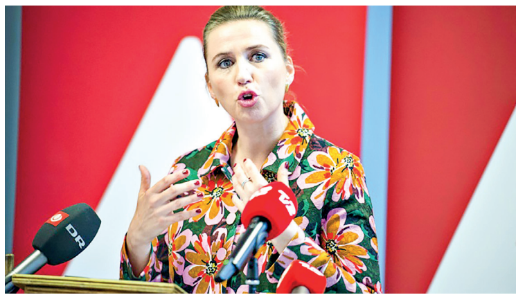
The left-wing Frederiksen told reporters that the political alliance was "what our country needs", following a narrow election victory for her Social Democrats in legislative elections on 1 November.