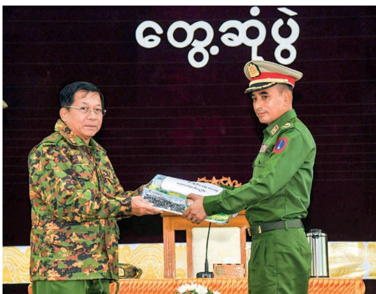
The Senior General presents foodstuffs for Tatmadaw members and families.

Later, the Senior General and party cordially greeted Tatmadaw members and families. — MNA