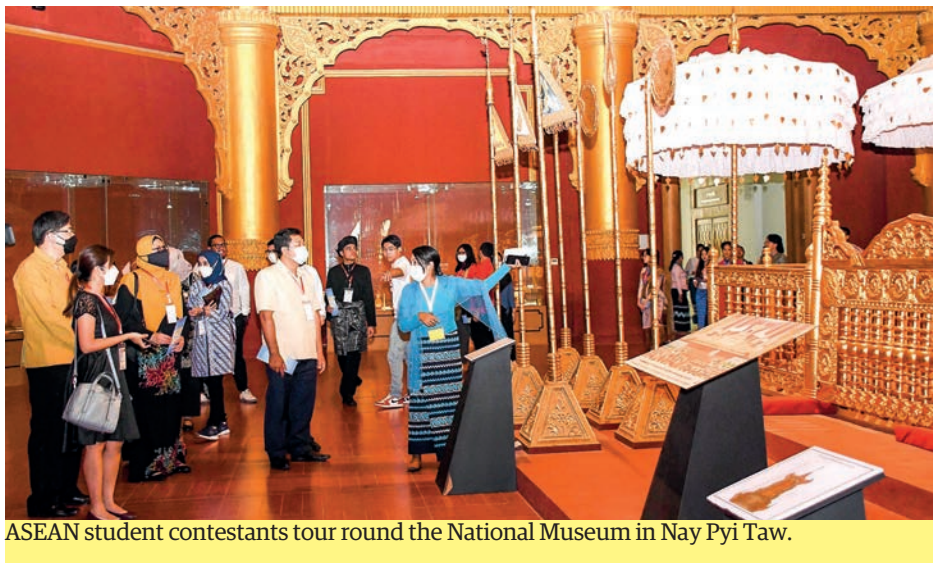
ASEAN student contestants tour round the National Museum in Nay Pyi Taw.