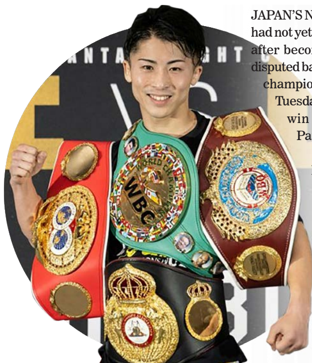
Japan's Naoya Inoue became the first undisputed bantamweight world champion in half a century on Tuesday after beating Paul Butler.

JAPAN'S Naoya Inoue said he had not yet reached his "goal" after becoming the first undisputed bantamweight world champion in half a century Tuesday with a knock-out win over England's Paul Butler.