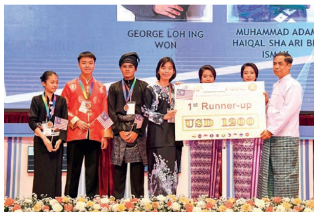
The second prize to Malaysia.