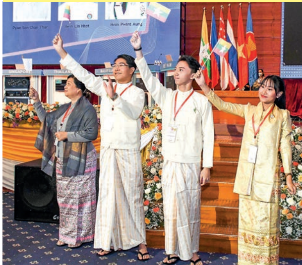
Contestants from Myanmar.