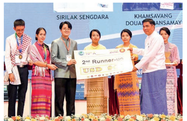
The third prize to Laos.