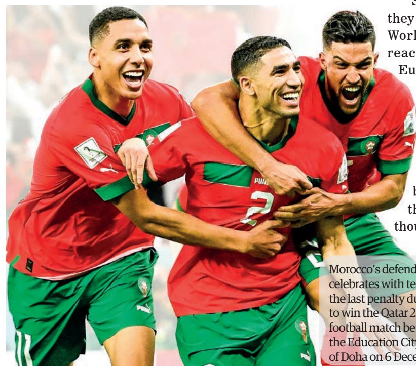
Morocco's defender #02 Achraf Hakimi (C) celebrates with teammates after converting the last penalty during the penalty shoot-out to win the Qatar 2022 World Cup round of 16 football match between Morocco and Spain at the Education City Stadium in Al-Rayyan, west of Doha on 6 December 2022. PHOTO: AFP

The teams were closely matched through a nail-biting clash, with Spain having more of the ball but Morocco creating the better openings, few though they were. —AFP