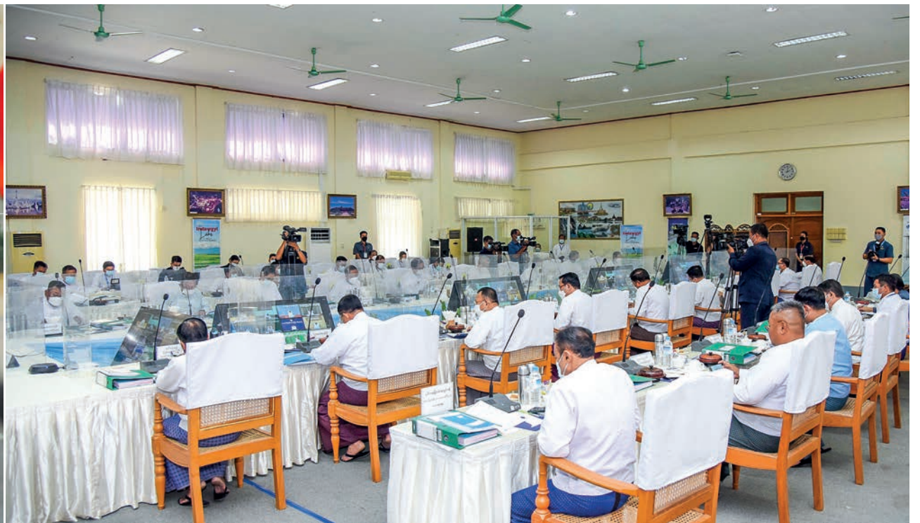
State Administration Council Vice-Chair Deputy Prime Minister Vice-Senior General Soe Win chairs the meeting 2/2022 of the National Tourism Development Central Committee in Nay Pyi Taw yesterday.

S IGNIFICANT tourism products and services must be promoted through the digital platform, said Chairman of the National Tourism Development Central Committee Vice-Chairman of the State Administration Council Deputy Prime Minister Vice-Senior General Soe Win at the meeting 2/2022 of the central committee at the Jade Hall of the Ministry of Hotels and Tourism in Nay Pyi Taw yesterday afternoon.