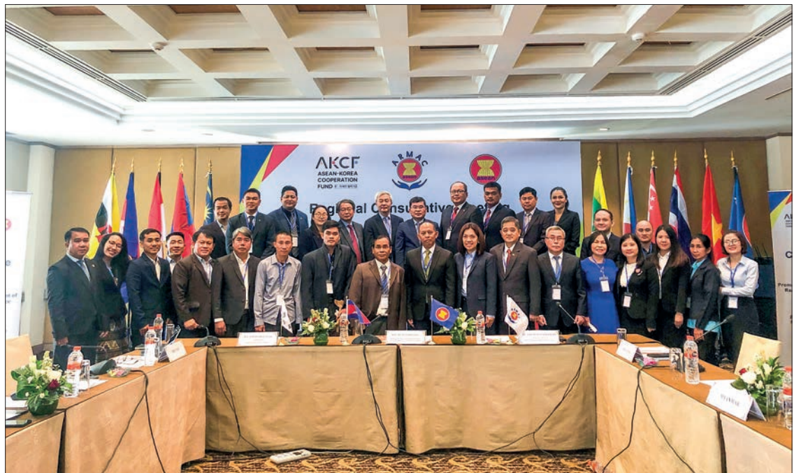
The documentary group photo of the Regional Consultative Meeting on Promoting the Establishment of Regional Victim Assistance Network in Bali, Indonesia, on 5 December.