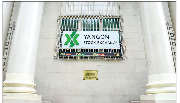
The YSX, a Myanmar bourse, was launched four years ago to improve the private business sector.

Moreover, the YSX stock investment virtual series 2022 launched in December through the YSX YouTube channel and other social media platforms every weekend of December 2022, including three sessions; Insights talk with listed companies, Investment presentations