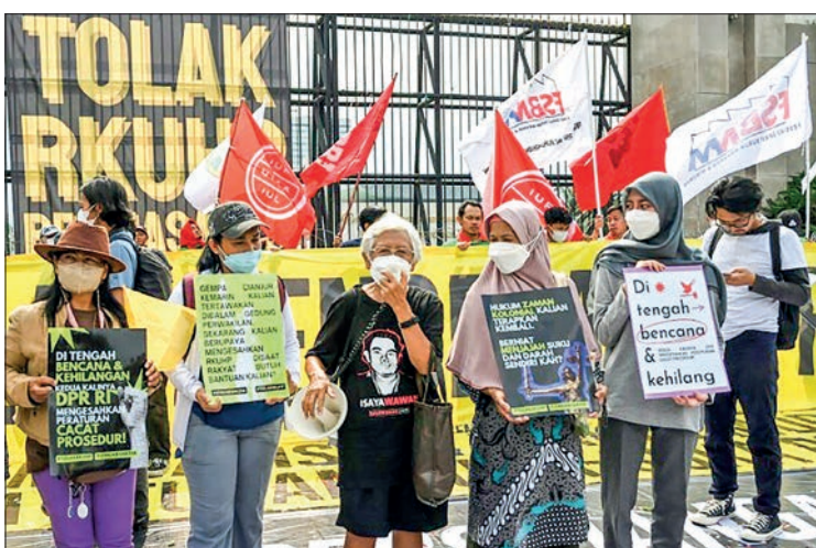
Rights groups have protested against Indonesia's move to outlaw pre-marital sex. PHOTO: AFP

In swift and brutal reprisal, the new Irish government executed four anti-treaty prisoners by firing squad without charge or justification.—AFP