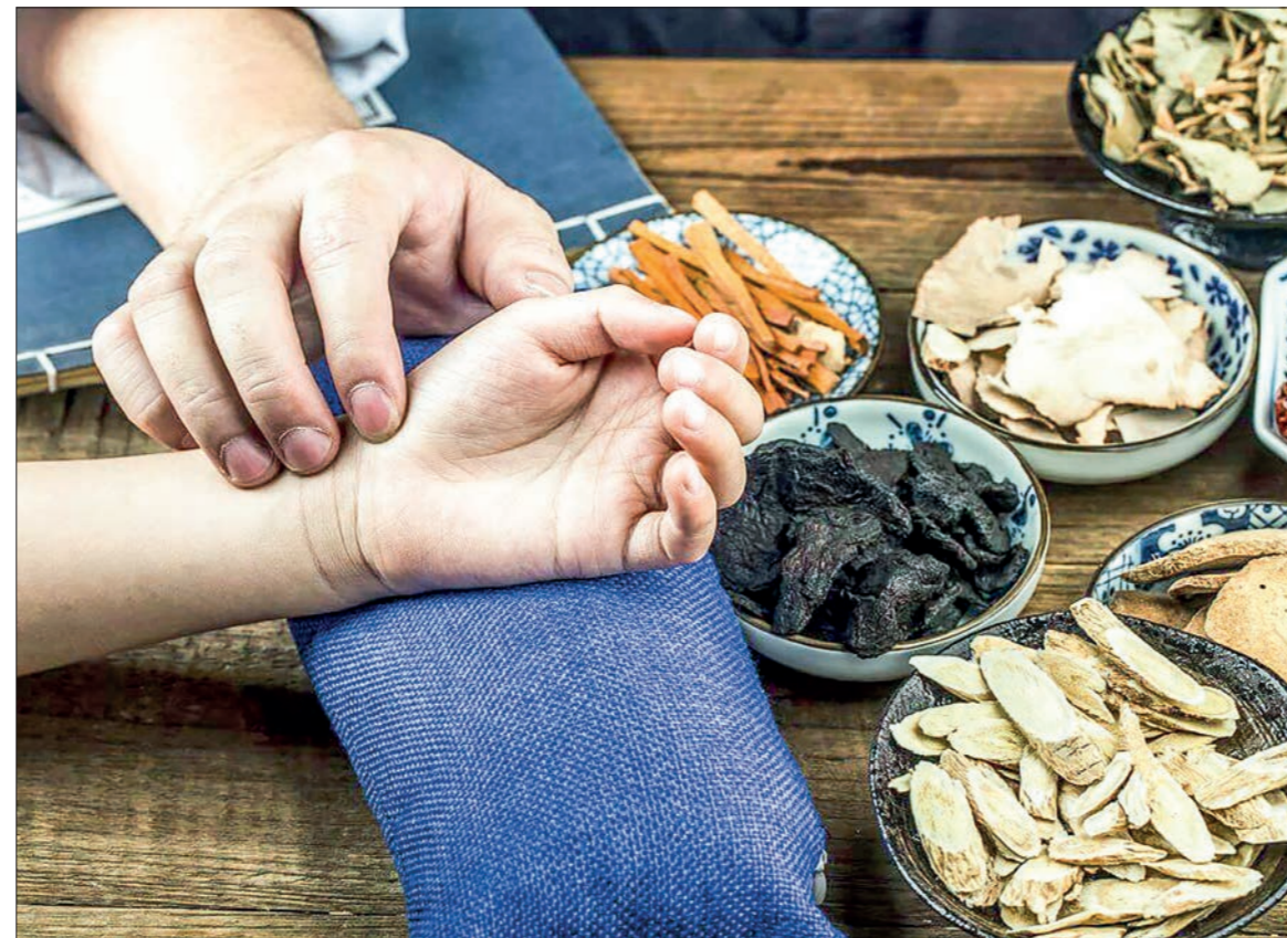
Myanmar traditional medicine is a broad, deep and delicate branch of science covering various basic medical knowledge, different treatises, a diverse array of therapies and potent medicines. ILLUSTRATION: FOR REPRESENTATIONAL PURPOSE ONLY/FREEPIK

The provision of traditional medicine services is at the basic health services level with the objective of making essential traditional medicine easily accessible for the benefit of both urban and