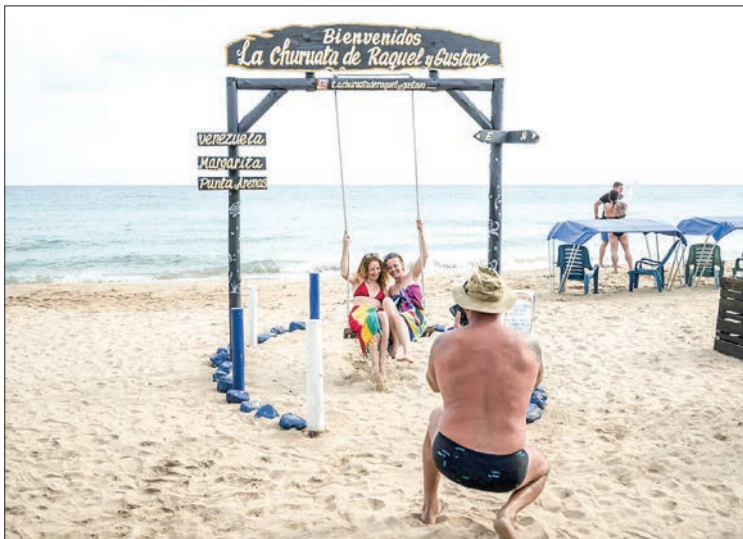
Russian tourists pose for photos at Punta Arenas beach in Venezuela during a guided tour of Isla Margarita.

SHUTTLED between tourist spots, posing for pictures on beautiful beaches, and dancing awkwardly to merengue: Russian tourists have found a friendly holiday destination on a Venezuelan island far from