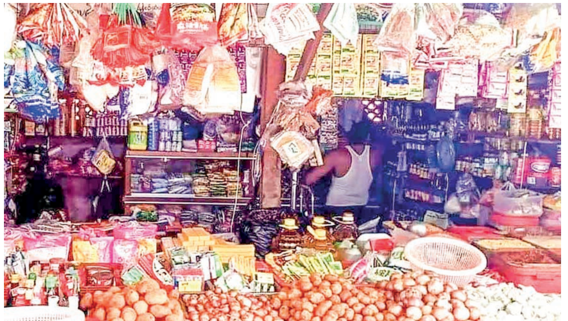
Foodstuffs are seen at one dry grocery.

Consequently, the wholesale prices of palm oil slid to K5,350 per viss on 6 December. There is