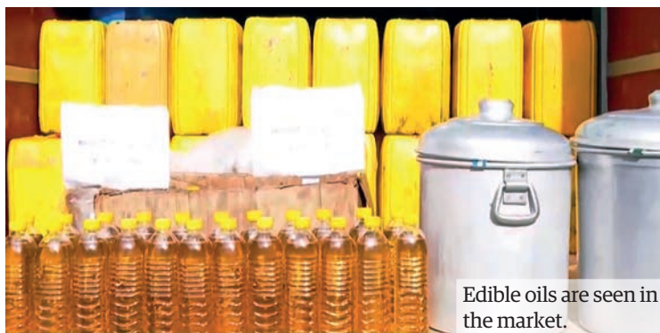
Edible oils are seen in the market.

THE Delivery Order (DO) price of palm oil stood at K5,350-K5,400 per viss (a viss equals 1.6 kilograms) at oil tanks in the Yangon market and the market retail price touched only K5,400-K5,430 per viss on 6 December 2022, according to the Bayintnaung oil market.