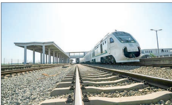
The Kaduna train attack was one of several major incidents this year.

The hostages were released in batches following negotiations with their captors who were believed to have collected huge ransoms from their families. An AFP reporter at the railway station in Abuja on Monday said the train departed the nation's capital at around 10:00 am (0900 GMT) for the two-hour journey to Kaduna.—AFP