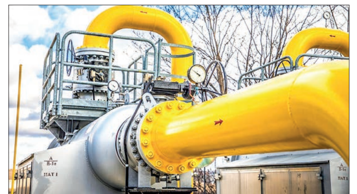
Moldova has seen its Russian gas deliveries slashed and its regular electricity imports dry up.

Russian energy giant Gazprom has slashed its gas supplies to Moldova, while the country can no longer rely on Ukraine for electricity imports after repeated Russian air strikes on Ukrainian power infrastructure.—AFP