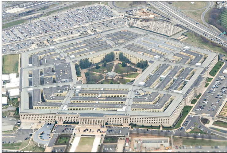
Photo taken on 19 Feb 2020 shows the Pentagon seen from an airplane over Washington DC, the United States.

see stronger action from the US government to limit arms industry mergers and acquisitions in the next few years," Nan Tian,