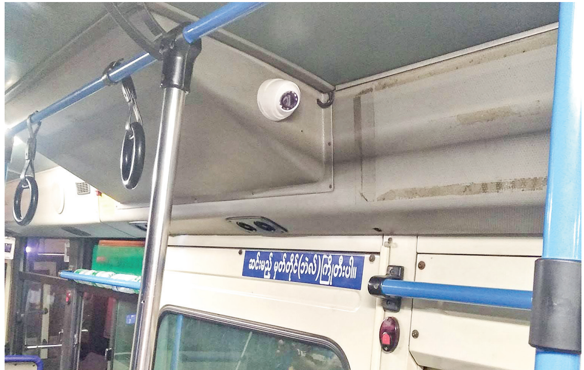
Photos show the YBS bus No 65.

be notified through the YBO control centre, and it will be a system that can be quickly controlled.