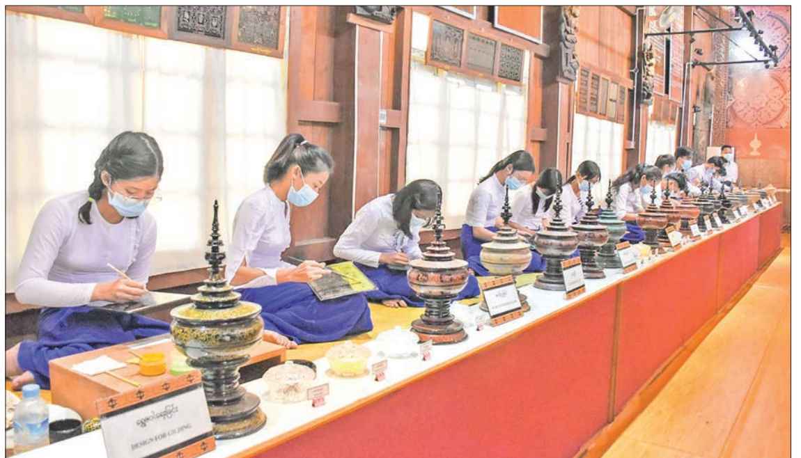
Their skill demonstration of students is pictured at Bagan Lacquerware College.

The Lacquerware Vocational School was first established in 1924. Then, it was upgraded to an institute and a college in 1995 and 2003 respectively. — Maung Aye Chan/CT