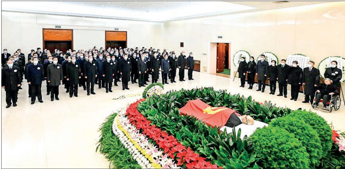
Xi Jinping, Li Keqiang, Li Zhanshu, Wang Yang, Li Qiang, Zhao Leji, Wang Huning, Han Zheng, Cai Qi, Ding Xuexiang, Li Xi, Wang Qishan, Hu Jintao, and others pay their final respects to Comrade Jiang Zemin at the Chinese PLA General Hospital in Beijing, capital of China, Dec. 5, 2022.

THE remains of Jiang Zemin, who passed away last Wednesday, were cremated at the Babaoshan Revolutionary Cemetery in western Beijing on Monday.