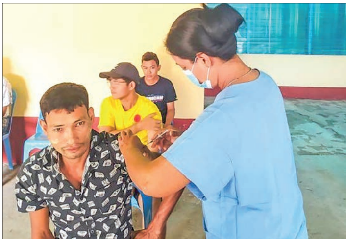
A local from Hinthada Township in Ayeyawady Region gets jabbed against COVID-19 on 6 December 2022.

In addition, to assist in the control and prevention of the COVID-19 disease, military officials from various regional commands in collaboration with district and township administrative officials, departmental personnel and members of civil society organizations (CSOs) conducted educational campaigns such as prevention of COVID-19, wearing of masks in public places and distribution of masks to the locals at schools, markets, streets, city entry points and crowded areas in 44 townships in Yangon Region yesterday.—MNA