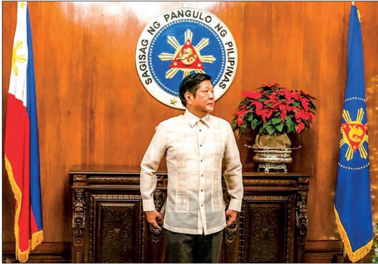
It would help the Marcos administration achieve its goals of getting the Philippine economy to “soar to greater heights in spite of external shocks”, the authors wrote.

PHILIPPINE lawmakers have proposed a $4.9 billion sovereign wealth fund to be chaired by President Ferdinand Marcos Jr to boost growth, but critics warn it will be prone to graft and risk Filipino pensions.