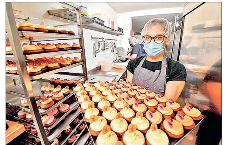
According to a business survey carried out by the EK, the prospects for the country’s SMEs in 2023 are in many respects almost as gloomy as they were at the end of 2020, the first year of the COVID-19 pandemic.