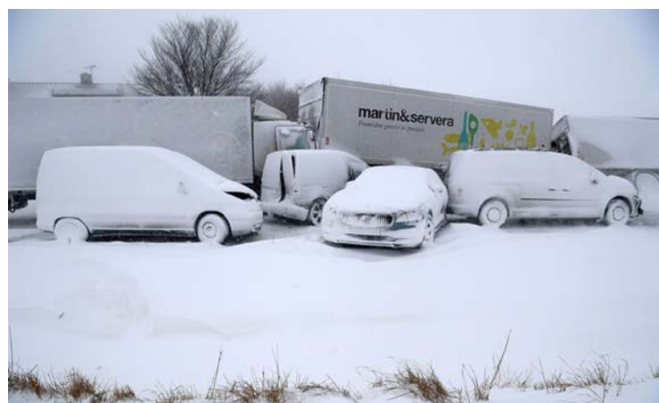
A large part of Sweden was paralyzed on 21 Nov following heavy snowfall over the weekend.