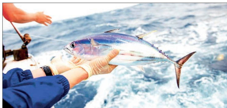
Skipjack catches in the entire western and central Pacific doubled over roughly 20 years, with about 1.75 million tonnes caught in 2021, according to the agency.

The decision by the Western and Central Pacific Fisheries Commission at its recent annual gathering came in line with Japan’s call for stronger stock management, given that their catches have been on a declining trend in nearby waters.