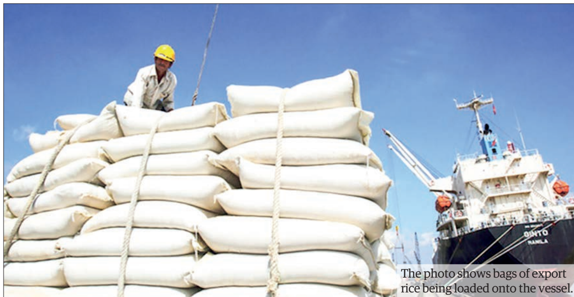
The photo shows bags of export rice being loaded onto the vessel.

MYANMAR shipped over 1.4 million metric tons of rice and broken rice to foreign trade partners in the past eight months (April-October) of the current financial year 2022-2023, with an estimated income of US$510 million, according to Myanmar Rice Federation (MRF).