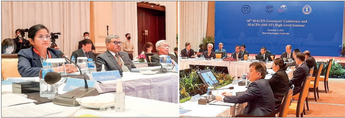
Central Bank of Myanmar Governor Daw Than Than Swe takes part in the 58 th SEACEN Governor's Conference/ High-Level Seminar and the 42 nd SEACEN BOG Meeting on 5 December in Cambodia.

GOVERNOR of the Central Bank of Myanmar Daw Than Than Swe attended the 58 th SEACEN Governors' Conference/High-Level Seminar and 42 nd SEACEN Board of Governors-BOG Meeting jointly organized by The South East Asian