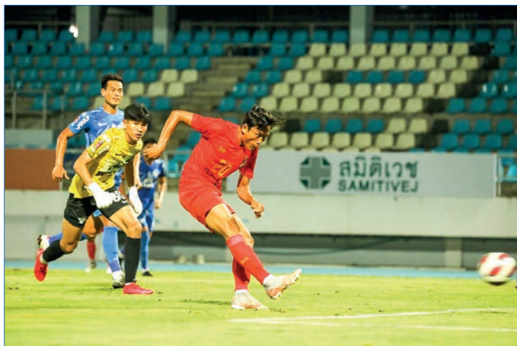
A Myanmar team player (red) poises to kick the ball during the friendly match against Thai Club Chonburi on 29 November 2022.

THE Myanmar national team, which is training in Thailand in preparation for the 2022 AFF Cup, will play two more friendly matches, according to the Myanmar football authorities.