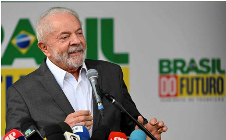
Lula had surgery on November 20 to remove the lesion in his left vocal cord after a months-long presidential campaign in which his hoarse voice had generated concern.

"Lula da Silva was today in the morning at the Sirio Libanes hospital for a previously scheduled laryngoscopy," said