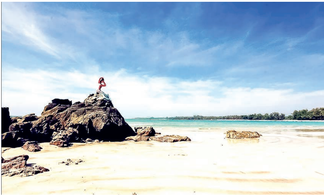
The photo shows Ngapali beach where tourists like to go.