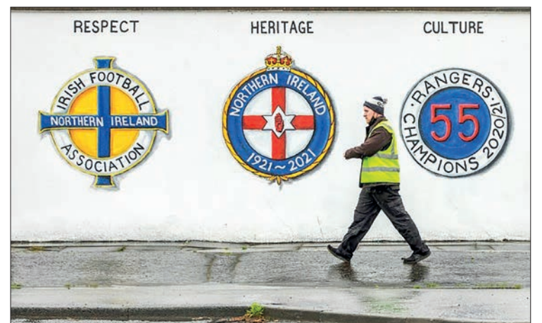
Northern Ireland, part of the United Kingdom, was created as a pro-British, Protestant majority enclave in 1921.

Not least among the accommodations made to the imperial power was provision for the continued partition of six, majority Protestant counties in the UK-ruled jurisdiction of Northern