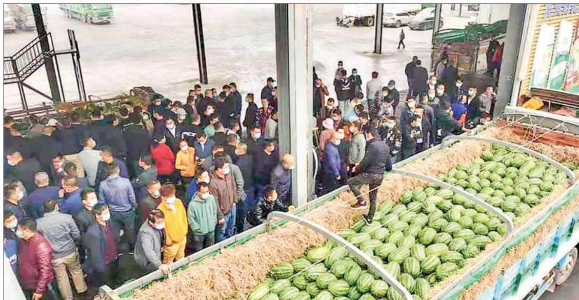
The prevailing prices per kilogramme stood at 1-1.8 Yuan for watermelon 855 variety, 2.2 Yuan for Taiwan watermelon, 2.2 Yuan for seedless watermelon and 2.5-3.5 Yuan for muskmelon.

On 1 April, Nantaw and Sinphyu border posts were suspended in the wake of COVID-19 impacts. China has closed down the major border crossing Mang Wein from 30 March 2021