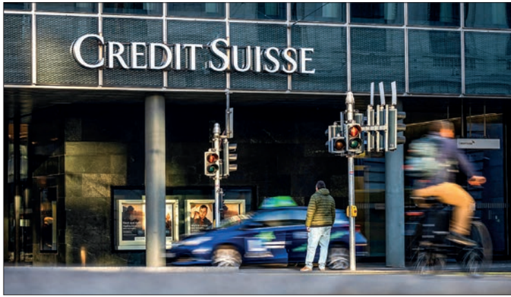
A picture taken on 25 October 2022 shows a sign of Switzerland's second-biggest bank Credit Suisse on a branch in Basel.

SAUDI Crown Prince Mohammed bin Salman is considering investing around $500 million in a new Credit Suisse investment bank spin-off, CS First Boston, according to The Wall Street Journal.