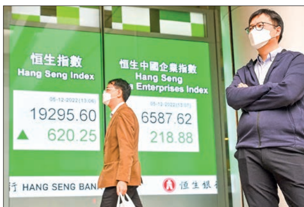
Pedestrians pass an electronic board showing the numbers for the Hang Seng Index in Hong Kong on 5 December 2022.

world's number-two economy kicking back into gear helped traders overcome data on Friday showing far more jobs than expected were created in the United States in November.