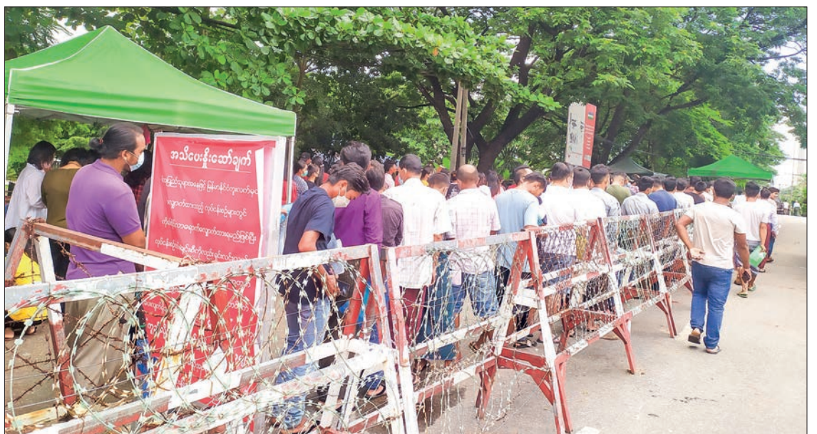
Applicants are seen lining up to get their passport at the Myanmar Passport Office.

booking system on 21 March 2022 and, according to the new system, the applicants must make an online appointment on www.passport.gov.mm by entering details such as the applicant's name, father's name, date of birth and gender and, only after they have received the QR code, they can come to