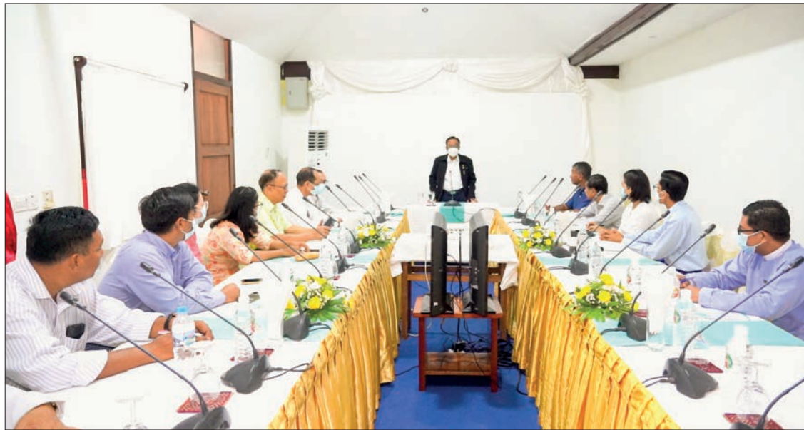
MoHT and MIFER Union Ministers Dr Htay Aung and Dr Kan Zaw receive the Russian delegation at Nay Pyi Taw International Airport on 3 December.

In the afternoon, the Union ministers conducted the Minister of Economic Development of Russia and party round the hotel rooms and services of the Amazing Ngapali Resort, the Bayview Beach Resort and the Sandoway Resort, it is learnt. — MNA