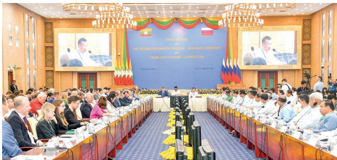
The third Russia-Myanmar intergovernmental trade and economic cooperation commission meeting is in progress in Nay Pyi Taw yesterday.

Afterwards, the contract signing ceremony continued, and seven contracts were signed by relevant officials from Myanmar