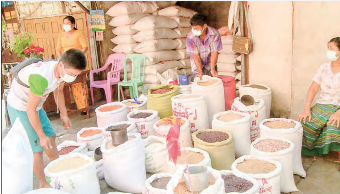
Sample of beans and pulses are displayed at a warehouse.

MYANMAR pocketed over US$826 million from the export of more than a million tonnes of various pulses in the past eight months of the current financial year 2022-2023, the Ministry of Commerce's statistics indicated.