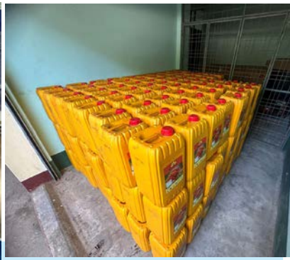
Seized illegal goods in Kayin State.

AN on-duty team under the supervision of the Kayin State Illegal Trade Eradication Task Force conducted surprise inspections on 3 December.