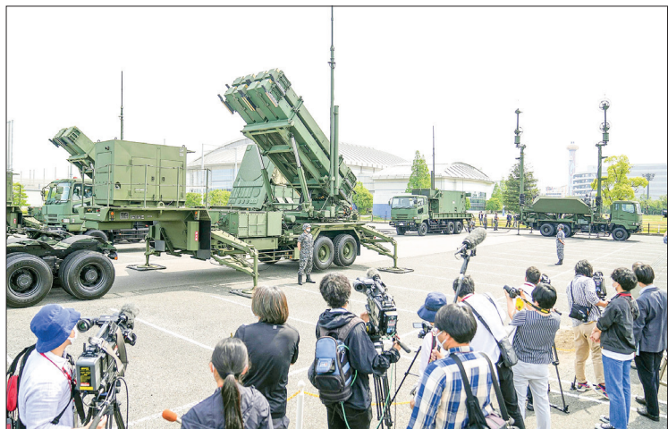
The Japan Air Self-Defence Force conducts a drill to deploy Patriot Advanced Capability-3 surface-to-air missile interceptors on an artificial island in Osaka, western Japan, on 19 May 2022, in the wake of North Korea's repeated missile launches.

JAPAN plans to put off for now a tax hike intended to finance a planned increase in the coun-