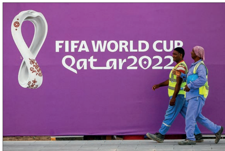
Workers walk past a FIFA World Cup sign in Doha on 16 November 2022, ahead of the Qatar 2022 World Cup football tournament.