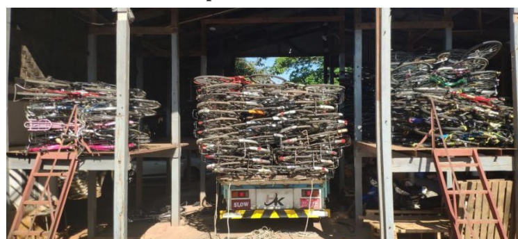
Confiscated illegal commodities in Mon State.

Therefore, 15 arrests (at an estimated value of K152,307,404) were made on three consecutive days from 3 to 5 December, according to the Illegal Trade Eradication Steering Committee. — MNA