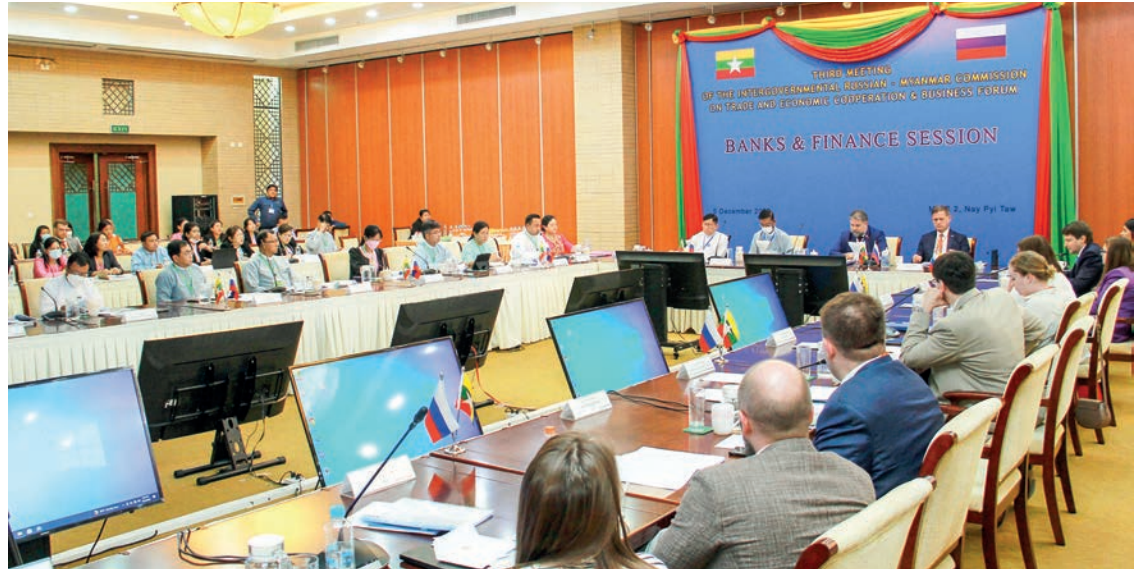
The third meeting of the Russia-Myanmar intergovernmental trade and economic cooperation commission and related meetings are in progress in Nay Pyi Taw yesterday.