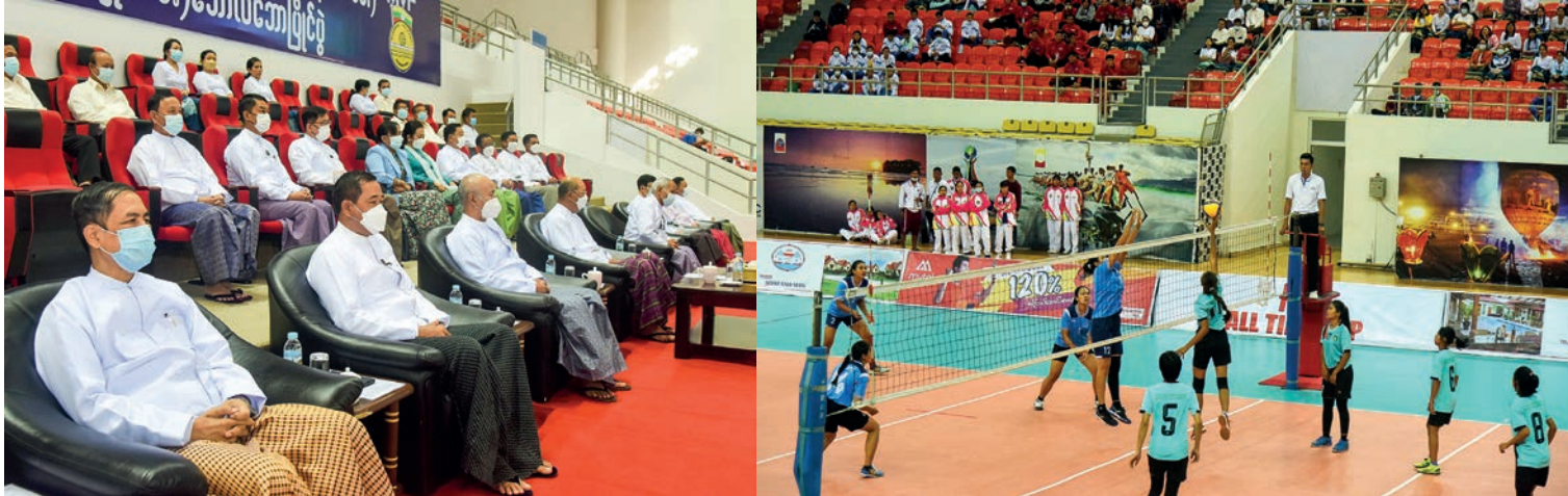
SAC members, Union ministers and dignitaries watch the opening match of the SAC Chairman's Trophy Inter-State/Region Volleyball Tournament in Nay Pyi Taw yesterday.

IN commemoration of the 2023 Diamond Jubilee Independence Day, the opening ceremony of the State Administration Council Chairman's Trophy Inter-State/Region Invitational Volleyball Tournament was held yesterday morning at the Wunna Theikdi Gymnasium B in Nay Pyi Taw.