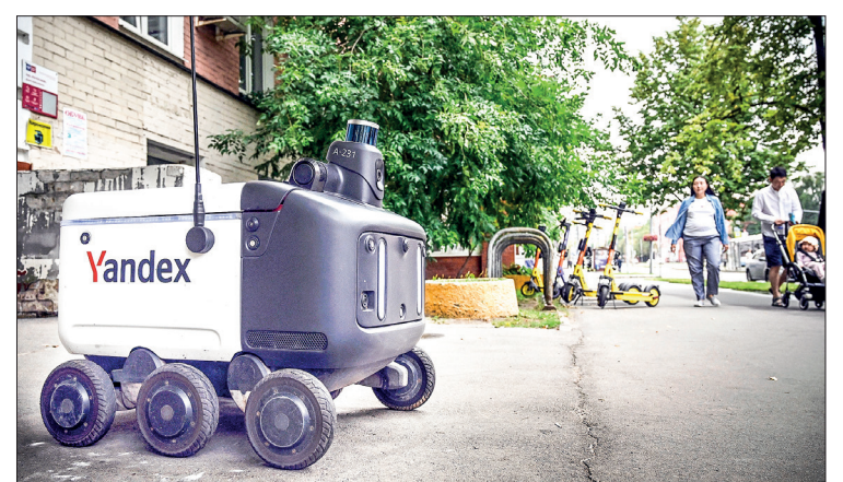
People walk past food delivery robot by Russian IT giant Yandex in Moscow on 11 August 2022.

Last week Kudrin announced he was stepping down as head of Russia's Audit Chamber to focus on private initia-