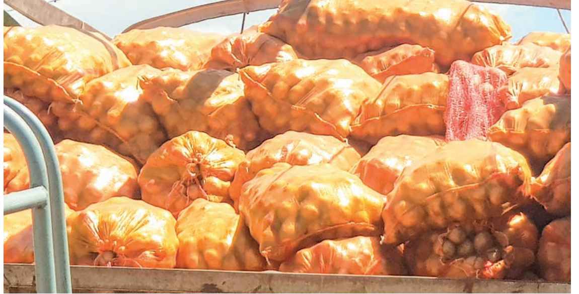
Chinese potatoes are seen flooding the market.

On 16 September, Shan potatoes were worth K1,500-K2,300 per viss whereas Chinese pota-