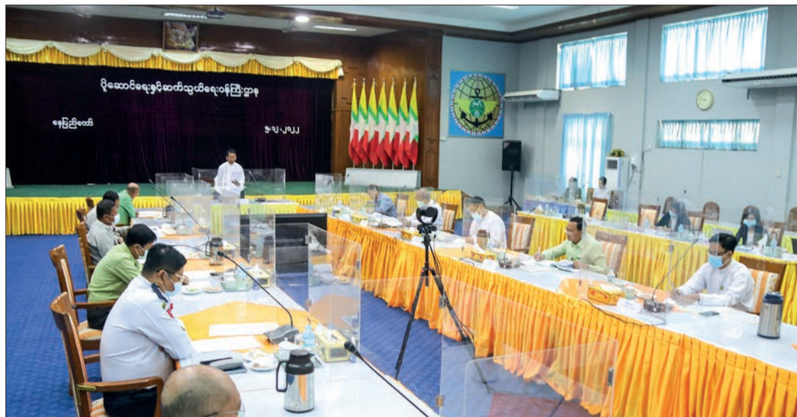
The work coordination meeting on unification of road markings, signs and signals is underway in Nay Pyi Taw yesterday.

The central supervisory board members, Union Territory (Nay Pyi Taw), and region/state supervisory board chairpersons participated in the discussions. — MNA