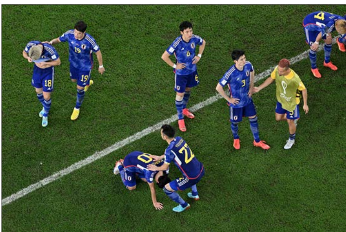
Japan's players react after they lost the penalty shoot-outs in the Qatar 2022 World Cup round of 16 football match between Japan and Croatia at the Al-Janoub Stadium in Al-Wakrah, south of Doha on 5 December 2022.

CROATIA reached the quarter-finals of the World Cup on Monday with a dramatic 3-1 penalty shoot-out win over Japan after a tense last-16 clash ended 1-1.