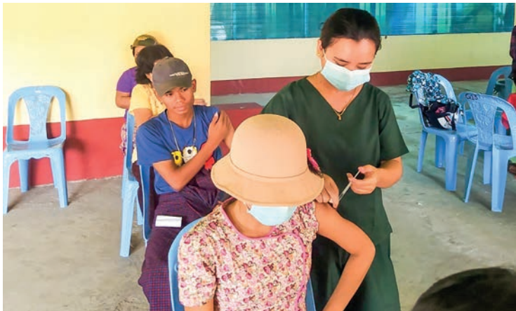
A local from Hinthada Township in Ayeyawady Region gets jabbed against COVID-19 on 5 December 2022.

tary personnel from various commands in collaboration with district and township administrative officials, departmental personnel and members of civil society organizations (CSOs) conducted educational campaigns such as prevention of COVID-19, wearing of masks in public places and distribution of masks to the locals at schools, markets, streets, city entry points and crowded areas in 44 townships, Yangon Region, and Pyapon Township, Ayeyawady Region yesterday. — MNA