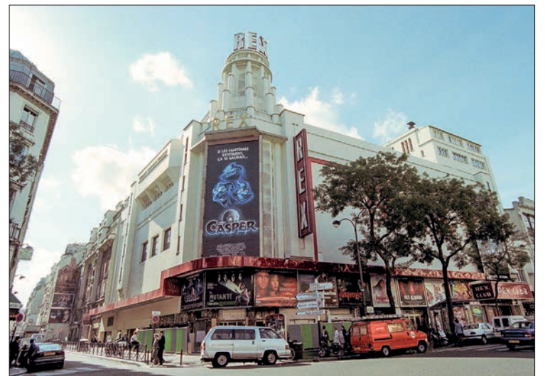
(FILES) This file photo taken on 5 October 1995 shows the cinema Le Grand Rex, in Paris. Paris remains the world capital of cinemas with 400 cinemas, including the Grand Rex cinema, which is the largest in the world and has been given a new life.

It also requires diversification. The Rex moonlights as a nightclub, escape game venue — and most importantly as a concert hall, featuring everyone from Madonna to Bob Dylan.