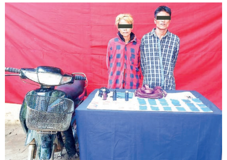
Two offenders are pictured along with seized drugs and a motorbike.

Those offenders are prosecuted under the Narcotic Drugs and Psychotropic Substances Law. — MNA