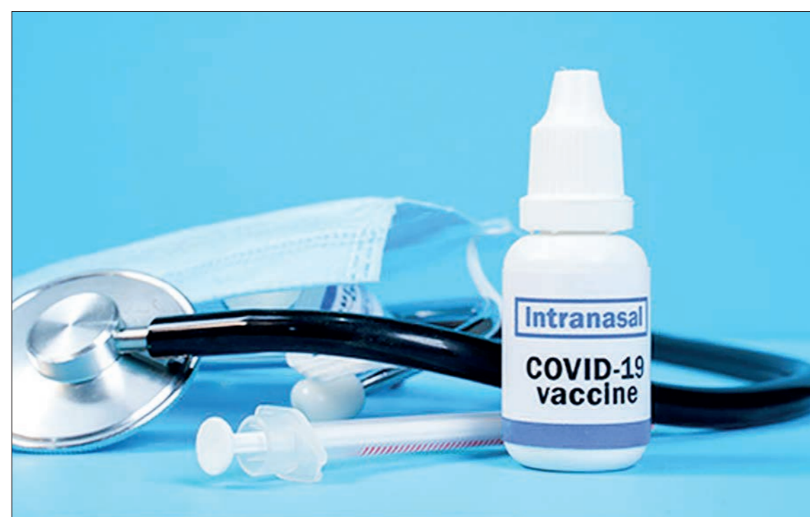
Bharat Biotech International Limited (BBIL) has received approval for its intranasal vaccine against Covid-19, iNCOVACC (BBV154).

Large manufacturing capabilities have been established by Bharat Biotech at multiple sites across India, including Gujarat,