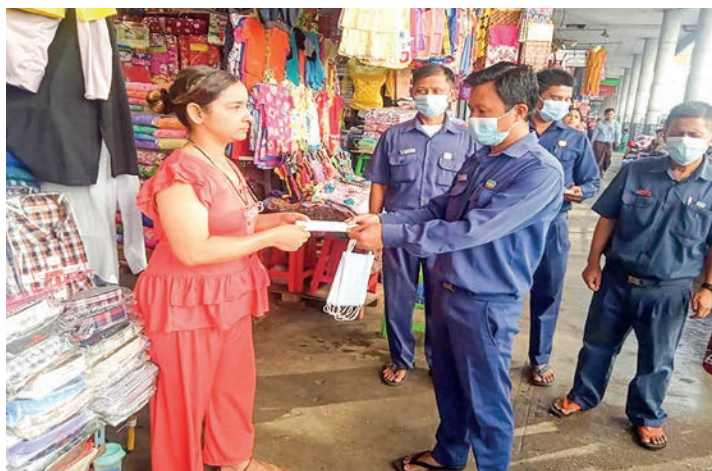
Governmental staff contribute masks to the public in Yangon on 5 December 2022.

the control and prevention of the COVID-19 disease, mili-