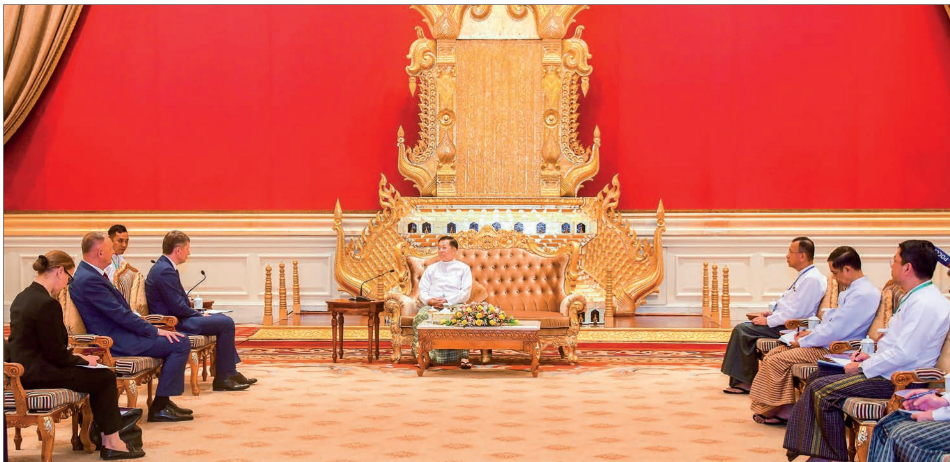
State Administration Council Chairman Prime Minister Senior General Min Aung Hlaing receives Mr Maxim Reshetnikov, Minister of Economic Development of the Russian Federation at the Credentials Hall of the SAC Chairman's Office in Nay Pyi Taw on 5 December 2022.

C HAIRMAN of the State Administration Council Prime Minister Senior General Min Aung Hlaing received Minister of Economic Development of the Russian Federation Mr Maxim Reshetnikov at the Credentials Hall of the Office of the SAC Chairman in Nay Pyi Taw yesterday afternoon.