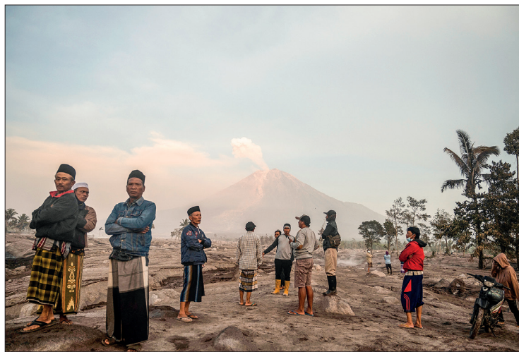
People stand before Mount Semeru following a volcanic eruption at Kajar Kuning village in Lumajang on 5 December 2022.

Some shepherded livestock while others carried appliances such as TVs and refrigerators