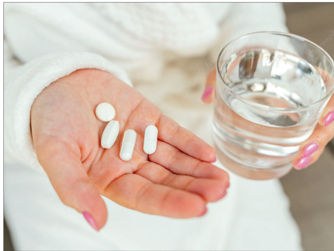
Medical problems often arise when the balance between beneficial and pathogenic microbes in a person's microbiome is thrown off, a condition known as dysbiosis.

All in all, all the arenas in society are formed with seniors and juniors. The seniors are responsible for handing over their invaluable experiences to the juniors. Such kinds of experiences may be bitter for the juniors but they have to adorably and delightedly embrace the bitter things to be applied in their lifespans for surviving themselves en route to their goals.