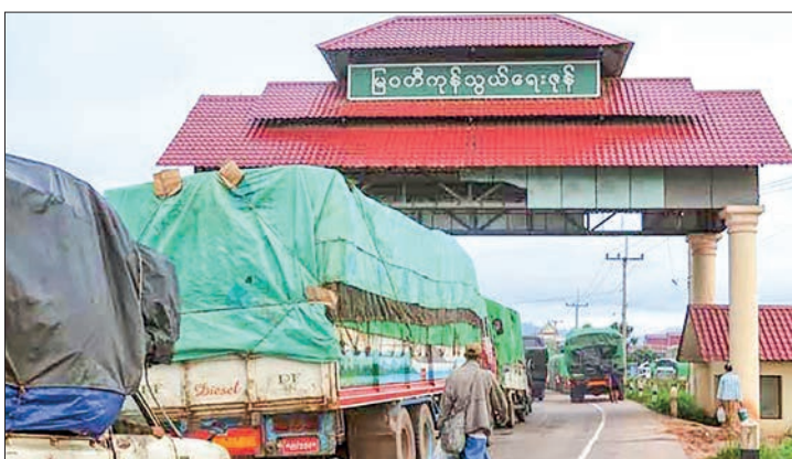
Trucks are seen entering the Myawady border trade zone.

Myanmar sent agricultural products (chilli pepper, onion, rice powder, turmeric, dried lily buds, coffee bean, green gram, rubber, cinnamon, macadamia nuts in shell, plum from Bago and peanuts), fishery products (anchovy, clam, hilsa, crab, shrimp and other fish) and finished industrial goods on a Cutting-Making and Packaging basis (men's sweaters, women's shirts and other clothes)