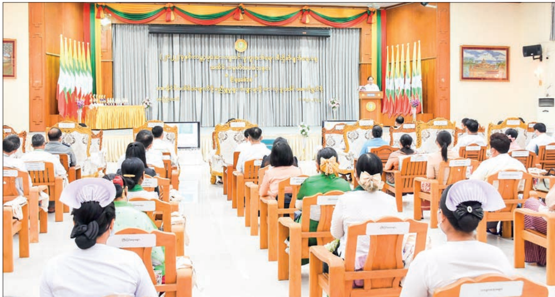
The 2022 World AIDS Day is held in Nay Pyi Taw on 1 December 2022.

UNION Minister for Health Dr Thet Khaing Win attended the 2022 World AIDS Day ceremony yesterday in Nay Pyi Taw.