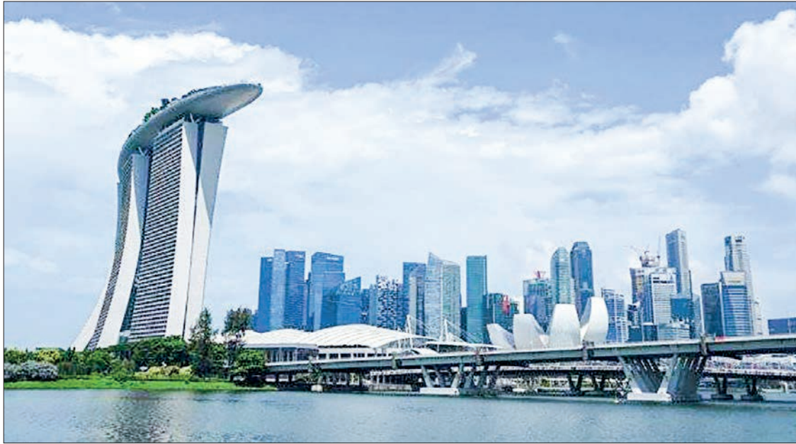
Singapore's placing at the top of the index was little surprise.

NEW YORK and Singapore are jointly the world's most expensive cities after inflation soared this year, an annual survey showed Thursday.