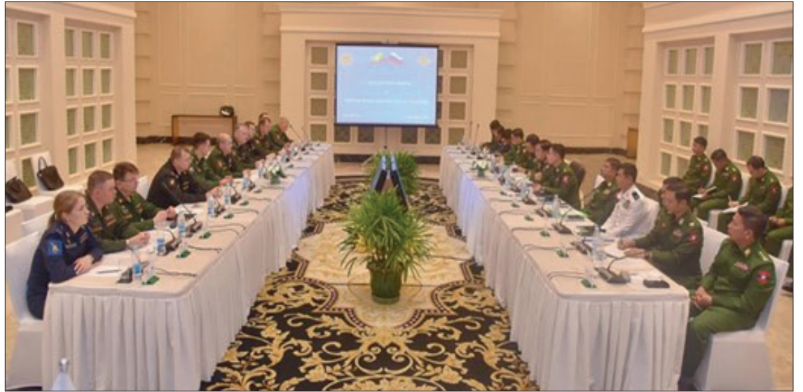
The first Myanmar-Russia Joint Anti-Terrorist Committee holds its second-day meeting in Nay Pyi Taw yesterday.

The meeting ended with concluding remarks of the