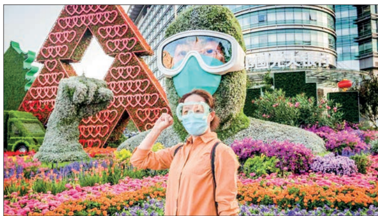
A woman poses in front of a flower display dedicated to frontline healthcare workers during the Covid-19 pandemic in Beijing.

THE devastation that COVID-19 has inflicted globally is truly historic and highlights the world's overall lack of public health preparedness for an outbreak of this magnitude, U.S. top infectious diseases expert Anthony S. Fauci wrote in a newly-published perspective. Although COVID-19 was "the loudest wake-up call in more than a century to our vulnerability to outbreaks of emerging infectious diseases," Fauci noted, one success of the response was the rapid development, testing and distribution of COVID-19 vaccines. The emergence of new infections and the reemergence of old ones are largely the result of human interactions with and encroachment on nature, Fauci wrote in the perspective published in the New England Journal of Medicine . As human societies expand in a progressively interconnected world and the human-animal