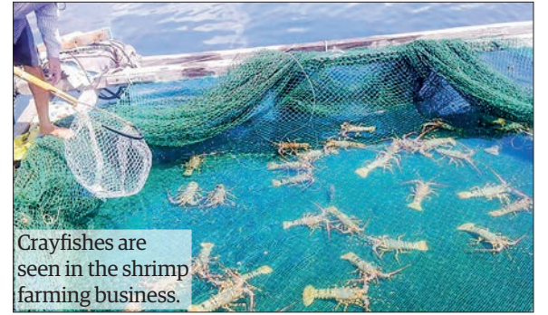
Crayfishes are seen in the shrimp farming business.

There are over 4,500 male workers and over 5,100 female workers in Japan. The Japanese government offers jobs for trained workers in construction, garment, agriculture, breeding, food processing, industries, and manufacturing and for workers skilled in 14 types of jobs such as caregiving, food industry and breeding sectors, according to the recruitment agencies. — TWA/GNLM