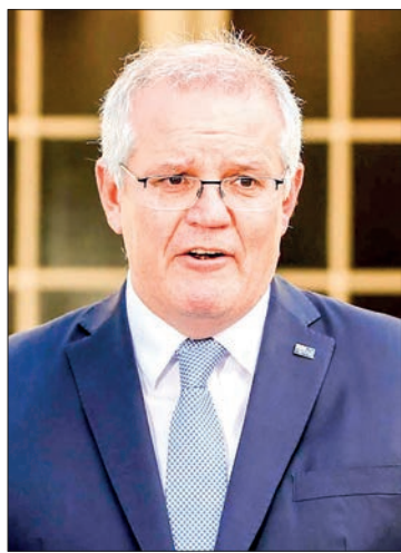
Former Australian Prime Minister Scott Morrison.