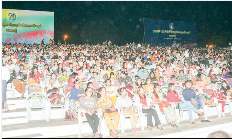
The public audience watch the Variety Show at the open-air theatre of the Nay Pyi Taw City Hall on 1 December 2022.

The Diamond Jubilee Independence Day Variety Show was the largest show to entertain the people who were under