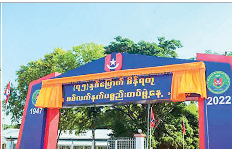
The Vice-Senior General presses the button to unveil the signboard to commemorate the 75 th Anniversary of Myanmar Military Ordnance Corps Day yesterday.