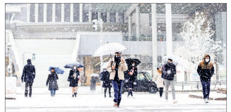
Japanese winters generally last from December to February. In Tokyo, December temperatures tend to be around 12°C (54°F) in the afternoon and drop to about 5°C (41°F) in the morning and at night.

AN electricity-saving period began in Japan on Thursday, with the government asking people to bundle up indoors and set the heating temperature low, among other steps, for the winter season through March due to power crunch concerns.