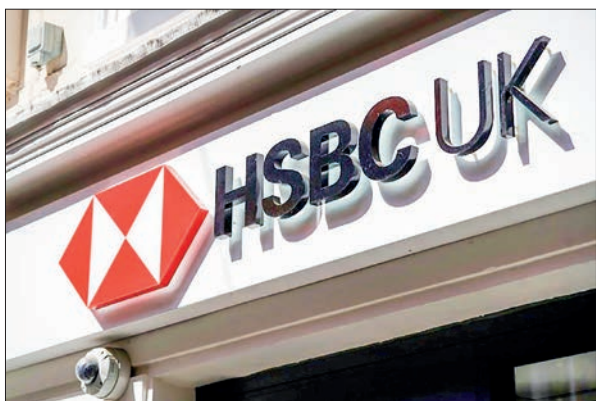
HSBC has announced the closure of more than a quarter of its remaining bank branches in the UK.

the way they bank and footfall in many branches is at an all-time low, with no signs of it returning," said the bank's managing