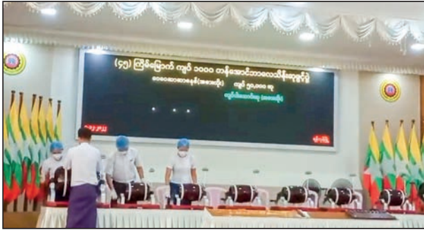
The opening of the 45 th Aung Bar Lay Lottery is in process.