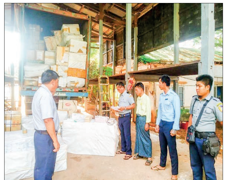
Officials check seized illegal commodities.

Similarly, a combined on-duty team under the management of the Kayin State Illegal Trade Eradication Task Force confiscated K2,568,000 worth of foodstuffs and consumer goods without official documents from a Toyota Hi-Ace car (estimated value of K15 million) heading from Myawady to Yangon at the Thanlwin Bridge (Hpa-an) combined checkpoint and 60 cooking pans (red) worth K2.1 million without official documents from a vehicle heading from Myawady to Yangon at the Kawkareik (Tadakyoe) combined checkpoint on 30 November. The action was taken under Customs Procedures.