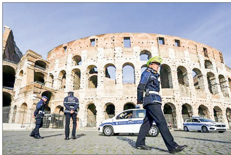
3 April 2021 — Italy has entered a strict three-day lockdown to try to prevent a surge in Covid-19 cases over Easter.