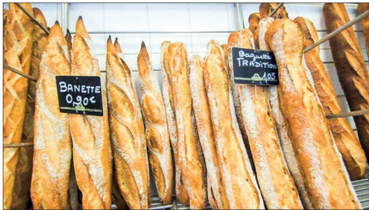
This file photo taken on 27 August 2007, shows baguette breads on display at a bakery in Caen, western France, as bread prices in France increase due to higher wheat prices.

some 400 artisanal bakeries per year since 1970, from 55,000 (one per 790 residents) to 35,000 today (one per 2,000).