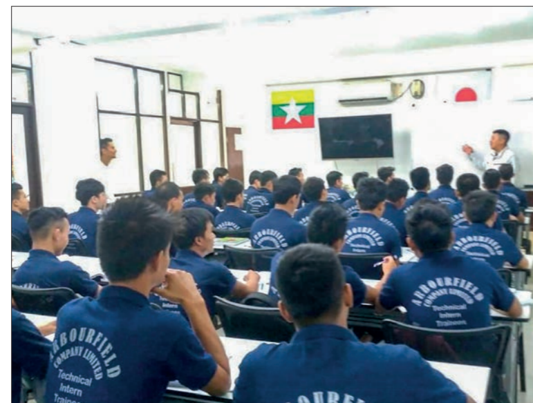
Students taking an education before going to Japan. The above photo shows an educational scene at Arborfield, a despatching agency in Myanmar. However, some despatching agencies receive the full amount of fees that the government allows, but send them without any prior training.

The matching between companies and TIT is done between the despatching agencies and the supervising agency that takes care of them in Japan, and some companies often hope to attend the interview.