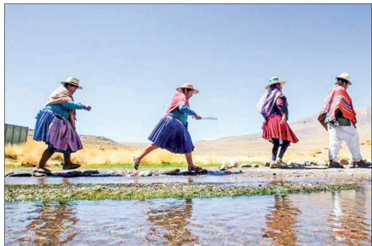
The Silala water system is the subject of a dispute between Bolivia and Chile at the International Court of Justice. PHOTO: AFP/FILE

There have long been troubled waters between the two neighbours.—AFP