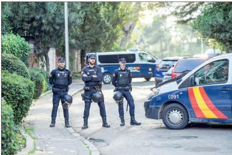
A security cordon has been put in place by the police around the embassy.

A security guard at Ukraine’s embassy in Madrid was lightly injured Wednesday while opening a letter bomb addressed