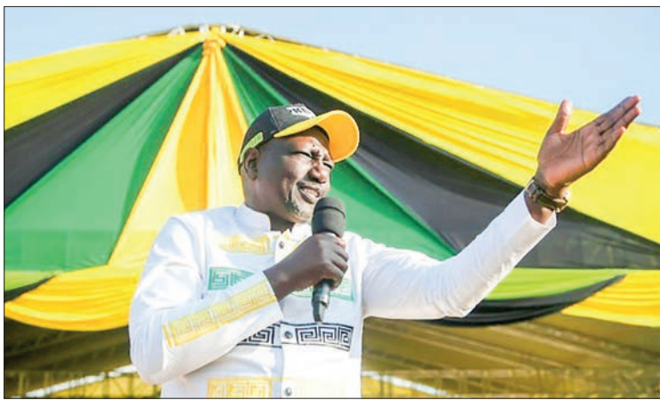
The credit scheme is one of Ruto's key campaign-trail promises.

KENYAN President William Ruto on Wednesday launched a low-interest credit scheme to boost financial access for the country's poorest citizens, fulfilling a key campaign promise