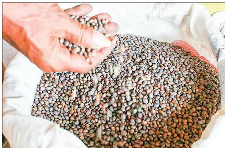
Black gram on the hand palm is being assessed for quality.

THE price of black gram weakened below K1.7 million per tonne in the beans and pulses market.