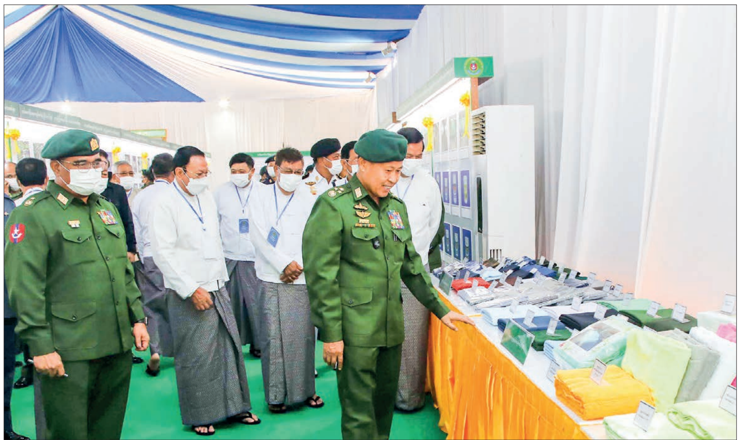
State Administration Council Vice-Chairman Deputy Commander-in-Chief of Defence Services Commander-in-Chief (Army) Vice-Senior General Soe Win views the exhibits at the event to mark the Diamond Jubilee Myanmar Military Ordnance Corps Day in Nay Pyi Taw on 1 December 2022.

“... the ordnance corps has been dutifully serving its assignments till today with the themes: to issue correct materials, correct position, correct time and correct quality. Those members of the ordnance corps actively participated in the public welfare tasks in addition to three primary duties of the Tatmadaw such as rescue and relief works in the cyclone Nargis and other natural disasters.