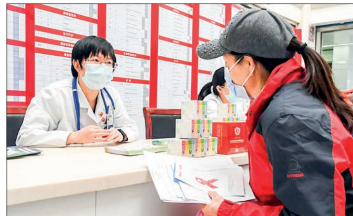
A visitor learns AIDS prevention know-hows during an AIDS awareness campaign held on the occasion of World AIDS Day at Haidian Hospital in Beijing, capital of China, 1 Dec 2020.

Beijing currently has 26,013 HIV carriers and AIDS patients. Since the first case in 1985, the capital city had reported a total of 39,018 HIV/AIDS cases as of the end of October, it added. —Xinhua