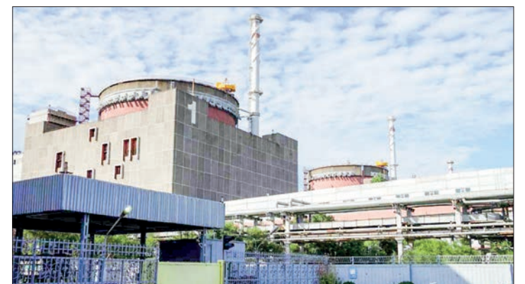
This photo taken on 11 September 2022 shows a general view of the Zaporizhzhia Nuclear Power Plant in Enerhodar, Zaporizhzhia Oblast, amid the ongoing Russian military action in Ukraine.

“We have done and are doing everything possible and impossible so that the world does not see a new Fukushima or Chernobyl,” he added. —AFP