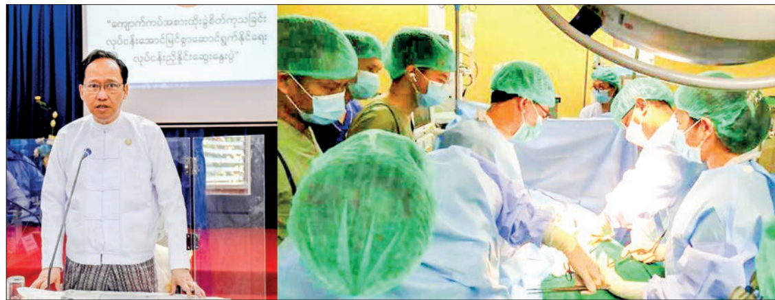
The 55 th kidney transplant operation is underway on 29 November 2022.

UNION Minister for Health Dr Thet Khaing Win discussed with the medical superintendent of the 500-bed Yangon Specialty Hospital, professor/department head of respective subjects, specialists, retired medics and health workers in detail to resume the kidney transplant operation, which was suspended in