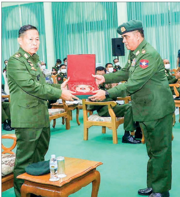
The Vice-Senior General receives the commemorative gift at the event.

Tatmadaw factories under the ordnance corps fully meet the demand of the whole Tatmadaw with the high-quality arms and ammunition produced from local factories of the Tatmadaw without relying on foreign-made military