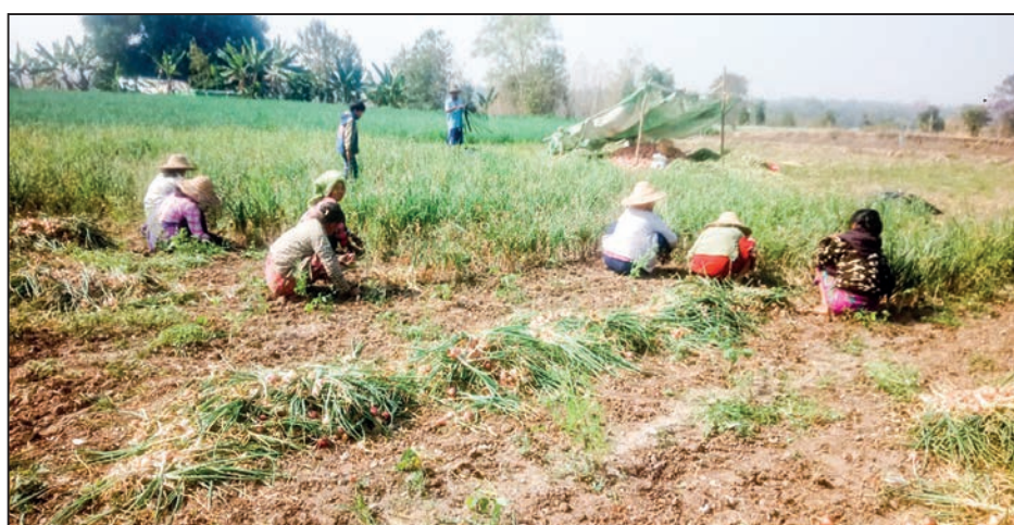
Farm workers are piling harvested onions in Kyaukpadaung Township.

The onion seeds that month were priced at K40,000 per pyi (eight condensed milk cans). About two to three pyi of seeds are required for cultivation per acre. The onion seedlings can be grown after 20 days from the seeds. Those