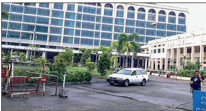
The picture shows the Central Bank of Myanmar.

They must present the receipt of the K200,000 payment in line with the directive (9/2021), when they seek permits for relocation, opening new offices or winding up. — TWA/GNLM