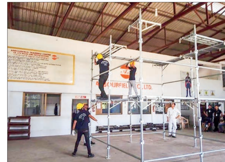
Not many despatching agencies have training facilities to teach jobs on the ground. The above photo shows a training centre in Arborfield, a despatching agency that teaches how to work at height.

In addition, TITs sometimes pay brokers to sign contracts with despatching agencies. According to this survey, about 11 per cent