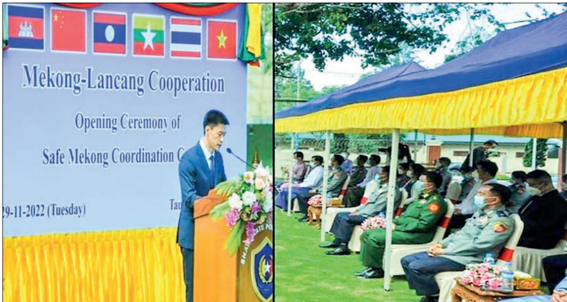
The inauguration event of the Safe Mekong Coordination Centre is in progress in Taunggyi on 29 November.

THE opening ceremony of the Safe Mekong Coordination Centre was launched in Taunggyi Township of Shan State on 29