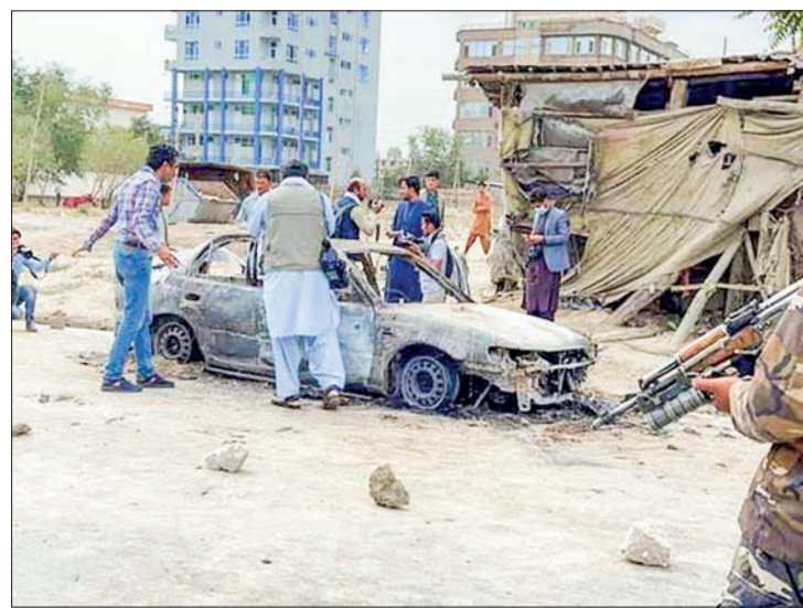
At least 19 people were killed and 24 others wounded Wednesday by a blast at a madrassa in Afghanistan's northern city of Aybak.

A provincial official confirmed the blast at Al Jihad madrassa, an Islamic religious school, but could not provide casualty figures.