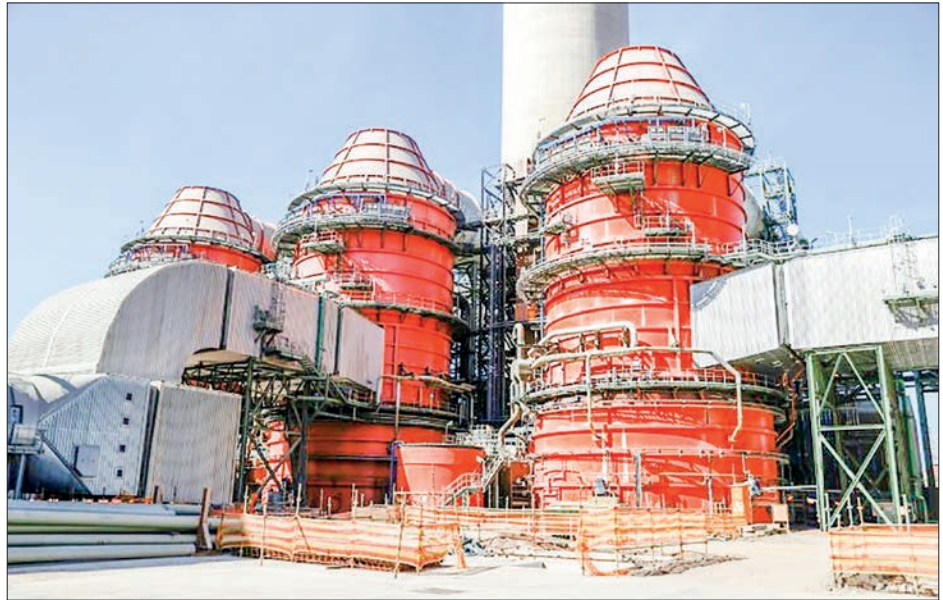
The Kusile coal-fired power station, one of the biggest in the world, was dogged for years by delays and allegations of corruption, design flaws and cost overruns.

The deal was negotiated with partner countries including Italy, Germany, the United States and Switzerland. —AFP