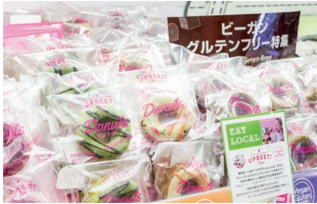
Photo taken in November 2022 shows vegan sweet donuts sold by the Aoyama branch of Natural House, an organic supermarket in Tokyo.

VEGANS in Japan are finding life much easier with a wide variety of foods to choose from, including specialty items such as “pork bone” ramen and even “cheesecake.”