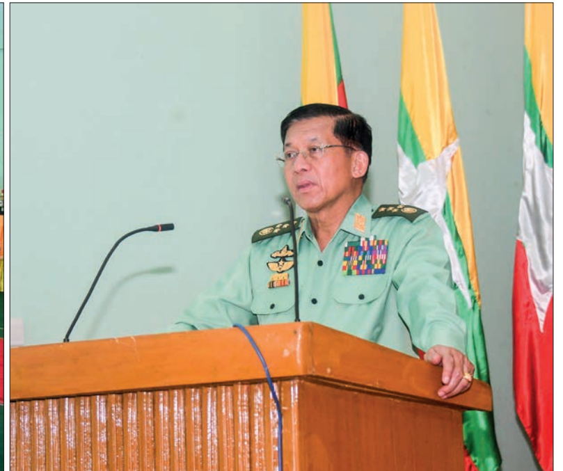
State Administration Council Chairman Commander-in-Chief of Defence Services Senior General Min Aung Hlaing meets Tatmadaw members and families from the Magway Station yesterday.

OFFICIALS need to encourage the mental strength of Tatmadaw members who perform operations and security duties, said Chairman of the State Administration Council Commander-in-Chief of Defence Services Senior General Min Aung Hlaing at a meeting with Tatmadaw members and families from Magway Station of the Central Command at Thiha Thura Kyin San Hall of the local battalion yesterday afternoon.