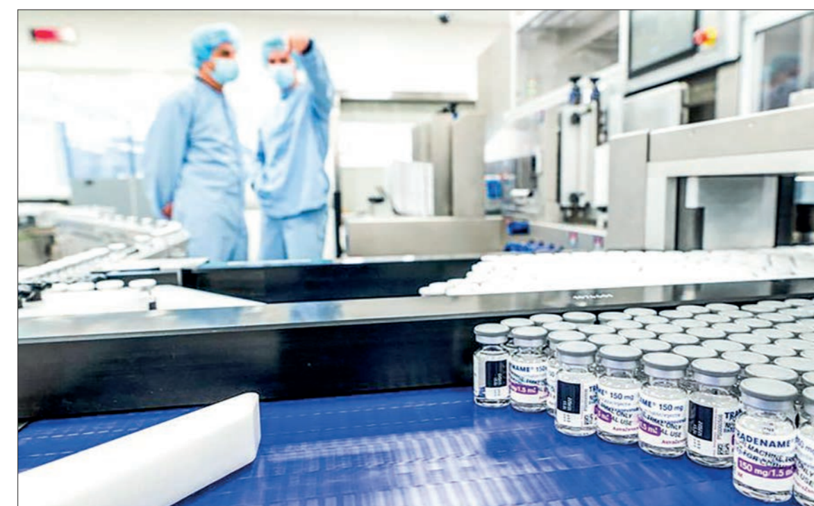
Employees work at the assembly line of the manufacturing facility of pharmaceutical company AstraZeneca for biological medicines in Södertälje, south of Stockholm, Sweden on 8 February 2022.

WITH the help of AI, researchers at Chalmers University of Technology, Sweden, have succeeded in designing synthetic DNA that controls the cells' protein production. The technology can contribute to