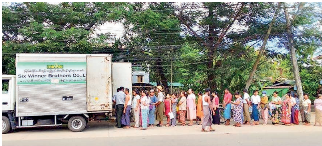
Residents line up to buy palm oil at the reference price.

THE wholesale reference price of palm oil in the Yangon market has been rising steadily, according to the Supervisory Committee on edible oil import and distribution.