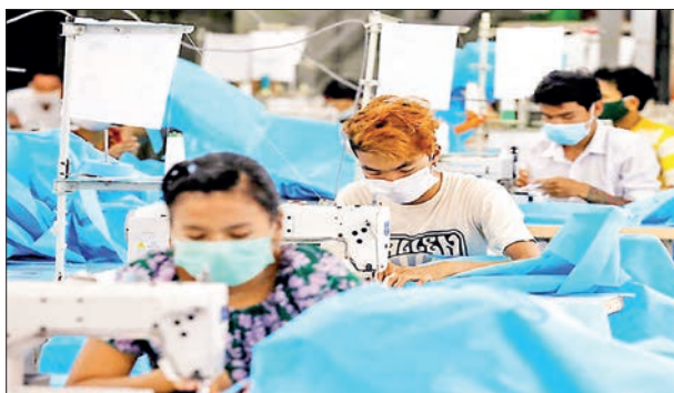
The picture shows workers of a garment factory running under a cutting-making-and-packaging system.

To simplify the verification of investment projects, the Myanmar Investment Law allows the region and state Investment Committees to grant permissions for local and