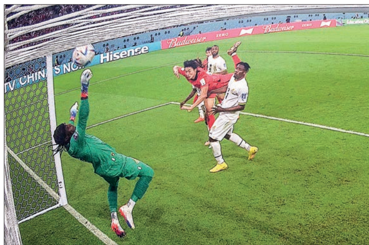
South Korea's forward #09 Cho Gue-sung (C) heads the ball and scores his team's second goal during the Qatar 2022 World Cup Group H football match between South Korea and Ghana at the Education City Stadium in Al-Rayyan, west of Doha, on 28 November 2022.

Despite their efforts, South Korea look likely to crash out of the tournament at the group stage for the third straight World Cup.—AFP