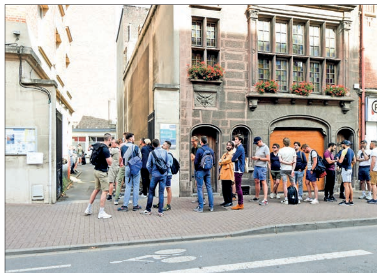
People line up to receive the monkeypox vaccine in front of the Centre gratuit d'information, de dépistage et de diagnostic (CeGIDD) in Lille, northern France, on 6 August 2022.

Some 81,107 cases and 55 deaths have been reported to the WHO this year, from 110 countries.—AFP