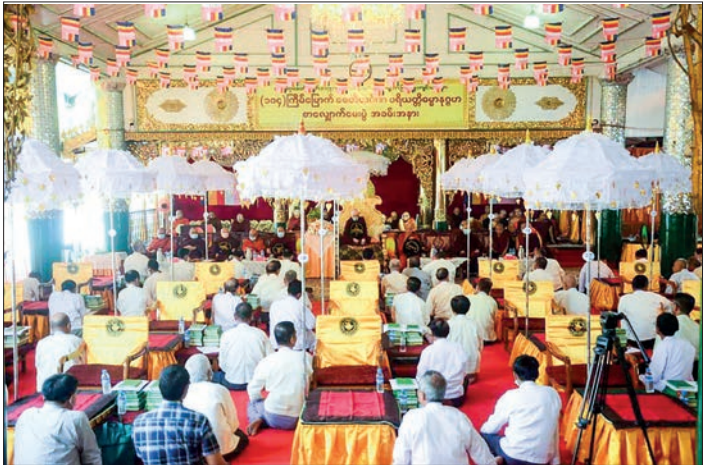
The 104 th Cetiyaṅgaṇa Pariyatti Dhamma Nuggaha Examination was held on 19 November.