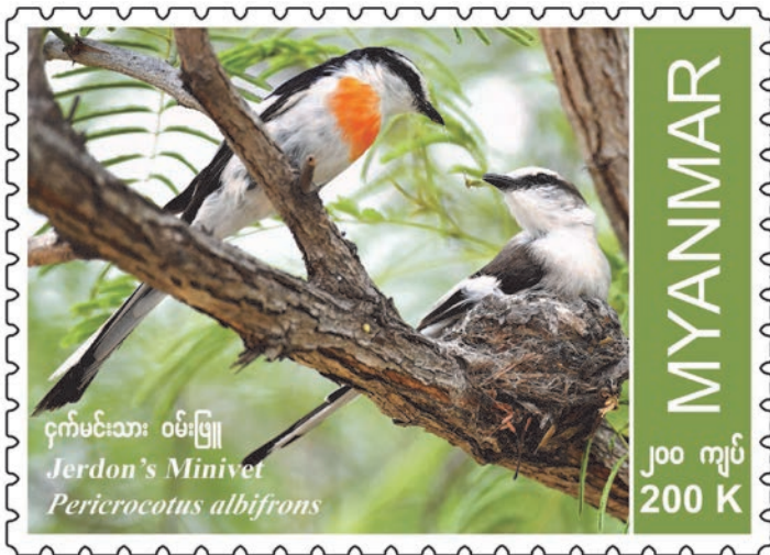
Sample of the new stamp.

As a special programme, the date will be sealed on the