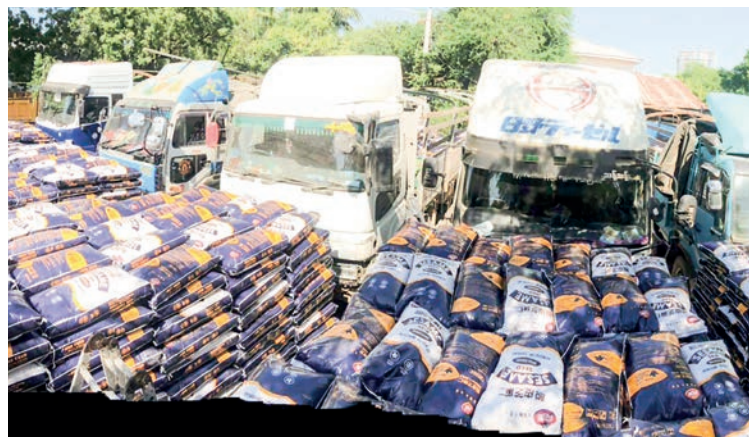
Seized illegal goods and vehicles.

Officials captured a total of 2.2326 tonnes of illegal timbers worth K156,282 in Lewe township.