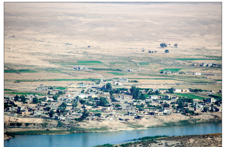
This picture taken on 1 November 2022, shows a view of the village of Messahag on the banks of the Tigris river in northern Iraq’s Salaheddine province, one of the villages that will be submerged in water if the Iraqi government completes the project of building the Makhoul dam.

ties have defended the project, which will boost water stores and help prevent shortages.—AFP