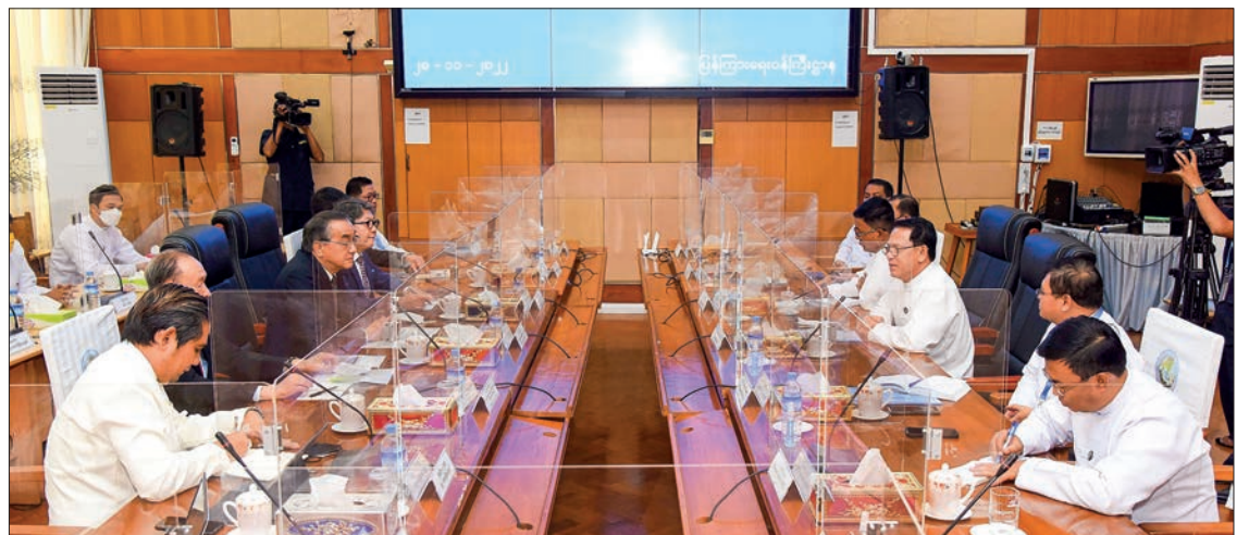
MoI Union Minister U Maung Maung Ohn meets Mr Fumio Usui of the Japan-Myanmar Cultural Promotion Association in Nay Pyi Taw yesterday.

discussed bilateral friendship and economic affairs and cooperation in the media sector. Deputy Minister U Ye Tint, Permanent Secretary U Myo Myint Maung and heads of department were also present at the meeting. — MNA