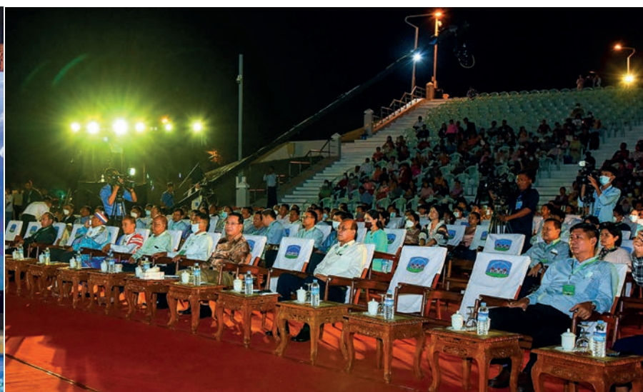
Union Minister U Maung Maung Ohn, dignitaries, staff and families watch the performances of the Variety Show yesterday.