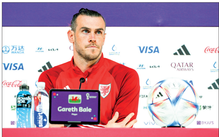
Wales' forward Gareth Bale addresses a press conference at the Qatar National Convention Centre (QNCC) in Doha on 28 November 2022, on the eve of the Qatar 2022 World Cup football match between Wales and England.

WALEs forward Gareth Bale said his team needed to give everything they had to beat England in the World Cup on