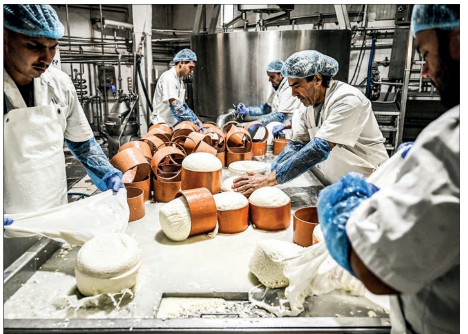
Employees work to produce Graviera cheese in a cheese factory at the Aegean island of Naxos on 11 November 2022.

Dimitris Kapounis, head of the union of Naxos agricultural cooperatives, warns that if nothing changes "in the medium term, there will be no more milk on the Greek market, no meat, potatoes, or anything else."—AFP