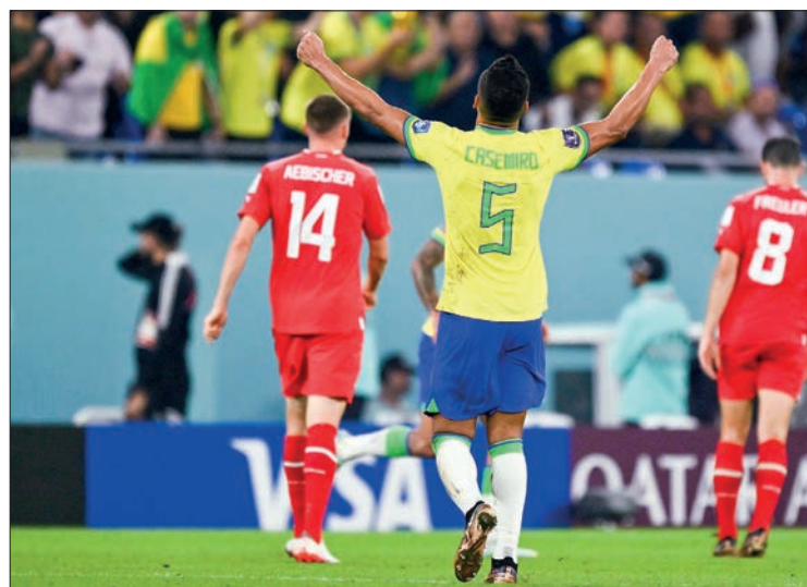
Brazil's midfielder #05 Casemiro celebrates his team's win after the Qatar 2022 World Cup Group G football match between Brazil and Switzerland at Stadium 974 in Doha on 28 November 2022.

Switzerland, meanwhile, failed to muster a shot on target but remain on course to qualify