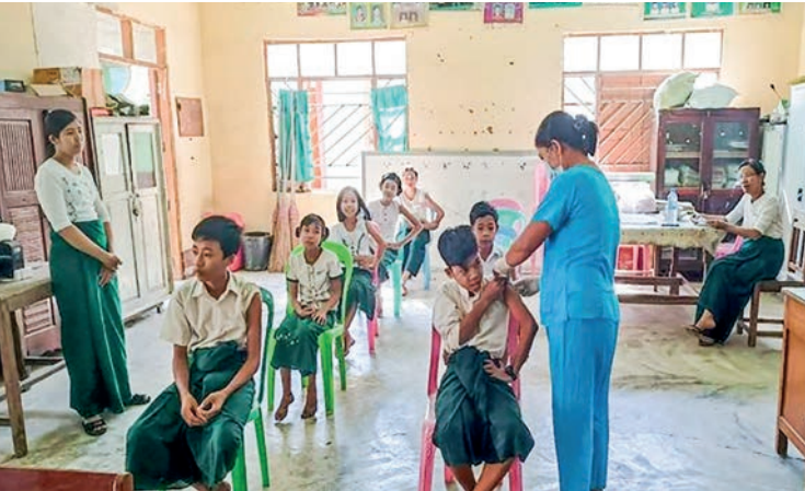
Students from Kyaunggon Township in Ayeyawady Region get jabbed against COVID-19 on 28 November.

In addition, to assist in the control and prevention of the Covid-19 disease, medical teams from various regional commands in collaboration with district and township administrative officials, departmental personnel