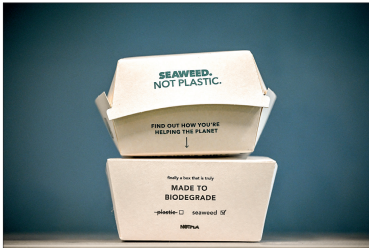
In this arranged photograph takeaway food packaging with “Notpla Coating” is pictured at Notpla in Hackney, east London, on 24 November 2022.

In its second year, the initiative to reward innovative efforts to combat climate change will then be broadcast on UK and US television on Sunday and Monday, respectively, as well as