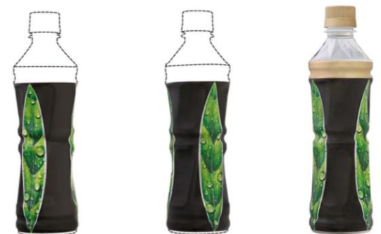
Reg. No. 4/11120/2013 (18 October 2013)

In abovementioned "Packaging Container" design, the features shown in broken lines depict environmental subject matter only and form no part of the claimed Design.