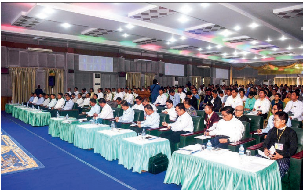
State Administration Council Chairman Prime Minister Senior General Min Aung Hlaing meets MSME businesspersons from the Magway Region on 28 November 2022.

can be created and more contributions can be supported for regional development. Hence, the region chief minister needs to lead the work process for uplifting the socioeconomic life of rural people. The country is endowed with trees, forests and bamboo resources. Whenever forest resources are utilized, it is necessary to grow trees in their place and carry out environmental conservation work without fail.