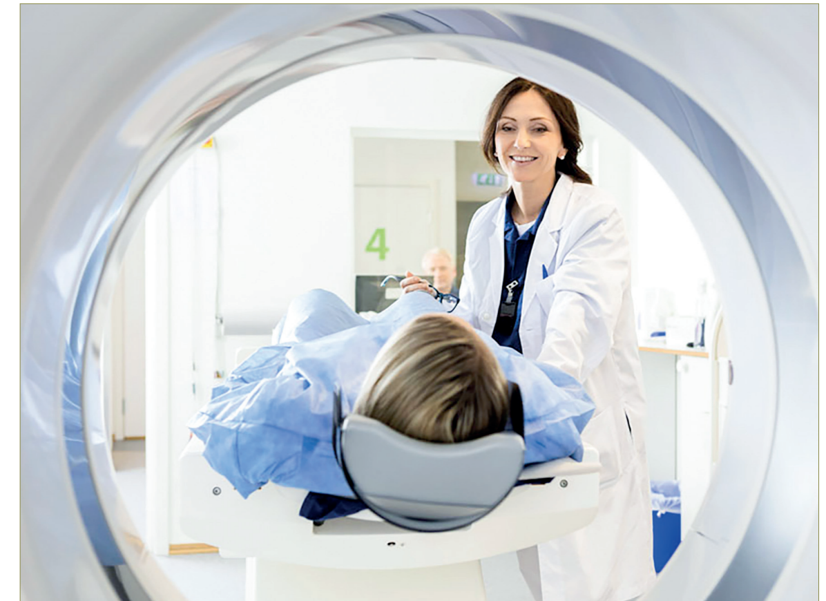
Magnetic resonance imaging (MRI) is a medical imaging technique that uses a magnetic field and computer-generated radio waves to create detailed images of the organs and tissues in your body.