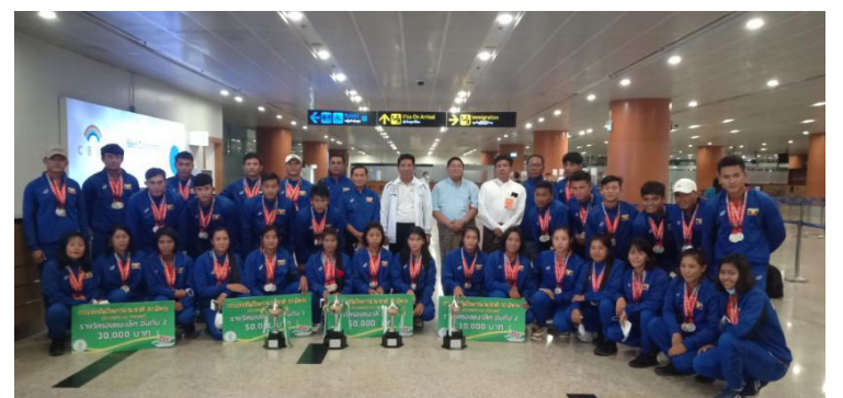
The Myanmar Rowing Team are seen at the Yangon International Airport after arriving back from Thailand.

When the Myanmar Sports Team returned to Yangon by air on 27 November, the Advocate-General of the Yangon Region Government, the Yangon Region Sports and Phys-