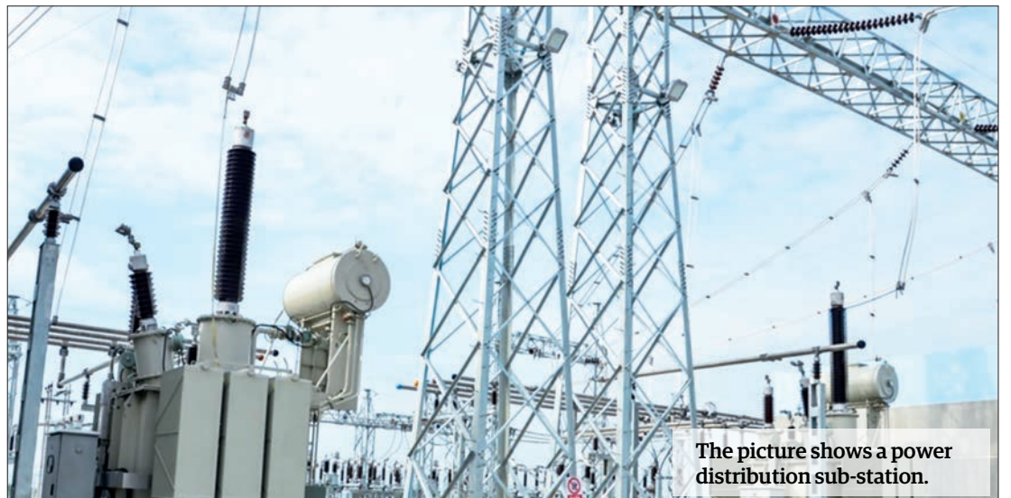
The picture shows a power distribution sub-station.

Electricity production decreased in 2020-2021FY though the production was high from 2016-2017FY to 2019-2020FY. It was due to the factories being closed in the COVID-19 outbreak, the maintenance of generators in some hydroelectric power plants and the control of the water level of the dams, said the Central Statistical Organization quoting the Electric Power Planning Department. — TWA/GNLM