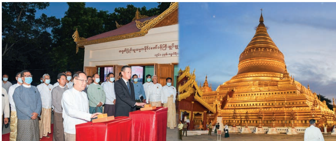
Union Minister U Ko Ko and Chinese Consul-General Mr Chen Chen press the button for the offering of electric light at Shwezigon Pagoda.

THE ceremonies of electric light offering to Shwezigon Pagoda and LED screen board installation at Zhou Enlai Prayer Hall, donated by Mandalay-based Consulate-General of China were