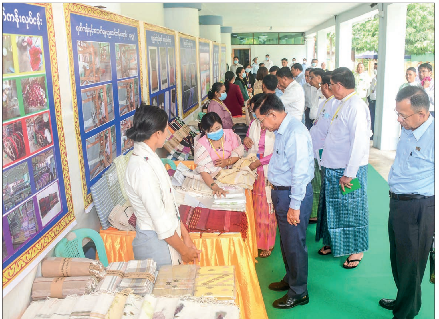
State Administration Council Chairman Prime Minister Senior General Min Aung Hlaing views round the exhibits at the meeting with MSME businesspeople in Magway Region on 28 November 2022.