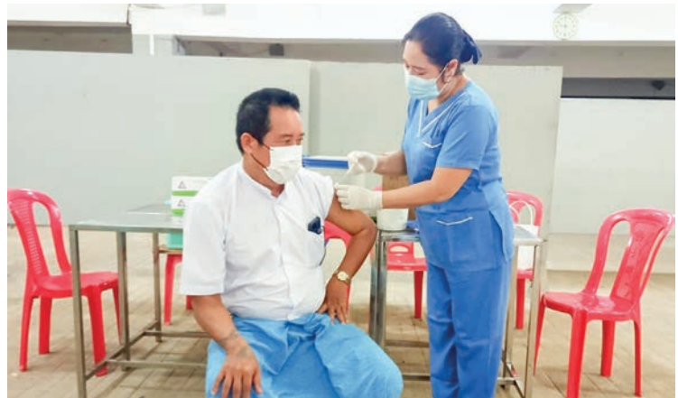
A local in Thakayta Township, Yangon Region gets COVID-19 vaccine shot on 28 November.

and members of civil society organizations (CSOs) conducted educational campaigns such as prevention of COVID-19, wearing of masks in public places and distribution of masks to the locals at schools, markets, streets, city entry points and crowded areas in 44 townships in Yangon Region, yesterday. — MNA