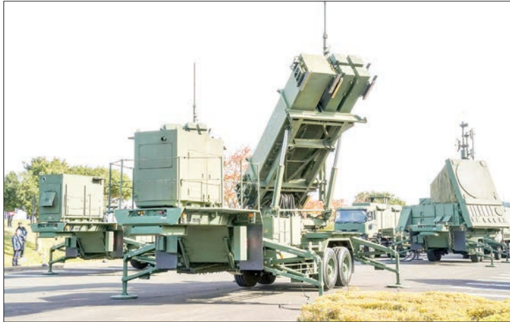
A launcher for Patriot Advanced Capability-3 ballistic missile interceptors is seen 28 November 2022, in Oi, Fukui Prefecture in central Japan as the Air Self-Defence Force conducted a drill.

JAPAN'S Air Self-Defence Force on Monday conducted a missile interceptor drill near a nuclear plant on the Sea of Japan coast, amid caution over North Korea's repeated ballistic missile test firings.