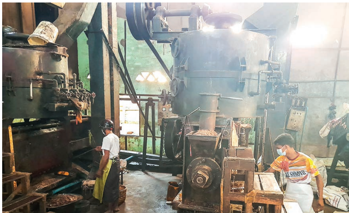
The Directorate of Industrial Supervision and Inspection (DISI) will pay out loans to oil millers to effectuate the development of the milling industry. Workers are seen at the edible oil mill.

Those interested can download the loan proposal form through the official website of the DISI https://msmewebportal.gov.mm/latest-news/185 and the Ministry of Agriculture, Livestock and Irrigation https://www.moali.gov.mm/my/tender/2022-11-25t1011090630 . The millers can send the proposal form and necessary documents in a sealed envelope to the office of DISI's loan management task force (addressing to the Director General) located at No.37, the Ministry of Indus-