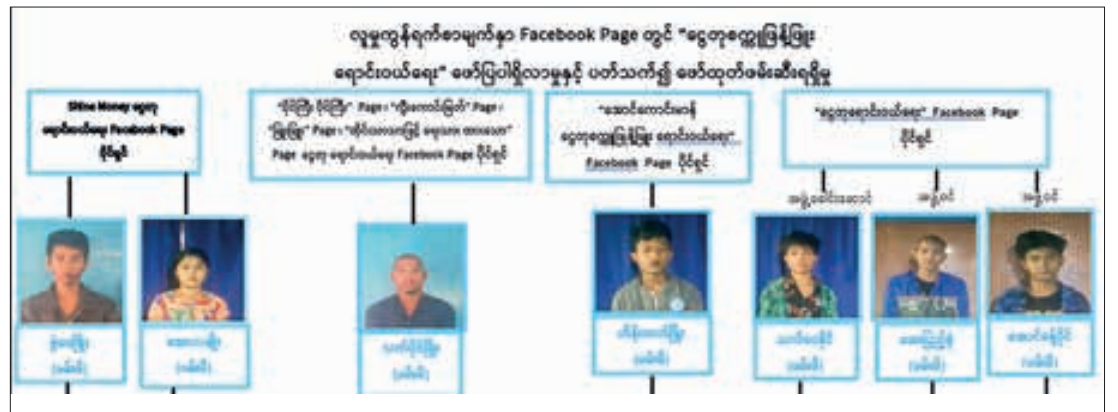
Offenders were arrested and prosecuted for posting fake currency sales on Facebook.