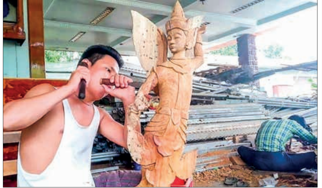
A sculptor from Darpein sculpture village is working on sculptures in Hlegu Township.

YANGON Region is a tourist destination that can be reached within an hour from Yangon. The Department of Hotels and Tourism, the Department of Archeology and National Museums, the Small Industries Department and the Myanmar Tourism Federation are jointly implementing it.