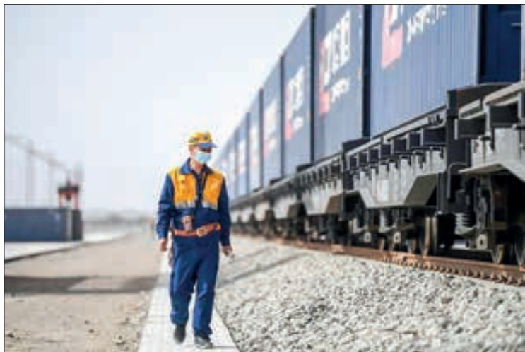
A railway staff member checks the freight train that runs via the China-Laos Railway in Dunhuang, northwest China's Gansu Province, 21 April 2022.

CHINA has stepped up measures to improve logistics and ensure an unimpeded flow of goods as part of efforts to optimize the COVID-19 response.