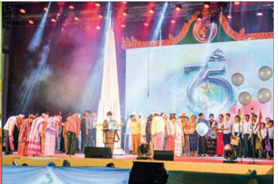
Chairman of the State Administration Council Prime Minister Senior General Min Aung Hlaing and wife Daw Kyu Kyu Hla enjoy the Variety Show to mark the Diamond Jubilee Independence Day for 2023 in Nay Pyi Taw on 26 November 2022.

A ceremony to launch a Variety Show to mark the Diamond Jubilee Independence Day for 2023 with the aim of enabling the people to have pleasure and enjoy the essence of independence took place at the open-air theatre of the Nay Pyi Taw City Hall yesterday evening, attended by Chairman of the State Administration Council Prime Minister Senior General Min Aung Hlaing and wife Daw