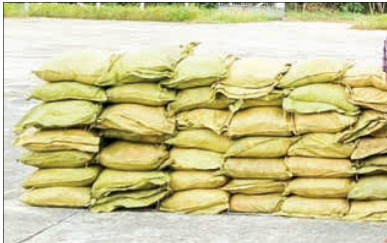
Seized illegal goods in Kachin State.

Therefore, six arrests (estimated value of K56,099,636) were made on 22, 24 and 25 November, according to the Illegal Trade Eradication Steering Committee. — MNA