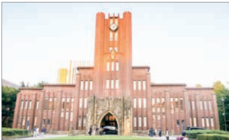
File photo taken 28 Sept 2018, shows the University of Tokyo's Yasuda Auditorium.

THE University of Tokyo has said it aims to double its number of female professors and associate professors to around 400 by fiscal 2027 as it pushes for more diversity on campus.