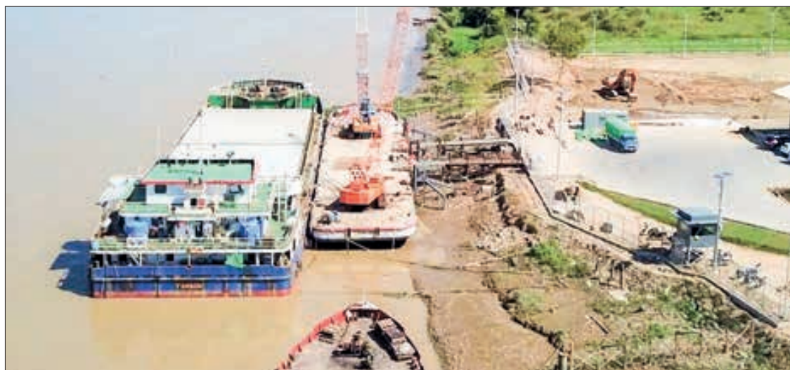
The vessel laden with export rice to Bangladesh is pictured at the Ayeyawady International Industrial Port-AIIP in Pathein.

The AIIP exported 2,650 tonnes of rice by MV MCL-7 from Ayeya Hinth company on 2 November, 2,615 tonnes by MV MCL-21 on 7 November, 2,650 tonnes by MV MCL-12 on 13 November and 2,650 tonnes by MV MCL-18 on 22 November, 10,565 tonnes of rice in total. A total of 211,300 bags of 50-kilogramme