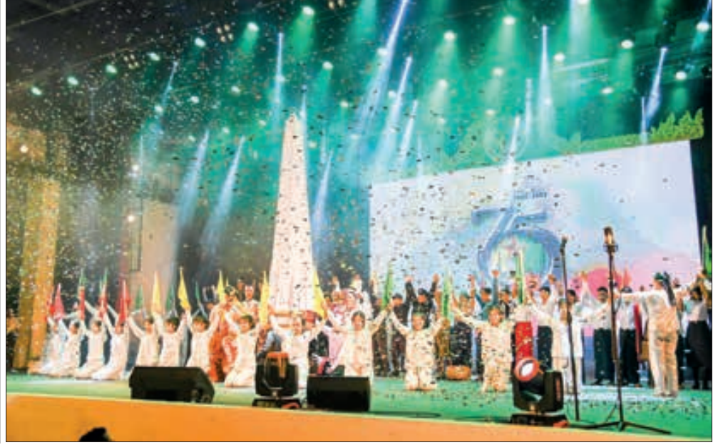
Artistes from film, music and theatrical arenas entertain performances at the Variety Show in commemorating Diamond Jubilee Independence Day 2023.