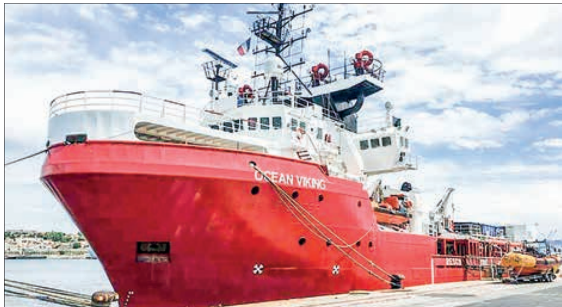
The NGO SOS Mediteranee's rescue ship Ocean Viking is docked in Marseille harbour.

EUROPEAN interior ministers welcomed Friday an EU plan to better coordinate the handling of migrant arrivals, after a furious row over a refugee rescue boat erupted between Italy and France.