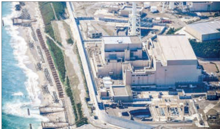
Chubu Electric Power Co's Hamaoka nuclear power plant.

The companies including Chugoku Electric Power Co, Kyushu Electric Power Co and Chubu Electric Power Co will be ordered to pay surcharges totalling tens of billions of yen for violating the anti-monopoly law, possibly the highest amount ever imposed by the Japan Fair Trade Commission, the sources said Friday.