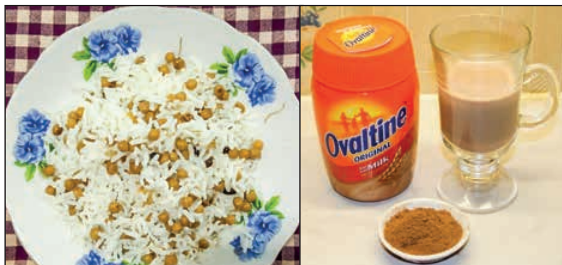
A dish of fried rice with baked garden peas.

The prices of Naan (Indian flat bread), Eikyakway (Youtiao or Yu Char Kway – deep-fried bread strips of Chinese origin) and Paukei (Baogi-Filled