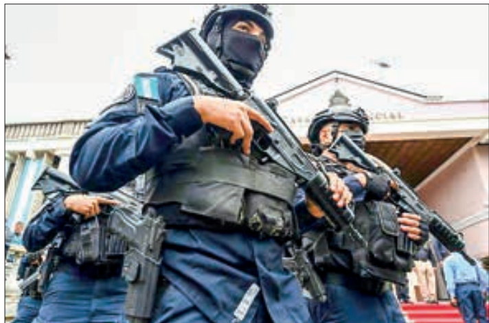
Honduran special forces at the launch of a plan to battle extortion and organized crime in the country, which has declared a state of emergency.

An AFP photographer reported a heavy presence of special forces and other officers in the capital on Friday.—AFP