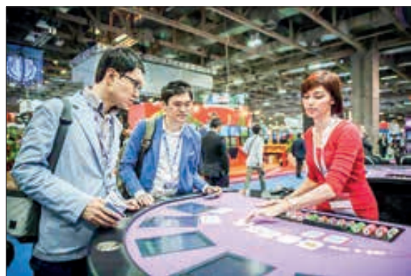
Macau is one of the biggest gambling hubs in the world.

That attempt failed, however, as Macau’s leader Ho Iat-seng announced that the existing licence holders have been granted provisional concessions.—AFP