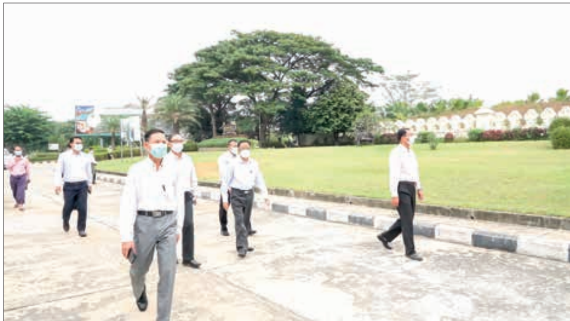
MoHT Union Minister Dr Htay Aung inspects the development measures of the hotels and tourism industry in Nay Pyi Taw yesterday.

Finally, the Union minister and party toured organic plantations operated at Park Royal Hotel and the operations run by solar energy at Park Royal Hotel and Horizon Lake View Hotel. — MNA