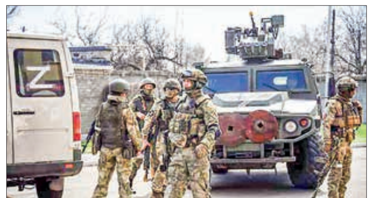
File photo of Russian soldiers.

The carefully choreographed meeting at Putin’s residence took place as anger simmers in Russia over a chaotic military draft and deaths of soldiers in Ukraine. At least one woman at the meeting wore a black headscarf, apparently marking a recent loss. “I want you to know — I personally and the entire leadership of the country share this pain,” Putin told the group ahead of Mother’s Day, which is celebrated in Russia on Sunday. “We understand that nothing can replace the loss of a son, a child,” Putin said.