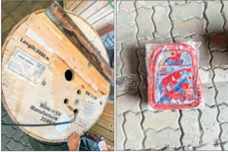
Confiscated illegal industrial materials at the Myanmar International Terminal Thilawa.

A combined team led by the Region Forest Department under the supervision of the Ayeyawady Region Anti-Illegal Trade Task Force conducted inspections on 22 November, according to information.