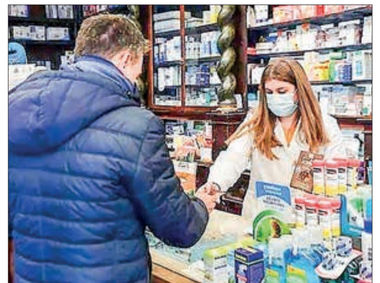
A pharmacist wearing a protective respiratory mask tends to a customer in Codogno, southeast of Milan, on 22 Feb 2020.

Italy no longer enforces COVID-19 health restrictions except in hospitals, care homes and other areas where highly vulnerable people are concentrated. Health authorities continue to administer a second booster vaccine dose tailored to reduce the risk of infection from new strains of the virus to eligible residents, though the process has so far been slower than at earlier vaccine rollout stages.— Xinhua