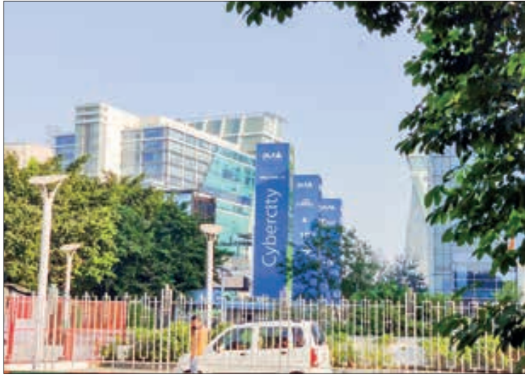
Photo taken on 24 Nov 2022, shows a view of Cyber Hub in Gurgaon, India.

THE recent layoffs in companies like Facebook and Twitter may cast a shadow on the information technology (IT) or software firms in India, particularly those which cater to outsourced works from foreign-based companies.