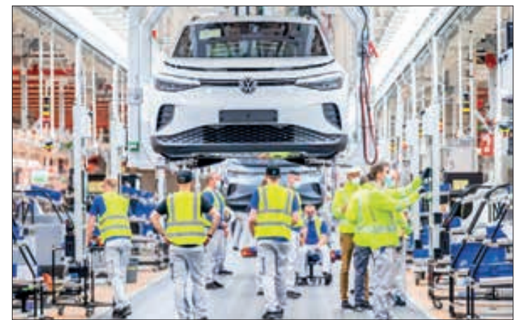
The European Union has "serious concerns" about the US Inflation Reduction Act, saying it breaches international trade rules. The assembly line for the Volkswagen ID 4 electric car, in Emden, northern Germany.

Sikela and Dombrovskis both underlined the need to avoid a "subsidy race" between the EU and the US, explaining that it would be dangerous, expensive and inefficient.—Xinhua