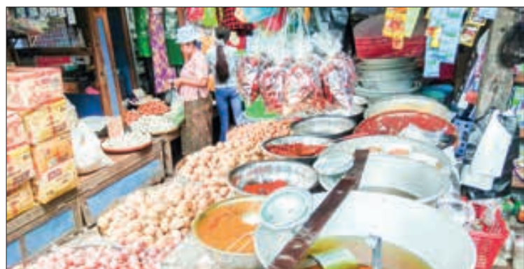
Shoppers are seen buying foodstuffs at the grocery.

The onion prices seem to drop significantly soon. Although the prices are high obviously, people have to buy at higher prices. However, people don't know clearly about the accurate prices when it falls again. — TWA/GNLM