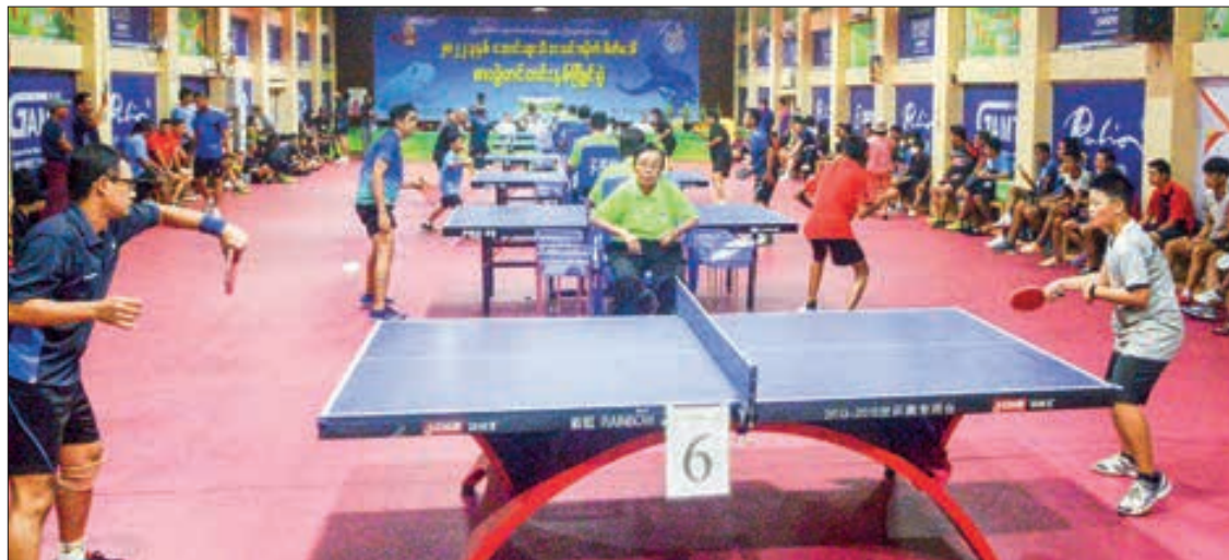
Table Tennis players train hard for the Winter Invitational Table Tennis Tournament 2022.

THE Winter Invitational Table Tennis Tournament 2022 organized by the Myanmar Table Tennis Federation and supported by Royal D was held yesterday morning at the U Wizara Road National Swimming Pool of Myanmar Table Tennis Federation in Dagon Township, Yangon Region and over 200 athletes participated in the tourney.