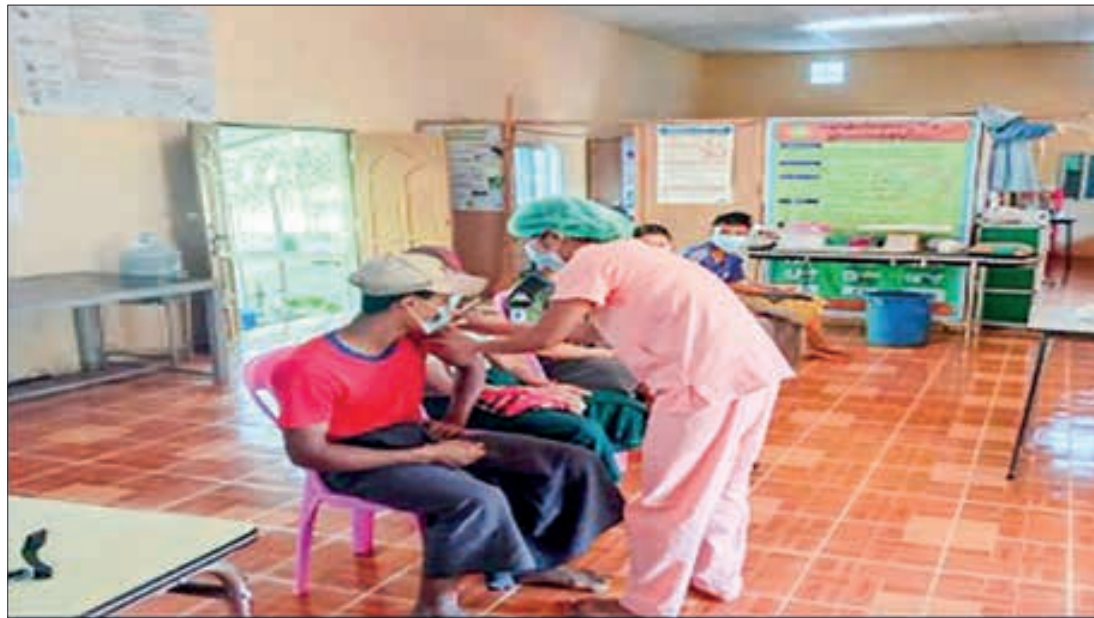
A local from Kyaunggon Township in Ayeyawady Region gets jabbed against COVID-19 on 26 November.

VACCINATION is being carried out in full swing in various regions and states as the vaccination programmes are one of the most important activities in the prevention, control and treatment of COVID-19 disease.