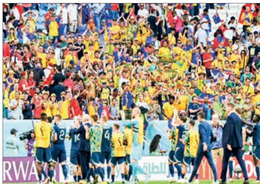
Fans of Australia celebrate as the team acknowledges the crowd after defeating Tunisia 1-0 in the Qatar 2022 World Cup Group D football match between Tunisia and Australia at the Al-Janoub Stadium in Al-Wakrah, south of Doha on 26 November 2022.

GOAL hero Mitch Duke said he had a feeling he would score after his header gave dogged Australia a 1-0 World Cup win over Tunisia on Saturday to revive their last-16 hopes.