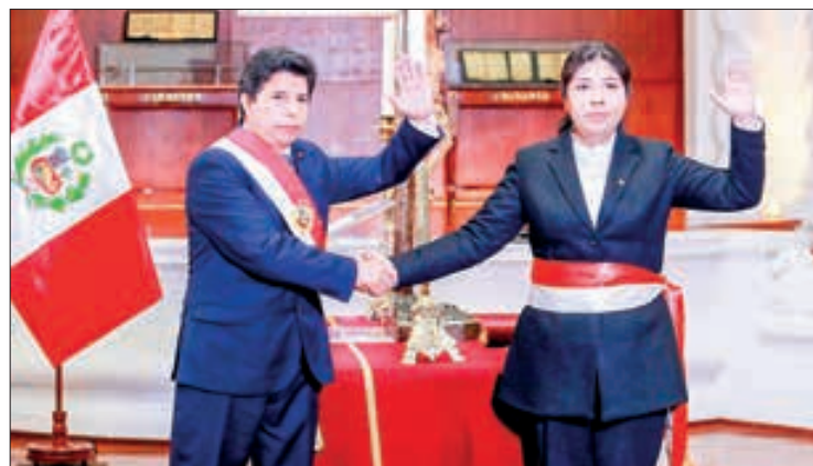
Betsy Chavez, a 33-year-old lawyer who also did a stint as labour minister, was sworn in as the fifth prime minister since the beleaguered Castillo took office 16 months ago.

PERU'S President Pedro Castillo on Friday appointed the culture minister as the country's new prime minister after her predecessor resigned over a row with parliament.