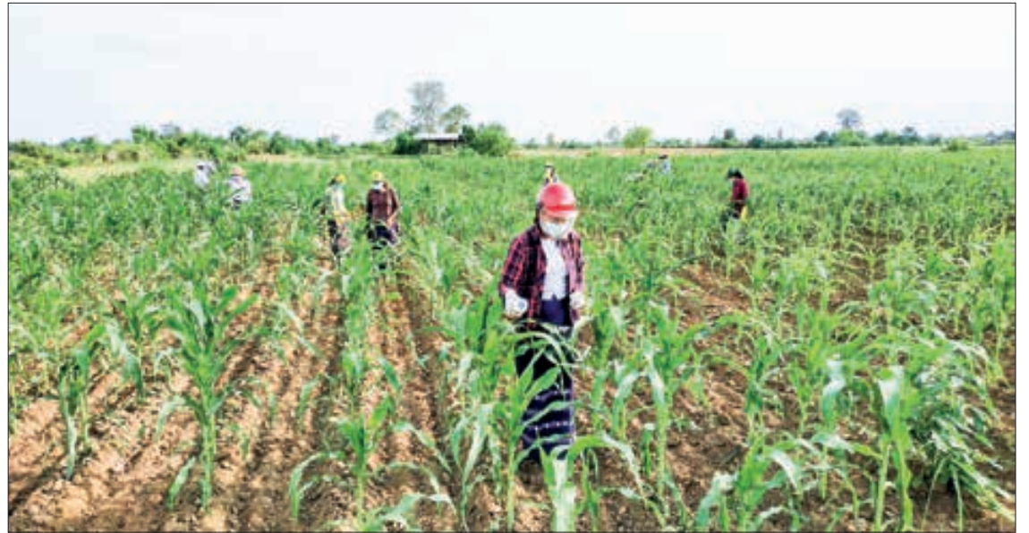
The country produces corn once every four months like winter corn, summer corn and monsoon corn. The country produces 2.5-3 million tonnes of corn every year.

According to the decision made at the FESC meeting (66/2022), "if it is difficult to make payment for exports via border areas like oil crops (peanut, sesame) including corn, beans and pulses (black gram, mung bean, pigeon pea, chickpea), rubber, marine products, fish (prawn, crab, eel), animals and animal products (live cat-