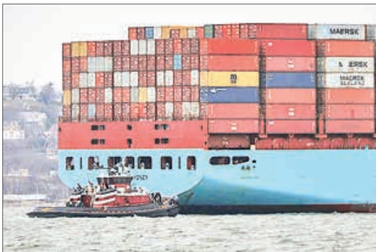
Overall, the German economy remains robust.

GERMANY'S economy grew more than previously thought in the third quarter despite high inflation and an energy crisis, revised official data showed Friday.