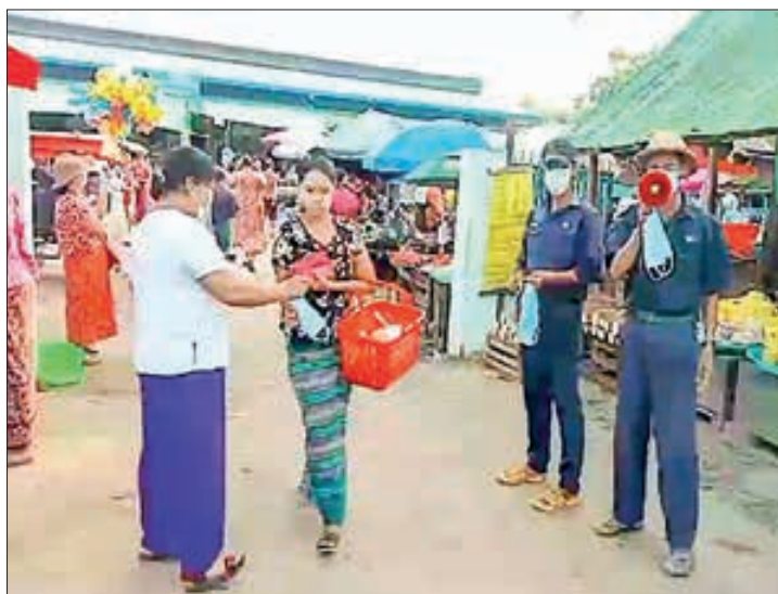
Local authorities distribute masks to local people in Yangon.

COVID-19, wearing of masks in public places and distribution of masks to the locals at schools, markets, streets, city entry points and crowded areas in 44 townships in Yangon Region and Yamethin Township in Mandalay Region yesterday. —MNA