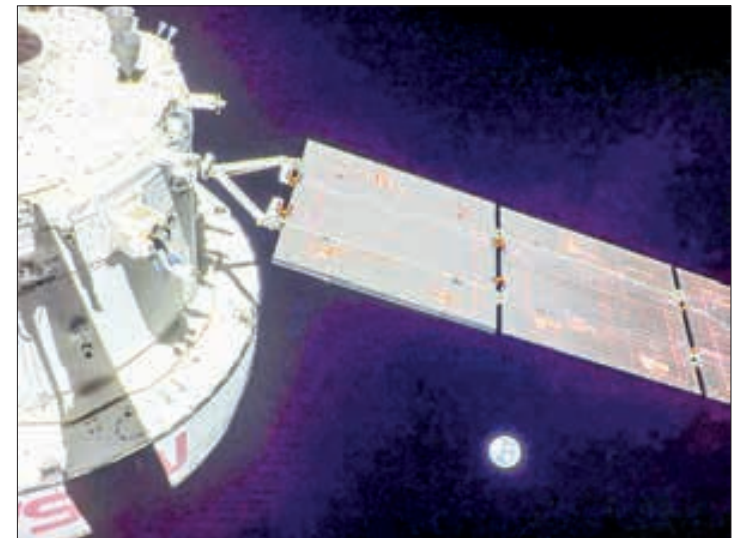
This image provided by NASA shows flight Day 9 imagery that NASA's Orion spacecraft captured looking back at the Earth from a camera mounted on one of its solar arrays. NASA's Orion capsule is now circling the moon in an orbit stretching tens of thousands of miles.

The current record is held by the Apollo 13 spacecraft at 248,655 miles (400,171 km) from Earth.—AFP