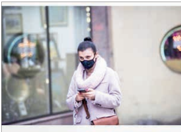
A woman wear a mask as she walks along a street in Skopje, Macedonia, on 30 January 2019, one of the most polluted cities in Europe. PHOTO: AFP/FILE

The Covid-19 pandemic led to the deaths of some people already living with diseases related to air pollution.—AFP