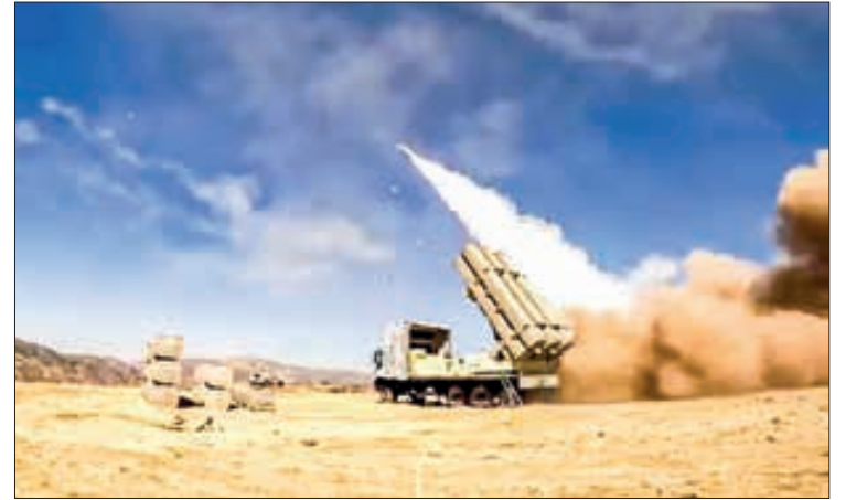
This video grab taken from footage provided by the Iranian military to Farsnews agency social media on Thursday 29 September 2022, reportedly shows a missile launch from the Iranian Kurdistan (Komalah) region directed towards Sulaimaniyah in Iraq’s autonomous Kurdistan region.

The IRGC recently used artillery and drones to attack what it called the positions of Iranian “separatists” based in Iraq’s northern Kurdistan Region.—Xinhua