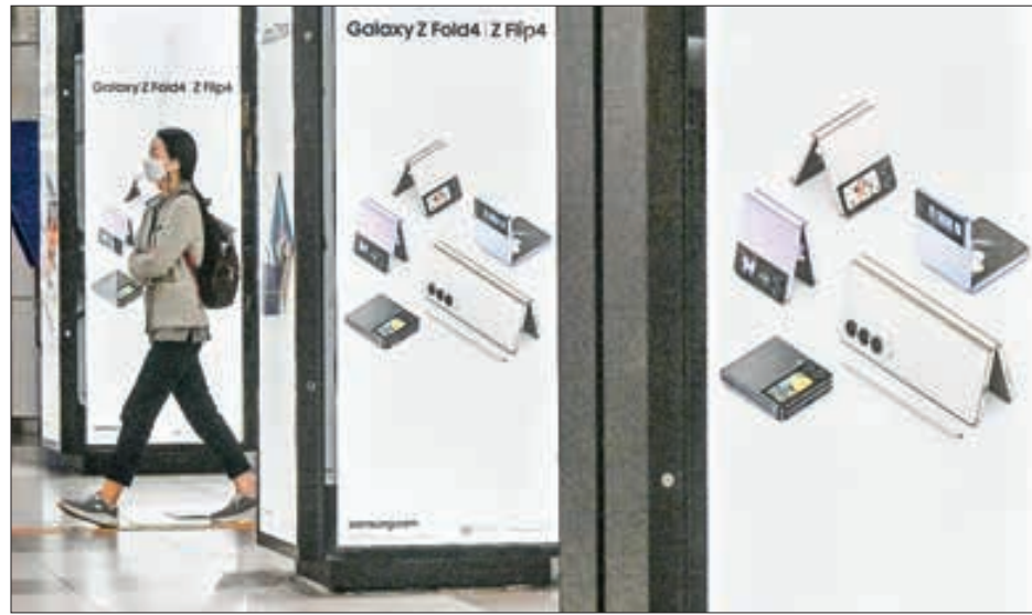
A woman walks past an advertisement for the Samsung Galaxy Z Fold4 and Flip4 smartphones at a subway station in Seoul on 27 October 2022.

SOUTH Korea's export of information and communications technology (ICT) products kept falling for the fourth consecutive month through October,