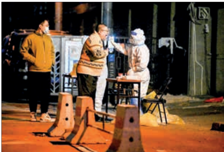
A health worker takes a swab sample from a man at a residential area under lockdown due to Covid-19 coronavirus restrictions in Beijing on 14 November 2022.

THE Chinese mainland on Sunday reported 1,747 locally transmitted confirmed COVID-19 cases, the National Health Commission said Monday.