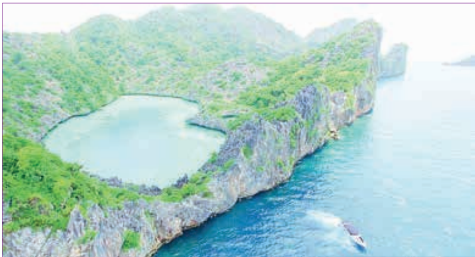
One of the tourist attractions, a beautiful island in the Myeik Archipelago is seen near the sea.