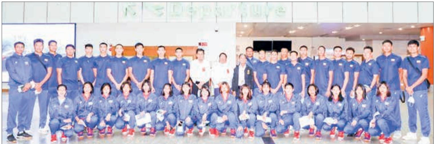
The Myanmar volleyball team are seen at the International Airport in Yangon before leaving for China for joint training.

IN order to further improve the quality and skills of the athletes who will represent Myanmar in the 32 nd Southeast Asian Games, the Ministry of Sports and Youth Affairs will conduct joint training in the People’s Republic of China under the G-to-G plan.