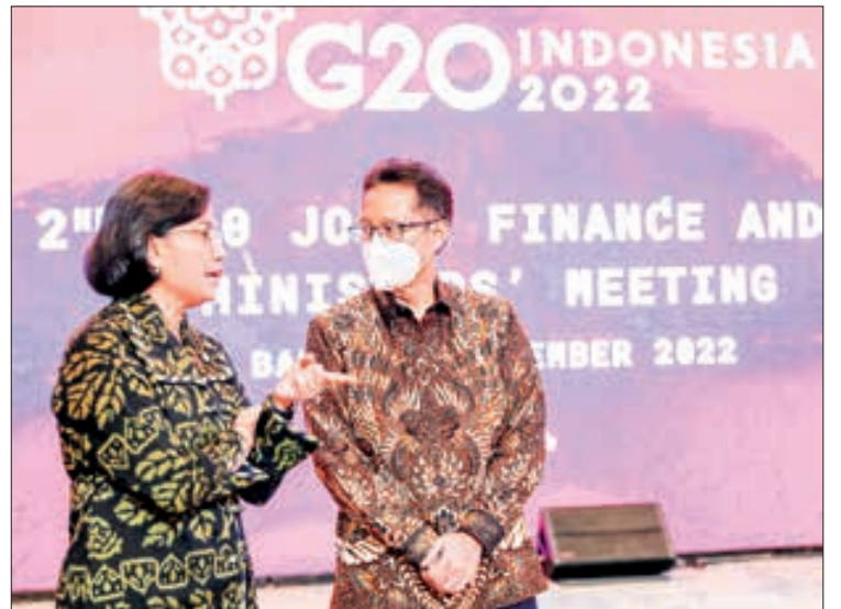
Indonesia's Finance Minister Sri Mulyani Indrawati (L) talks with Indonesia's Health Minister Budi Gunadi Sadikin (R) during the G20 Finance and Health Ministers meeting in Nusa Dua, Bali 12 November 2022.

US Treasury Secretary Janet Yellen said the joint fund was an example of what the G20 can do to tackle global problems.—AFP