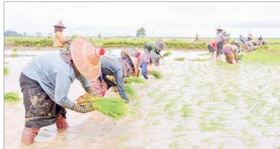
Farm workers are seen transplanting the summer paddy.

with the result that the draft cattle — the buffaloes and the oxen — were killed in the war by the thousands. The Japanese fascist troops slaughtered the cattle for their curry. With great losses of the farming animals, agricultural activities declined, and the acres of land put under cultivation also decreased. As a consequence, there were only 11.5 million acres of land even in 1961.