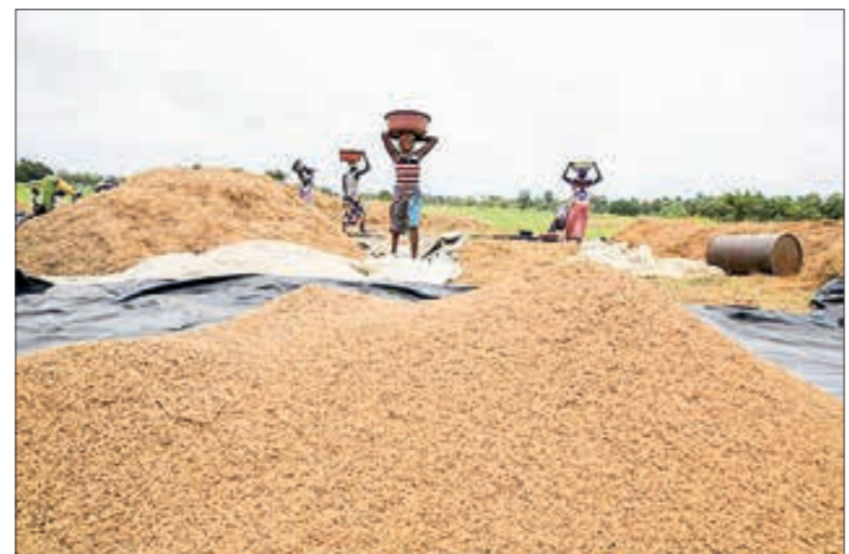
Farm workers are seen collecting the threshed paddy.