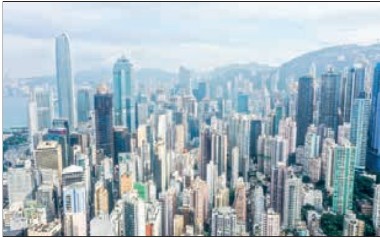
An aerial view shows residential and commercial buildings in Hong Kong on 14 November 2022.

STOCK markets mostly rose Monday after last week's global surge, helped by China's loosening of Covid rules and plans to help its property sector.