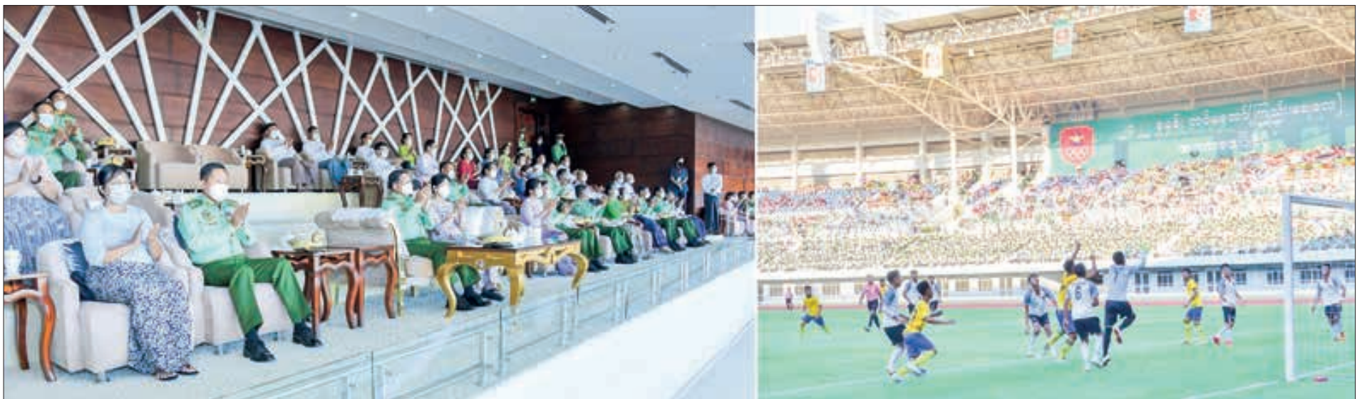
The Senior General and party watch the football match between the Eastern Command team and the Central Command team in Nay Pyi Taw yesterday.