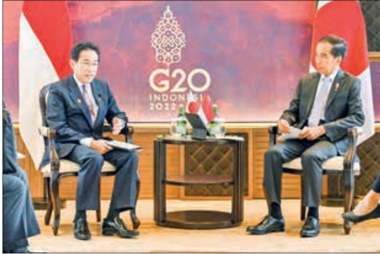
Japanese Prime Minister Fumio Kishida (L) and Indonesian President Joko Widodo hold talks on the sidelines of a summit of the Group of 20 major economies in Bali, Indonesia, on 14 November 2022.

JAPANESE Prime Minister Fumio Kishida pledged Monday to provide 130 billion yen ($927.4