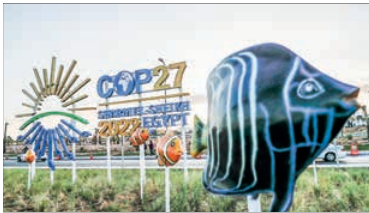
This picture shows a view of the green zone at the Sharm el-Sheikh International Convention Centre, during the COP27 climate conference in Egypt's Red Sea resort city of the same name, on 9 November 2022.

At last year's UN climate summit in Glasgow, nearly 200 countries vowed to "keep alive"