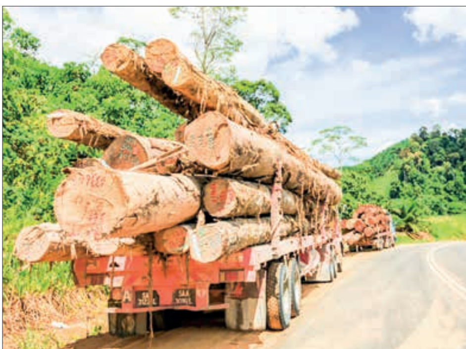
Teak logs were seen being exported to Thailand in the financial year 2018-2019.

ACCORDING to the statistics of the Ministry of Commerce, more than US$88 million were earned from the export of forest products from Myanmar.