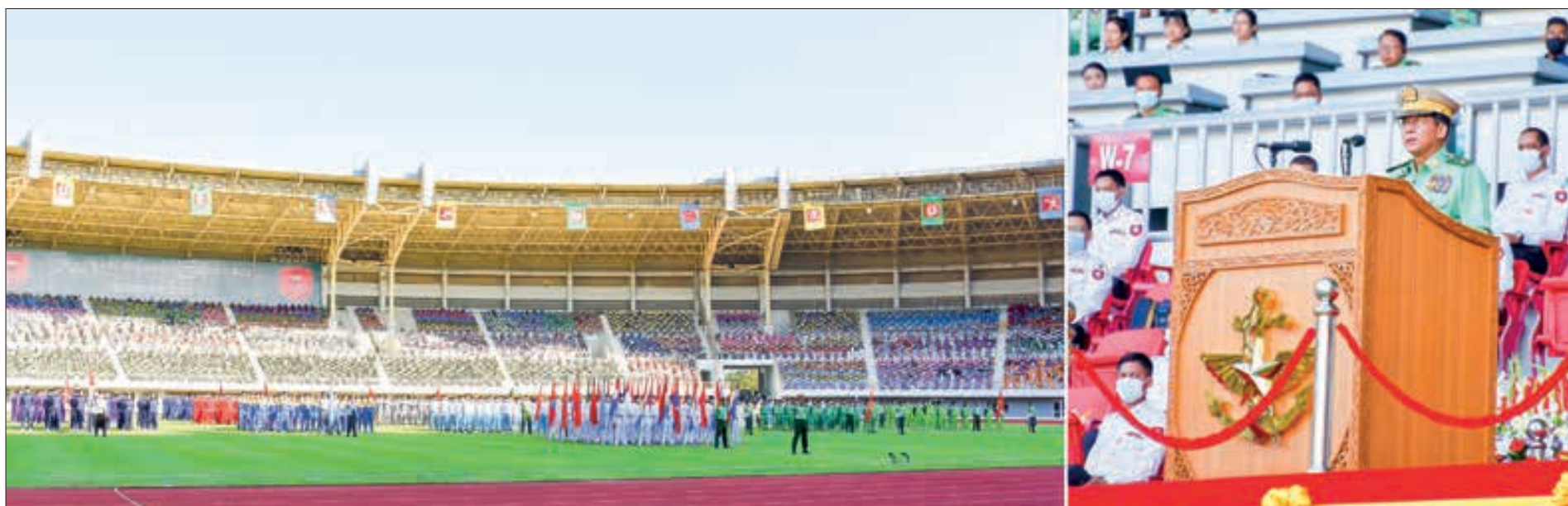
State Administration Council Chairman Commander-in-Chief of Defence Services Senior General Min Aung Hlaing inaugurates the Tatmadaw (Army, Navy and Air) Sports Competition 2022 in Nay Pyi Taw on 14 November 2022.

TODAY'S Tatmadaw (Army, Navy and Air) sports competition is an act of Tatmadaw implementing one of the social objectives adopted by the State: to enhance the health, fitness and education quality of the entire nation. As officials of the State and Tatmadaw will fulfil the needs, Tatmadaw member athletes must forge the sporting spirit and the spirit of unity among the organizations for the State and Tatmadaw, said Chairman of the State Administration Council Commander-in-Chief of Defence Services Senior General Min Aung Hlaing at the opening