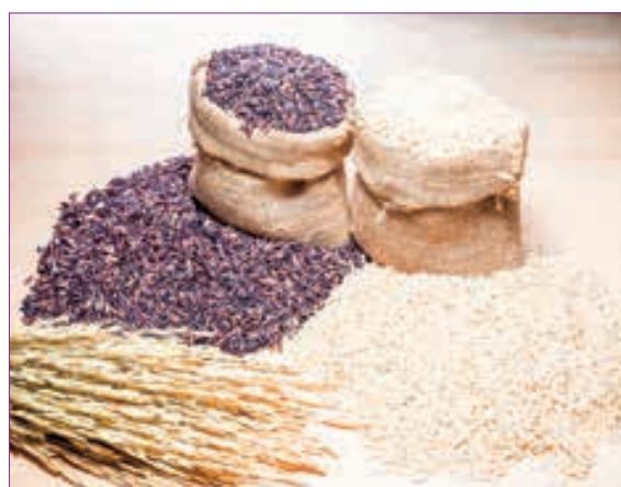
The picture shows sticky rice and snacks made from glutinous rice flour.

In recent days, following the price increase of glutinous rice, the prices of paddy and rice have also moved up. Although glutinous rice is consumed less than rice, the price is rising faster. — TWA/GNLM