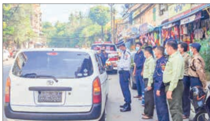
Officials conduct traffic awareness activities in Yangon on 14 November 2022.

AWARENESS activities of road safety, traffic rules, and traffic inspections were conducted yesterday morning near Yoma Bank, East Shwegondine Road, West Ngahtetgyi Ward in Bahan township.