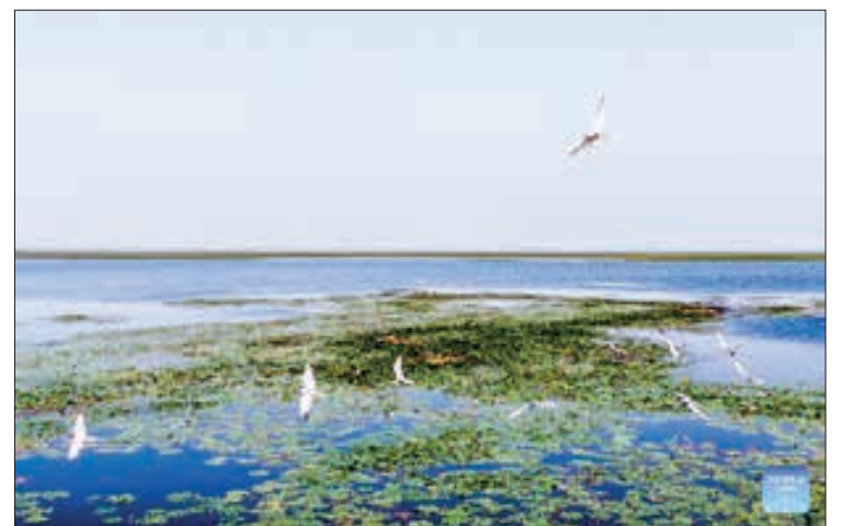
Migratory birds are seen in Chenhu Lake Wetland Nature Reserve in Wuhan, capital of central China's Hubei Province, 4 August 2022.

Among the important outcomes of the gathering were the Wuhan Declaration as well as the Global Strategic Framework for Wetland Conservation 2025-2030. The