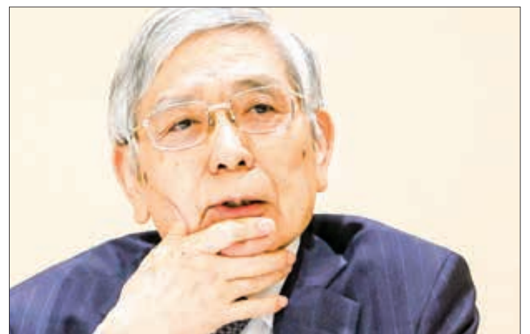
Bank of Japan Governor Haruhiko Kuroda makes a speech at a meeting with local business leaders in Nagoya in Aichi Prefecture, central Japan, on 14 November 2022.

Market participants have been on alert for any signs of slower policy tightening. In recent days, the yen has risen sharply against the US dollar, in a reversal of its sharp decline to a three-decade low, as markets expect the Federal Reserve to be