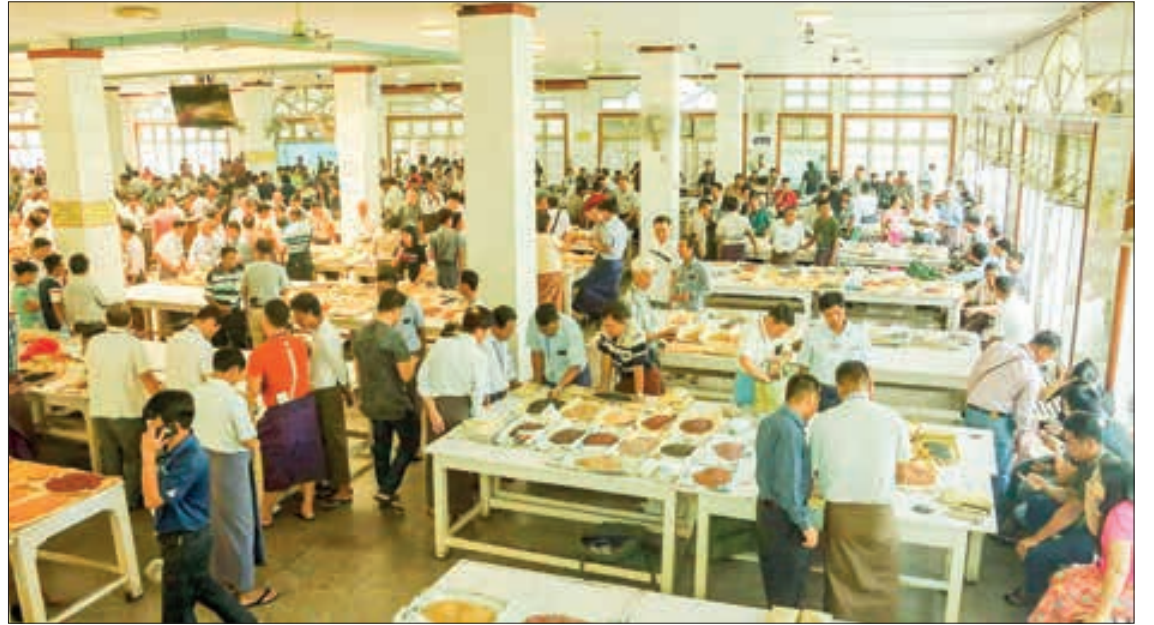
Beans and pulses traders are seen evaluating the products at the bean market.

Myanmar conveyed over 899,541.734 tonnes of various beans and pulses worth $707.799 million to foreign trade partners between 1 April and 28 October 2022 in the current financial year 2022-2023. The country shipped 752,623.804 tonnes of pulses and beans valued at $607.942 million to foreign markets by sea, and over 146,917.930 tonnes valued at $99.857 million