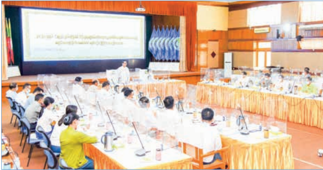
Union Information Minister U Maung Maung Ohn addresses the third coordination meeting in Nay Pyi Taw yesterday.

THE Leading Organizing Committee on Variety Show for Diamond Jubilee Independence Day 2023 held its third coordination meeting in Nay Pyi Taw