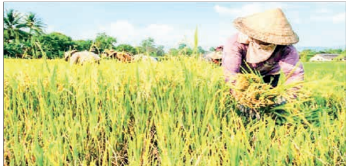
Farmers are pictured harvesting the monsoon paddy.

Cultivation of paddy plays a significant part in the agricultural sector of Myanmar with paddy cultivation accounting for 34 per cent of cultivation of all crops. In 2013, a total of 27 million tons of rice were produced. For all small and big farms within the country of Myanmar, the major paddy is monsoon paddy. The acres of land under cultivation of monsoon paddy were 15 million while the acres of land under cultivation of summer paddy were two million.