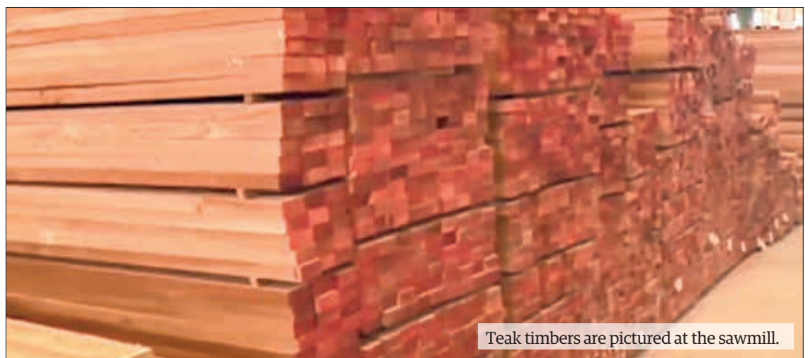
Teak timbers are pictured at the sawmill.

Myanmar bagged US$88.383 million from the exportation of