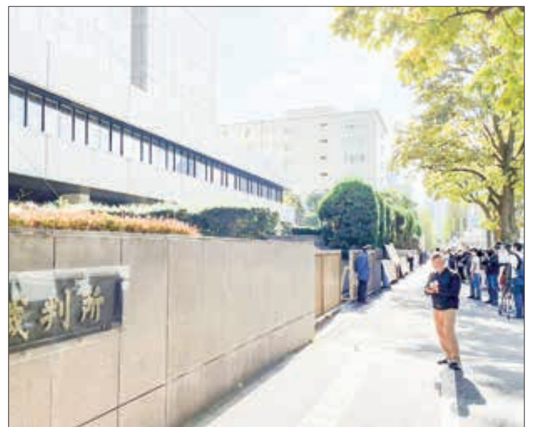
Photo taken 14 November 2022 shows the building (L) which houses the Tokyo District Court and Tokyo High Court in Tokyo’s Kasumigaseki area.

According to police, the Immigration Services Agen-