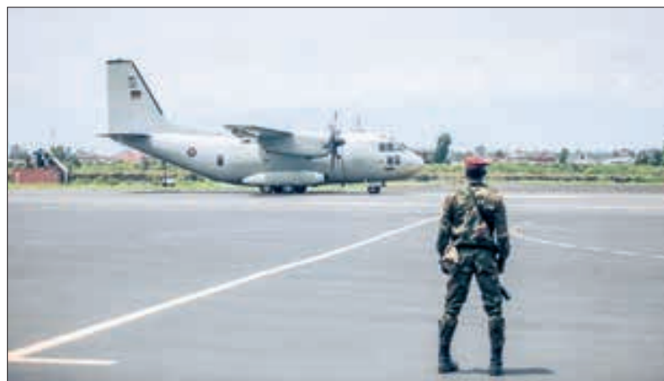
A Congolese soldier watches a Kenyan army plane arriving at Goma airport, eastern Democratic Republic of Congo on 12 November 2022, as part of a regional military operation targeting rebels in the region.

The announcement came as Congolese troops clashed anew with the M23 north of the volatile