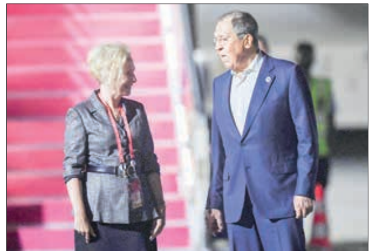
Russia's Foreign Minister Sergei Lavrov (R) arrives to attend the G20 Summit at Ngurah Rai International airport at Tuban, Badung regency on Indonesia's resort island of Bali, on 13 November 2022.

"We're here with Sergei Viktorovich (Lavrov) in Indonesia, reading the wires and we can't believe our eyes," Zakharova said.—AFP