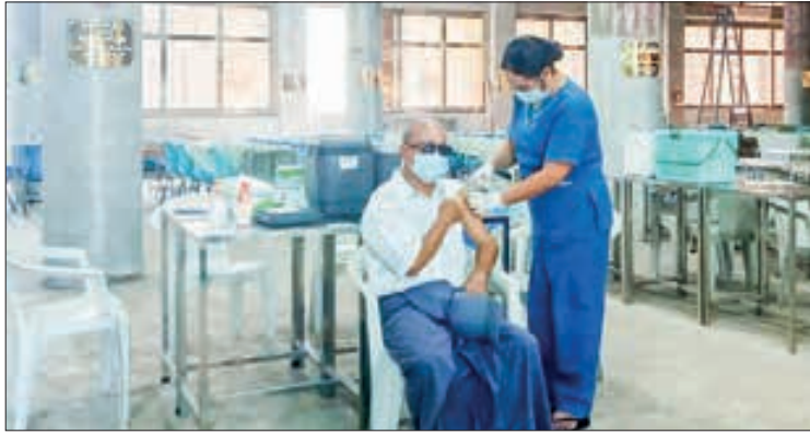
A local from Yankin Township in Yangon Region gets jabbed against COVID-19 on 14 November.

VACCINATION is being carried out in full swing in various regions and states as the vaccination programmes are one of the most important activities in the prevention, control and treatment of COVID-19 disease.