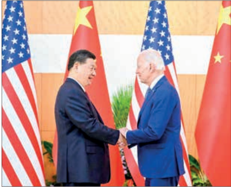
Chinese President Xi Jinping meets US President Joe Biden upon request in Bali, Indonesia, 14 November 2022.

CHINESE President Xi Jinping said on Monday here during a meeting with his US counterpart, Joe Biden, that as leaders of two major countries, they need to set the right course for bilateral ties.