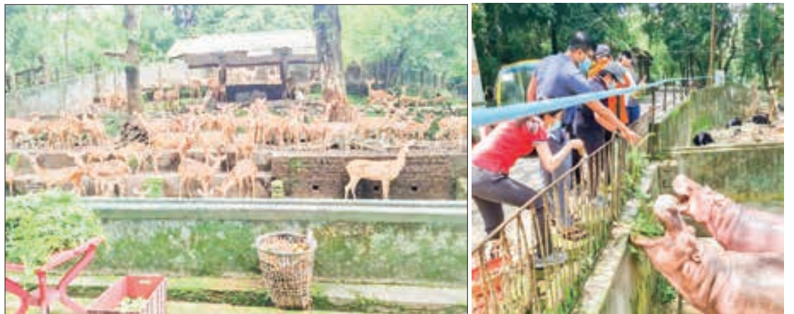
Visitors feed zoo animals.