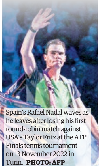
Spain’s Rafael Nadal waves as he leaves after losing his first round-robin match against USA’s Taylor Fritz at the ATP Finals tennis tournament on 13 November 2022 in Turin.

The year-ending Finals is the only major trophy missing from tennis icon Nadal’s list of honours but his straight-sets loss means he will struggle to escape the round-robin stage.—AFP