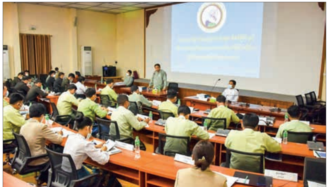
The coordination meeting on voter lists and polling stations is in progress in Mandalay Region.

THE Union Election Commission (UEC) is continuously conducting the election process that must be prepared to hold a free and fair multiparty democratic general election and obtain the right to vote freely under the law.