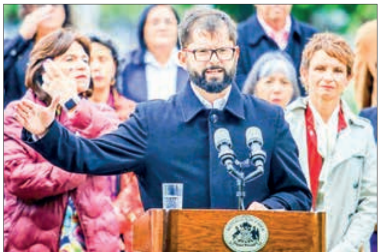
Chile's President Gabriel Boric announced the creation of a commission to resolve issues of Indigenous land ownership while meeting with Mapuche leaders.

CHILE President Gabriel Boric met with Mapuche Indigenous leaders on Friday and announced the creation of a commission to resolve issues of land ownership in the flashpoint southern Araucania region, which has seen a