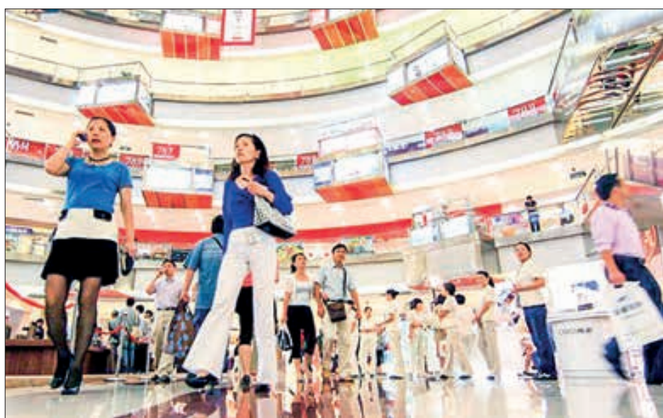
China's shopping sales from the Singles Day holiday could top a record one trillion yuan ($140 billion).

"Chinese consumers have become more rational and no longer hoard large amounts of goods like they did in years gone by", economist Song Qinghui told AFP.—AFP