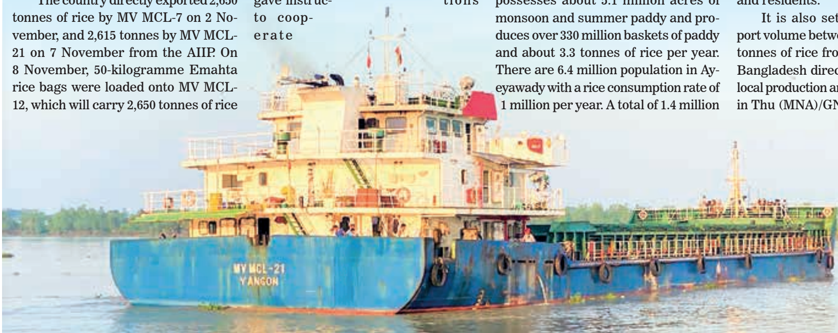
The vessel loaded with 2,615-tonne export rice onboard is seen sailing to Bangladesh from the Ayeyawady International Industrial Port in Patheingyi.

It is also set to increase the export volume between 30,000 and 100,000 tonnes of rice from AIIP in Patheingyi to Bangladesh directly depending on the local production and rice surplus.—Nyein Thu (MNA)/GNLM