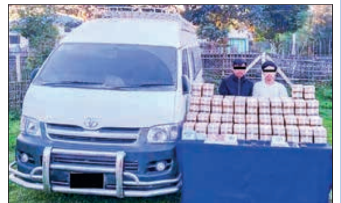
Two offenders are seen together with seized drugs and a Toyota HiAce.

According to interrogation results, stimulant tablets were transported from Kunhing township to Tachilek township. Legal action is taken against them and the Myanmar Police Force is trying to expose those connected with the offenders. — MNA