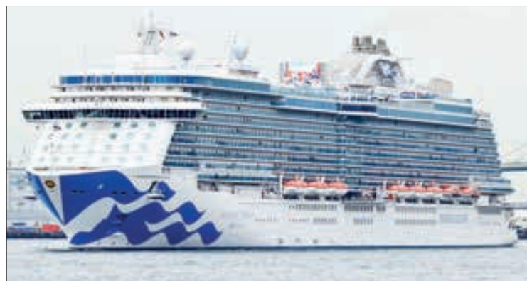
The ship had just finished a 12-day tour of New Zealand - having dropped anchor in ports around Auckland, Wellington, Dunedin, Bay of Islands, and Fiordland National Park. PHOTO: MAJESTIC PRINCESS

A cruise ship named Majestic Princess docked in Sydney on Saturday morning, with at least