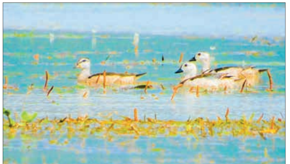
Winter migration of bird and duck species begins in Inlay Lake in October 2022.