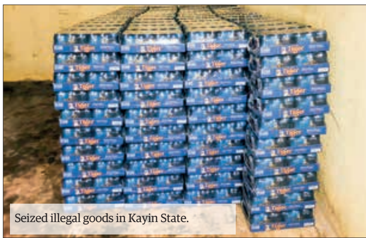
Seized illegal goods in Kayin State.

On 11 November, the Ma-yanchaung Permanent Checkpoint in Mon State captured 1,200 kilogrammes of high-density polyethylene worth K2,016,000