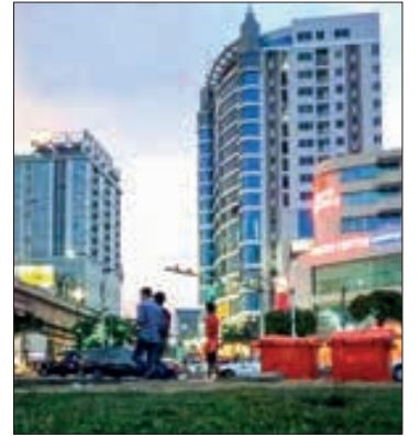
The view of the Myaynigon traffic light and its vicinity.