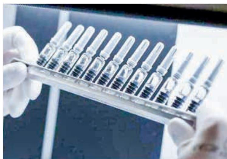
A trial of 162 adults given the Sanofi-GSK booster showed that it triggers a higher production of antibodies against the Omicron BA.1 subvariant than Pfizer's jab.

Fitzgerald also noted that the company has been assisting guests infected with COVID-19 to access private transport and accommodation to complete their isolation period.—Xinhua