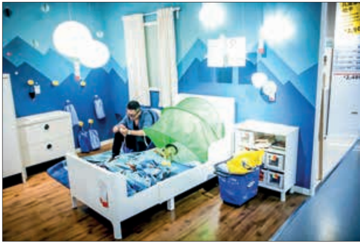
A father, escaping the heat in Shanghai, has his son nap in an air-conditioned Ikea store. Nighttime temperatures are rising, and they can interfere with sleep and health if homes don't cool off.

But quantifying the overall impact is an extremely complicated task, experts told AFP, because global warming affects health in many different ways, from the immediate dangers of rising heat and extreme weather to longer-term food and water