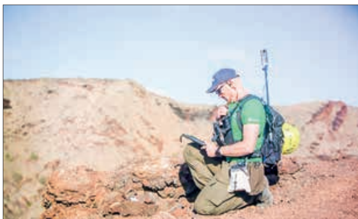
‘If we run into a problem, we have to solve it ourselves,’ says astronaut Alexander Gerst.

With its blackened lava fields, craters and volcanic tubes, Lanzarote’s geology can