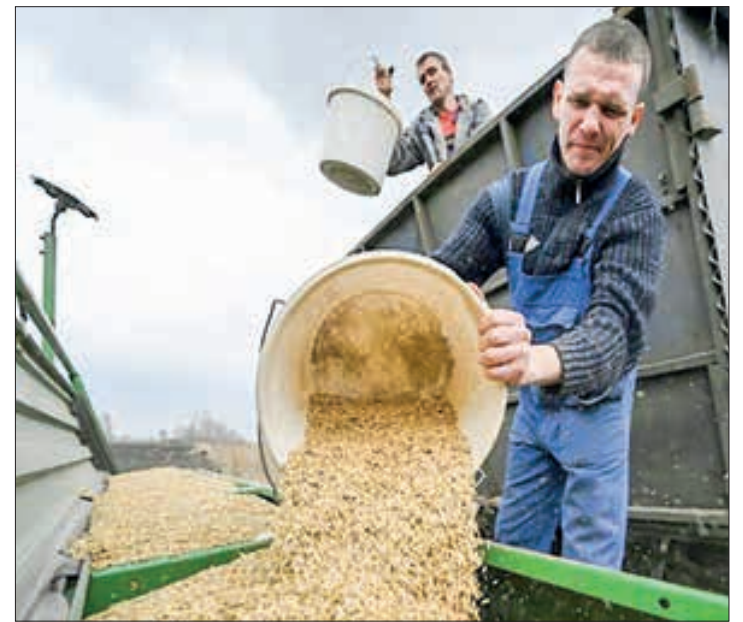
Farmers load oat in the seeding-machine to sow in a field east of Kyiv.

Moscow, however, has not yet said whether it will agree to that. —AFP