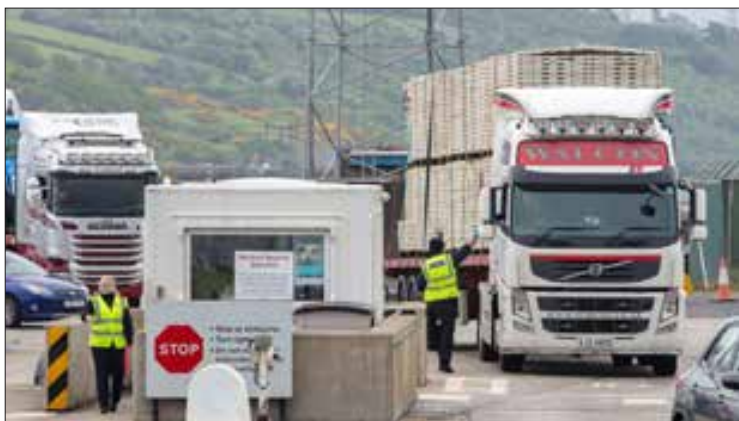
The deal kept Northern Ireland in the European single market and customs union, stipulating checks on goods moving from the rest of the UK to Northern Ireland.

IRISH prime minister Micheal Martin on Friday said there was "a window of opportunity" for Britain and the European Union to resolve a dogged dispute over post-Brexit trade in Northern Ireland.