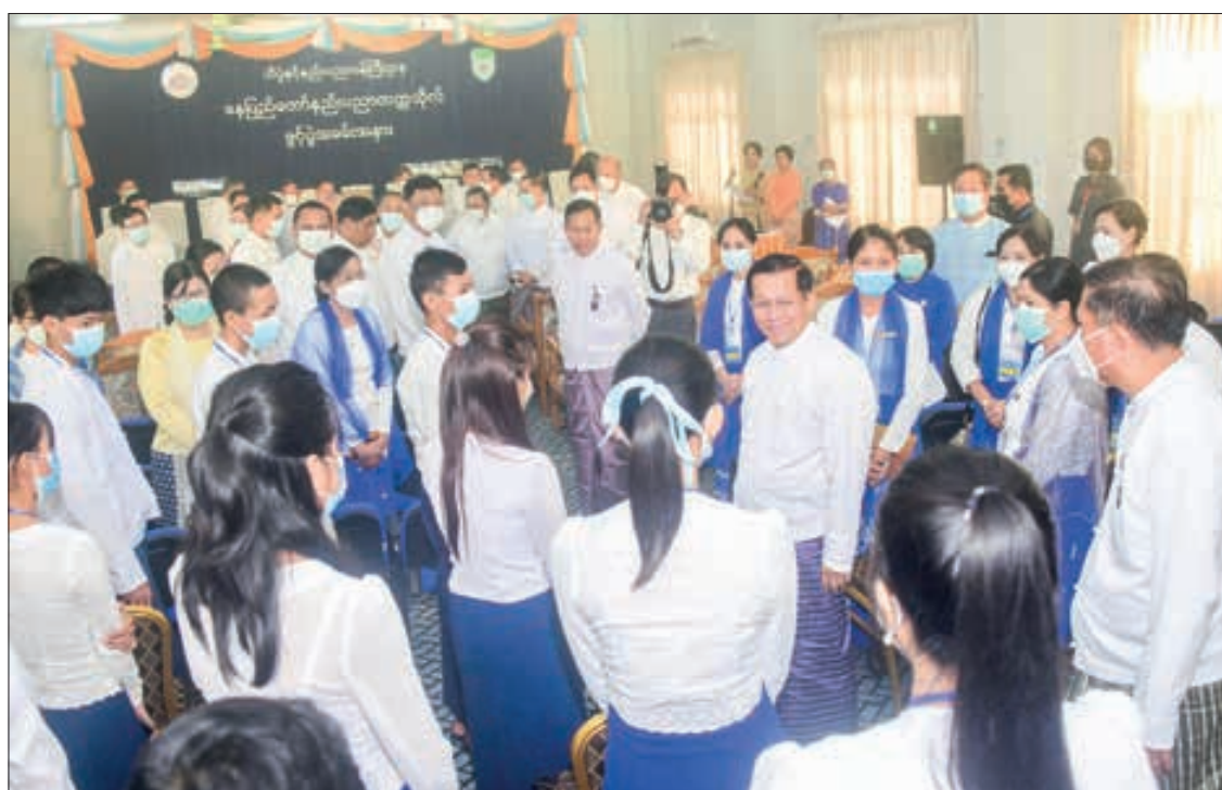
The Senior General warmly greets the attending teachers and students at the event.

The Nay Pyi Taw Technological University will be facilitated with Information and Communication Technology and a learning management