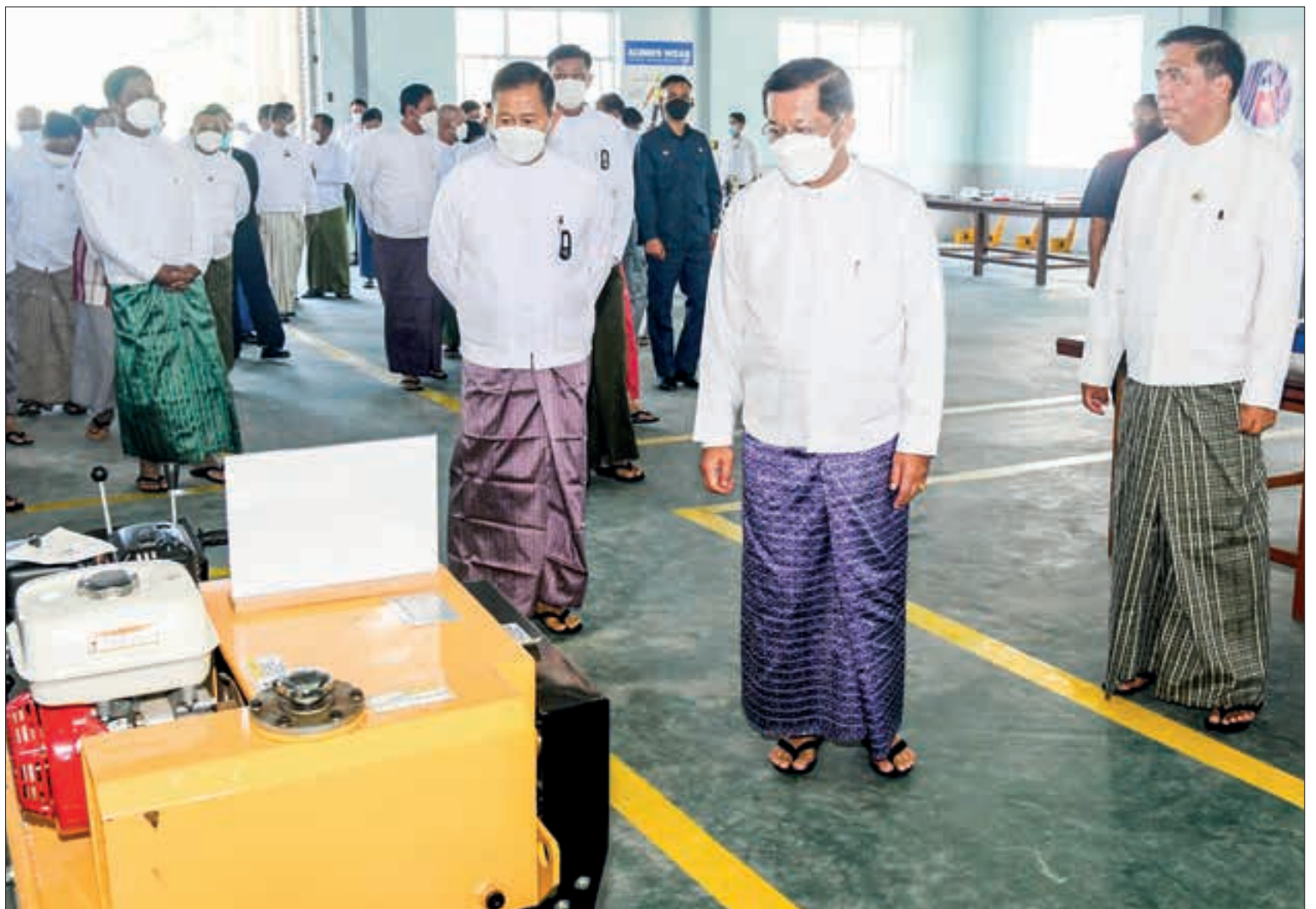
State Administration Council Chairman Prime Minister Senior General Min Aung Hlaing views round the mechanical engineering workshop at the Nay Pyi Taw Technological University yesterday.