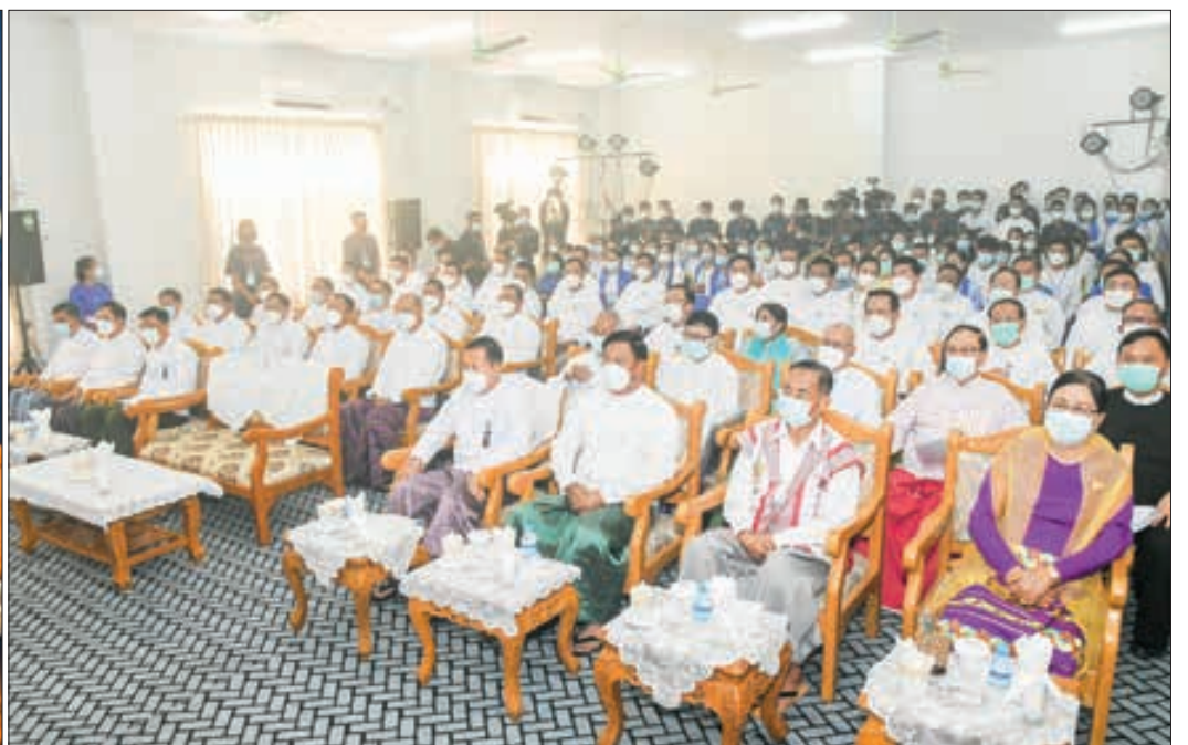
State Administration Council Chairman PM Senior General Min Aung Hlaing addresses the inaugural event of the Nay Pyi Taw Technological University on 12 November 2022.