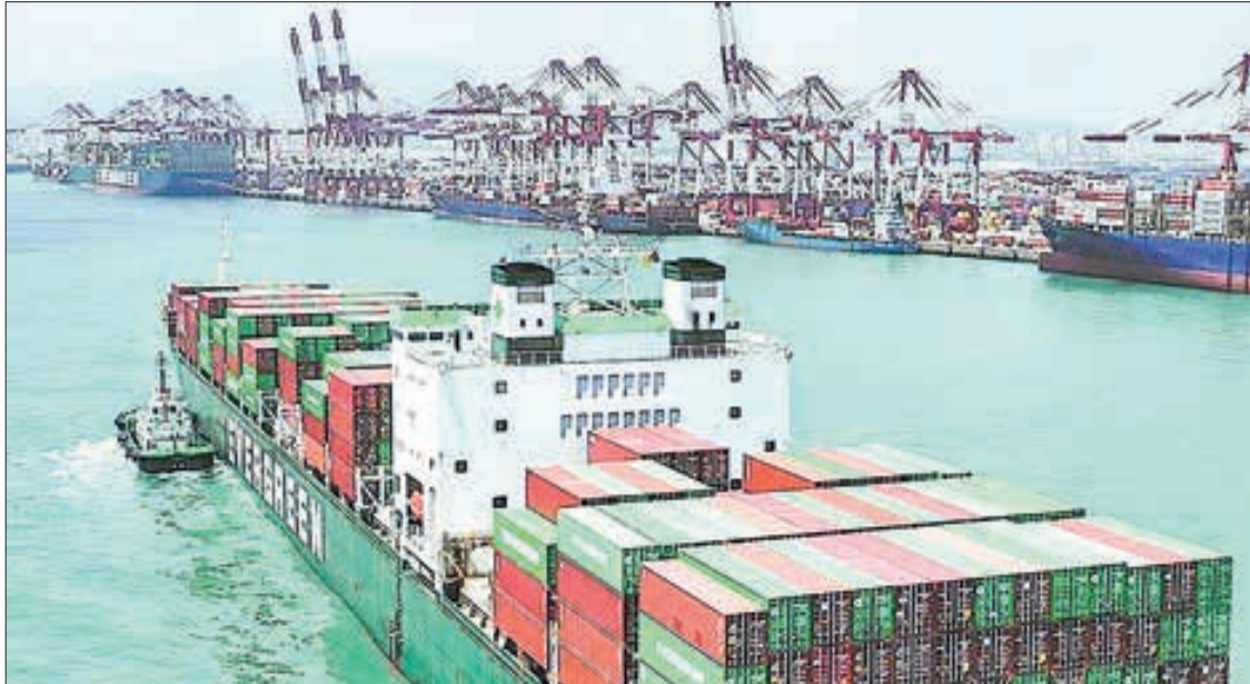
Singapore is an important source of foreign investment for China, and the bilateral trade is expected to achieve a new breakthrough. A container ship sails into the Qingdao Port on 2 June 2022.

CHINESE Premier Li Keqiang on Friday met Singaporean Prime Minister Lee Hsien Loong, who is in Phnom Penh for the leaders' meetings on East Asian cooperation.