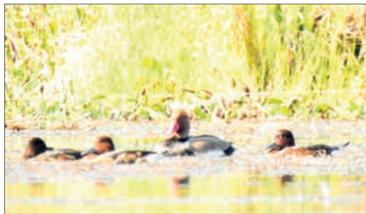
World's endangered duck species—Red-crested Pochard.

The migratory birds from the North Pole take refuge at new locations during winter to escape from the extreme weather. The migratory birds entering Inlay wildlife sanctuary are from Siberia and 15 migratory bird species enter the lake starting in October this winter. — Nyein Thu (MNA)/GNLM