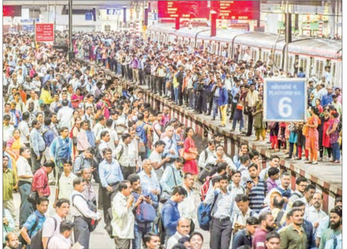
The global population is expected to reach eight billion people by mid-November, and India will be the most populated country.

He noted that billions of people are struggling, hundreds of millions are facing hunger and even famine, and record numbers are on the move seeking opportunities and relief from debt and hardship, wars and climate disasters. "Unless we bridge the yawning chasm between the global haves and have-nots, we are setting ourselves up for an eight-billion-strong world filled with tensions and mistrust, crisis and conflict," wrote Guterres. —Xinhua