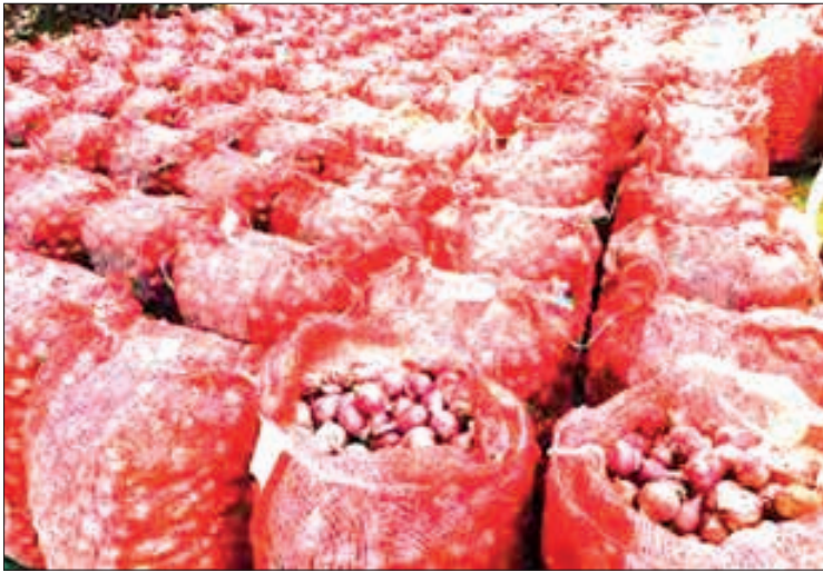
New monsoon onions are seen in the market.

The onion prices become higher as there were demands from Bangladesh in 2019 and Viet Nam in 2022.—TWA/GNLM