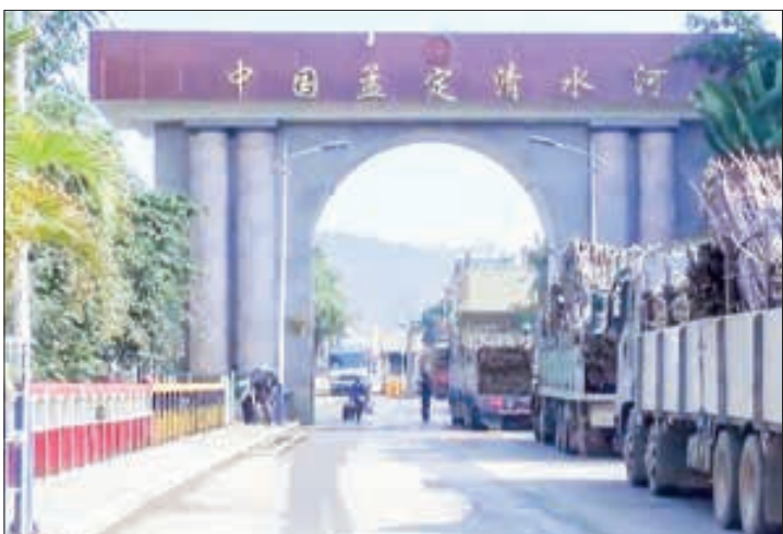
The picture shows the Chinshwehaw border checkpoint.

THE Yunnan provincial government launched the China-Myanmar new freight transport model with one bill of lading for 20 land border points, according to the statement released by the Chinese Embassy in Myanmar.