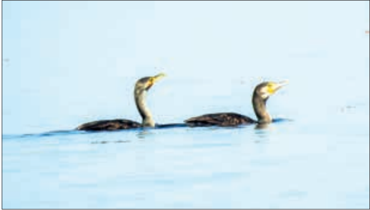
World's endangered aquatic bird species—Great Commonnant.

INLAY Lake, Myanmar's second-largest lake, located between two mountain ranges spanning from south to north is a Ramsar site and various marine animals and bird species live there, and 15 migratory bird species enter the lake starting in October.