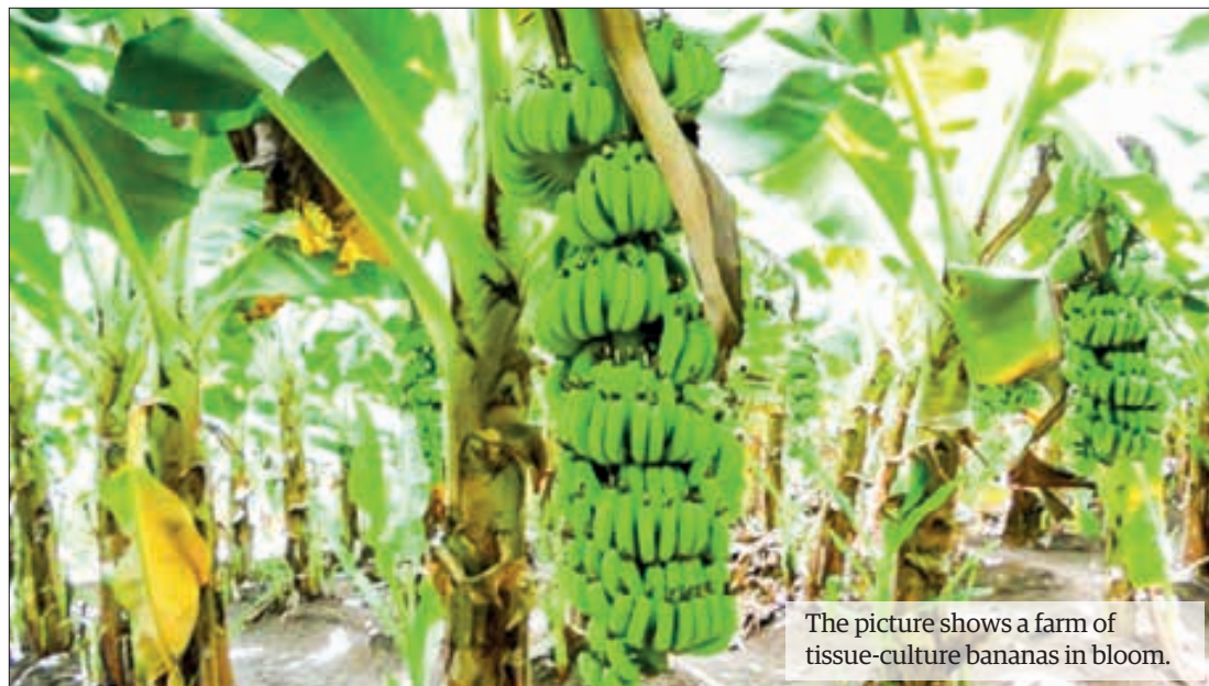
The picture shows a farm of tissue-culture bananas in bloom.

Among those agricultural products registered with the GACC, the products that have a government-to-government agreement grasp a strong market share.—TWA/GNLM