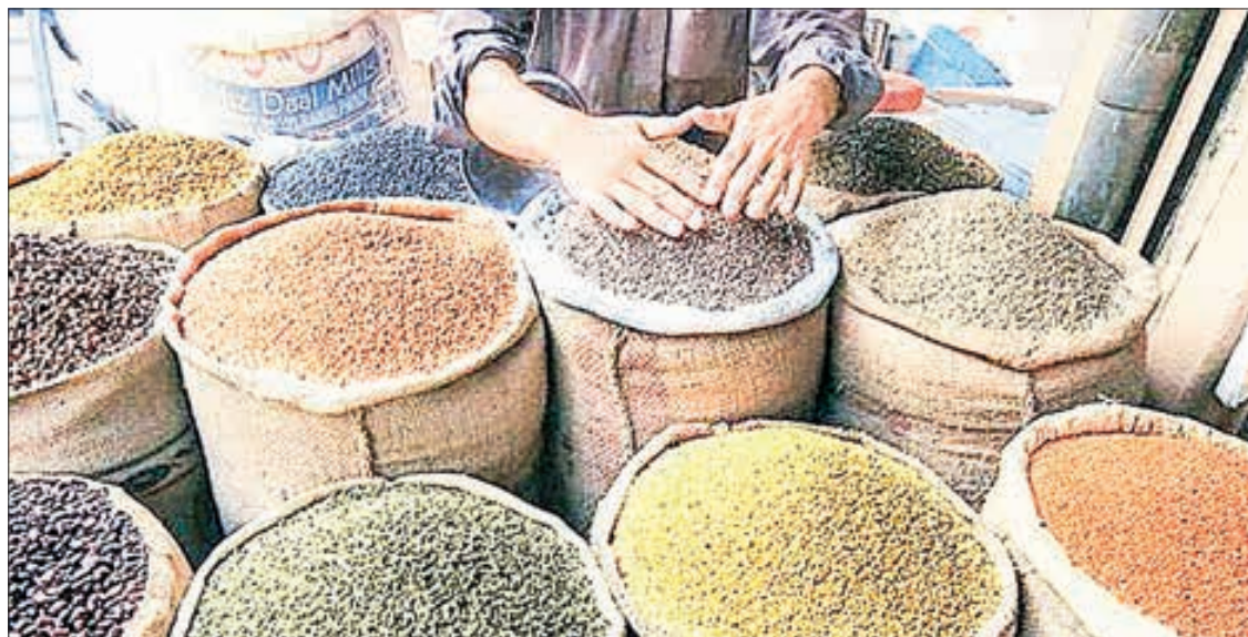
The photo shows one bean outlet in Yangon.

K1,990,000 while K2,120,000 on 31 August, K2.1 million on 5 September, K2,075,000 on 6 September and K2,130,000 on 27 September. Forty-five days later, the prices reached below K1.9 million.