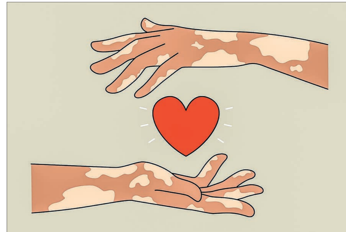
Love and kindness are never wasted.

Middle school was tough for both of us - for completely different reasons. I was struggling with my self-confidence and recovering from abuse; she was struggling with her gender identity. I couldn't tell you when she made the switch. Maybe it was when she stopped wearing feminine clothes, or maybe it