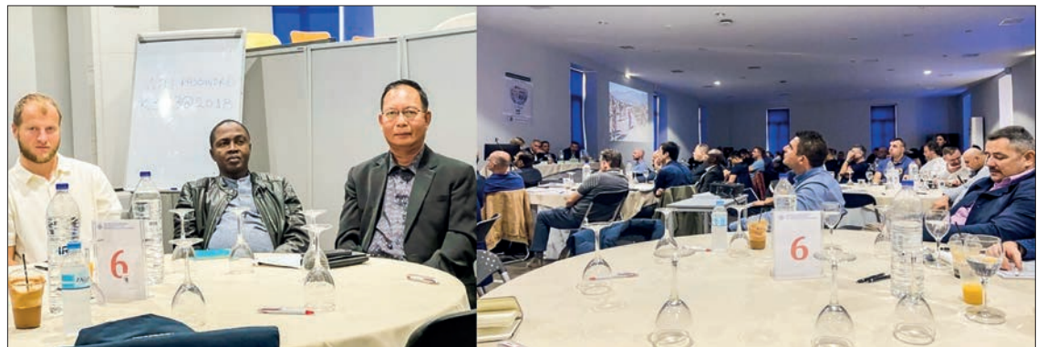
The International Negotiators Working Group-Annual Conference 2022 is held in Athens, Greece.

ences of negotiation regarding arrests as hostages and kidnappings and the latest developments and strategies were discussed by experts, psychologists and negotiating forces from police forces from several countries, Federal Bureau of Investigation (FBI), Centre for Security Studies/Kentro Meleton Asfaleias – KEMEA from Greece, the Foundation for Defence of Democracies and the Fletcher School of Law and Diplomacy/Tufts University from the United States, London Metropolitan Police, National Crime Agency – NCA, Global Interagency Security Forum – GISF and the College of Policing from the United Kingdom and European Network of Advisory Teams – EuNAT.