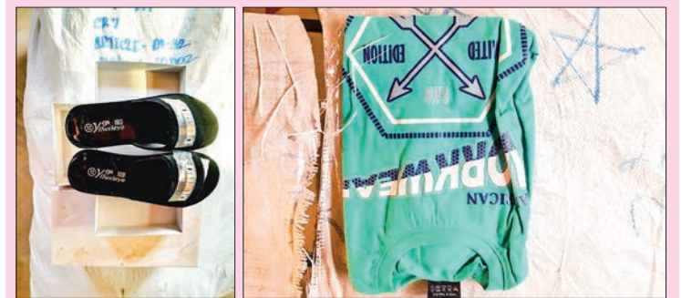
Officials check confiscated illegal teak log (top photo). Seized illegal goods (above).