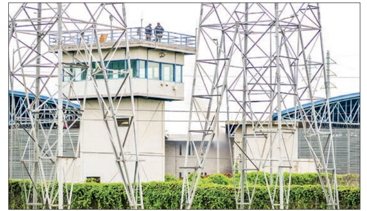
The jail is home to 1,300 male inmates.

Quito had until now escaped the violent gang battles — a spillover from a drug war in the country — which have left around 400 inmates dead since February 2021. Many have been beheaded or burned in the clashes in overcrowded prisons, where corruption allows inmates to get their hands on guns and explosives.—AFP