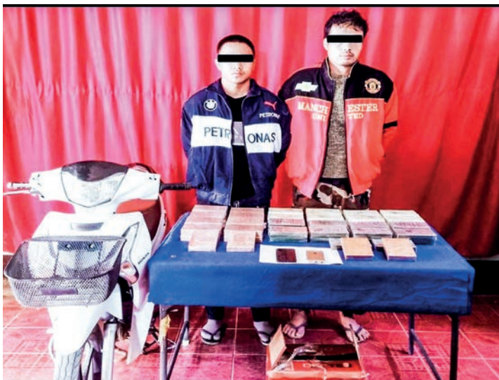
Two offenders are seen together with confiscated heroin and a motorbike.

They were prosecuted under the Anti-Narcotic Drugs and Psychotropic Substance Law. — MNA