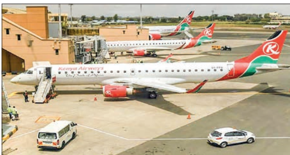
A picture taken through a window shows Kenya Airways planes parked at the parking bay at the Jomo Kenyatta international airport in Nairobi on 1 August 2020.

The data breach of Medibank — one of Australia's largest insurers — included 1.8 million international customers.