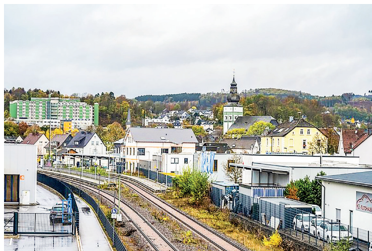
The child was found in Attendorn in the German Sauerland region.

IN Attendorn, in the Sauerland region in Germany, an eight-year-old girl is said to have been locked away by her mother and grandparents for most of her entire life.