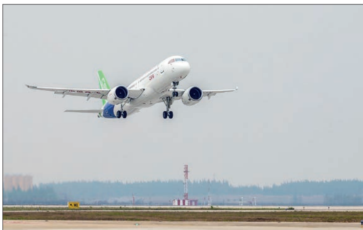
Gulor at the end of September, with the first aircraft expected to be delivered by the end of 2022, according to Xinhua News Agency.

CHINA on Tuesday showed off its first domestically produced large passenger jet after the aircraft was approved by regulators, unveiling the C919 at a major airshow. The sleek, narrow-body