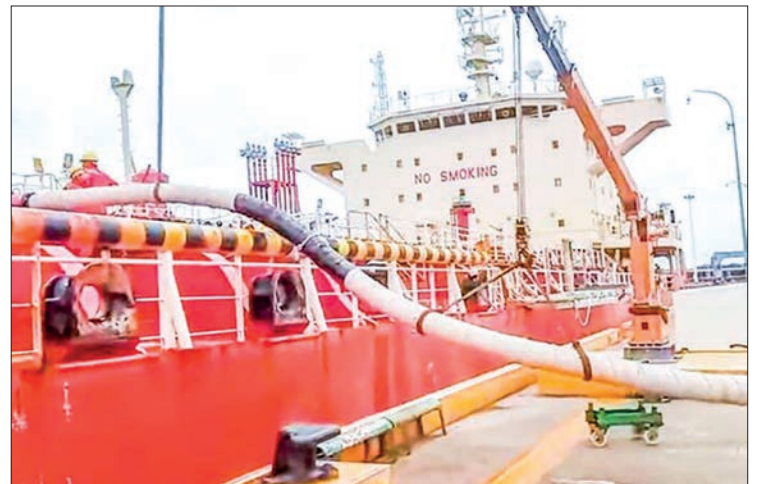
MT Yu Yi is seen during fuel unloading operations.

week, it has been observed that the price of petrol has increased slightly and the price of diesel has decreased slightly.