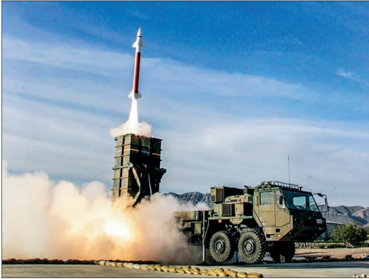
File photo shows a Type-03 intermediate-range surface-to-air missile.