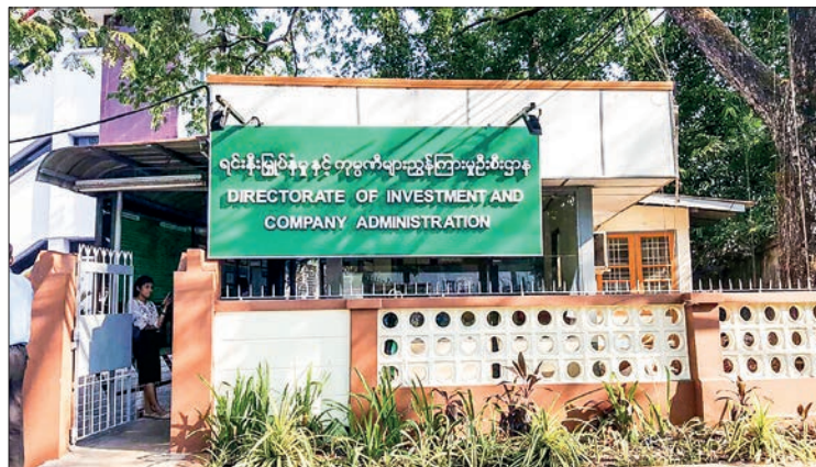
The office of the Directorate of Investment and Company Administration in Yangon.

As a result of this, newly established companies are required to submit ARs within two months of incorporation or face a fine of K100,000 for filing late returns. The DICA has notified that any company which fails to submit its AR within 13 months will be notified of its suspension (I-9A). If it fails to submit the AR within 28 days of receiving the notice, the system will show the company's status as sus-