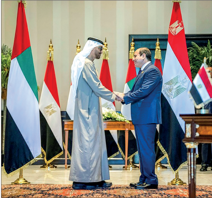
UAE President Sheikh Mohamed bin Zayed al-Nahyan, on the left, and Egypt's President Abdel Fattah el-Sisi shake hands after a ceremony to sign a memorandum of understanding to build a 10-gigawatt onshore wind project in Egypt.

THE United Arab Emirates and Egypt agreed Tuesday to develop one of the world's largest wind farms in a deal struck on the sidelines of the UN's COP27 climate summit in Sharm el-Sheikh.