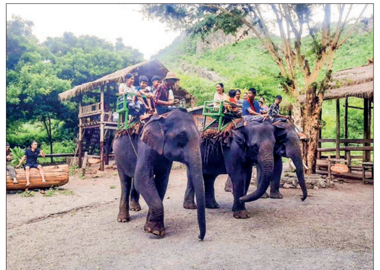
Visitors enjoy elephant rides at the camp.

At the Wahnet Elephant Camp, visitors can ride the elephants and see the forest scenery and it is providing services such as showing the