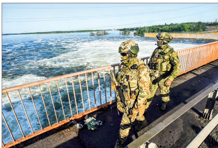
In this file photo taken on 20 May 2022 Russian servicemen patrol at the Kakhovka Hydroelectric Power Plant, Kherson Oblast, amid the ongoing Russian military action in Ukraine.

“Everything is under control. The main air defence strikes were repelled, one missile hit (the dam), but did not cause critical damage,” Ruslan Agayev, a representative of the Moscow-installed administration of nearby