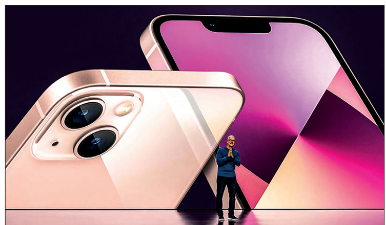
Apple CEO Tim Cook unveils the new iPhone 13 during a special event at Apple Park on 14 September 2021.

"Customers will experience longer wait times to receive their new products." Foxconn is China's biggest private sector employer, with more than a million people working across the country in about 30 factories and research institutes.—AFP