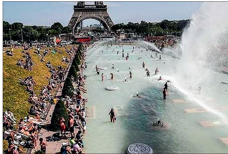
Extreme temperatures caused heat stress, which had become the leading weather-related cause of death in Europe. People bathe in the Trocadero Fountain near the Eiffel Tower in France on 28 June 2019.