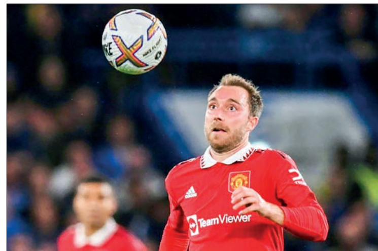
Manchester United Christian Eriksen is in Denmark's initial 21-man squad with five more players still to be named.

Eriksen spent eight months out of the game after collapsing in Denmark's opening game of the European Championships against Finland in Copenhagen on 12 June last year.