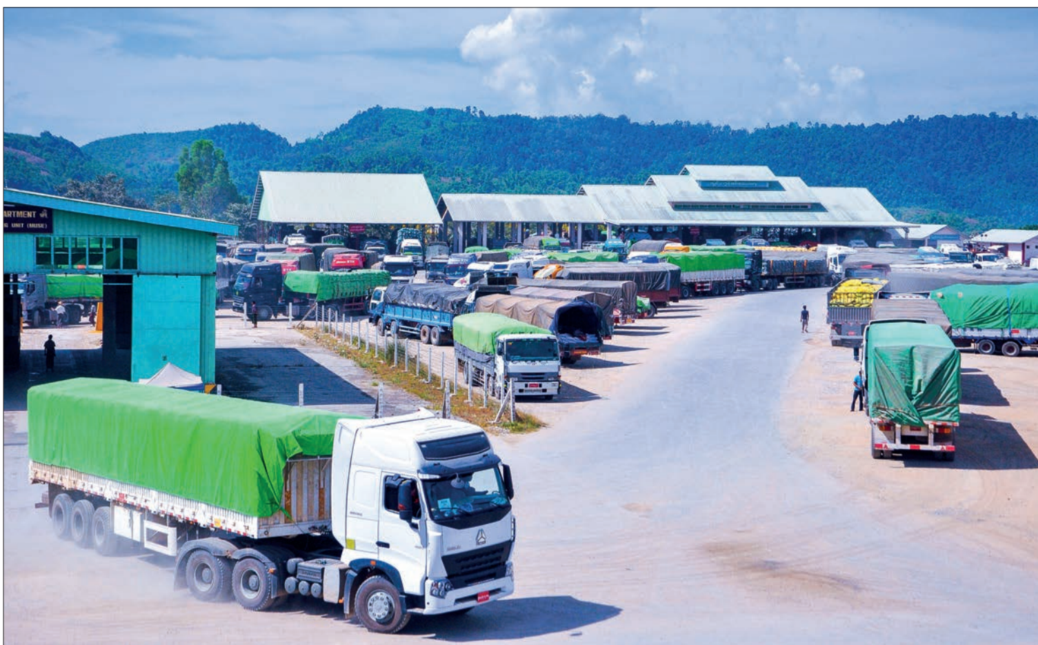
Lorries loaded with export cargoes are pictured at the Muse trade post on the Myanmar-China border.

M ORE than 600 companies including rice, broken rice, corn and banana exporting firms are making efforts to register with the General Administration of Customs of the People's Republic of China to export over 1,600 items.