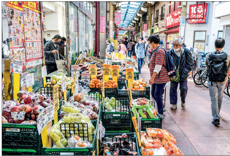
The government's new economic package is designed to mitigate the pain on households and businesses of rising prices.

The government is expected to submit the extra budget plan to parliament in mid-November to have it approved before the current session ends in early December. Work to compile a separate draft budget for the next fiscal year from April is set to accelerate toward year-end. The total size of the economic package will be 71.6 trillion yen, which includes 39.0 trillion yen in fiscal spending by the government and local