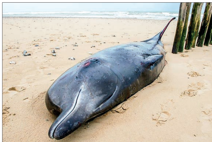
Northern beaked whales are rarely seen this far south of the Arctic.

Experts had ruled out lifting the animal back into the water, hoping that the tide would allow the animal to refloat and swim away, he said.—AFP