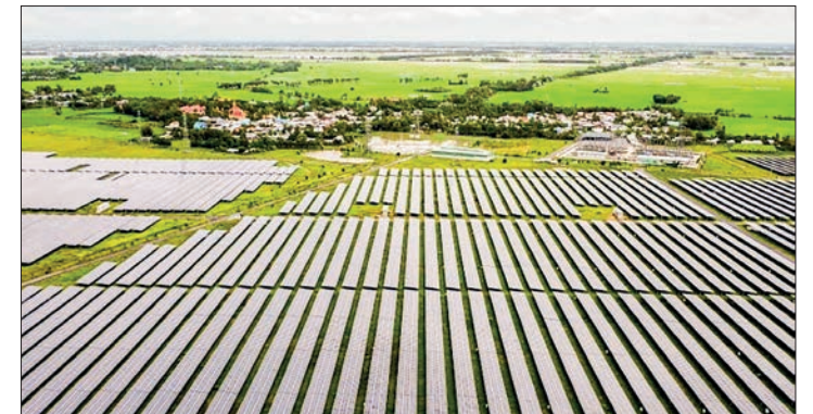
Despite Viet Nam's solar boom and ambitious climate targets, the fast-growing economy is struggling to quit dirty energy.

After China and India, Viet Nam has the world's third-largest pipeline of new coal power projects. But at COP27 this week, G7 countries could announce billions of dollars in funding to help steer Viet Nam away from fossil fuels and the country could attract billions more in clean energy investment as part of the Just Energy Transition Partnership.— AFP