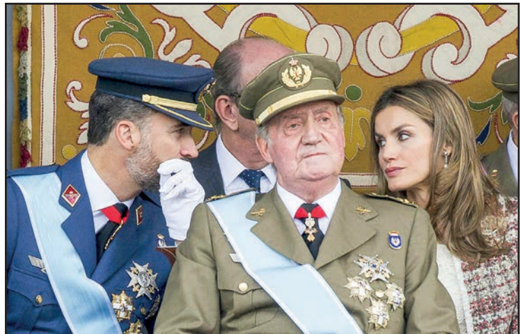
King Juan Carlos with his son, Felipe, and Felipe's wife Letizia in 2012. Juan Carlos abdicated in 2014 and has been living in Abu Dhabi since 2020.

SPAIN'S former king Juan Carlos I on Tuesday resumes a UK court battle over harassment claims by his former lover, seeking confirmation of his legal immunity as a royal.