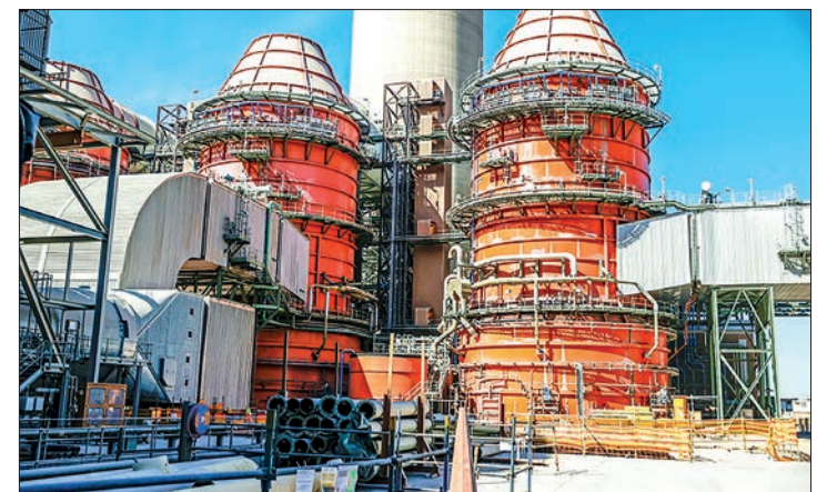
Africa's biggest economy relies on coal for 80 per cent of its electricity generation. A general view of absorbers at the Kusile Power Station, a coal-fired power plant located on the Hartbeesfontein Farm in Malahleni.

The nations providing the $8.5 billion, known collectively as the International Partners Group, said the funding will go towards decommissioning coal power plants and investments to accelerate the deployment of renewable energy.—AFP