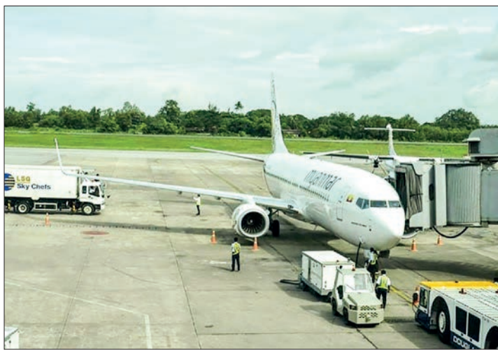
One of the MNA aircraft for the Yangon-Bangkok -Yangon flight.

The MNA started its first flight (Yangon- Bodh Gaya-Yangon) for the pilgrimage season of Bodh Gaya on 4 November and will be continued on a weekly basis depending on the availability of passengers, it is learnt. — TWA/GNLNM