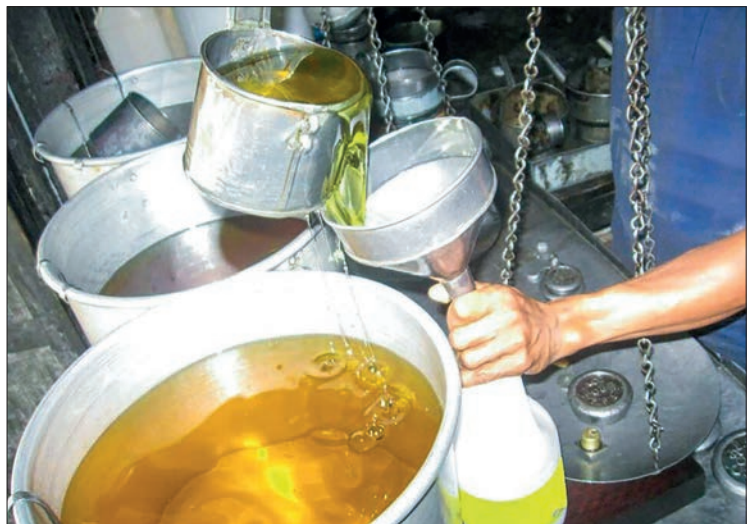
The domestic consumption of edible oil is estimated at one million tonnes per year.

THE wholesale reference rate of palm oil in the Yangon market continued to rise at K4,330 per viss (a viss equals 1.6 kilograms) this week, according to the Supervisory Committee on edible oil import and distribution.