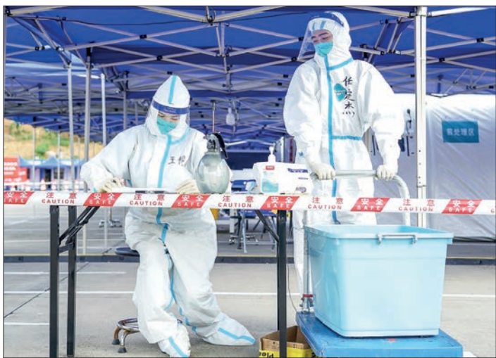
Medical workers of an air-inflated testing lab prepare to receive nucleic acid samples in Chengdu, southwest China's Sichuan Province, 5 Sept 2022.

The regulations, with 19 articles, have, for the first time, defined the concept of occupational exposure of medical and health personnel from the legislative level. They will provide a legal guarantee for safeguarding the legitimate rights and interests of medical workers.—Xinhua