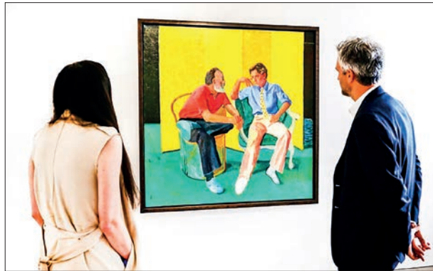
Christie's will sell David Hockney's "The Conversation" from the late Paul Allen's art collection.

He amassed a huge art collection which he used to lend to museums before his death in 2018 at