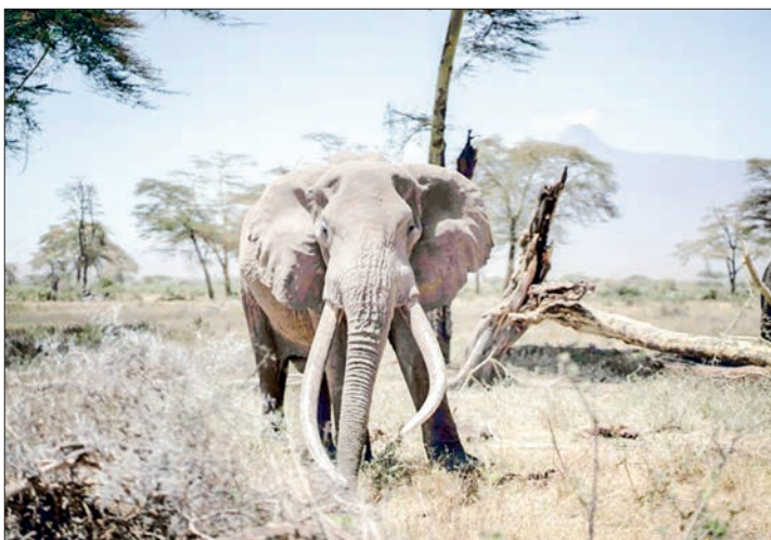
A bull elephant roams in Kimana sanctuary Kajiado south sub county on 25 September 2022.