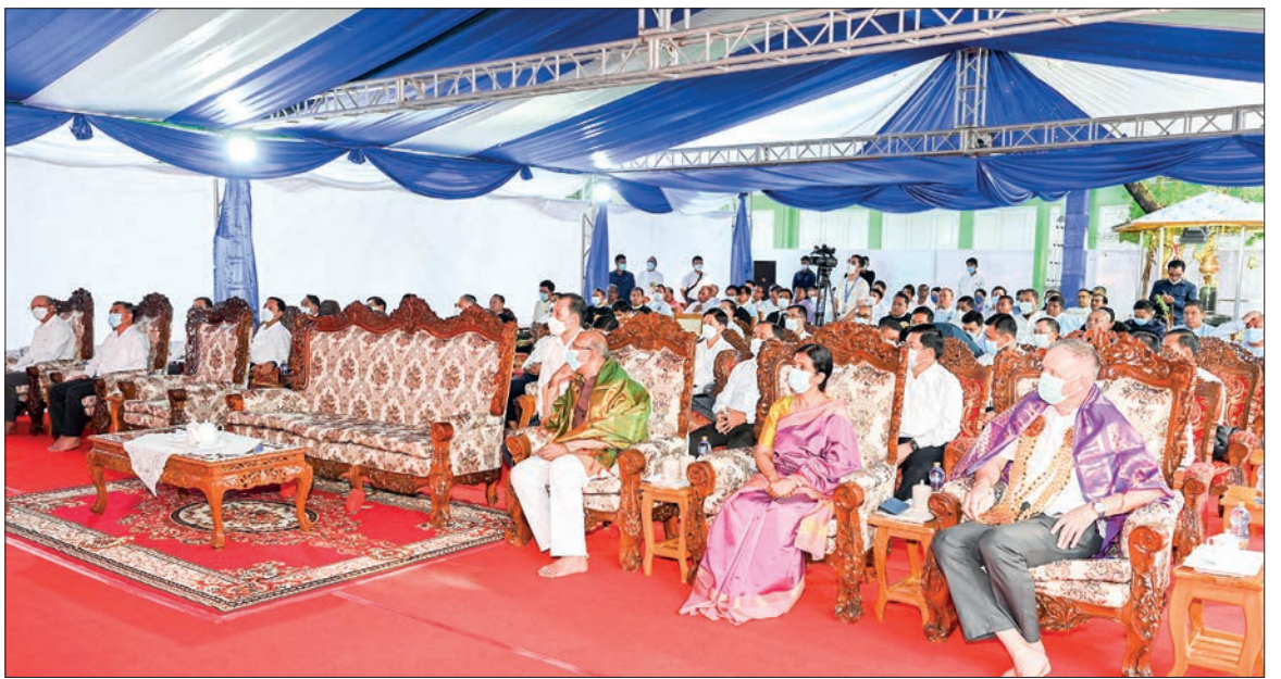
SAC Chairman Prime Minister Senior General Min Aung Hlaing delivers speech as Deepavali lighting festival in Yangon on 6 November.