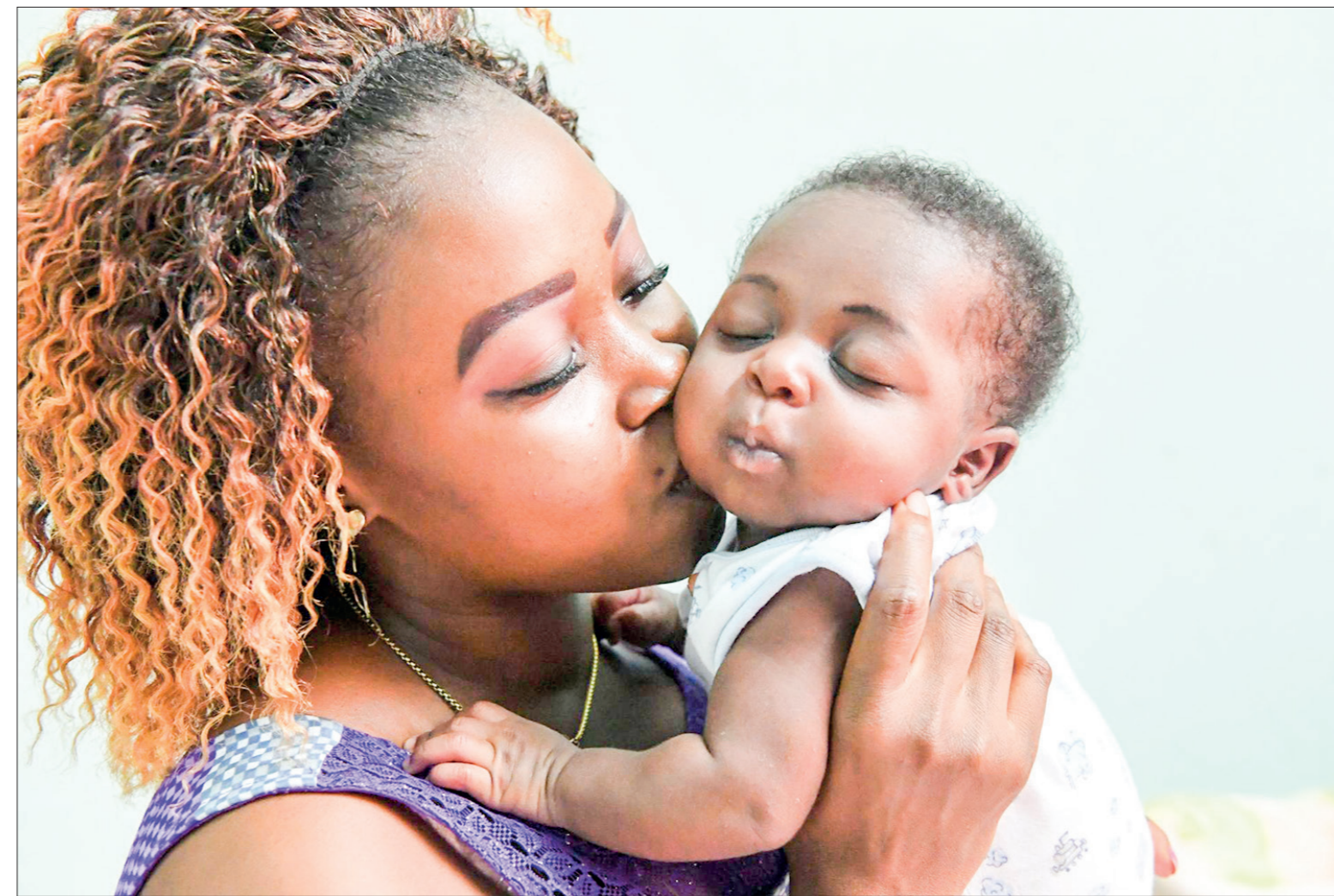
The number of infected people in a household was the factor most closely linked with the infant's likelihood of being infected. PHOTO: REPRESENTATIONAL IMAGE/UNICEF/UNO241753/DEJONGH

In all, about half of the infants of COVID-positive mothers developed symptoms or anti-