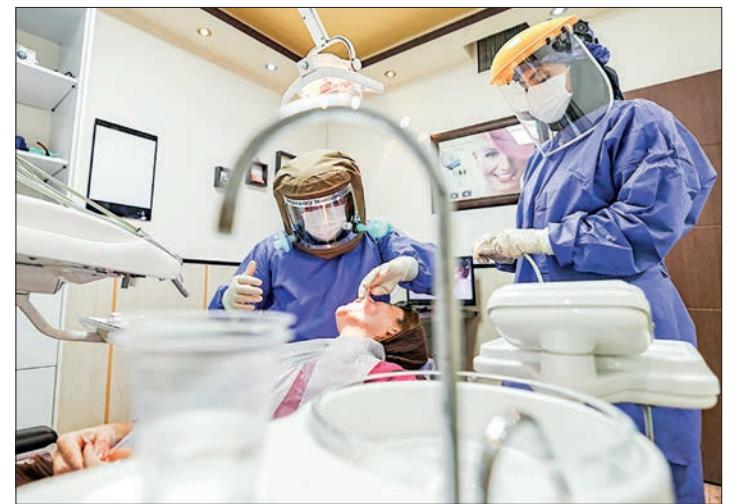
A dentist and an assistant in Iran work in full personal protective equipment to treat a patient during the COVID-19 pandemic.

The ministry said it would continue to monitor the arrival of tourists and local citizens from overseas and would step up efforts to detect any possible infected cases. —Xinhua