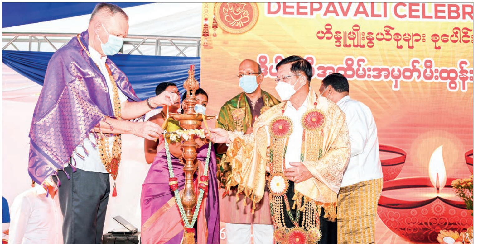
SAC Chairman Prime Minister Senior General Min Aung Hlaing, the Indian Ambassador and wife and the Russian Ambassador ignite oil lamp to mark Deepavali festival at Shree Maha Lakshmi Temple in Yankin Township of Yangon Region on 6 November.