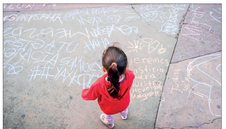
File photo of a child looking at messages written during vigil and protest held by migrants and advocates to remember the migrants who died on their travel to the United States, during the Day of the Dead celebrations in Tijuana, Baja California state, Mexico, on 2 November 2022.