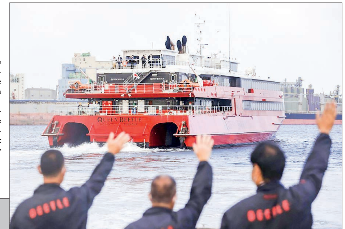
The Queen Beetle high-speed ferry departs from Hakata port in Fukuoka for South Korea's Busan on 4 November 2022.