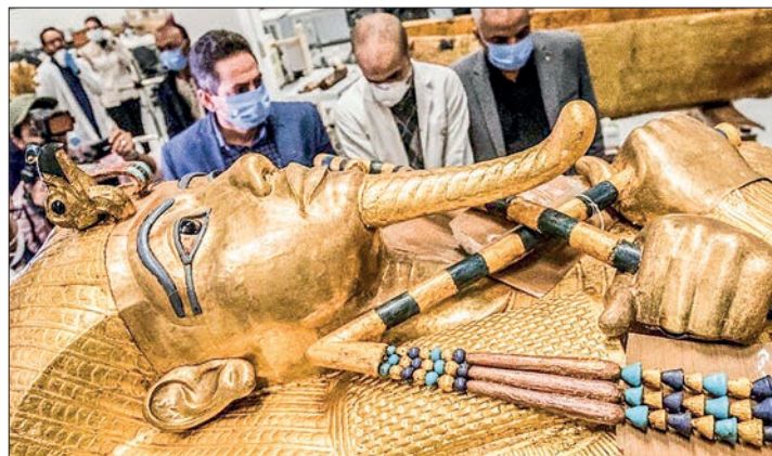
The golden sarcophagus of the Egyptian pharaoh Tutankhamun in a restoration lab at the newly-built Grand Egyptian Museum in Giza.