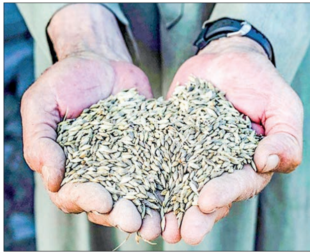
The grains and cereals sub-index rose by 3 per cent, building on a 2.2 per cent increase a month earlier.

WORLD wheat prices rose by 3.2 per cent in October partially due to tighter supplies from the US following a downward production revision, the Rome-based United Nations Food and Agriculture Organization's (FAO)