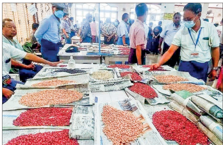
Merchants check samples of groundnuts at Mandalay market. PHOTO: MIN Htet AUNG (MANDALAY SUB-PRINTING HOUSE)

All kinds of peanuts were mainly cultivated in Mandalay, Sagaing, Magway and Ayeyawady regions for the domestic consumption and the exportation. It is known that Magway region is called “the Big Oil Pot of Myanmar” for its high output rate. — Min Htet Aung (Mandalay Sub-Printing House)/GNLM