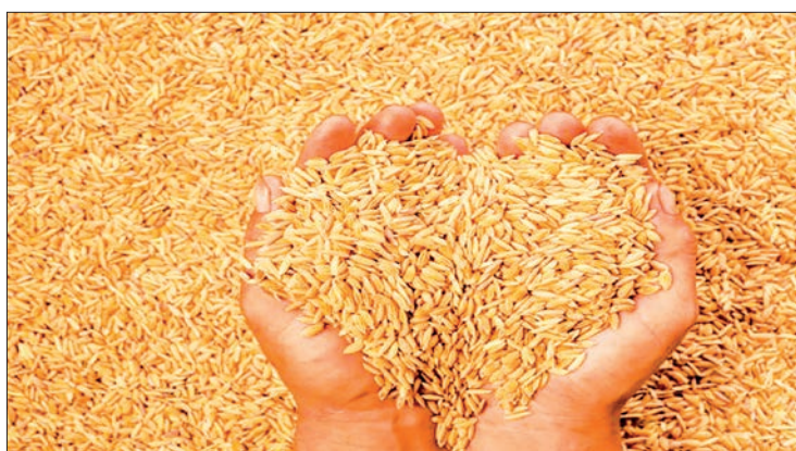
Paddy seeds obtained from newly-harvested monsoon paddy this year.

which entered the chilli pepper market around the end of June, went from around 4,000 kyats per viss in the same period last year to 8,000 kyats in the same period of the new release this year, and after about four months, at the beginning of November, it reached 15,500 kyats per viss.