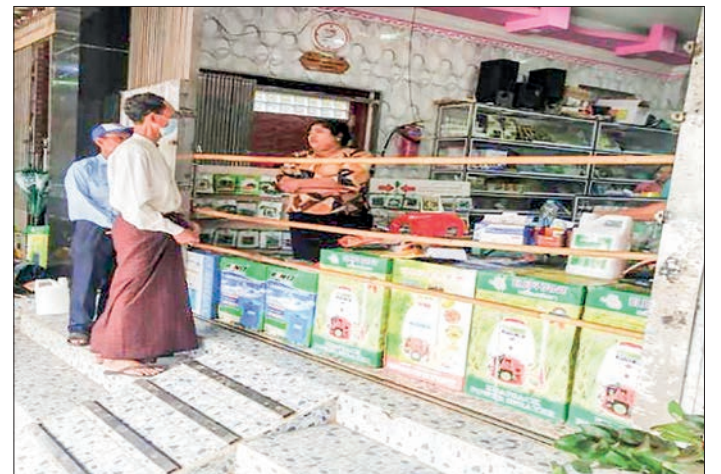
Fertilizers and pesticides are displayed at a shop in DaikU Township.

In addition, over 1,000 tonnes of fertilizer worth $321 million were imported from border trade. As importation, over 600 tonnes from China, over 20 tonnes from India and over 400 tonnes from Thailand.—TWA/GNLM