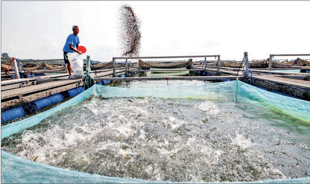
Photo shows fish farm on a manageable scale.