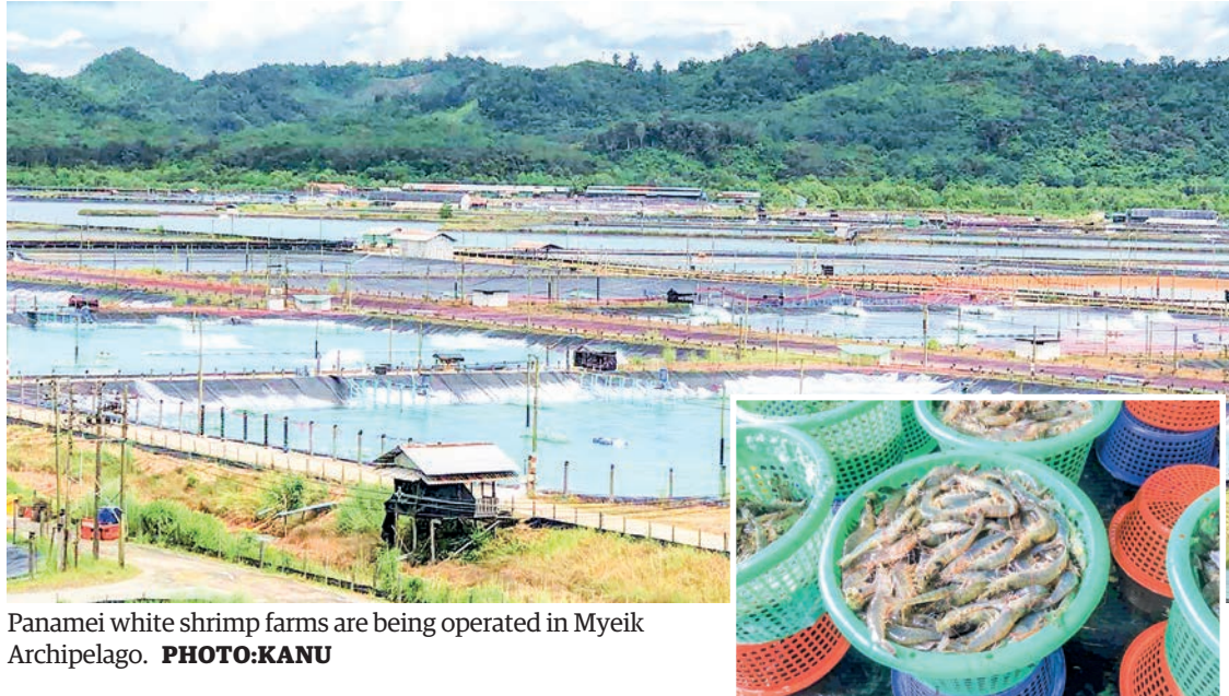
Panamei white shrimp farms are being operated in Myeik Archipelago.

"Myanmar and Russia have signed a Government to Government pact for the fishery sector. Only the protocol on fisheries (checking fish processing) is