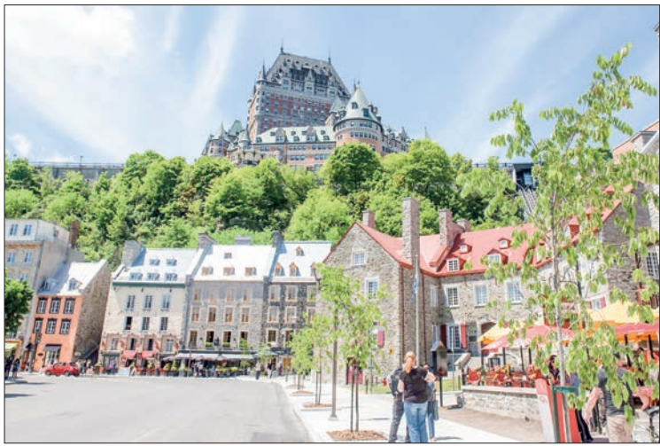
As of 1 November 2022, 525 cases of monkeypox had been reported in Québec.

CANADA has confirmed 1,444 cases of monkeypox, including 42 hospitalisations, the Public Health Agency of Canada said on Friday.