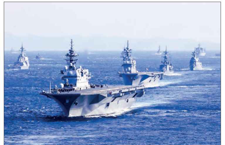
Photo taken by a Kyodo News reporter aboard a Japan Maritime Self-Defence Force helicopter shows vessels taking part in an international fleet review in Sagami Bay off Kanagawa Prefecture near Tokyo on 6 November 2022, including the MSDF destroyer Izumo (front).

Izumo, Kishida said North Korea has been launching ballistic missiles, including interconti-