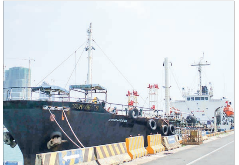
The oil tanker M/T Courageous was seized over sanctions-violating transfers to North Korea.

The State Department's Rewards for Justice program had said his exact location was not known and that he has also been identified as being in North Korea, Cambodia, Taiwan and Thailand as well as Cameroon and the tiny Caribbean nation of Saint Kitts and Nevis.—AFP