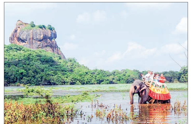
Foreign tourists ride an elephant during a sightseeing tour in the ancient city of Sigiriya.

SRI Lanka's tourism earnings in the first 10 months this year surpassed 1 billion US dollars, according to the latest data from the country's central bank.