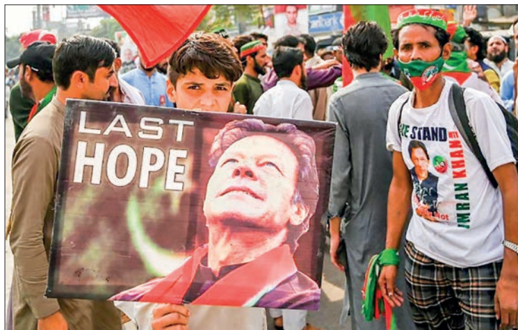
Supporters of former Pakistani prime minister Imran Khan, take part in a protest near the container truck a day after the assassination attempt on Khan, at the cordoned-off site of a gun attack in Wazirabad 4 November 2022.

THE assassination attempt on former prime minister Imran Khan and his accusation it was a plot involving a senior intelligence officer has pushed Pakistan into a "dangerous phase", analysts say.