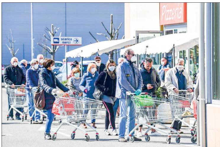
Residents of Codogno, northern Italy, at a local supermarket.

It comes after Italy posted better-than-expected quarterly growth on Monday. "Thanks to a favourable third quarter", the government was able to free up "around 9.5 billion euros" that the government will allocate "from next week" towards measures to mitigate higher energy costs, Meloni said.—AFP