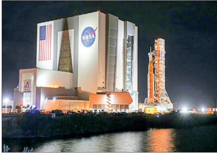
The Artemis-1 rocket is rolled out from the Vehicle Assembly Building en route to Launch Pad 39B at the Kennedy Space Center in Florida.

rocket was rolled out slowly on a giant platform known as the crawler-transporter designed to minimize vibrations.