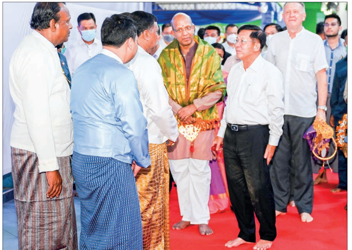
SAC Chairman Prime Minister Senior General Min Aung Hlaing cordially greets attendees at Deepavali lighting festival on 6 November.

The Senior General expressed his wishes that may all ethnic national people residing in the Republic of the Union of Myanmar in different faiths upholding the four cardinal virtues and advice of relevant religions to stay away from two kinds of extremism be serving the interests of the mother land.