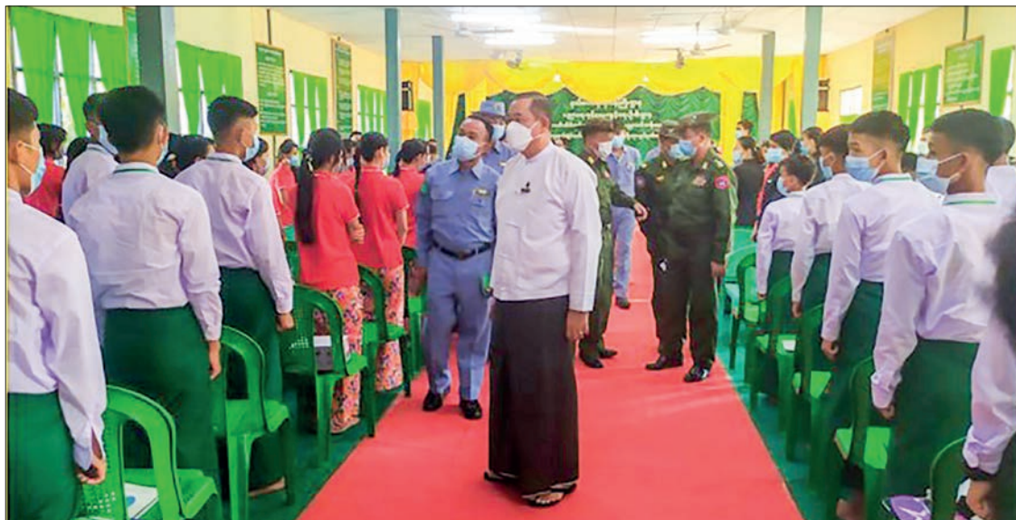
Union Minister for Border Affairs Lt-Gen Tun Tun Naung cordially converses with youths at youth training school in Hpa-an on 4 November.

Development Training School in Hpa-an, he inspected student dormitory, mess, and library, and progress of building the 100 KVA transformer sub-power station.—MNA