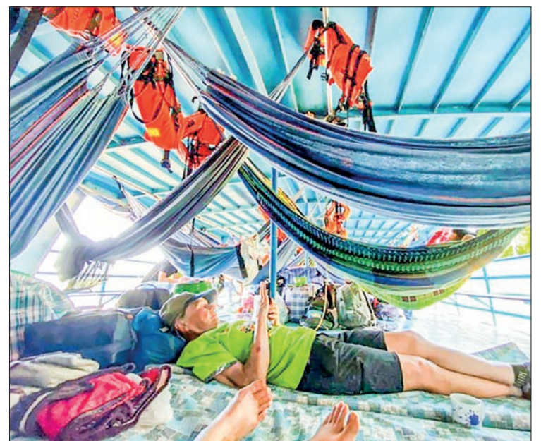
More than 100 foreign and local tourists were taken hostage on a riverboat in the Peruvian Amazon, and freed 28 hours later.

On Friday, the office of Peru's human rights ombudsman