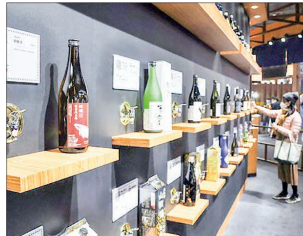
Japanese firms are promoting various items such as sake, an electric vehicle and camping goods at the annual China International Import Expo in Shanghai.

Honda Motor Co. unveiled the concept model for the second edition of its EV series models to the Chinese market at the event Saturday. The exterior design of the e:N2 concept, which follows the April launch of the e:N1 EVs, features characteristics of sedan, coupe and sport utility vehicles, according to a Honda official.—Kyodo