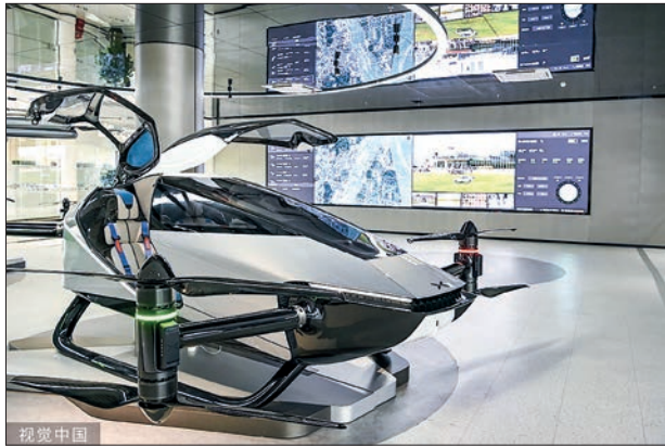
XPENG X2, the latest version in the XPENG Flying Car family.

A showcase for the latest plug-in and electric vehicles opened in Denmark on Friday, with Chinese e-automakers Xpeng, SAIC's MG, BYD, and Aways among those displaying the latest cutting-edge cars. Denmark's eCarExpo 2022, which takes place from Friday to Sunday at the Bella Center in Copenhagen, is twice the size of