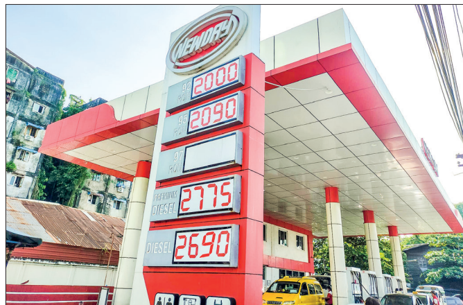
Score board mentioning prices of fuel seen at fuel station on 29 October.

The Supervisory Committee on Oil Import, Storage and Distribution of Fuel Oil stated that domestic fuel prices are increasing as per the higher price index set by Mean of Platts Singapore (MOPS).—NN/GNLM