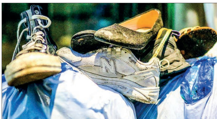
Shoes are seen on top of plastic bags on a street near where a stampede took place at a packed Halloween event in the popular Itaewon district of Seoul, early on 30 October 2022.

An estimated 100,000 people attended the event, which local vendors said was "unpre-