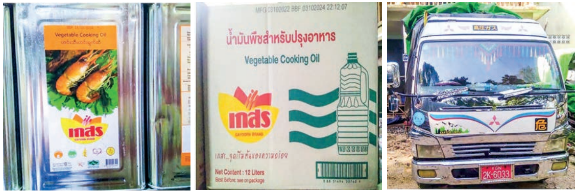
Bottle of cooking oil and vehicle carrying cartons of cooking oil bottles seized in Kayin State on 29 October.

UNDER the supervision of the Anti-Illegal Trade Steering Committee, effective action is being taken to prevent illegal trade in accordance with the law.