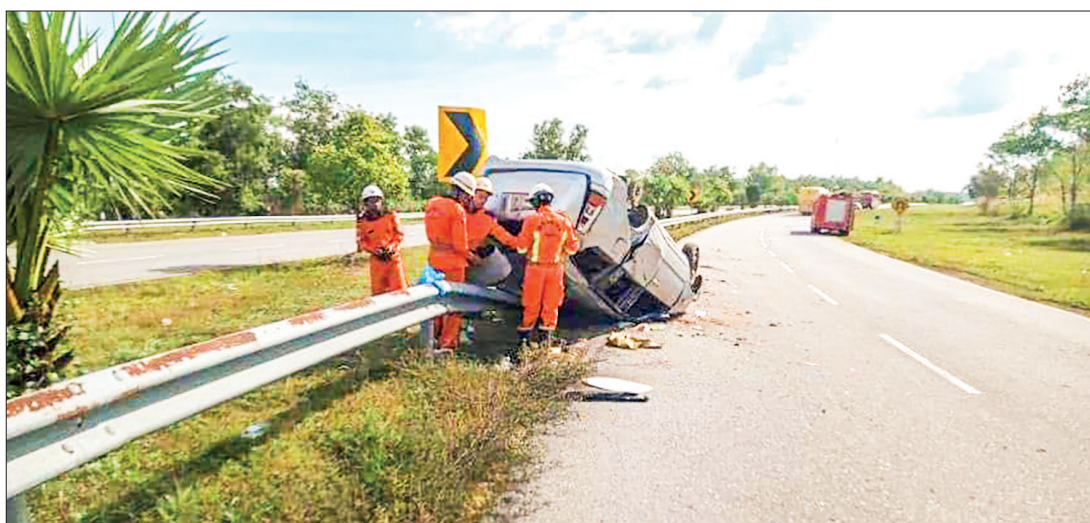
A vehicle overturns on Yangon-Mandalay Expressway on 29 October.

A vehicle accident occurred in the area of Bawni Expressway fire station on Yangon-Mandalay expressway. The authorities are investigating the fact that no one was found in the vehicle when the relevant authorities went to rescue them.