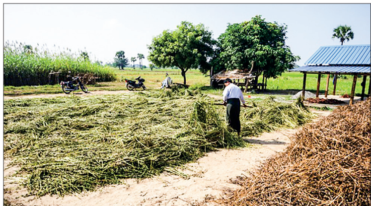
Sesame plants are kept in the sun for winnowing at the farming plain.

THE prices of various sesame seeds headed for the fourth-week fall amid the forex rules, said traders.