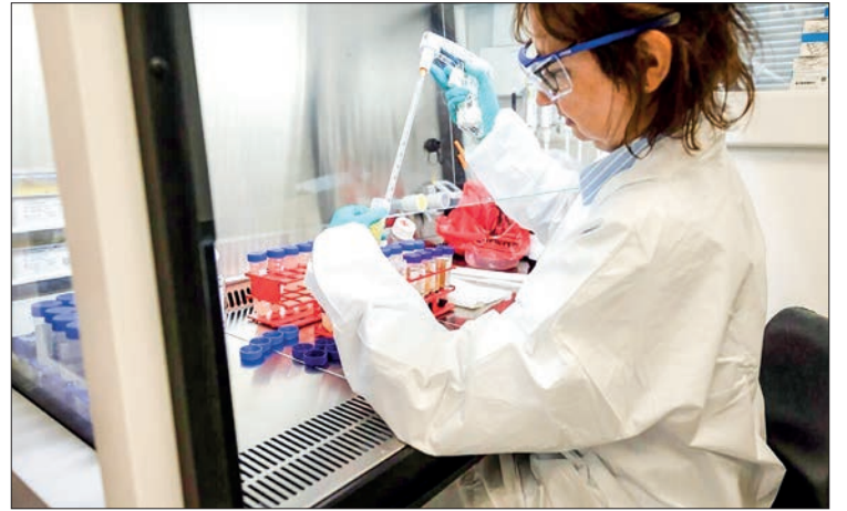
In the first nine months of the year, revenue reached 32.3 billion euros.

And in the first nine months of the year, revenue reached 32.3 billion euros — an increase of more than 16 per cent. —AFP