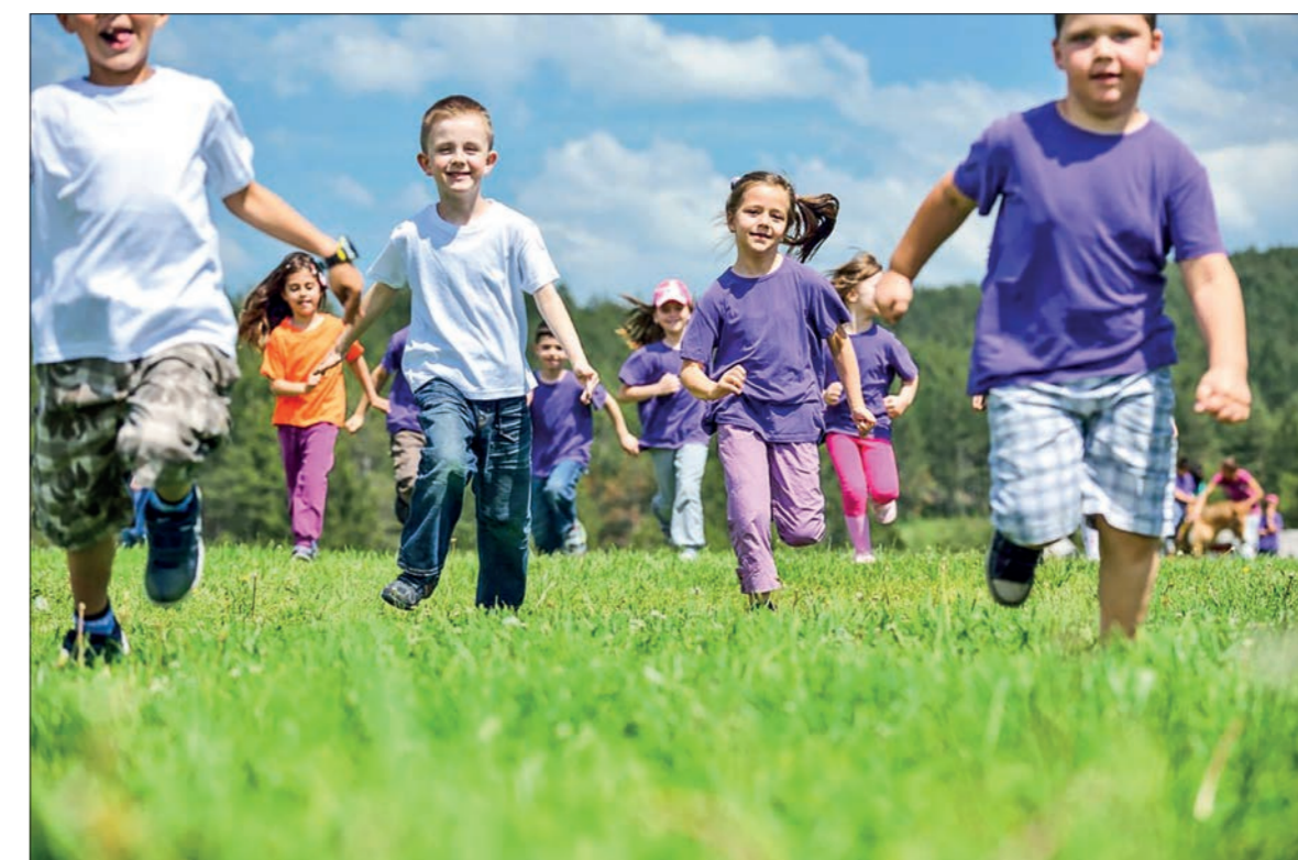
Monkeypox can be asymptomatic, thus the outbreak could get out of hand and affect vulnerable populations like young children.

Antiviral drugs such as tecovirimat, which is effective against orthopoxviruses, and vaccinia immune globulin (VIG), which is used to treat side effects of smallpox vaccination, are therapy choices in these high-risk situations. However, "None of these treatments