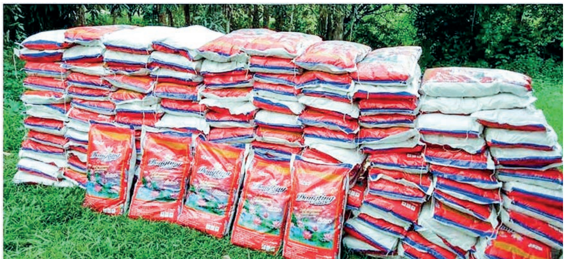
Bags of detergent powder seized in Shan State on 29 October.

an investigation team from Customs Department of Kengtung Township investigated near