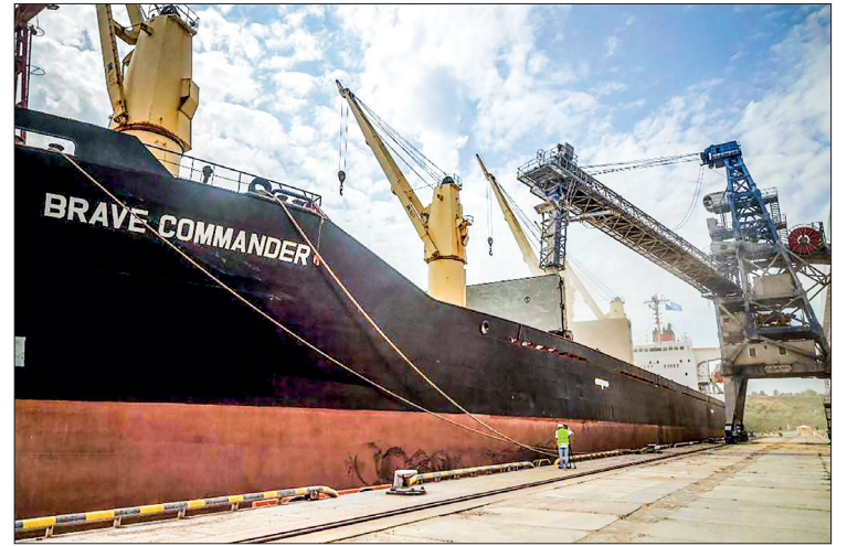
In this file photo taken on 14 August 2022, the first UN-chartered vessel MV Brave Commander loads more than 23,000 tonnes of grain to export to Ethiopia, in Yuzhne, east of Odessa on the Black Sea coast.

The Russian army claimed to have “destroyed” nine aerial drones and seven maritime ones, in an attack in the port early Saturday. — AFP