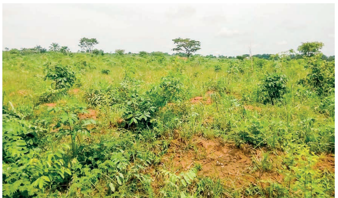
A plot of vacant and fallow land is seen in the country.

The operations on the permitted vacant, fallow and virgin lands for mining should be completed during a fixed time with the Ministry of Natural Resources and Environmental Conservation. The land utilization permit will be revoked if they fail to complete the operations and the Security Fees will be nationalized. Moreover, the