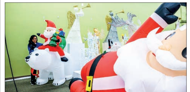
A worker inflates a Santa Claus decoration a Christmas decorations showroom of the National Tree Company in New Jersey on 26 October 2022.

The situation was worsened by a shortage of shipping containers, along with delays at ports from a lack of workers to unload products and transport them to retailers.—AFP