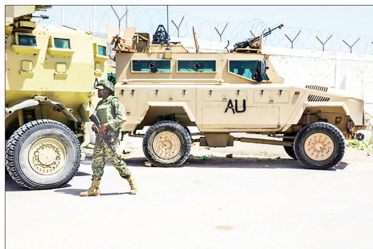
Somalia's international partners have repeatedly warned that the election delays — caused by political infighting — were a dangerous distraction from the fight against Al-Shabaab.

the same busy junction where a truck packed with explosives blew up on 14 October 2017, killing 512 people and injuring more than 290.