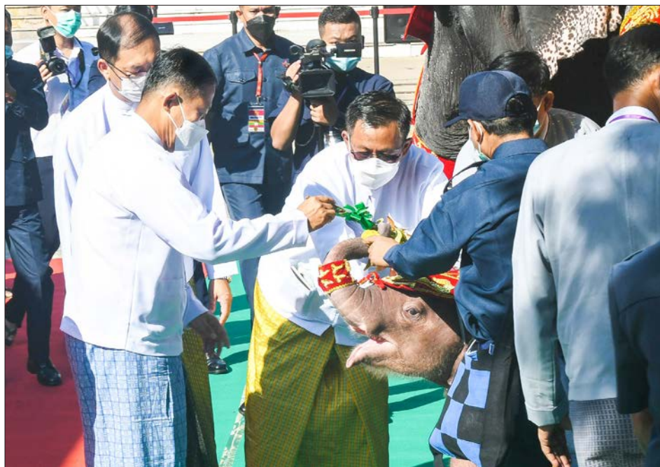
SAC Vice-Chairman Deputy Prime Minister Vice-Senior General Soe Win sprinkles scented water on the Yadana white elephant at the naming ceremony in Nay Pyi Taw on 30 October.

The three month and seven day-old white elephant is two feet and 10 inches in height, four feet and two inches in girth and about 265 pounds. He arrived in Nay Pyi Taw together his mother elephant on 27 October. Now, the white elephant healthily and happily resides at Yadana white elephant hall in the precinct of Uppatasanti Pagoda . The Rattha Nandaka white elephant is the 10 th white elephant of the country.—MNA