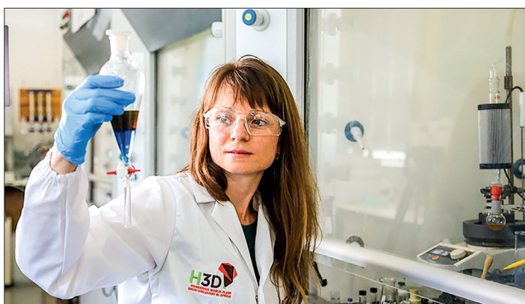
The research team, led by experts from the University of Cape Town (UCT), published their findings in the journal Science Translational Medicine.