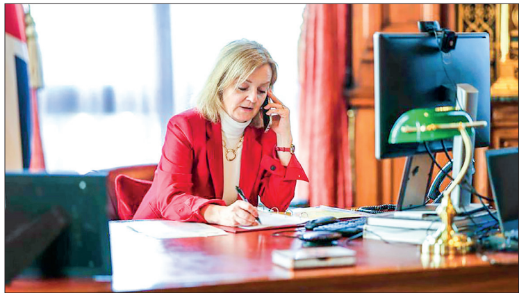
In an unconfirmed report, The Mail cited unnamed security sources as saying that ex-prime minister Liz Truss' personal mobile phone had been hacked 'by agents suspected of working for the Kremlin'.