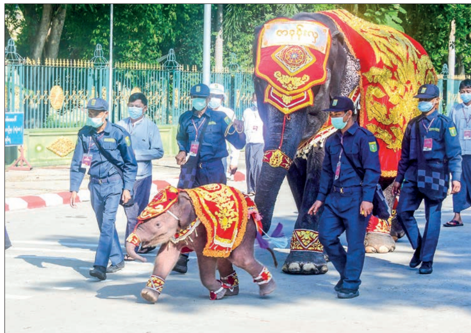
Officials bring Yadana white elephant to precinct of Uppatasanti Pagoda in Nay Pyi Taw to attend naming ceremony and hall-accepting ceremony in Nay Pyi Taw on 30 October.