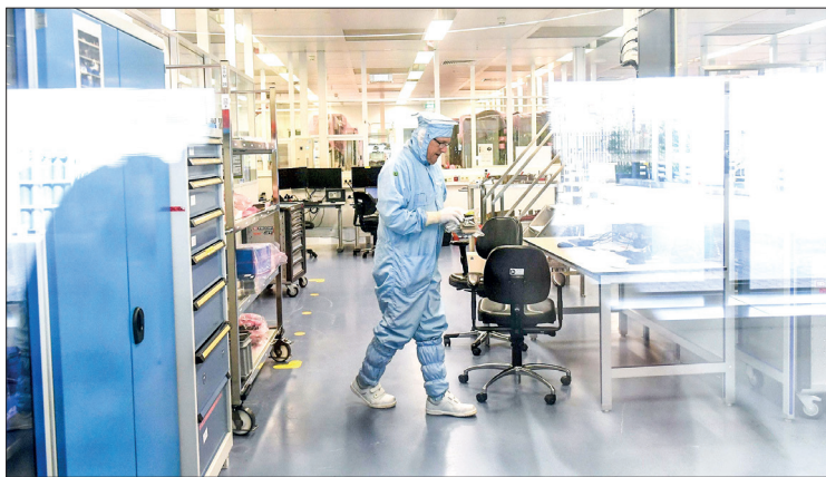
Netherlands is home to top companies in the semiconductor and microchip sectors, such as NXP and ASML. An employees make his way in a laboratory at ASML.

THE Dutch military intelligence service has warned companies that Moscow is trying to obtain high-tech assets for its war in Ukraine through front compa-