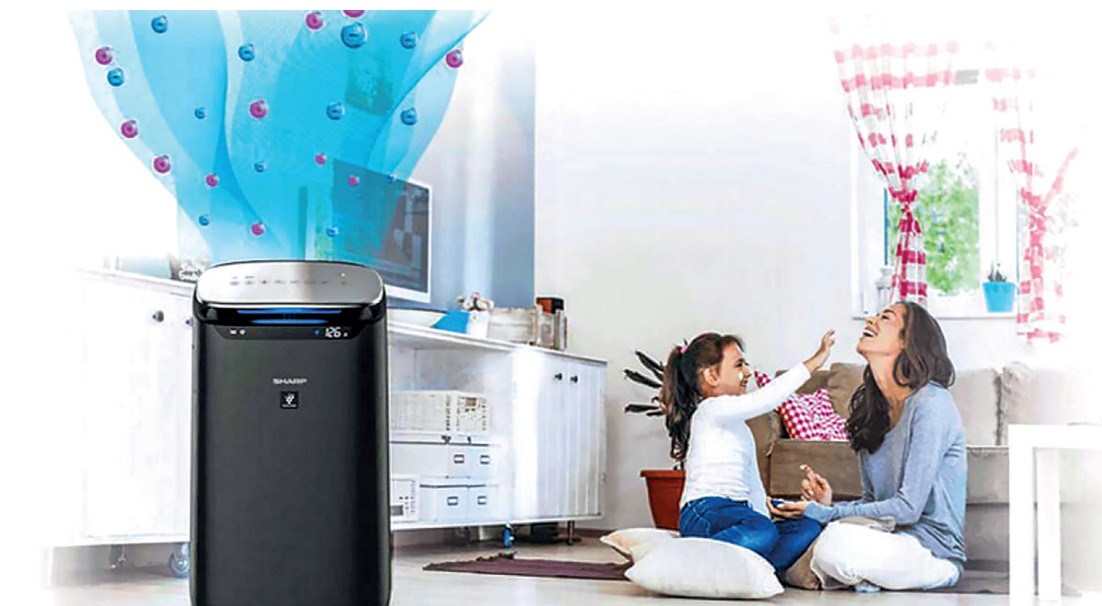
Sharp's revolutionary Plasmacluster technology has been proven to be effective against suspending viruses and microbes that contaminate our air, creating cleaner air and healthier living environment.

With the growing numbers of mutations of novel Coronavirus (SARS-CoV-2) that have surfaced over the past two years, we believe that the study results pro-