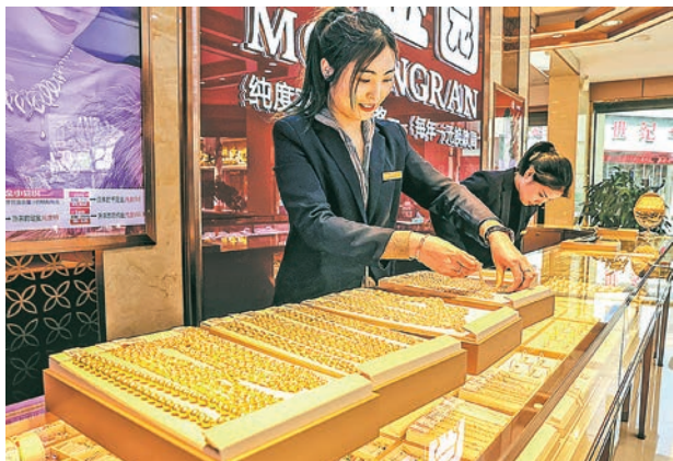
Employees sort gold ornaments at a jewelry shop in Huzhou, Zhejiang province.

CHINA produced 269.987 tonnes of gold in the first nine months of this year, an increase of 33.235 tonnes or 14.04 per cent from the same period last year, industry data showed on Friday.