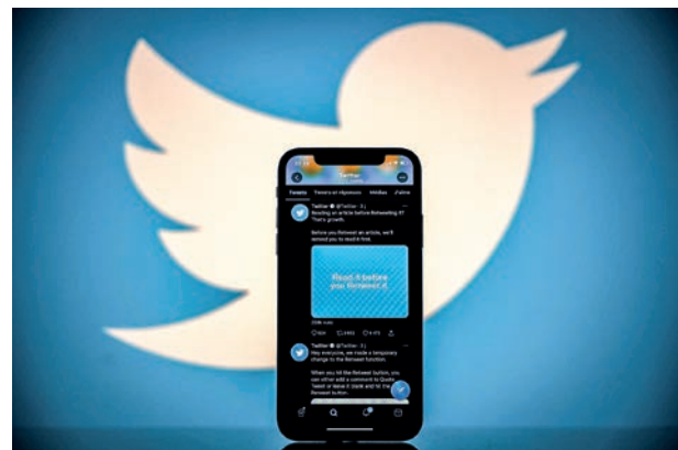
Elon Musk completed his deal to buy Twitter at 44 billion U.S. dollars Thursday, gaining control of the social network company, CNN reported, citing sources familiar with the deal.

On 4 October Musk proposed to proceed with the deal at the original price, just ahead of a trial scheduled at the Delaware Chancery Court on 17 October in which Twitter was set to seek an order directing Musk to close the deal for 44 billion dollars. —Xinhua