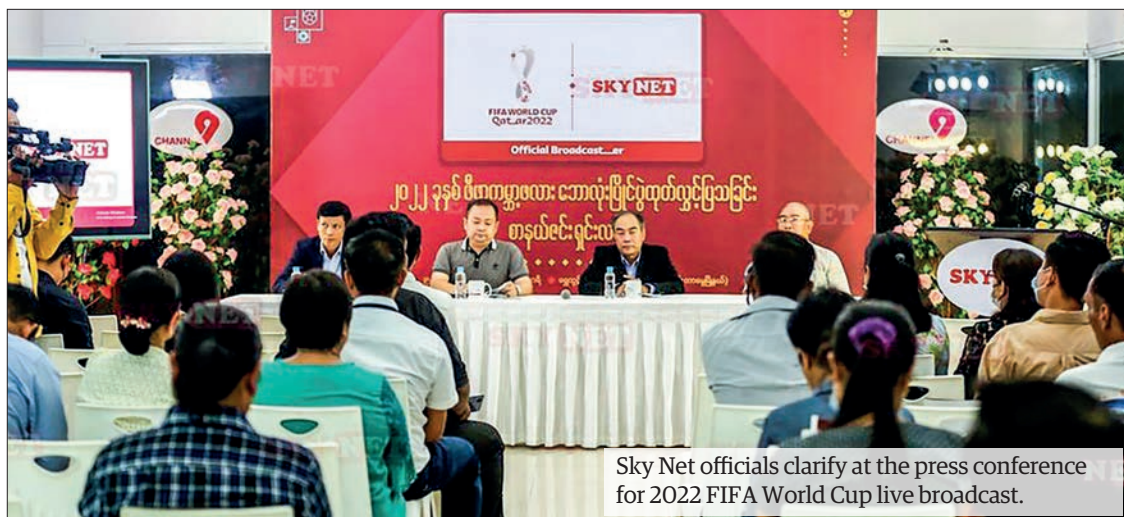
Sky Net officials clarify at the press conference for 2022 FIFA World Cup live broadcast.

A SKY NET official said at a press conference held on 29 October that all matches of the 2022 World Cup, which will be hosted by Qatar, will be broadcast live on SKY NET.