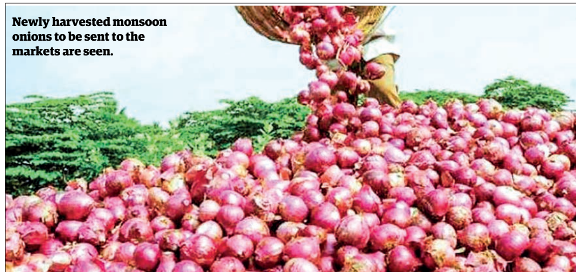
Newly harvested monsoon onions to be sent to the markets are seen.

The consumers reduce the consumption of onions when the price climbs. The Yangon market sees only regular demand from the border area. With the monsoon onions flooding the market, there is less chance for the price to go up as some traders who keep the stocks in hands expected, the GNLM quoted a market observer, as saying.—TWA/GNLM