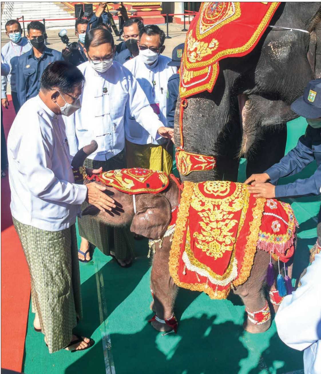
SAC Chairman Prime Minister Senior General Min Aung Hlaing calls title of Yadana white elephant Rattha Nandaka three times at naming ceremony in Nay Pyi Taw on 30 October.

T HE naming ceremony and the hall-accepting ceremony for Yadana white elephant born of female elephant Zar Nan Hla, 33, of Myanma Timber Enterprise in Taungup Township of Rakhine State at 6:30 am on 23 July 2022 took place at the Yadana white elephant hall in the precinct east of Uppatasanti Pagoda in Nay Pyi Taw yesterday morning.