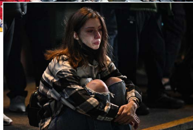
A woman reacts outside the Itaewon subway station in the district of Itaewon in Seoul on 30 October 2022, the day after a Halloween stampede in the area.

About 151 people were killed in the incident, including 19 foreigners, 11 of whom have not yet been identified. The Myanmar embassy said it is concerned about all Myanmar citizens. The Ministry of Foreign Affairs of the Republic of Korea has inquired about whether or not Myanmar citizens have