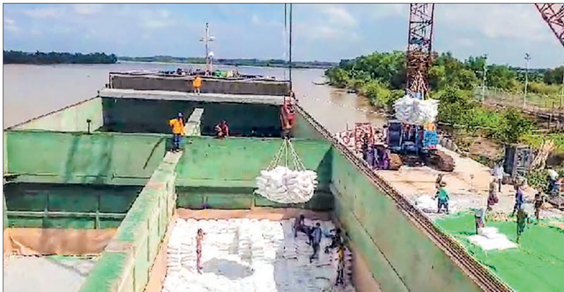
Bags of rice are being loaded onto international cargo ship at international port in Pathein recently.

Bangladesh and Myanmar officials signed a sales contract on 8 September in order for exporting 200,000 tonnes of Myanmar's white rice to Bangladesh. About 30,000-50,000 tonnes of rice are scheduled to be sent to