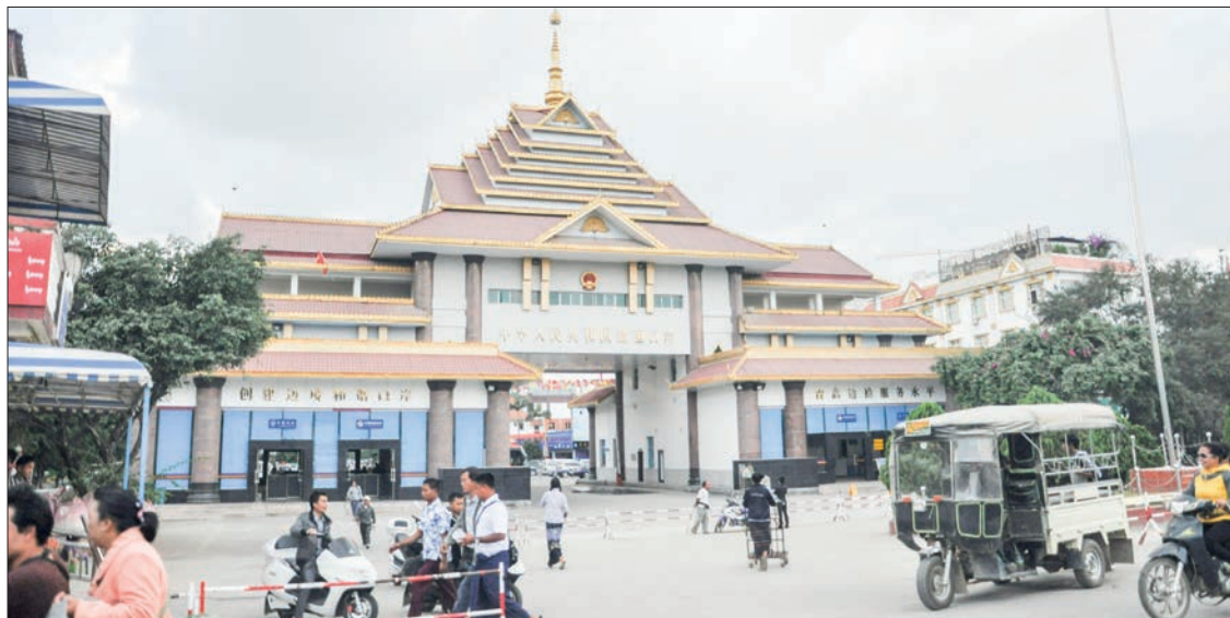
Trade activities are seen on the Sino-Myanmar border.

THE Trade Department under the Ministry of Commerce will issue Certificate of Origin (CO) Form RCEP to the products that originated in Myanmar and are designated to be exported to China so that the authorized traders can enjoy customs tariff relief, starting from 1 November.