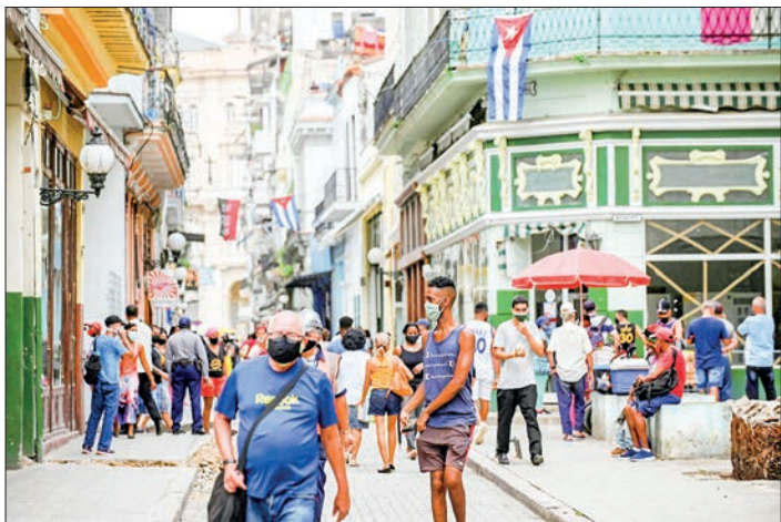
Cuba's First Deputy Minister of Public Health Tania Cruz said the US government restricted the island's access to medical supplies, medicines and reagents during the COVID-19 pandemic. Cubans wearing masks walk along a streets of Havana, on 11 Aug.

According to Cuban official data, the US sanctions in the past six decades has cost the Cuban economy a total of 154.2 billion US dollars. —Xinhua