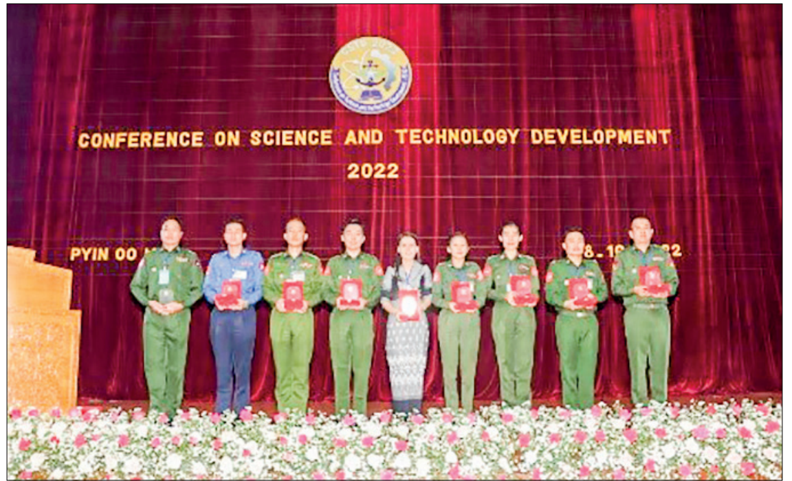
Recipients of the presents from the Senior General pose for the documentary photo at the event.

He then delivered a speech to conclude the conference.