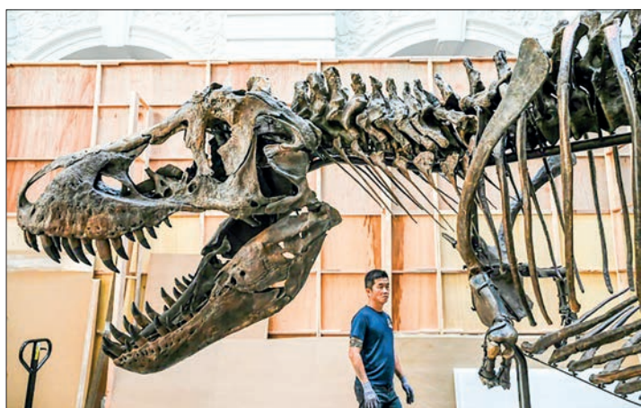
Shen, which stands 4.6 metres tall and 12 metres long, is thought to be male.

"We really wish that Shen will find a new home amongst our Asian collectors here." —AFP