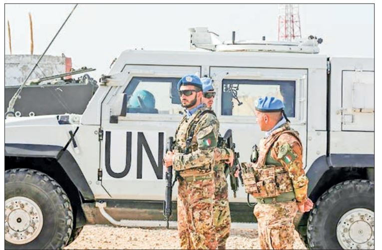
Italian UNIFIL peacekeepers in Naqura ahead of the planned signing.

The final accord is due to be signed at the headquarters of the United Nations Interim