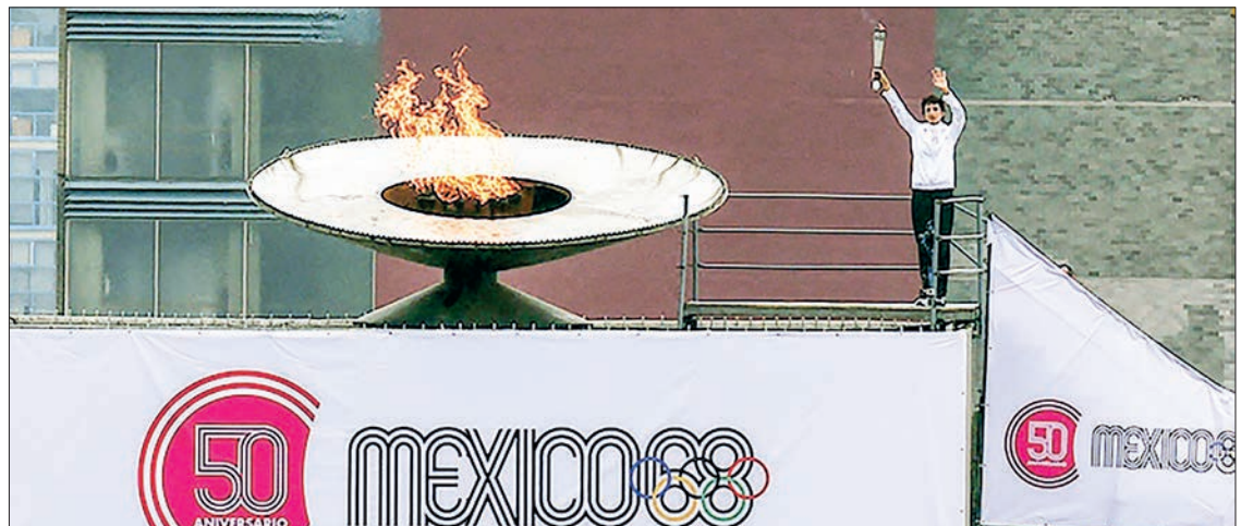
Mexican former Olympic track and field athlete, Enriqueta Basilio symbolically lights the olympic cauldron, during the ceremony to mark the 50 th anniversary of Mexico's 1968 Summer Olympics, at the Olimpico Universitario stadium, in Mexico City, Mexico on 12 October 2018.

MEXICO on Wednesday announced a bid to host the 2036 Olympics, more than half a century after first staging the Summer Games.