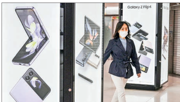
Samsung Electronics reported its first year-on-year decline in operating profit in three years on Thursday.

SOUTH Korean tech giant Samsung Electronics on Thursday said its third-quarter operating profits were down 31.39 per cent year on year after a global economic downturn hit demand for consumer electronics.