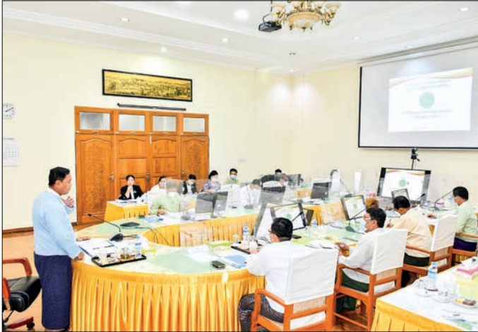
The coordination meeting on implementation of Smart Village projects is in progress.

THE Smart Village projects are expanded in 44 villages this year, said Union Minister for Cooperatives and Rural Development U Hla Moe during the coordination meeting on socio-economic development programmes in the first six-month term of 2022-2023FY held on 26 October.