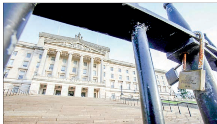
Northern Ireland has been without a functioning government since February. Locks on the closed gates outside Parliament Buildings on the Stormont Estate in Belfast.

NORTHERN Ireland on Thursday appeared headed for a second election this year, after UK government efforts to resolve months of political stalemate over its post-Brexit status failed to secure a breakthrough.