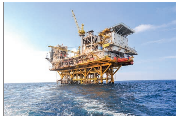
The banking group will no longer make “investments and direct financing of new oil and gas production projects and the infrastructure directly related to these new projects.”

The banking group will no longer make “investments and direct financing of new oil and gas production projects and the infrastructure directly related to these new projects”. It said it would also stop financing oil companies without plans to reduce production.