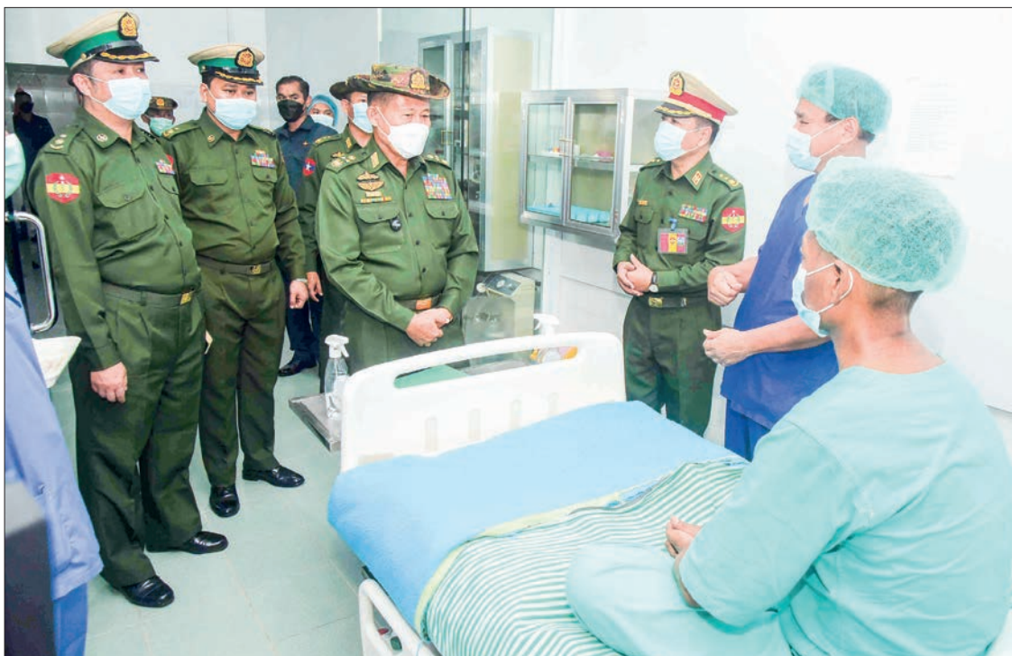
SAC Vice-Chair Deputy Commander-in-Chief of Defence Services C-in-C (Army) Vice-Senior General Soe Win comforts patients at the Tatmadaw Liver Specialty Hospital in Mingaladon Township in Yangon Region yesterday.

VICE-CHAIRMAN of the State Administration Council Deputy Commander-in-Chief of Defence Services Commander-in-Chief (Army) Vice-Senior General Soe Win, accompanied by senior military officers from the Office of the Commander-in-Chief and the commander of Yangon Command, yesterday morning, went to the Defence Services Specialty Orthopaedic Hospital (500-bed), the special care centre at Defence Services General Hospital (1,000-bed) and Defence Services Liver Specialty Hospital in Mingaladon Township and comforted officers, other ranks and families receiving medical treatments there.