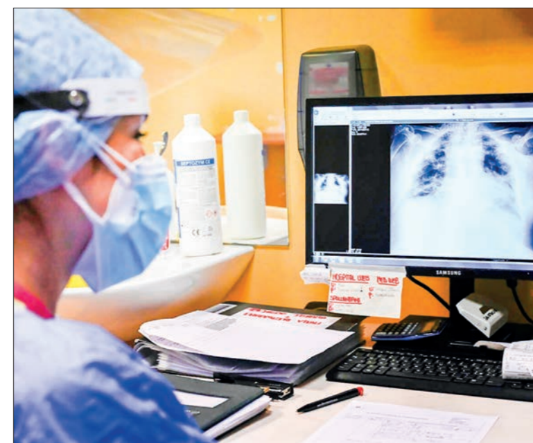
Most of the estimated increase in TB deaths globally was accounted for by four countries: India, Indonesia, Myanmar and the Philippines.

T UBERCULOSIS case numbers increased last year for the first time in more than 20 years, fuelled by the Covid-19 pandemic which disrupted access to diagnosis and treatment, the World Health Organization (WHO) said Thursday.