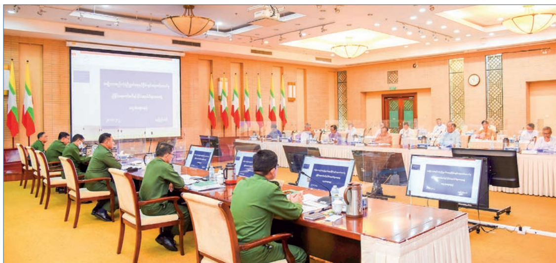
The discussion between the National Solidarity and Peacemaking Negotiation Committee and the working group of political parties is in progress.

THE National Solidarity and Peacemaking Negotiation Committee (NSPNC) convened a discussion with the working group of political parties at the National Solidarity and Peacemaking Centre in Nay Pyi Taw yesterday.