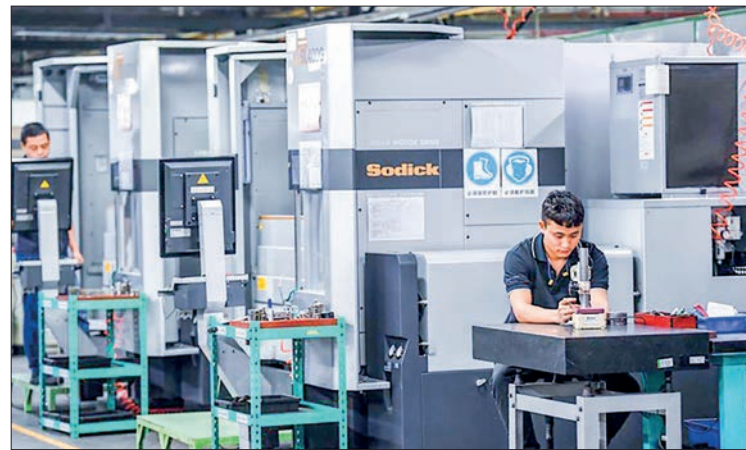
Workers are seen at a workshop in Longhua science and technology park of Foxconn Technology Group in Shenzhen, south China's Guangdong Province, 22 Feb 2019.

MILLIONS of people in China were under tight Covid restrictions on Wednesday as sporadic outbreaks across the country prompted business closures and disruption at the world's largest iPhone factory.