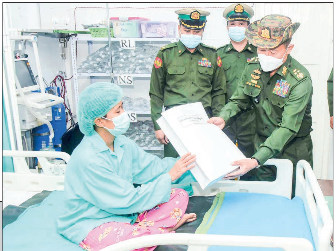
Vice-Senior General Soe Win provides foodstuffs to the patient.