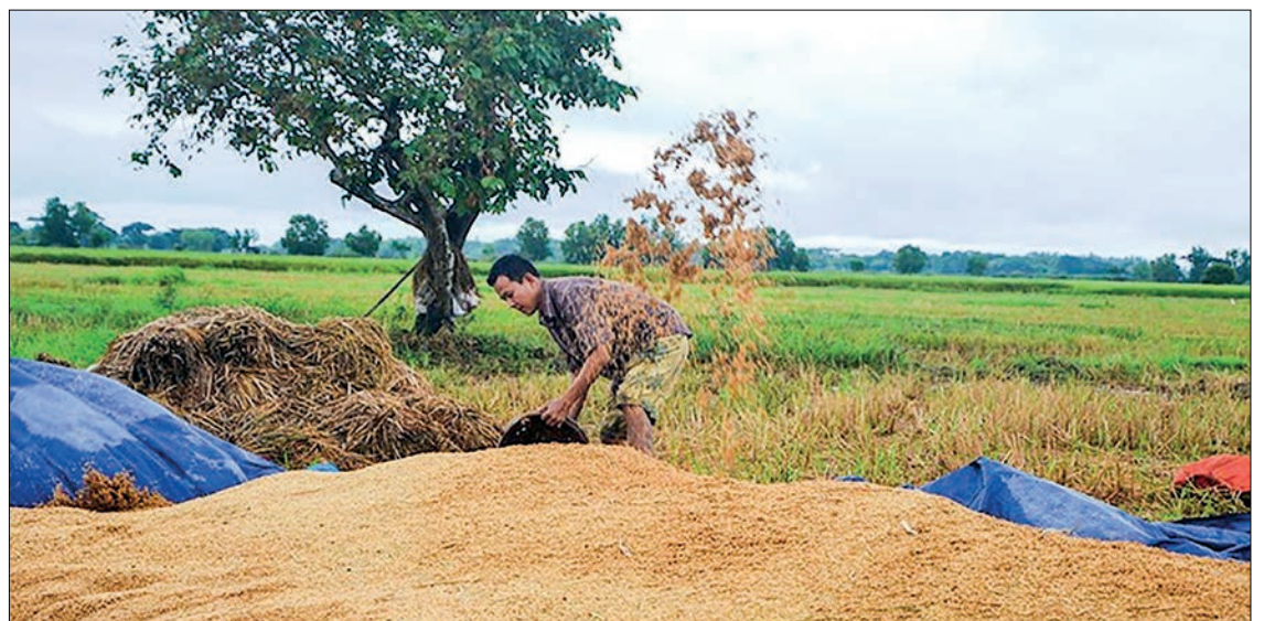
A farmer is piling up the harvested paddy.

The prices of both new paddy varieties were above K1 million so the farmers do a roaring business despite the high agricultural input cost. Nonetheless, it sparked concerns among consumers over the possible price increase. —TWA/GNLM