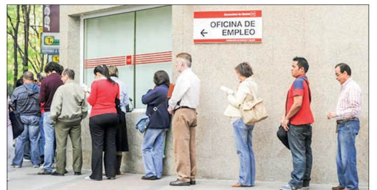
The number of job seekers in Spain fell below three million in May for the first time since November 2008 at the start of the global financial crisis. PHOTO: AFP

key tourism sector, and agriculture. The jobless rate was still lower than during the same period a year ago when it stood at 14.57 per cent. The number of job seekers in Spain fell below three million in May for the first time since November 2008 at the start of the global financial crisis. The fall in joblessness was due to a rebound in Spain's tourism sector following the end of most pandemic travel restrictions and a labour market reform which limits the back-to-back use of temporary contracts.—AFP