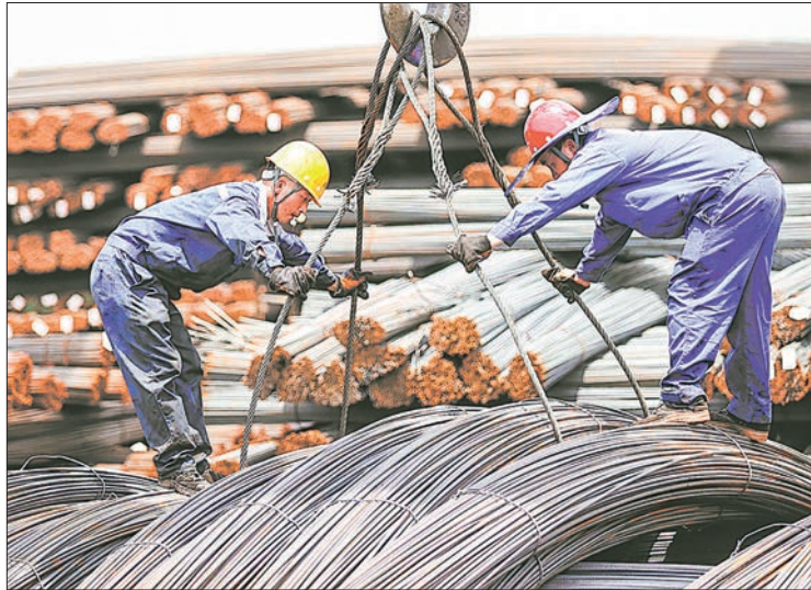
Workers hoist steel bars at a logistics park in Huzhou, Zhejiang province.

Highlighting the improvement in business profit structure, senior NBS statistician Zhu Hong noted that the performance of industrial firms is gaining recovery momentum as the country's pro-growth policies are taking effect.