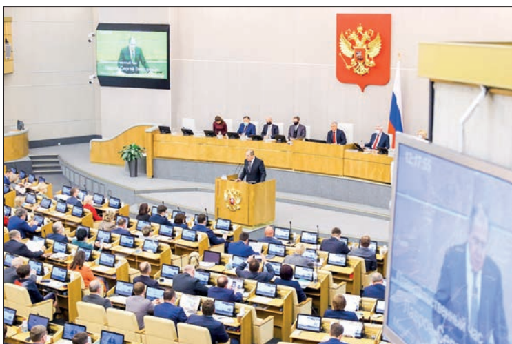
Russian Foreign Minister Sergey Lavrov delivers a speech during a session of the State Duma, the lower house of Russia's parliament, Moscow, Russia, 26 Jan 2022.

THE Russian parliament on Thursday passed a law allowing ex-convicts to be mobilized into the army and other measures to prop up Moscow's troops in Ukraine.