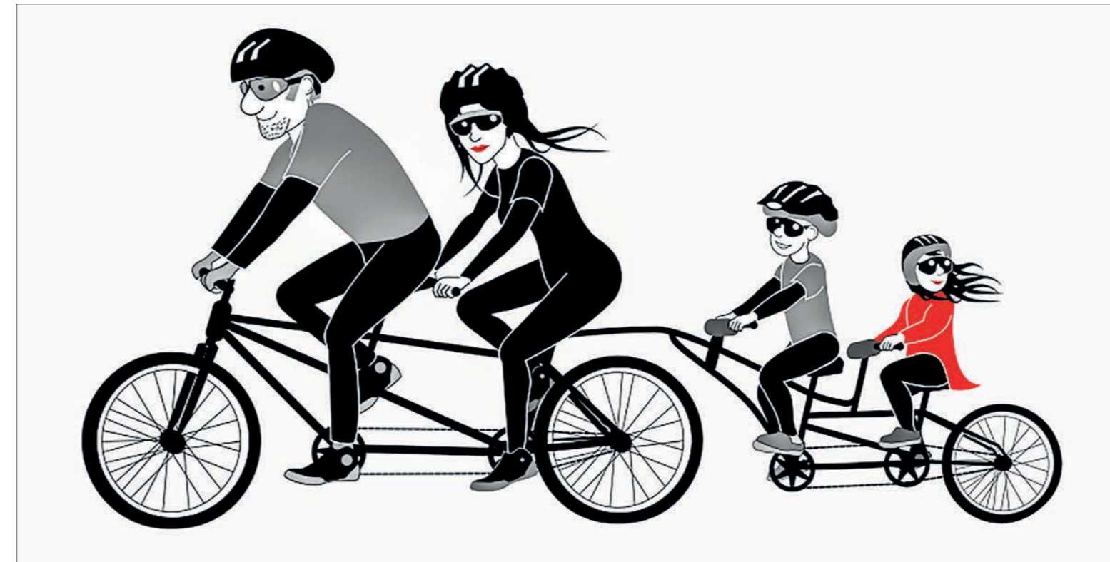
Popular ways to be active include walking, cycling, wheeling, sports, and active recreation and play and these can be done at any level of skill for enjoyment by everybody.

Globally, round about one in three women and one in four men do not have enough physical activity to be a healthier life. This means they do not meet the global recommendations of at least 150 minutes of moderate-intensity or