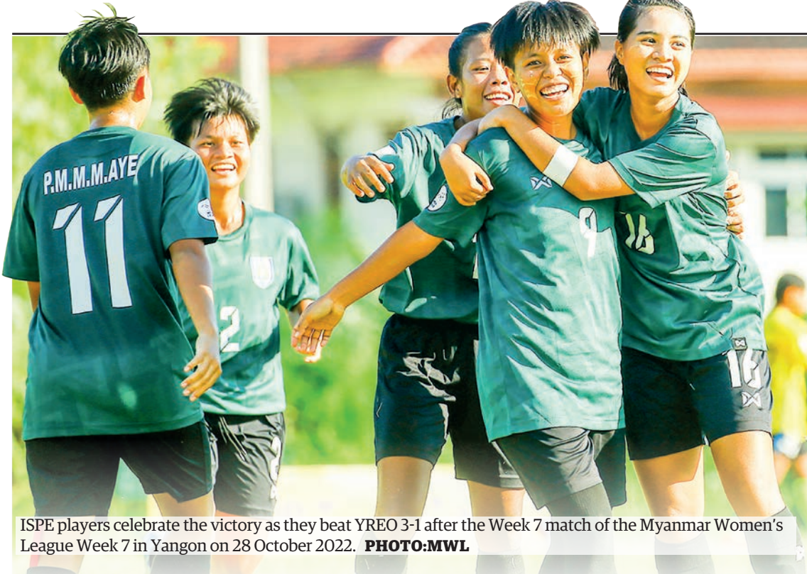
ISPE players celebrate the victory as they beat YREO 3-1 after the Week 7 match of the Myanmar Women's League Week 7 in Yangon on 28 October 2022.