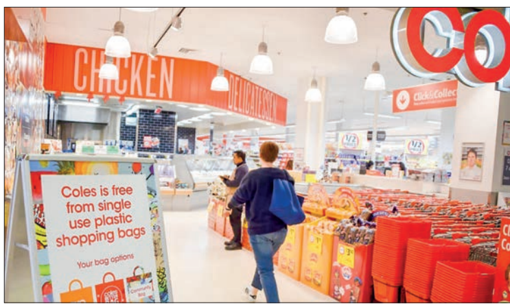
A sign, seen in a Coles supermarket, advises its customers of its plastic bag free in Sydney on 2 July 2018.

AUSTRALIA'S annual inflation has climbed to its highest level in more than 30 years amid soaring prices for housing and gas.