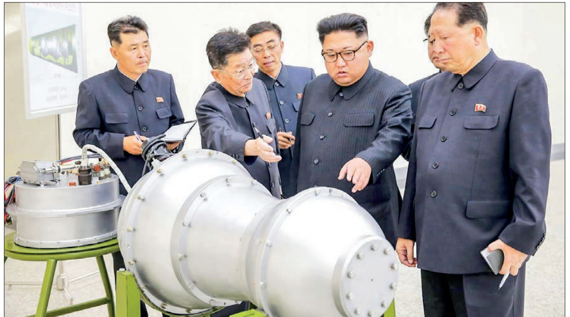
Kim Jong Un, centre, examines a device at an undisclosed location in an undated photo released by North Korea's official news agency.

The missiles flew approximately 230 kilometres (143 miles) at an altitude of 24 kilometres and speeds of 5 Mach, the statement said, calling the launch "a serious provocation" that violated UN sanctions.—AFP