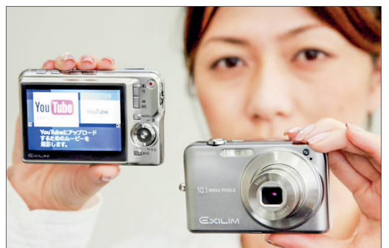
Japanese electronics giant Casio Computer put on the market new cameras that feature a pre-installed YouTube Capture software to easily upload videos to the website.

In addition to doctors and nurses, mental health professionals and healthcare informa-