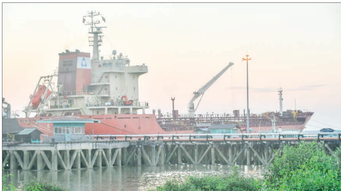
A tanker is pictured berthing at Thilawa Port to unload its cargoes – fuel oil.

The committee is importing fuel oil to avoid a shortage in the market. A total of 2.26 million gallons of oil on 1 October, 5.05 million gallons on 3 October,