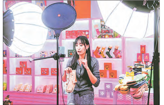
A saleswoman promotes socks during a livestream session in November, 2021 in Datang, a town in Zhuji, Zhejiang province.

Support for these businesses in areas including registration of market entities, annual reporting services, supply of business premises as