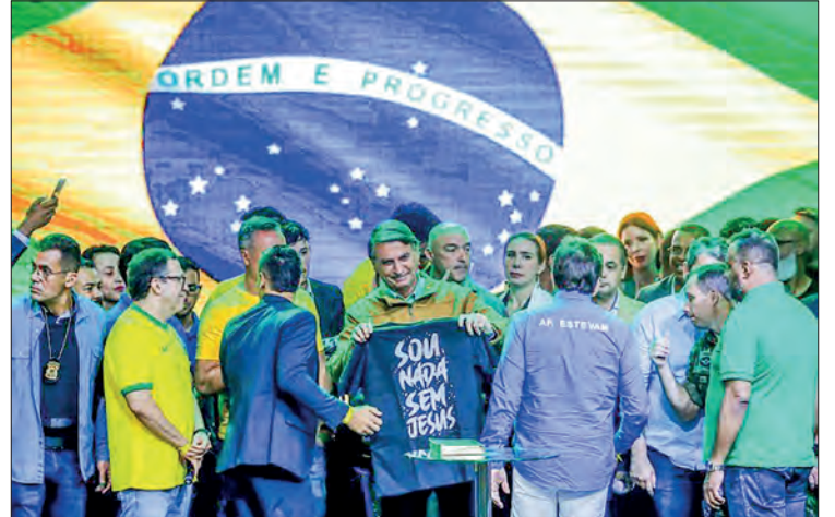
President Jair Bolsonaro has cultivated close ties with Brazil's powerful Evangelical community.