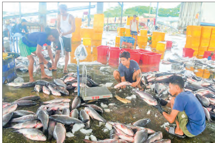
Myanmar is strategically located with its strategic coastlines and rich marine resources and the construction of an international fish market will bring about earning foreign income and one new basic infrastructure for economic growth.

At present, Myanmar is stepping up to produce value-added fisheries products. The raw fish is mostly sent to Thailand and China. It is also shipped to other foreign markets through Viet Nam and Bangladesh. As value-added products can increase export income, the country aims for direct export of value-added products. It can support the country's agriculture and livestock sectors. The market will attract more foreign