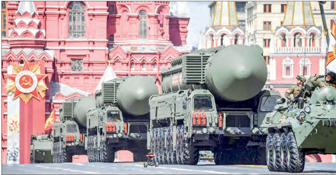
Russian Yars intercontinental ballistic missile launchers parade through Red Square during the Victory Day military parade in central Moscow on 9 May.

RUSSIAN President Vladimir Putin on Wednesday oversaw the training of Moscow's strategic deterrence forces, troops responsible for responding to threats of nuclear war, the Kremlin said. "Under the leadership of... Vladimir Putin, a training session was held with ground, sea and air strategic deterrence