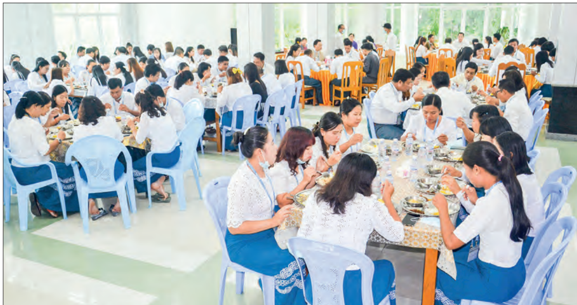
Union Information Minister U Maung Maung Ohn takes lunch together with MRTV staff in Nay Pyi Taw yesterday.

The Union minister said the newscasters should be proud of their work as they are serving duties for the channels of state-owned MRTV. Among the broadcasting services, it has to serve duty in person and should have confidence and learn continu-