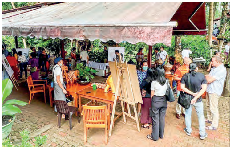
The launching event of the Lab is in progress on 26 October.

THE Lab is a subsidiary of Yever in Yangon, which is a consultancy offering custom-made solutions to corporate leaders, comprised of business consultants who provide pro-bono and low-bono