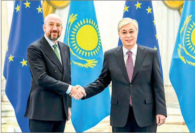
Michel is visiting two weeks after Astana hosted summits involving Russia.

EU chief Charles Michel called on Thursday for closer ties with Central Asia on his first official visit to Kazakhstan, the main economic powerhouse in a region where Russia's influence has come under question.