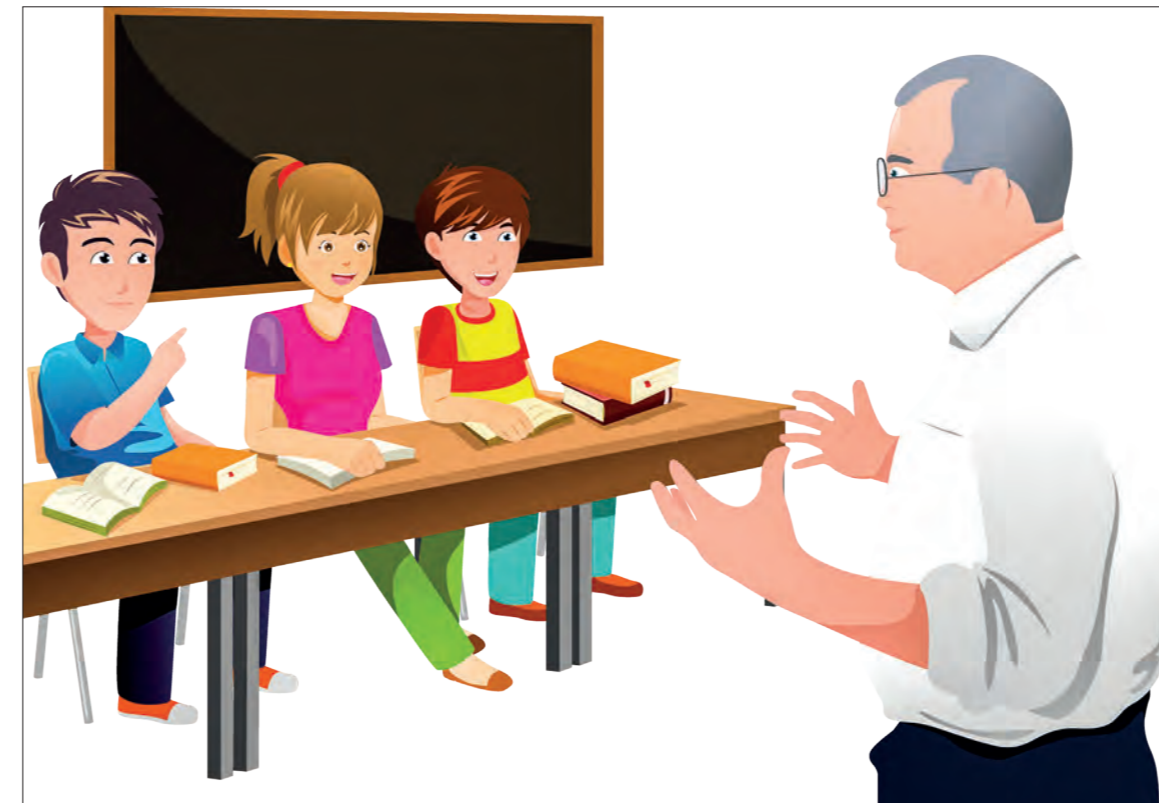
One of the problems with the pressure of expectations is that many teachers and schools don't have effective mental health strategies.

High expectations can put students under intense pressure. In an article, once I read about how students in high-achieving schools have been designated as an "at-risk" group, the author wrote, "The unrelenting pressure on students in high-achieving schools comes from every direction, from overly invested parents who want. As coaches who want wins for their own personal reputations and school administrators who feel pressured to get high standardized scores in their school." It is hard to get things right when you have expectations dragging you down, especially when it's coming from the people you know or love. Sometimes