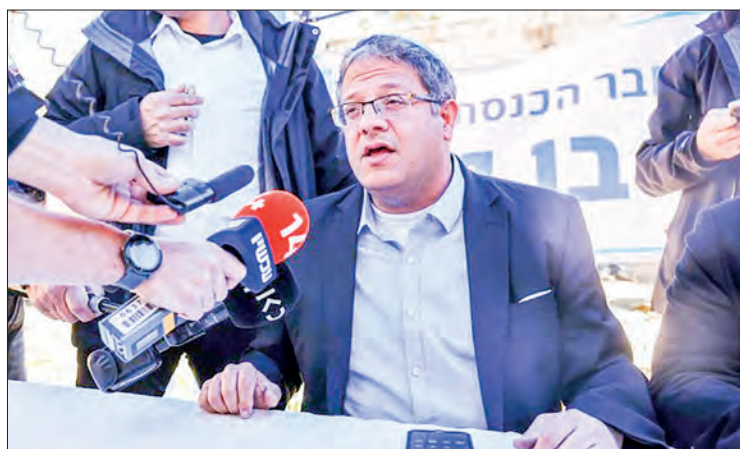
Extremist Israeli Knesset member Itamar Ben-Gvir in Jerusalem on 13 February 2022.

"I don't say one thing and think something else," added the 46-year-old. "I offer my truth and my truth is that we must save the country."