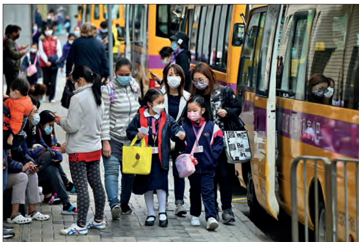
Children are escorted from school in Hong Kong on 11 Jan 2022, as the city announced the suspension of face-to-face learning at all kindergarten and primary schools until after the Lunar New Year.

He had been visiting Bahrain and Saudi Arabia to build trade ties and was scheduled to return Thursday. But he tested positive