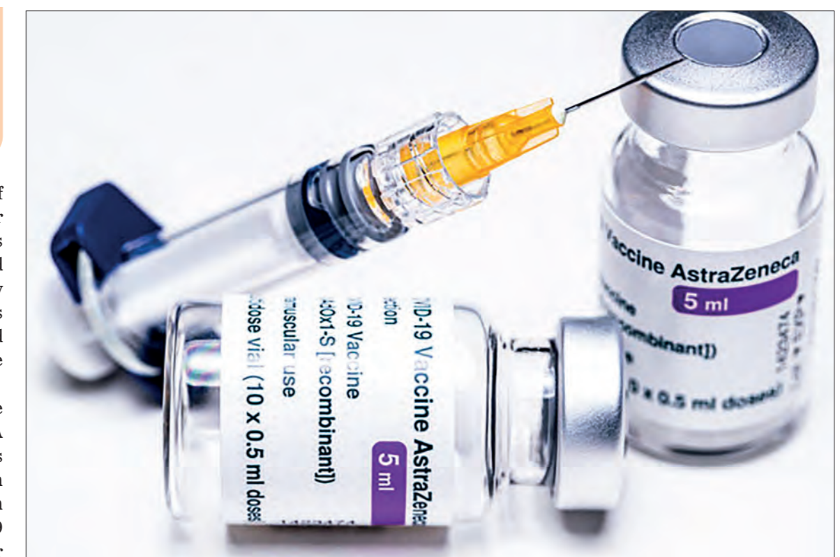
Vials of the AstraZeneca COVID-19 vaccine and a syringe.