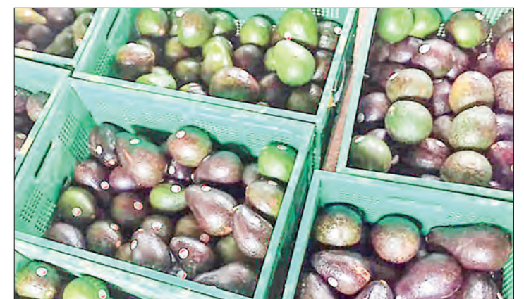
Samples of Myanmar avocados to be exhibited.

Avocados are grown in Shan State, Chin State, Mandalay Region and upper Sagaing Region in Myanmar. There are 23 avocado varieties, around 20,000 acres of avocado plantations and over 6,000 avocado farmers in Myanmar.