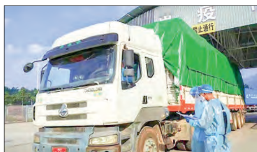
A truck is being inspected at a border post between Myanmar and China.

Following the ease of COVID-19 restrictions, Myanmar's border posts (Chinshwehaw, Kyinsankyawt and Kampaiti) were back to business. Additionally, Yuan-Kyat direct payment in the border trade was also allowed. Afterwards, the authorities are prioritizing the Sino-Myanmar border to return to normalcy, export promotion to China and increasing the income of the Myanmar citizens. — TWA/GNLM