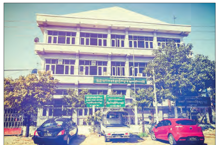
The Internal Revenue Department in Mandalay Region.

In addition, the IRD notified that they have arranged CBM-NET — the payment network