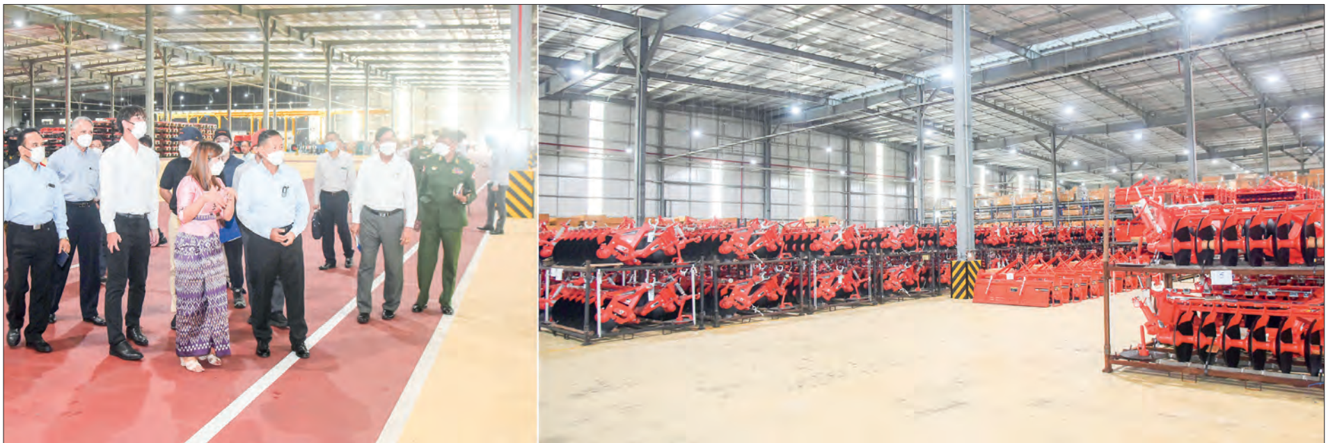
State Administration Council Vice-Chairman Deputy Commander-in-Chief of Defence Services Commander-in-Chief (Army) Vice-Senior General Soe Win views round the Kubota Myanmar Co Ltd in the Thilawa Special Economic Zone on 27 October 2022.

AS Thilawa SEZ is a successful one, efforts must be made for achieving more success, said Vice-Chairman of the State Administration Council Deputy Commander-in-Chief of Defence Services Commander-in-Chief (Army) Vice-Senior General Soe Win in a meeting with officials of Thilawa Special Economic Zone Management Committee at the Chairman Office of the Zone yesterday afternoon.