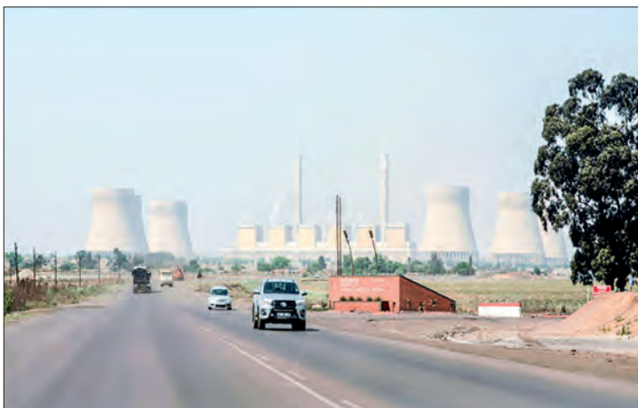
The South African government has for more than a decade poured billions of rands into Eskom, which provides almost all of South Africa's electricity.

"The debt takeover, once finalized, together with other reforms will ensure that Eskom is financially sustainable," he said. The government has for more than a decade poured billions of rands into Eskom, "with limited improvements in the reliability of the electricity supply or the financial health of the company," he said. Sweeping power outages, caused by failures at ageing and poorly maintained infrastructure at Eskom — which provides almost all of South Africa's electricity — have worsened in recent months.—AFP