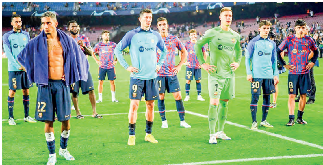
Barcelona's players face their supporters after they were eliminated at the Champions League group stage for the second consecutive year.

BARCELONA exited the Champions League at the group phase for the second season running on Wednesday, a 3-0 home defeat by Bayern Munich rubbing salt in the