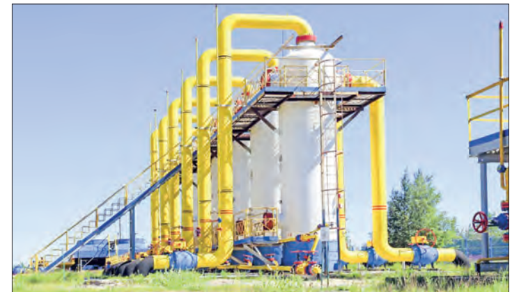
The EU Commission chief is set to visit Albania, Kosovo, Montenegro and Serbia in the coming days. Albania is working to diversify its energy sources, including by introducing gas and wind power.

The news will likely come as welcome relief to many countries across the Western Balkans, including North Macedonia where domestic production of electricity meets only two thirds of the country's annual needs. —AFP