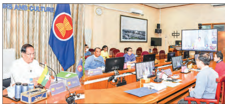
Union Minister U Ko Ko attends the tenth ASEAN Ministers Responsible for Culture and Arts Meeting and related meetings virtually.

Speaking at the 10 th AMCA Meeting, Minister of Information, Culture and Tourism Madam Sunanesavanh Vignaket of Laos said the sociocultural sector plays a key role in implementing the socio-economic development project in the post-COVID-19