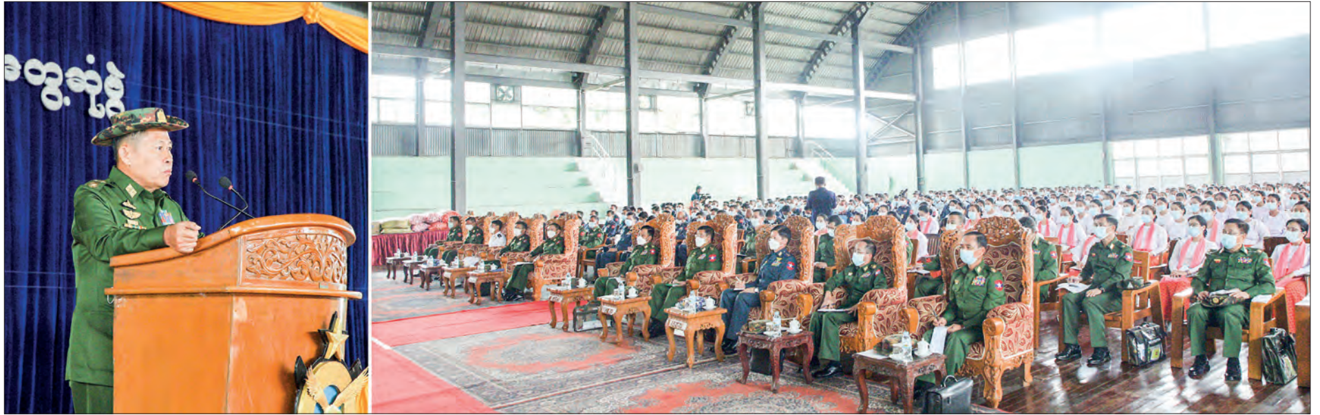
SAC Vice-Chair Deputy Commander-in-Chief of Defence Services C-in-C (Army) Vice-Senior General Soe Win meets officers, other ranks and family members of the Mingaladon Station in Yangon Region on 27 October 2022.

VICE-CHAIRMAN of the State Administration Council Deputy Commander-in-Chief of Defence Services Commander-in-Chief (Army) Vice-Senior General Soe Win met with Tatmadaw members and families from Mingaladon Station at the station hall yesterday morning.