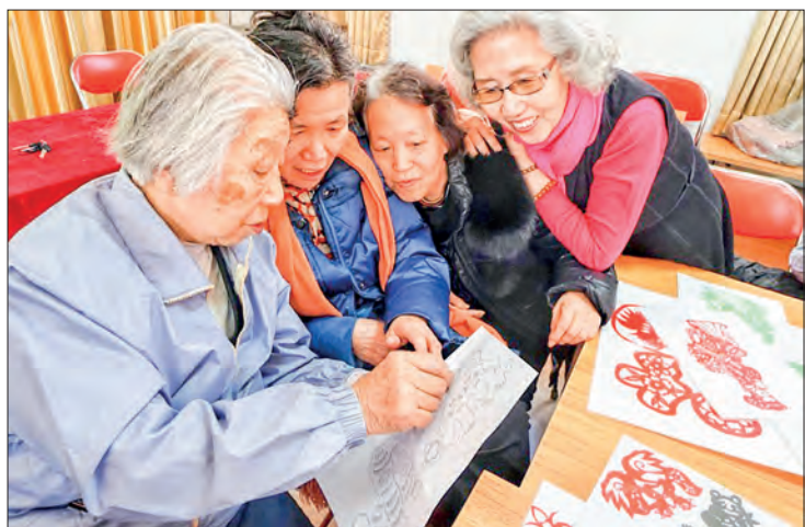
Elderly women attend a paper-cutting workshop organized by a local community in Fengtai District of Beijing, capital of China, 8 March 2018.