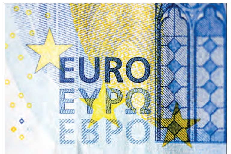
Analysts see an interest rate hike of 0.75 percentage points as a done deal.

ECB is fighting back with a series of rate hikes intended to dampen demand by making credit more expensive for households and businesses -- at the risk of triggering an economic downturn.