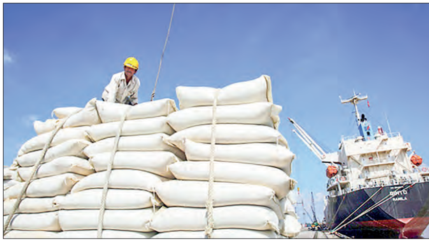
The photo shows bags of export rice being loaded onto the vessel.

Meanwhile, Myanmar sent over 3,110 tonnes of broken rice worth $1.122