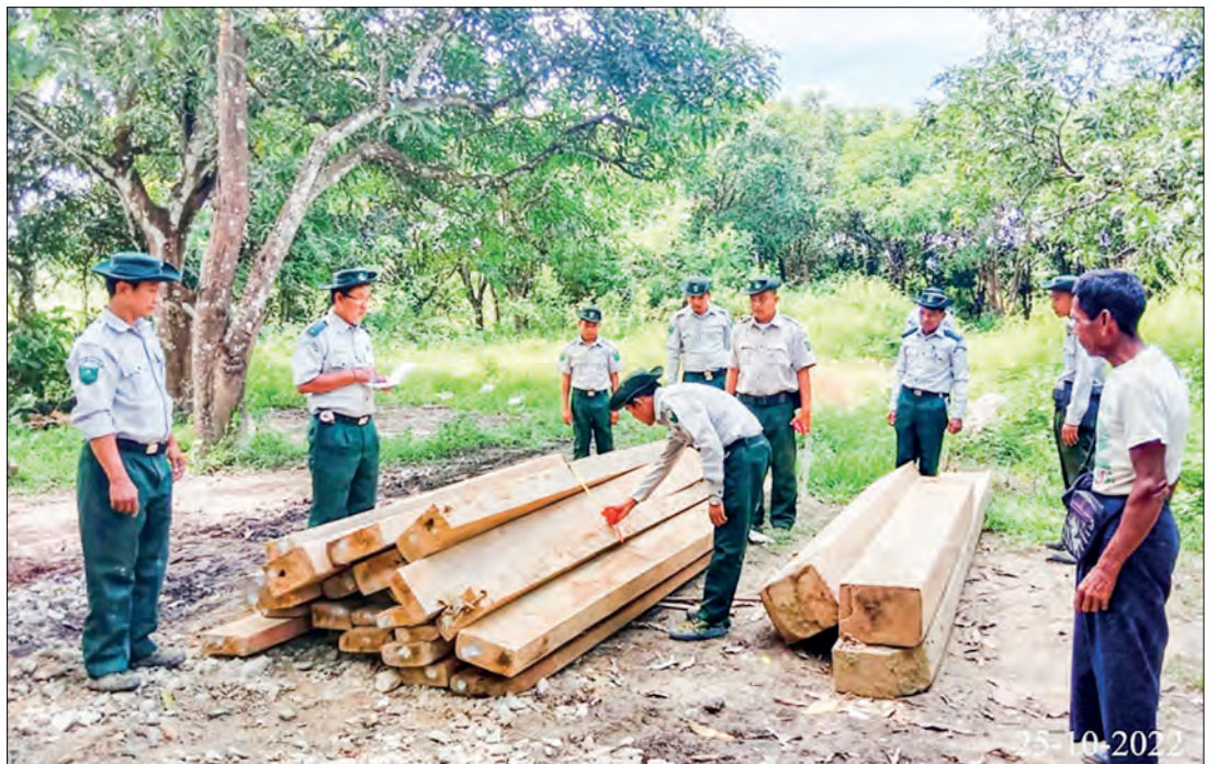
Officials measure confiscated illegal timbers.

SUPERVISED by the Anti-Illegal Trade Steering Committee, an on-duty team captured an unregistered Super Custom car (estimated value of K6 million) at Kyweye Combined Checkpoint on 26 October. The action was filed under the Export and Import Law.