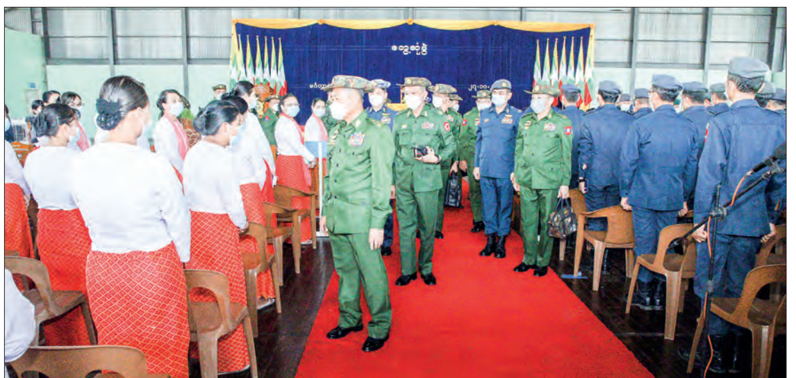
The Vice-Senior General warmly greets the attendees at the meeting event.

PDF to commit terror acts, legal efforts of the Tatmadaw to protect the life and property of the innocent people, nuns and monks and health and education staff who suffered brutal killing by NUG, CRPH and PDF terrorists, encroachments of some big countries which do not wish assumption of the State responsibilities of the Tatmadaw on administration mechanism of the State Administration Council, implementation of the five-point road map and nine objectives of the SAC, root causes of implementing the two national aspirations: prosperity of the State and food sufficiency, and two political processes: strengthening the genuine, disciplined multiparty democratic system and building the Union based on democracy and federalism, encouragement of the Prime Minister for agriculture, livestock and MSME sectors