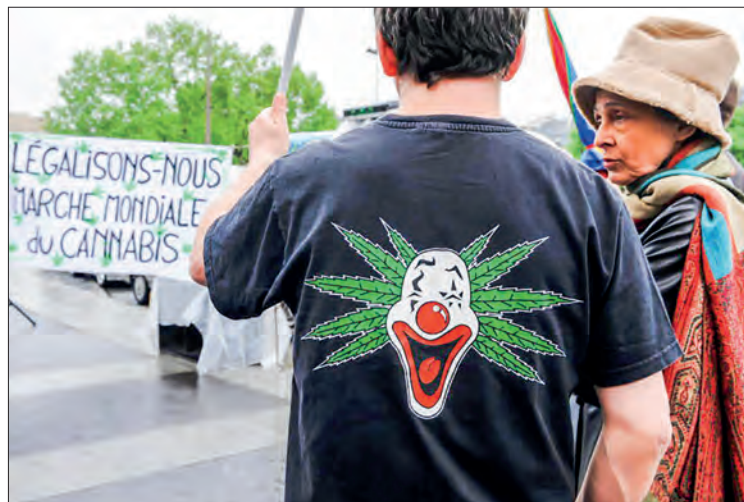
The Global Marijuana March (GMM), also referred to as the Million Marijuana March (MMM), is an annual rally held at different locations around the world on the first Saturday in May.

Under the draft plans, production and supply of cannabis would be "permitted in a licenced and state-controlled framework", Health Minister Karl Lauterbach said at a news conference. Consumers would be allowed to purchase a maximum of between "20 and 30 grammes" of dried cannabis leaf for their private consumption, with supplies distributed through a net-