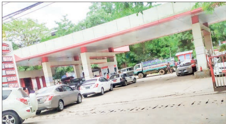
Cars are pictured queuing for fuel oil at the petrol station in Sangyoung Township.

THE cars have been queuing at petrol stations as people think local fuel prices will be higher, and such cases caused traffic jams near fuel stations on 22 October.