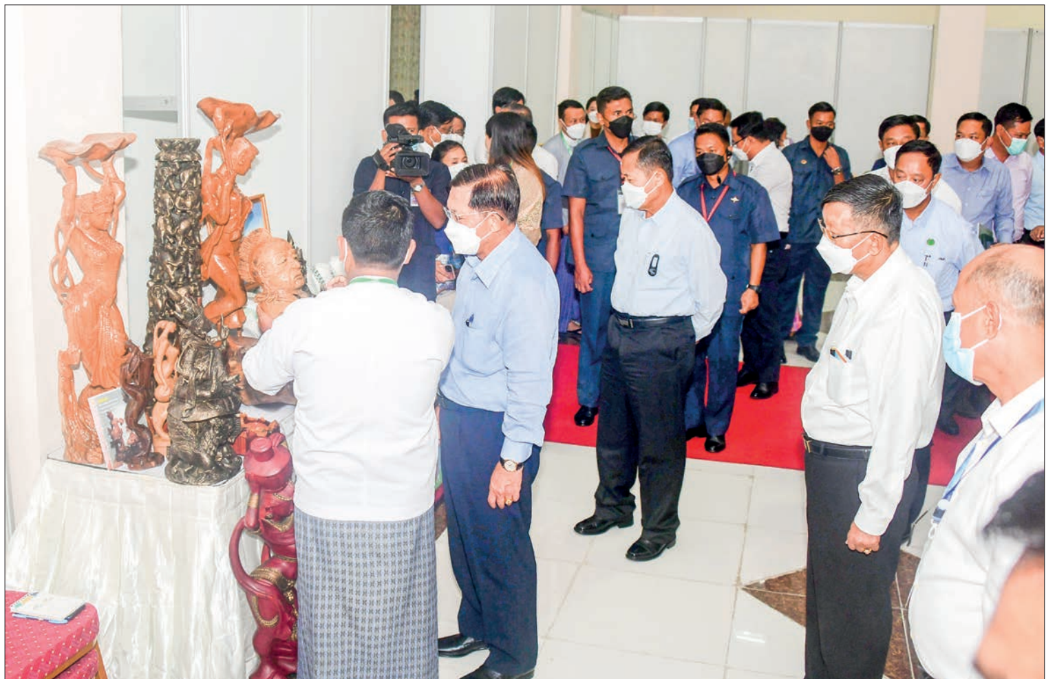
State Administration Council Chairman Prime Minister Senior General Min Aung Hlaing views round the value-added products manufactured by the MSMEs in Nay Pyi Taw Council Area on 22 October 2022.