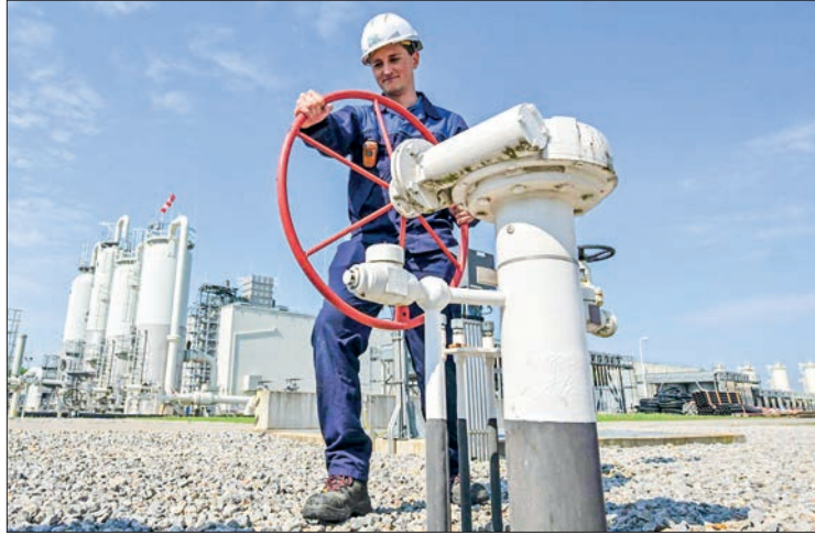
At least 15 EU countries – more than half the bloc – are pushing for an ambitious cap on prices and are increasingly unsettled by strikes and protests over the cost of living spreading across France, Belgium and other member states.

The summit agreement set out a "solid roadmap to keep on working on the topic of energy prices", European Commission chief Ursula von der Leyen told a media conference.