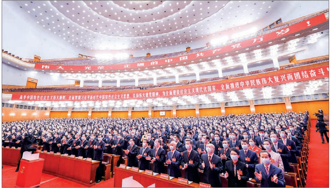
Delegates attend the closing session of the 20 th National Congress of the Communist Party of China (CPC) at the Great Hall of the People in Beijing, capital of China, 22 October 2022.

The event will be broadcast live by China Media Group and Xinhuanet. It will also be relayed simultaneously by television and radio stations across China, as well as news websites, new media platforms, large outdoor screens and mobile televisions.—CGTN/Xinhua