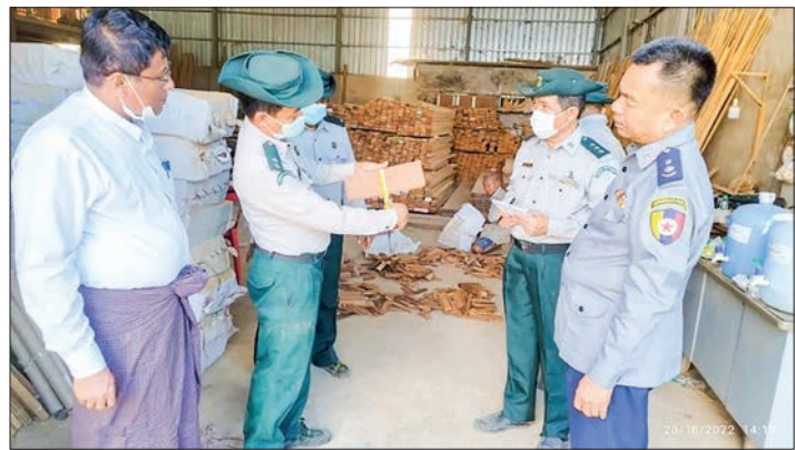
Officials check confiscated goods in Yangon Region.