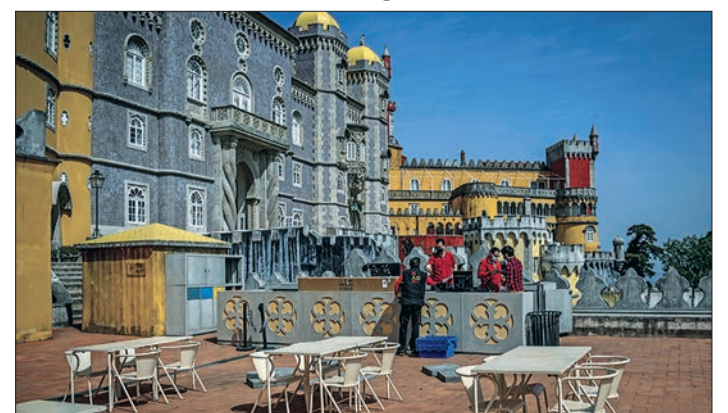
Technicians work at the esplanade of the Pena Palace in Sintra, west of Lisbon on 31 March 2021, days before the reopening of museums and monuments following coronavirus restrictions.

The measures are part of a state package called "Families First" that focuses on reducing the impact of inflation in Portugal.