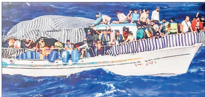
Thousands of migrants heading to the eastern Greek islands are increasingly opting to take larger boats, such as sailboats and yachts.

The Greek coastguard says it has rescued about 1,500 people in the first eight months of the year, up from less than 600 last year.—AFP