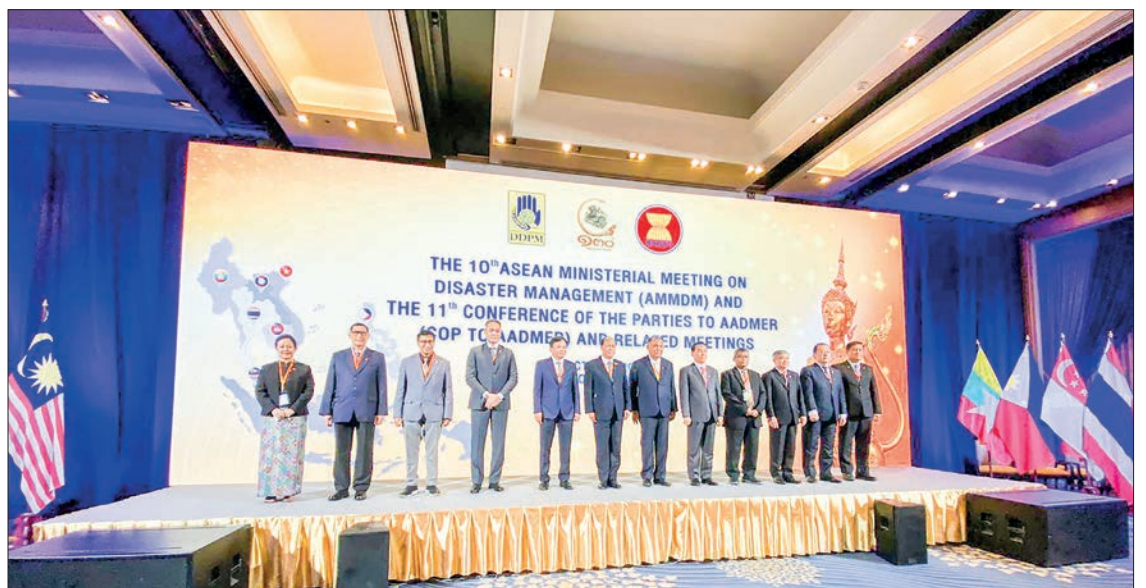
The MoSWRR Union Minister poses for the group photo at the ASEAN Ministerial Meeting on Disaster Management in Bangkok, Thailand on 20 October 2022.

Then, the ASEAN ministers for natural disaster management held ministerial meetings with ministers from China, Japan and Korea separately and discussed the cooperation work in natural disaster management with ASEAN and a joint statement on natural disaster management.