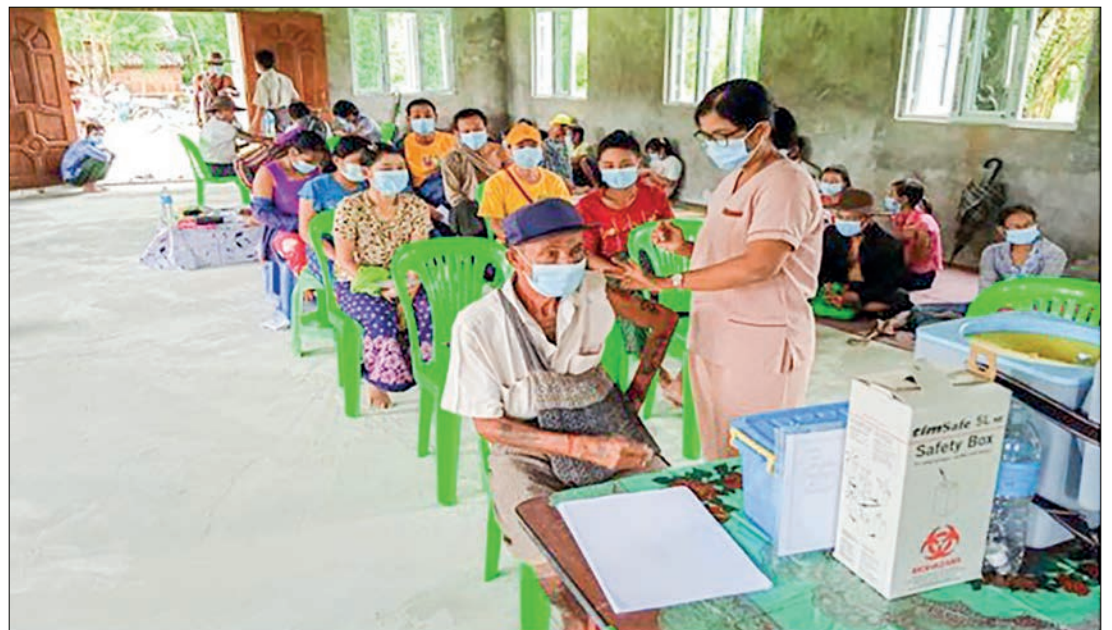
A health staff administers Covid vaccines to locals in Kangyidaunt Township.

VACCINATION is being carried out in full swing in various regions and states as the vaccination programmes are one of the most important activities in the prevention, control and treatment of COVID-19 disease.