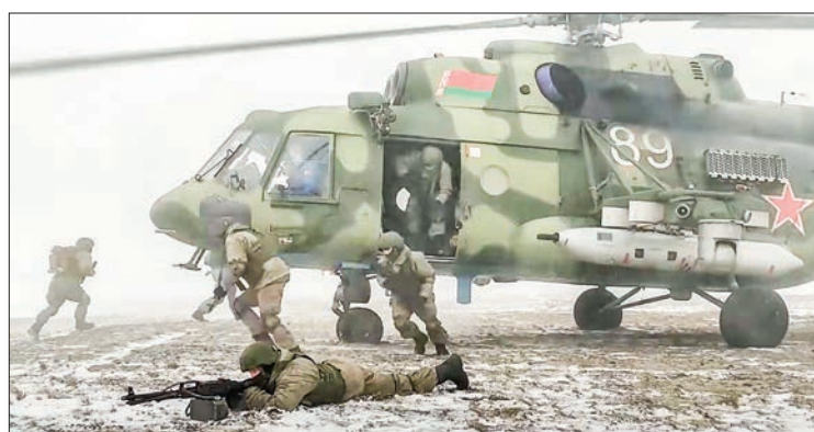
Soldiers from Belarus and Russia take part in a joint exercise at a firing range in Belarus on 4 February 2022.

An offensive could be launched "to the west of the Be-