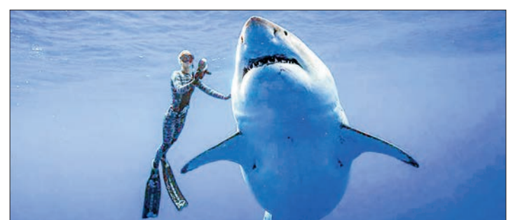
Big fishes living in the open ocean, like tunas, prefer to scrape on sharks, rather than on other fish species.

“Tunas were quite orderly, lining up behind the shark and taking turns to brush against the tail. Rainbow runners were unruly, forming a school around the back half of the shark and darting out in turns to bump against its body,” the researchers said, when detailing different scraping behaviours between various fish species.—Xinhua