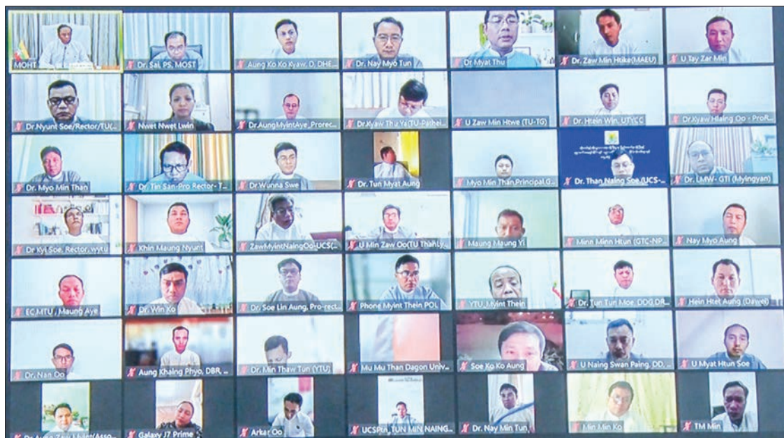
The videoconference between the MoHT Union Minister and civil servants who studied in the Russian Federation is in progress.

Then, the permanent secretary of the Ministry of Science and Technology and participants