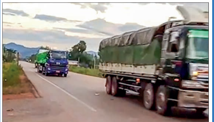
According to the residents, vehicles stuck on the Myawady-Kawkareik Road have been allowed to travel since the evening of 22 October.