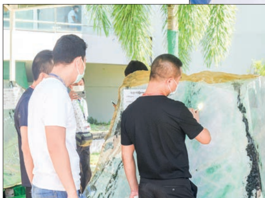
Gem traders are keen on viewing the jade lots at the emporium yesterday.