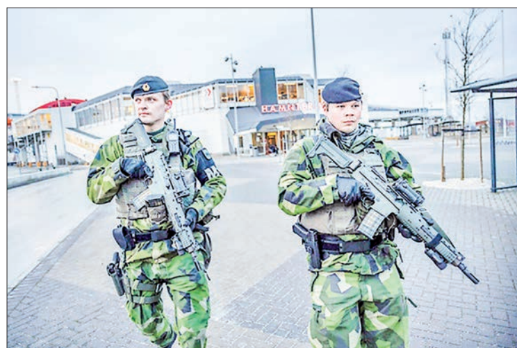
Soldiers from Gotland's regiment patrol in Visby harbour, Sweden.

Sweden and Finland earlier this year tore up their long-standing policies of non-alignment in the face of Russia's war on Ukraine and launched their bids to join the US-led military alliance.