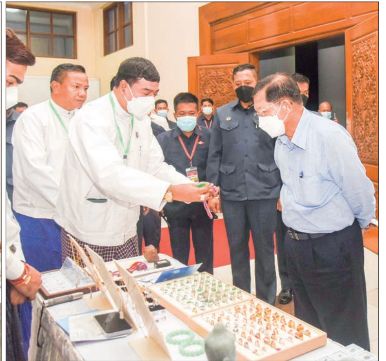
State Administration Council Chairman Prime Minister Senior General Min Aung Hlaing looks into the products exhibited at the event in Nay Pyi Taw on 22 October 2022.