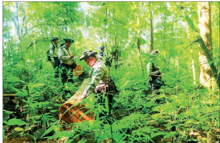
Officials measure confiscated illegal teak logs in Bago Region.

Therefore, six arrests (estimated value of K336,503,944) were made on three consecutive days from 20 to 22 October, according to the Anti-Illegal Trade Steering Committee. — MNA