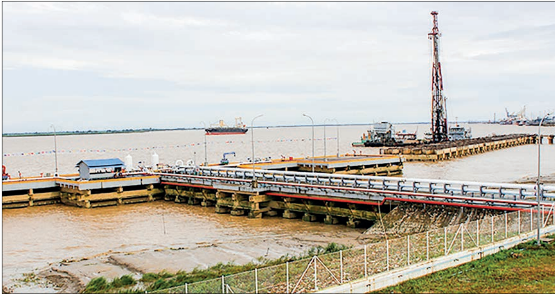
The picture shows a jetty of Thilawa Port where oil tankers unload their cargoes - fuel oil.

OIL tankers carrying over 10 million gallons of fuel oil docked at Thilawa Port and the fuel oil unloading process is being undertaken, according to the Supervisory Committee on Oil Import, Storage and Distribution of Fuel Oil.