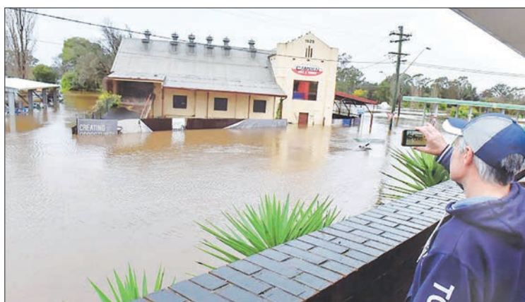
A man films flooded streets due to torrential rain in the Camden suburb of Sydney in July.

FLOODING in Australia's south-east will harm the country's projected economic growth, the treasurer has confirmed.