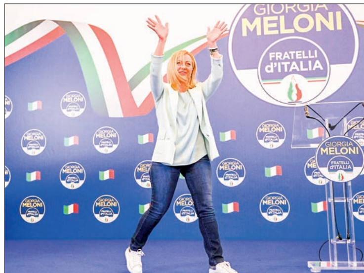
Giorgia Meloni acknowledges the audience after she delivered an address at her party's campaign headquarters overnight on 26 September 2022, in Rome after winning the national election.

GIORGIA Meloni, leader of the far-right populist Brothers of Italy (FdI) party, became Italy's first woman prime minister on Friday.