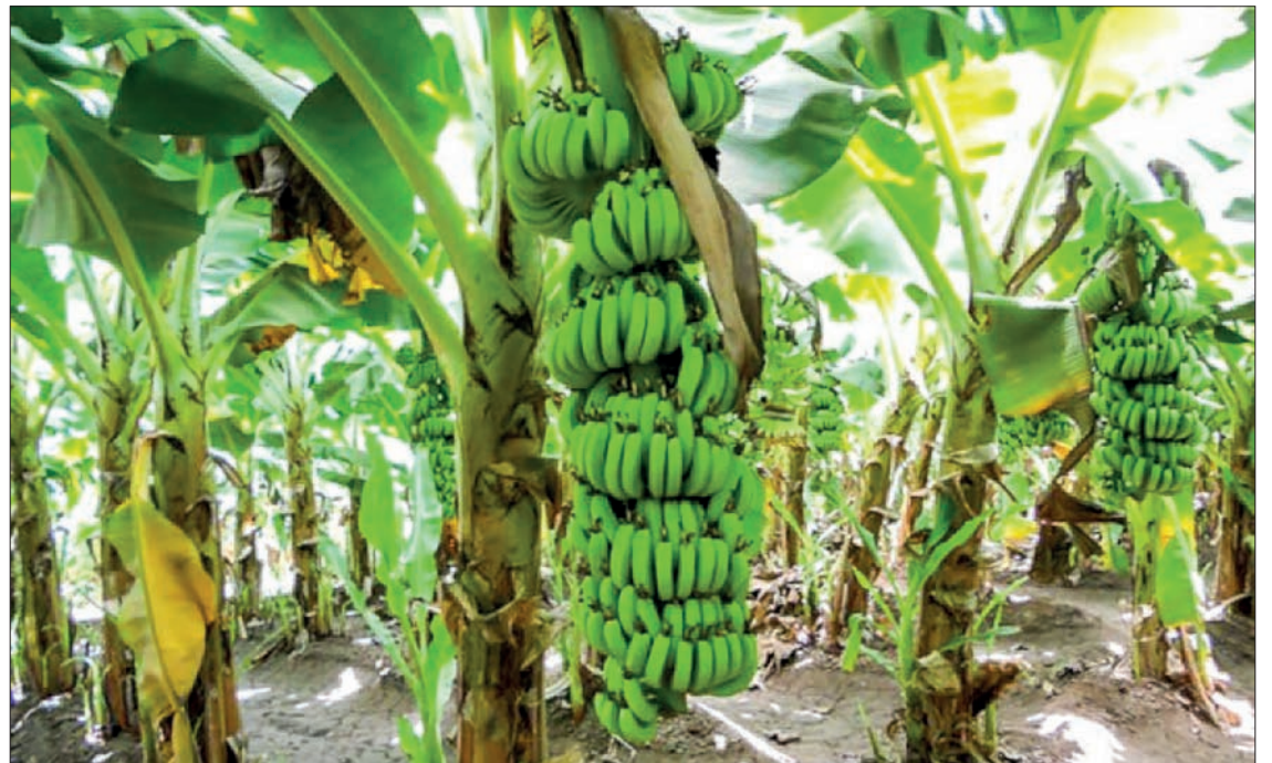
GM bananas are grown on the local farm.

GM bananas were mainly exported from Kachin State's Kampaiti border trade post to China during the rainy season, from 1 April to 17 June 2022, and