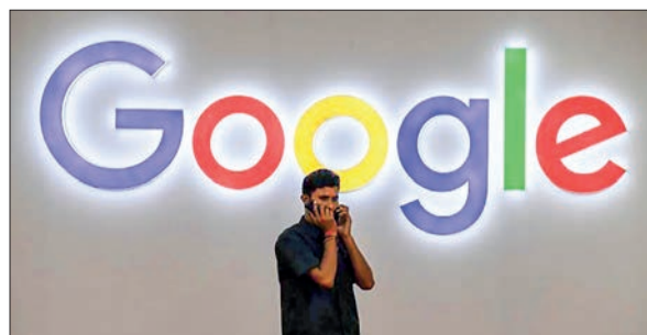
The California-based company's Android mobile operating system is by far the dominant player in India and is run on 95 per cent of all the country's smartphones.

Android had a suite of Google apps pre-installed on its phones, including the company's own search engine, "which accorded significant competitive edge to Google's search services over its competitors", a CCI statement said late Thursday. —AFP