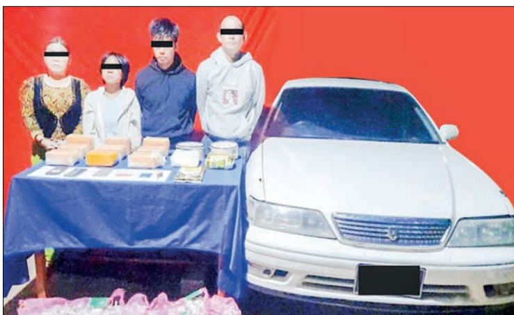
Four arrestees are seen along with seized drugs and a saloon.

regional commands in collaboration with district and township administrative officials, departmental personnel and members of civil society organizations (CSOs) conducted educational campaigns such as prevention of COVID-19, wearing of masks in public places and distribution of masks to the locals at schools, markets, streets, city entry points and crowded areas in 44 townships in Yangon Region yesterday. — MNA