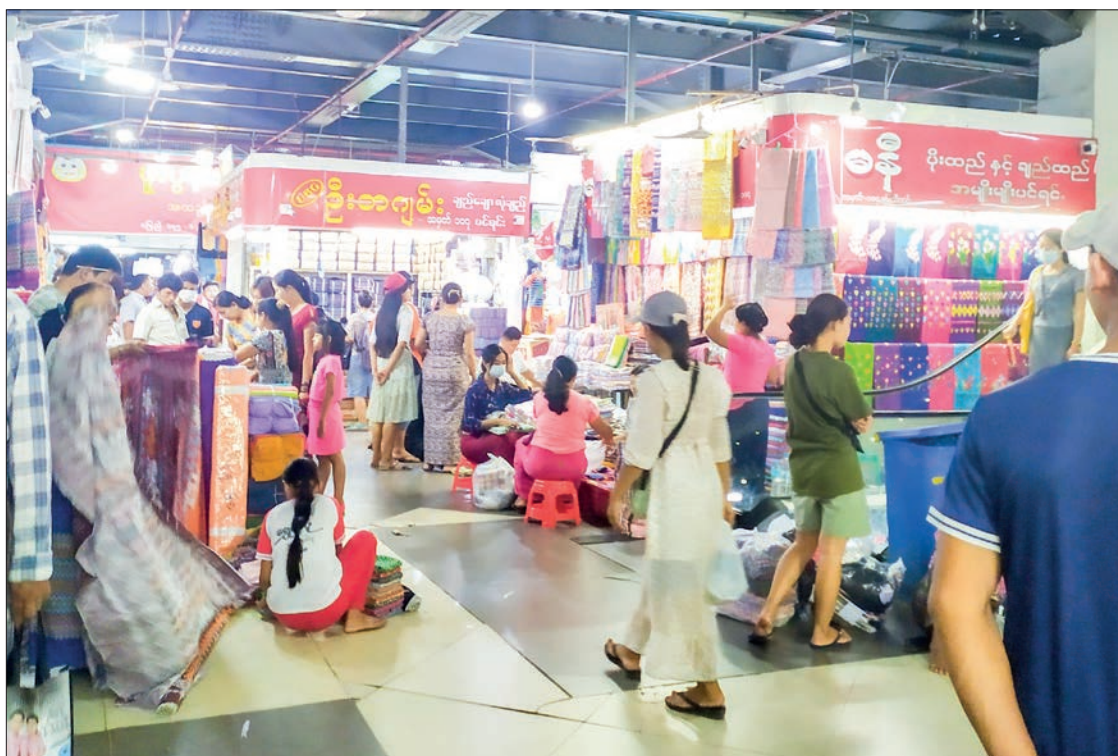
Garment shops in the Mingala Mon Market are running as normal on 22 October noon.

In Thanzay (Iron Bazaar), some Chinese product shops did not sell materials as the exchange was not stable. In the cooking oil market, although companies suspend sales those