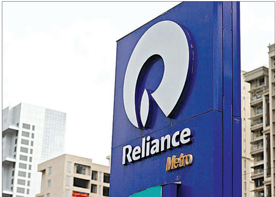
Reliance, which is owned by Asia's second-richest man Mukesh Ambani, reported a net profit of 136.56 billion rupees ($1.65 billion) between July and September, 0.2 per cent lower than the same period last year.

Revenues from operations increased 33.7 per cent on-year to 2.33 trillion rupees, helped by strong contributions from Reliance's newer consumer-facing businesses.