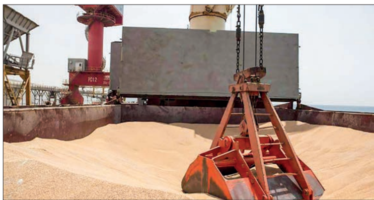
As of Wednesday, the total tonnage of grain and other foodstuffs exported through the initiative had reached almost eight million metric tons, of which more than 70 per cent was maize and wheat.

THE United Nations insisted Thursday that the deal on exporting grains from Ukraine is