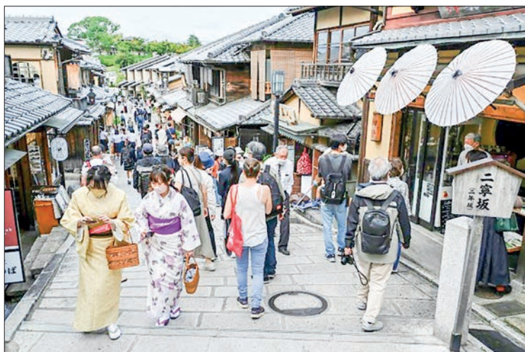
Japan scrapped its Covid-19 border restrictions and reopened to tourists this month.

THE falling yen hit 150 per dollar for the first time since 1990 on Thursday, driven down by the contrast between Japanese monetary easing and aggressive US interest rate hikes.