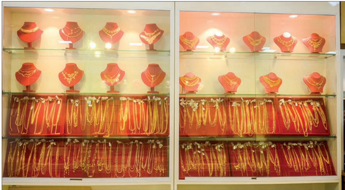
Gold jewellery is seen at one gold outlet in Yangon.

"YGEA determines the reference price based on the over-the-counter market rate as fuel oil is transacted based on that rate. Similarly, the banks purchase the salary of Myanmar citizens working overseas that came into the bank accounts at the highest rate. The market price of gold is also related to the dollar exchange rate in the grey market. To narrow the gap between the YGEA reference price and the market price, the association will also calculate