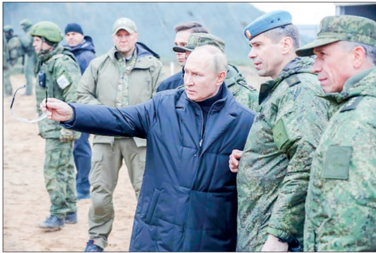
Russian President Vladimir Putin meets soldiers during his visit to a military training centre on Thursday.

“What kind of family do you have?” “A daughter. Five years old,” the mobilized soldier an-