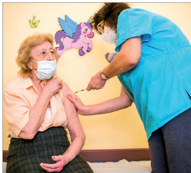
A woman receives a vaccine dose in Bulgaria, where the average life expectancy has dropped by three and half years since the start of the pandemic.

T HERE was a dramatic divergence in the average life expectancy of people in different global regions during the second year of the pandemic, a study found Monday, as higher vaccination rates helped some nations recover far more quickly than others.