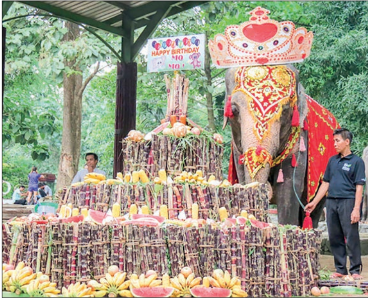
A 69 th birthday party of the elephant Mo Mo is in progress.

A living icon of the Yangon Zoological Gardens, Momo the elephant will be congratulated on its 69 th birthday for three consecutive days starting from 28 October. Stalls are also planning to sell products at the event.