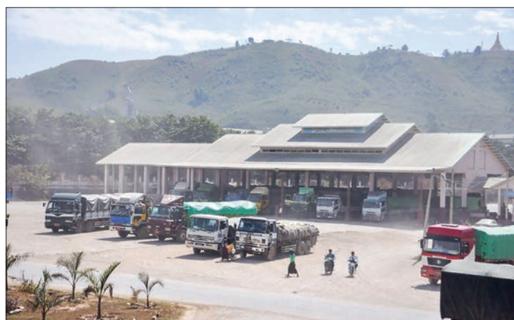
The Muse border trade post.

Broken rice fetches 120 Yuan per 50-kilo bag. The price of rice moves in the range between 140 and 150 Yuan.