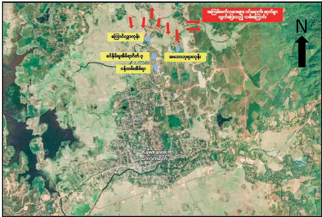
The map shows locations from where insurgents and terrorists intrude, retreat and run away.

BATTALIONS under KNU/KNLA Brigade 6, KKO (Split) group, so-called PDF terrorists under NUG and CRPH this morning launched fires into Kawkareik of Kayin State with heavy weapons and entered and attacked public residences, staff housings, offices and departmental buildings.