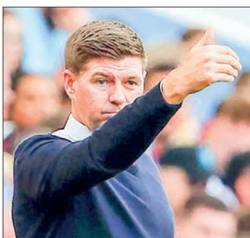
Steven Gerrard has been dismissed as manager of Aston Villa.

STEVEN Gerrard was sacked as Aston Villa manager less than two hours after his struggling side crashed to a dismal 3-0 defeat at Fulham on Thursday.