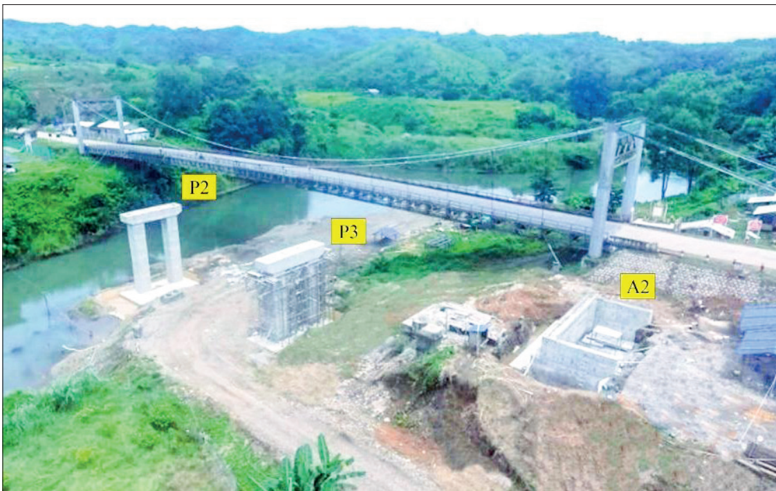
The construction site of the Thayu (Pe Pa Don) Bridge is seen from the side of An Township.

FOR the development of transportation in Rakhine State, the new Thayu (Pe Pa Don) Bridge was being constructed on the Minbu-An-Sittway Road of An Township in An District, Rakhine State, by the Department of Bridges under the Ministry of Construction. It is known that the bridge project is now 39 per cent completed. The Department of Bridges stated that the new Thayu (Pe Pa Don) Bridge, being constructed across Thayu Creek, is about 50 feet downstream from the original suspension bridge. The construction work started on 1 December 2021, and the bridge is going to cost K4.03 billion.