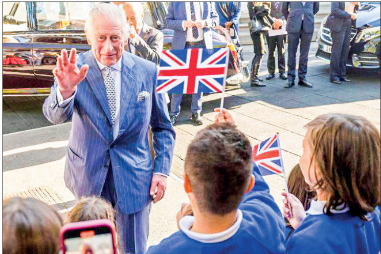
Britain's King Charles III is welcomed as he arrives to meet with members and staff of the association "Project Zero", an organization dedicated to engaging young people in positive activities, promoting social inclusion and strengthening community cohesion, during a visit of the centre in Walthamstow, in east London, on 18 Oct 2022.