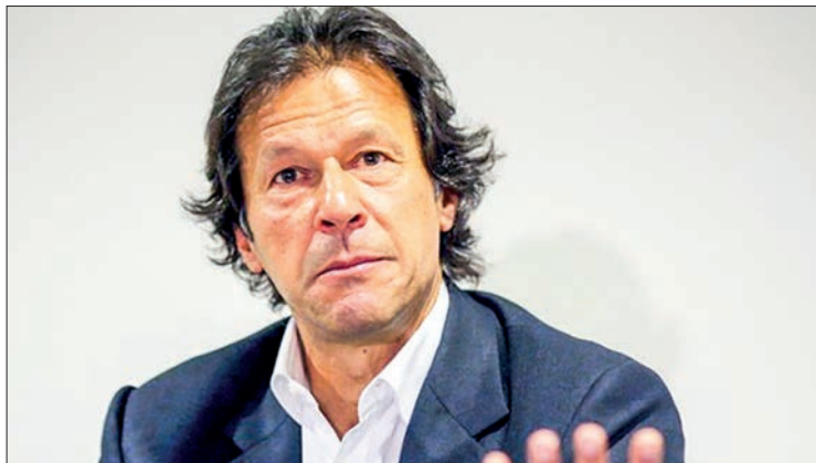
The case is another twist in political wrangling that began even before Khan's 10 April ouster.

Pakistan's courts are often used to tie up lawmakers in long-winding proceedings that rights monitors criticize for stifling political opposition,