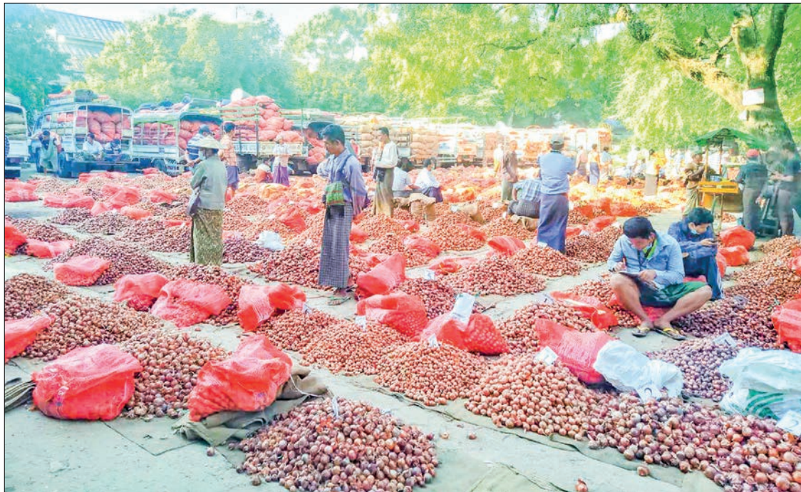
An onion market is seen in the monastic precinct located at Ward 4 of Pakokku city.

THE price of onions from Seikphyu area rose for the fifth day at Bayintnaung Wholesale Market, reflecting an increase of K550 per viss (a viss equals 1.6 kilograms).