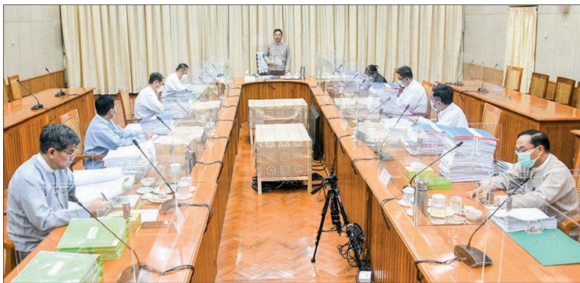
The meeting 4/2022 of the Myanmar Investment Commission is in progress, addressed by MIC Chair Lt-Gen Moe Myint Tun.

THE Myanmar Investment Commission (MIC) held its meeting 4/2022 at No 18 Union Government Office in Nay Pyi Taw yesterday.