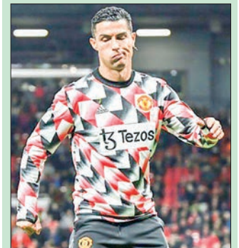
Cristiano Ronaldo is struggling to win a place in the Manchester United team.

MANCHESTER United manager Erik ten Hag confirmed on Friday that Cristiano Ronaldo refused to come on as a substitute during this week's win against Tottenham, saying there had to be “consequences” for his behaviour. Post-match talk following the impressive 2-0 victory over Spurs at Old Trafford on Wednesday has been dominated by the early exit of the 37-year-old Portuguese superstar. Ronaldo headed down the tunnel before the final whistle and made a hasty departure from Old Trafford.