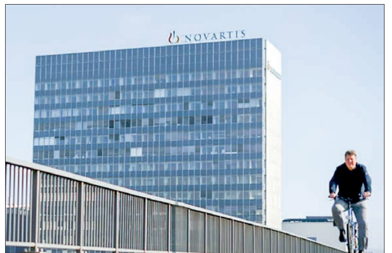
A sign of Swiss pharmaceutical giant Novartis is seen on the top of a building on 27 October 2015 in Basel.

“I am glad more people in (low and middle-income countries) will have access to this essential cancer medicine,” she said in the statement.—AFP