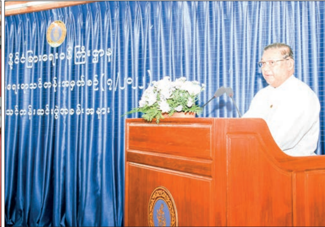
Union Minister U Wunna Maung Lwin concludes the Course in Diplomacy 7/2022 for junior officials in Nay Pyi Taw on 21 October 2022.

THE Graduation Ceremony of the Course in Diplomacy 7/2022 for junior officials, conducted by the Ministry of Foreign Affairs, was held at Win Zin Min Yazar