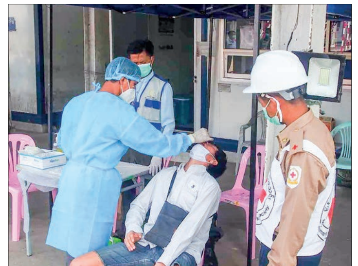
A returnee undergoes Covid test.

A total of 178 Myanmar migrant workers: 140 males and 38 females, who were charged and stranded in Thailand for various reasons, arrived back in Kawthoung via Ranong, Thailand by boat on 2 October. — TWA/GNLM