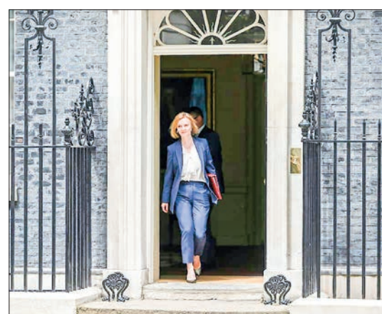
Liz Truss is set to become the shortest-serving prime minister in Britain's history, after the public, MPs and the markets comprehensively rejected the self-styled heir to Margaret Thatcher.

Having warned correctly of the disastrous consequences of her debt-fuelled tax promises, former finance minister Sunak has emerged as an early favourite to succeed Truss.—AFP