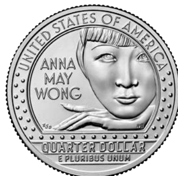
The quarter featuring Anna May Wong is in high demand, according to the US Mint.

Wong was born Wong Liu Tsong in 1905 in Los Angeles, California. She was cast in her first role as an extra in 1919's film "The Red Lantern" at 14 and took her first leading role in 1922's "The Toll of the Sea". Her career spanned motion pictures, television, and theatre. She appeared in more than 60 movies, including silent films and one of the first movies made in Technicolour. She also became the first Asian American lead actor in a US television show for her role