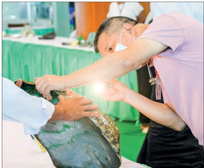
A gem dealer is seen evaluating the jade.