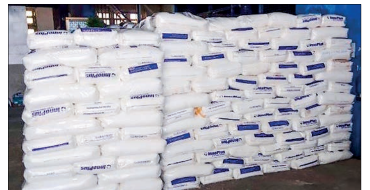
Seized illegal commodities.

Therefore, 11 arrests estimated at K160,575,672 were made on three consecutive days from 19 to 21 October, according to the Anti-Illegal Trade Steering Committee.—MNA