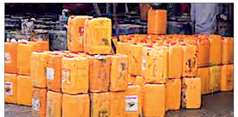
A picture shows palm oil jerry cans to be sold in the market.

The traders have to closely observe the market due to the price fluctuations, said U Htay, a