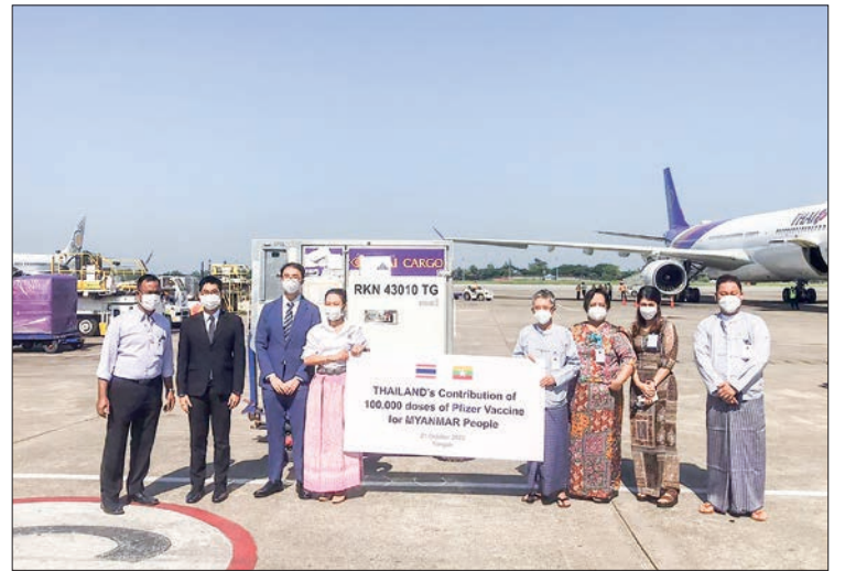
Pfizer vaccines and syringes donated by Thailand for children arrive at Yangon International Airport yesterday.