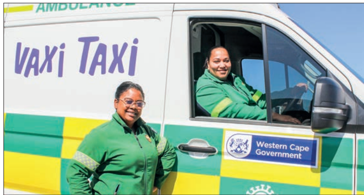
An ambulance converted to facilitate vaccinations at a COVID 19 vaccination event in Manenberg, which is part of the Vaxi-Taxi mobile vaccination drive, on 8 December 2021 in Cape Town.

EFFORTS to vaccinate 70 per cent of people in Africa against Covid-19 are stalling, the World Health Organization warned Thursday, with only three states out of 54 reaching the target.