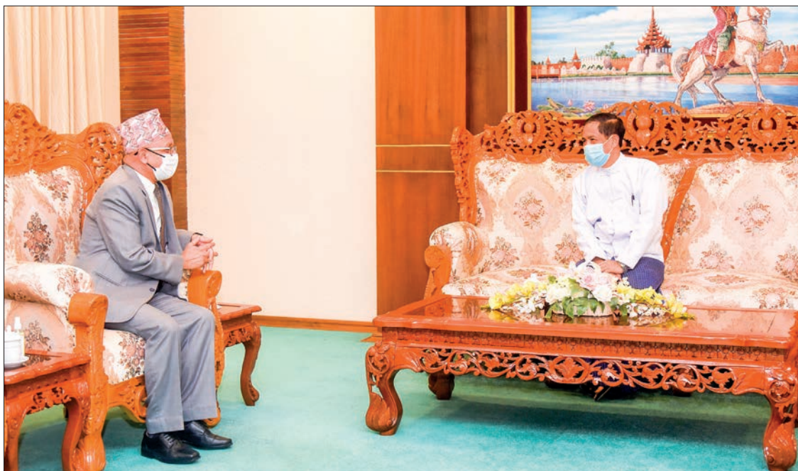
The Nepali ambassador calls on Union Minister U Ko Ko Hlaing yesterday.

UNION Minister U Ko Ko Hlaing of the Ministry of International Cooperation of the Republic of the Union of Myanmar received Mr Harishchandra Ghimire, Ambassador Extraordinary and Plenipotentiary of Nepal to the Republic of the Union of Myanmar at 4 pm on 21 October 2022