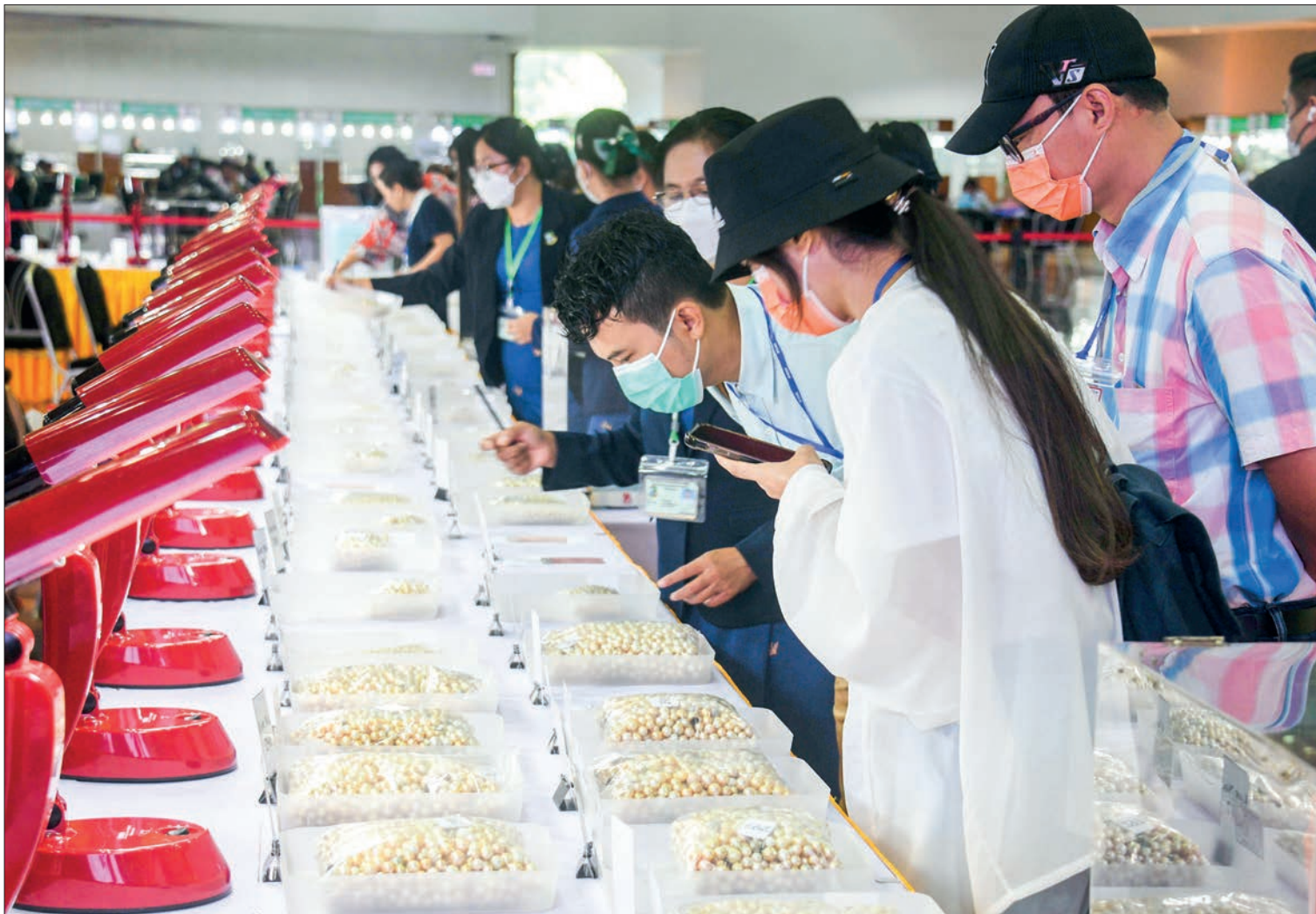
Local and foreign gem merchants are pictured enthusiastically looking into the pearl lots displayed at the 2022 Mid-Year Gems Emporium in Nay Pyi Taw on 21 October 2022.

THE third day of the 2022 Mid-Year Gems Emporium continued at the Maniradana Jade Hall in Nay Pyi Taw yesterday.