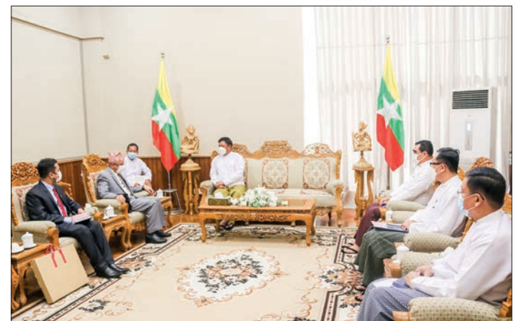
Union Minister Admiral Tin Aung San receives the ambassador of Nepal to Myanmar yesterday.

UNION Minister Admiral Tin Aung San of the Ministry of Transport and Communications received Mr Harishchandra Ghimire, Ambassador of Nepal to Myanmar, at the ministry in Nay Pyi Taw yesterday morning.