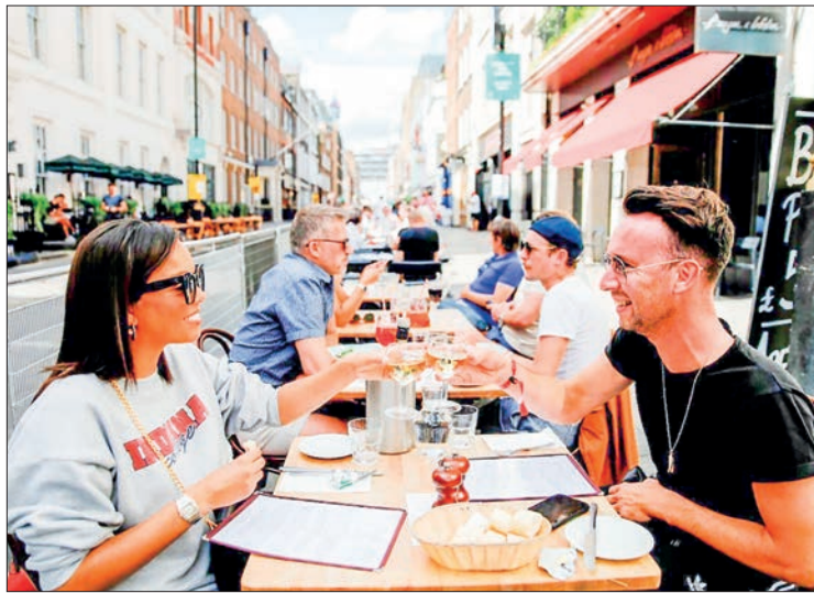
Diners enjoy their drinks as they sit at tables outside a restaurant in London in August 2020.

Separately, the consumer group stated Wednesday that