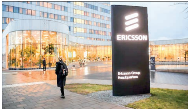
Ericsson headquarters in Stockholm.

Ericsson's shares sank by more than 11 per cent as the Stockholm stock exchange opened while Nokia tumbled by four per cent in Helsinki. Sweden's Ericsson reported a net profit of 5.4 billion Swedish kronor ($480 million) between July