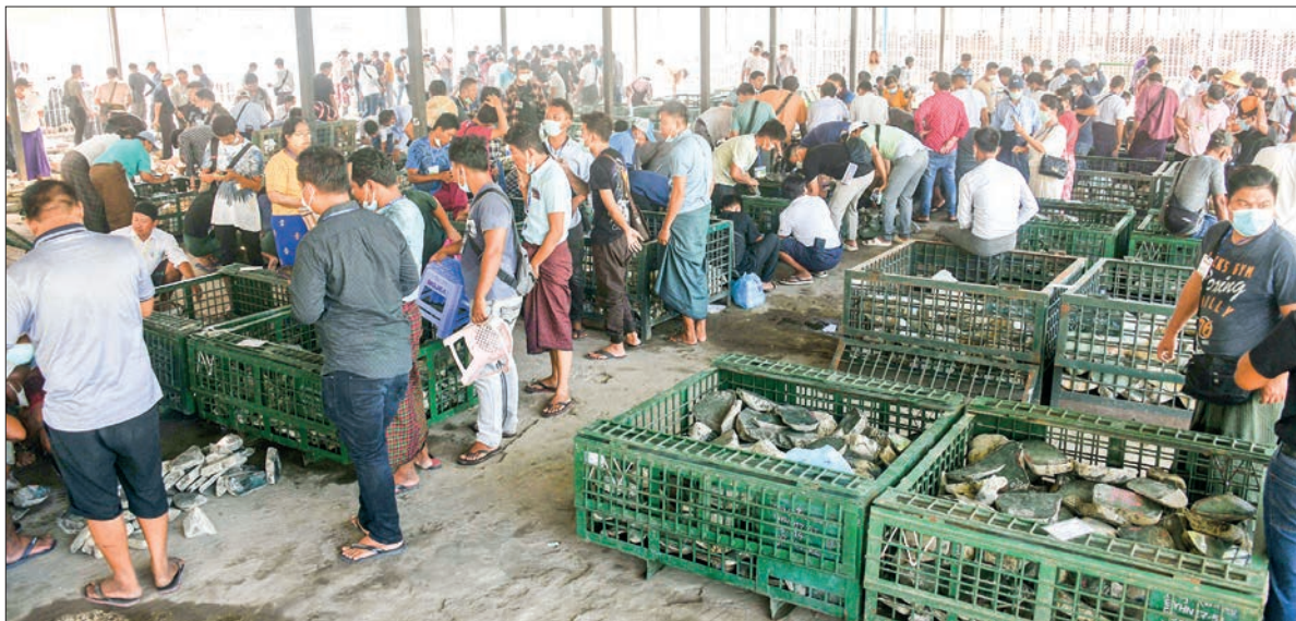
Gem traders are keen on observing the jade lots at the emporium yesterday.