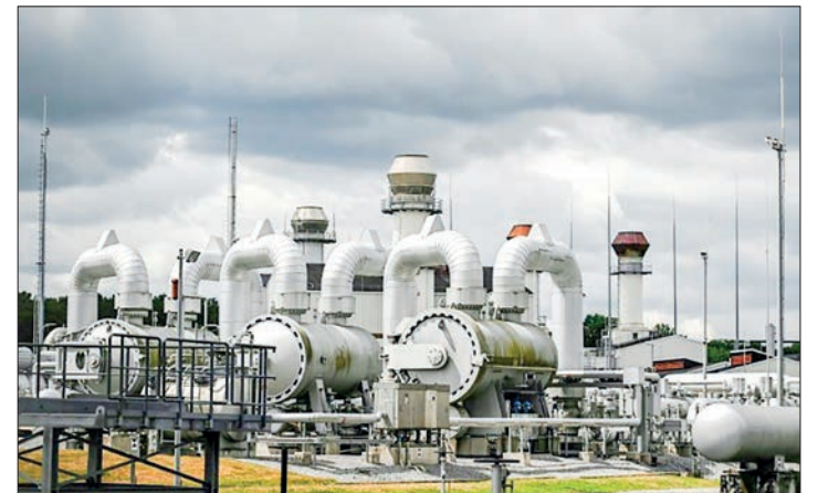
Russia’s war in Ukraine has sent gas prices spiralling.

If this summit does not result in a “clear political signal that we...no longer tolerate high gas prices”, it will be “Europe’s failure”, Belgian Prime Minister Alexander De Croo said on Monday. The European Commission, the EU’s executive arm, has tried to satisfy the diverging views with a series of proposals that it hopes will help Europeans pay for their heating as winter approaches.—AFP