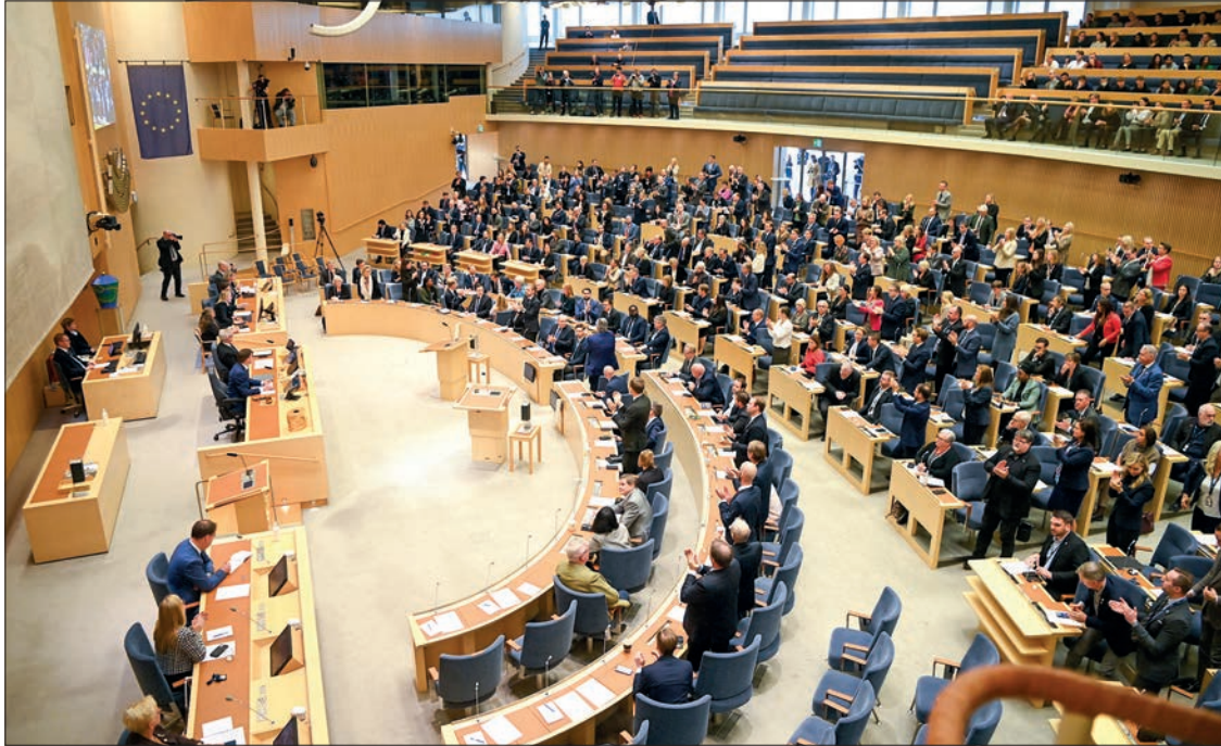
Members of the Swedish parliament applaud after the vote to elect the new Swedish Prime Minister.

SWEDEN'S conservative leader Ulf Kristersson was on Monday elected prime minister in parliament, heading the first government supported by the far-right Sweden Democrats.