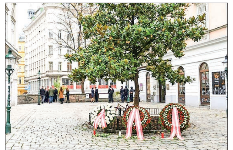
Four people were killed and 23 others wounded in Austria's first deadly jihadist attack. PHOTO: AFP/FILE

The accused face charges ranging from participating in terrorist crimes in connection with murder to involvement or membership in a terrorist group.—AFP