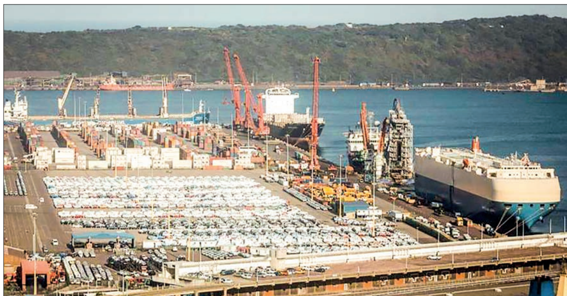
Cargo vessels are seen at the Port of Durban harbour in Cape Town on 27 July 2021.

The strike cost mining firms 815 million rand ($45 million) in exports a day, according to the Minerals Council South Africa, an industry group.—AFP