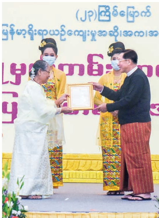
The Senior General presents the certificate of honour to the judge for singing genre.

A total of 1,838 contestants from regions and states participated in the 23 rd Myanmar Traditional Cultural Performing Arts Competitions. —MNA