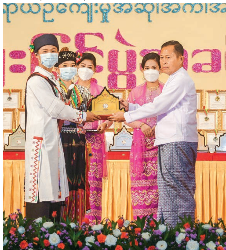
The Vice-Senior General presents the prize of honour to the ethnic cultural troupe.

atus and that it was due to the cooperation of responsible personnel of the leading committee, working committees, sub-committees and regional and state governments, members of the panel of judges and instructors.