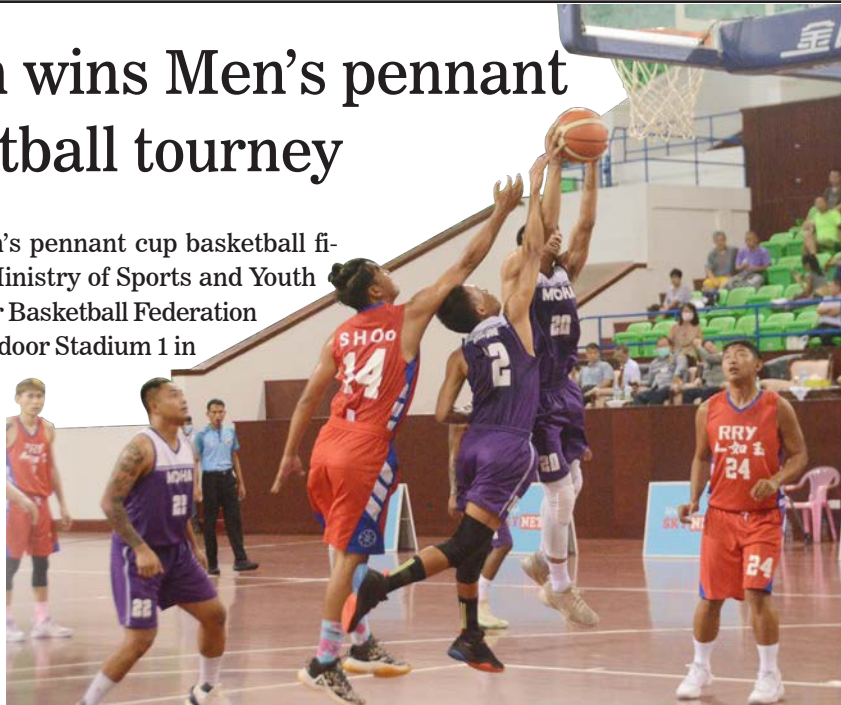
The RRY team competes against the MOHA team in the men's pennant cup basketball finals.