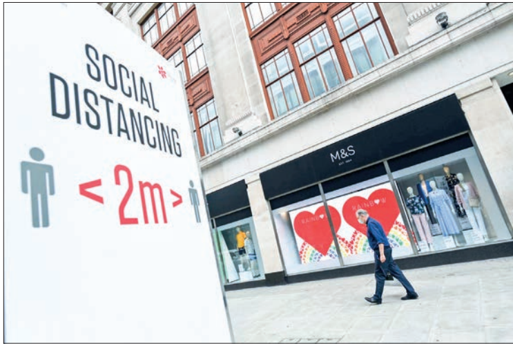
A shopper walks past a store of the clothing and food retailer Marks and Spencer in central London.

EMBATTLED UK Prime Minister Liz Truss on Monday apologized for going “too far too fast” with reforms that triggered economic turmoil, but vowed to remain leader despite a series of humiliating climbdowns.