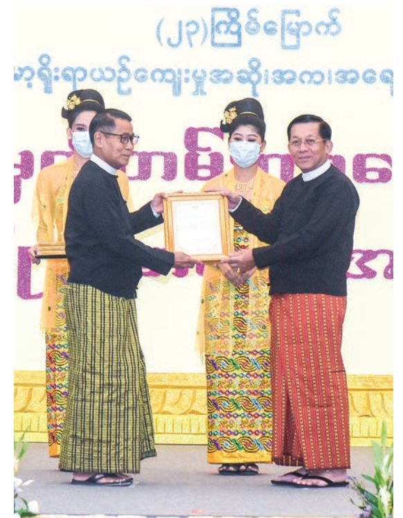
The Senior General gives the certificate of honour to the judge for composing category.

Various ethnics residing in Myanmar have different traditions and customs, culture and fine arts. Literature, culture and fine arts of respective ethnic nationals are flourishing on a grand scale throughout history. Hence, it is necessary to preserve the literature, culture, customs and traditions for existence.