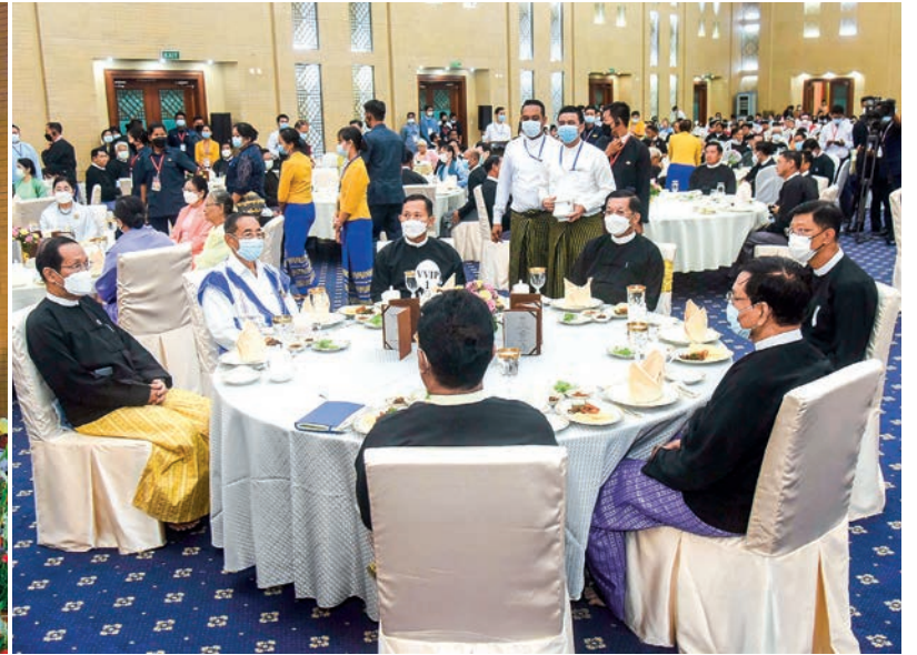
Chairman of the State Administration Council Prime Minister Senior General Min Aung Hlaing graces the dinner with his presence in honour of the 23 rd Myanmar Traditional Cultural Performing Arts Competition in Nay Pyi Taw on 18 October 2022.

C HAIRMAN of the State Administration Council Prime Minister Senior General Min Aung Hlaing attended the ceremony to present certificates of honour in conjunction with the dinner in honour of the 23 rd Myanmar Traditional Cultural Performing Arts Competition at Myanmar International Convention Centre-II in Nay Pyi Taw yesterday evening.