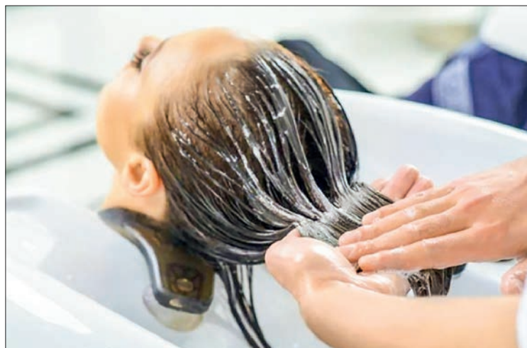
Women who reported using hair straightening products in the past year were almost twice as likely to develop uterine cancer compared to women that never used them, the researchers found.

The new paper relied on data from more than 33,000 US women aged 35-74 who took part in the Sister Study, which is led by the government and designed to identify risk factors for cancer and other conditions.—AFP