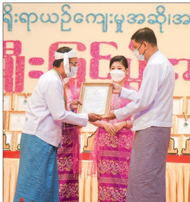
MoD Union Minister General Mya Tun Oo gives the prize.

The prize-giving ceremony was also attended by members of the State Administration Council, the Union Chief Justice, the Chairman of the Union Election Commission, Union Ministers, Union-level officials, Supreme Court Judges, members of the Constitutional Tribunal, UEC members, deputy ministers and members of the Union Civil Service Board. — MNA