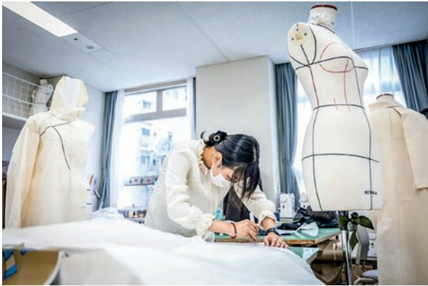
Students of Tokyo's prestigious Bunka Fashion College are striving to emulate the global success of alumni like Kenzo.

AT Tokyo's prestigious Bunka Fashion College, students concentrate in silence that is broken only by the sound of scissors and sewing machines as they strive to emulate the global success of alumni like Kenzo.