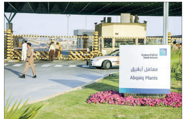
Saudi security guard the entrance of the oil processing plant of the Saudi state oil giant Aramco in Abqaiq in the oil-rich Eastern Province.

The United Arab Emirates and Bahrain, which like Saudi Arabia are US allies as well as OPEC partners, also defended the cartel’s decision as a “technical” move. —AFP