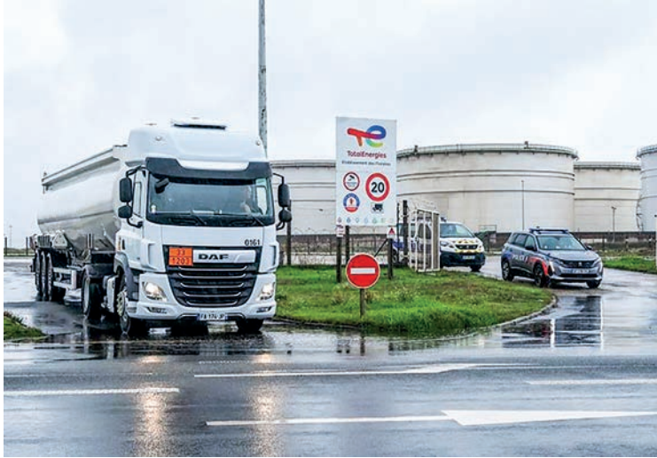
A tank truck leaves the Total Energies refinery site, in Mardyck, northern France, on 13 October 2022.

FRANCE on Monday braced for nationwide transport strike action as the government and unions remained in deadlock over walkouts at oil depots that have sparked fuel shortages.