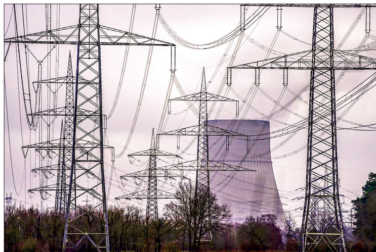
A cooling tower of the Emsland nuclear power plant.

"The legal basis will be created to allow the operation of the nuclear power plants Isar 2, Neckarwestheim 2 and Emsland beyond 31 December 2022 until 15 April 2023," Scholz said in a letter to cabinet ministers seen by AFP. Economy Minister Robert Habeck from the traditionally