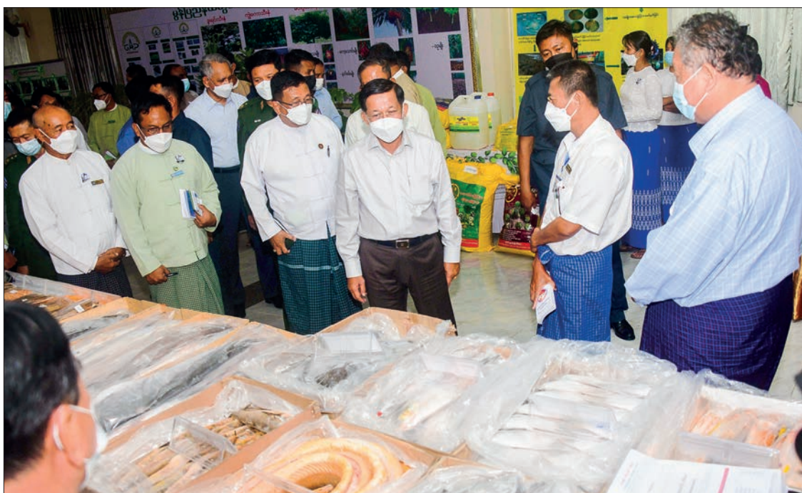
The Senior General views round the display.

With regard to tax, some EAOs are involved in the illegal trade process. This illegal trade causes loss to the State. As such, the government restricts illegal trade as much as it can and officials need to seize unregistered vehicles and motorcycles. People should participate in all measures taken under disciplines for the development of the nation. The Senior General viewed the display of foodstuffs, personal goods, industrial products, traditional goods, textiles and traditional medicines and asked about markets for these products. —MNA