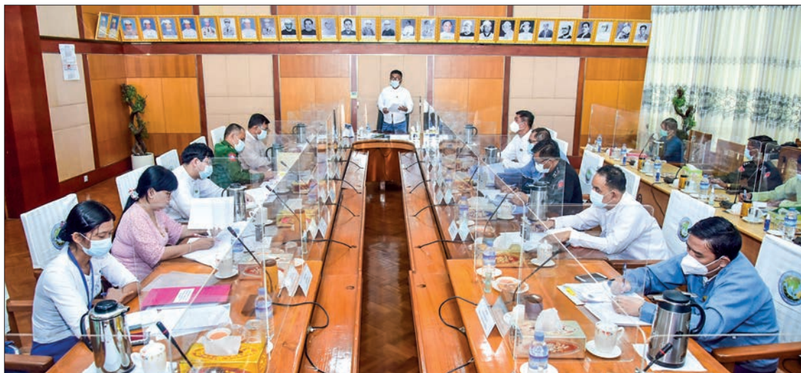
The first coordination meeting of the Information Working Committee on Resettlement and Closure of IDP Camps in progress.

THE first coordination meeting (1/2022) of the Information Working Committee on Resettlement and Closure of IDP Camps was held in Nay Pyi Taw yesterday.