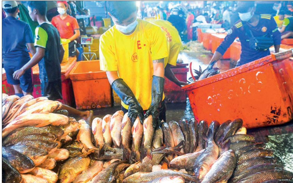
Apart from sufficient consumption, excess supplies of fisheries products are exported to foreign markets. Preparations are made for selling fish at the Shwepadauk fish market.

Agriculture and livestock are the backbones of Myanmar's economy. Commercial fish farming businesses are