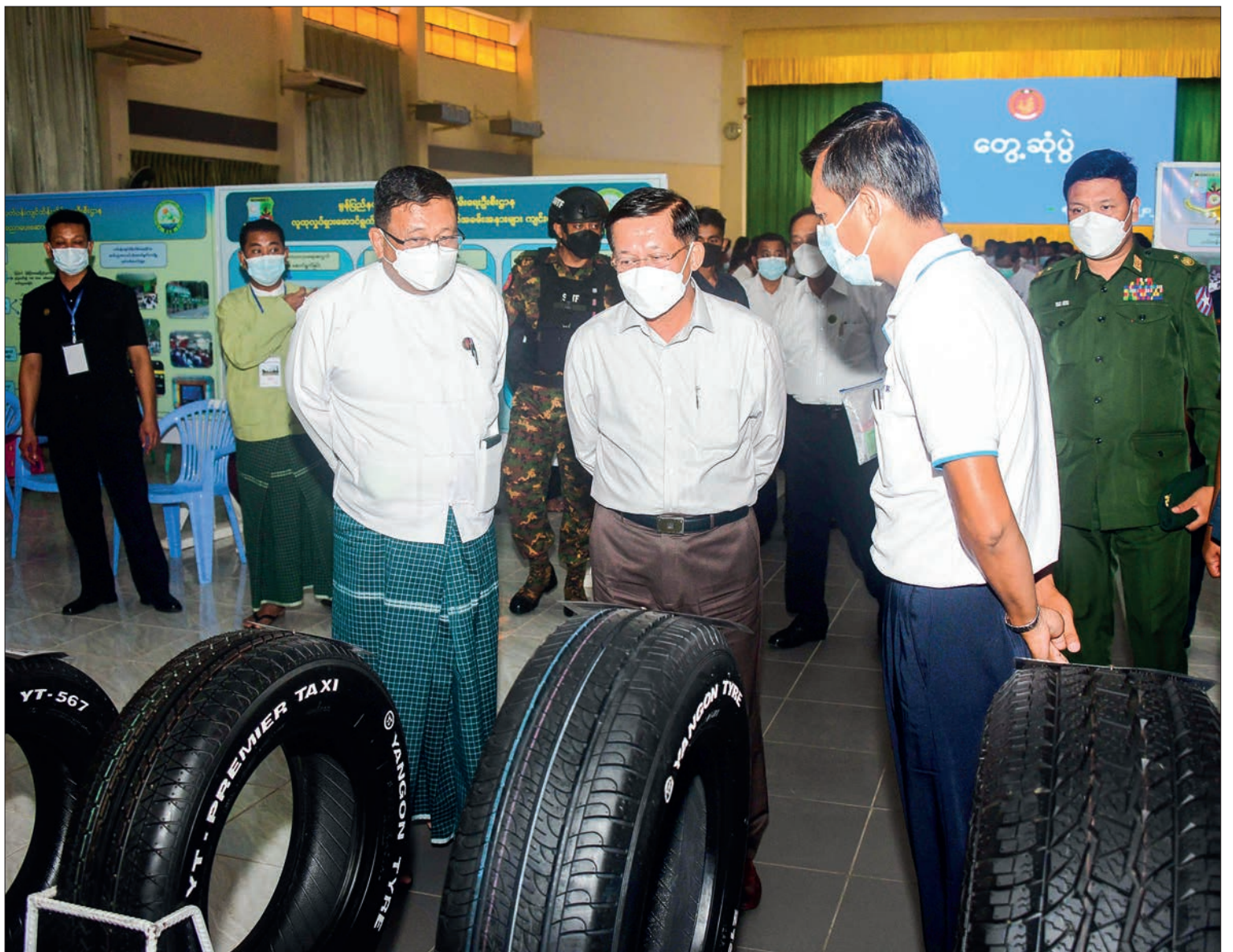
Chairman of the State Administration Council Prime Minister Senior General Min Aung Hlaing looks into the industrial products manufactured by MSME industries in Mon State on 18 October 2022.

In his speech, the Senior General said that a country SEE PAGE-3