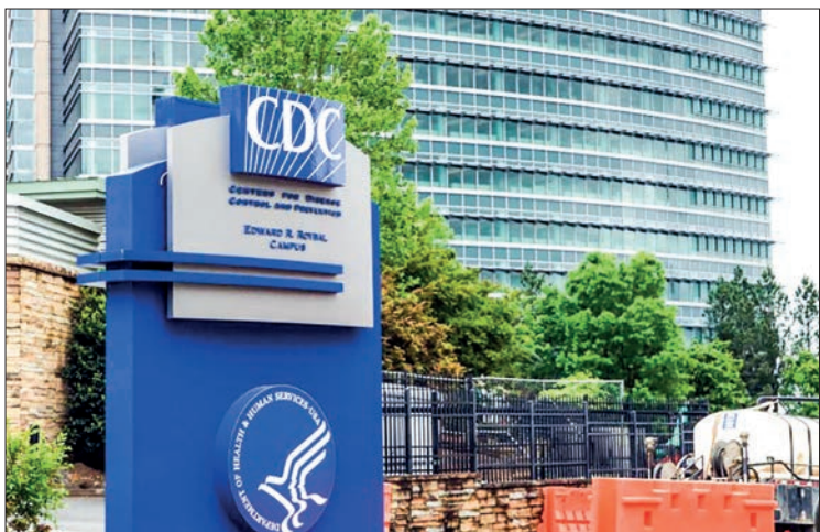
Senior staff at the US Centres for Disease Control and Prevention (CDC) told investigators Trump aides bullied staff and tried to rewrite their reports in a bid to align guidance with the president's public downplaying of the crisis.

Trump appointees had sought to "alter the contents, rebut, or delay the release" of 18 MMWRs and a health alert, succeeding on at least five occasions.—AFP