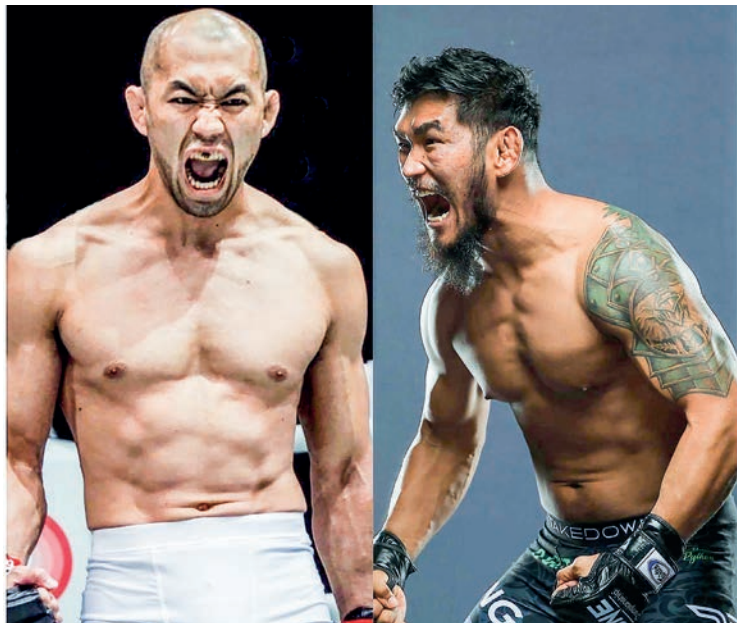
Aung La N Sang (right) and Okami (left) scream in victory in their previous MMA fights.

AUNG La N Sang will take on Japanese fighter Okami in the middleweight class challenge of the ONE Championship: ONE