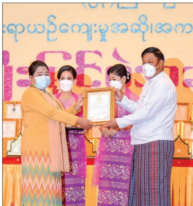
MoTC Union Minister Admiral Tin Aung San presents the prize.