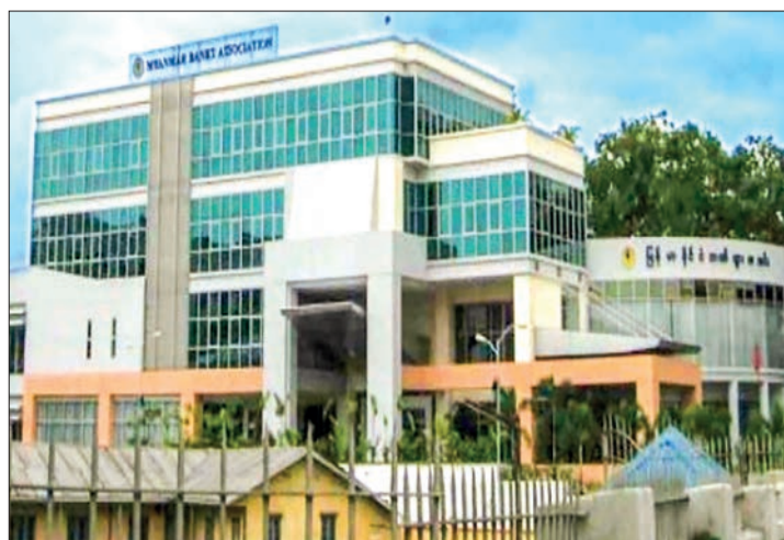
An undated picture of the Myanmar Banks Association Office.

In late September, nine private banks were examined whether they comply with the standards on money laundering and combating the financing of terrorism (AML/CFT) as recommended by the Financial Action Task Force-FATF. — TWA/GNLM