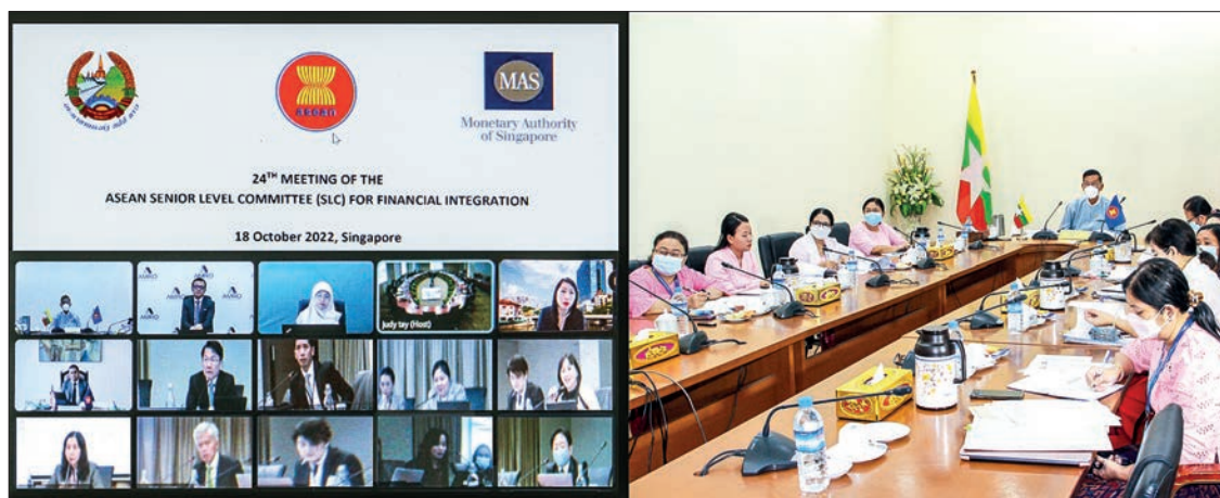
The 24 th meeting of ASEAN SLC on financial integration is underway online.

Then, relevant working committees clarified the growth regarding the ASEAN