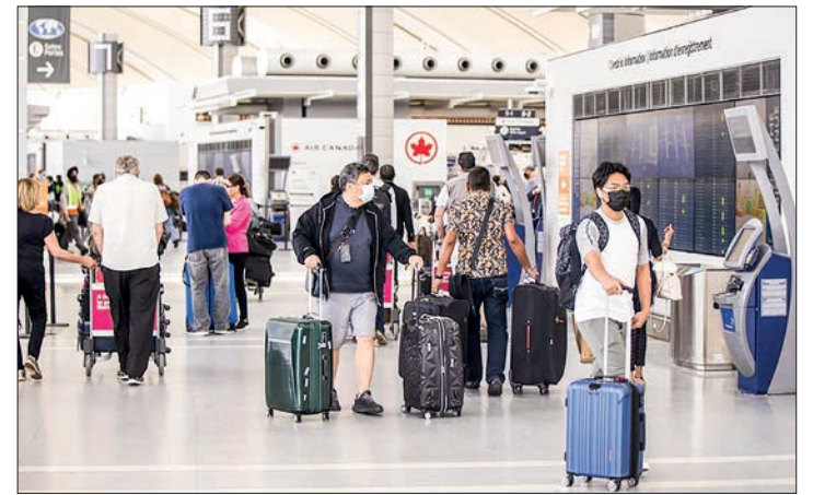
Travellers are seen at Toronto Pearson International Airport in Mississauga, Ontario, Canada, on 20 June 2022.

ABOUT 1.4 million Canadian adults indicated they had symptoms at least three months after a positive COVID-19 test or suspected infection, Statistics Canada said on Monday.