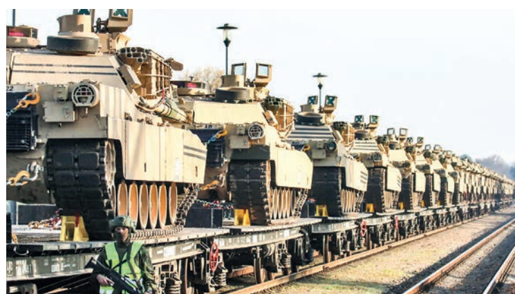
Abrams tanks are seen at the railway station near the Pabrade military base in Lithuania on 21 October 2019 as the United States began deploying a battalion.