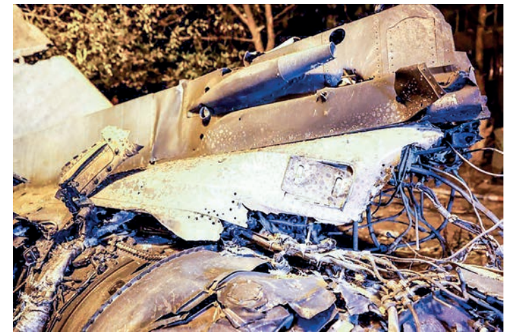
The wreckage of a Sukhoi Su-34 military jet lie at the crash site in the courtyard of a residential area in the town of Yeysk in southwestern Russia on 17 October 2022. PHOTO: AFP

"On 17 October 2022, while taking off to carry out a training flight from the military airfield of the Southern Military District, an Su-34 aircraft crashed," the ministry said.—AFP