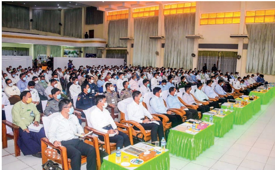
State Administration Council Chairman Prime Minister Senior General Min Aung Hlaing meets MSME business people in Mon State yesterday.

Local raw materials must be utilized in the manufacturing