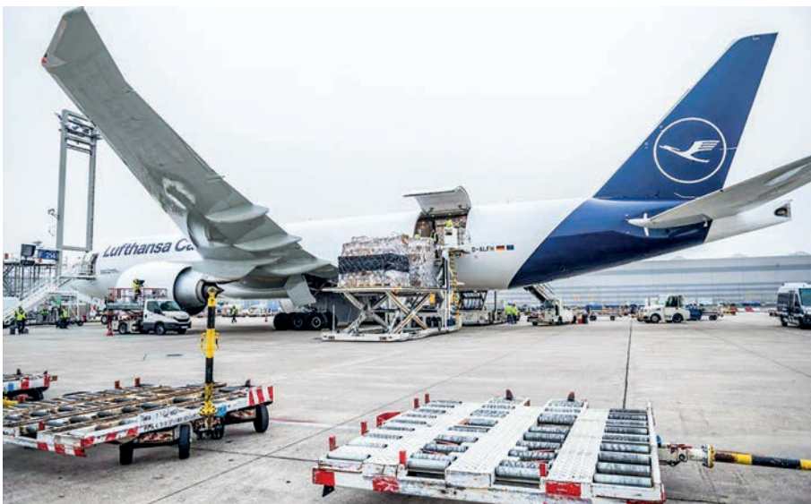
Lufthansa's freight division made a profit of €482m in Q2, up 48% on last year.

Lufthansa said the optimistic outlook was "based on the positive development in the third quarter, the current booking situation, which continues to reflect strong demand for air travel in the coming months and