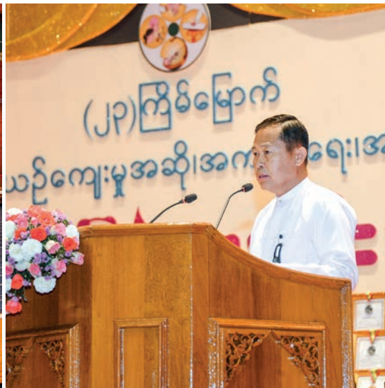
State Administration Council Vice-Chairman Deputy Prime Minister Vice-Senior General Soe Win speaks on the occasion of the prize-presenting event of the 23 rd Myanmar Traditional Performing Arts Competition in Nay Pyi Taw yesterday.