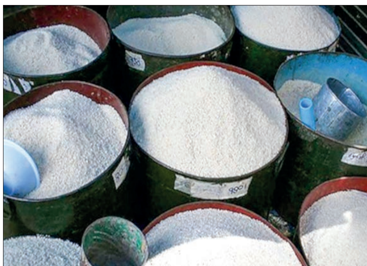
Pawsan rice varieties are displayed at the rice retail outlet.

The retail price of Pawsan rice from the Mawgyun area stands at K59,000-61,000 these