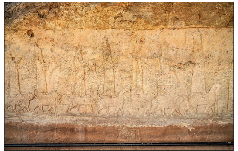
A picture shows a carved plaque lining an ancient irrigation canal dating back to Assyrian times, in the archaeological site of Faydeh (Faida) in the mountains near the town of the same name in the autonomous Kurdish region of Iraq, on 16 October 2022, during the opening of the first phase of a planned archaeological park in Iraqi Kurdistan. PHOTO: AFP

Looters decimated the country’s ancient past, including after the 2003 US-led invasion. —AFP