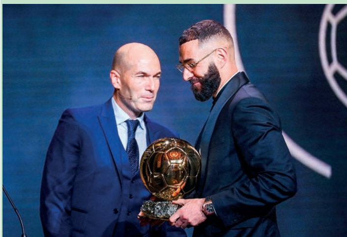
Real Madrid's French forward Karim Benzema receives the Ballon d'Or award from French former forward football player Zinedine Zidane during the 2022 Ballon d'Or France Football award ceremony at the Theatre du Chatelet in Paris on 17 October 2022.

FRANCE striker Karim Benzema won the Ballon d'Or at a ceremony in Paris on Monday, the reward coming after his stunning performances helped Real Madrid win the Champions League and La Liga last season.