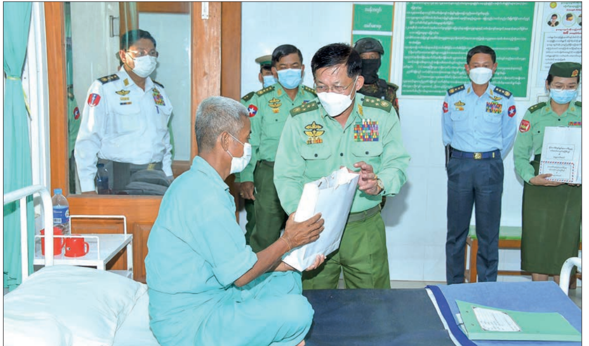
State Administration Council Chairman Prime Minister Senior General Min Aung Hlaing provides the patient with foodstuffs.

In the afternoon, the Senior General arrived at the military hospital in Hpa-an where he asked about the health conditions of Tatmadaw members, members of the Myanmar Police Force and members of the