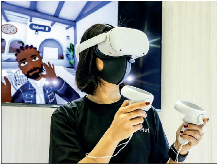
Meta Platforms Inc demonstrates a metaverse service that enables participants wearing virtual reality headsets to hold business meetings in the form of their avatars in various virtual settings at an electronics exhibition in Chiba, near Tokyo, on 17 October 2022.