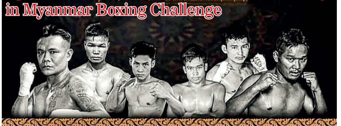
Myanmar Traditional Boxing Challenge features many thrillers including newcomers' fights plus special challenges.

IT has been reported that the Myanmar Traditional Boxing Challenge, which will be hosted by Lethwei Journey Group, will be held at Theinbyu Boxing Hall in Yangon at 1 pm on 23 October.