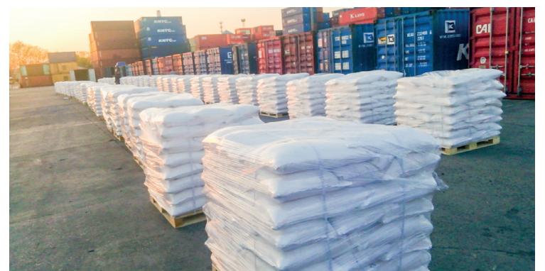
The cement bags are systematically stacked in China.

Meanwhile, the country imported over 18,500 tonnes of cement worth $10.230 million from the neighbouring countries through the cross-border trade posts in September, with over 9,700 tonnes from Thailand, 2,200 from India and about 6,500 from China. The cross-border import indicated an increase of 4,200 tonnes against that of August. —TWA/GNLM