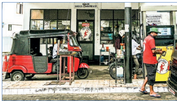
An employee fills petrol in an auto rickshaw at Ceylon petroleum corporation fuel station in Colombo on 17 October 2022.

CRISIS-HIT Sri Lanka slashed fuel prices on Monday, the second cut in as many weeks, after the World Bank warned that