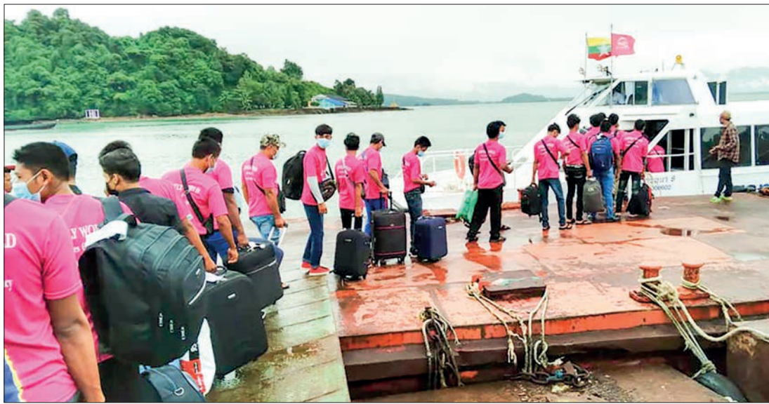
MoU workers are seen at the Kawthoung border.