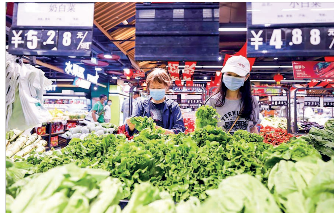
Residents buy vegetables at a market under COVID-19 prevention and control measures, in Chengdu, southwest China's Sichuan Province, on 2 September 2022.

The Chinese government has stressed coordinating epidemic prevention and control with economic and social development, and adopting targeted and science-based measures to minimize the epidemic impact on people's