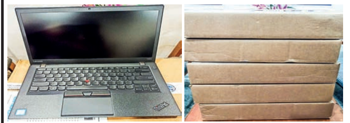
Confiscated illegal items at Yangon International Airport.

SUPERVISED by the Anti-Illegal Trade Steering Committee, effective action is being taken to prevent illegal trade under the law.