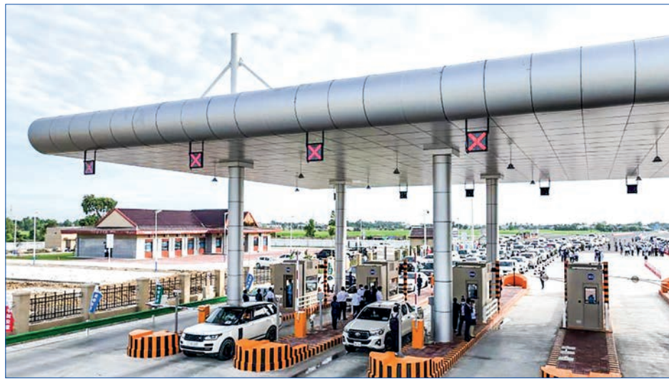
Photo taken on 1 October 2022 shows a toll station on the Phnom Penh-Sihanoukville Expressway in Phnom Penh, Cambodia.

With two lanes for traffic in each direction plus an emergency lane on each side and paved