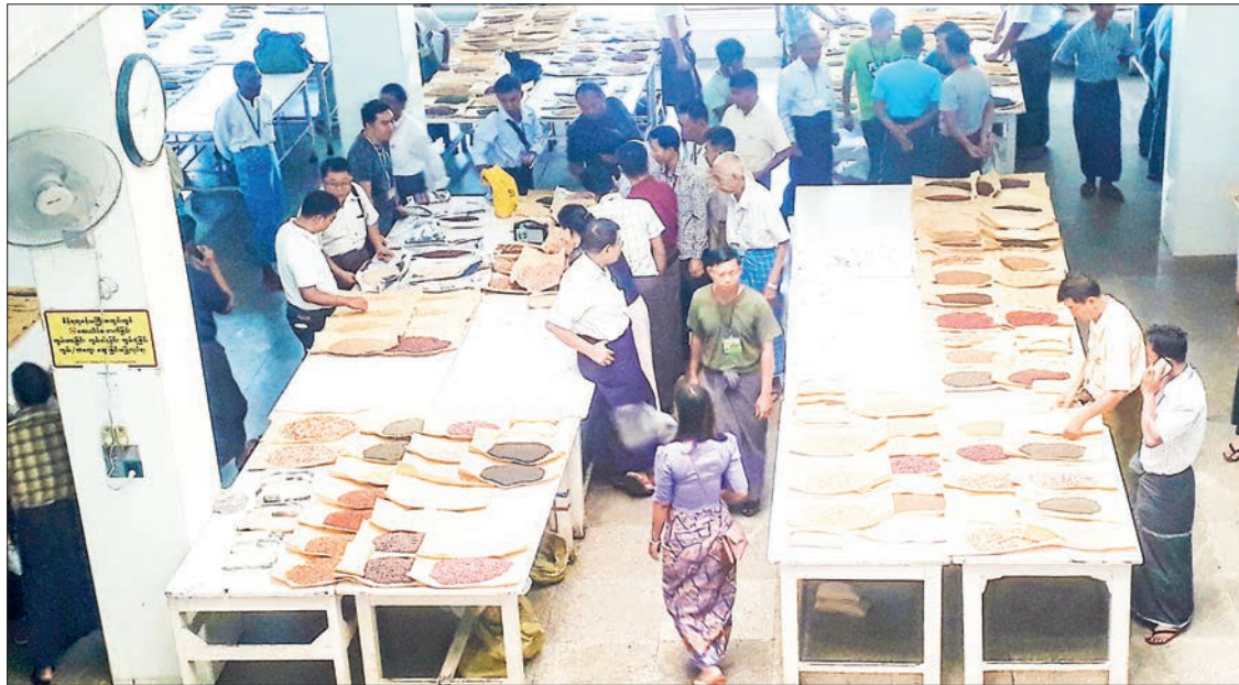
Bean and pulse merchants evaluate the goods.

That being so, the black gram of good quality is expect-