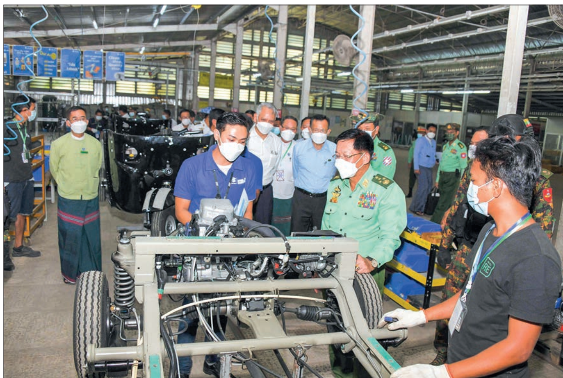
The Senior General looks into the assembling and manufacturing of tri-wheelers and vehicles.

Later, the Senior General viewed round manufacturing of tri-wheelers and vehicles and assembling process.—MNA