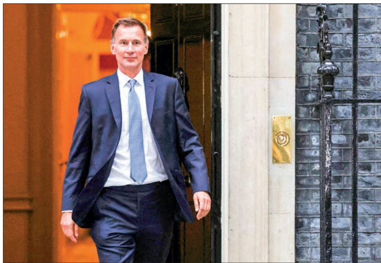
Britain’s new Chancellor of the Exchequer Jeremy Hunt leaves 10 Downing Street in central London on 14 October 2022, after having a meeting with Britain’s Prime Minister Liz Truss.

STERLING rose Monday as Britain’s new finance minister prepared to announce new tax and spending measures aimed at calming markets after a botched debt-fuelled budget by his pre-