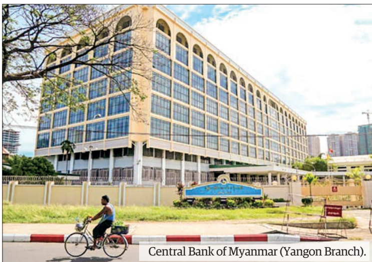
Central Bank of Myanmar (Yangon Branch).

THE Central Bank of Myanmar (CBM) will sell Central Bank Bills (CBBs) in order to curb inflation.