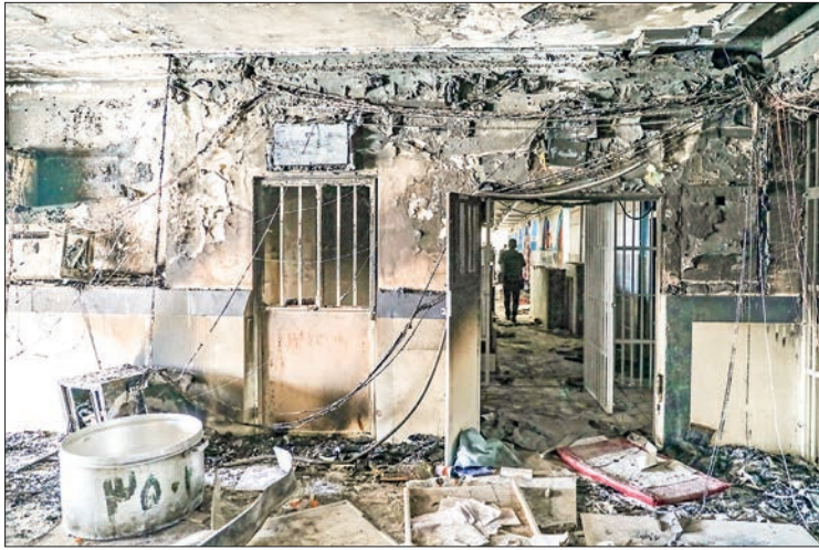
A picture obtained from the Iranian Mizan News Agency on 16 October 2022 shows damage caused by a fire in the notorious Evin prison, northwest of the Iranian capital Tehran.

EIGHT Iranian inmates were killed in a fire that raged through Tehran's Evin prison, the judiciary said Monday, doubling the official toll from the blaze that further stoked tensions after a month of protests sparked by the death of Mahsa Amini.