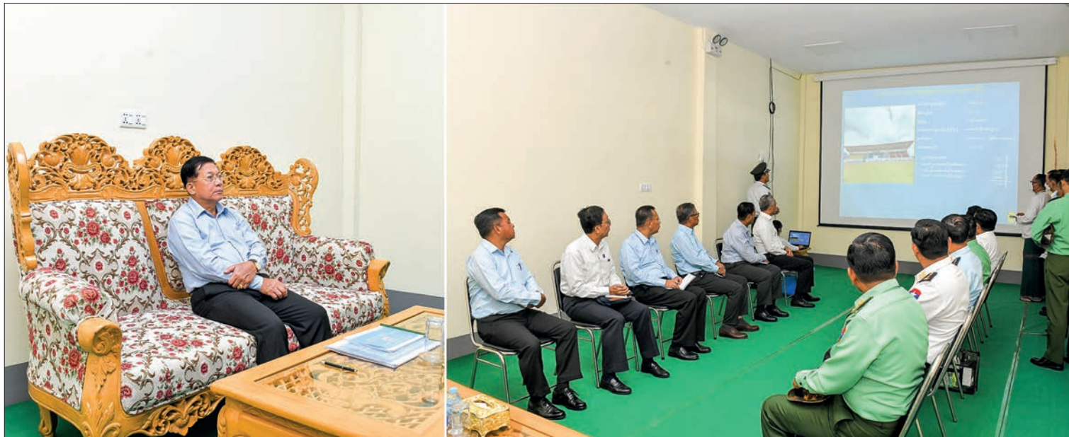
The Senior General hears the report on the upgrading of the Zweekabin stadium in Hpa-an, Kayin State yesterday.

Border Guard Force patients receiving medical treatments for their wounds they suffered in discharging the State defence duties. The Senior General then presented foodstuffs to them. After inspecting the hospital, the Senior General attended to the needs.