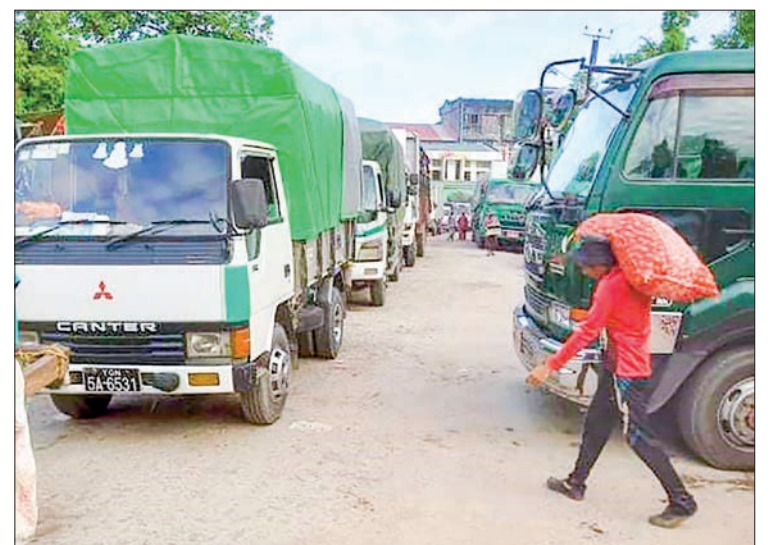
The photo shows trucks loaded with onions entering the Bayintnaung Wholesale Market on 17 October 2022.

There are only 50 days remaining for summer onions to sell in the market. The domestic consumption of onions is the highest at six million visses and the lowest at three million visses per month. Prior to the entry of monsoon onions, only five million visses of onions are required at Bayintnaung market during that period. Although onion stocks are getting lower in the market, there is the self-sufficiency of onions in the market. When the price inflates, Chinese onions will re-enter the market, the market observers pointed out. —TWA/ GNLM