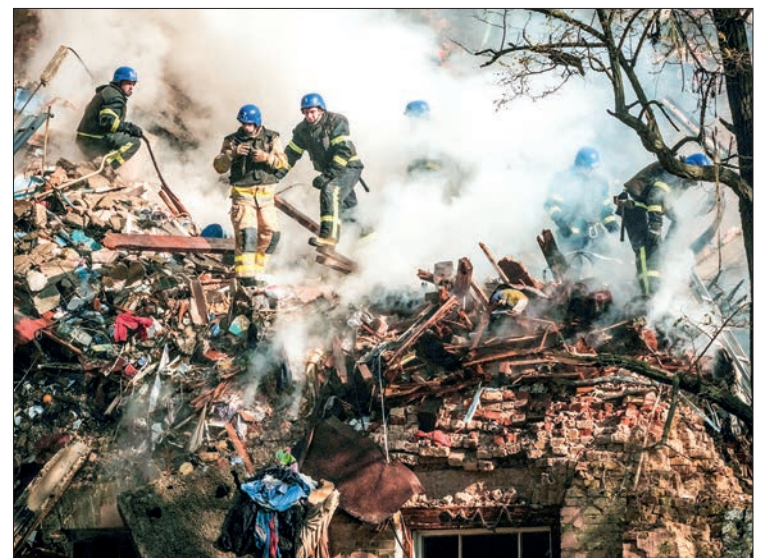
Ukrainian firefighters work on a destroyed building after a drone attack in Kyiv on 17 October 2022, amid the Russian invasion of Ukraine.

Prime Minister Denys Shmygal earlier said Russian strikes had hit energy facilities in Sumy and the central Dnipropetrovsk region, where, according to the presidency, attacks had left some people killed and injured.—AFP