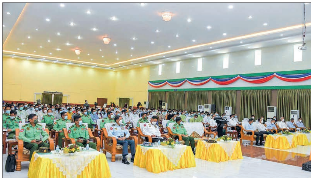
State Administration Council Chairman Prime Minister Senior General Min Aung Hlaing meets MSME business people in Kayin State yesterday.

In his speech, the Senior General said that he came to Kayin State to discuss improving businesses in Kayin State to develop the State economy and fulfil the needs. As the eco-