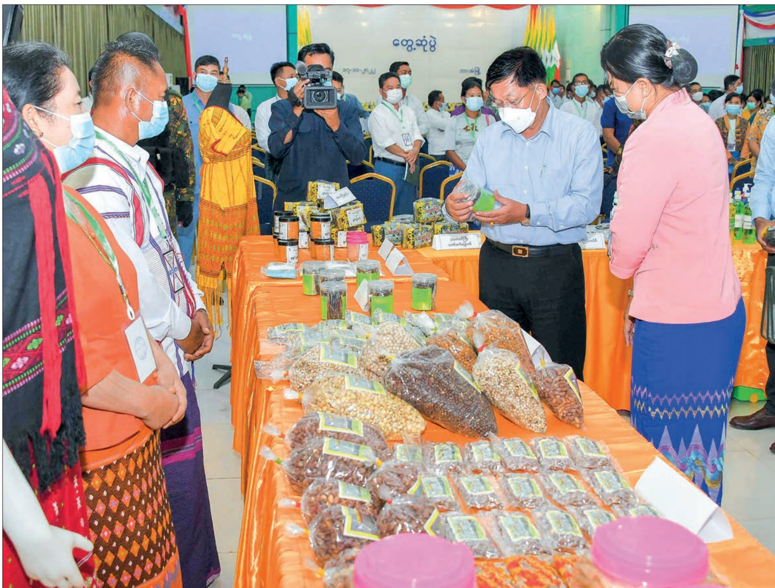
State Administration Council Chairman Prime Minister Senior General Min Aung Hlaing views consumer goods and foodstuffs manufactured by MSME businesses in Kayin State on 17 October 2022.

L OCALS and public service personnel assigned in the region need to strive for the creation of a beautiful environment for attracting local and foreign travellers, peace and stability of the region, the prevalence of law and order and a secure state, said State Administration Council Chairman Prime Minister Senior General Min Aung Hlaing yesterday morning at a meeting with MSME businesspersons from Kayin State at Zweekabin Hall of Hpa-an.