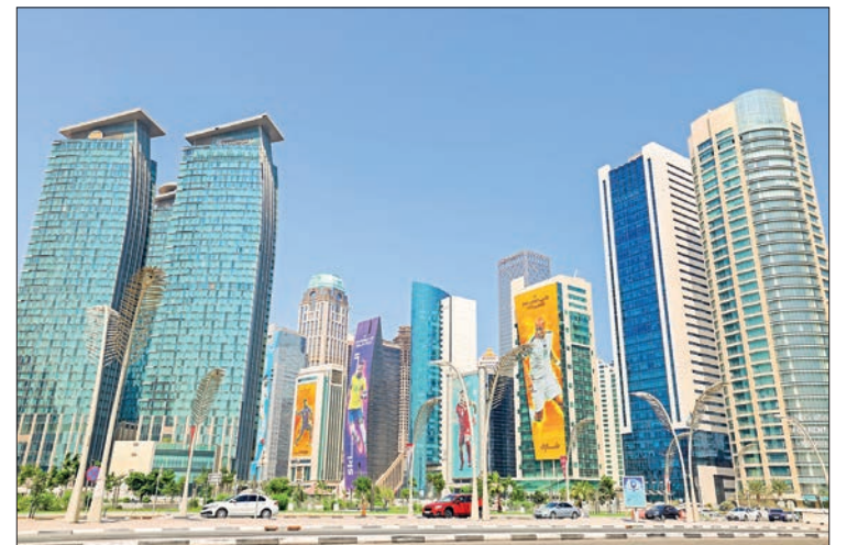
Banners depicting footballers hang on buildings in the Qatari capital Doha ahead of this year’s FIFA football World Cup, on 16 October 2022.