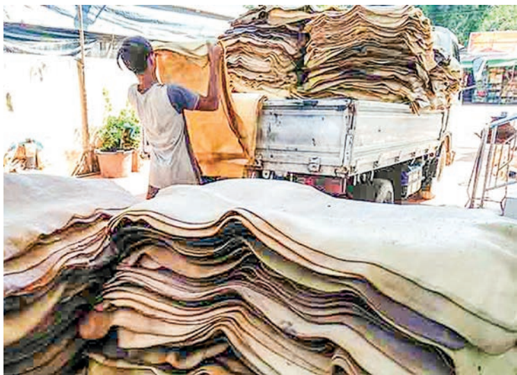
A worker is loading ribbed smoked sheet rubber onto a truck.

The export volume of rubber in September was down by 3,500 tonnes compared to October's rubber export volume (8,810 tonnes). China was the main buyer of Myanmar's rubber last month. Myanmar's rubber is exported to Malaysia, Singapore, Indonesia, the Republic of Korea, Japan, China (Taipei) and India, according to Myanmar Rubber Planters and Producers Association.—TWA/GNLM