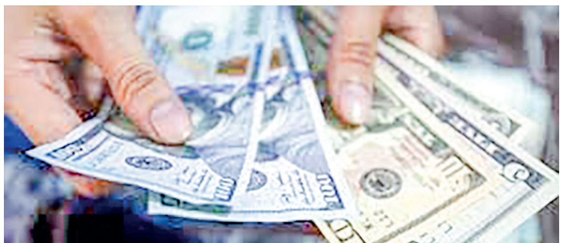
Those two businesses (Perfect Money and B to P Money Exchange) were found to execute illegitimate transactions of foreign currency through the digital platform (Facebook) without holding any valid licence of the CBM.

The CBM greenlighted 18 commercial banks, 10 banks for internet banking, eight banks for mobile payment, five institutions for mobile financial service, seven entities for transportation card and shopping card payment, and four companies for MMQR of merchant acquiring service under Sections 40 and 79 of the Central Bank of Myanmar Law, Section 5, 129 and 130 of the Fi-