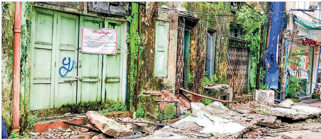
A dilapidated apartment building is pictured in Yangon.

A notification has been issued by Yangon City Development Committee (YCDC) to mend the ruins of Yangon City in line with city standard features.