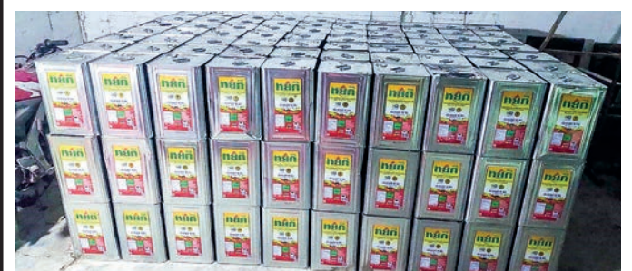
Seized illegal foodstuffs in Taninthayi Region.