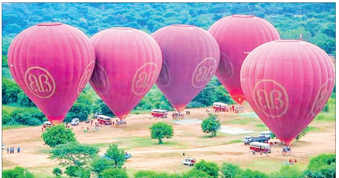
Out of the four existing hot air balloon companies, one company started to offer the hot-air balloon service for the visitors to enjoy the stunning bird's eye view of the Bagan scenic beauty.

There are over 150 hotels in the Bagan-NyaungU area. Over 70 restarted this business in the COVID-19 pandemic. Over 120 rooms are available in a hotel. Bagan was packed with the visitors and room occupancy rate was 100