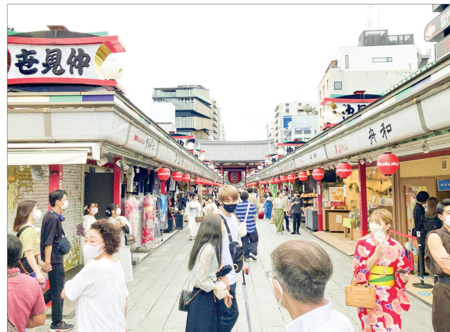
People walk along the Nakamise shopping street in Tokyo's Asakusa district earlier this month.

JAPAN'S health ministry said Thursday those at low risk of developing serious coronavirus symptoms will be encouraged to use at-home test kits and online medical services this winter, when COVID-19 and seasonal influenza are expected to spread simultaneously.