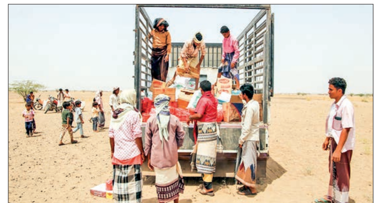
Yemenis displaced by the conflict, receive food aid and supplies on 29 March 2022.

Aid groups have raised alarm with more than 23 million people — more than two-thirds of Yemen's population — dependent on aid.—AFP