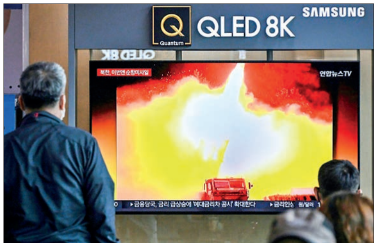
North Korea says it took "strong military countermeasures" after South Korean artillery fire.

NORTH Korea launched early Friday a short-range ballistic missile towards the Sea of Japan, the Japanese government and South Korean military said, as it conducted the latest in a series