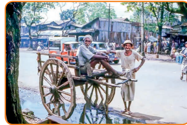
A man-pulled rickshaw

Most of the privately owned jeeps were put in the garage in the yard or kept on the ground