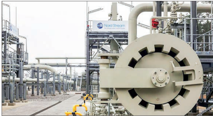
After the Nord Stream pipelines connecting Russia to Europe were damaged by explosions, Putin said “the ball was in the EU's court” to resume deliveries.

RUSSIAN President Vladimir Putin on Wednesday said his country was a reliable energy