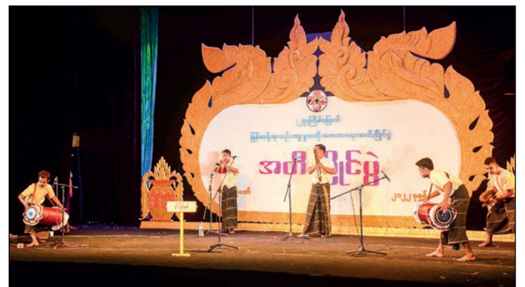
Myanmar Harp, violin, dancing, Myanmar traditional drums competitions. (top photos clockwise) Myanmar Pattala (xylophone) competition. (above)

These events were watched by Union-level persons, deputy ministers and ethnic affairs ministers of regions and states and officials. — MNA