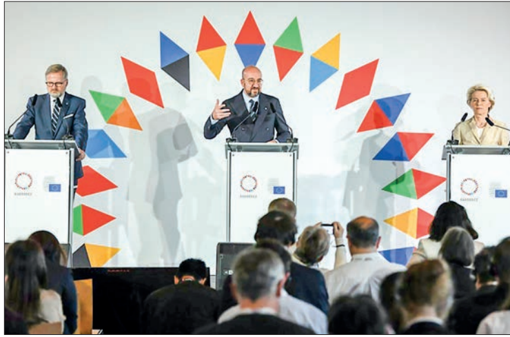
Czech Prime Minister Petr Fiala, European Council President Charles Michel and European Commission President Ursula von der Leyen (from L to R, Rear) attend a press conference after an informal summit of the European Union (EU) in Prague, the Czech Republic, on 7 Oct 2022.

"I expect the European Commission will take this dis-