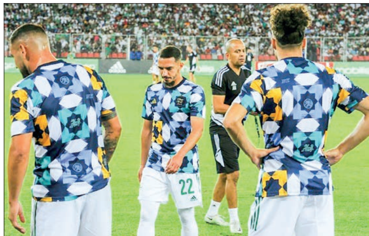
Algerian players wearing the tops that have upset Morocco before a friendly match against Guinea in September. Adidas says it has resolved the row.

Adidas reported Friday a “positive resolution” to the dispute following talks with the ministry, and the tops, worn by the Algerian team for pre-match warm-ups, will not be withdrawn. “The design was inspired indeed by the zellige mosaics pattern, and was at no time intended to offend anyone,” said the company in a statement. “We would like to express our deep respect to the people and craftsmen of Morocco and regret the controversy surrounding this case.”—AFP