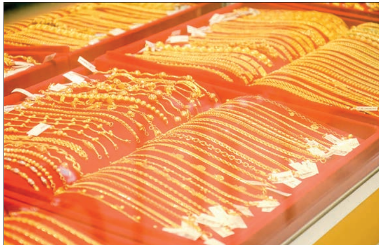
With an aim at reducing gold price, Yangon Region Gold Entrepreneurs Association (YGEA) sold approximately 1,277 ticals of gold bullion supplied by the executive members and the members of the YGEA on 12 October.

The ministry is, therefore, selling gold bars and coins in