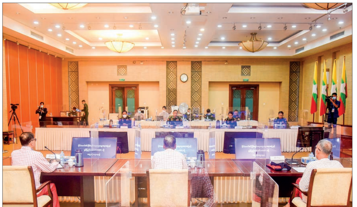
The third-day peace talks between the State Peace Talks Team and the New Mon State Party delegation in progress.

The record book on national endeavours of the State Administration Council, publications, an MRTV DTH receiver, a two-foot satellite dish and gifts were presented to the NMSP peace delegation. —MNA