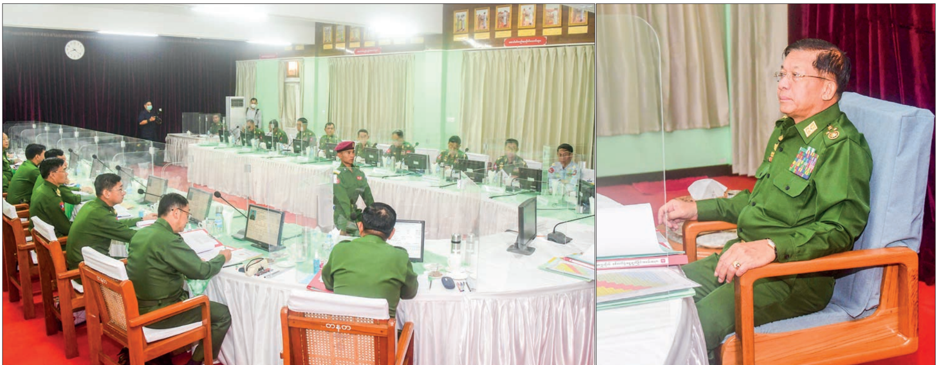
State Administration Council Chairman Commander-in-Chief of Defence Services Senior General Min Aung Hlaing continues attending the choice of arms for the 25 th Intake cadets of the Defence Services Technological Academy in PyinOoLwin yesterday.

CHAIRMAN of the State Administration Council Commander-in-Chief of Defence Services Senior General Min Aung Hlaing yesterday morning attended the choice of arms for cadets of the 25 th Intake of Defence Services Technological