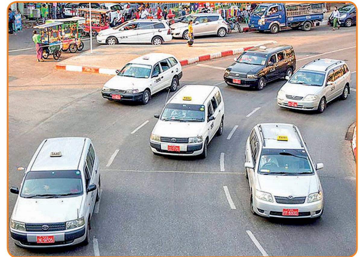
City taxis are seen on the road in Yangon.

Uber withdrew from the market in April 2018, having sold out certain portions of the shares to Grab which is Singapore based. Oway and Hello Cab, the two local companies, could not compete with Uber and Grab, the interna-