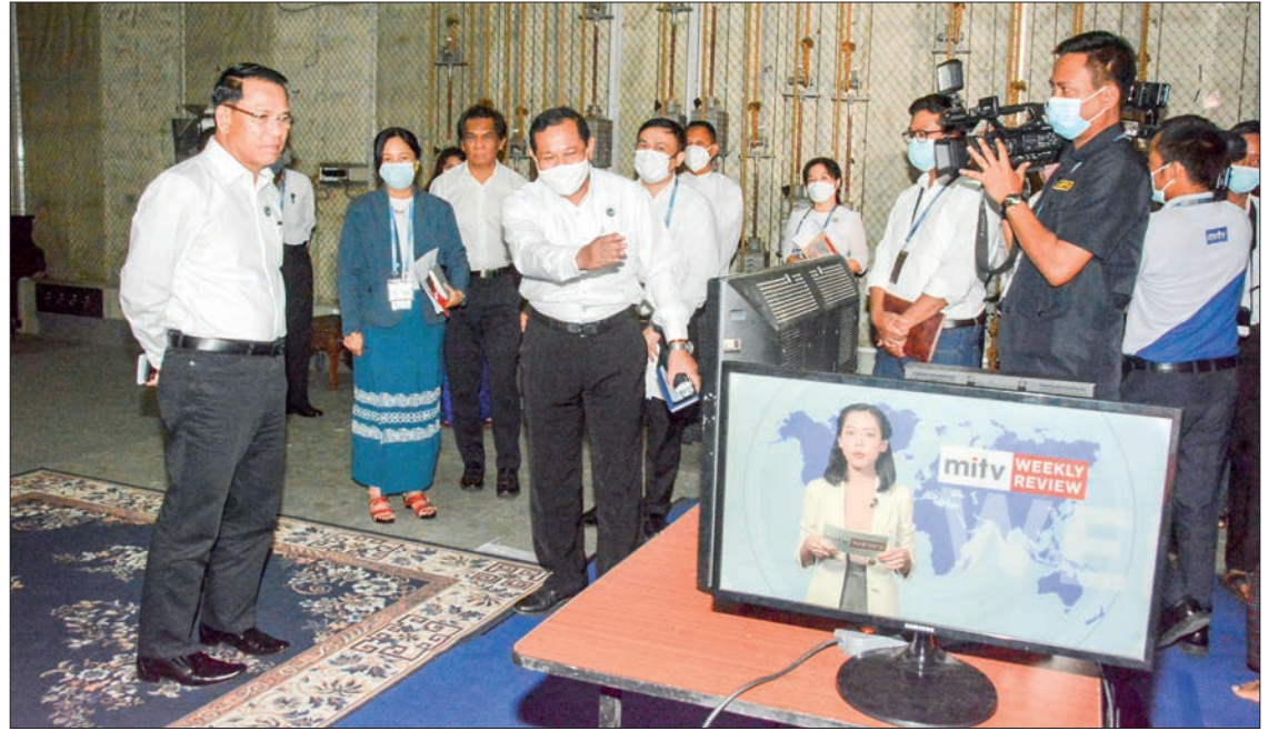
Union Information Minister views the reconstruction of MITV News Studio at MRTV in Yangon yesterday.

The 200-metre tower was jointly established by MRTV and Shwe Than Lwin Company in 2012 and became operational in