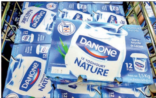
Danone is one of the few multinationals to have remained in Russia — where it employs 8,000 people — since the

One of the few multinationals to have remained in Russia since the Ukraine war, Danone said the move to "transfer the effective control" of the dairy business could result in a write off of up to one billion euros ($980 million). The arm represented