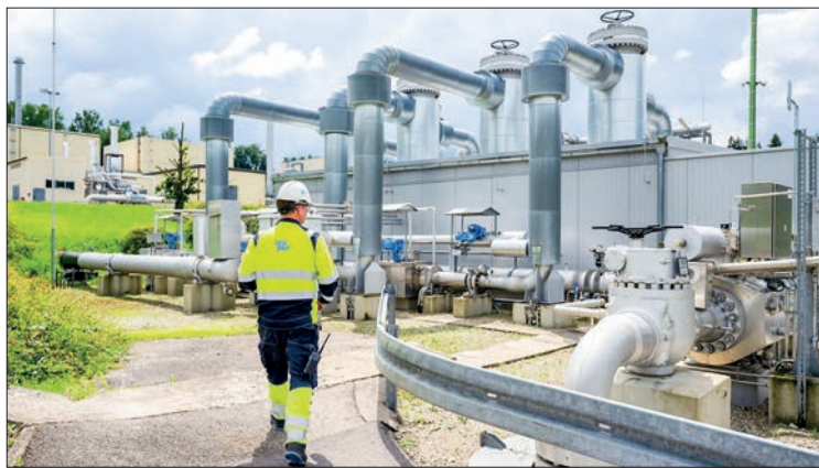
A natural gas storage facility in Bierwang, Germany.

FRANCE has started sending natural gas to Germany as part of its pledge to ensure EU energy solidarity as Russia reduces exports after its invasion of Ukraine, the French network operator said Thursday.