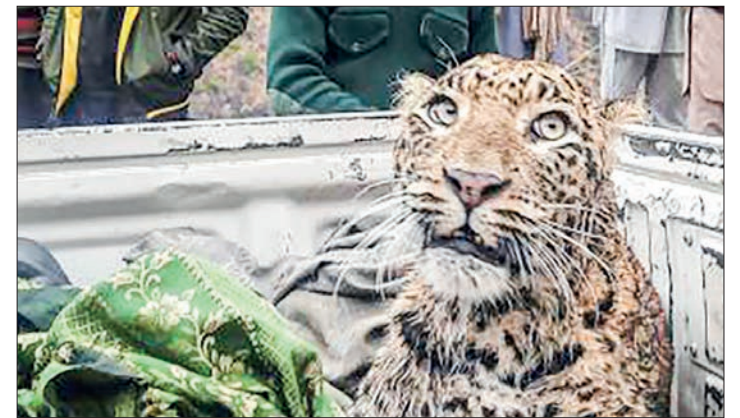
An employee (C) of the Azad Jammu and Kashmir (AJK) Wildlife Department rescues and shifts an injured leopard at Neelum Valley.

“(It shows) a devastating fall in wildlife populations, in particular in tropical regions that are home to some of the most biodiverse landscapes in the world,” he said.— AFP