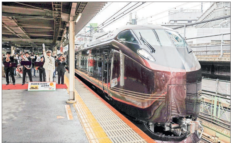
A commemorative train leaves JR Shimbashi Station in Tokyo on 14 Oct 2022, marking the 150 th anniversary of the launch of Japan's first railway.

JAPAN celebrated the 150 th anniversary of its railways on Friday with a series of events, observances and merchandising tie-ins in Tokyo and elsewhere.