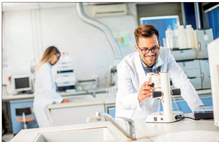
Scientists are investigating the learning capacities of neurons in a dish.

NEUROSCIENTISTS have shown that lab-grown brain cells can learn to play the classic video game Pong, and could be capable of "intelligent and sentient behaviour."