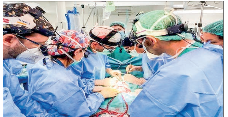
Doctors attend a surgery procedure to perform the first ever multi-visceral intestinal transplant from a controlled pediatric donor in asystole to a 13-month baby girl, in Madrid, Spain in this undated handout image obtained by Reuters on 11 October 2022.

Spain is a world leader in organ transplants, according to figures from the Global Observatory on Donation and Transplantation. It also accounted for five per cent of organ donations in the world in 2021, when it has only 0.6 per cent of the world's population.—AFP