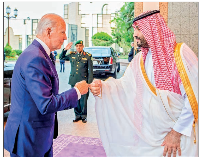
Washington has accused Saudi Arabia of coercing other Opec+ members into 2m-barrel-a-day reduction. President Biden was pictured fist-bumping the Saudi crown prince before their talks on 15 July 2022.

It “certainly gave... Mr Putin a sense of comfort.”—AFP