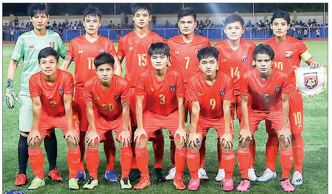
Myanmar Women’s National Football Team.

MYANMAR women’s national football team is currently standing third in the ASEAN region with 48 th in the FIFA ranking and 1,517 points earned, according to yesterday’s statement with the ASEAN Football Federation.