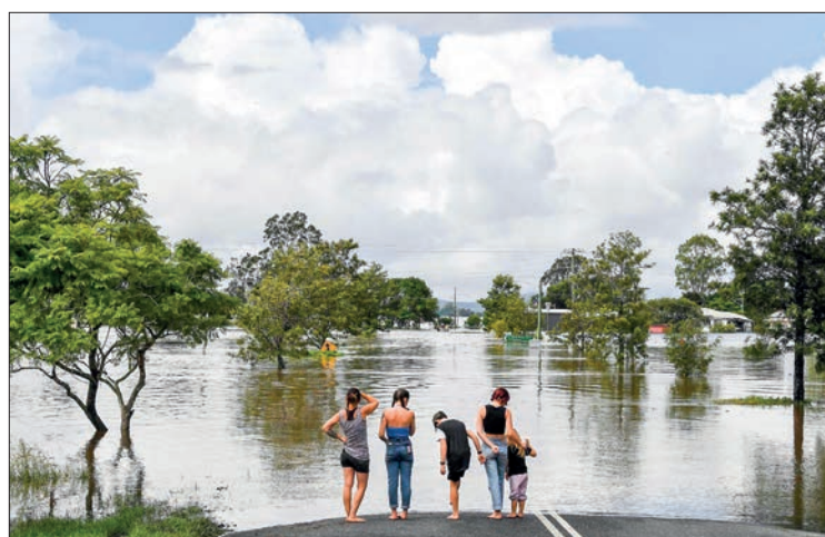
A family stays next to a flooded street in Lawrence, some 70 kms from the New South Wales town of Lismore, on 1 March 2022.

Countries should therefore be equipped with multi-hazard