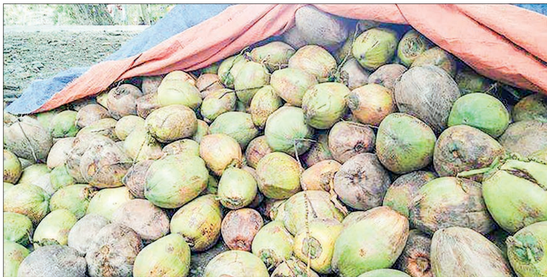
Additionally, Myanmar has been exporting coconuts to Thailand through a legitimate trade channel since 2015.

MYANMAR delivered 319 tonnes of coconuts to Bangladesh through the Maungtaw border trade post in the first half of the current financial year 2022-2023, with an estimated value of US$0.128 million.