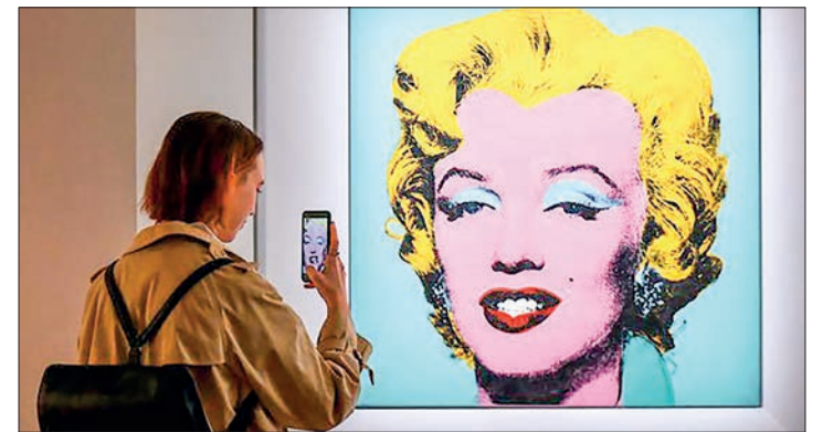
Andy Warhol's 'Shot Sage Blue Marilyn' sold under the hammer for a record $195 million.