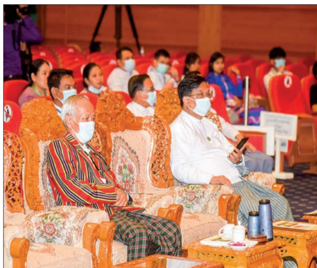
SAC members watch the performing arts competition in Nay Pyi Taw yesterday.