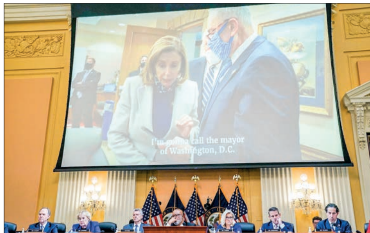
Majority Leader Charles E Schumer and Pelosi are seen on the screen making calls from a secure location as the House select committee investigating the 6 Jan attack on the US Capitol holds a hearing in the Cannon House Office Building on 13 Oct 2022 in Washington, DC.

Reacting on his right-wing Truth Social platform, Trump said the committee was a "total 'BUST' that has only served to further divide our Country." — AFP