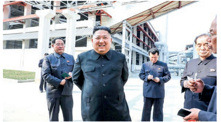
North Korea's leader Kim Jong Un (C, pictured 10 October 2022) has vowed to develop the country's nuclear forces at the fastest possible speed.

out nuclear tests under UN Security Council resolutions. The launch last week of the intermediate-range ballistic missile, which Japan's Defence Ministry said travelled about 4,600 kilometres, has fuelled fears that North Korea could engage in further military provocations. Earlier Thursday, North Korea's official Korean Central News Agency reported leader Kim Jong Un oversaw the test-firing of two long-range strategic cruise missiles in person the previous day.—Kyodo