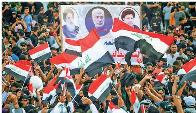
Supporters of Iraq's Coordination Framework rally in the Green Zone.

Parliament is due to convene from 11:00 am (0800 GMT) in Baghdad's Green Zone, the capital's fortified government and diplomatic district that was recently the site of large protest camps set up by rival factions.—AFP