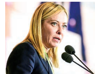
Meloni will almost certainly be nominated prime minister -- the first woman to take the job in Italy.

ITALY'S parliament meets for the first time Thursday since the far-right won elections last month, a key step in the process of forming a government.