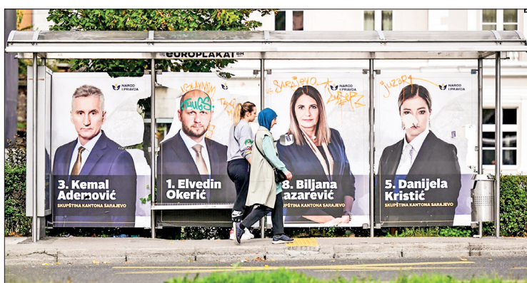
People walk past electoral posters in Sarajevo on 1 Oct 2022, on the eve of general elections in Bosnia.

If the EU, which currently comprises 27 member countries, adopts the recommendation, Bosnia would join seven other nations with candidate status: