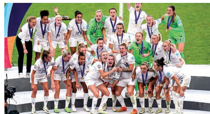
England players celebrate with the trophy after winning the Women’s Euro final at Wembley Stadium, in London, UK, 31 July 2022.