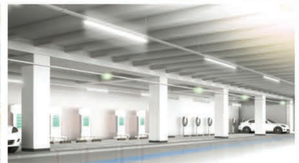
Private & Public EV Charger Carpark

Architectural Design Consultant by : ONG & ONG PTE.LTD(Singapore)