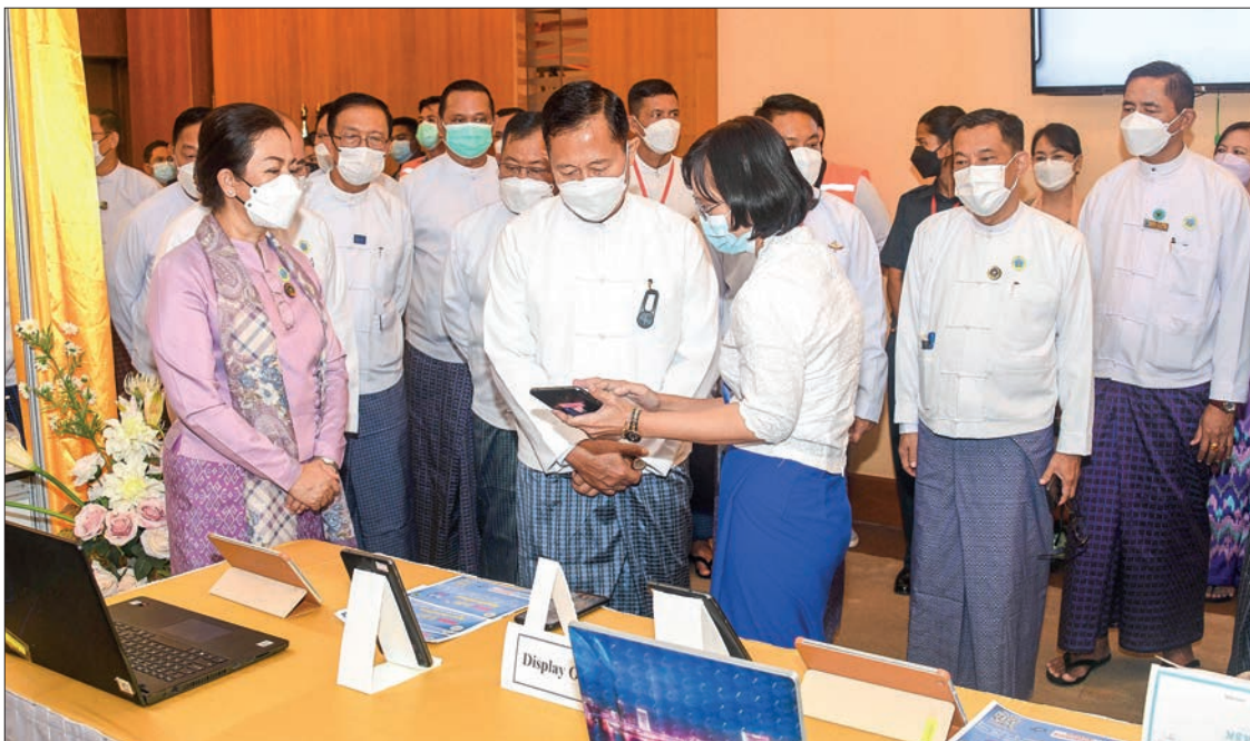
The Vice-Senior General looks into the exhibits at the event yesterday.

The Vice-Senior General visited the exhibition on natural disasters and viewed rescue equipment.