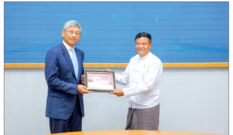
Union Sports and Youth Affairs Minister U Min Thein Zan presents a gift to the Chinese ambassador.

They also discussed the assistance of the Chinese government in Myanmar's sports sector. —MNA