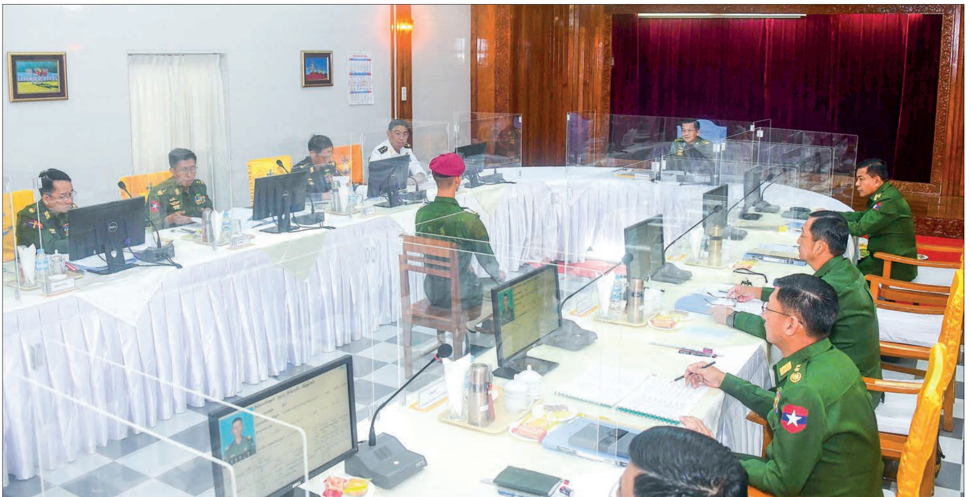
State Administration Council Chairman Commander-in-Chief of Defence Services Senior General Min Aung Hlaing continues attending the choice of arms for the 65 th Intake cadets at the Defence Services Academy in PyinOoLwin on 13 October 2022.

C HAIRMAN of the State Administration Council Commander-in-Chief of Defence Services Senior Gen-