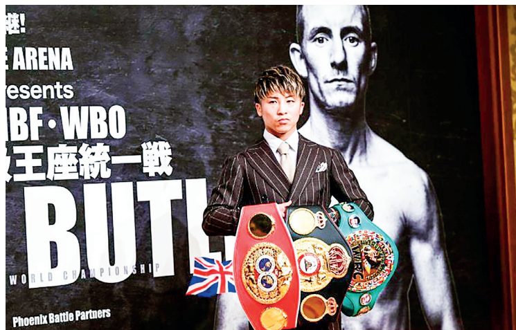
A victory against WBO champion Paul Butler would make Naoya Inoue (left) the first undisputed boxing world champion from Asia.

JAPAN’S Naoya Inoue announced Thursday that he will fight Britain’s Paul Butler in December when all four bantamweight world championship belts will be at stake.