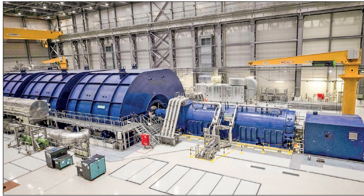
With a power level of 1,600 megawatts, the Olkiluoto 3 nuclear reactor is now the most powerful in Europe.

The almost 300-degree Celsius (572 F) steam gushing