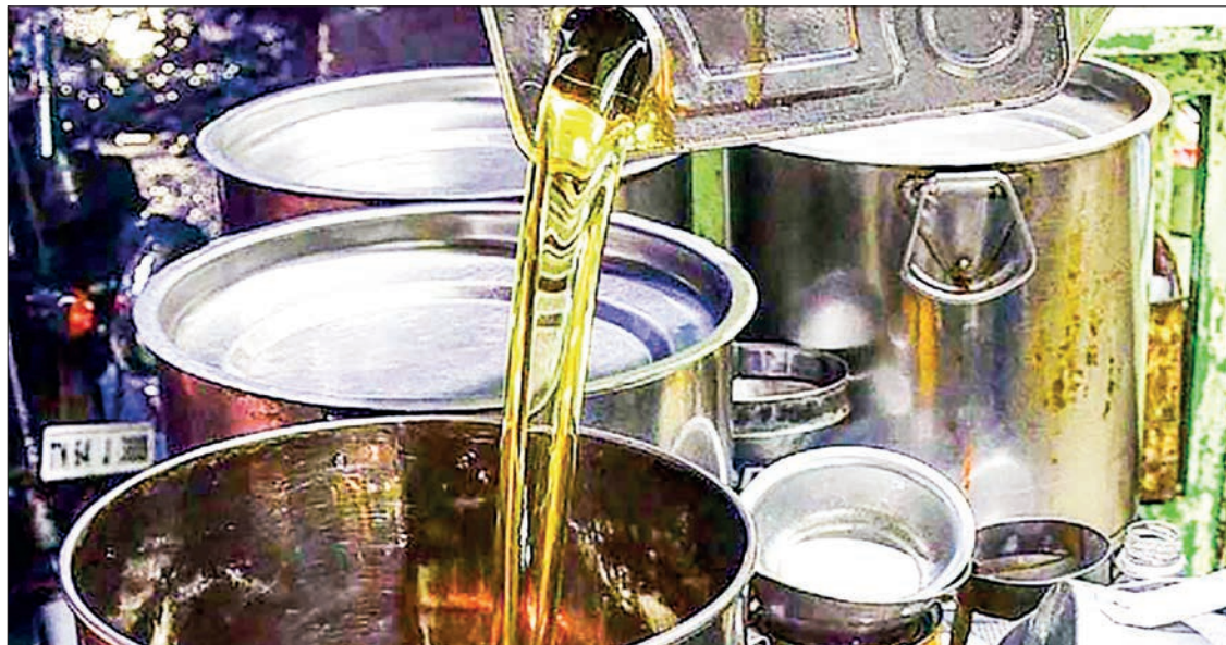
The local cooking oil production is just about 400,000 tonnes. To meet the oil sufficiency in the domestic market, about 700,000 tonnes of cooking oil are yearly imported through Malaysia and Indonesia.

THE wholesale reference rate of palm oil in the Yangon market fell below K4,000 per viss (a viss equals 1.6 kilogrammes), according to the Supervisory Committee on edible oil import and distribution.