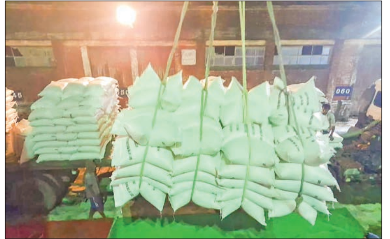
Myanmar bagged US$700 million from two million tonnes of rice exports to foreign countries in the past 2020-2021 financial year.

Myanmar has shipped more than 1.4 million tonnes of rice