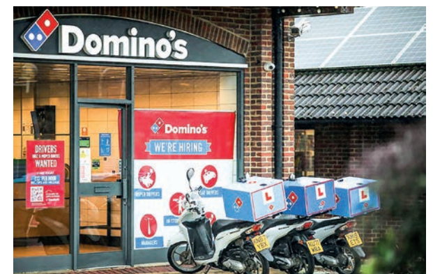
Photo taken on 15 Feb 2022 shows a sign outside a Domino's Pizza takeaway advertising for recruiting staff in Hampshire, Britain.

Meanwhile, the economic inactivity rate for people neither working nor looking for work increased by 0.6 percentage points to 21.7 per cent in the three months. —Xinhua