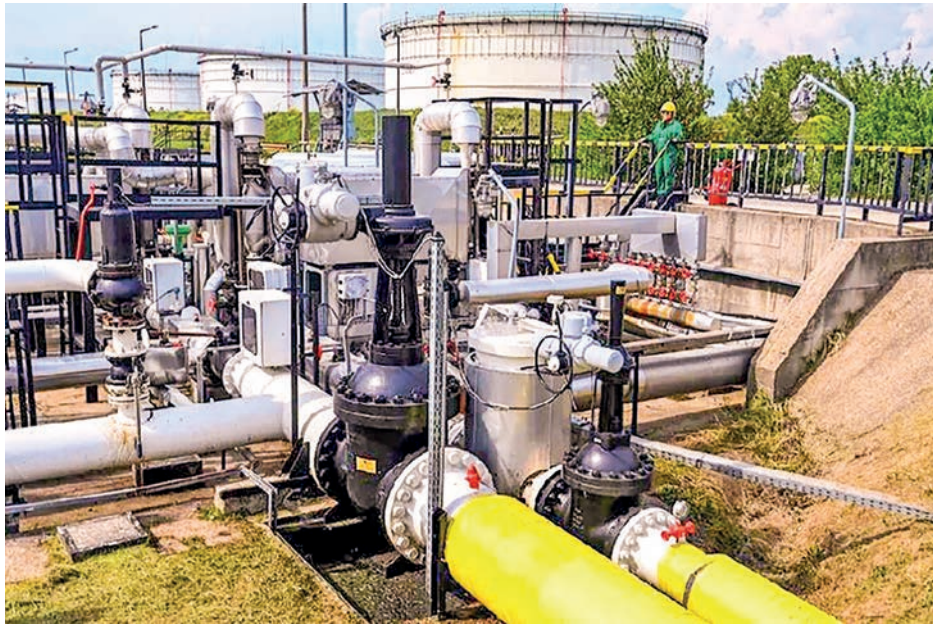
The receiver station of the Druzhba pipeline between Hungary and Russia at the Duna Refinery of Hungarian MOL Company located near the town of Szazhalombatta, Hungary, on 5 May 2022.

RUSSIA'S economy may face multiple long-term challenges, but for now energy exports appear to be helping it ride out Western sanctions im-