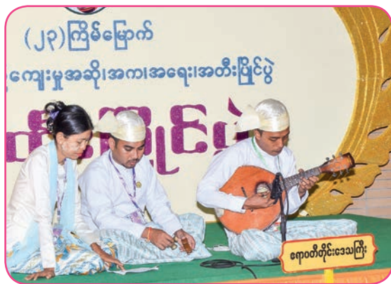
Madolin and Myanmar traditional harp competitions.

Modern song competitions at women’s (amateur-level first