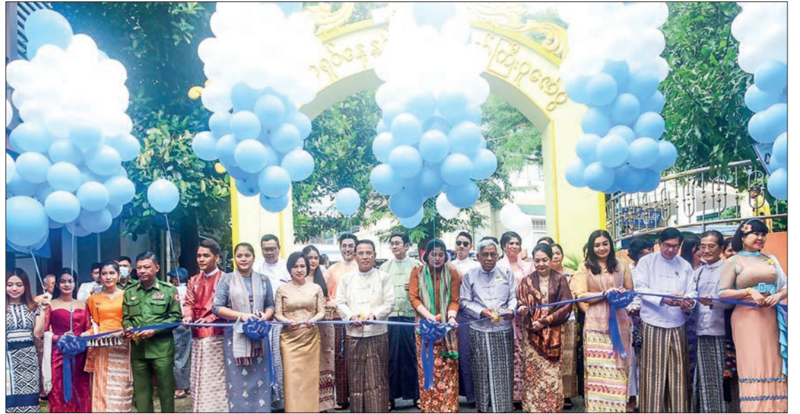
Union Information Minister U Maung Maung Ohn and dignitaries cut the ceremonial ribbon to inaugurate the Myanmar Motion Picture Museum yesterday in Yangon.

Afterwards, the Union minister and party unveiled the Myanmar Motion Picture Museum by cutting the ceremonial ribbon. The Vice-chairman 1 of the Myanmar Motion Picture Organization explained the history of the mu-