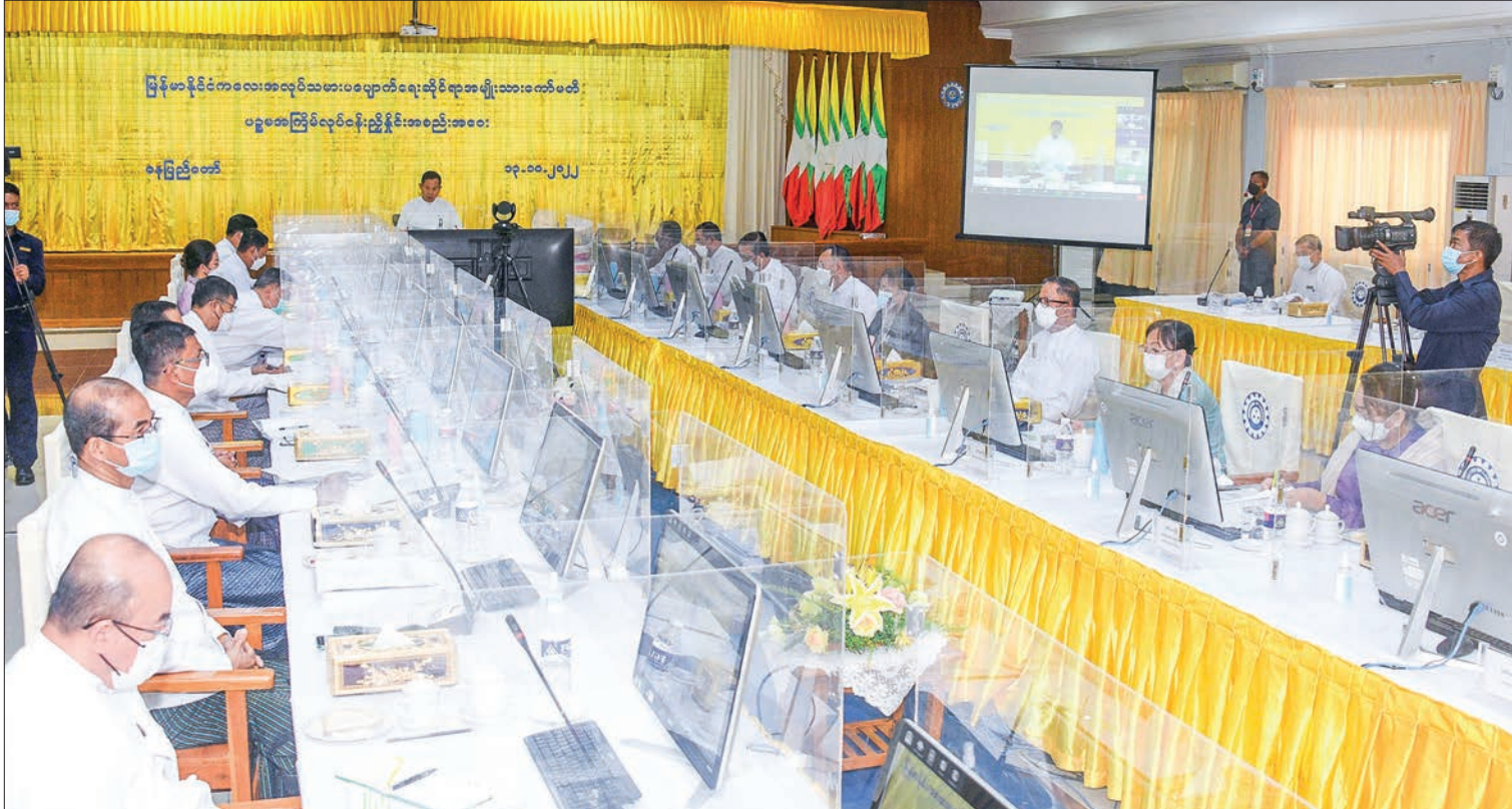
State Administration Council Vice-Chairman Deputy Prime Minister Vice-Senior General Soe Win addresses the fifth coordination meeting of the Myanmar Child Labour Eradication National Committee yesterday.

protection, job opportunities for poor families, proper jobs for adults and plans for sending all school-age children to schools, an inspection of free education and labour affairs, and the rule of law. If social protection tasks including child labour measures are on the rise, protection will cover the occurrence of child labour.