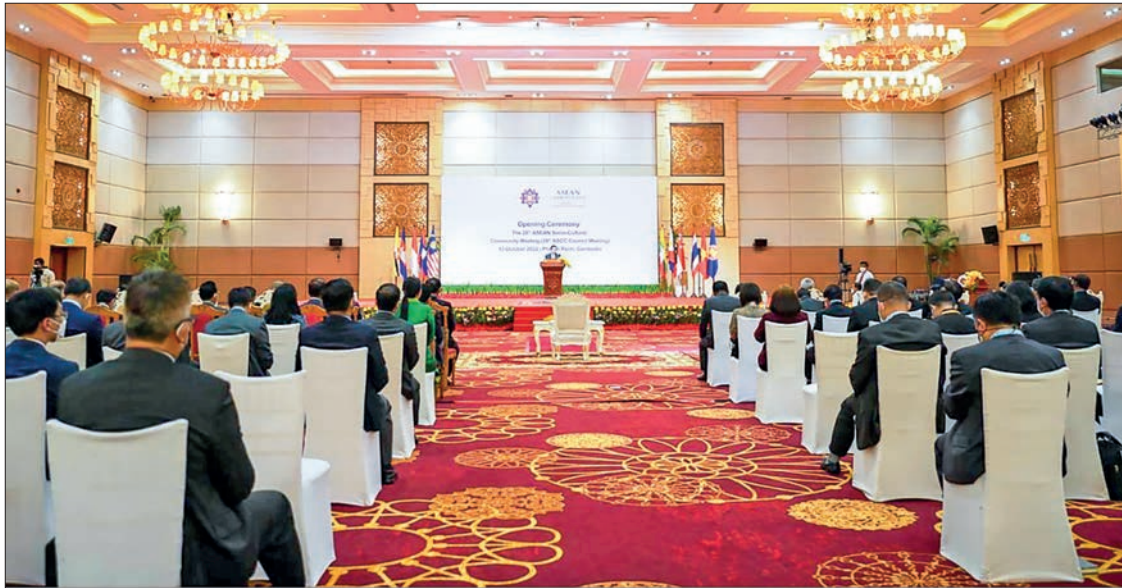
Union Religious Affairs and Culture Minister U Ko Ko and Myanmar delegation take part in the 28th ASEAN Socio-Cultural Community Council Ministers Meeting in Cambodia.

CAMBODIA hosted the 28th ASEAN Socio-Cultural Community Council (ASCC) Ministers Meeting in Phnom Penh yesterday.