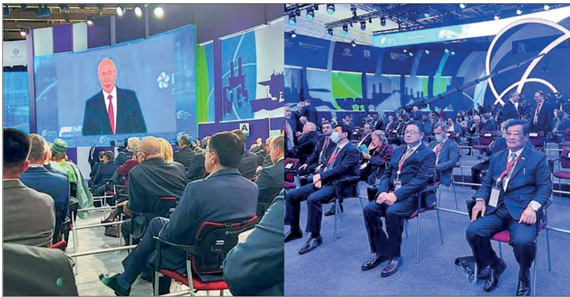
Union Electric Power Minister U Thaug Han and Union Energy Minister U Myo Myint Oo attend the opening ceremony of the Russian Energy Week International Forum in Moscow.

UNION Minister for Electric Power U Thaug Han and Union Minister for Energy U Myo Myint Oo attended the opening ceremony of the Russian Energy Week International Forum together with Myanmar Am-