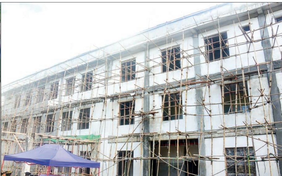
The Senior General views the construction of the radiation and cancer ward at the military hospital in PyinOoLwin.

hospital and responded to the reports of officials, instructing them to systematically install water and power supply facilities, carry out construction tasks meeting the set standard for easily moving patients from one place to another, ensure timely completion of the building in time and left other necessary instructions.