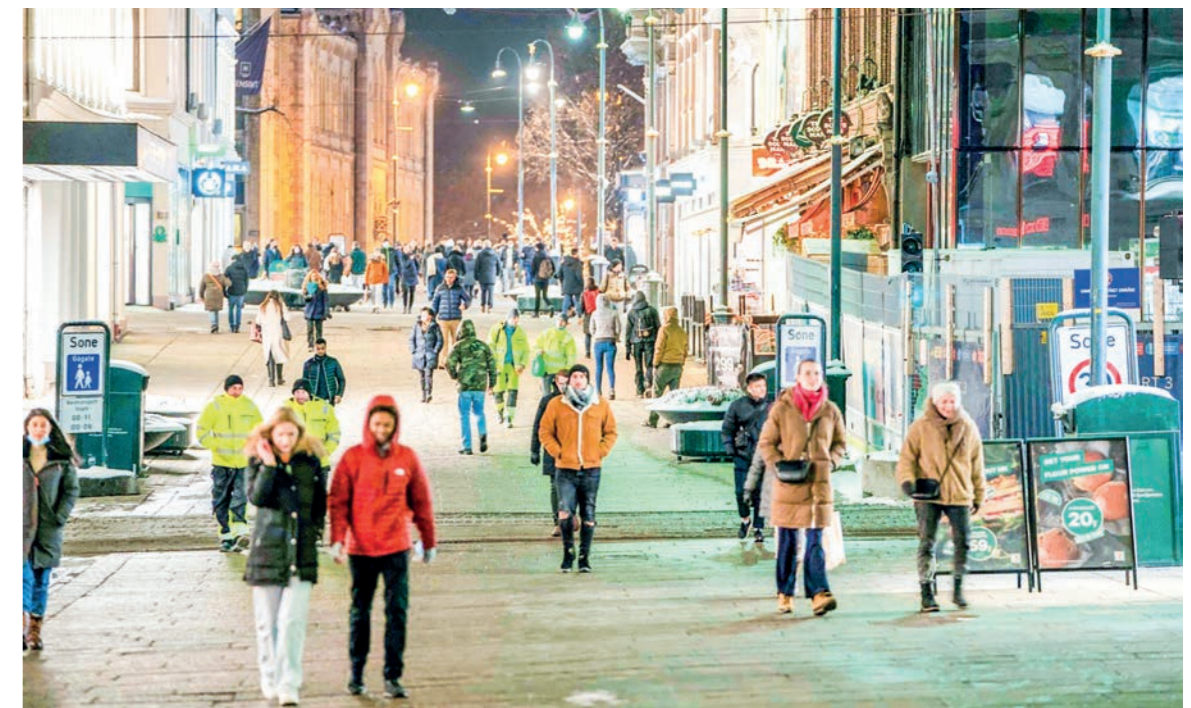
Norway topped the index as the best-performing nation when it comes to tackling inequality.

ments around the world to refrain from austerity measures that would worsen the lot of the poor.