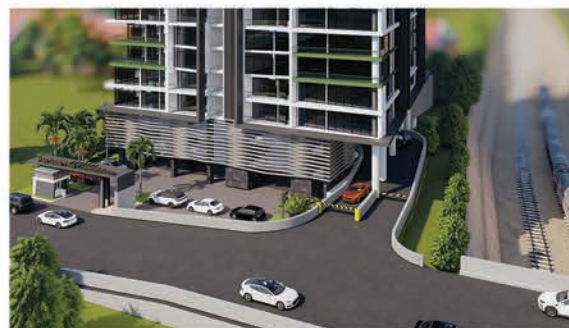
Entrance-1&2 (Ahlone Rail-way Bridge)