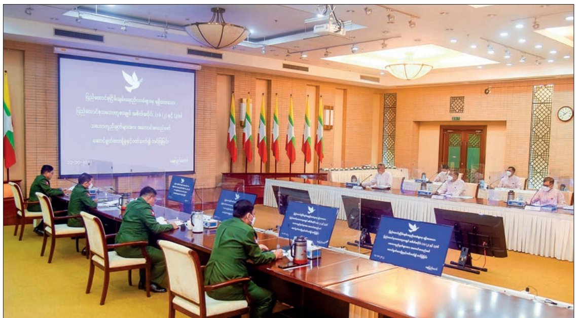
The second-day peace talks between the State Peace Talks Team and the New Mon State Party is in progress on 13 October 2022.

After that, they discussed general issues and adjourned the second-day meeting. The third-day meeting will be held on 14 October, it is learnt. — MNA