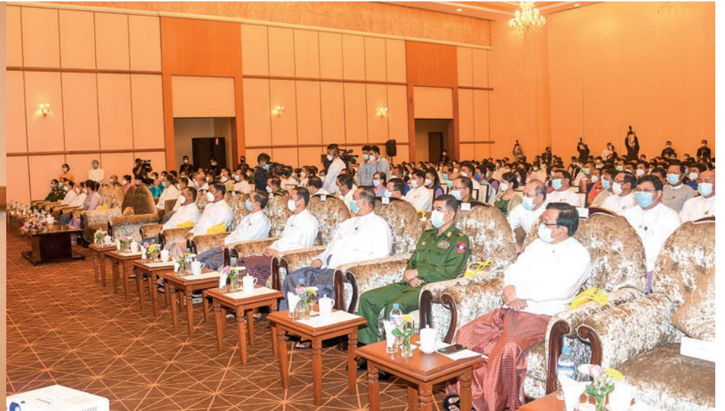
State Administration Council Vice-Chairman Deputy Prime Minister Vice-Senior General Soe Win speaks on the occasion to mark the International Day for Disaster Risk Reduction in Nay Pyi Taw on 13 October 2022.

(GP2022) held in Bali of Indonesia this year prioritized discussions on strengthening public-centred early warning and early action for all disasters, the correctness of data on natural disasters, financial resource management and effectiveness of natural disaster management.