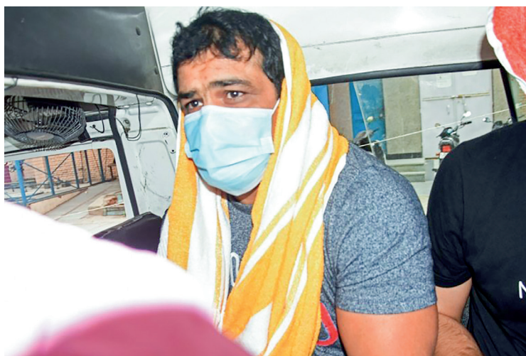
Indian Olympic medallist Sushil Kumar is escorted by police after his arrest in May last year.

He has been charged with murder, kidnapping, rioting and using deadly weapons. Two of the accused are still on the run,