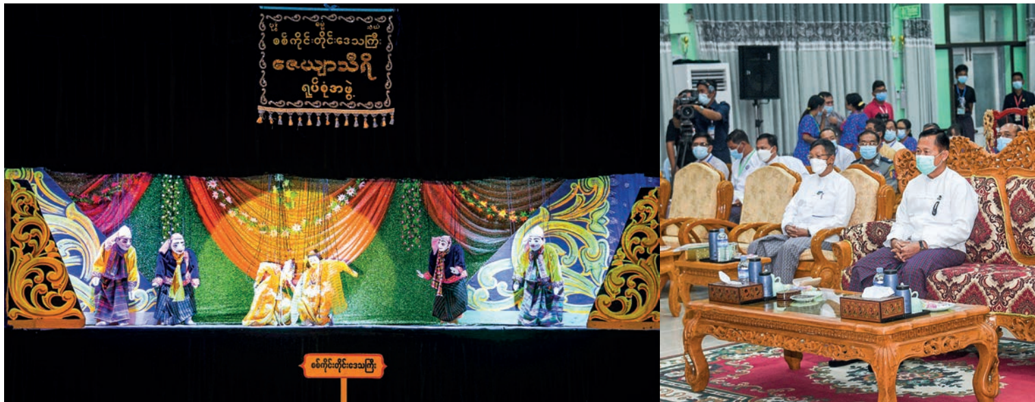
State Administration Council Vice-Chairman Deputy Prime Minister Vice-Senior General Soe Win watches the competition of the marionette troupe from Sagaing Region yesterday.

At the marionette play amateur level (first class) event, the Zeyathiri marionette troupe representing Sagaing Region presented performances with full dancing methods under the title of “Ngapada Akkhaya” (five-stanza letter). The Patron of the leading committee, Union level persons, the chairman of Nay Pyi Taw Council, the commander of Nay Pyi Taw Command, deputy