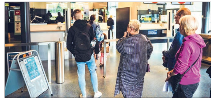
Russian tourists have their passport checked on 28 July 2022 at the Nuijamaa border crossing, Finland.

from 25 October. Lipavsky said the Czech Republic was following in the footsteps of Finland, Poland and the Baltic states, which had introduced a similar measure earlier on. In the wake of the recent bombing of civilian targets in Ukraine by the Russian army, "we need to seek solutions that will send a clear signal to the people inside the Russian Federation", Lipavsky said. — AFP