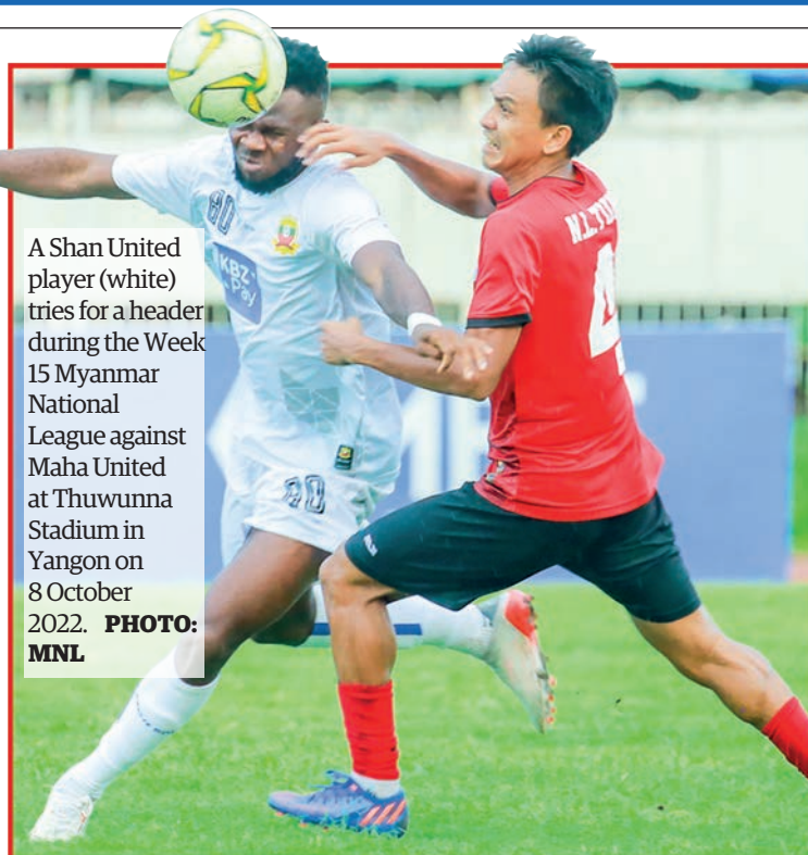
A Shan United player (white) tries for a header during the Week 15 Myanmar National League against Maha United at Thuwunna Stadium in Yangon on 8 October 2022.

After this match, the Shan United team continues to lead