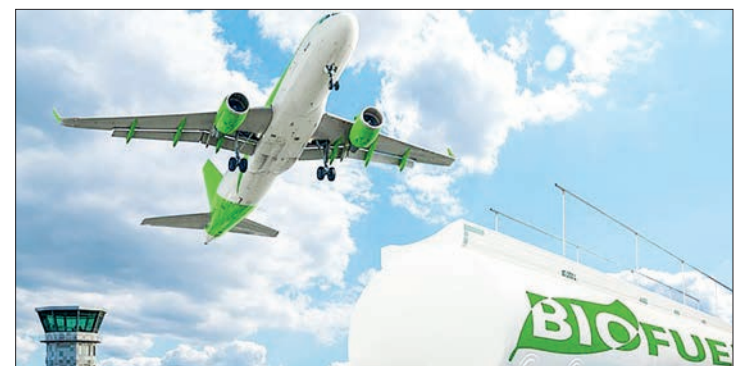
An aviation biofuel or bio-jet-fuel or bio-aviation fuel (BAF) is a biofuel used to power aircraft and is said to be a sustainable aviation fuel (SAF).

"It's an excellent result," a diplomatic source told AFP, revealing that only four coun-