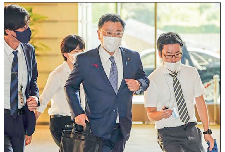
Japan’s Chief Cabinet Secretary Hirokazu Matsuno, centre, arrives at the prime minister’s office in Tokyo Tuesday, 4 Oct 2022. South Korea says North Korea has fired a ballistic missile toward its eastern waters.

The spokesman said Pyongyang “categorically condemns and rejects” the ICAO move “as a political provocation of the US and its vassal forces aimed to infringe upon the sovereignty” of North Korea.—Kyodo