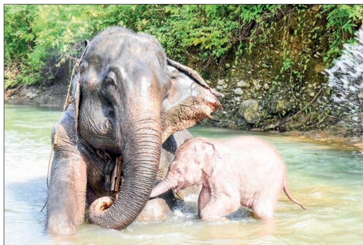
The new White Elephant is pictured playing happily in the water.