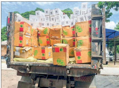
Confiscated illegal commodities in Mandalay Region.

SUPERVISED by the Anti-Illegal Trade Steering Committee, effective action is being taken to prevent illegal trade under the law.