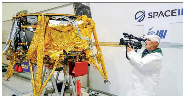
Australia's plant-growing experiment on the Moon will be carried on board the Israeli spacecraft 'Beresheet 2'. PHOTO: AFP

One likely choice is an Australian "resurrection grass" that can survive without water in a dormant state.— AFP