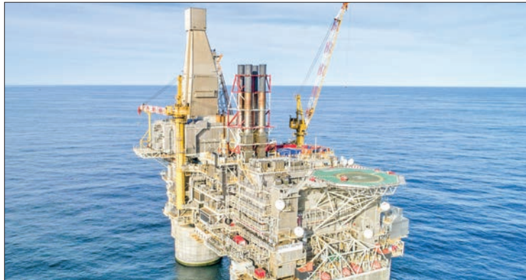
Undated photo shows a facility of the Sakhalin 1 oil and gas development project.

SODECO holds a 30 per cent stake in the project, which started producing crude oil in 2005. The decree was quoted as stating that foreign business partners will have one month to decide whether to invest in the