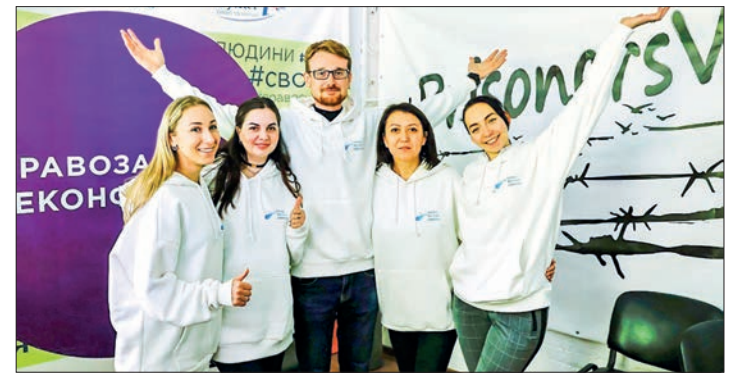
Staff members of the Centre for Civil Liberties celebrate in Kyiv after the Ukrainian human rights group won the Nobel Peace Prize on 7 Oct 2022.

THE Royal Swedish Academy on Friday jointly awarded the 2022 Nobel Peace Prize to human rights advocate Ales Bialatski from Belarus, the Russian human rights organization Memorial and the Ukrainian human rights organization Centre for Civil Liberties.