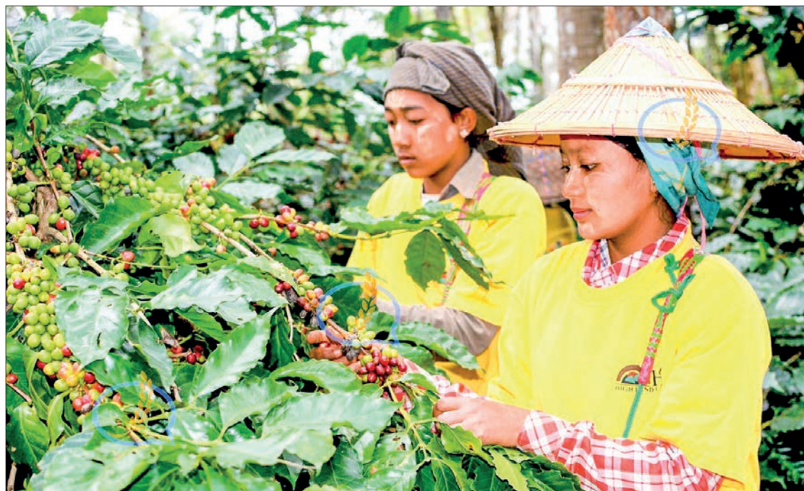
PyinOoLwin Township produces 500 metric tons of coffee per year while 700 metric tons are produced in Ywangan with Shan State being a top producer.

The coffee produced in Myanmar is exported to 14 countries including the UK, America, the Netherlands, New Zealand, Australia, Germany, Japan, Chi-