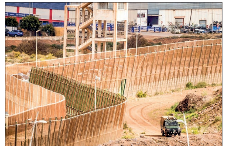
The border fence separating Morocco (R) from Spain’s North African Melilla enclave (L), near Nador in Morocco.

Since the 24 June incident, dozens of mostly Sudanese migrants have been sentenced to prison terms ranging from eight months to two years in prison without parole.—AFP