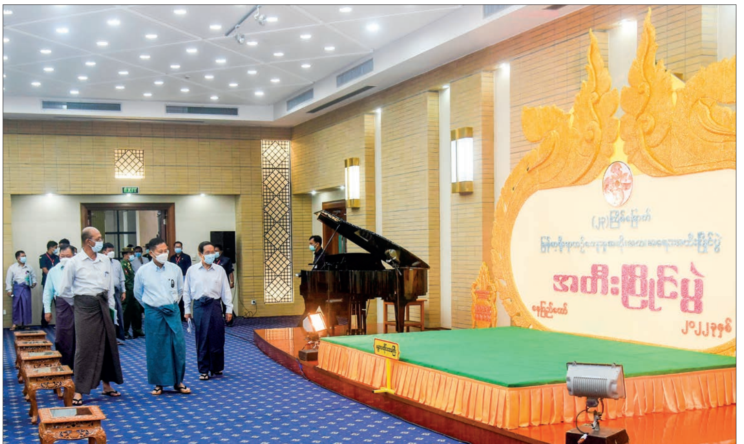
State Administration Council Vice-Chairman Deputy Prime Minister Vice-Senior General Soe Win views the preparations for the successful holding of the 23 rd Myanmar Traditional Cultural Performing Arts Competition in Nay Pyi Taw on 8 October 2022.

al and party also inspected hostels for providing accommodation to contestants and members of the panel of judges