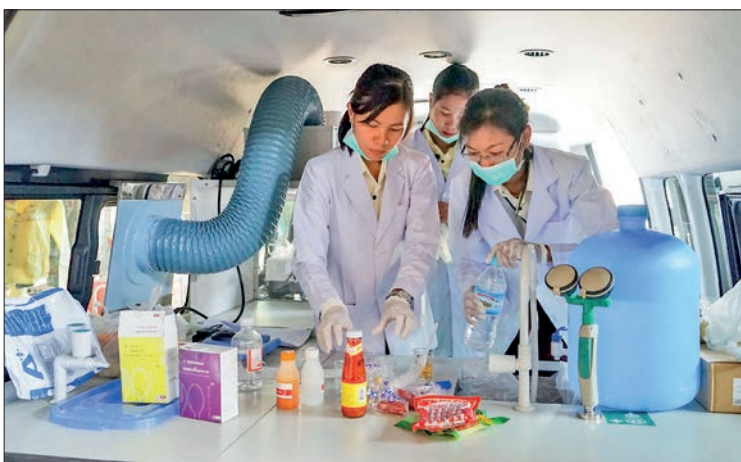
FDA staff are seen examining foodstuffs.

If sellers do distribute and sell such unfit food in the market and do not comply, action will be taken under Article 28 (a) of the National Food Law. — TWA/GNLM