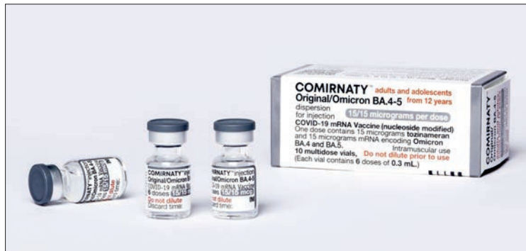
The health ministry plans to begin the rollout of Pfizer Inc.'s coronavirus vaccine tailored to protect against the BA.5 subvariant next Thursday.

The bivalent vaccine is available next Thursday for people aged 12 and over who have received two previous shots. The panel will discuss the interval between vaccinations on 19 Oct. However, another person familiar with the matter has said that it may be shortened to three months from the current five months.—Kyodo