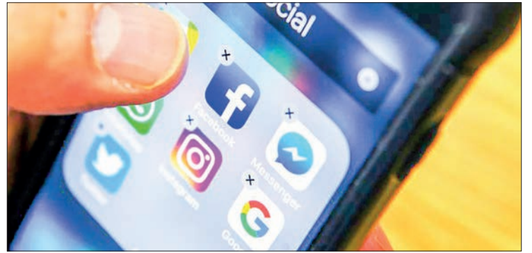
US tech giants have faced a barrage of lawsuits from EU privacy activists concerned about the ability of US intelligence services to access the personal data of Europeans.

resorted to legally uncertain workarounds to keep the data flow moving, with hope that the two sides could come up with something stronger in the long term.—AFP