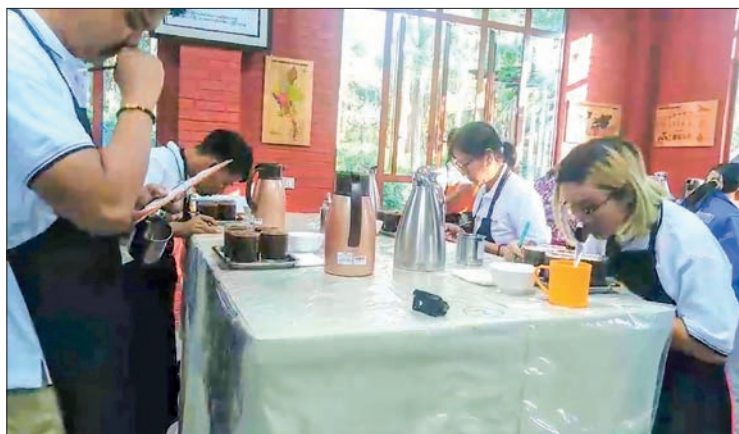
One of the coffee training sessions.

PyinOoLwin Township produces 500 metric tons of coffee per year while 700 metric tons are produced in Ywangan with Shan State being a top producer. The country exports them to 14 countries at present. — Nyein Thu (MNA)/GNLM