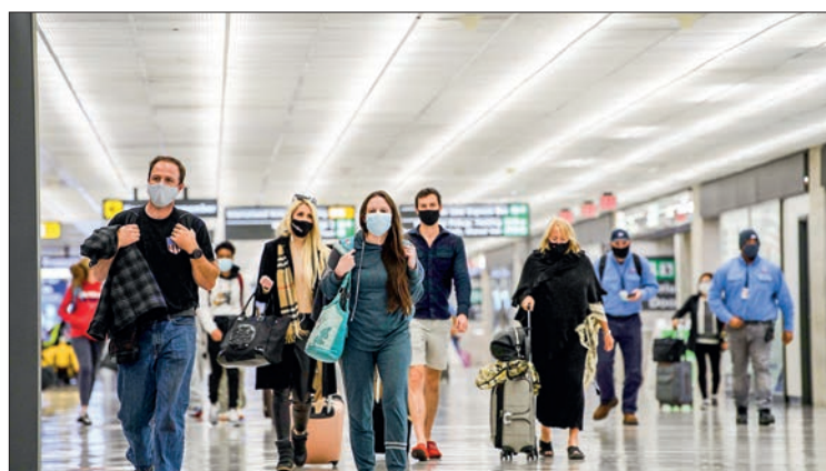
Travellers walk through Washington's Dulles International Airport in Dulles, Virginia, on 24 November 2020.

CDC issued a warning over Ebola virus disease (EVD) since the Ugandan Health Ministry