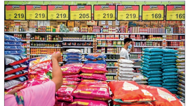
The FAO said 45 countries, including 33 in Africa, nine in Asia, two in Latin America and the Caribbean, and one in Europe "are in need of external assistance for food".

Prices for grains and cereals, a component in the index, rose by 2.2 per cent due in part to uncertainty connected to the supply of wheat through the Black Sea, the trade route most affected by the Ukraine crisis. Dry conditions in the United States and Argentina have also had an impact on production in those countries, with rice prices also climbing based in part on changes in export policies from India.—Xinhua