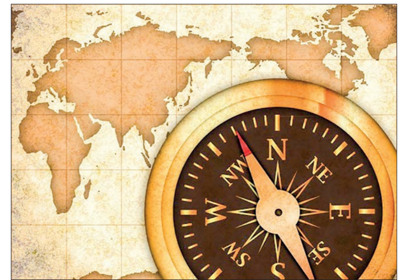
Image of Compass showing the direction you must proceed.

What is needed to overthrow the status is a candid dialogue between SAC key members and the NUG key members. Both the Myanmar government and NUG/PDF should stop relying on foreign countries. This is because foreigners and foreign governments are not aware of the meaning of Myanmar's constitution, nor are they aware of the frequent encroachments on