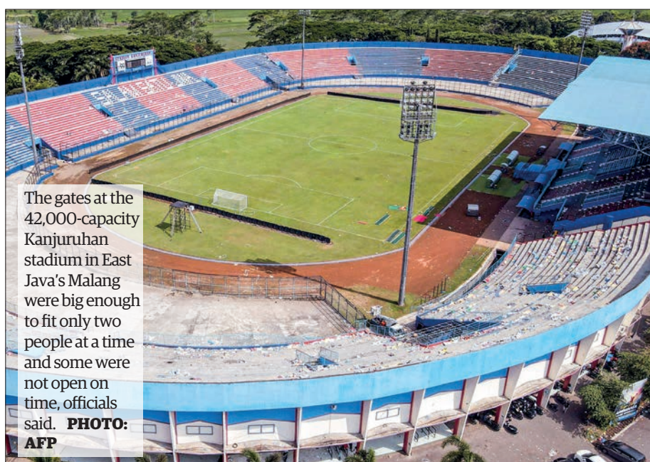
The gates at the 42,000-capacity Kanjuruhan stadium in East Java’s Malang were big enough to fit only two people at a time and some were not open on time, officials said.

THE deadly stampede at an Indonesian football stadium has shaken the foundations of the country’s most popular sport and was the culmination of decades of mismanagement and violence, experts say.