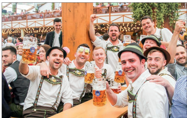
People attend the Oktoberfest 2022 in Munich, Germany, 17 Sept 2022.

SINCE the start of the Oktoberfest celebrations in mid-September in the German state of Bavaria, the seven-day incidence of COVID-19 cases per 100,000 peo-