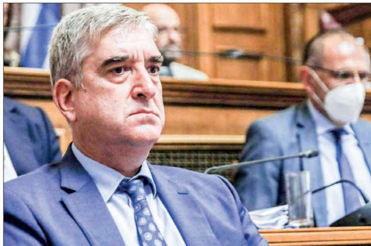
Greece’s then-intelligence chief Panagiotis Kontoleon is seen in Athens on 29 July 2022. Several days later, Kontoleon resigned amid a scandal involving the alleged spying of an opposition politician.

COVER-UP allegations are dogging a short-lived Greek parliamentary investigation into a