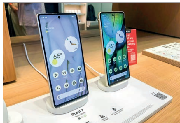
Google unveiled its Pixel 7 as it makes a bigger push into smartphone hardware.

figures are partly due to the Google phone's limited availability, with the Pixel 5 sold in less than 10 countries as the tech giant has focused its smartphone investment on software rather than its own hardware.—AFP