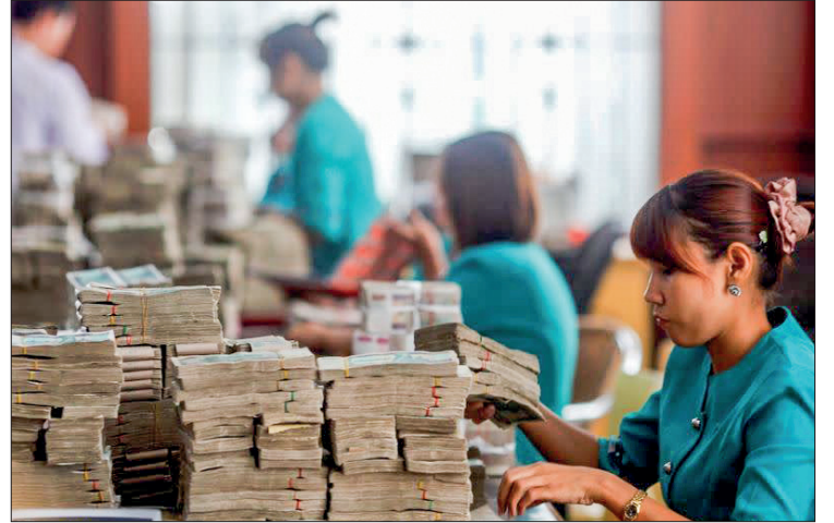
Bank staff count Myanmar's kyat notes at the office of a local bank in Yangon. — TWA/GNLM

Granting interest for average excess reserve will be conducted at the state-owned banks, private banks and foreign banks allowed for Retail Banking at Myanmar Kyats at the same time. — TWA/GNLM