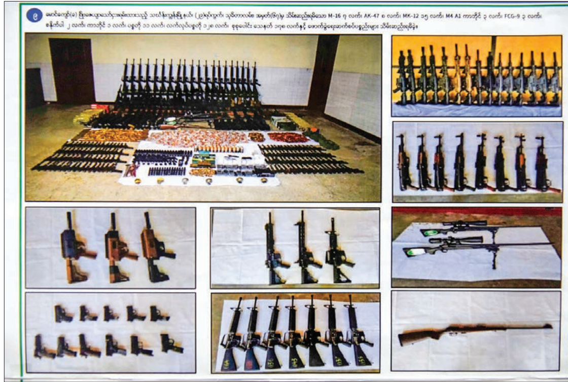
The series of weapons is evidence that PDF planned a well-organized riot.

And an intermediary between NUG and SAC is needed. Academics, merchants, and religious people can do that role. Currently,