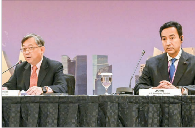
Singapore Trade and Industry Minister Gan Kim Yong (L) and Japan's economic minister Daishiro Yamagiwa hold a press conference in Singapore on 8 Oct 2022.

The one-day meeting discussed Britain's entry into the