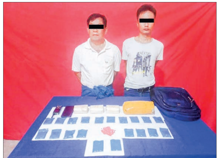
Two arrestees are seen along with seized stimulant pills.

them. Similarly, a combined team consisting of the Shan State Police Force examined suspicious Maung Lay near Ingyingon village, Thaleoo village-tract in Nyaungshwe Township at 2:40 pm on 6 October and they found 1,100 stimulant tablets from him. Those suspects were prosecuted under the Narcotic Drugs and Psychotropic Substances Law. — MNA