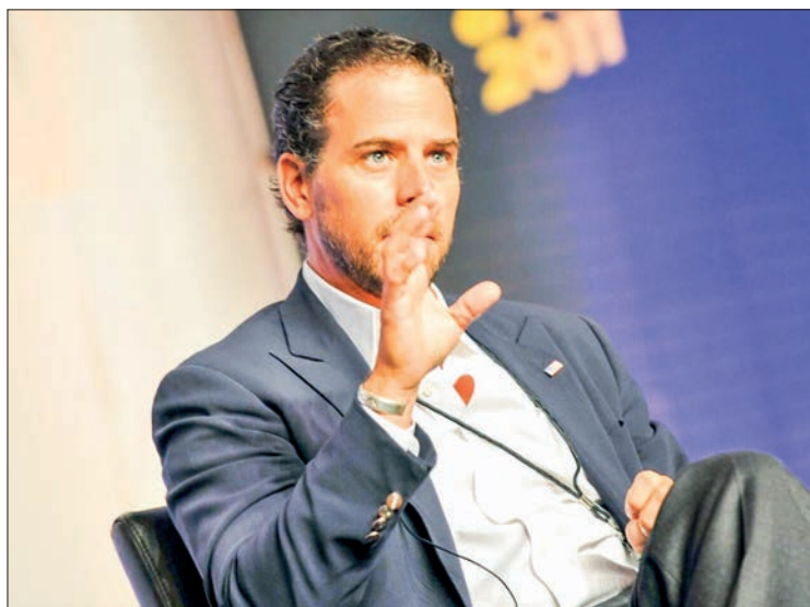
Federal investigators indicate they have enough to charge Hunter Biden: report.

It would be up to the US Attorney in Delaware, an appointee of former president Donald Trump, to decide whether to file