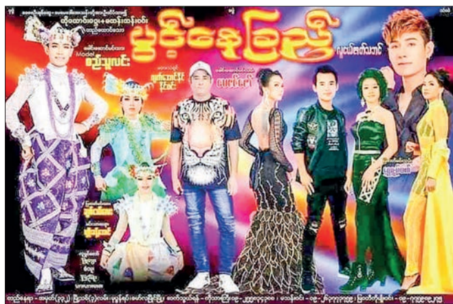
An advert sign of the Pwint Nay Chi theatrical troupe.

ON the night of October 6, the death toll reached 11 people in the car accident of the Pwint Nay Chi theatrical troupe on the Myawady-Kawkareik Asia Highway, Kayin State, according to the Mon State Police Force.