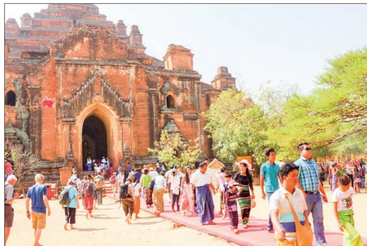
The Bagan-NyaungU area was crowded with tourists and homegrown visitors in 2018.

“In 2019, all the hotels and guesthouses were occupied. The number of visitors has decreased amid the COVID-19 impacts and security concerns on road transport triggered by the political changes. The hotel