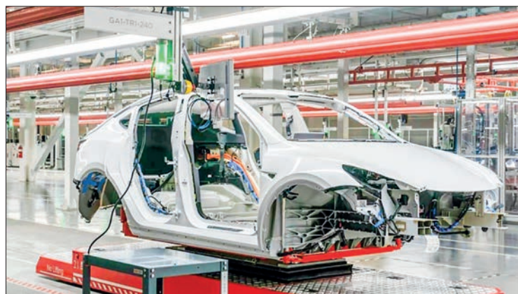
Prices have surged over the past year, partly due to global supply chain problems that created shortages of key parts such as semiconductors needed for cars and electronics, as well as a shortage of workers.

"Inflation remains stubbornly and unacceptably high, and data over the past few months show that inflationary pressures