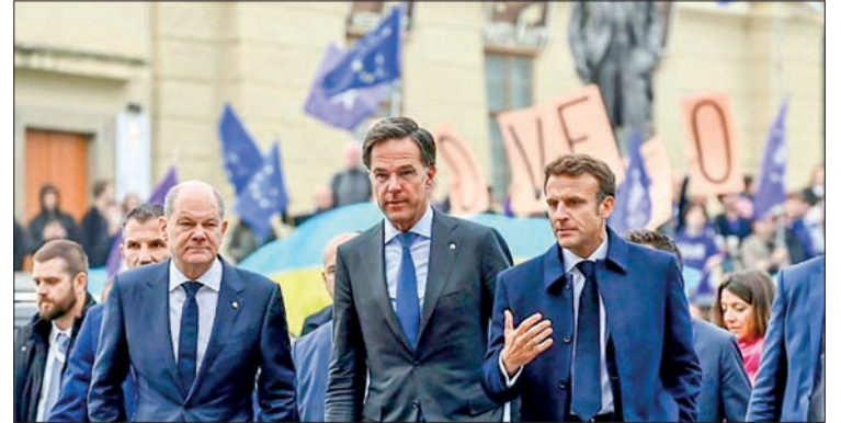
EU leaders have disagreed over how to tackle soaring energy costs. PHOTO: AFP

Governments across the bloc are scrambling to lower the costs for their consumers, but they rely on different sources for their energy and are split over the solutions.—AFP