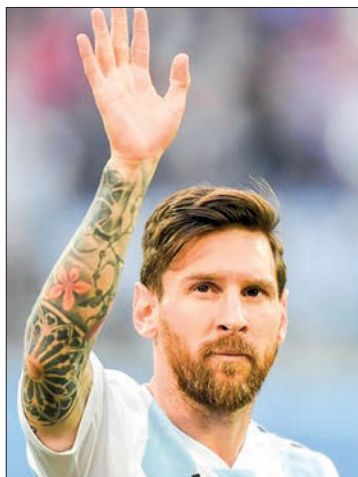
Argentine superstar Lionel Messi said the Qatar World Cup will be the last of his career.

ARGENTINA captain Lionel Messi said Thursday that the 2022 World Cup in Qatar will "surely" be the last of his career.