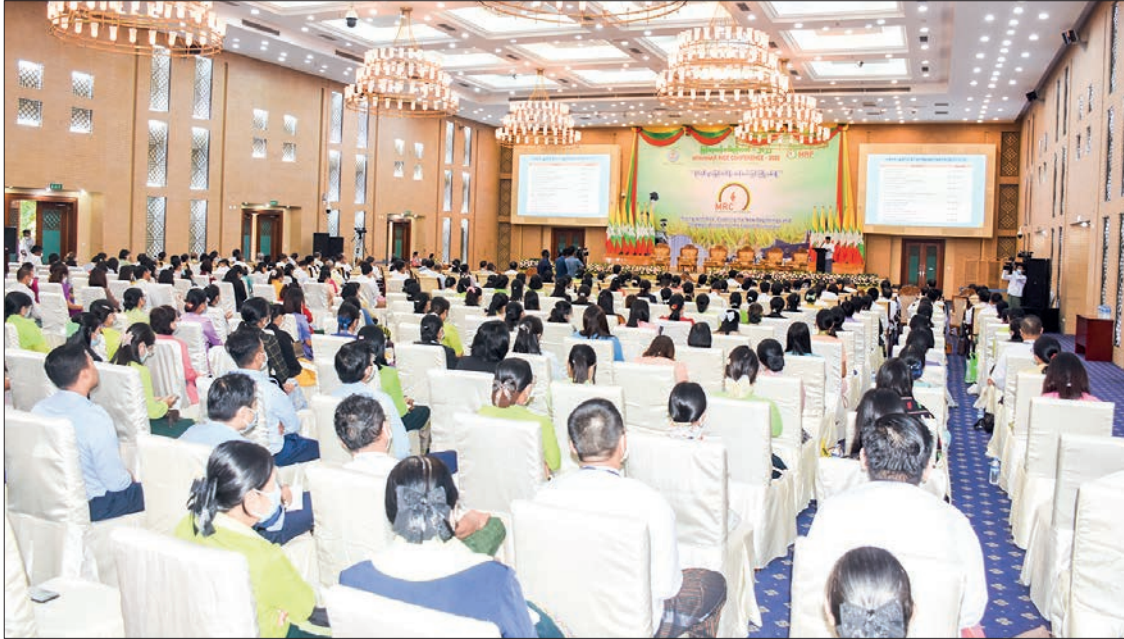
The Myanmar Rice Conference 2022 is in progress yesterday.

THE Myanmar Rice Conference 2022 was successfully held at the Myanmar International Convention Centre-II in Nay Pyi Taw yesterday morning with the attendance of