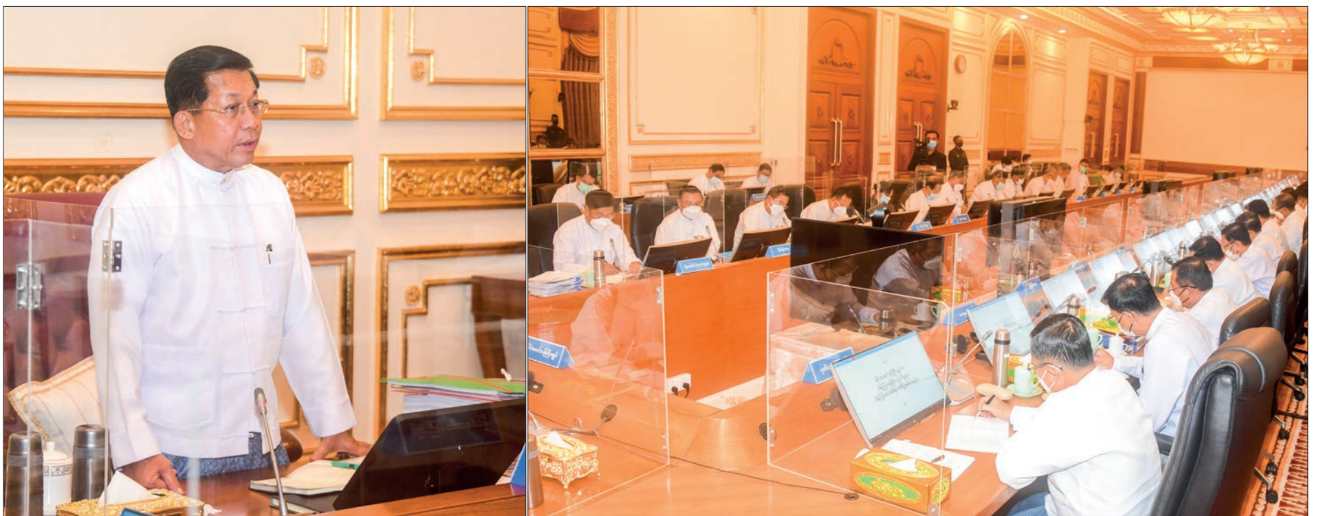
State Administration Council Chairman Prime Minister Senior General Min Aung Hlaing addresses the meeting 7/2022 of the Union government in Nay Pyi Taw on 7 October 2022.

ALL ministries must spend the budget under the appropriate titles without waste, said Chairman of the State Administration Council Prime Minister Senior General Min Aung Hlaing at the meeting 7/2022 of the Union government at the SAC Chairman office in Nay Pyi Taw yesterday afternoon.