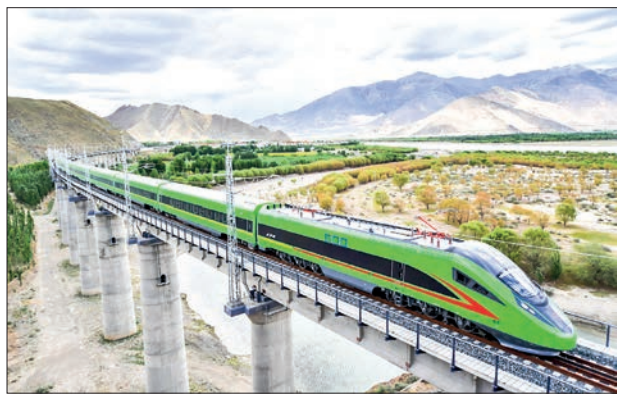
A Fuxing bullet train runs on the Lhasa-Nyingchi railway in Southwest China's Tibet autonomous region.

CHINA is expected to see 6.55 million railway passenger trips on Thursday, the sixth day of the weeklong National Day holiday, as more travellers embark on return trips, according to the national railway operator. A total of 8,144 trains have been arranged to handle the travel rush on Thursday, according to China State Railway Group Co., Ltd.