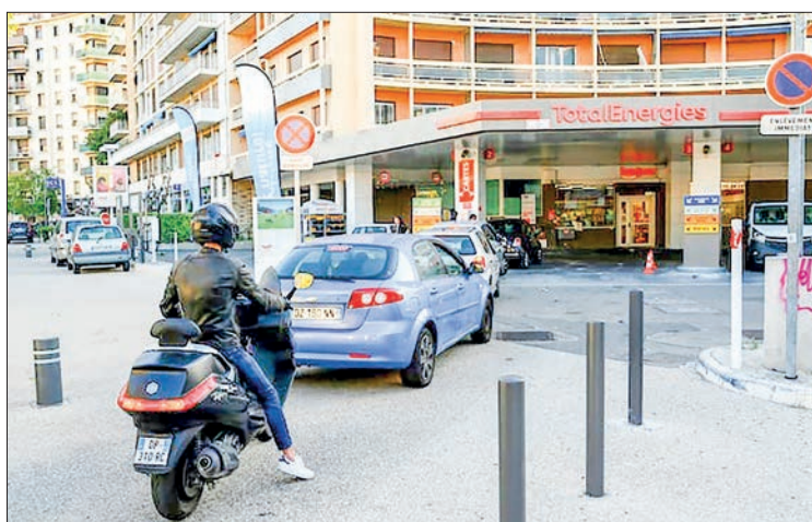
TotalEnergies runs a network of around 3,500 stations in France, nearly a third of the total, with most of them low on fuel.

FRUSTRATED motorists faced more chaos at petrol pumps across France on Friday as a strike at energy giant TotalEnergies entered its 12th day.