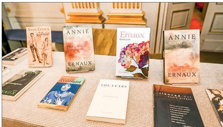
Books by French author Annie Ernaux are on display at the Swedish Academy after the announcement that Ernaux is this year's winner of the 2022 Nobel Prize in Literature at the Swedish Academy in Stockholm, on 6 Oct 2022.

won the Nobel Literature Prize, the jury announced.