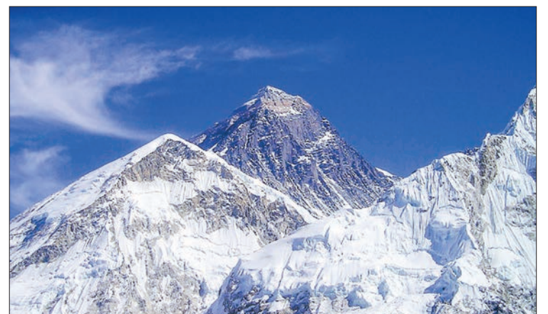
Authorities are still conducting rescue operations in the Indian Himalayas in search of 26 missing climbers struck by an avalanche that killed at least four members of their expedition.

"Rescue operations have resumed for the day but are subject to weather," she added.