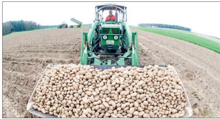
Potatoes in Kenya are an important subsistence crop; there are approximately 25 000 to 30 000 hectares grown annually. A potato variety genetically engineered to resist potato blight can help reduce the use of chemical fungicides by up to 90 per cent.

ACTIVISTS and agriculture lobby groups on Thursday urged Kenya's government to reverse its decision to lift a