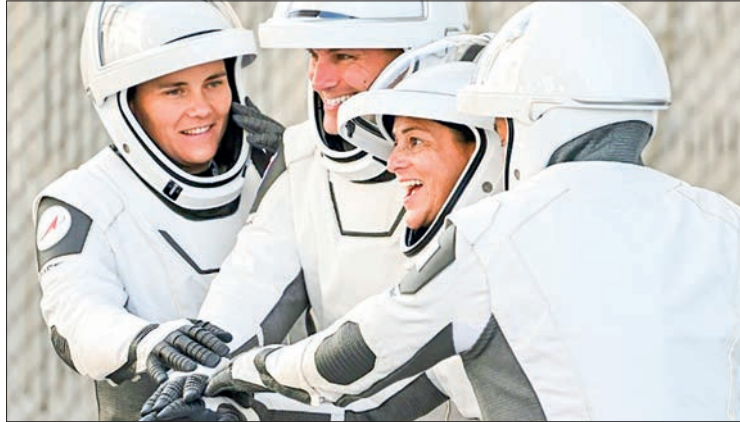
(L-R) Russian cosmonaut Anna Kikina, NASA astronaut Josh Cassada, NASA astronaut Nicole Mann, and Japanese astronaut Koichi Wakata.

finally arrived at the International Space Station," said commander Nicole Mann, the first Native American woman in space.