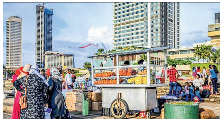
A street food vendor sets up his stall and waits for customers at Galle Face promenade in Colombo.

Stressing the urgency to stabilize the economy, Georgie-