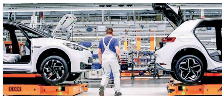
Germany's government is aiming to have 15 million pure electric cars on the road by 2030. An employee of German car maker Volkswagen works on an assembly line.

In the first nine months of the year, new registrations were down seven per cent year-on-year. The balance is "sobering," Zirpel said. —Xinhua