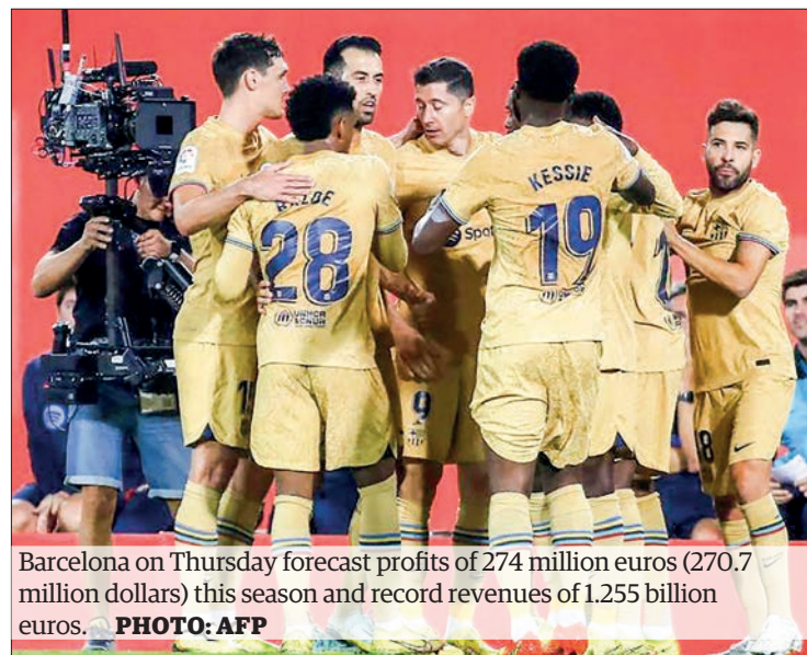
Barcelona on Thursday forecast profits of 274 million euros (270.7 million dollars) this season and record revenues of 1.255 billion euros.

The Catalans said in the year just ended they made a profit of 98 million euros after taxes, with operating income of 1.017 billion euros and expenses of 856 million euros. That followed two loss-making seasons during the Covid-19 pandemic. Barca said they were "back on the road to profit and looking to initiate a new virtuous circle".—AFP