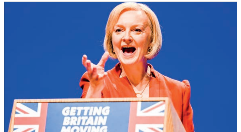
Britain's Prime Minister Liz Truss delivers her keynote address on the final day of the annual Conservative Party Conference in Birmingham, central England, on 5 October 2022.

Steven Fielding, professor of political science at the University of Nottingham, told AFP Truss's policy had been formed from talking to "a very small number of ultra rightwing, neoliberal think-tankers" but those views were not widespread, even in the Conservative party. "If you look at what she actually said, none of it was new. It was all very familiar," he added.—AFP