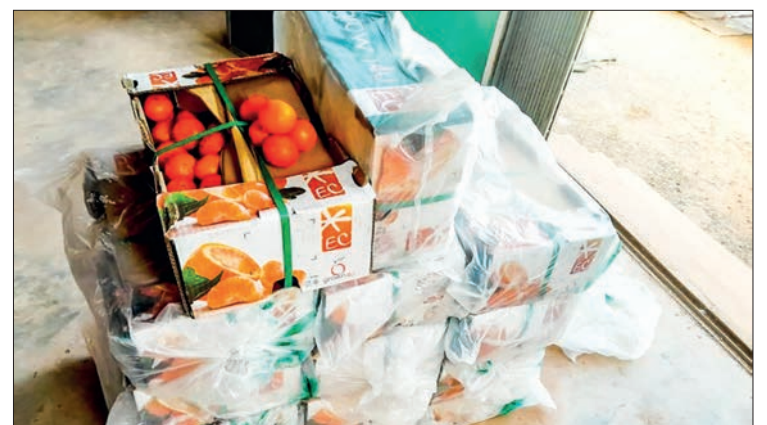
Seized illegal foodstuffs.

Afterwards, a combined team led by Myanmar Police Force captured an unregistered Kenbo 125 (estimated value of K200,000) in Shwebo township on 5 October; an unregistered Toyota Mark II car (approximately K3.5 million) at the Yadanabon Bridge Combined Checkpoint. The action was taken under the