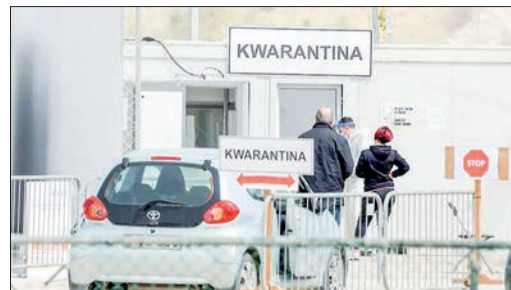
People queue outside tents set up for either COVID-19 positive or in quarantine voters to cast their vote in Zejtun on 26 March 2022 during Malta’s general election.

MALTA has spent more than 1.6 billion euros (1.58 billion US dollars) on support measures since the COVID-19 pandemic broke out in 2020, the country’s Finance Minister Clyde Caruana said on Wednesday.