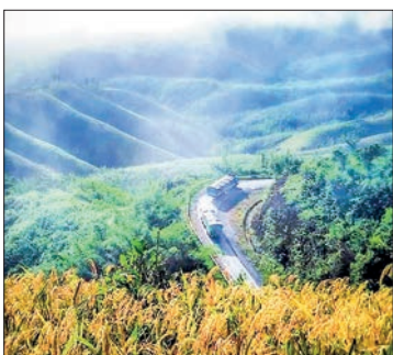
The beauty of An in the cold season (top).