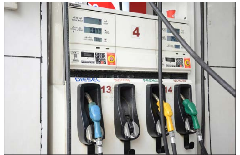
Myanmar also poses only a lower tax rate on fuel oil and strives for energy consumers to buy the oil at a cheaper rate.

As per the statement, 90 per cent of fuel oil in Myanmar is imported, while the remaining 10 per cent is produced locally. The domestic fuel price is highly correlated with international prices. The