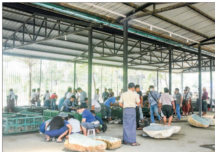
Gem merchants check jade lots at the Maniradana Jade Hall in the 57 th Myanmar Gems Emporium.

upon jade lots, three per cent upon service tax and five per cent commercial tax upon pearl lots. —TWA/GNLM