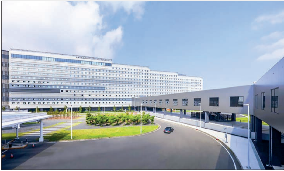
Undated photo shows a hotel complex directly connected to Haneda airport in Tokyo.

The complex was initially scheduled to open in