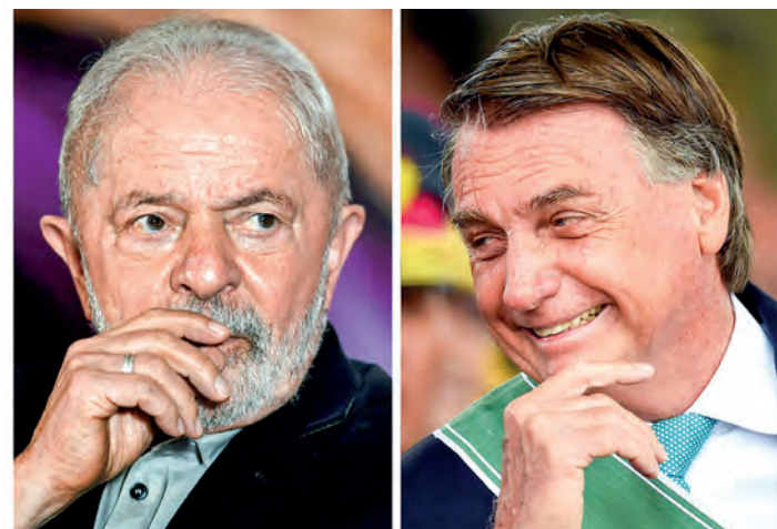
Seeking to make a spectacular comeback, ex-president and frontrunner Luiz Inacio Lula da Silva (L) failed to garner the 50 per cent of votes plus one needed to avoid 30 October runoff against far-right incumbent Jair Bolsonaro (R).

gap of 14 points. Ex-president Lula, 76, had appeared to be within arm's reach of taking the election in the first round with more than 50 per cent of the vote — but the race now heads to a 30 October runoff. Not only Bolsonaro surpassed expectations: many allies of his "God, country and family" brand of conservative politics also performed better than poll predictions in congressional and gubernatorial races.—AFP