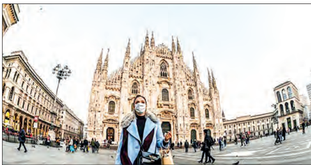
A woman walks across the Piazza del Duomo, in central Milan.

THE Italian economy contracted in the third quarter of this year, the Treasury said Monday, with more negative growth forecast into next year.