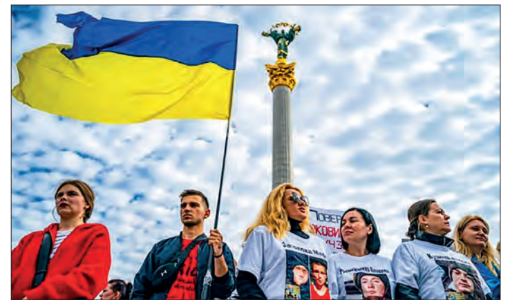
Relatives of Ukrainian prisoners involved in the battle of the Azovstal steel plant in Mariupol, attend a demonstration demanding to speed up their release with Russia, downtown Kiev, on 1 October 2022.

Kyiv's ambassador to Germany Andriy Melnyk replied bluntly: "My very diplomatic response (to Musk) is to get lost." Ukrainian presidential aide Mykhaylo Podolyak suggested a "better peace plan" under which Ukraine took back its territories including Crimea, Russia was demilitarized and denuclearized and "war criminals" faced an international tribunal.—AFP