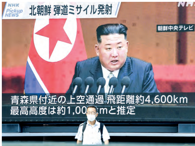
A large screen in Tokyo's Akihabara area shows news on 4 Oct 2022 that a ballistic missile fired by North Korea has flown over Japan.

NORTH Korea on Tuesday fired a ballistic missile over northeast Japan, the first it has sent across the Japanese archipelago in nearly five years, just days after launching missiles towards the Sea of Japan despite an international outcry.