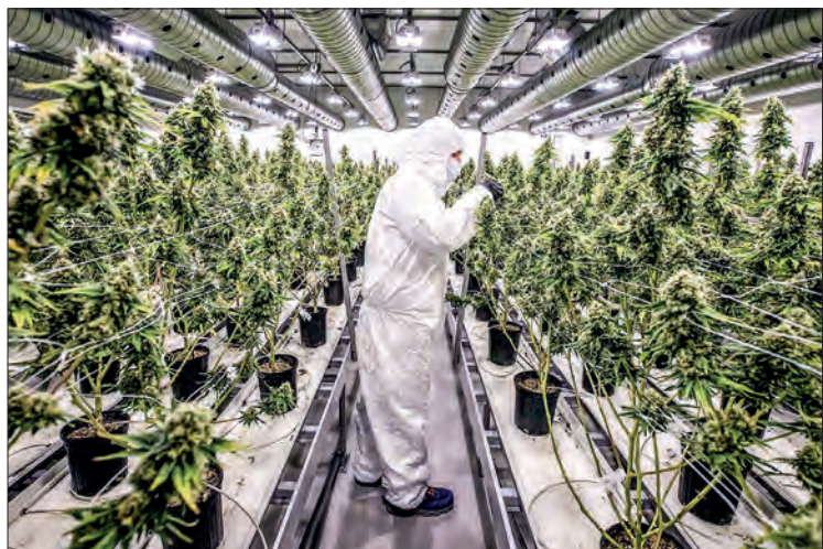
Uruguay legally produced 1,200-kilogrammes of marijuana between July 2017 and July 2018, 100 per cent of which was sold to registered users.

URUGUAY was a pioneer in the legalization of recreational cannabis use, a move that helped to push many drug traffickers out of the domestic market.