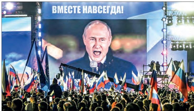
Russian President Vladimir Putin is seen on a screen set at Red Square as he addresses a rally and a concert marking the annexation of four regions of Ukraine Russian troops occupy - Lugansk, Donetsk, Kherson and Zaporizhzhia, in central Moscow on 30 September 2022.

Putin last Friday presided over a grand ceremony at the Kremlin during which he signed agreements with the Moscow-installed leaders of the four regions to become subjects of the Russian Federation.