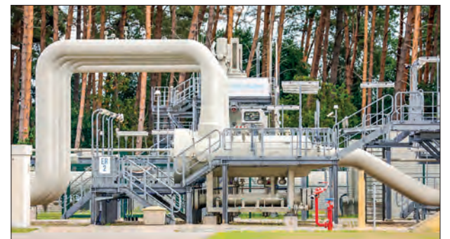
Nord Stream 1, Russia's largest gas pipeline to Europe, has been closed indefinitely after a number of leaks were found in it and a parallel pipeline, Nord Stream 2. EU leaders say the leaks were caused deliberately. Russia denies it's to blame.

loni in the French newspaper Les Echos and other European publications.—AFP