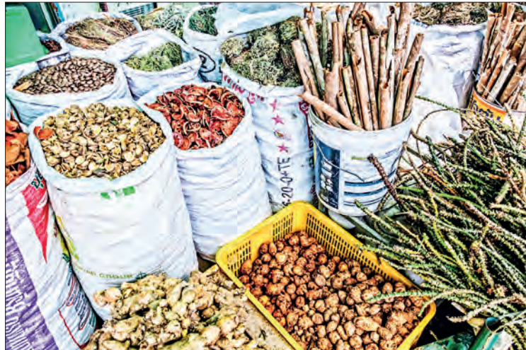
Laws on facilitating export of indigenous medical products have been drafted and would be presented at the parliament shortly.

Around 75,000 people can be provided with direct and indirect job opportunities through these initiatives, said the official, adding