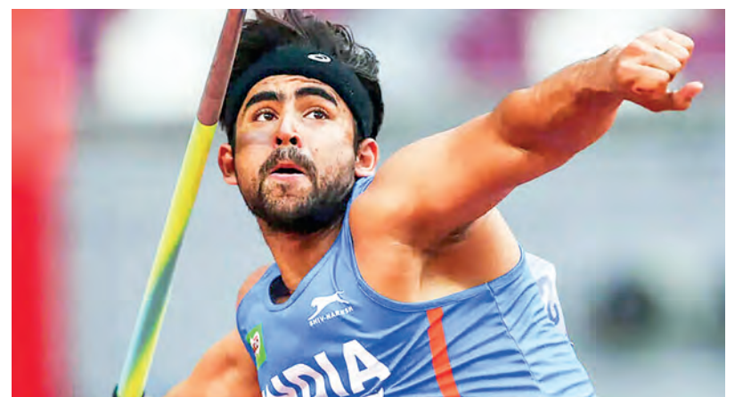
Shivpal, India’s second best javelin athlete after Olympic gold medallist Neeraj Chopra, was tested out of competition in September last year.

The 27-year-old’s ban by India’s anti-doping disciplinary panel comes into effect from his provisional suspension in October last year. It ends in October 2025, the panel said.—AFP