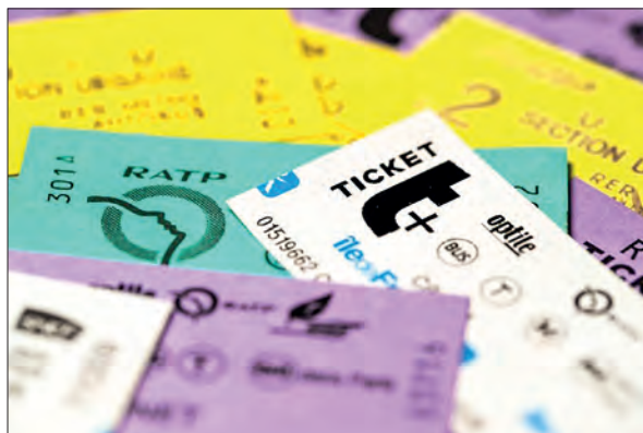
The metro ticket has had a colourful career.

THE Paris Metro is phasing out cardboard tickets after 120 years, taking the capital’s urban transit into a contactless future but leaving behind nostalgic fans who will miss the humble rectangular cards.