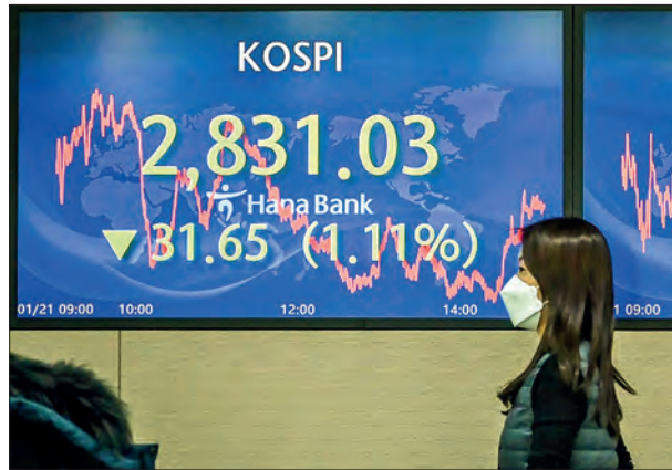
A currency dealer walks past a screen showing South Korea's benchmark stock index in a trading room at Hana Bank in Seoul on 21 Jan 2022.

In a decade of ultra-low interest rates, central banks consistently fell short of inflation targets and failed to generate healthier economic growth, the report said, adding