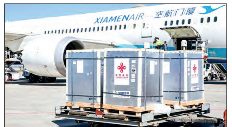
A batch of China’s Sinopharm vaccine is transported by a cart at the Manas International Airport in Bishkek, Kyrgyzstan, 19 March 2021.

COVID-19 booster doses can be received by all citizens of the republic four to six months after their second shots. At present, Sinopharm and Pfizer-BioNTech vaccines are available in sufficient quantities in the country, it said. —Xinhua