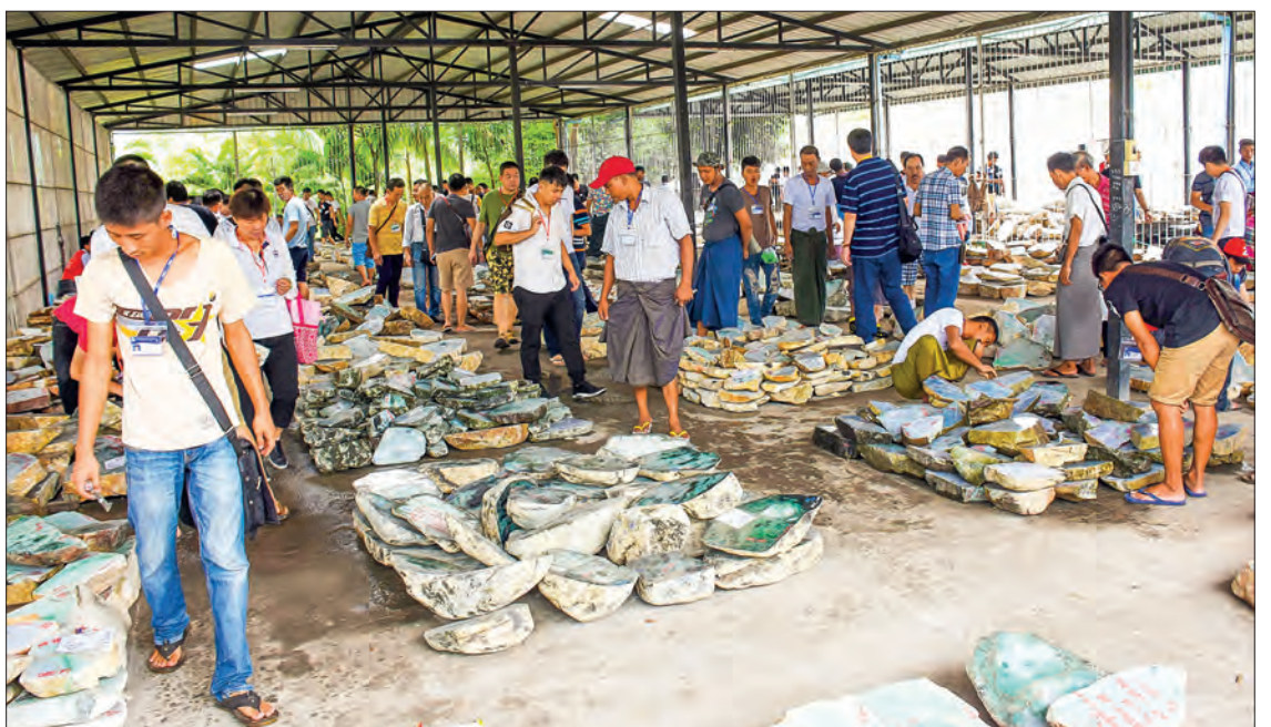
Gem merchants were seen observing the jade lots in the previous emporium.

At present, Lonkhin, Phakant, Mawlu and Mawhan gem and jade mining businesses in Kachin State have been suspended with a view to supporting sustainable resource extraction for future generations, and ensuring the safe and efficient operation of jade and gems mines, the Myanmar Gems Enterprise under the Ministry of Natural Resources and Environmental Conservation declared on 1 April. — NN/GNLM