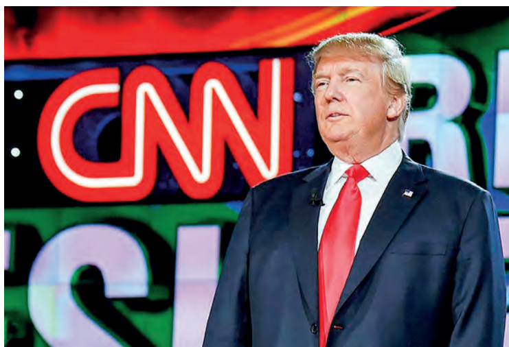
In this file photo taken on 15 December 2015, Republican presidential candidate Donald Trump is introduced during the CNN presidential debate at The Venetian Las Vegas in Las Vegas, Nevada.

He said CNN has tried to "taint" him with a "series of ever-more scandalous, false, and defamatory labels of 'racist', 'Russian lackey', 'insurrectionist', and ultimately 'Hitler'".—AFP