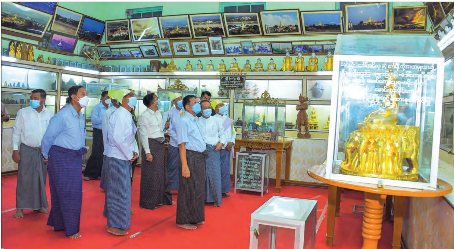
State Administration Council Chairman Prime Minister Senior General Min Aung Hlaing views round the historical museum of the Shwesandaw Pagoda in Pyay on 4 October 2022.

The Senior General tolled the great bell in the precinct of Shwesandaw Pagoda. Then, he signed in the visitors' book of the Shwesandaw Pagoda and presented a cash donation to members of the Shwesandaw Pagoda Board of Trustees. — MNA