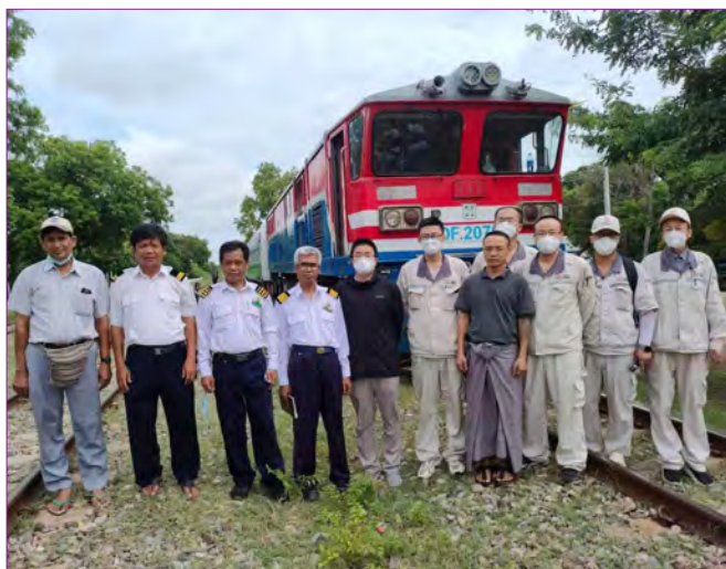
Chinese technical experts and officials from Myanmar Railways are pictured together in Mandalay.

THE test run of a total of 28 train coaches, which were purchased with an interest-free loan from China, was carried out in Mandalay and it was successful, stated the Chinese Embassy.