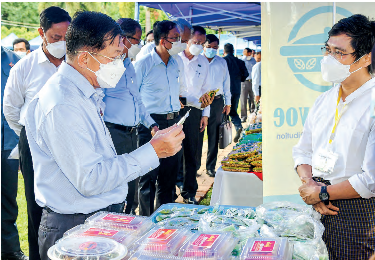
State Administration Council Chairman Prime Minister Senior General Min Aung Hlaing observes the products exhibited at the meeting hall in Pyay on 4 October 2022.

T HE tourism industry should be encouraged in the cultural heritage centres, railways are being upgraded to make journeys by train comfortable, the government aims to use electric trains to contribute to the development of the tourism industry, it is necessary to make the region and the cities clean and pleasant, and it is also necessary for the residents to work together to attract foreign tourists, said Chairman of the State Administration Council Prime Minister Senior General Min Aung Hlaing in his meeting with proprietors of micro, small and medium enterprises (MSME) in Pyay District yesterday morning.