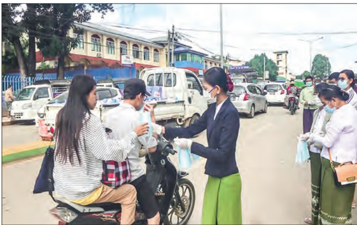
Governmental staff contribute masks to the public in Lashio Township in Shan State (North).

VACCINATION is being carried out in full swing in various regions and states as the vaccination programmes are one of the most important activities in the prevention, control and treatment of COVID-19 disease.