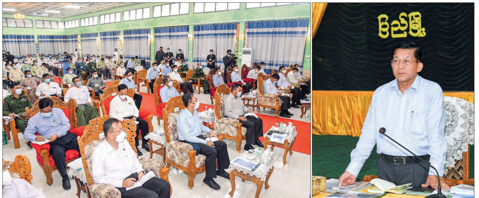
The Senior General meets the business people of micro, small and medium enterprises-MSMEs in Pyay District on 4 October 2022.

Regarding the cultivation and production of crops, the Prime Minister said that, as the government is practising market economy, he encouraged private economy, that, as the government is providing all the necessary assistance, the farmers on their part need to