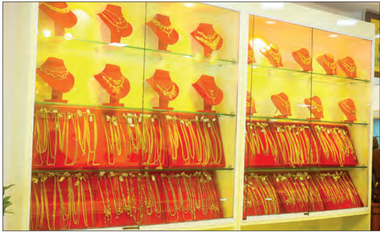
Jewellery is pictured at one gold outlet in Yangon.

THE price of pure gold rebounded to K2.6 million per tical (0.578 ounce or 0.016 kilogramme) in domestic markets.