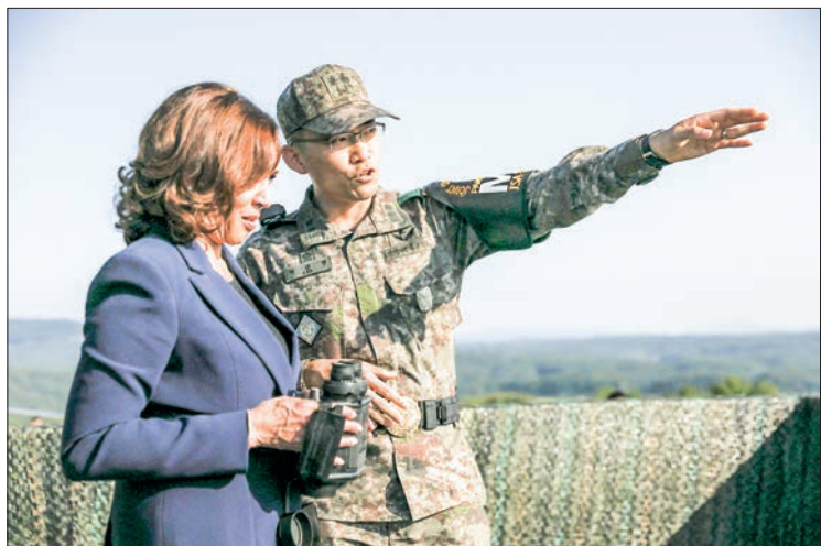
US Vice-President Kamala Harris stands at a military observation post as she visits the demilitarized zone separating North and South Korea, in Panmunjom, on 29 Sept.

NORTH Korea fired two ballistic missiles into the Sea of Japan on Saturday, Japanese and South Korean authorities said, in the fourth such provocation by Pyongyang in less than a week.