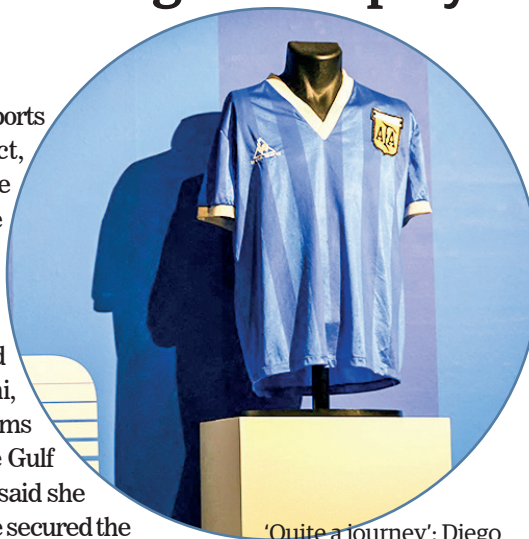
'Quite a journey': Diego Maradona's 'Hand of God' shirt.

record price for any sports memorabilia object, but negotiations are understood to have started just weeks after the 4 May auction. Sheikha Al Mayassa bint Hamad bin Khalifa Al Thani, head of Qatar Museums and a member of the Gulf state's ruling family, said she was "excited" to have secured the shirt for a special World Cup exhibition.—AFP