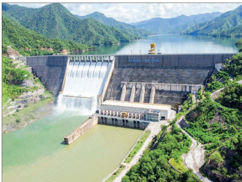
Union Information Minister U Maung Maung Ohn, Union Electric Power Minister U Thaung Han and party view the Yeywa Hydropower Plant in Myittha Township of Mandalay Region yesterday.