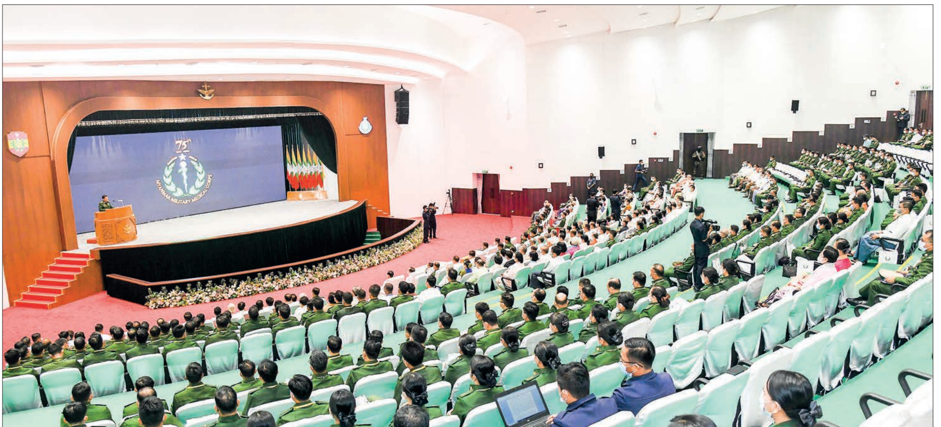
State Administration Council Chairman Commander-in-Chief of Defence Services Senior General Min Aung Hlaing speaks on the occasion of the Diamond Jubilee Medical Corps Day in Yangon on 1 October 2022.

THE Diamond Jubilee Medical Corps Day was held yesterday morning in the convocation hall of the Defence Services Institute of Nursing and Paramedical Sciences in Yangon, and State Administration Council Chairman Prime Minister Senior General Min Aung Hlaing attended Diamond Jubilee Medical Corps Day. Also