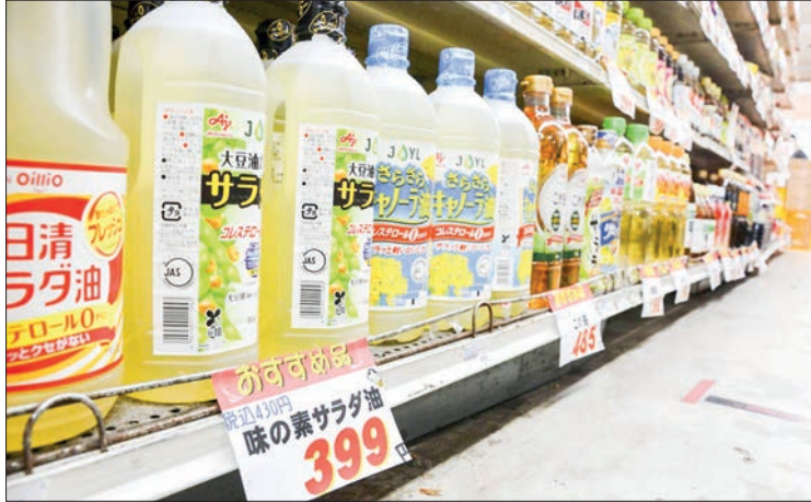
Price hikes have spread from food to energy prices and smartphones, adding more burdens on consumers.

JAPAN is preparing another round of economic stimulus measures, the government said Friday, as rising prices and the plummeting yen squeeze the world's third-largest economy.