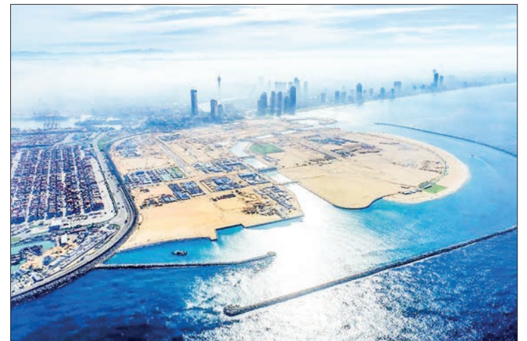
Aerial photo taken on 26 Nov 2021 shows a panoramic view of the Colombo's Port City in Sri Lanka.

The CPCEC after evaluating the application and supporting documents will issue a letter of approval in principle. If the commission is satisfied that an applicant has fulfilled all legal and regulatory requirements and has complied with all the conditions set out in the letter of approval,