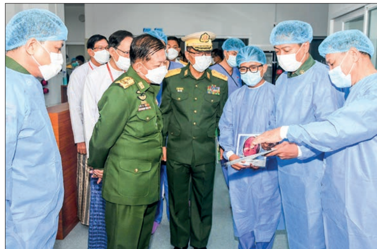
The Senior General observes the explanation about the first-ever successful liver implant.

Tatmadaw hospitals. Afterwards, the Senior General explained the upgrading of the military hospitals in which advanced surgical operations were being provided, keeping abreast of the world's hospitals. He said that it is heartening to learn that organ transplants can now be done, that the first historic liver transplant had been performed successfully, that people from all regions can now have access to quality medical care and that there is no medical treatment that the physicians and surgeons from the military medical corps cannot conduct. Next, the Senior General said that the Nurses Training Wing was first founded in 1959 to produce the trained nurses and now altogether 16 batches had been opened, that similarly, the National Service (Medical Officer) training courses