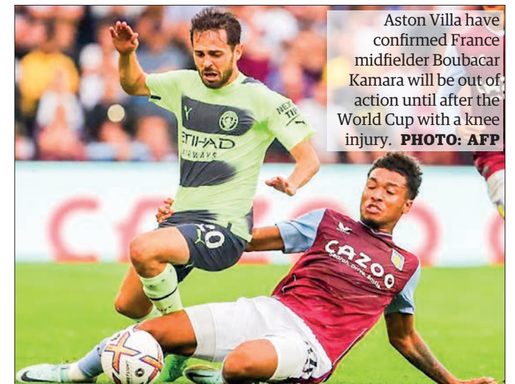
Aston Villa have confirmed France midfielder Boubacar Kamara will be out of action until after the World Cup with a knee injury.

Kamara, who has won three caps for France, had been called up for the latest round of Nations League matches before his injury.—AFP