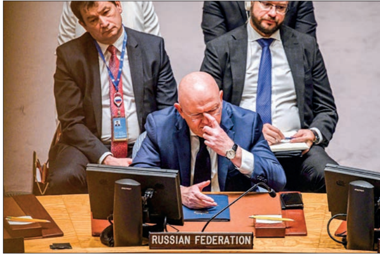
Russian ambassador to the UN Vassily Nebenzia attends a Security Council meeting to discuss the Nord Stream pipeline leaks on 30 September.

The United States pushed through the draft Security Council resolution hours after Russian President Vladimir Putin announced that Moscow had taken over four areas of Ukraine which held Kremlin-organized referendums on land seized by