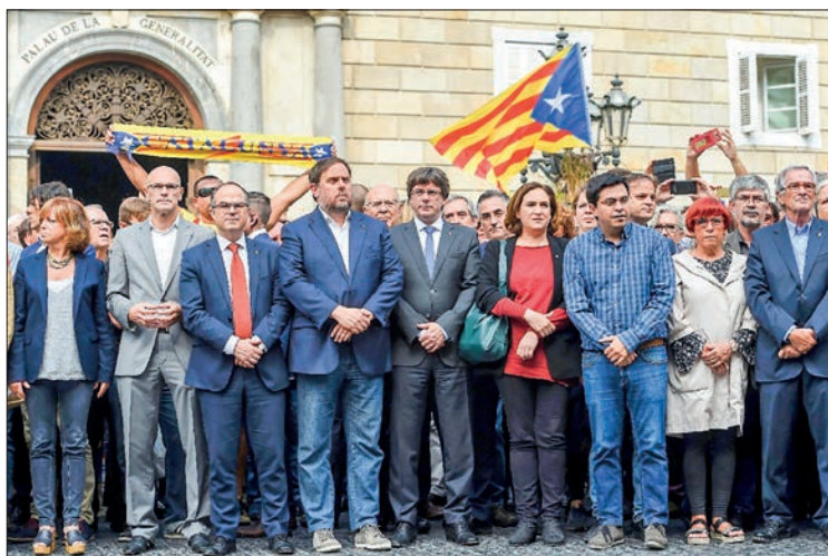
Oriol Junqueras (4L), part of a failed secession push in Spain's Catalonia, has no regrets.

FIVE years after the failed secession push in Catalonia which