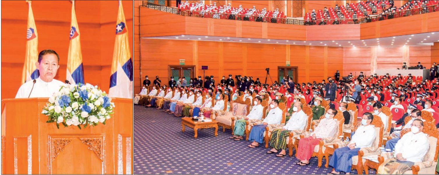
State Administration Council Vice-Chairman Deputy Prime Minister Vice-Senior General Soe Win addresses the 58 th Anniversary of the Myanmar Police Force in Nay Pyi Taw on 1 October 2022.

ALL retired police must be organized as a force of the State, said Vice-Chairman of the State Administration Council Deputy Prime Minister Vice-Senior General Soe Win at the ceremony to mark the 58 th Anniversary of the Myanmar Police Force at the Myanmar International Convention Centre-II in Nay Pyi Taw yesterday morning.