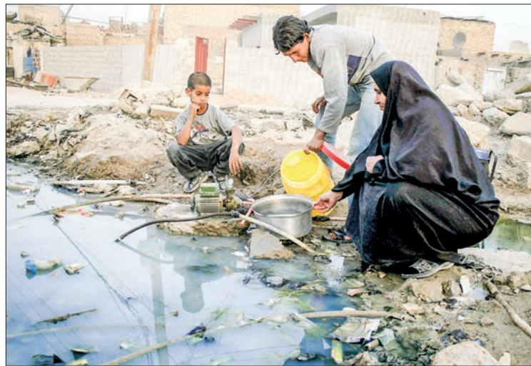
An Iraqi youth fills a pan with drinking water that he got from a burst water pipe on the outskirts of the impoverished Baghdad district of Sadr City.

He said the average case fatality rate reported in 2021 had almost tripled when compared to the five previous years. Bar-