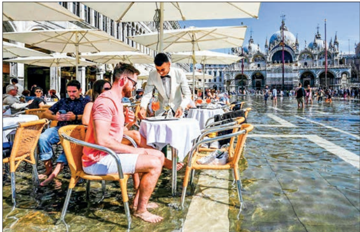
Tourists get their drinks served at a cafe's terrace on a flooded St. Mark's square in Venice on 27 September 2022, following an "Alta Acqua" high tide event, too low to operate the MOSE Experimental Electromechanical Module that protects the city of Venice from floods, but high enough to potentially threaten St. Mark's Basilica.

Last winter, it required certain categories of workers to be vaccinated and demanded proof of a negative test, recent recovery from the virus or vaccination — the so-called Green pass — to enter public places.—AFP