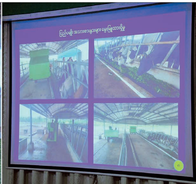
State Administration Council Chairman Prime Minister Senior General Min Aung Hlaing hears the report on the 26 th -mile multiple agriculture and livestock zone yesterday.

LIVESTOCK zones must be extended in the townships outside the municipal area of Yangon City, said Chairman of the State Administration Council Prime Minister Senior General Min Aung Hlaing on his inspection tour of the 26 th -mile multiple agriculture and livestock zone of Myanmar Economic Corporation near the Yangon-Mandalay Expressway yesterday.