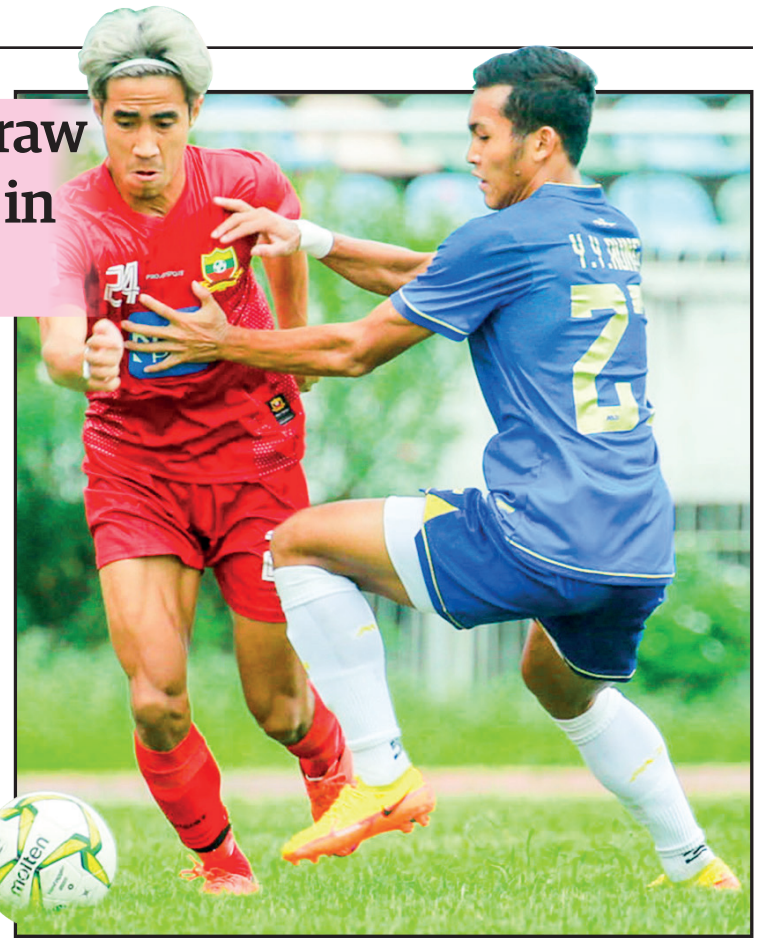
A Shan United player (red) attempts to pass his opponent during the previous Myanmar National League match.