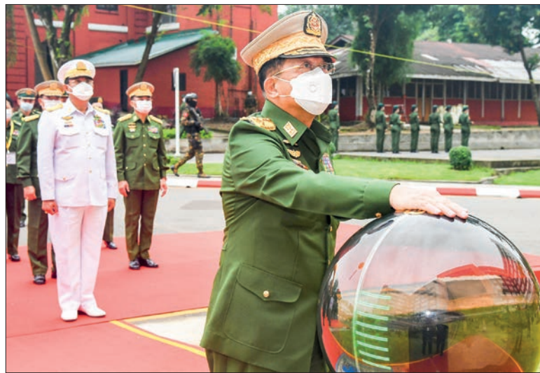
The Senior General presses the button to inaugurate the Special Care Centre.