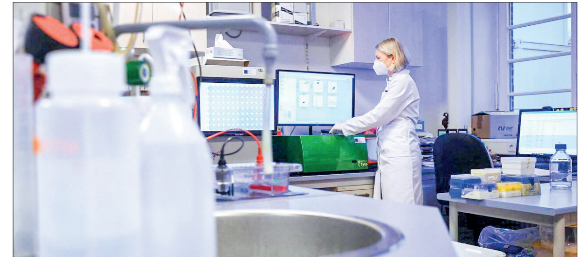
In Europe, 17 million people had a long Covid symptom for at least three months in 2020-2021.