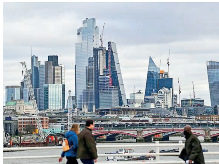
Less than four weeks into the top job, and a week after the disastrous unveiling of a mini-budget that cut taxes for the wealthiest amid a cost-of-living crisis, 51 per cent of people polled by YouGov said she should quit.

Truss beat former finance minister Rishi Sunak in a summer-long leadership contest, promising immediate tax cuts and a focus on driving econom-