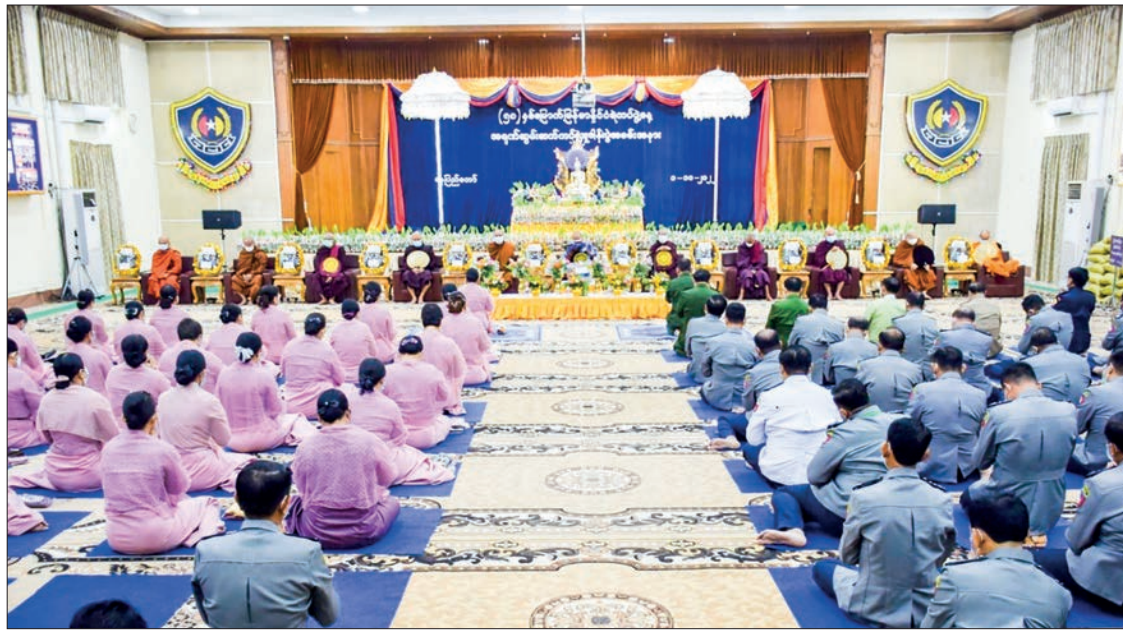
Union Minister Lt-Gen Soe Htut and congregation take the Five Precepts at the ceremony yesterday.