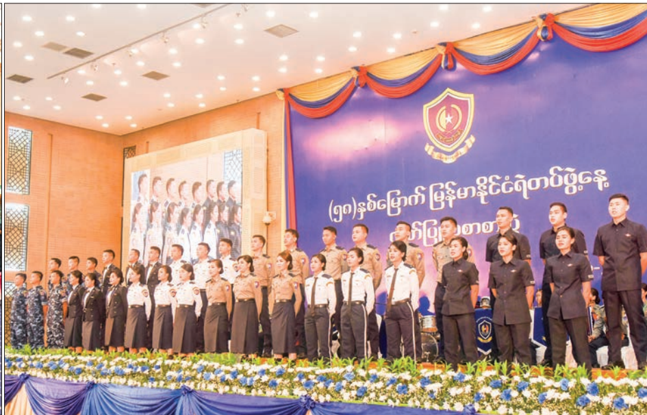
SAC Vice-Chair Deputy Prime Minister Vice-Senior General Soe Win is present at the dinner to honour the 58 th Anniversary of the Myanmar Police Force.

A dinner in honour of the 58 th Anniversary of Myanmar Police Force day took place at the Myanmar International Conven-