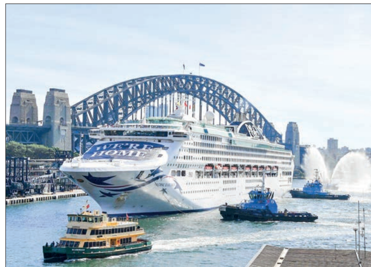
The Pacific Explorer makes its way to dock at the overseas passenger terminal on Sydney Harbour on 18 April 2022, as Australian authorities lifted a ban on cruise ships after relaxation in Covid 19 restrictions.

AUSTRALIA will end mandatory five-day home isolation for people infected with COVID-19 in mid-October, the government said Friday, removing one of the last remaining virus restrictions as the country moves out of the "emergency response"