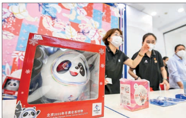
A stuffed toy of popular panda mascot "Bing Dwen Dwen" and other licensed Olympic products are displayed at an official shop on the last day of operation on 30 Sept 2022, in Beijing.

The Olympic panda mascot Bing Dwen Dwen maintained popularity even after the games and the total sales volume of its toys alone has exceeded 5.5 million units, the offi-