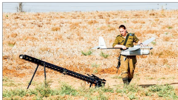
Each month, Israel uses drones above Gaza for 4,000 flying hours — the equivalent of five of the unmanned aircraft permanently in the sky.

gral part of Israel's 15-year-old blockade of the impoverished enclave, and 2.3 million Palestinians endure their incessant hum. Bissam, whose family requested their surname be withheld for security reasons, said that together with the street noise, the drones create an unbearable cacophony.—AFP