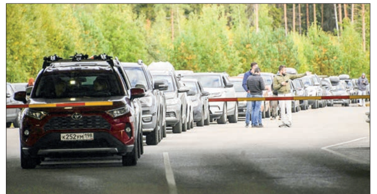
The EU encouraged member states to tighten security checks for Russians fleeing the draft for the war in Ukraine.

She said the member states should not accept Schengen visa applications from citizens of the Russian Federation who are present in a third country for short stays or for purposes of transit. —Xinhua