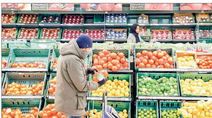
A customer shops for food items inside a Tesco supermarket store in east London on 10 January 2022.

FRANCE'S economy minister said Friday that he was worried by the financial turbulence in Britain, criticizing Prime Minister Liz Truss's economic policies for causing a "disaster" of high borrowing rates for her country.