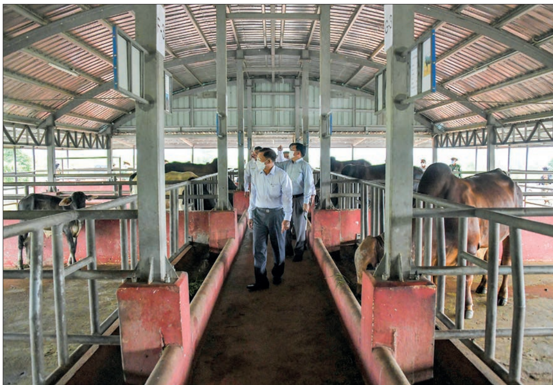
The Senior General looks around the dairy cows and beef cattle farm.

In his response to the reports, the Senior General