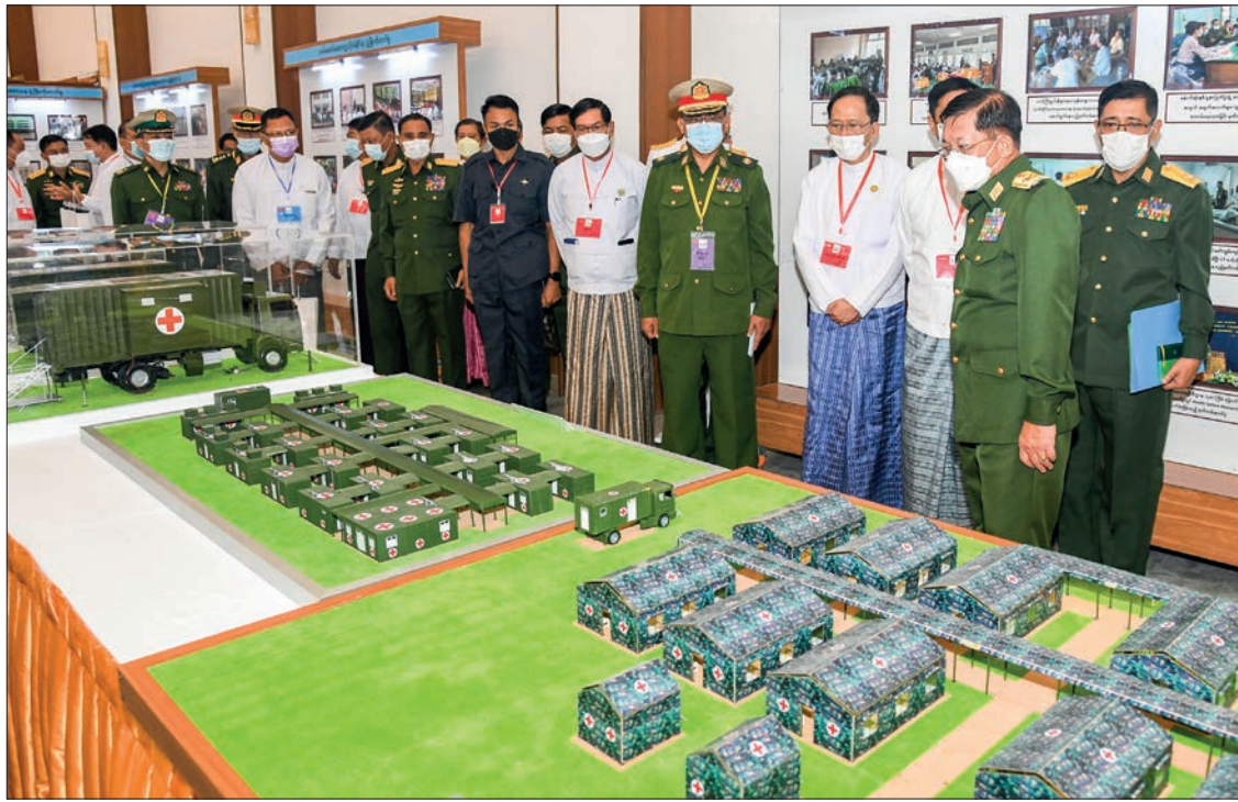
The Senior General views the display at the event.