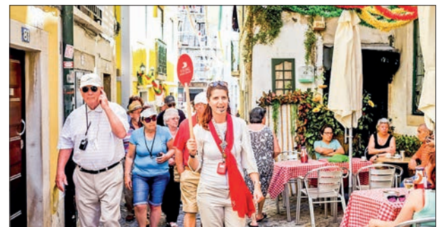
A tour guide leads a group of tourists through the streets of Alfama neighbourhood as locals sit at a terrace in Lisbon.

According to the government, the aim is to establish "procedures that allow attracting regulated and integrated immigration for the development of the country, changing how the public administra-