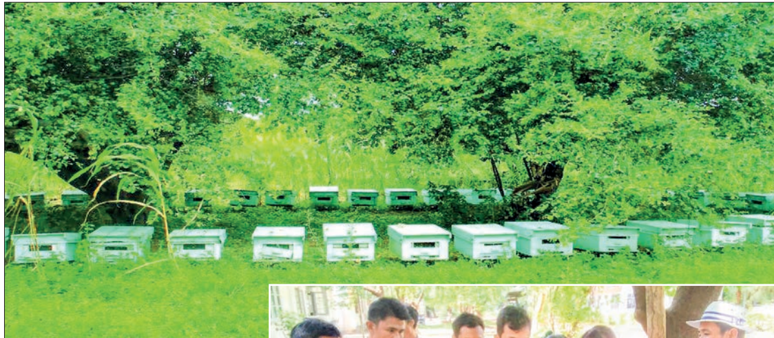
Beehives are seen in a row under plum plants.

Myanmar's honey is being shipped to the US, Japan, China, the Republic of Korea, Singapore and Thailand. Myanmar's beekeeping business began in 1979 and honey export started in 1985. China is the most honey producing country in the world and Myanmar, Vietnam and Thailand are the leading producing countries among ASEAN. Myanmar's Niger honey, sunflower honey and jujube honey have earned a good reputation in the international markets. Out of them, Myanmar's sunflower honey is highly demanded. As agriculture and livestock farms are the backbone of the country's economy, Myanmar is trying to meet the