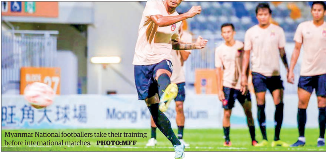
Myanmar National footballers take their training before international matches.