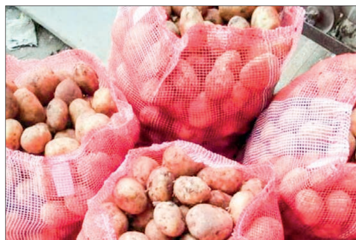
Picture shows Chinese potatoes found in the domestic wholesale market.

THE prices of onion and Chinese potato have declined from the last week of September 2022. Bayintnaung Wholesale Market saw an extended drop of Chinese potatoes, Ko Myint Thu, a seller told the Global New Light of Myanmar (GNLM).