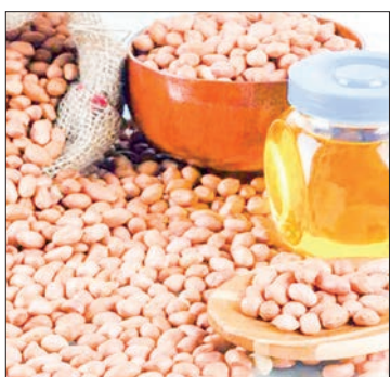
A picture shows peanut and oil made of peanut.

The peanut oil prices declined from K13,500-K14,500 per viss on 12 September to K11,000-K12,000 per viss on 25 September. The sesame oil consumption is low in the market so the price remains unchanged at K10,000-K11,000 per viss in the wholesale market.—TWA/GNLM