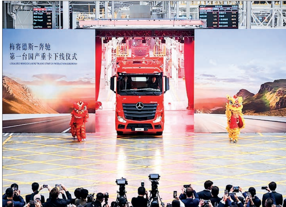
Daimler Truck reaches major milestone in China by starting local production of Mercedes-Benz trucks for Chinese market.

The company has teamed up with 150 Chinese suppliers to provide over 1,500 components for the trucks. The automobile plant is capable of producing 60,000 trucks each year. It is the right time to go to market as China's logistics and transporta-