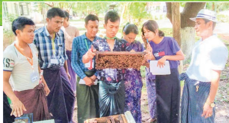
Trainees observe nature of beehives.

"Advanced beekeeping courses aim to enhance rural economic development of the beekeepers. The Apiculture Division is providing courses on basic training, bee pest and disease management, queen bee raising and Good Apiculture Practices for the beekeepers. As the business is lucrative for those involved in mixed