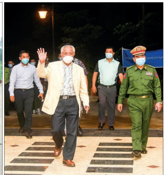
Leaders and parties of Ethnic Armed Organizations arrive in Nay Pyi Taw on 25 September to attend peace talks.

AS State Administration Council Chairman Prime Minister Commander-in-Chief of Defence Services Senior General Min Aung Hlaing called for peace talks with ethnic armed organizations-EAOs, peace delegations led by Vice-Chairman U San Pae of the Nation-