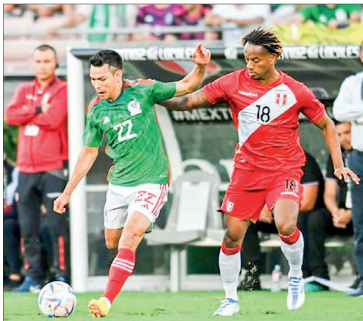
Mexico forward Hirving Lozano vies for the ball with Peru midfielder André Carrillo in Mexico's 1-0 victory in a friendly international football match at the Rose Bowl.

HIRVING Lozano's late strike lifted Mexico to a 1-0 victory over Peru at California's Rose Bowl on Saturday in a friendly international football match that is part of Mexico's World Cup build-up.