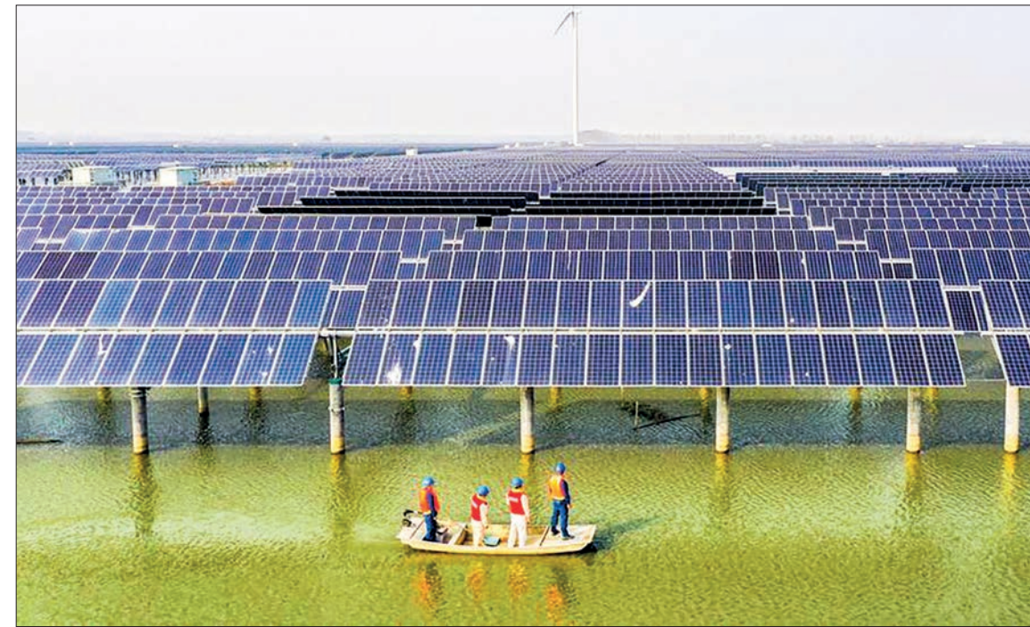
The secretary-general urged developed countries to deliver on their promises and support developing countries "as they adapt to worsening climate impacts." Engineers check facilities at Sheyang lake, Baoying county of Jiangsu province, on 3 November. Solar and wind power generation takes up 84 per cent of the East China county's electricity consumption.

Group of 77 and China at the United Nations is a coalition of 134 developing countries, designed to promote its members' collective economic interests and create an