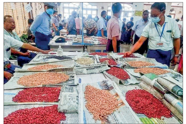
Merchants check quality of chickpeas and other pulses and beans in Mandalay market.

DUE to domestic and international demand, Myanmar chickpeas are fetching good prices in the Mandalay market.