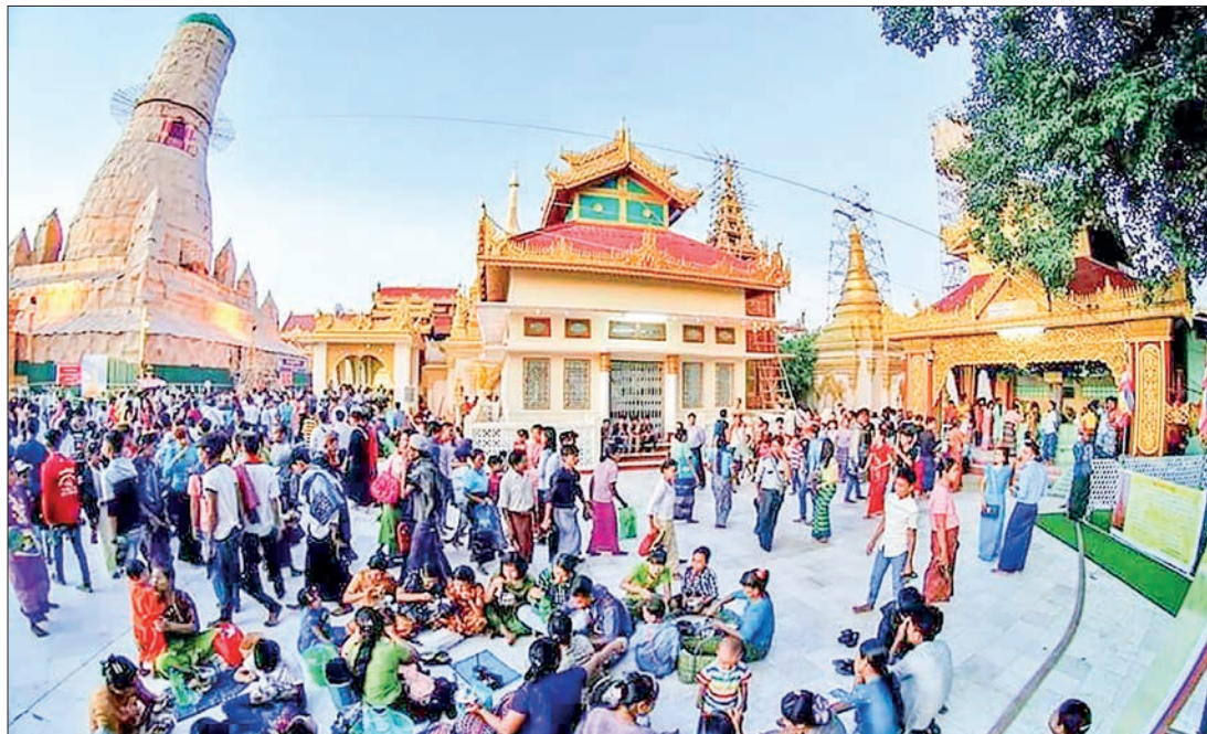
Visitors throng Magway City's landmark named Myathalun Pagoda during the pagoda festival.

ACCORDING to the Magway Region's Tourism Committee, about K656 million was earned from the arrivals of domestic and foreign visitors to Magway Region from January to August.