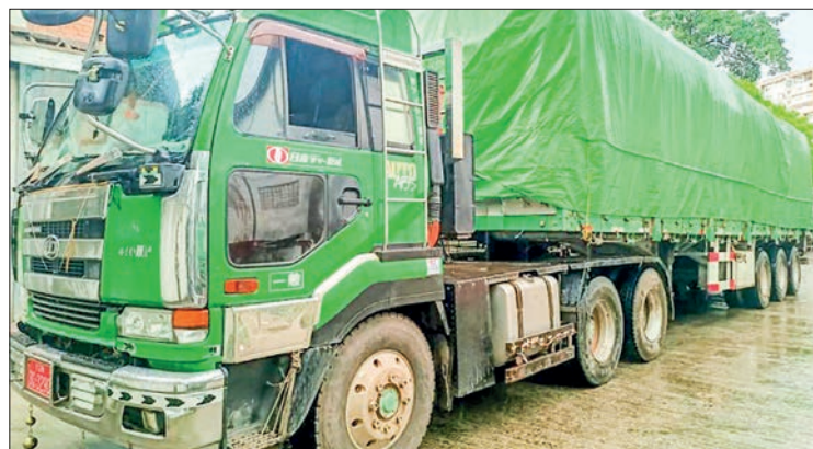
A truckloads of accessories and bed sheets seized near Zayatkwinn Village in Hlegu Township.

Furthermore, an on-duty team under the supervision of