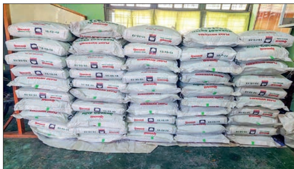
Fertilizer bags seized at Pauktine Bridge checkpoint in Dawei Township on 24 September.