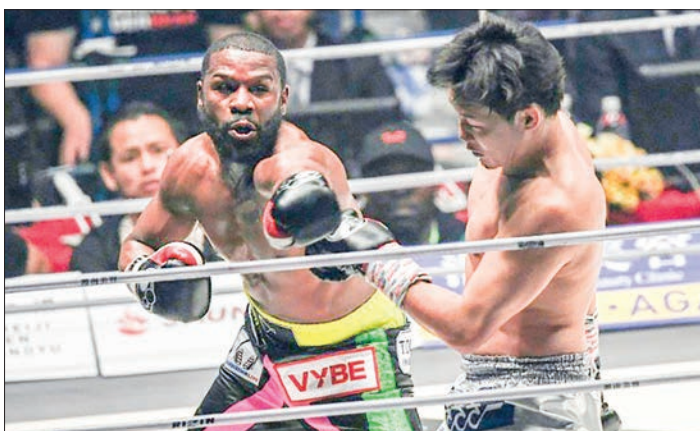
Floyd Mayweather (left) throws a punch at Japan's Mikuru Asakura during their exhibition fight in Saitama, Japan, on Sunday.

Mayweather arrived at Saitama Super Arena, north of Tokyo, just an hour before the fight. He was shown on TV relaxing in a dressing room full of takeaway fast food, prior to making his ringwalk. On another easy payday for the self-styled "Money" Mayweather, the bell to end the second round sounded as Asakura hit the canvas, but it failed to save the Japanese fighter and he was unable to beat the count.—AFP