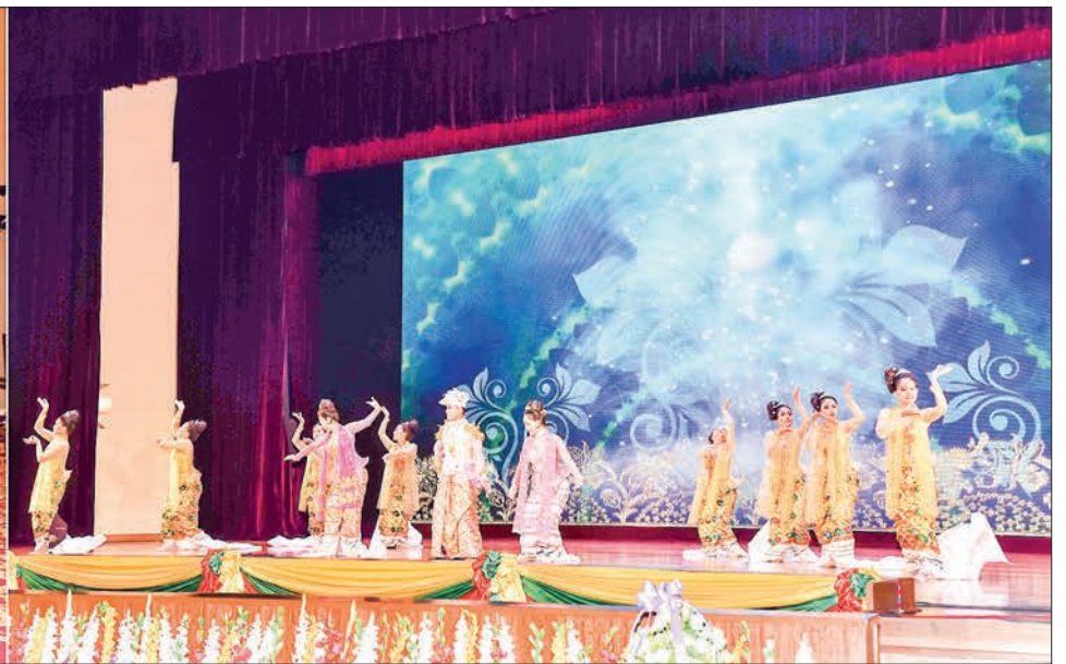
Vice-Chairman of the State Administration Council Deputy Prime Minister Vice-Senior General Soe Win views the play "The Prestige Nobler than the Life" in Nay Pyi Taw on 25 September 2022.

AS part of efforts to preserve Myanmar traditional cultural heritages, service personnel of the Department of Fine Arts under the Ministry of Religious Affairs and Culture together with artistes presented a premiere of the play titled "The Prestige Nobler than the life" in line with the instructions of maestros at the theatre of Zeyathiri Beikman in Nay Pyi Taw yesterday evening for the second day, enjoyed by Vice-Chairman of the State Administration Council Deputy Prime Minister Vice-Senior General Soe Win.