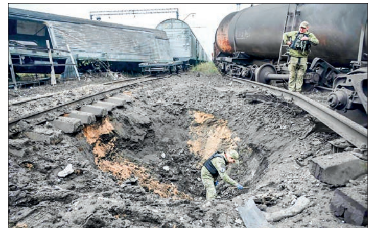
A forensic explosives expert examines a crater from a missile explosion at a freight railway station in Kharkiv on 21 September 2022.

Next year, Ukraine is also willing to launch cooperation with the WB in the energy sector, he added. According to a joint assessment released on 9 September, the government of Ukraine, the European Commission, and the World Bank estimated that Ukraine would need about 350 billion dollars for post-conflict reconstruction. —Xinhua