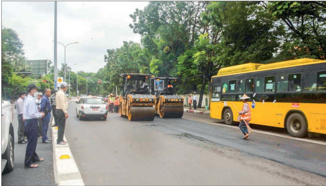
Mayor U Bo Htay and party view paving of asphalt concrete on Pyay Road between Hledan overpass and Parami road in Yangon on 25 September.

YANGON mayor U Bo Htay, in his capacity as chairman of Yangon City Development Committee, inspected the Nyaunghnapin Agriculture and Livestock Special Zone in Hlegu and Hmawby townships yesterday morning.