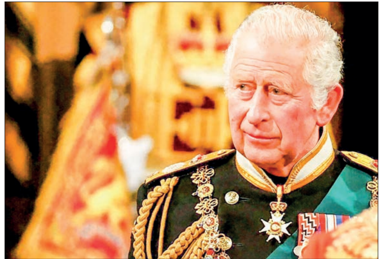
King Charles III will have to confront the legacy of Britain's colonial past.

Many black Britons no longer want to stay silent about