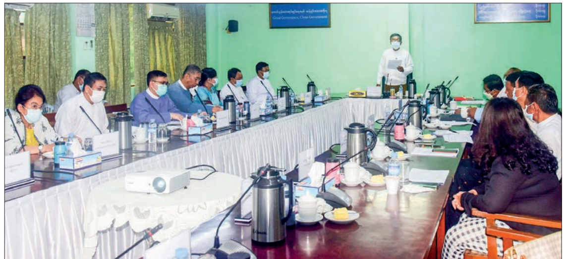
Deputy Minister for Information U Ye Tint, Chairman of Working Committee for Diamond Jubilee Independence Day Variety Show Organizing, speaking at coordination meeting of the Committee in Yangon on 25 September.

Officials and those from relevant associations participated in the discussions to stage the variety show with the coordination of the deputy minister.—MNA