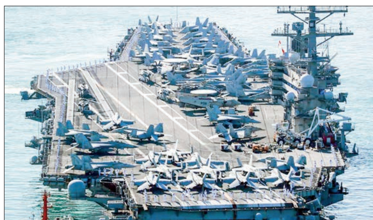
The US Navy's nuclear-powered USS Ronald Reagan (CVN-76) aircraft carrier arrives at ROK Fleet Command in Busan, 390 kilometers south of Seoul, on 23 September 2022.

NORTH Korea fired a ballistic missile Sunday, Seoul's military said, just days after a US aircraft