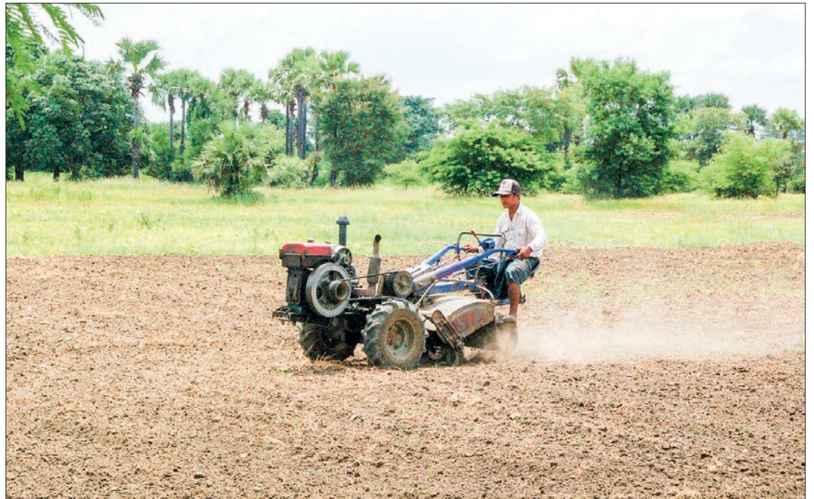
A farmer is using a farming machine in Sagaing Region.

The farmers from Nay Pyi Taw, Yangon and Bago regions and Kachin State received loans. The repayment from the early batch