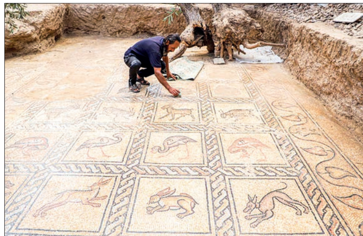
A man cleans parts of a Byzantine-era mosaic at Bureij refugee camp in the middle of the Gaza Strip, 21 September 2022. A Gaza-based excavation team continues its search in the archaeological site located in the Bureij refugee camp in the middle of the Gaza Strip, where rare Byzantine-era mosaic floors were freshly discovered.

"The mosaic panels are painted in several colors, includ-