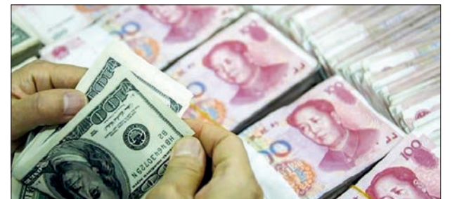
This picture shows US dollar notes being counted next to stacks of 100 yuan (RMB) bank notes at a bank in Huaibei, in eastern China's Anhui province.

Over 80 overseas central banks or currency authorities had the yuan in their forex reserves, said the report. —Xinhua