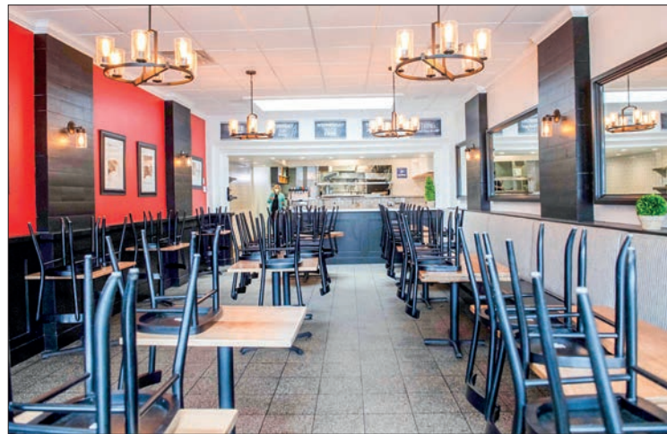
Chairs are stacked on tables in the empty dining room of Maria's Italian Kitchen now closed due to the COVID-19 pandemic in Santa Monica, California on 28 July 2020.

A US government watchdog said fraudulent jobless benefits paid out during the pandemic could amount to as much as $45.6 bil-