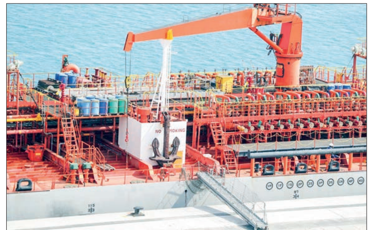
Exports In 2020, Qatar exported $18.2B in Natural gas, liquefied, making it the 2 nd largest exporter of Natural gas, liquefied in the world. At the same year, Natural gas, liquefied was the 1 st most exported product in Qatar.

"Qatar Energy announces the selection of TotalEnergies as a partner for the development of the North Field South," Qatar's official news agency