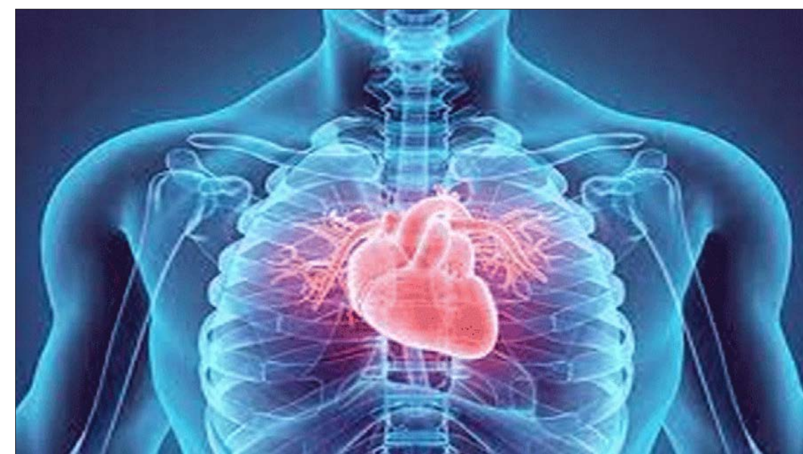
World Heart Day, which falls on 29 September, is celebrated annually to spread awareness about the importance of keeping the heart fit as it's one of the most important organs that deliver oxygen and nutrients to cells and also removes waste products. PHOTO: REPRESENTATIVE IMAGE / AFP

There is multiple misinformation surfacing around social media that people have been reporting cases of heart inflammation or heart attack after the COVID-booster shots. On the other hand, it is of utmost importance that we take booster shots to prevent ourselves from re-infection with COVID