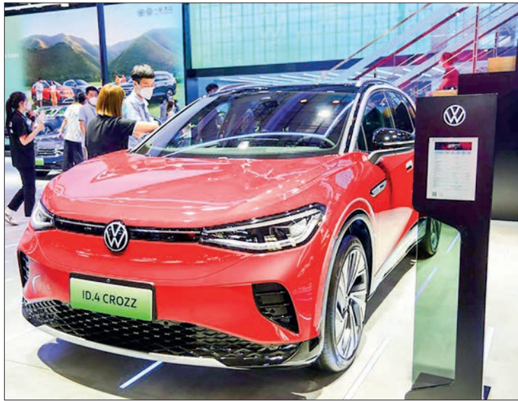
Visitors walk by a FAW-Volkswagen new energy vehicle during the 19 th China (Changchun) International Automobile Expo in Changchun, capital of northeast China's Jilin Province, 18 July 2022.

"Both China and Germany are leading car-producing countries and have developed complementary advantages in