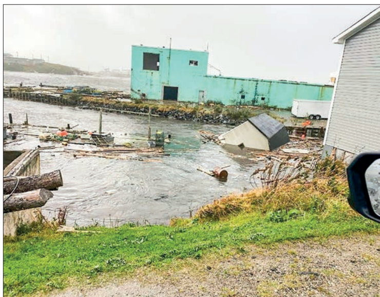
Damage caused by Fiona on the Burnt Islands in the Newfoundland and Labrador Province of Canada.

Mayor Brian Button of Channel-Port aux Basques, on the southwestern tip of Newfoundland, said in a Facebook video Saturday night that at least 20 homes had been destroyed