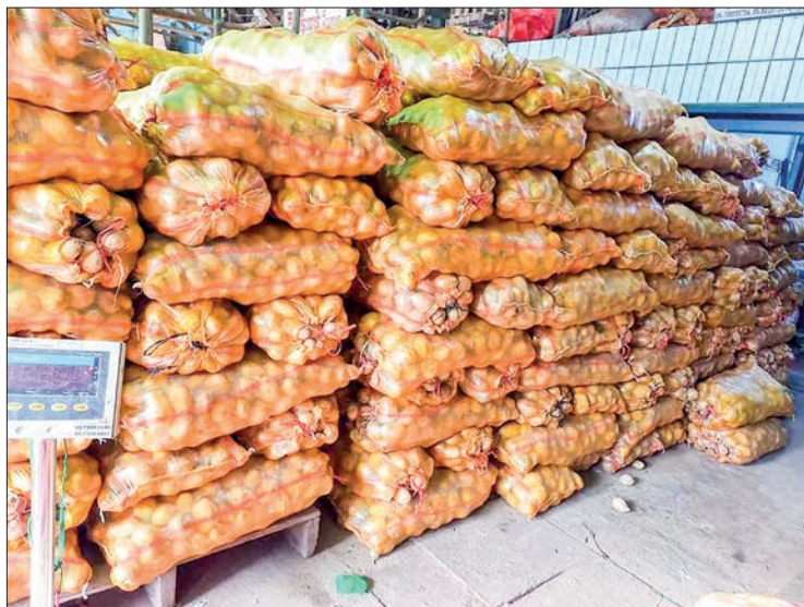
Bags of onions and potatoes were pictured being piled up at warehouses in the Bayintnaung Wholesale Market.

The prices of local onions from the Seikphyu area were K2,800-3,200 in recent days. — TWA/GNLM