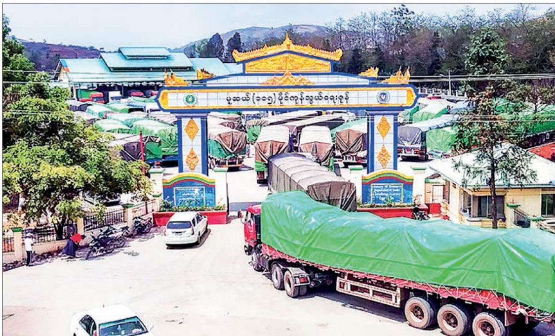
Freight lorries are pictured piling up at the Muse 105 th -mile trade zone.

MYANMAR'S 105 th -mile Muse trade zone for cross-border trade with China accumulated US$60.178 million in August.