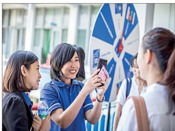
The undated photo shows a KBZ Bank staff helping a customer to open a KPay account.

THE customers of KPay, a mobile wallet powered by the KBZ Bank, can directly submit their complaints to the Central Bank of Myanmar (CBM) if their accounts are temporarily restricted for no apparent reason, according to KPay's statement.