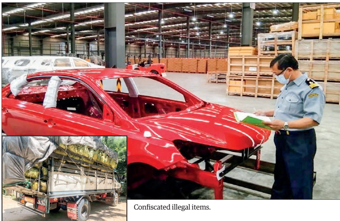
Confiscated illegal items.

Afterwards, the combined inspection teams led by Bago Region Forest Department captured a total of 98.0168 tonnes of illegal timber worth