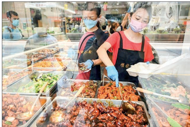
Small shops selling inexpensive two-dish mealboxes have mushroomed across Hong Kong.

"The Covid restrictions were a catalyst," she told AFP at her res-