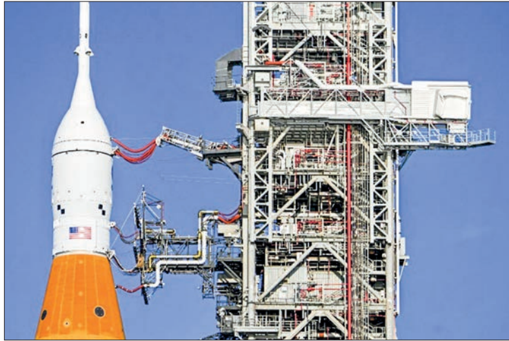
The unmanned mission hopes to test the new 30-storey SLS rocket as well as the unmanned Orion capsule that sits atop it, in preparation for future Moon-bound journeys with humans aboard.

The last attempt in early September to launch NASA’s most powerful rocket yet had to be aborted because of a leak while its cryogenic fuels – liquid