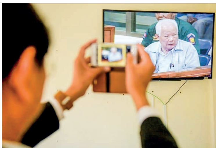
Khieu Samphan, pictured in 23 June 2017, was given a life sentence in 2018 for genocide against ethnic-minority Vietnamese by the Extraordinary Chambers in the Courts of Cambodia (ECCC).

A UN-backed tribunal in Cambodia trying former Khmer Rouge leaders over the 1970s genocide in the country upheld on Thursday a lower-court sentence of life imprisonment against Khieu Samphan, the radical communist regime's former head of state.