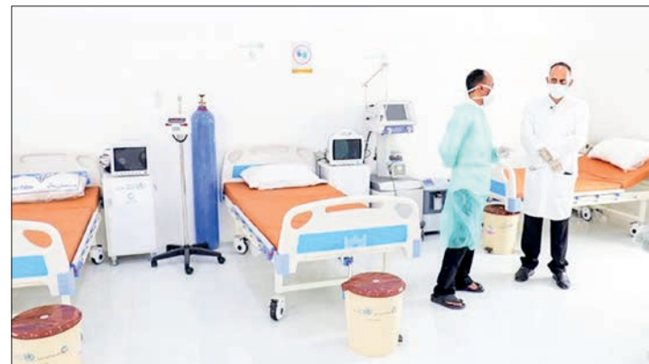
Hospitals and medical centres in parts of Yemen are on the brink of closure due to a lack of funding. PHOTO: FOR REPRESENTATIONAL PURPOSE ONLY/ WHO EMRO/FILE