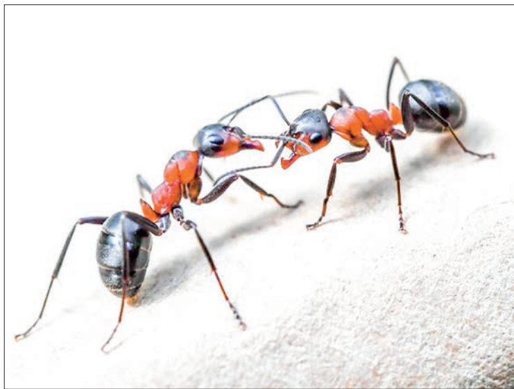
Two European red wood ants ( Formica polyctena ) are pictured in a forest near Birkenwerder, northeastern Germany.

THERE are at least 20 quadrillion ants on Earth, according to a new study that says even that staggering figure likely underestimates the total population of the insects, which are an essential part of ecosystems around the world.