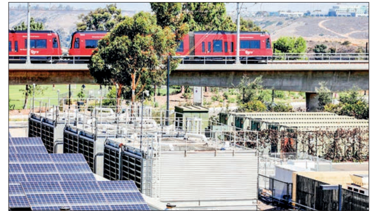
California has abundant solar energy, harnessing a growing amount of the rays that land on its rooftops, but when the sun sets, there can be a shortfall.

Sunny California has abundant solar energy at its disposal, and harnesses a growing amount of the rays that land on its rooftops.—AFP