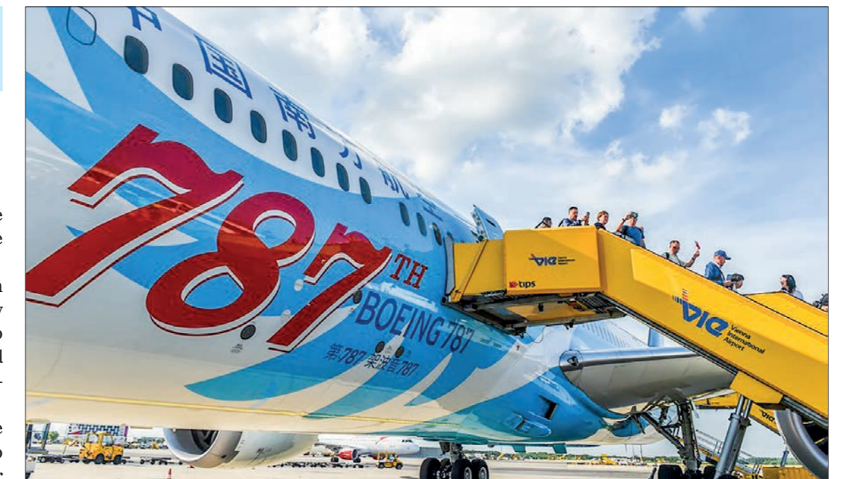
China had a "very important place" in international travel figures. Passengers get off the first flight of China Southern Airlines' Guangzhou-Urumqi-Vienna route at Vienna International Airport, Vienna, Austria, 18 June 2019.