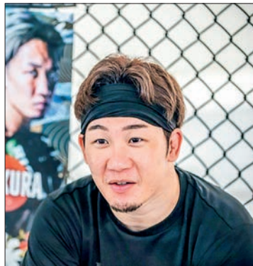
Japan's Mikuru Asakura will meet Floyd Mayweather this weekend.

The fight was widely seen as a farce but the American vowed to give the crowd this weekend at Saitama Super Arena, just north of Tokyo, their money's worth in his latest lucrative post-retirement performance.