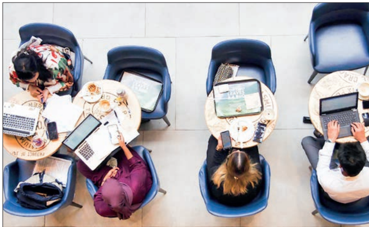
Digitalization offers big growth opportunities for businesses in Asia and the Pacific.

"For this to happen, there needs to be a supportive environment enabled by conducive policies and incentives," he added. —Xinhua