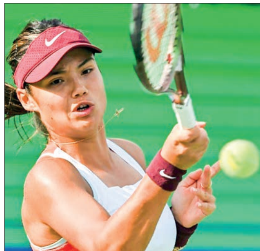
Emma Raducanu returns the ball against Yanina Wickmayer of Belgium.

EMMA Raducanu enjoyed support from the Korea Open crowd on the way to a straight-sets win over 396th-ranked Yanina Wickmayer and a place in the quarter-finals on Thursday.