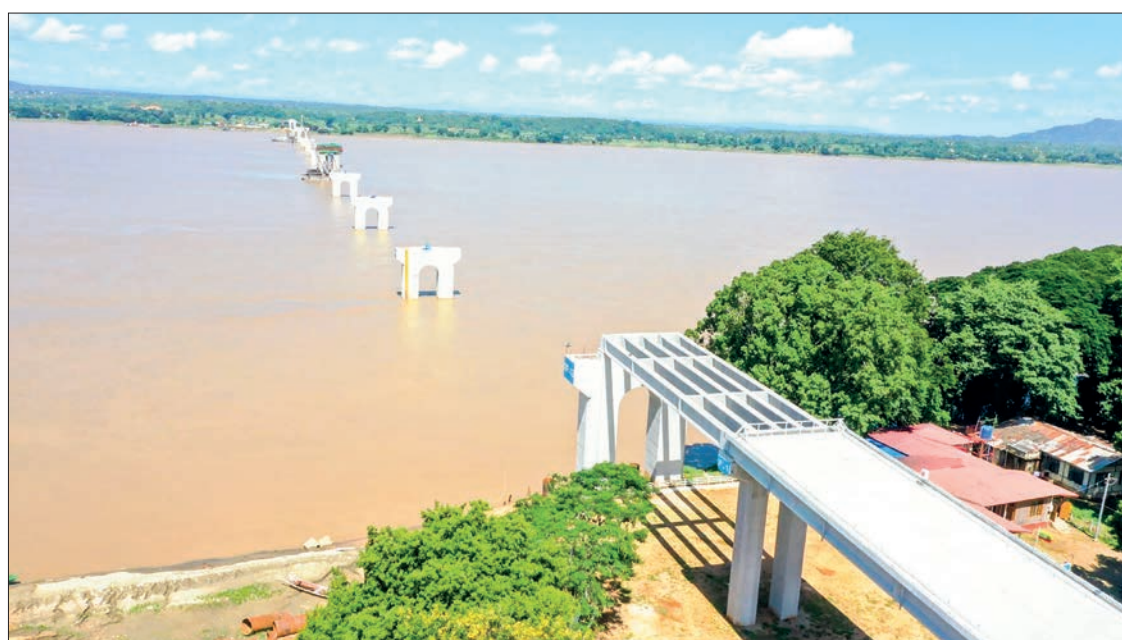
The photo shows a general view of the Ayeyawady Bridge (Thayet-Aunglan) Project.

THE Ayeyawady Bridge (Thayet-Aunglan) project in Magway Region is now 52 per cent complete, according to the Bridge Task Force (3) of the Bridge Department.