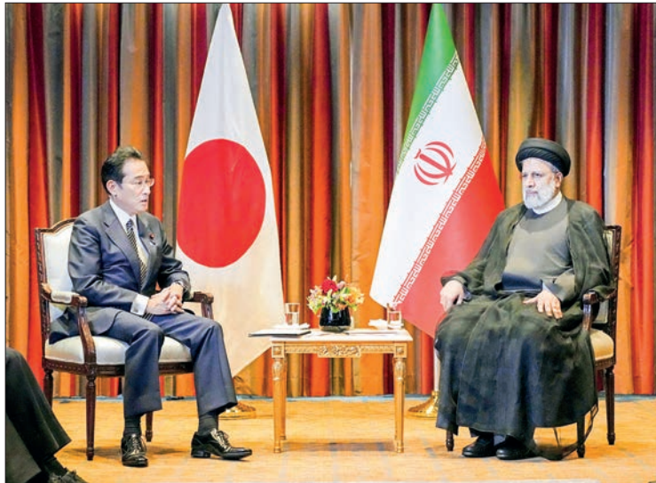
Japanese Prime Minister Fumio Kishida (L) and Iranian President Ebrahim Raisi hold talks on 21 Sept 2022, in New York.

Negotiations on the pact, struck between Iran and Britain, China, France, Germany, Rus-