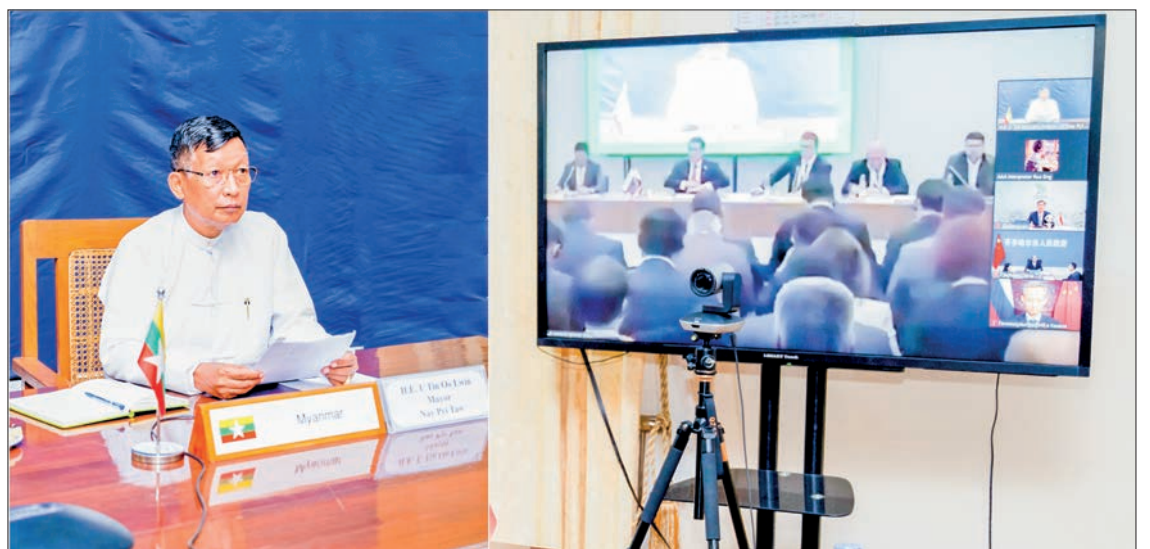
Nay Pyi Taw Mayor U Tin Oo Lwin joins the Mayor's Roundtable of the International Forum Kazan Digital Week-2022 online.

and the Mayor's Roundtable themed: "Digital Transformation of the City Management" was held separately from 21 September. The Nay Pyi Taw Mayor interpreted the current status of the Nay Pyi Taw city administration and management operated by digital technology and the human resources management activities, the measures for anti-corruption using ICT technology by forming the Corruption Prevention Unit (CPU) in collaboration with the Anti-Corruption Commission, the situations of receiving comments from the public through online regarding the public service activities of municipal affairs, the state of being able to pay water bills to the Nay