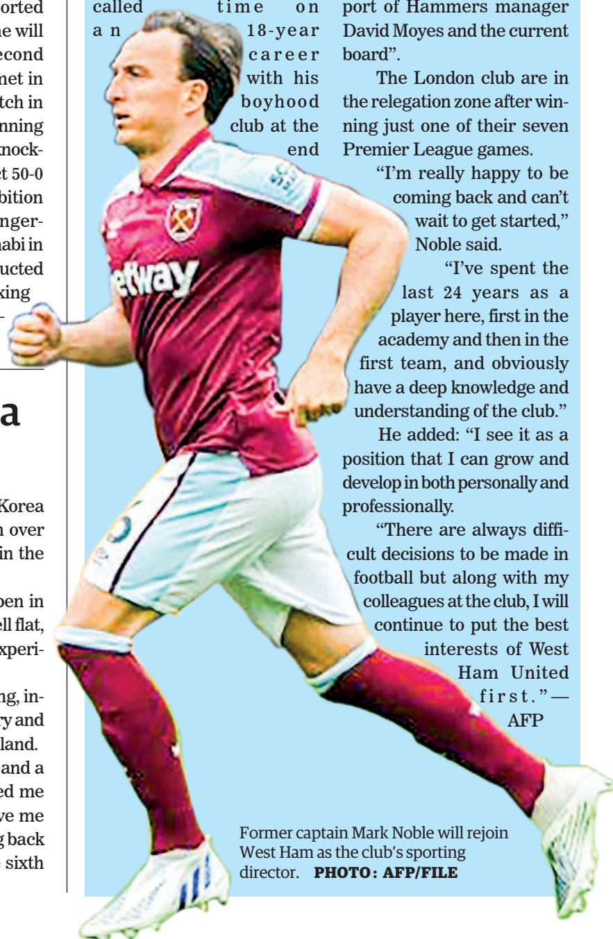
Former captain Mark Noble will rejoin West Ham as the club's sporting director.

"There are always difficult decisions to be made in football but along with my colleagues at the club, I will continue to put the best interests of West Ham United first." — AFP