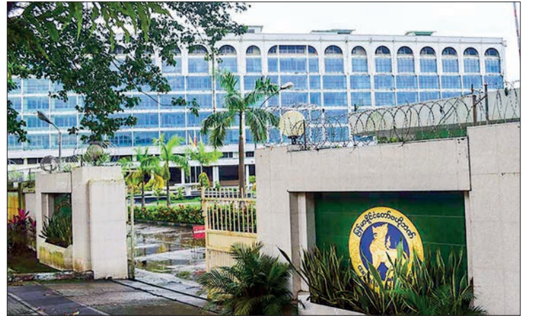
The office of the Central Bank of Myanmar-CBM.

The objectives of the committee are inspecting and prosecuting market manipulation, checking if there is compliance with payment rules in the domestic market, and proceed-