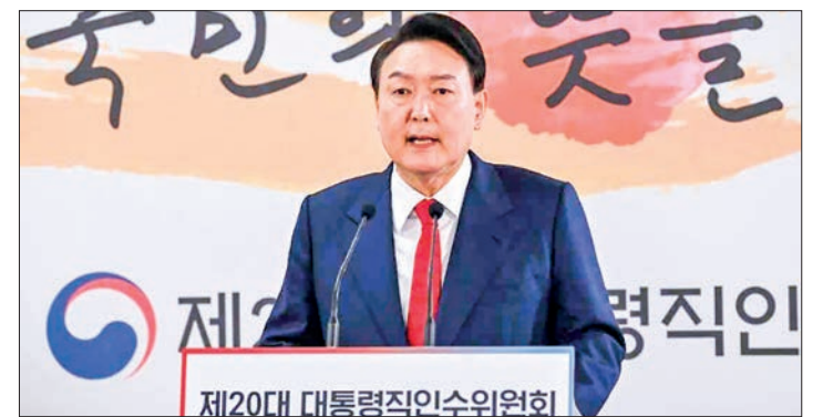
South Korea's President-Elect Yoon Suk-yeol speaks during a news conference at his transition team office in Seoul, South Korea on 20 March 2022.

"The president's words and actions are the national dignity of the country," one YouTube commenter wrote.—AFP