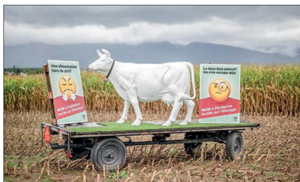
No to the useless livestock initiative, the placards read, ahead of a vote Swiss vote on a proposed ban on factory farming.

"We believe animal agriculture is one of the defining problems of our time," animal welfare group Sentience, which presented the initiative, says on its website. It points to the "immense suffering experienced by animals on factory farms,"