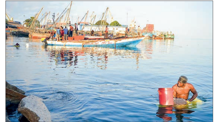
A vendor swims to shore from a fishing boat after purchasing a catch of sardines in Stone Town, Zanzibar, a Tanzanian archipelago off the coast of East Africa.

TANZANIAN Prime Minister Kassim Majaliwa on Tuesday launched a 15-year fisheries master plan aimed at boosting the sector's contribution to the gross domestic product (GDP) from the current 1.8 per cent to 10 per cent by 2037.