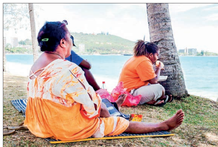
A woman sits on the shore looking out at sea in Noumea, Capital of New Caledonia on 1 December 2014.

RISING levels of obesity are set to cost the world economy 3.3 per cent of GDP by 2060, slowing development in lower-income countries and making it hard for people to lead healthy lives, according to a new study published Wednesday.