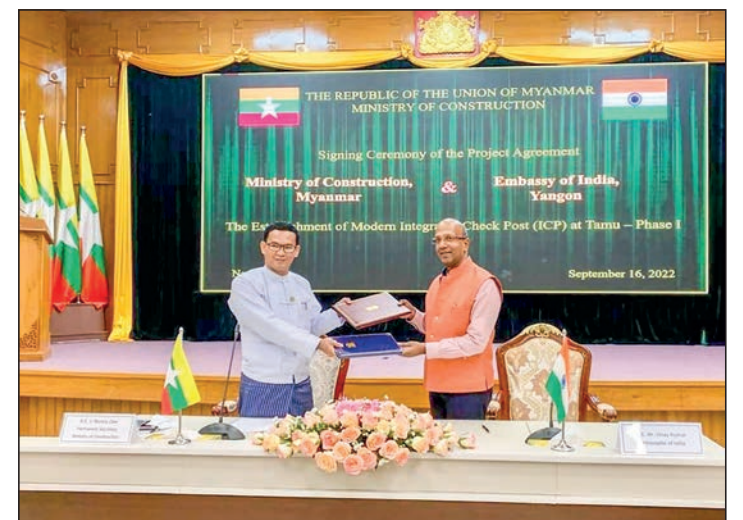
Officials exchange the signed Memorandum of Understanding-MoU on the project agreement on the construction of a multilateral checkpoint in Tamu.

A total of 35 undocumented migrants were also captured in Pandaung and Okshitpin of Pyay district in June and July. —TWA/GNLM