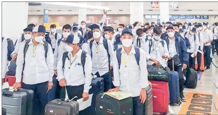
Myanmar workers were seen before leaving for South Korea at Myanmar International Airport in July.

The EPS-TOPIK tests for manufacturing and construction were earlier scheduled between 16 August and 15 October 2022. However, verification of the high number of EPS candidates de-