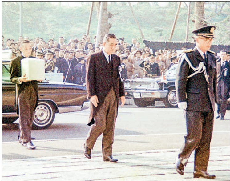
Prime Minister Eisaku Sato (center) during a state funeral for the former Prime Minister Shigeru Yoshida in October 1967 in Tokyo.

JAPAN will ask foreign guests attending the state funeral for former Prime Minister Shinzo Abe next week to wear protective face masks to curb the spread of the novel coronavirus, the top government spokesman said Thursday.