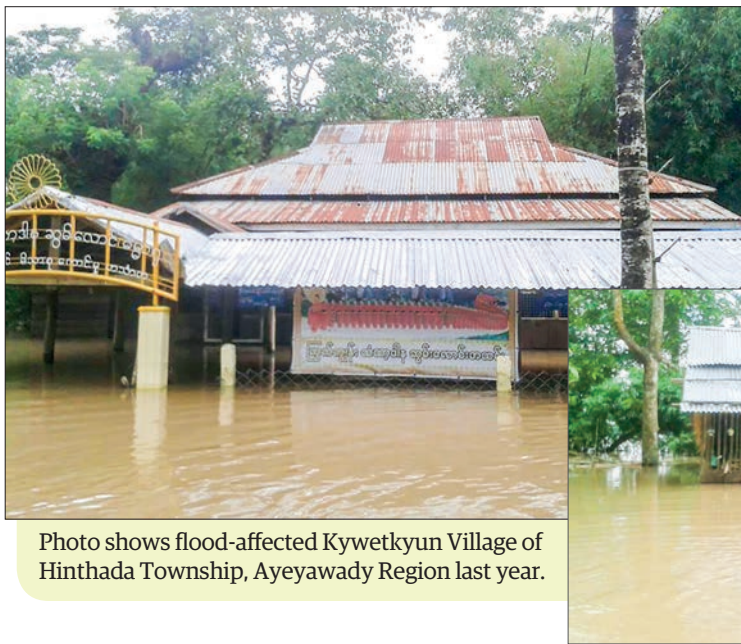
Photo shows flood-affected Kywetkyun Village of Hinthada Township, Ayeyawady Region last year.

level by about 3 feet at Kalay, Dokhtawady River about 1-2 feet at Hsipaw, Shwesayan and Myitnge, Sittoung River about 1-2 feet at Toungoo and Madauk, Shwegyin River about 1.5 feet at Shwegyin, Bago River by about 1-3 feet at Zaungtu and Bago, Thanlwin River about 2-3 feet at Pasawng and Hpan, Thaungyin River about 2 feet at Myawady, Ngawun River about 1-3 feet at Ngathaingyoung, Thabaung and Pathein, Toe River one foot at Maubin, Kaladan River about 0.5-1 foot at Paletwa and Kyauktaw, Laymyo River about 1 foot at MraukU and Bilin River about 1.5 feet at Bilin.— TWA/GNLM