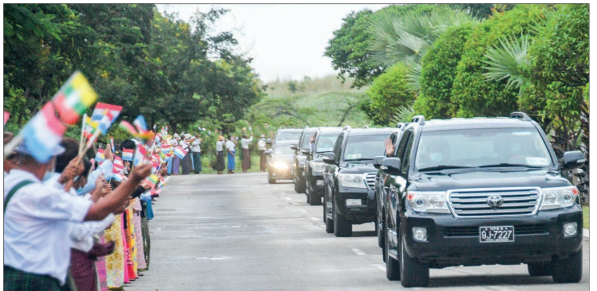
Ethnic people warmly welcome back SAC Chairman Prime Minister Senior General Min Aung Hlaing along the route by waving miniature State flags on 11 September

Those wishing to enter the legal fold can contact respective townships' Red Cross Society, Myanmar Maternal and Child Welfare Association, Myanmar Women's Affairs Federation, Social Welfare Office and social welfare organizations authorized by the Ministry of Social Welfare, Relief and Resettlement in addition to reception centres in border areas, Tatmadaw units and police stations