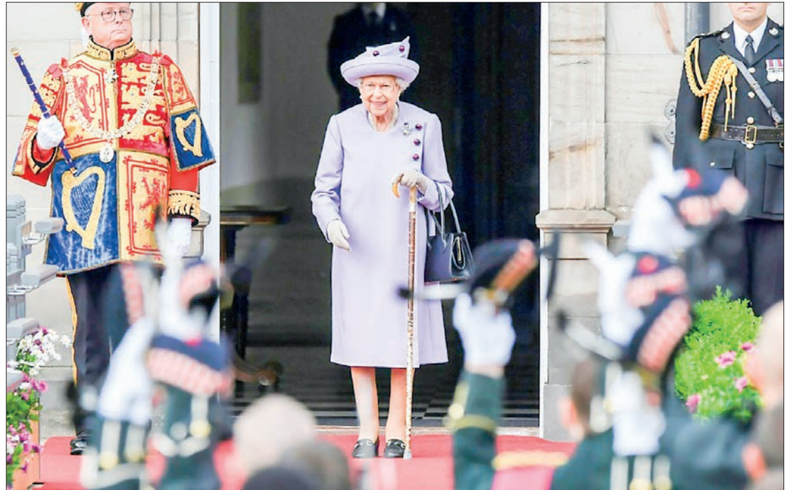
Queen Elizabeth II last stayed at the Palace of Holyroodhouse in Edinburgh in June 2022.

After a brief republic, his son returned as King Charles