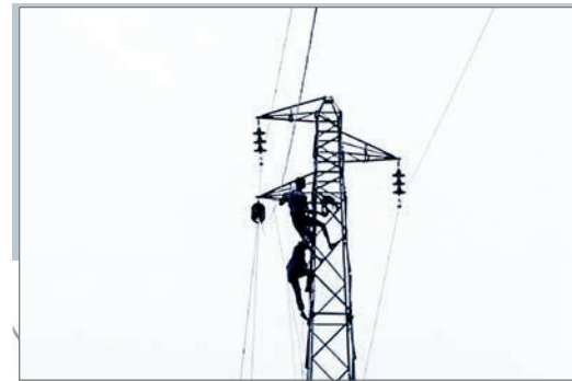
Electricians are repairing the power line at the site.