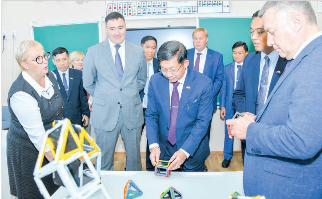
SAC Chairman Prime Minister Senior General Min Aung Hlaing visits MBOU Zakharovkaya Secondary School Moscow in Irkutsk on 11 September.

Irkutsk Aviation Plant was established in 1932, and it is a branch of Irkutsk Corporation. The Irkutsk airplane manufacturing association is an oldest works in Transbaykal region. From 1932, it has manufactured more than 7,000 airplanes.