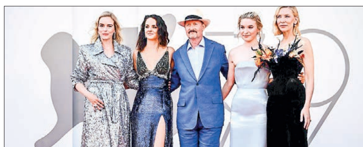
Looking good: German actress Nina Hoss, French actress Noemie Merlant, American director Todd Field, British-German actress Sophie Kauer and Australian American actress Cate Blanchett (pictured left to right) who attended the star-studded event.

THE first United Nations Global Congress of Victims of Terrorism concluded Friday at the UN headquarters in New York with a commitment to strengthen support for terrorism victims. Themed "Advancing the Rights and Needs of Victims of Terrorism," the congress aims to adopt a victim-centric approach to countering terrorism and preventing violent extremism, said a press release of its organizer, the United Nations Office of Counter-Terrorism. More than 600 participants, including close to 100 victims of terrorism from 25 countries across the globe, attended the congress in person. The congress concluded with the presentation of the chair's summary by Vladimir Voronkov, the under-secretary-general for counter-terrorism. In his remarks, Voronkov reiterated a three-pronged approach to promote the rights of victims of terrorism and better support their financial, legal, medical, and psychosocial needs. —Xinhua