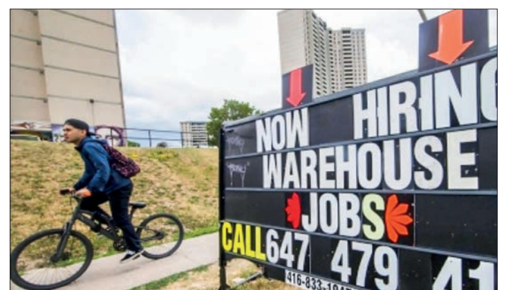
The unemployment rate of very recent immigrants has a particular impact on labour market conditions in Canada's largest cities.

Long-term unemployment, the number of people who had been continuously unemployed for 27 weeks or more, rose by 22,000, or 13.7 per cent in August, offsetting a similar size decline in July. Long-term unemployment expressed as a proportion of the total labour force was 0.9 per cent in August, the same as its February 2020 pre-pandemic level, the agency said. —Xinhua