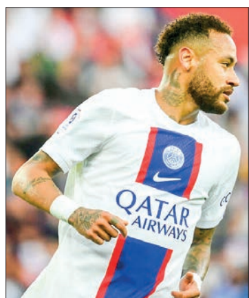
Neymar scored the only goal in Paris Saint-Germain's win over Brest.

NEYMAR notched his 10 th goal of the season but a lethargic Paris Saint-Germain needed a second-half Gianluigi Donnarumma penalty save to secure a 1-0 win over Brest in Ligue 1 on Saturday.