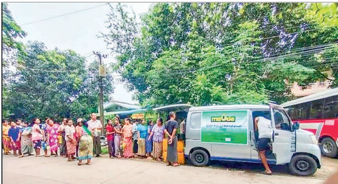
Consumers standing in queue to buy the palm oil from a mobile market truck.

As the price movement is likely to happen in the coming days, traders do not make a big purchase when the price is decreasing. The consumers also expect to see palm oil and vegetable oil bottles in the shelves of city marts.—TWA/GNLM