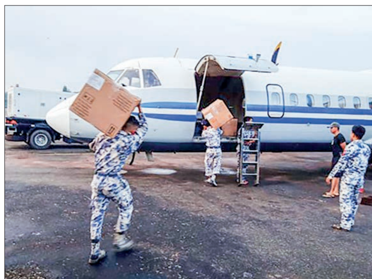
Tatmadaw members loading cartons of COVID-19 vaccines onto Tatmadaw aircraft recently.

Responsible officials received them and will distribute them to the relevant areas.— MNA