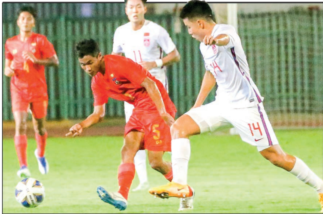
Myanmar team player (red) eyes on the ball during the Group A opener of the Asian U-20 Qualifiers at the Prince Saud bin Jalawi Stadium in Al Khobar, Saudi Arabia on 11 September.