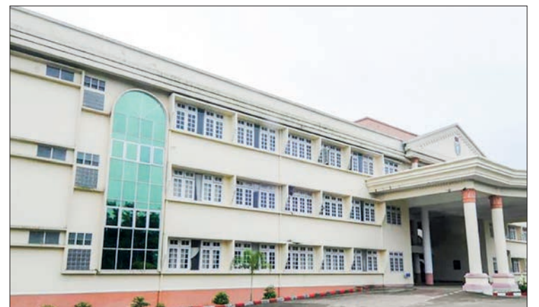
University of Dental Medicine (Yangon).

A total of 1,355 applicants were allowed to join entrance interviews for Universities of Medicine and Universities of Dental Medicine, according to the Ministry of Health.