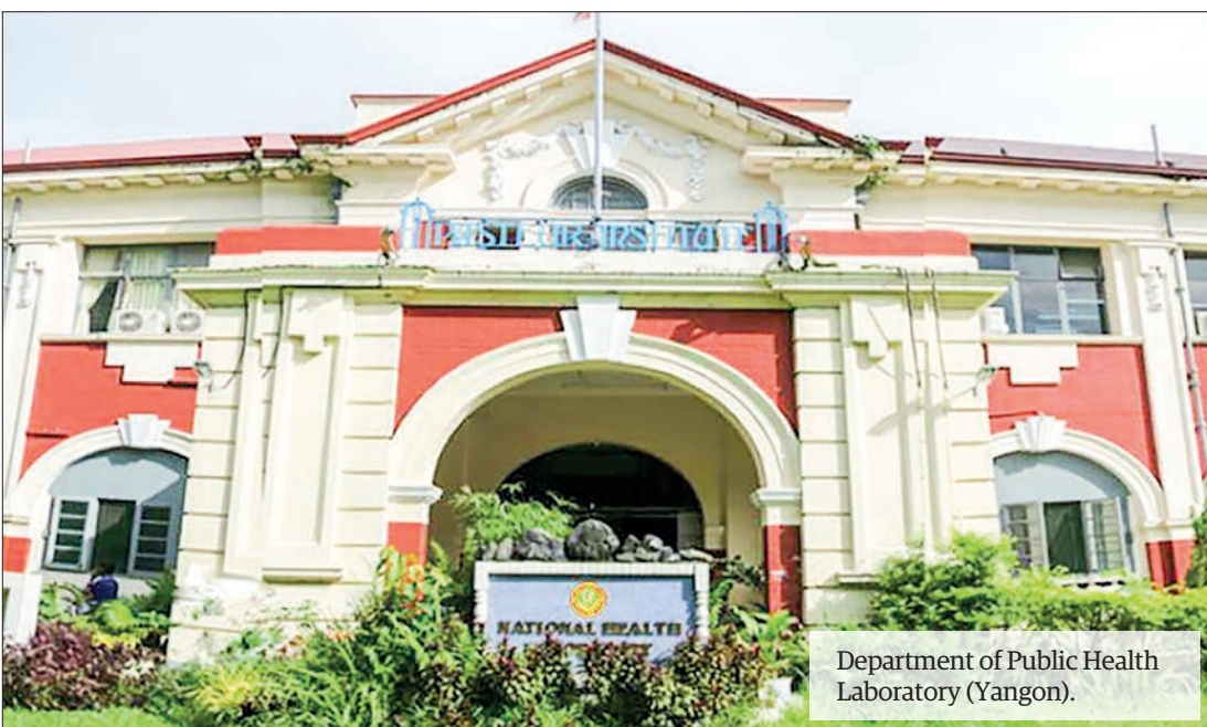
Department of Public Health Laboratory (Yangon).

The Covid-19 Control and Emergency Response Committee stressed the need to facilitate hand-washing basins and hand gel at shopping centres, factories, workshops, schools, offices, and departments, taking body temperature measurements, and urging the people to wear masks at YBS Bus terminals, airports, and ship ports with random inspections with the test kit for COVID-19 in public area.—TWA/GNLM