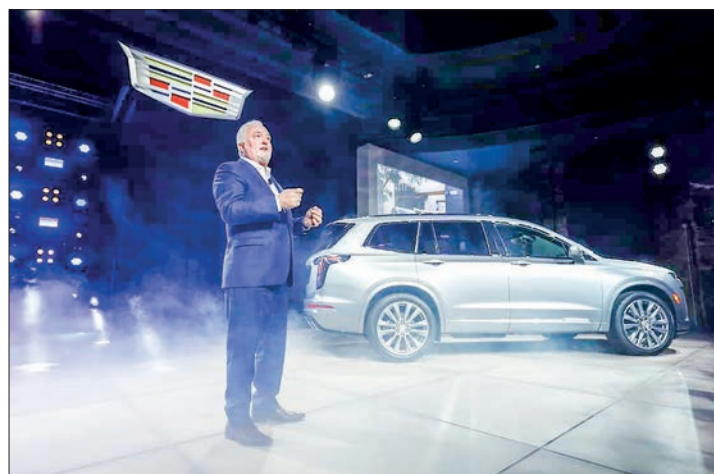
General Motors President of Cadillac Steve Carlisle revealed the Cadillac XT6 in January 2019 during the last Detroit Auto Show prior to the pandemic.

Architects of the event, officially called the North American International Auto Show, are not trying to replicate the panache of the show's earlier incarnation in light of profound changes since the last show in 2019. —AFP