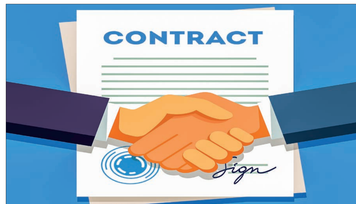
The basic elements required for the agreement to be a legally enforceable contract are mutual assent, expressed by a valid offer and acceptance, adequate consideration, capacity, and legality.

The party committing a breach of contract is called the