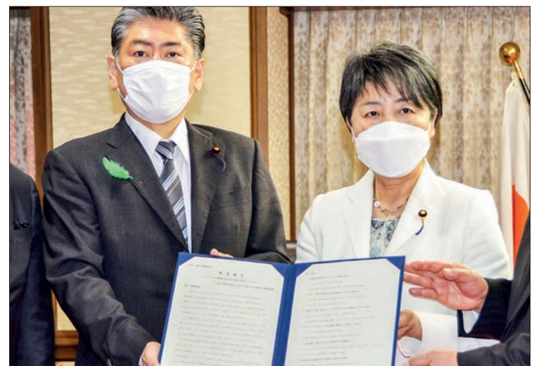
Then Justice Minister Yoshihisa Furukawa (L) and his predecessor Yoko Kamikawa hold up the proposal to support Ukrainian evacuees, at the Justice Ministry in Tokyo on 21 April 2022.

One official recalled that Japan’s quick decision to accept people from Ukraine using a government plane was a sort of an “unprecedented mission,” and