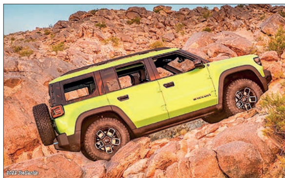
Battery electric vehicles will account for half of Stellantis car sales in the United States by the end of the decade.

Recon will be launched in North America in 2024. Jeep is also releasing an electric variant of its largest sport-utility vehicle, the 600-horsepower Wagoneer S, with a range of 600 kilometres. —AFP