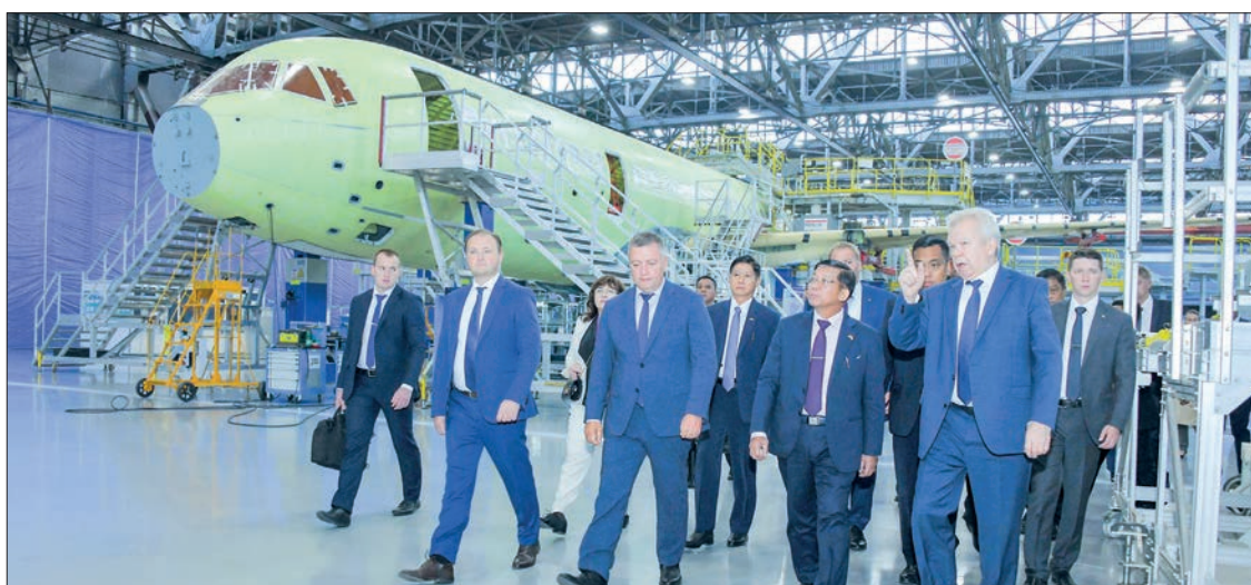
SAC Chairman Prime Minister Senior General Min Aung Hlaing visits Irkutsk Aviation Plant in Irkutsk on 11 September.

The Senior General and the General Director exchanged gifts.