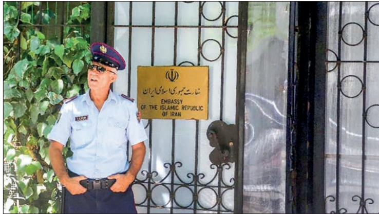
Albania blamed Iran for the July attack and on Wednesday cut diplomatic ties over the affair.

The US Treasury Department on Friday imposed sanctions on Iran’s Intelligence Ministry and its Minister Es-mail Khatib, citing alleged cy-