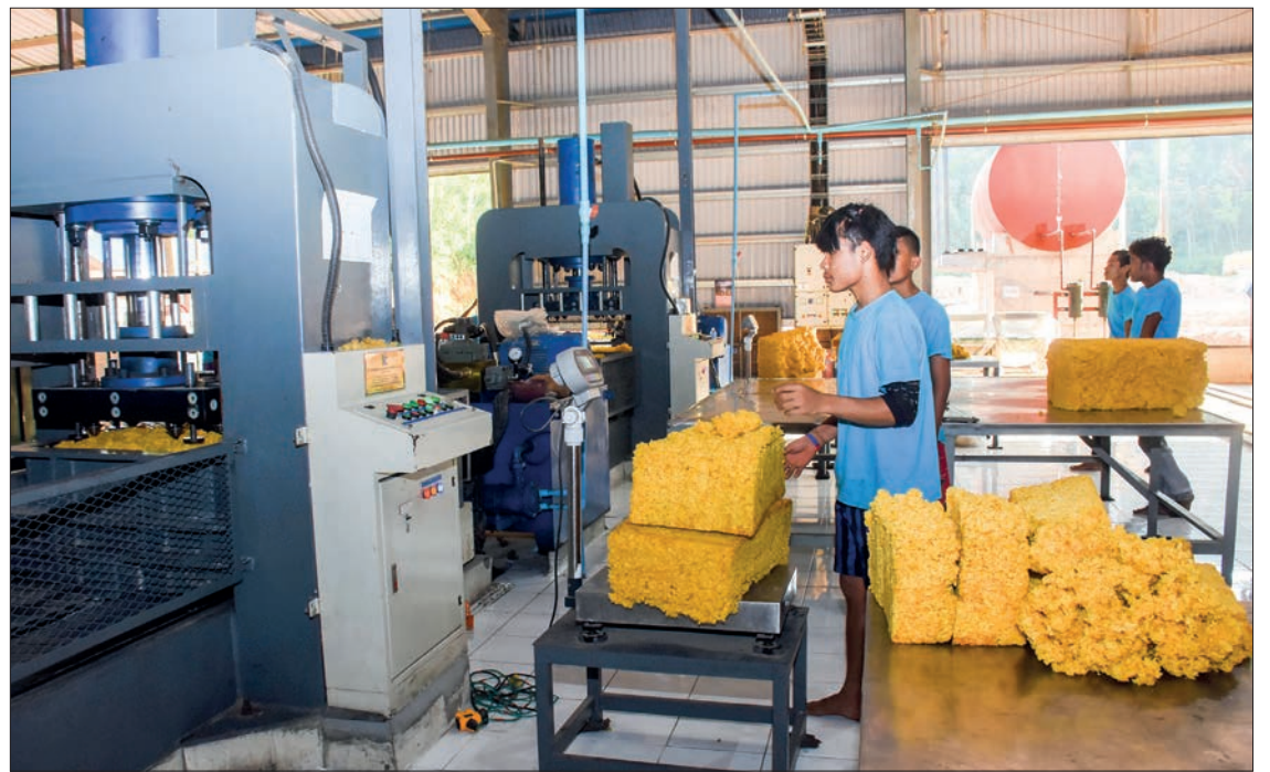
A factory running production of value-added rubber products.

Myanmar's agriculture sector is the backbone of the country's economy and it contributes to over 30 per cent of Gross Domestic Products. The country primarily cultivates paddy, corn, cotton, sugarcane, various pulses and beans.—KK/GNLM