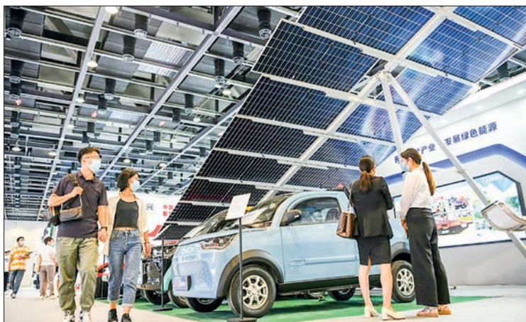
Visitors watch solar-powered cars at the environmental services exhibition during the 2022 China International Fair for Trade in Services (CIFTIS) in Beijing, capital of China, 3 September 2022.

CHINA'S automobile industry continued to see robust growth in production and sales in August