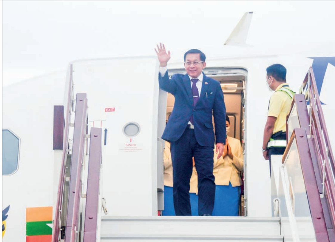
SAC Chairman Prime Minister Senior General Min Aung Hlaing arrives back at the military airport in Nay Pyi Taw on 11 September.

As a gesture of honouring the Myanmar high-level delegation led by the Senior General who made utmost efforts for emergence of opportunities to cooperate peoples and businesspersons with each other in friendly relations, economic, health and education sectors of both countries during the trip with the emphasis for development of the nation, ethnic children, traditional dance troupes and local people waited for the delegation at the airport, and chanted “May SAC Chairman Prime Minister Senior General Min Aung Hlaing be physical and mental wellbeing” hold-