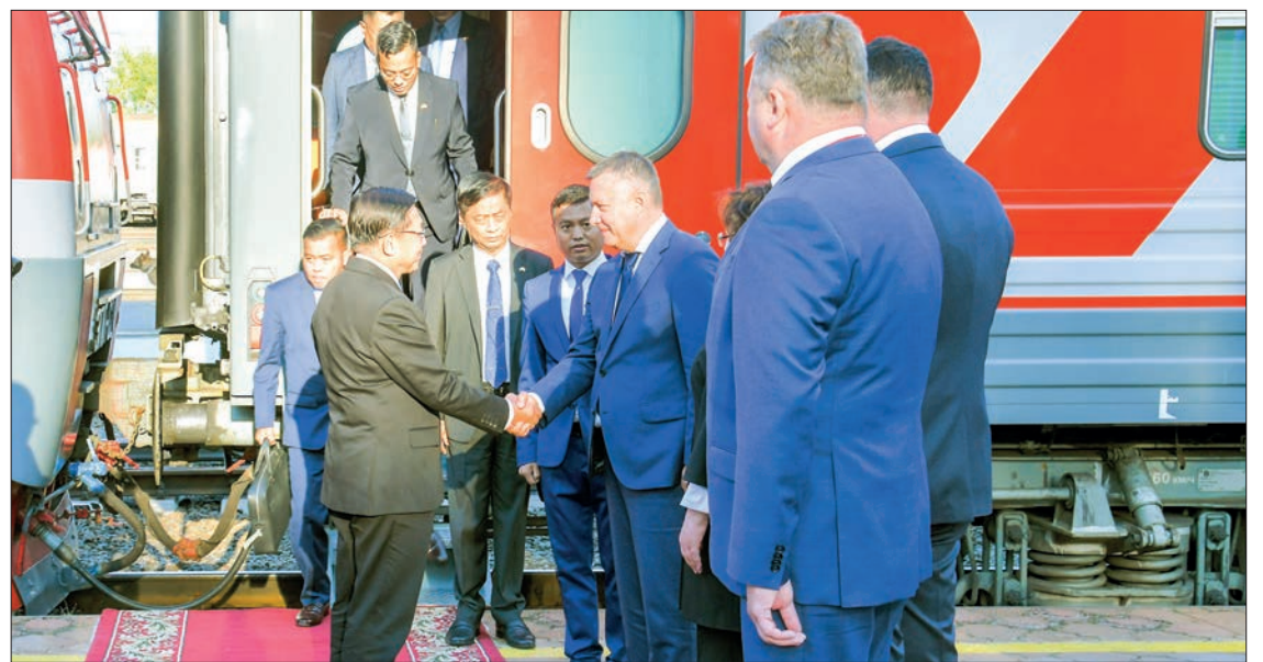
SAC Chairman Prime Minister Senior General Min Aung Hlaing being welcomed by Head of Government of Irkutsk State Mr Igor Ivanovich Kobzev at Passazhirskiy railway station in Irkutsk on 10 September.

At the talks, they exchanged views on Myanmar's situation as the strategic partnership country of Russian Federation, the hub situation of Irkutsk state in the Russian Federation, settlement of many heavy industries of the Russian Federation