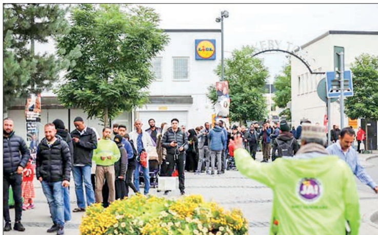
People queue to vote at a polling station for advanced voting, 10 September, in Rinkeby, north of Stockholm, Sweden, one day ahead of the general elections.

Polling stations open at 8:00 am (0600 GMT) and close at 8:00 pm, with final results due around midnight. The right-wing