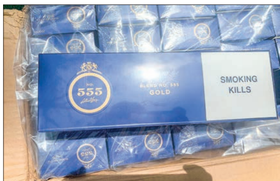
Various customs dutyless foodstuffs and consumer goods seized in Mandalay Region on 9 September.

Furthermore, a combined inspection team under the su-