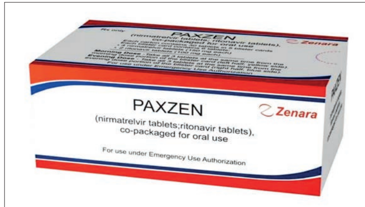
Paxzen, the first generic of Paxlovid for COVID-19 in India.