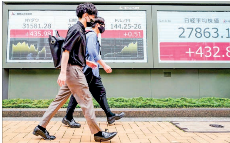
Japan has so far not announced any specific measures to bolster the yen's value.

It has continued to drop fast, nearly touching 145 per dollar overnight in New York, as investors flooded into the US currency hoping for better