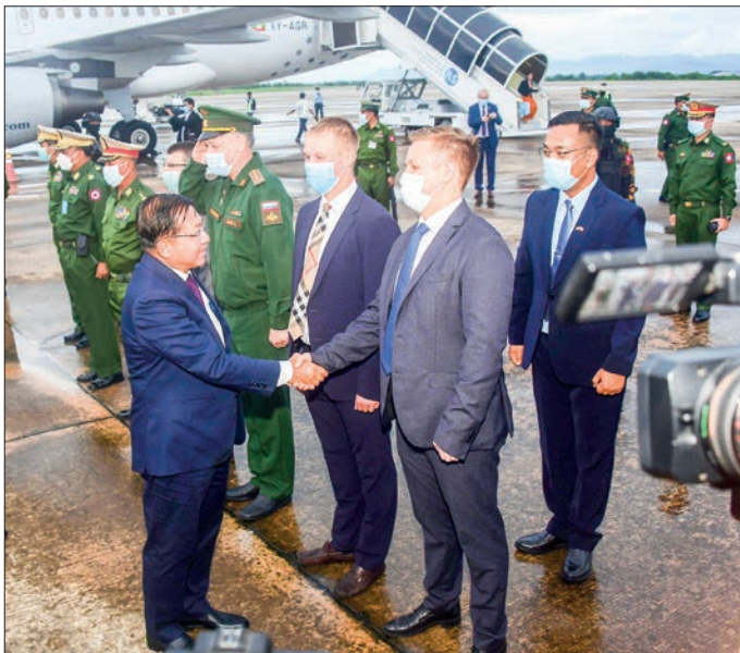
SAC Chairman Prime Minister Senior General Min Aung Hlaing being welcomed back by diplomats at the Military Airport in Nay Pyi Taw on 11 September.

ing the placards “Warmly welcomed Prime Minister Senior General Min Aung Hlaing who attended the 7 th Eastern Economic Forum-2022”, “Specially thank for Prime Minister Senior General Min Aung Hlaing who uplifted prestige of Myanmar in the world”, “Heartily take pride of efforts of Senior General Min Aung Hlaing for Myanmar”, “Let the State Administration Council be successful”, “Warmly welcome” and “Perpetually cement Myanmar-Russia fraternity” from the landing space to VIP lounge and from the military airport to the roundabout, and from the military airport roundabout to International Airport Roundabout, some 30 5x2 feet pictures bearing activities of the trips of the Senior General to Russia, waving miniature flags of the Republic of the Union of Myanmar.—MNA