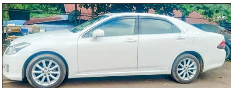
A Toyota Crown without registration seized on Yangon-Myawady Road on 7 September.

pervision of the Anti-Illegal Trade Task Force of Mandalay Region, led by Region Customs Department performed inspection near the Htonbo gate in Yangon-Mandalay highway. They seized illegal foodstuffs, without official documents, from a vehicle estimated at K68.510 million and a Mitsubishi Fuso six-wheel truck, which carried goods estimated at K10 million, and total estimated at K78.510 million were seized and the action was taken under the