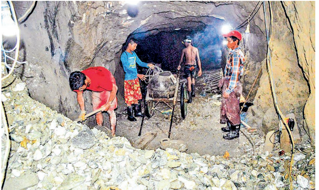
Gold mines usually collapse in the rainy season. To avoid an unnecessary shortage, the association stated in May that raw gold metal would be imported this rainy season. A gold mine and mine workers in Shan State (South).