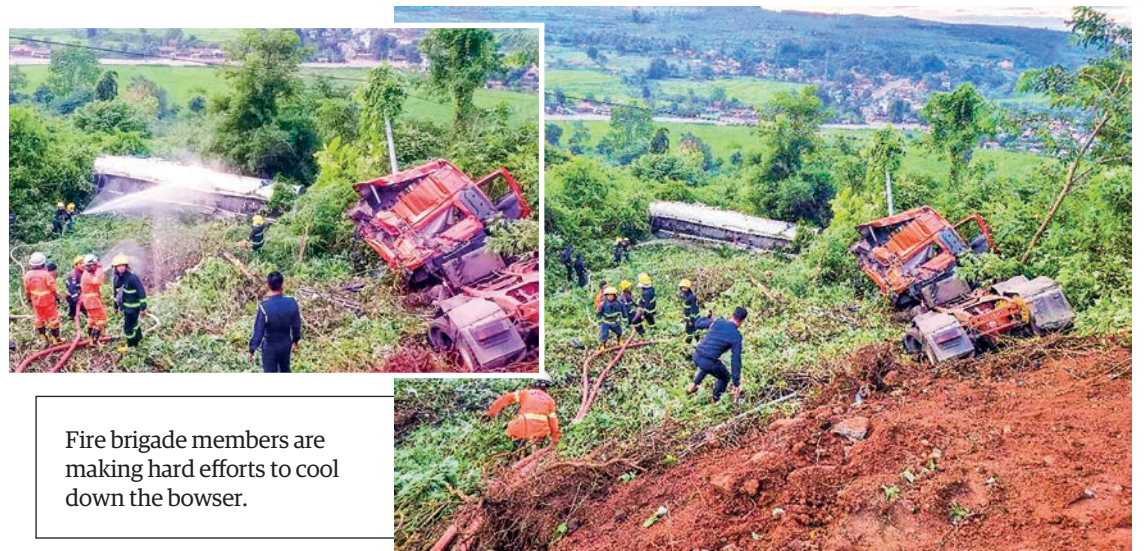
Fire brigade members are making hard efforts to cool down the bowser.

A fire engine and a water tanker from the fire station of PyinOoLwin District, a fire engine and members from the PyinOoLwin Township fire station carried out the cooling work at the scene. No one was injured in the incident. — TWA/GNLM