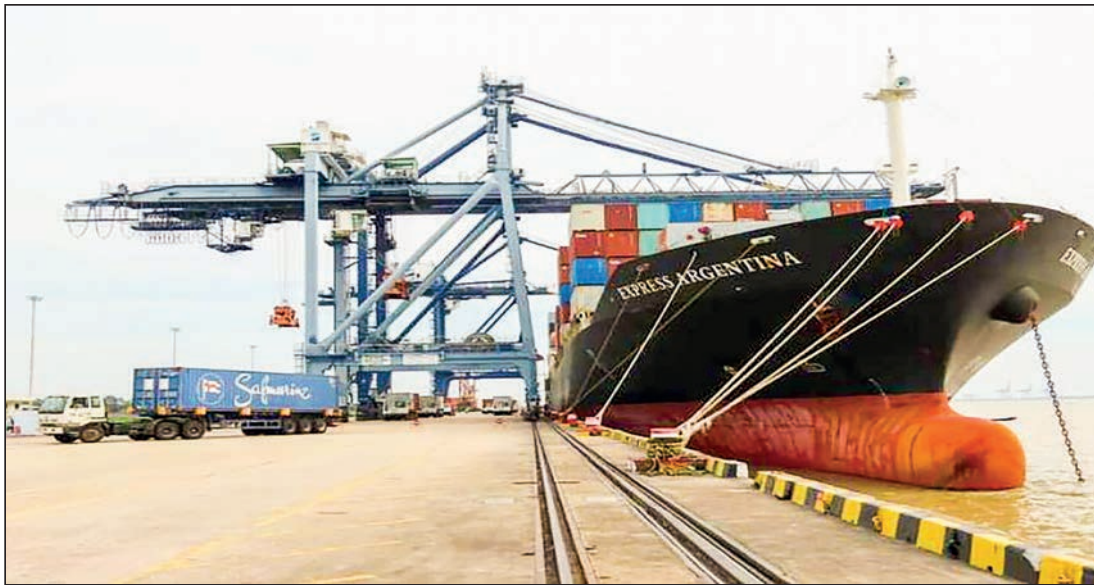
MV. Express Argentina cargo ship from Viet Nam docked at Myanmar International Terminals Thilawa with 8.1 drafts on 12 January 2022

Earlier, the larger ships had draft problems preventing their sailing on the Yangon River. The draft extension is up to 10 metres with the new navigation channel accessing the inner Yangon River. Yangon inner terminals and the outer