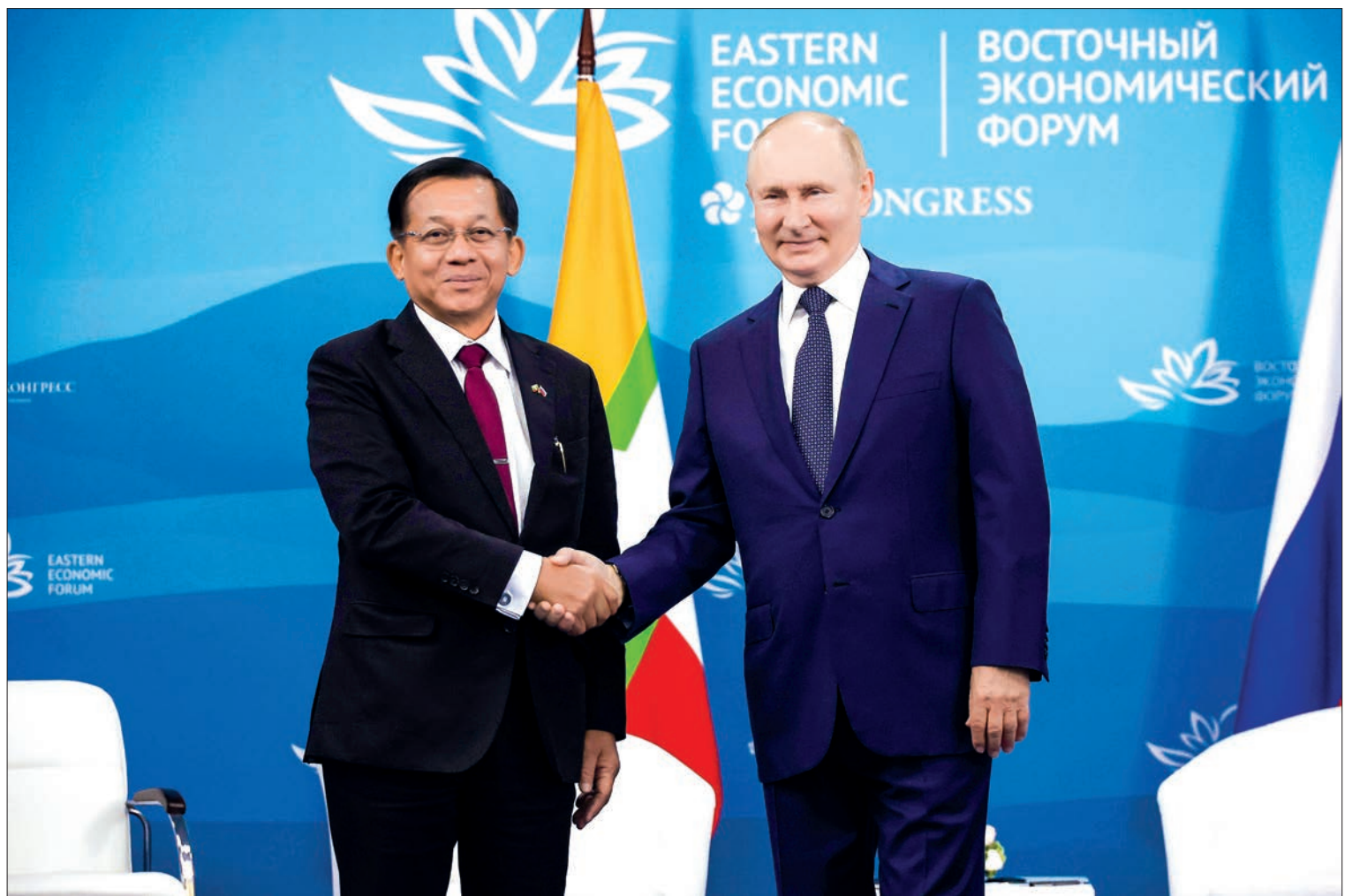
State Administration Council Chairman Prime Minister Senior General Min Aung Hlaing exchanges the greetings with President of Russian Federation Mr Vladimir Vladimirovich Putin in Vladivostok on 7 September 2022.

At the talks, President of the Russian Federation Mr Vladimir Vladimirovich Putin said that a plan is underway to hold the