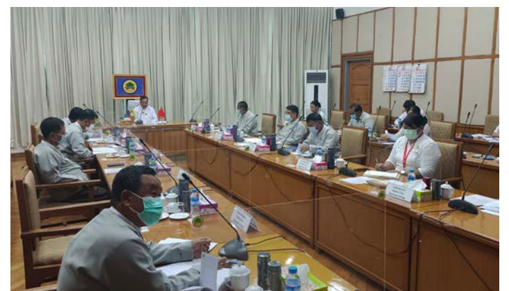
The handover ceremony of auxiliary bridge to the Ministry of Construction from Lancang government of China in progress online.

Afterwards, officials signed a joint inspection record regarding the completion of the Kunlong Auxiliary Bridge as the executive deputy mayor of Lancang also spoke on the occasion and the deputy minister gave the concluding remark. —MNA