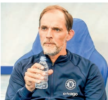
Chelsea have sacked manager Thomas Tuchel.

"On behalf of everyone at Chelsea FC, the club would like to place on record its gratitude to Thomas and his staff for all their efforts during their time with the club," the Premier League club