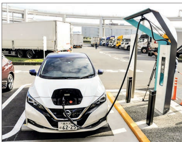
In 2020, Japan had a total of 29,855 charging stations (21,916 slow chargers and 7,939 fast chargers).

The announcements come as automakers worldwide expand their efforts to roll out less-polluting, electrified cars amid stricter environmental