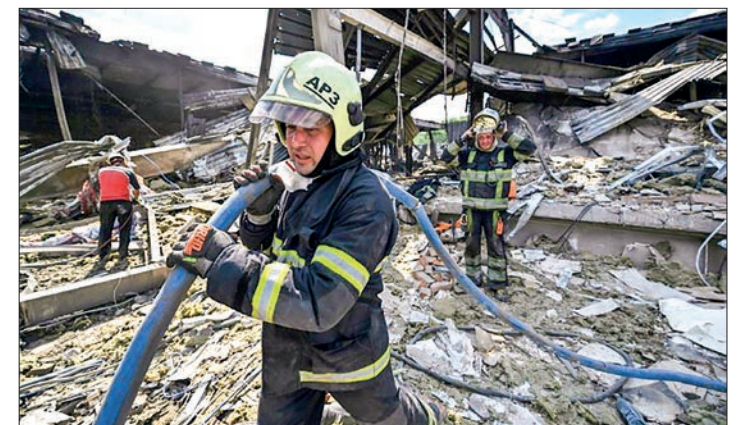
Rescuers clear rubble from a mall in Kremenchuk, on 28 June 2022.

According to Kirby, massive purchases of artillery ammunition from the deeply isolated and repressive North Korean government, as well as a deal to purchase military drones from Iran, show the dire straits Russia faces after months of Western economic and technological sanctions aimed at crippling its war machine.—AFP