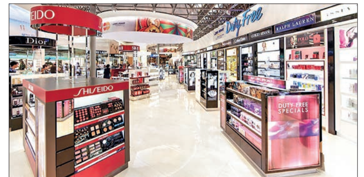
The King Power duty-free shop at Don Mueang Airport.

In cooperation with MNA and King Power, passengers can get a 15 per cent discount at the shops such as King Power Suvarnabhumi, Don Mueang, Chiang Mai, Phuket, U-Tapa Airports King Power Rangnam, Srivaree, Pattaya and Phuket. — TWA/GNLM