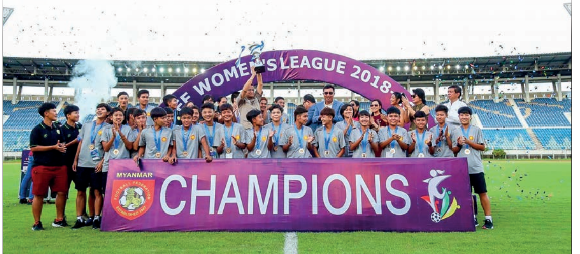
The file photo shows the celebrating ISPE FC players as they win the championship title of the Myanmar Women's League in 2018.

The Myanmar U-18 women's team, which is preparing to compete in international competitions, also plans to compete in the women's league to gain competition experience. — GNLM