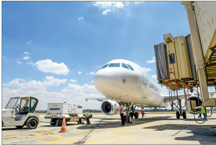
Israeli strikes hit Syria's Aleppo airport on Tuesday evening, damaging the runway and putting the facility out of service.

Human Rights, a Britain-based war monitor, said several explosions were heard near Aleppo airport, "resulting from Israeli strikes on warehouses of Iran-affiliated militias".