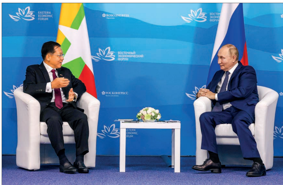
SAC Chairman Prime Minister Senior General Min Aung Hlaing holds talks with President Vladimir Vladimirovich Putin yesterday.

After the talks, the Senior General and the Russian Federation President cordially greeted each other. — MNA