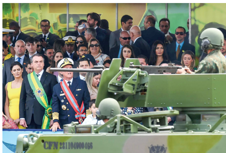
Every year, 7 September in Brazil is a day of colourful parades, military demonstrations and national pride. PHOTO: AFP

But the incumbent looks determined to flex his muscle on Independence Day.—AFP