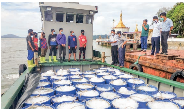
The picture shows fish and shrimp covered with ice on a vessel.

THE value of Myanmar's seafood exports as of 26 August in the current financial year 2022-2023 was estimated at over US$260 million since 1 April, the Ministry of Commerce's data indicated.