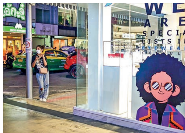
Photo-sharing app BeReal invites users to share glimpses of their real lives rather than carefully staged moments, winning fans with the bid for authenticity.

It was the most downloaded app in the United States at start of September, and ranked among the top three in Britain and France, according to figures provided by market tracker Data.ai.—AFP