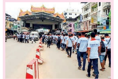
MoU workers to Thailand.

Around 30,000 and 40,000 workers have been sent to Thailand through the MoU system since 10 May. —TWA/GNLM