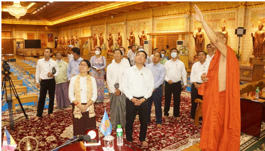
MoI Union Minister U Maung Maung Ohn views the Samvezaniya religious hall.

The Union Minister and party then viewed the Samvezaniya religious hall where the life circle