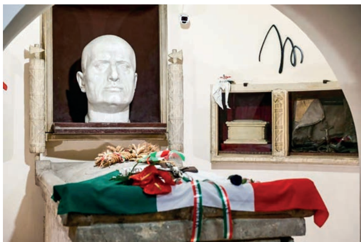
Mussolini's tomb draws tens of thousands of visitors each year.

"We will never forget you!" says one message in the gold