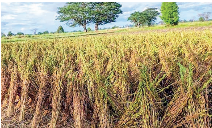
Of the cooking oil crops grown in Myanmar, the acreage under sesame seed is the highest, accounting for 51.3 per cent of the overall oil crop plantation. Approximately 600,000-800,000 tonnes of sesame seeds are produced yearly.

Of the cooking oil crops grown in Myanmar, the acreage under sesame seed is the highest, accounting for 51.3 per cent of the overall oil crop plantation. Approximately 600,000-800,000 tonnes of sesame seeds are produced yearly. — KK/GNLM