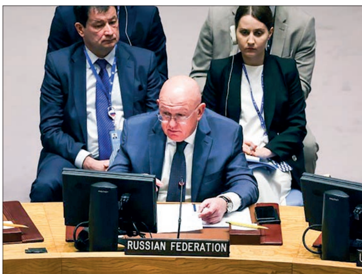
Russia's ambassador to the UN, Vasily Nebenzya, expressed regret at a UN Security Council meeting on 6 September 2022, that an IAEA report on the Zaporizhzhia nuclear power plant did not blame Ukraine for shelling the Russian-occupied Ukrainian facility.

each other for shelling, which took place again Tuesday despite the watchdog's recommendations.