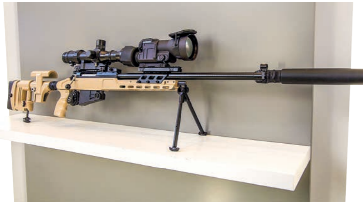
Chukavin sniper rifle

FROM 15 to 21 August, Russia hosted the Army 2022 International Military and Technical Forum organized by the Ministry of Defence of the Russian Federation. On the same days, the Army International Games and the 10th Moscow Conference on International Security were held. The Army 2022 events took place at the Patriot Convention and Exhibition Centre, Kubinka Airfield, Alabino Military Training Ground, as well as in all military districts and in the Northern Fleet. The Army Forum is traditionally the most important international platform where the latest armament solutions are presented and relevant issues are discussed.