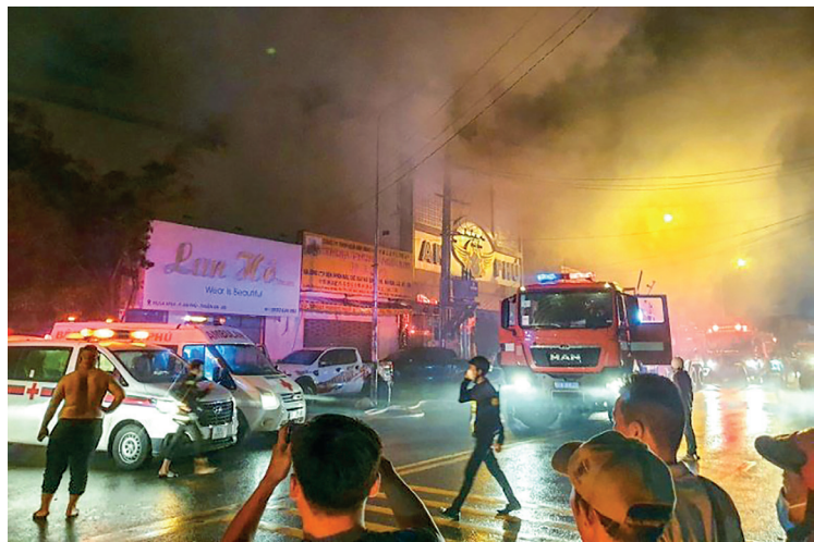
The blaze engulfed the second and third floors of the building.