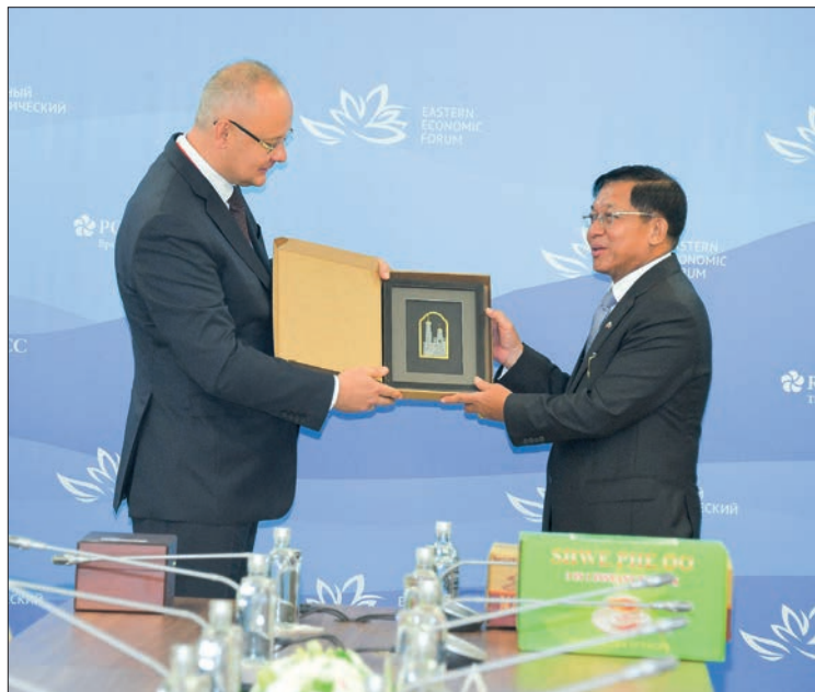
The Senior General and the Adviser to the Russian President exchange gifts.

After the meeting, the Senior General and the Adviser to the Russian President and Executive Secretary of the Eastern Economic Forum Organizing Committee exchanged gifts. — MNA