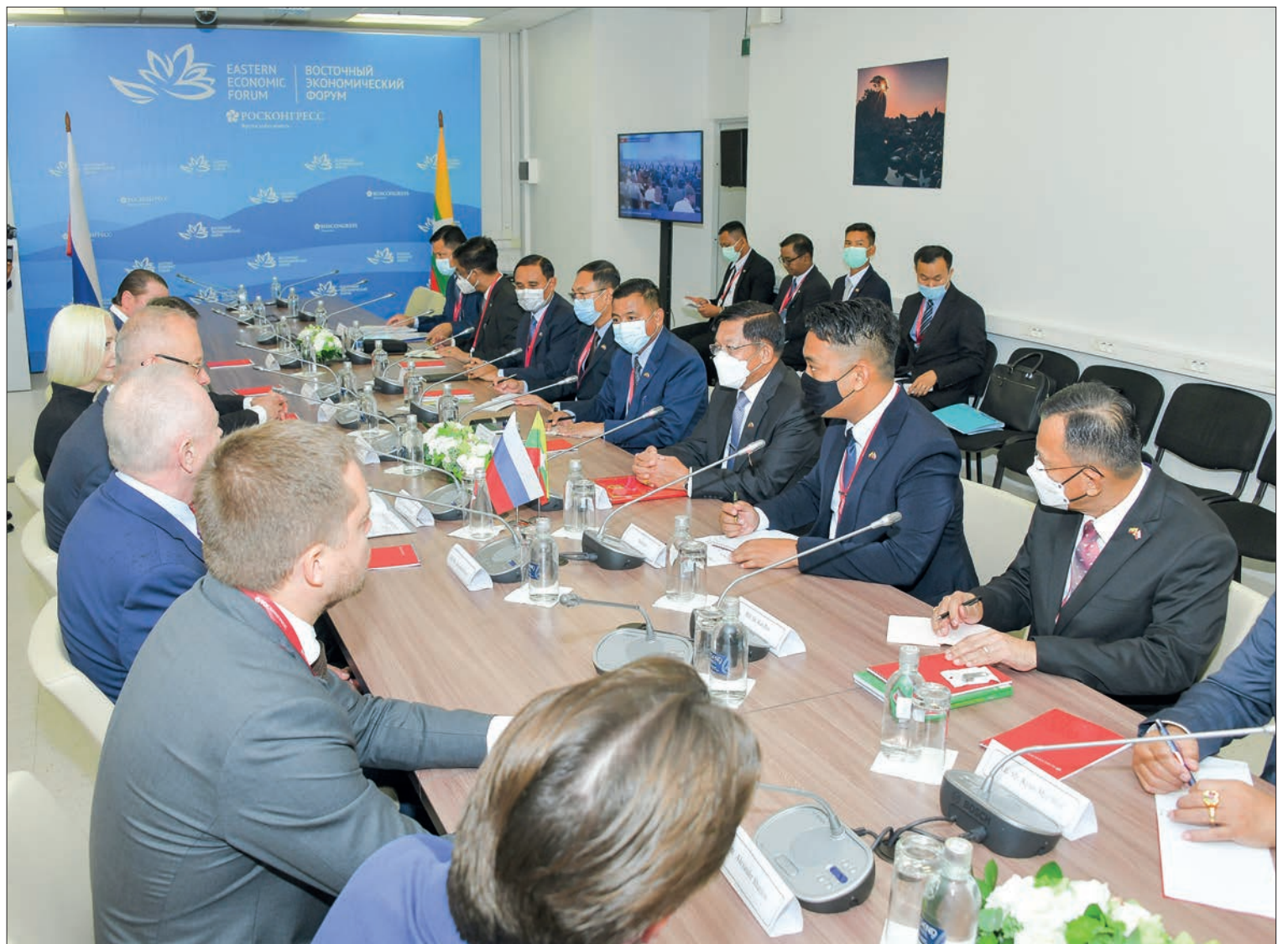
State Administration Council Chairman Prime Minister Senior General Min Aung Hlaing holds talks with Adviser to the Russian President and Executive Secretary of the Eastern Economic Forum Organizing Committee Mr Anton Kobyakov in Vladivostok yesterday.