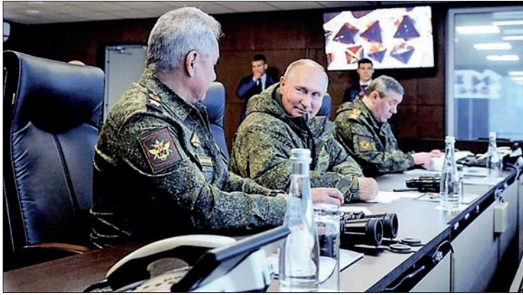
President Putin attended the Vostok-2022 manoeuvres that are being staged in Russia's Far East.

PRESIDENT Vladimir Putin attended large-scale military exercises on Tuesday involving China and several Russia-friendly countries as Moscow seeks to strengthen partnerships in Asia in the face of Western sanctions.