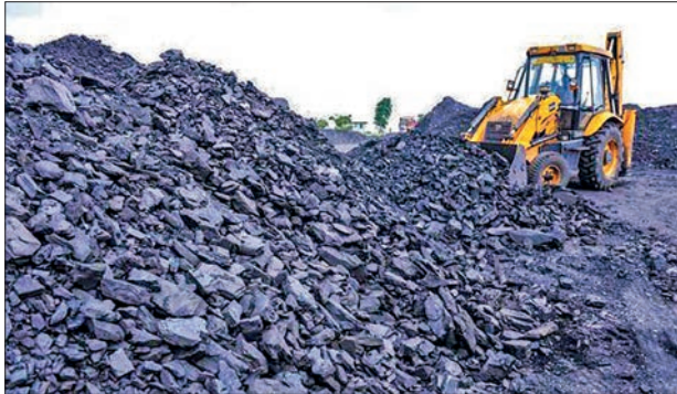
Australian Prime Minister Anthony Albanese has assured the resources industry that the country will remain a major exporter of fossil fuels under his leadership.

However, he said Australia would look to increase exports of alternative renewable energy sources such as hydrogen as the world transitions away from fossil fuels.