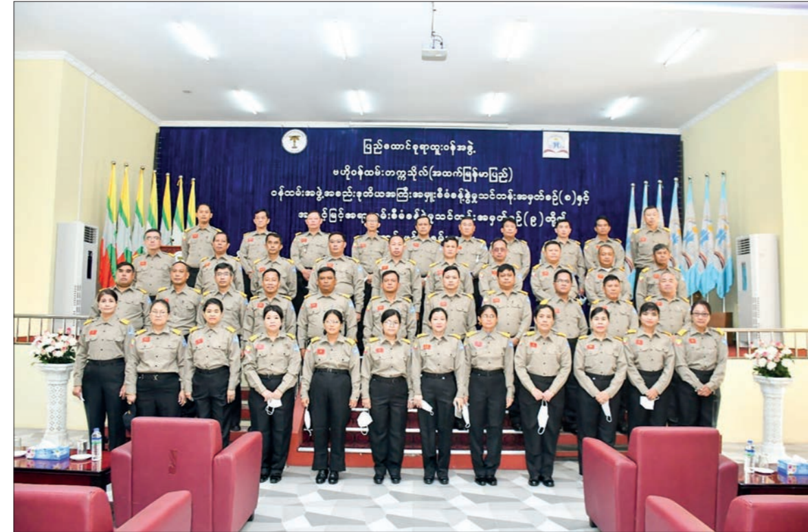
The Management Course No 8 for Executive Level Officials was held at the Central Institute of Civil Service (Upper Myanmar) from 24 January to 18 March 2022.

In order to nurture efficient civil service personnel, this is the time to train civil servants