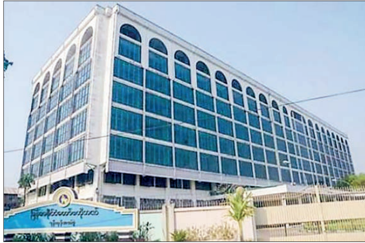
The office of the Central Bank of Myanmar-CBM (Yangon Branch).

The remittances of Myanmar migrant workers play a key role in the development of the country and foreign income