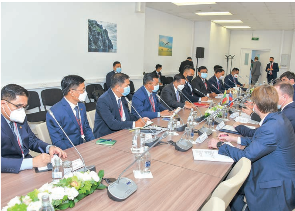
The Senior General receives the CEO of the Rosatom State Corporations yesterday.