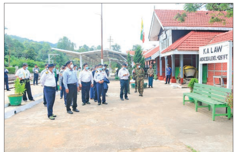
MoTC Union Minister Admiral Tin Aung San views round the Kalaw Railway Station yesterday.

Union Minister Admiral Tin Aung San met officials and staff from the Taunggyi Railway Station and gave necessary instructions. — MNA