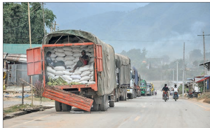
Exports including rice and broken rice are being delivered through the Muse-Kyinsankyawt route every day and about 50 trucks are going to China every day.