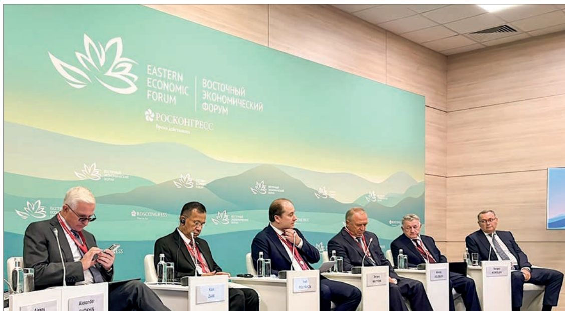
Union Minister Dr Kan Zaw participates in the Russia-ASEAN Business Dialogue.

Union Minister Dr Thet Khaing Win joins the Medical Panel Session of the Eastern Economic Forum 2022.