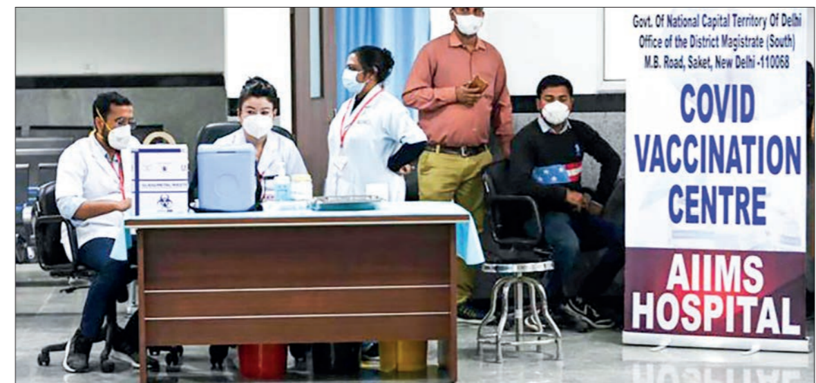
Health workers wait for the start of the Covid-19 coronavirus vaccination drive at the All India Institute of Medical Science (AIIMS) in New Delhi in 16 January 2021.