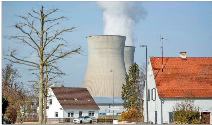
The plants would be kept in reserve to potentially "make a further contribution to the electricity grid in southern Germany", where the development of renewable power was lagging the north.

GERMANY said Monday it would keep two nuclear plants on standby beyond the end of the year in