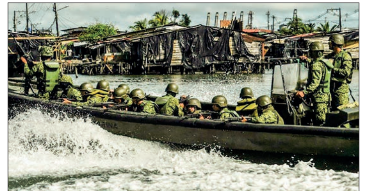
A Colombian navy patrol in the waters around Buenaventura, where rival gangs have turned the major port city into a living nightmare for residents.

Buenaventura is where 40 per cent of the country's international trade takes place and the departure point of most of the cocaine destined for the United States. In recent years, it has become one of the most violent cities in the country, with 576 murders between 2017 and 2021, according to the Pares foundation, along with forced disappearances and kidnappings. On 30 August, the two gangs were involved in a shoot-out using automatic weapons that lasted several hours.—AFP