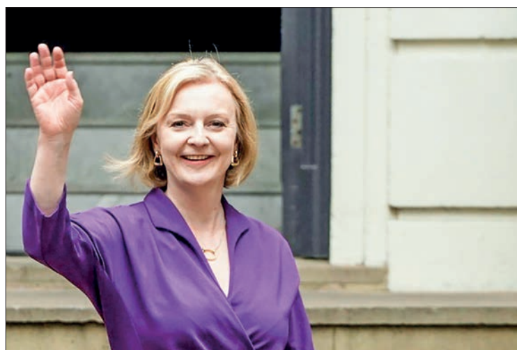
Truss, the outgoing British foreign minister, has warned that she will push ahead to pass proposed UK legislation to tear up part of Britain's Brexit deal with the European Union.

vent the return of a trade border between the north and Ireland, which remains an EU member, and was signed and approved by Truss's outgoing predecessor Boris Johnson.