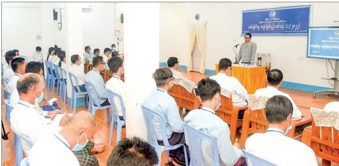
MoI Union Minister U Maung Maung Ohn makes the opening address at the training course yesterday.

PHOTOGRAPHY records the moments that never be regained and the photos reflect the history and social culture of a nation, so it needs to take records of the good history, said Union Minister for Information U Maung Maung Ohn at the opening ceremony of the photo shooting and editing training course 1/2022 in Nay Pyi Taw yesterday.