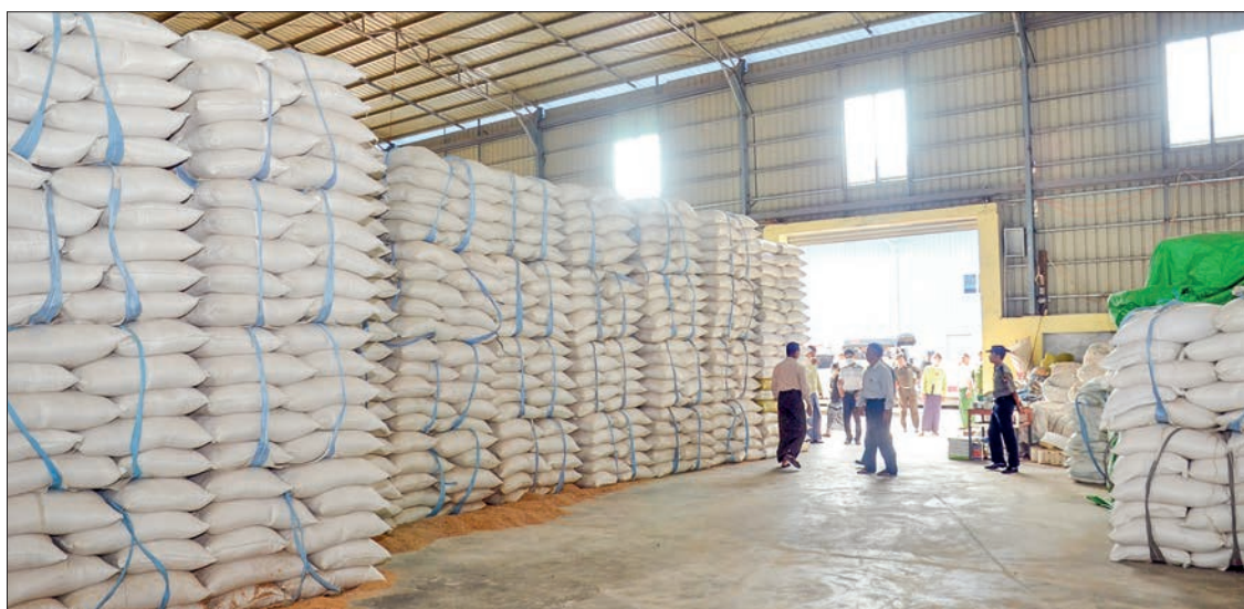
In the past five months, approximately 44 exporter companies delivered over 731,590 MT of rice to external markets by sea, whereas over 158,400 MT were sent to neighbouring countries via border posts.

Myanmar shipped rice and broken rice to regional countries, countries in Africa and European Union member countries through maritime trade. It is also exported to neighbouring countries, China and Thailand through cross-border posts.