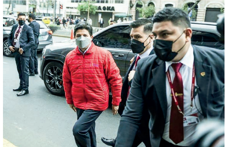
Peru's President Pedro Castillo is the subject of six criminal investigations.