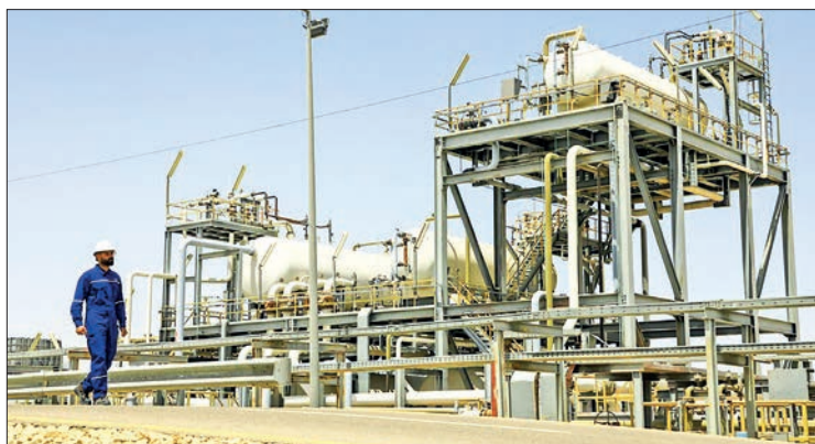
Crude oil production by the Organization of the Petroleum Exporting Countries (OPEC) is an important factor that affects oil prices.

pressed OPEC+ to increase output to bring down energy prices that have fuelled decades-high inflation.—AFP