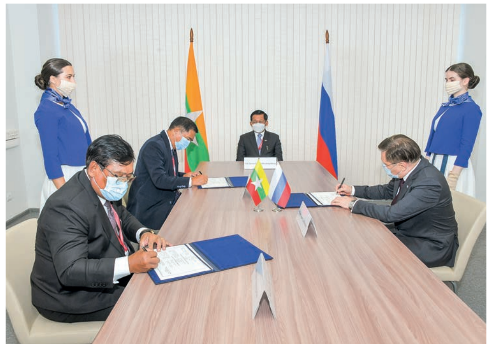
The MoU signing event between the Ministry of Science and Technology and the Ministry of Electric Power and the Rosatom State Corporations is in progress.