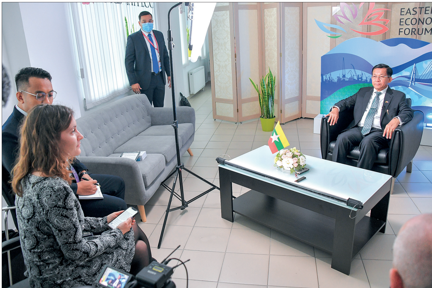
The Senior General holds an interview with the Rossiya Segodnya News Agency, RIA in Vladivostok yesterday.