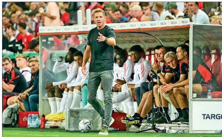
Bayern Munich's German head coach Julian Nagelsmann says his side haven't been "awake in their heads" in recent Bundesliga draws.

While Lewandowski's replacement Sadio Mané has scored three goals in five Bundesliga matches since arriving