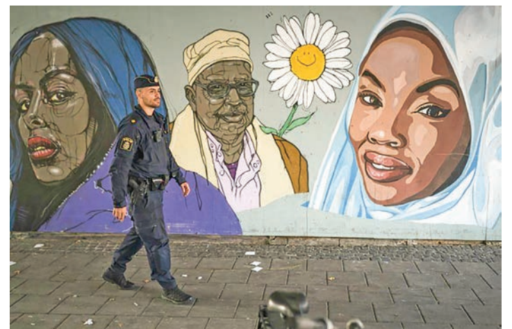
Sweden — one of the richest and most egalitarian countries in the world — now tops the European rankings for fatal shootings.

According to a report published last year by the National Council for Crime Prevention, among 22 countries with comparable data only Croatia had more deadly shootings, and no other country posted a bigger increase than Sweden in the past decade.—AFP