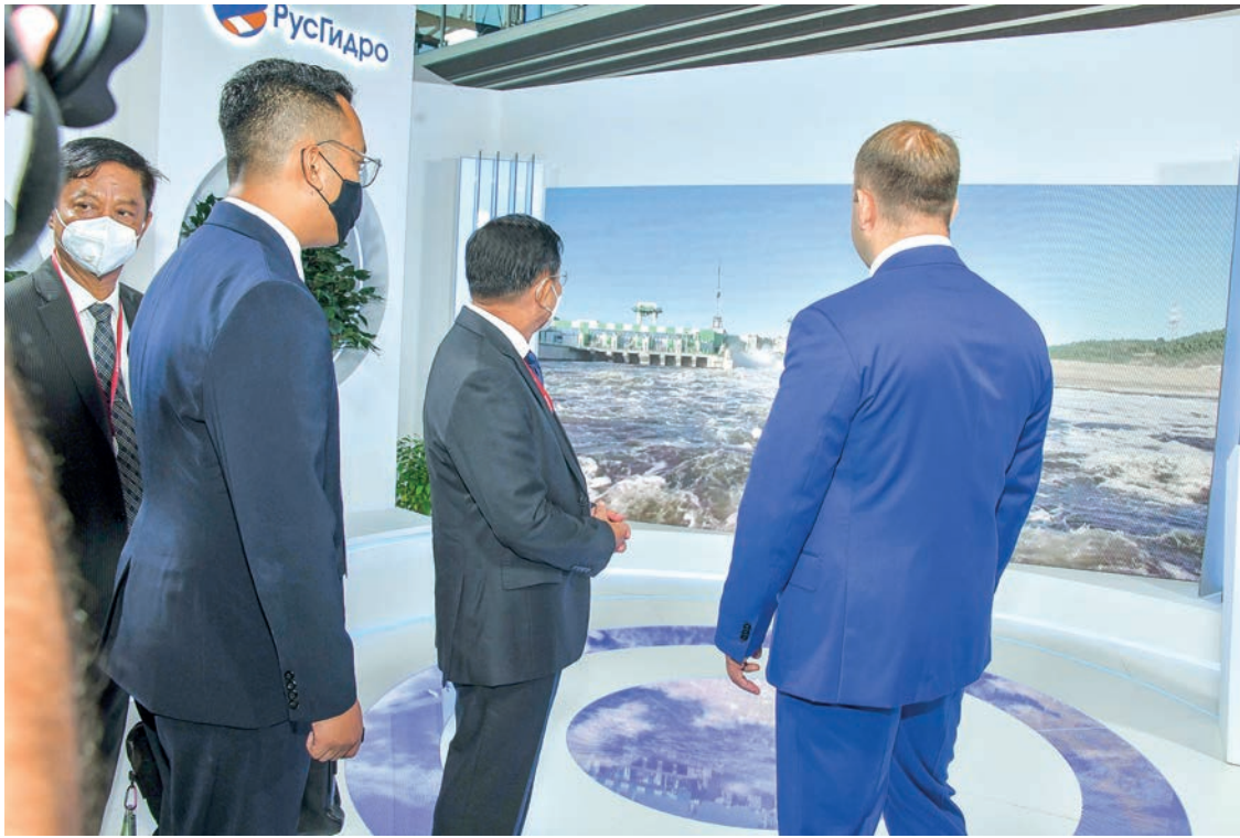
The Senior General views round the booths displayed at the Eastern Economic Forum-2022 yesterday.

T HE seventh Eastern Economic Forum-2022 was launched at the Far Eastern Federal University (FEFU) in Vladivostok of the Russian Federation on 5