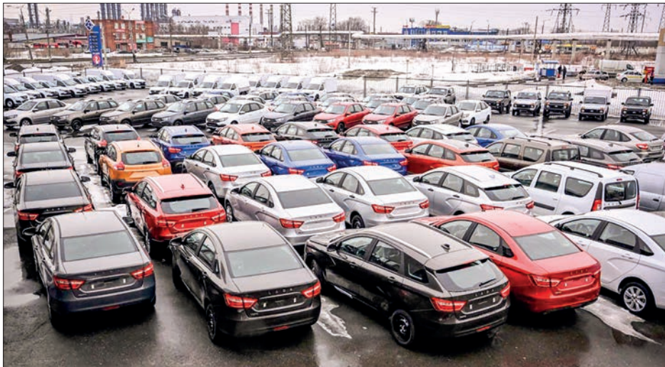
In August, 41,698 cars and light commercial vehicles were sold, according to figures released by the Association of European Businesses (AEB).

NEW car sales in Russia were down 62.4 per cent in August year-on-year, industry data showed Tuesday, as Moscow is facing a barrage of Western sanctions over its military campaign in Ukraine.