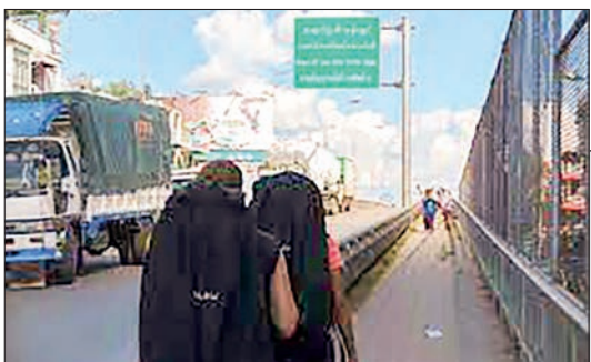
People and trucks are seen passing over the Myawady-Mae Sot Friendship Bridge II.

THE officials concerned and private businesspersons from Myanmar and their Thai counterparts negotiated permits for delivering goods to and from Mae Sot by Myanmar trucks, according to the Information