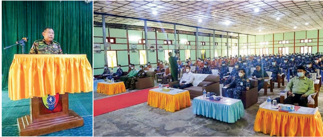
Home Affairs Union Minister Lt-Gen Soe Htut meets the staff and family members of the police force in Sittway in Rakhine State on 4 September 2022.

The Union minister mentioned the above in meeting with the staff and family members of the security police force at the hall of the office of the commander of the Rakhine State police force in Sittway, on the morning of 4 September and at the Control Headquarters of Border Guard Police Force in Maung-