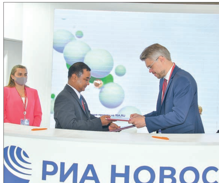
MoI Deputy Minister Maj-Gen Zaw Min Tun and the Sputnik news agency exchange the agreement document.