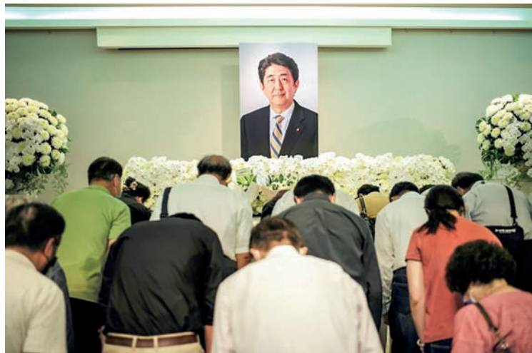
Shinzo Abe, Japan's longest serving prime minister, was shot dead on the campaign trail in July.

JAPAN expects to spend around 1.7 billion yen ($12 million) on a state funeral for assassinated former premier Shinzo Abe, the government said Tuesday, despite controversy over the plan.