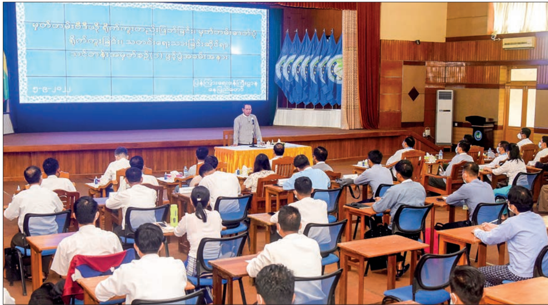
MoI Union Minister U Maung Maung Ohn opens the training in Nay Pyi Taw yesterday.

THE opening ceremony of the No 1 course on documentary video editing, documentary photo shooting and news writing was held at the assembly hall of the Ministry of Information in Nay Pyi Taw yesterday.