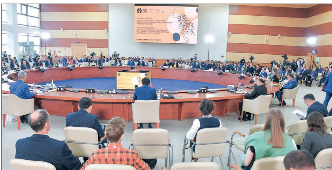
The second International Tiger Conservation Forum is in progress.

WHILE accompanying the high-level delegation led by SAC Chairman Prime Minister Sen-