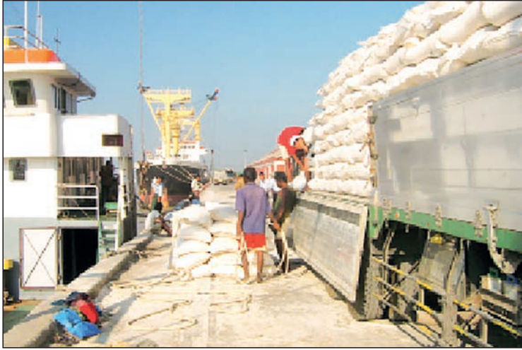
Export bags of beans and pulses are loaded onto the ship.

MYANMAR earned over US$500 million from export of various pulses in nearly five months of the current financial year 2022-2023, the Ministry of Commerce's statistics indicated.