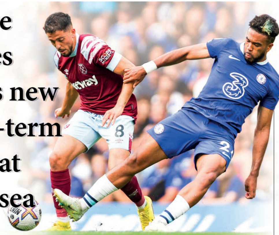
West Ham United's Spanish midfielder Pablo Fornals (L) fights for the ball with Chelsea's English defender Reece James (R) during the English Premier League football match between Chelsea and West Ham United at Stamford Bridge in London on 3 September 2022.

CHELSEA and England defender Reece James has signed a new five-year contract that will keep him at Stamford Bridge until 2027, the Premier League club announced on Monday.