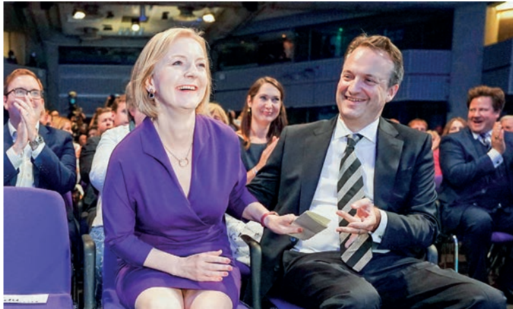
New Conservative Party leader and Britain's Prime Minister-elect Liz Truss (L) reacts next to her husband Hugh O'Leary as she hears the announcement of the winner of the Conservative Party leadership contest in central London on 5 September 2022.

In a short victory speech at the announcement in a central London convention hall, Truss said it was an "honour" to be elected after undergoing "one of the longest job interviews in