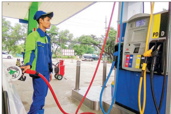
Fuel oil is filled into a car at one petrol station in Yangon.

The Petroleum Products Regulatory Department, under the guidance of the committee, is issuing the daily reference