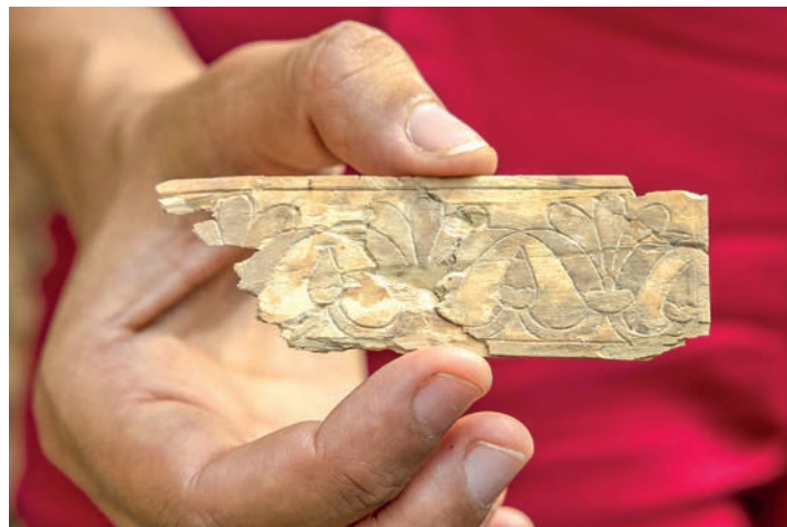
A picture shows ivory plaques unearthed in excavations in the Givati Parking Lot in the City of David National Park near the walls of the old city of Jerusalem on 5 September 2022. The items, according to the Israel Antiquities Authority (IAA), are believed to have been inlaid in a couch-throne and can be dated to the Biblical First Temple era.

ARCHAEOLOGISTS revealed Monday ivory plaques found in a luxurious Jerusalem Iron Age residence, a first-of-its-kind discovery at this location that sheds light on the owner's wealth and social status.