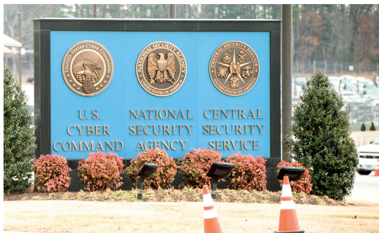
China has accused the US National Security Agency of launching ‘tens of thousands’ of cyberattacks.

BEIJING on Monday accused the United States of launching “tens of thousands” of cyber-