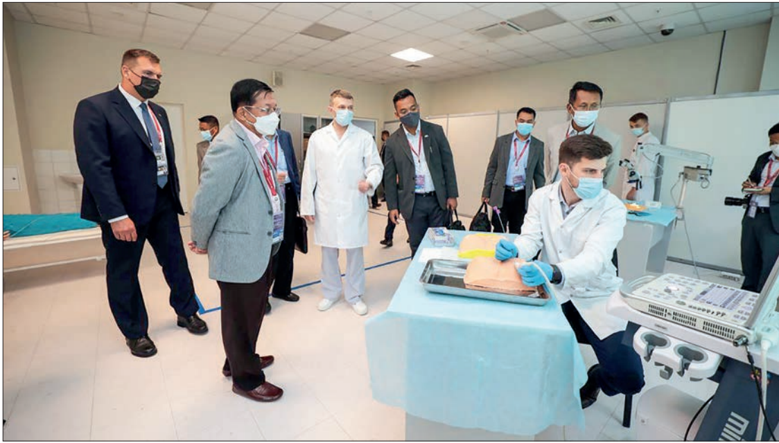
The Senior General pays study tours round the Medical School of the Far Eastern Federal University in Vladivostok yesterday.

THE high-level delegation headed by Chairman of the State Administration Council Prime Minister Senior General Min Aung Hlaing, currently in the Russian Federation, visited the Medical School and the Medical Centre of the Far Eastern Federal University in Vladivostok yesterday afternoon.