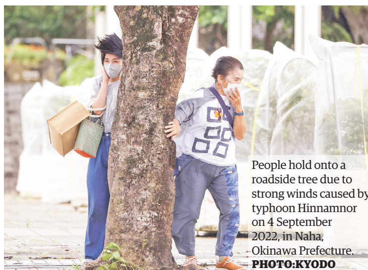
People hold onto a roadside tree due to strong winds caused by typhoon Hinnamnor on 4 September 2022, in Naha, Okinawa Prefecture.

The season's 11 th typhoon was moving slowly north over the East China Sea after passing between Ishigaki and Miyako islands in Okinawa Prefecture, the Japan Meteorological Agency said Sunday. The agency said people in eastern and western Japan should also stay alert for heavy rain and related mudslides