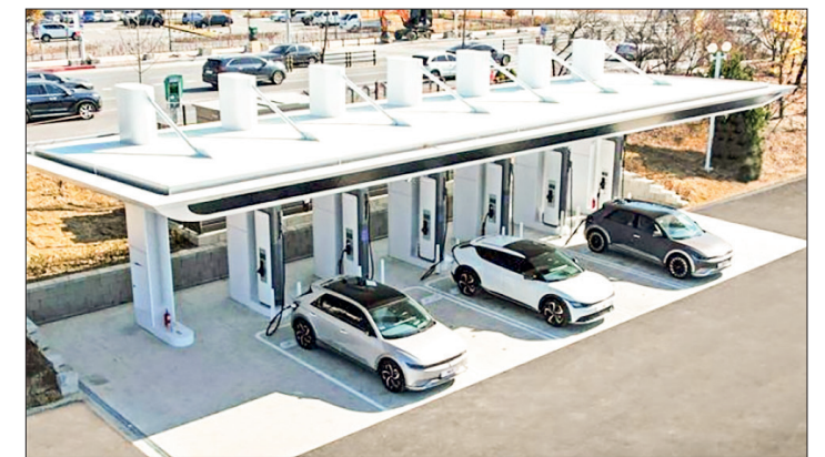
An electric car charging station is seen on a highway in South Korea.