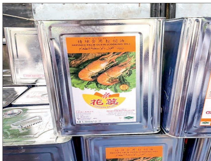
The wholesale reference rate of palm oil in the Yangon market rose again to over K5,200 per viss, according to the Supervisory Committee on Edible Oil Import and Distribution.

The Ministry of Commerce is striving for consumers not to worry over the supply of edible oil. The ministry is also trying to secure edible oil sufficiency, supervise the market to offer reasonable prices to the consumers and maintain price stability.