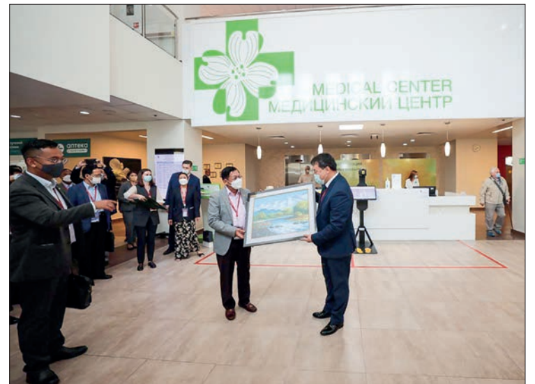
The Senior General presents the souvenir to the Medical Centre.

Finally, the SAC Chairman Prime Minister gave souvenirs to the Vice-President of the Medical Affairs of FEFU and the Director-General of the Medical Centre. The Medical Centre on the campus of FEFU covers 53,000 square metres and about 200 specialists, doctors and paramedics are working there. The FEFU Medical Centre has 14 medical departments and gives treatments for various kinds of diseases. — MNA