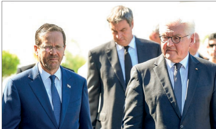
German President Frank-Walter Steinmeier (R), Israel's President Isaac Herzog (L) and Bavaria's State Premier Markus Soeder (background, C) attend a ceremony to mark the 50 th anniversary of an attack on the 1972 Munich Olympics, at the Fuerstenfeldbruck Air Base, southern Germany, on 5 September 2022.

West German police responded with a bungled rescue