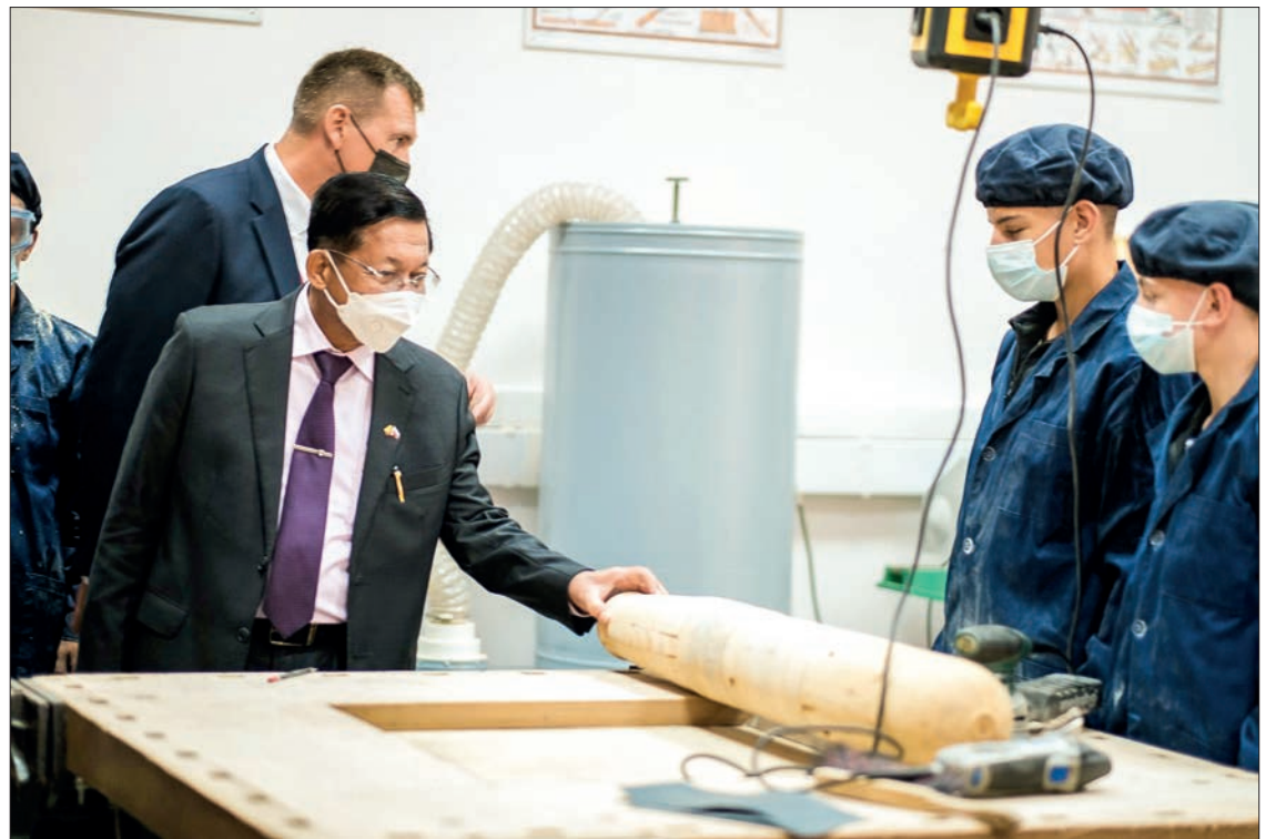
The Senior General looks into the teaching aid at the Makarov Pacific Higher Naval School.