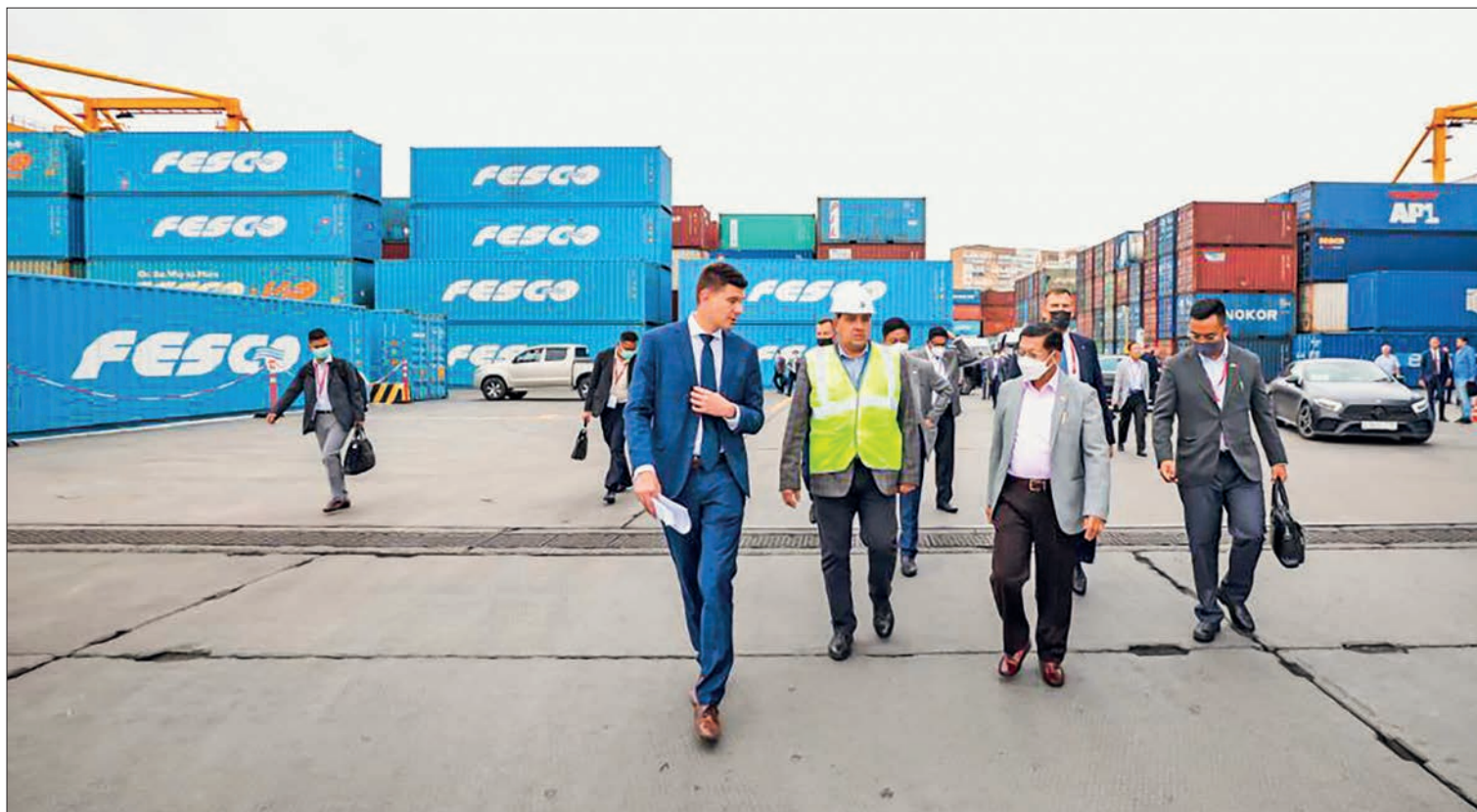
The Senior General pays observation tours at the Commercial Port of Vladivostok.

The Commercial Port of Vladivostok was built as the Russian Naval Headquarters in 1872. During World War I, the port was primarily used for military transport measures. In the Second World War, some cargo ships of foreign countries started docking at the port. In the 1950s, foreign vessels anchored there, and it was named the Commercial Port of Vladivostok in 1990. It is the largest port in the eastern part of the Russian Federation. — MNA