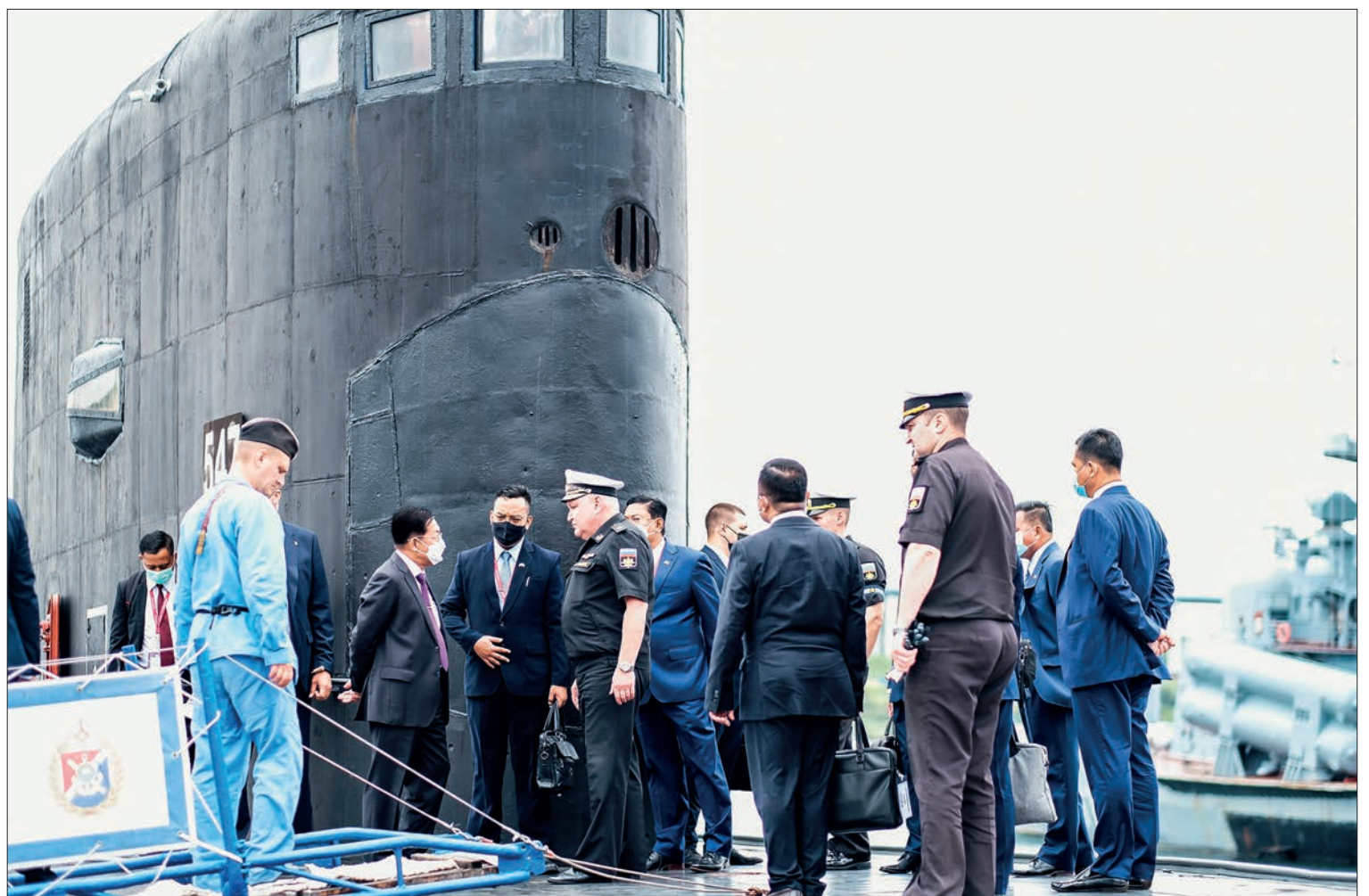
State Administration Council Chairman Prime Minister Senior General Min Aung Hlaing views round the Pacific Fleet Headquarters in Vladivostok yesterday.

The Senior General and party viewed systematic training in the classrooms with use of teaching aids and multimedia