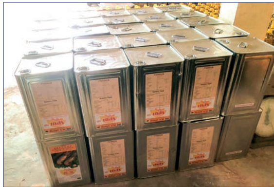
Seized illegal foodstuffs in Kayin State.