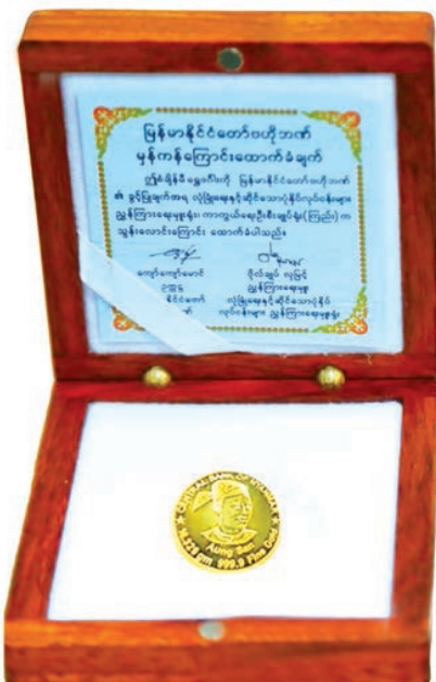
A one-tical fine gold coin issued by the Central Bank of Myanmar -CBM. (file photo)

Therefore, 12 arrests estimated at K169,090,480 were made on three consecutive days from 3 to 5 September, according to the Anti-Illegal Trade Steering Committee. — MNA