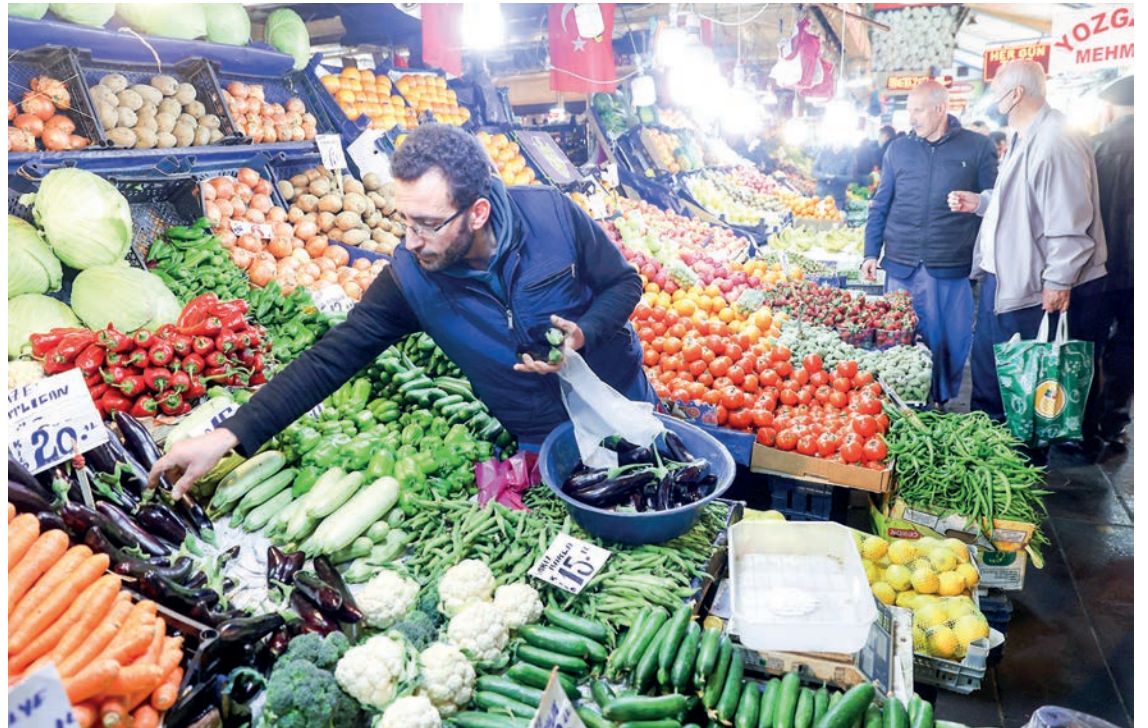
People shop at a vegetable and fruit market in Ankara's historic Ulus district on 14 April 2022.

Erdogan himself says prices will only start falling in January.—AFP