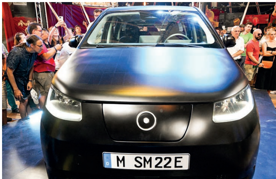
The Sion car, a solar electric vehicle (SEV) developed by Sono Motors, is surrounded by viewers in Munich, southern Germany, on 25 July 2022, during the unveiling of the final series production design.

GERMAN car sales rose in August, official figures published Monday showed, despite persistent supply bottlenecks which have led to hefty declines in recent months.