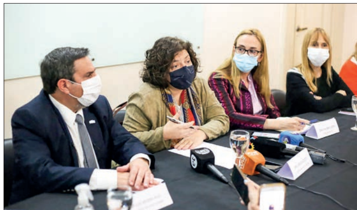
This handout picture released by the Health Ministry of the Province of Tucuman shows Health Minister Carla Vizzotti (2-L), the representative in Argentina of the Pan American Health Organization (PAHO) Eva Jane Llopis (2-R), and provincial Health Minister Luis Medina Ruiz (L) during a press conference in Tucuman, Argentina, on 3 September 2022.

Local officials said they are examining the clinic's water sup-