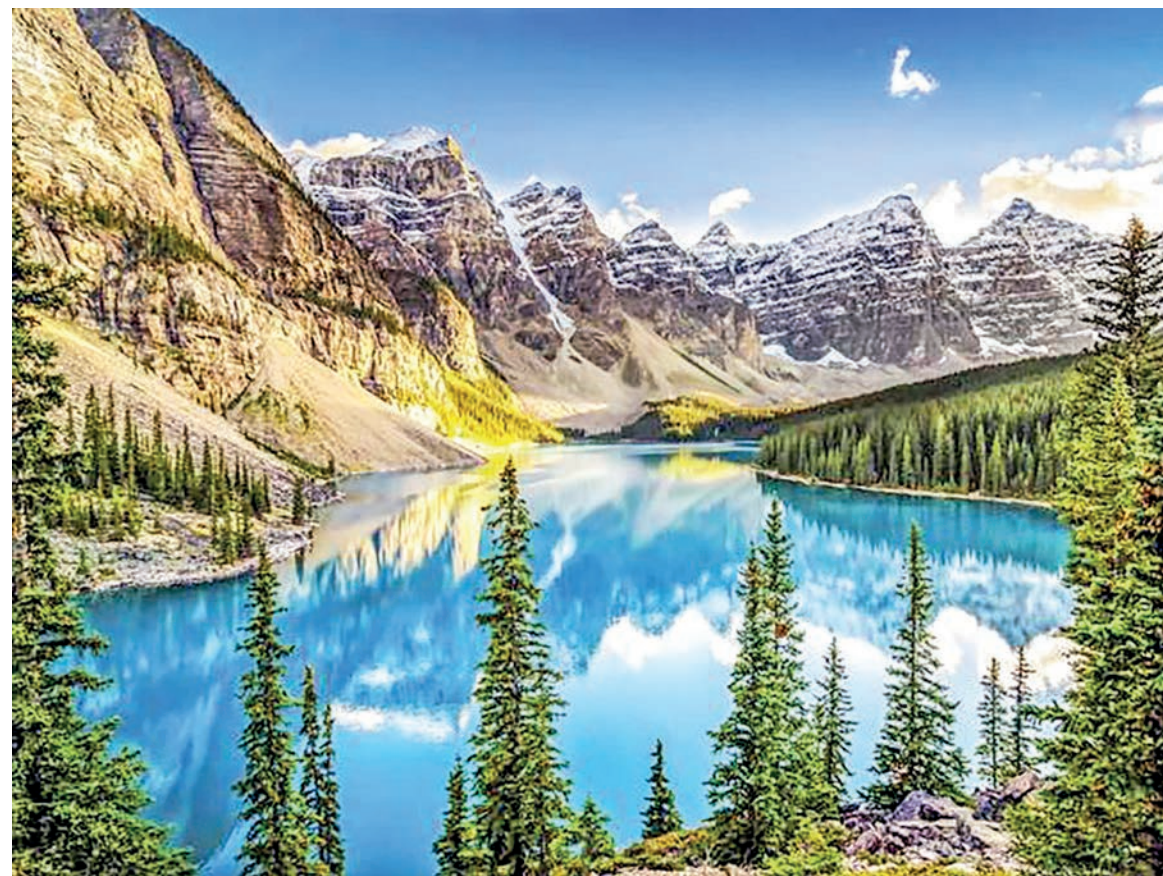
The study's findings revealed that people, especially those living in metropolitan areas, appeared to have developed fresh respect for nature and green spaces.

As such, all the people need to understand the efforts of the government which strive for declining the Covid-19 infection rate by providing vaccinations to the people and urging them to strictly abide by Covid-19 preventive measures and restrictions with conscientiousness on a daily basis without fail.