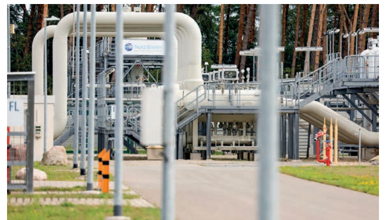
(FILES) In this file photo taken on 30 August 2022 facilities to receive and distribute natural gas are pictured on the grounds of gas transport and pipeline network operator Gascade in Lubmin, northeastern Germany, close to the border with Poland - the industrial infrastructure includes a receiving and distribution station for the Nord Stream 1 pipeline and is also the place. PHOTO: AFP

Russian gas giant Gazprom said Friday that the Nord Stream pipeline due to reopen at the weekend after three days of maintenance would remain shut for repairs after "oil leaks" were discovered in a turbine. Following the imposition of economic sanctions over the Kremlin's offensive of Ukraine, Russia has reduced or halted supplies to different European nations, causing energy prices to soar.—AFP