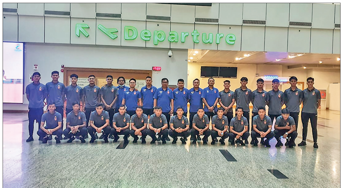
The Myanmar national U-20 team together with coaches are seen at the Yangon International Airport yesterday ahead of the 2023 AFC U-20 Asian Cup Qualifiers.

Myanmar team's Group A includes Kazakhstan, which will host the 2023 Asian U-20 final tournament, and Uzbekistan which has won direct qualification. So the results of playing against these teams will not be