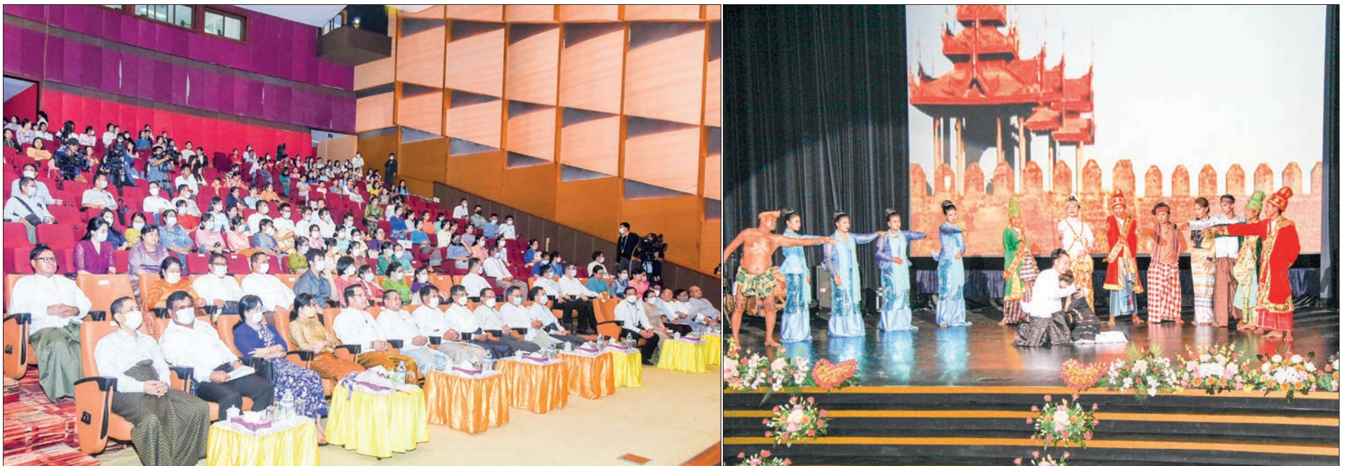
Union Ministers and guests watch the special performance on the Doorman Chief Dathta Story of the Buddha's birth stories at the MRTV in Nay Pyi Taw yesterday.

THE special performance of “Doorman Chief Dathta Story” of “Nipattaw La Zet Thabin Maha” (Birth Stories of the Buddha) programme of MRTV that will be broadcast soon was performed at MRTV in Tatkon of Nay Pyi Taw yesterday.