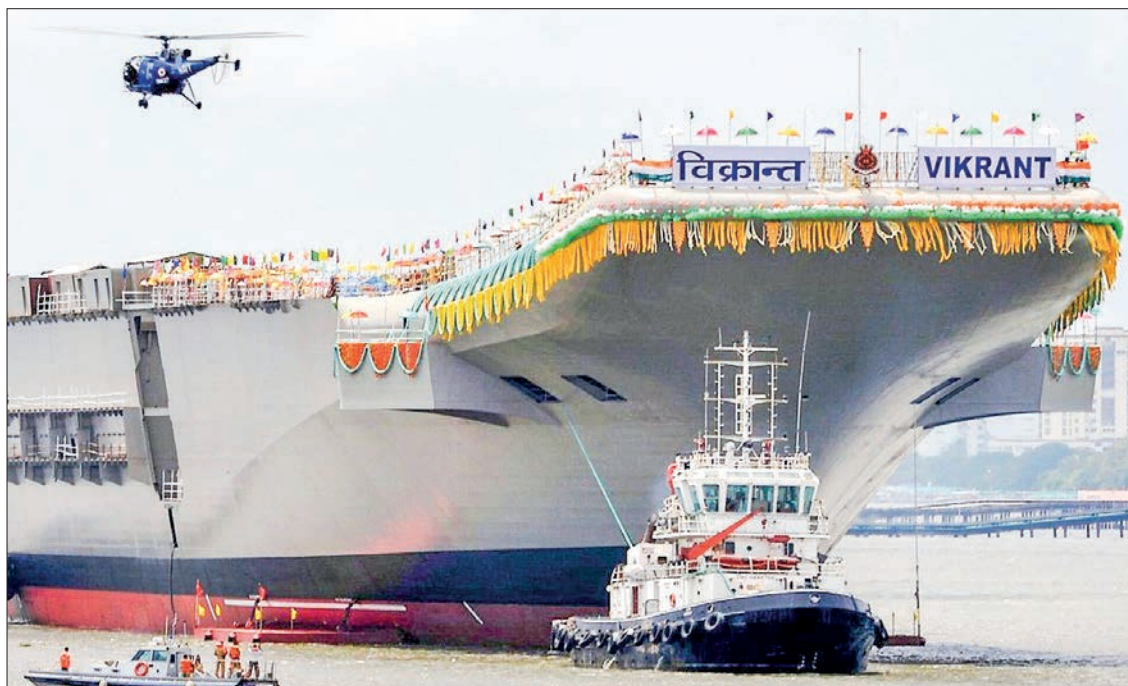
India's domestically-built aircraft carrier INS Vikrant.

INDIA commissioned its first domestically-built aircraft carrier, Vikrant, in the southern state of Kerala on Friday, boosting its defence capability amid China's growing assertiveness in the Indo-Pacific.