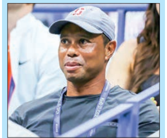
Tiger Woods saluted Serena Williams as “the greatest” after her third round exit at the US Open.

TIGER Woods and former first lady Michelle Obama hailed Serena Williams as “the greatest” on Friday as the tennis superstar headed into retirement.