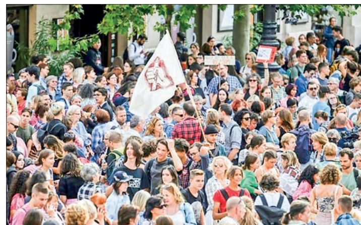
Thousands joined the protest in Budapest.

That compares with 90 per cent in other developed countries according to the OECD.—AFP