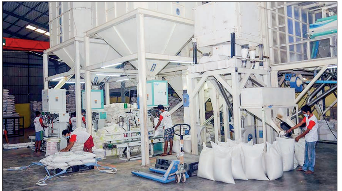
Workers are pictured putting rice into bags at one rice mill.

In the post-1970s, the rice species produced in Pathein were quite famous in the market, selling the first. The consumers liked these Pathein species because they produced a higher volume of rice compared to other species.