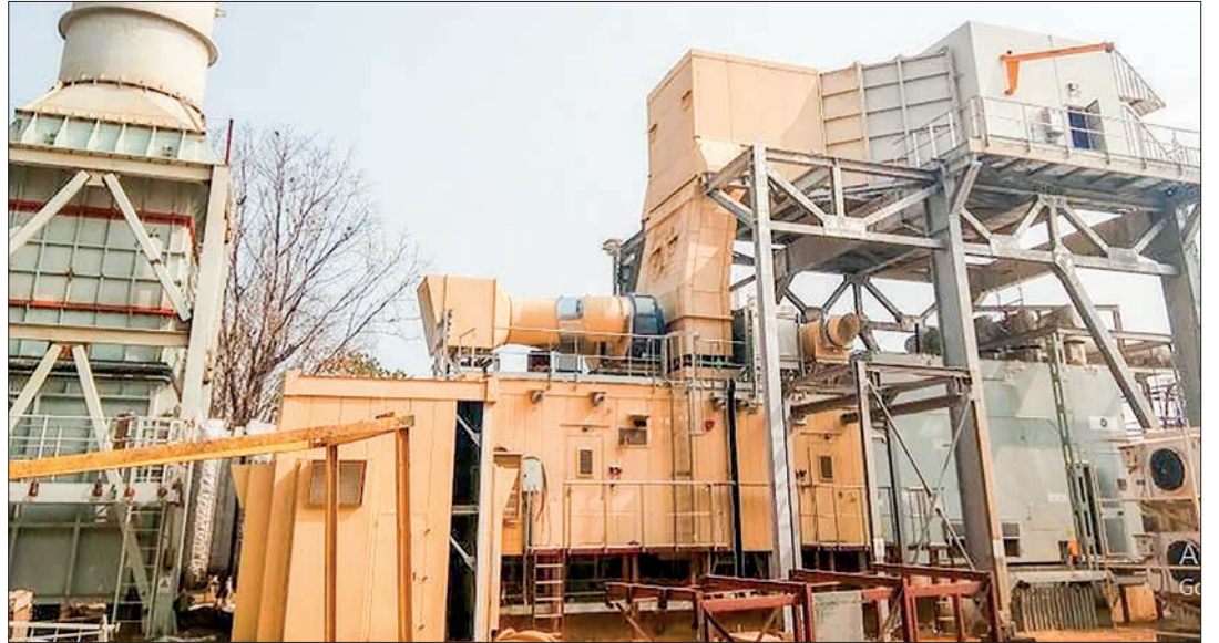
One electric power station.

MAINTENANCE works are underway at the Thakayta, Ahlon and Shweli power stations so temporary power outages will occur in some townships in Yangon Region, according to the Yangon Electricity Supply Cooperation.