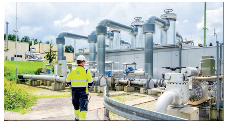
An employee of Uniper Energy Storage walks through the above-ground facilities of a natural gas storage facility in Bierwang, Germany, 10 June 2022.

When the weather turns colder, maximum room temperatures in public buildings and workplaces will be lowered from 20 degrees Celsius to 19 degrees Celsius. In places where heavy physical work is performed, temperatures may even be as low as 12 degrees Celsius.—Xinhua