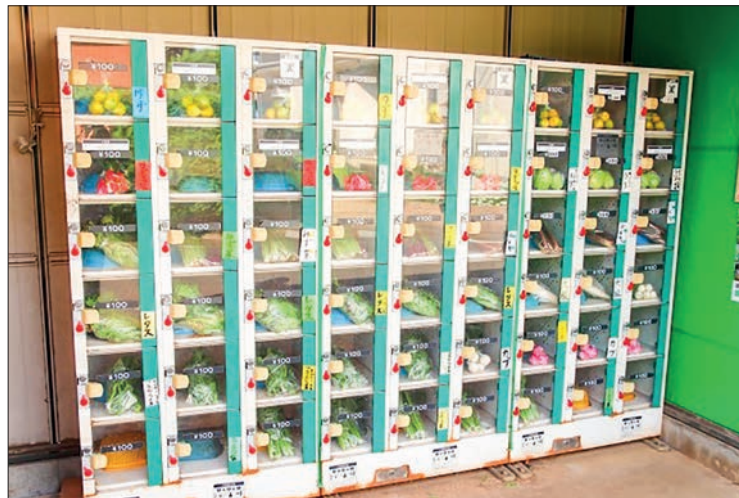
Farmers in Tokyo are selling fresh agricultural products to residents through such an automatic vending machine because producers and consumers are living close together.

The government has enacted several laws to encourage this activity. In May 2016, the Cabinet approved the Basic Plan