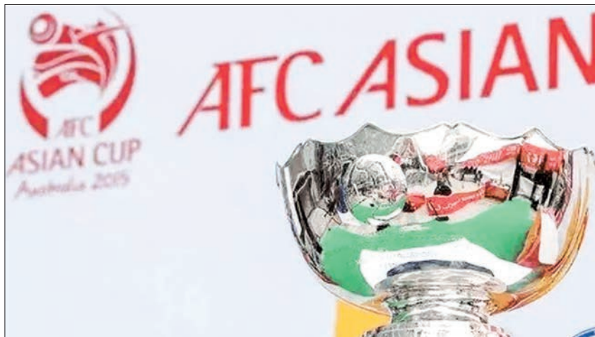
Australia said on Friday that it will not push ahead with a formal bid to host the 2023 Asian Cup, but is “strongly” interested in holding the women’s tournament in 2026.

But it “maintains its strong interest in bidding for the AFC Women’s Asian Cup 2026” and plans to submit a formal bid later this year. —AFP