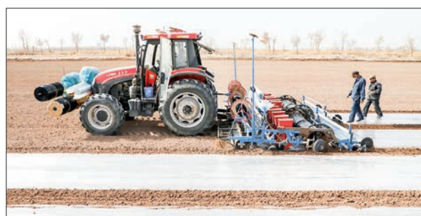
A farming tractor equipped with the Beidou Satellite Navigation System sows cotton in Aksu, Northwest China's Xinjiang Uygur Autonomous Region on 31 March 2022.

CHINA will step up its efforts to promote the de-