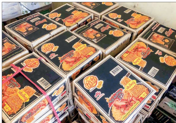
Confiscated illegal commodities in Kayin State.

On 3 September, an on-duty team at the Thanlwin Bridge (Hpa-an) Combined Checkpoint made inspections under the management of the Kayin State Anti-Illegal Trade Task Force.