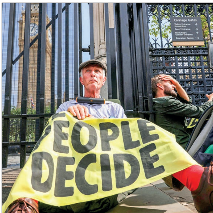
Climate change activists targeted the UK parliament, calling for the public to have more say over environmental policy.

MEMBERS of climate activist group Extinction Rebellion on Friday glued themselves to the Speaker's chair in the UK House of Commons, calling for a "Citizens' Assembly" to help shape environmental policy.