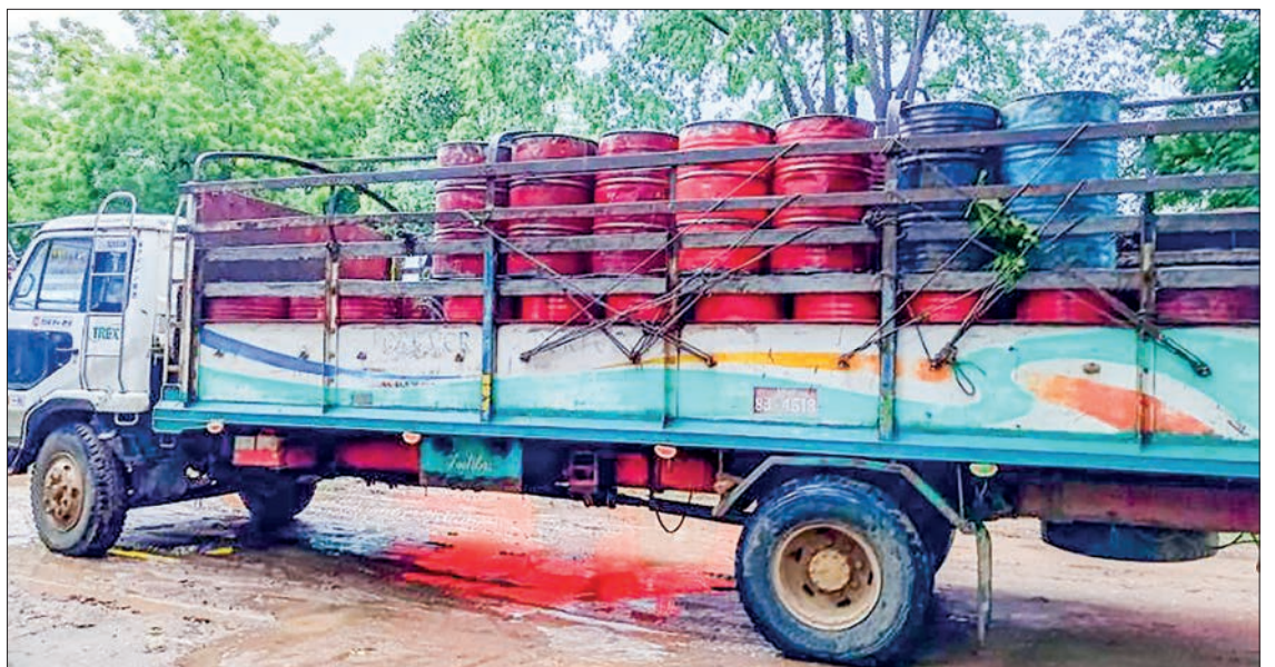
Seized illegal fuel oil in Sagaing Region.

In addition, an inspection team led by the Forest Department nabbed a total of 1.988 tonnes of illegal teak worth K656,040 in the 18-Mawkuu forest reserve on 2 September. The action was taken under the Forest Law.