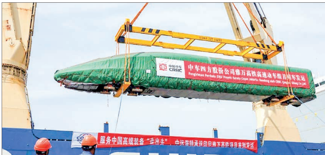
A high-speed electric passenger train, customized for the Jakarta-Bandung high-speed railway, is loaded on a vessel in Qingdao Port of east China's Shandong Province, 18 August 2022.

Initially, both China and Japan were in competition for the project with Japan insisting on a government guarantee from the Indonesian side.—Kyodo