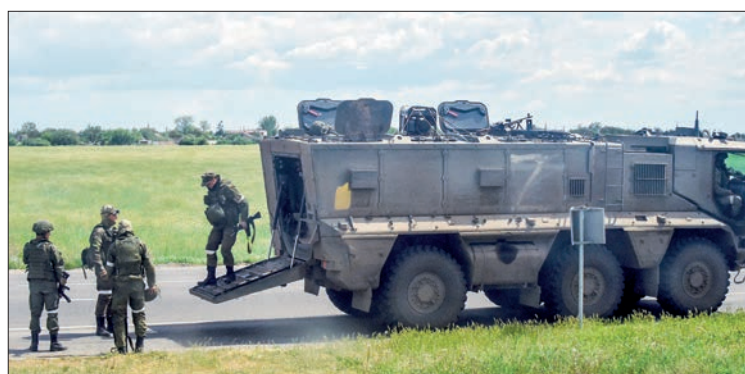
Fierce battles have been reported as Ukraine tries to retake the Russian-occupied southern Kherson region Russian servicemen on the roadside in Kherson region, Ukraine.

to care for Ukrainian patients waiting for evacuation flights, officials said Thursday.