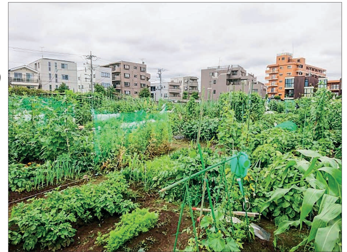
Farmland used by residents in Tokyo is so popular that it is full of various crops.

agriculture from the standpoint of the side that sells ingredients in the market and the side that manufactures processed foods, it is not possible to harvest a large amount of a single ingredient, so it is necessary to purchase from various sources. In other words, it is time-consuming and costly. Japan’s food self-sufficiency rate has fallen significantly because importing food from foreign countries is cheaper. As a result, importing food incurs huge transportation costs, and food mileage has become the largest in the world. Food mileage refers to the “Food Miles” movement, a citizen movement, that was active in the UK, and we are conscious of [the amount of food × transportation