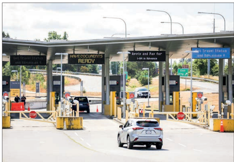
Border testing is an important tool in Canada's detection and surveillance of COVID-19. On 20 March 2020, Canada and the United States imposed border restrictions on all non-essential travel across the Canada-US border.

CANADA confirmed 20,843 new COVID-19 cases for the week of 21-27 August, the Public Health Agency of Canada (PHAC) said on Friday.