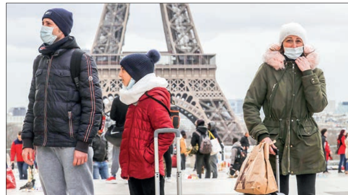
People walk near the Eiffel Tower wearing protective face masks amid the outbreak of COVID-19, the new coronavirus, on the Trocadero esplanade in Paris, on 10 March 2020.

"As the virus continues to mutate at high speed, we keep track of all new variants to be able to anticipate on variants of concern," Cavaleri said. "In particular, the BA.2.75 currently spreading in India needs to be carefully monitored."—Xinhua