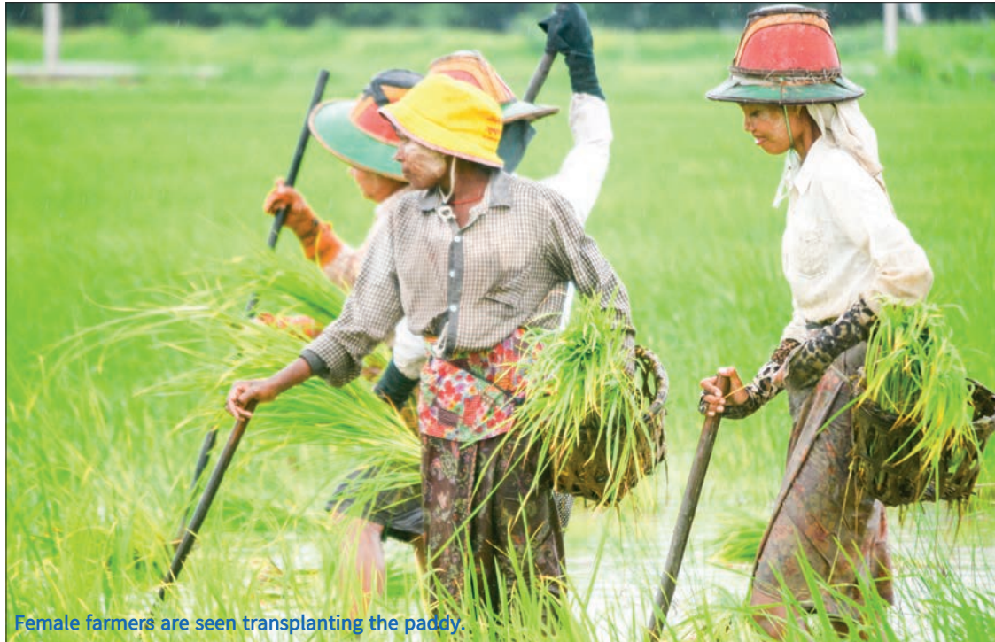
Female farmers are seen transplanting the paddy.

Beyond 1962, when rice and paddy trading was nationalized, private entrepreneurs could not be engaged in this business. Nevertheless, the rice mills were not nationalized. Therefore, the paddy can be milled by private entrepreneurs, and for almost three decades, the privately-owned rice mills were assigned the duty to mill the paddy for both governments' prescribed quota