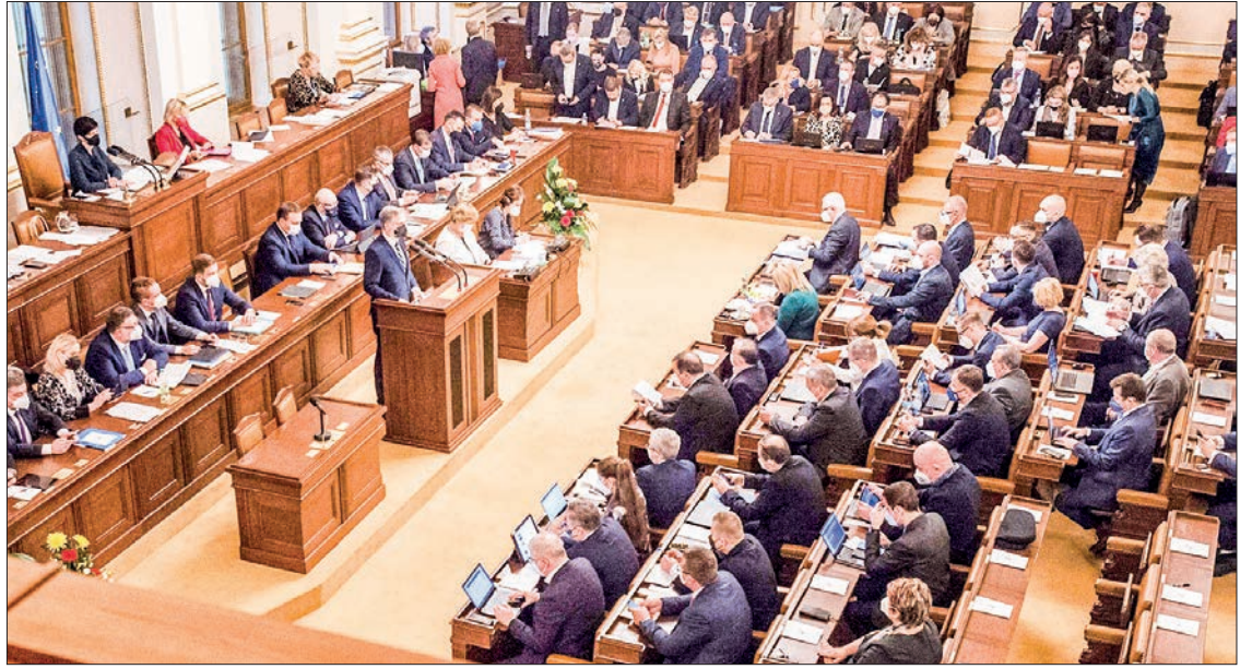
Czech Prime Minister Petr Fiala delivers a speech in the Czech Parliament in Prague, 12 January 2022.

The current Czech government, comprised of a centre-right coalition headed by the Civic Democratic Party (ODS), won its mandate last October after a tight election against the former coalition government led by ANO.—Xinhua