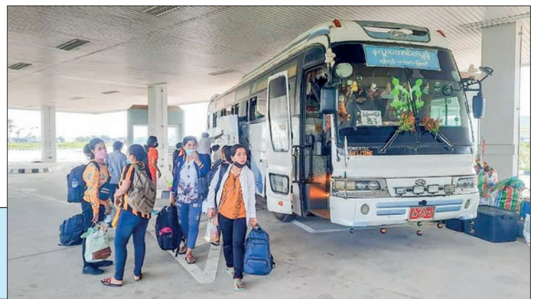
The picture shows Myanmar nationals who returned from Thailand.

back to their respective townships only after a 10-day quarantine in Myawady trade zone and Maekanel until no infection is detected. — TWA/GNLM