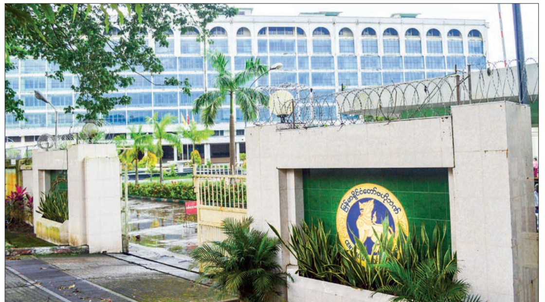
The office of the Central Bank of Myanmar-CBM (Yangon Branch).

ACCORDING to foreign currency dealers, the central bank's reference remittance rate is set at K2,100 per US dollar, but in the foreign exchange market, it is around K3,500 per dollar.