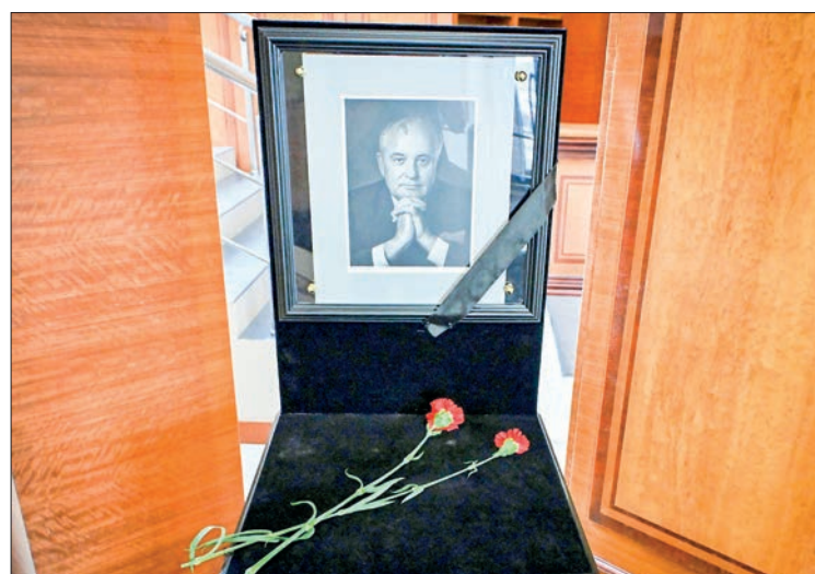
Gorbachev— affectionately known in the West as Gorby — died on Tuesday at the age of 91.

him for letting go of the Soviet empire and with it the country's position as a global power. But in the West, Gorbachev is viewed as the man who ended the Cold War and lifted the Iron Curtain — achievements recognized by a Nobel Peace