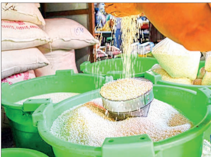
Pawsan rice is measured in a traditional way at one rice outlet.

Depending upon the water type, soil type and paddy prices, the quality of rice varies from species to species. The Ngakywe Hmwe, Kaukkyi and Taungpyan produced in the Delta Area sold very well in the market. Nonetheless, this popularity has faded gradually for a lack of properly maintaining the quality, for not cultivating at the right time and for not using the pedigree seeds. ▶▶▶