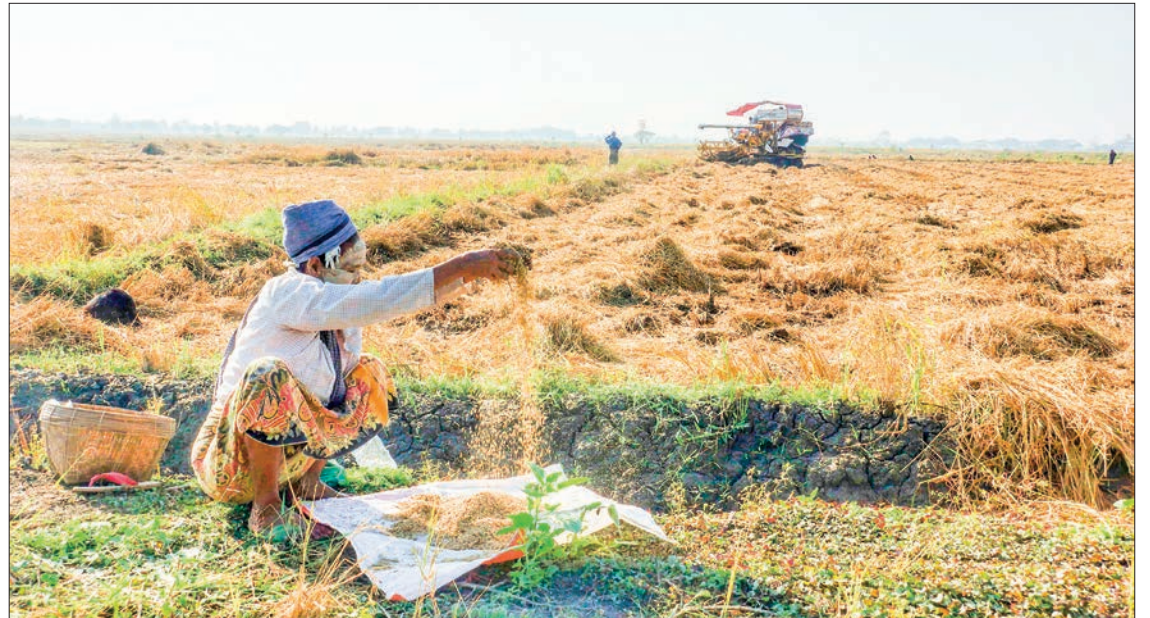
A female farmer is still manually working while a rice combine harvester is being used on the paddy field.

As for the home delivery businessmen, they have the rice