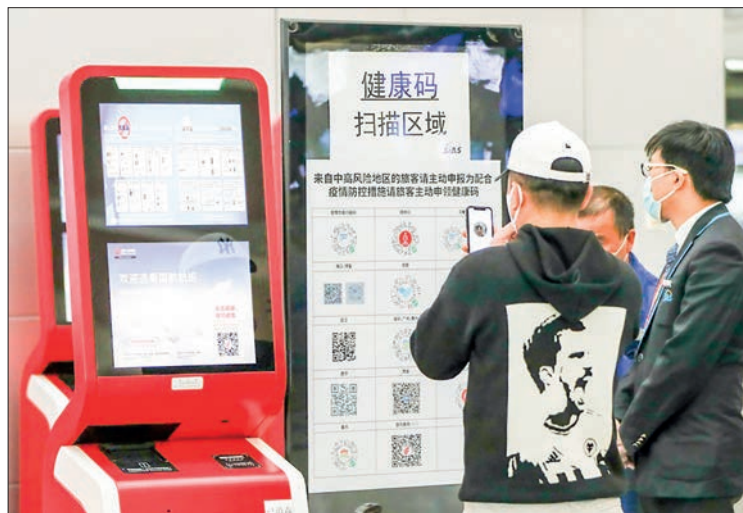
Passengers perform self-service personal health confirmation at Terminal 2 building of the Shanghai Pudong International Airport in east China's Shanghai, 24 November 2020.

Since the outbreak of the COVID-19 pandemic, China has given full play to IT application and made its digitalized anti-pandemic measures a highlight in the country's re-