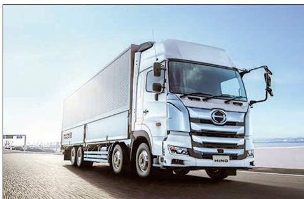
The decision was made after it re-examined its overseas operations and the business environment and was not related to Russia's invasion of Ukraine or a series of recent scandals.

A plant in Khimki, Moscow Oblast, scheduled to start operations