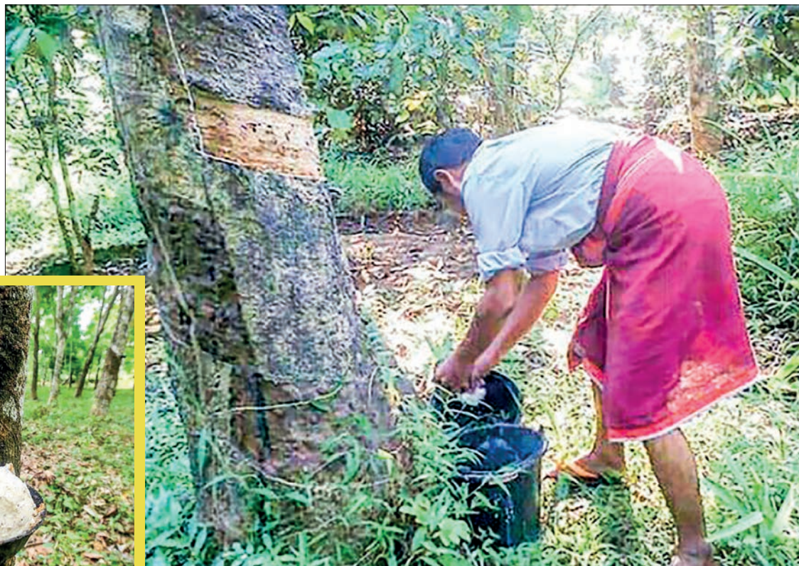
A Myanmar worker taps rubber latex from the rubber tree.

It shipped 1,410 tonnes of rubber to China while over 120 tonnes to Malaysia and 630 tonnes to India. The rubber demand from Thailand is also high and they purchase the most volume of rubber via the border