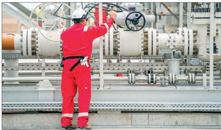
Russian Deputy Prime Minister Alexander Novak on Thursday said Russia would not supply oil and petroleum products to those countries that support the price caps.

Today's action will help deliver a major blow for Russian finances and will both hinder