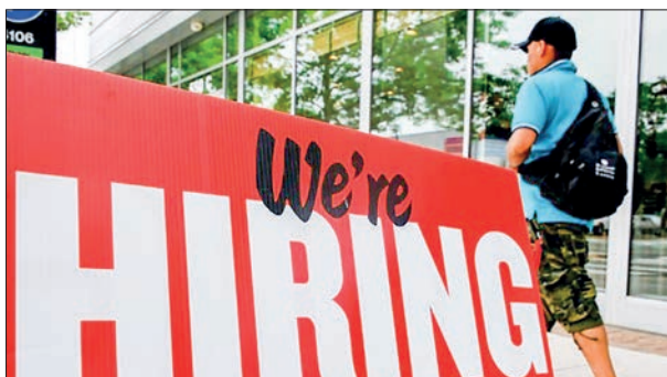
A solid but not too strong monthly US jobs report had initially lifted US stocks before markets reversed course on Russian gas company Gazprom's announcement to keep a key pipeline off-line.

US stocks had initially gained following August jobs data that showed employment growth moderating and unemployment ticking higher in a report seen by investors as lessening pressure on the Federal Reserve to increase interest rates. But markets did a 180-degree turn mid-