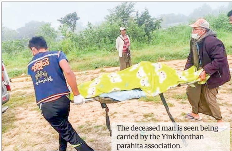
The deceased man is seen being carried by the Yinkhonthan parahita association.

The body was carried to the Ottwin Hospital with the help of the Yinkhonthan parahita (welfare) association at 6 am, and the investigation of death was opened by the relevant police station. — TWA/GNLM