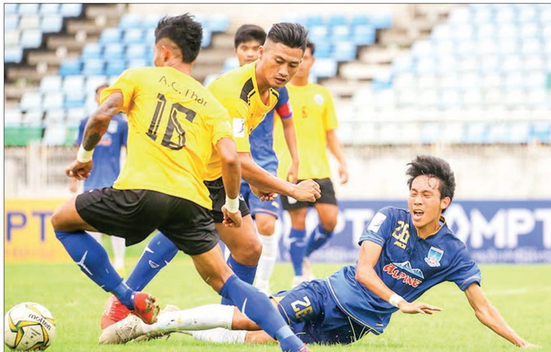
ISPE FC players (yellow) pass over Yadanabon players (blue) during their final match of the Myanmar National League 1 st round match at Thuwunna Stadium in Yangon.