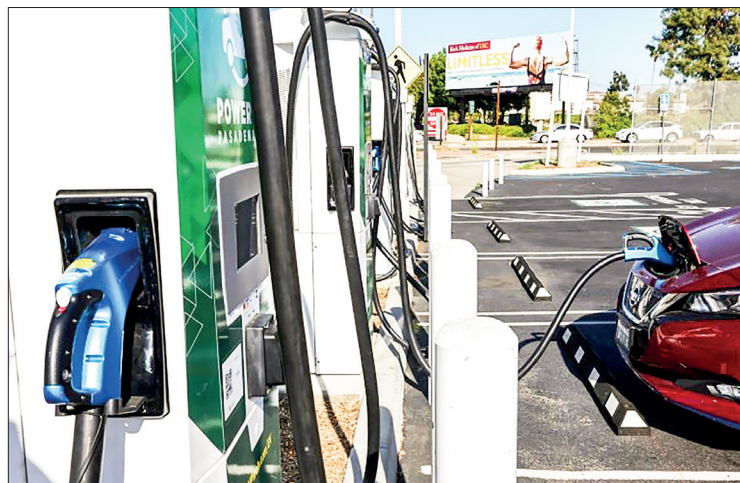
California's environmental policies, including ones around car emissions, can, in effect, set national standards as the state's 40 million people make up the United States' largest market.

“This is monumental,” Sperling told CNN. “This is the most important thing that CARB has done in the last 30 years. It's important not just for California, but