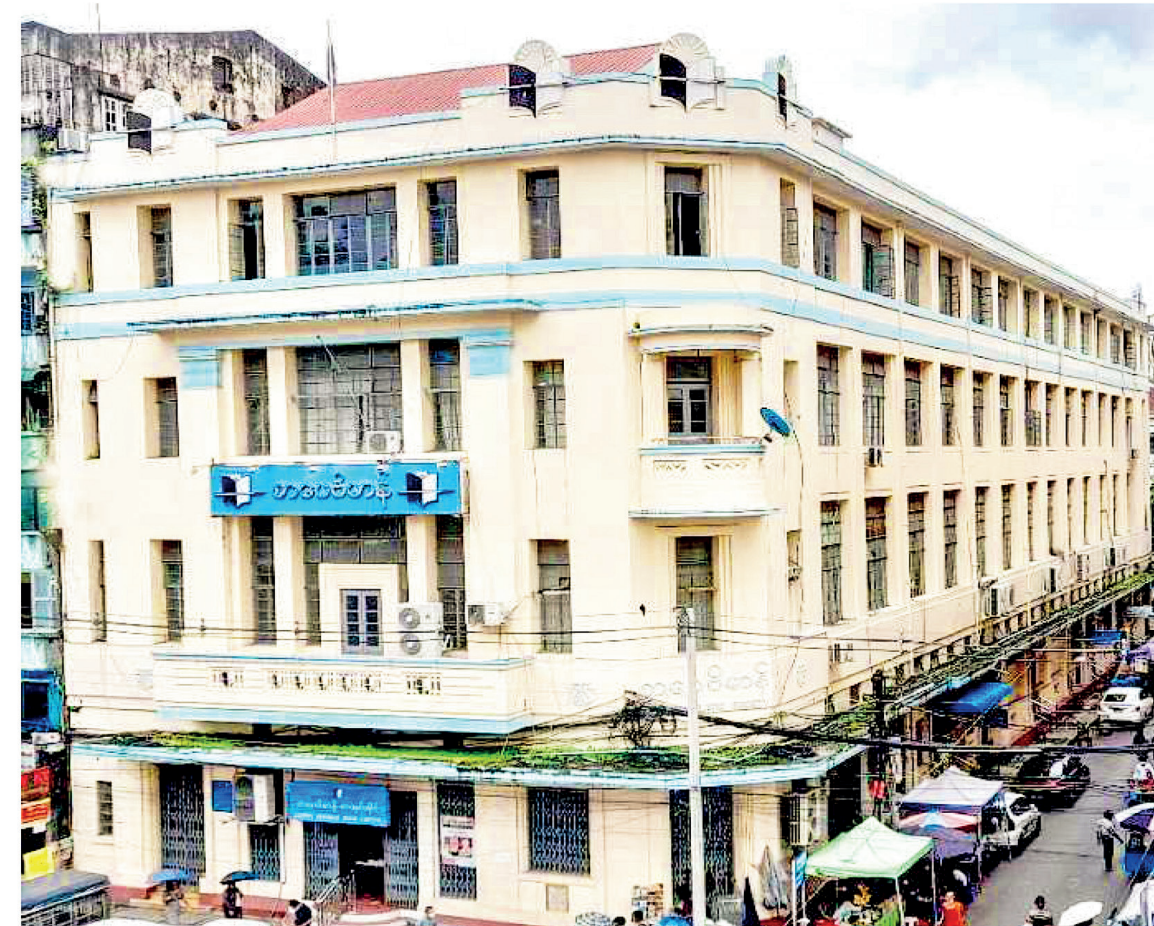
Sarpay Beikman is located at 529-531, Merchant Rd., Corner of 37 th St., Kyauktada Tsp, Yangon.

An integral part of the Library was a Children's Branch, situated on the ground floor of the Institute building at Merchant Street. Children's Library programmes were presented every Saturday and included film shows, easy competitions, debates, magic painting competitions, indoor games,