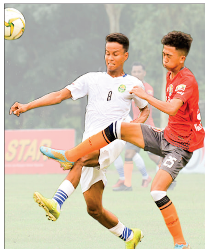
A Mawyawady FC player (red) poises to kick the ball during their Myanmar National League Week II match against Dagon Star FC at Thuwunna Training Ground I in Yangon on 25 August 2022.

MAWYAWADY FC played a goalless draw match against Dagon Star FC in the Week-4 of Myanmar National League-2 match at Thuwunna Training Ground I in Yangon yesterday.