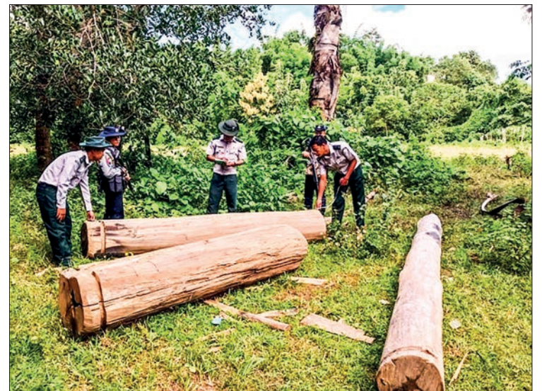
Officials check confiscated illegal teak logs in Bago Region.