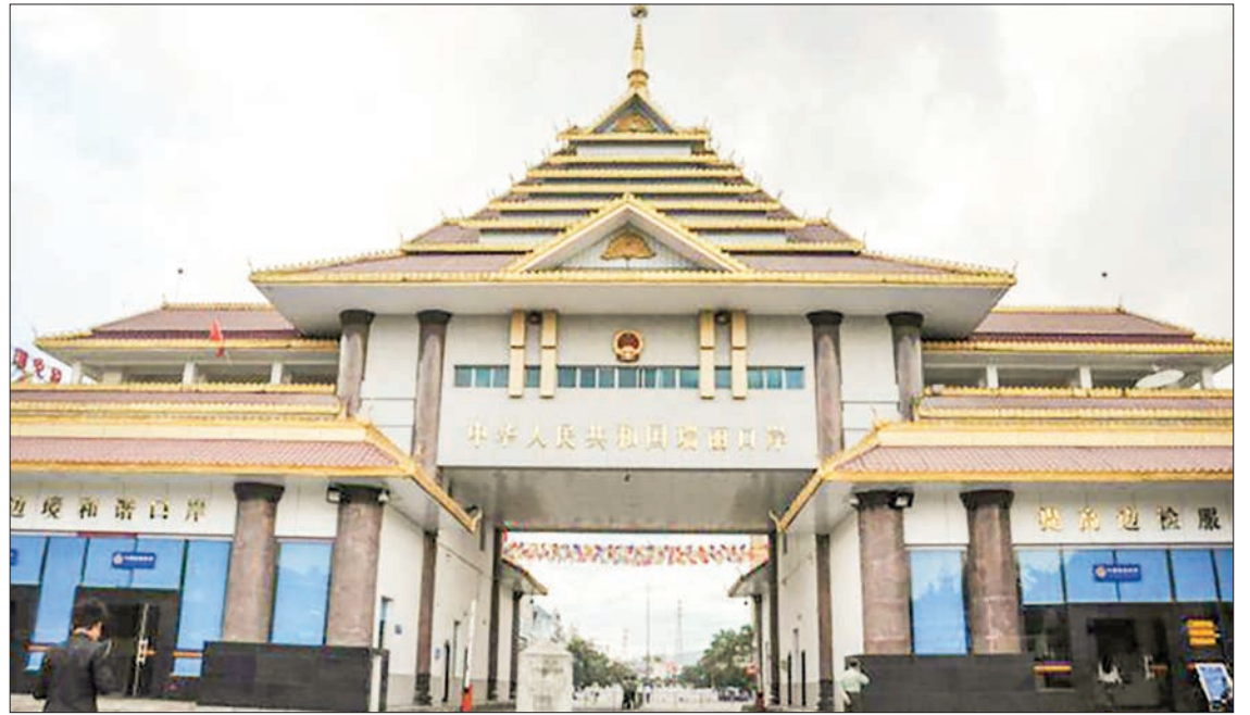
The Kyinsankyawt-Wang Ding border post.

China-Myanmar border trade from January to 5 Au-