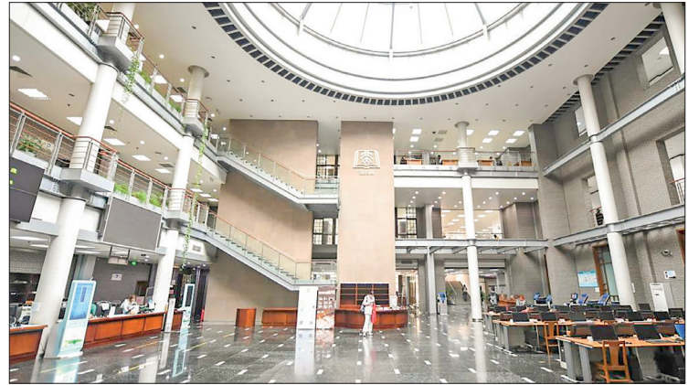
A wide range of courses is offered at Peking University to over 40,000 students including more than 6,000 international students. Photo taken on 21 April 2022 shows the interior view of Peking University Library in Beijing, capital of China.

According to the Japan Chamber of Commerce and Industry in China, at least 220 Japanese students who have enrolled in Chinese universities have not been able to travel to China due to visa restrictions.—Kyodo