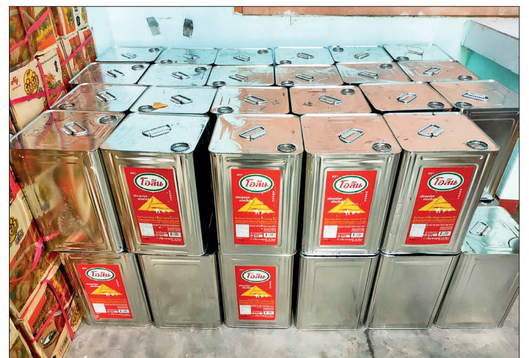
Seized foodstuffs in Bago Region.

Afterwards, on 23 August, an inspection team conducted unexpected inspections at the Phayagyi Tollgate.