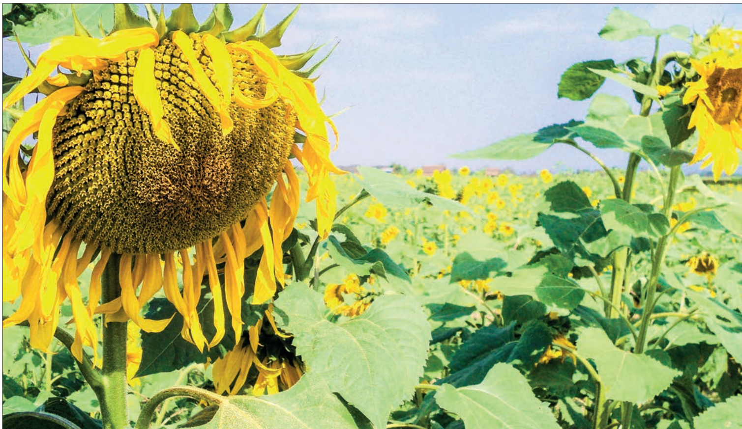
A sunflower plantation was seen in Taikkyi Township in 2021.