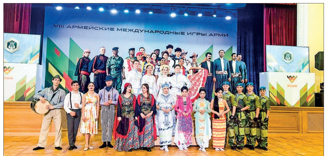
Myanmar Tatmadaw Cultural Troupe pose for the documentary group photo at the event.

ing and music awards in 2019; the third prize in dancing event, the best Russian singing performance award in 2020, the third prize in single Russian singing contest, the first prize in Traditional Costume Performance and second People's Choice Award in 2021.