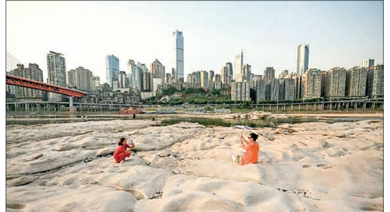
Southern China has recorded its longest continuous period of high temperatures since records began more than 60 years ago. PHOTO: AFP

The worst-affected area — the Yangtze river basin, stretching from coastal Shanghai to Sichuan province in China's southwest — is home to over 370 million people and contains several manufacturing hubs including the megacity of Chongqing. — AFP