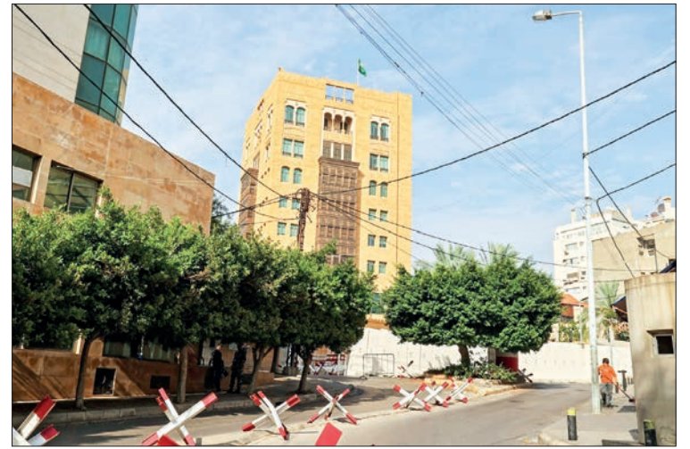
Lebanese authorities will investigate an audio recording shared online threatening to attack the Saudi Arabian embassy in Beirut.

The police identified the man only by his initials, but a security source told AFP it was dissident Maneh al-Yami.—AFP