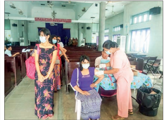
A local in Toungoo Township, Bago Region gets COVID-19 vaccine shot on 25 August.

to 978 students from twenty-six townships in Ayeyawady Region, 264 students from Kyaukphyu and Thandwe Townships in Ra-