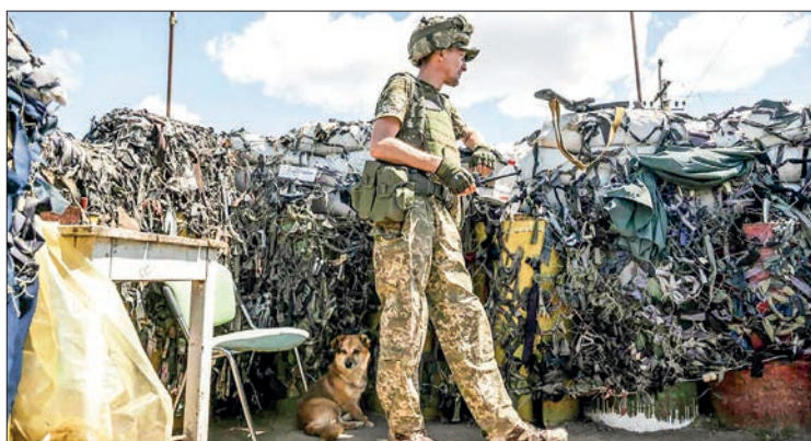
A Ukrainian soldier, accompanied by a dog, keeps position on the front line in Mykolaiv region on 23 July 2022, amid the Russian invasion of Ukraine.

SIX months since the start of Russia's invasion, residents of