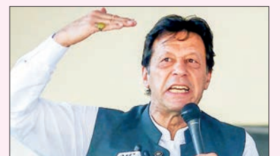
Pakistan's former prime minister Imran Khan was granted bail Thursday on charges brought under the country's anti-terrorism act, a party official said, leaving him free to continue his nationwide rallies calling for early elections.

But the former cricket star retains widespread support, staging mass rallies railing against the establishment and Prime Minister Shehbaz Sharif's government, which he says was imposed on Pakistan by a "conspiracy" involving the United States.—AFP