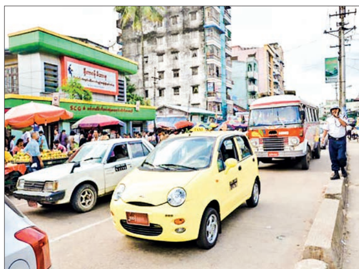
Taxis are seen in Yangon City.

Gas-fuelled taxi drivers have to pay K16,000 to the owners per day while Octane-fuelled taxi drivers have to pay only K8,000. Although the taxi drivers who