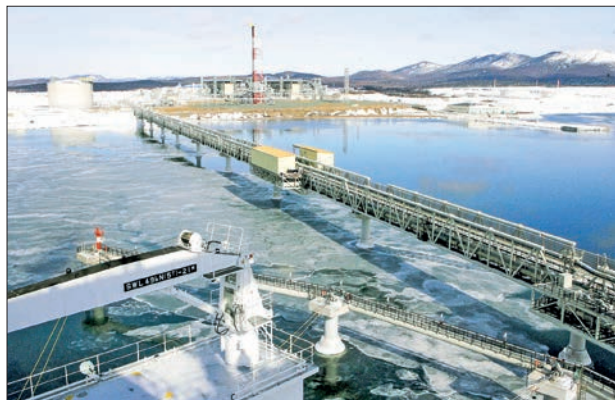
File photo taken February 2009 shows pipes extending from a liquefied natural gas terminal (back) in Sakhalin Oblast, Russia, to a carrier ship.

JAPANESE trading houses Mitsui & Co. and Mitsubishi Corp. plan to retain their interests in the Sakhalin 2 oil and gas project and will notify Russia by the end of the month, Mitsubishi and sources familiar with the matter said Thursday.