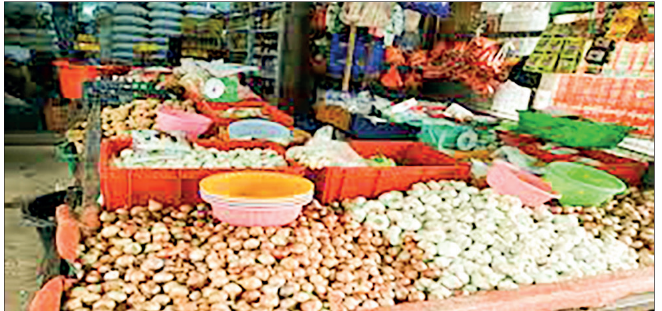
A grocery store is pictured retailing a range of commodities.

SOME commodities prices declined on 25 August although the kitchen budgets continued rising in recent days, the Global New Light of Myanmar (GNLM) quoted U Kyaw Lwin, a grocery retailer from Nyaungpinlay Market, as saying.