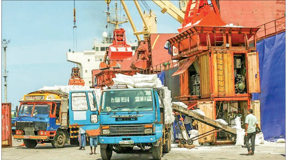
Trucks carrying fertilizer arrive at a port in Colombo. Sri Lanka has been experiencing acute shortages of a range of goods.

A delegation from the International Monetary Fund was due on Wednesday to continue talks with Sri Lankan officials on a bailout.— AFP