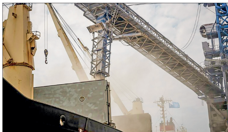
The first UN-chartered vessel, MV Brave Commander, loads more than 23,000 tonnes of grain to export to Ethiopia, in Yuzhne, east of Odessa on the Black Sea coast, on 14 August 2022.

"Thanks to intensive international cooperation, Ukraine is on track to export as much as four million metric tons of agricultural products in August,"