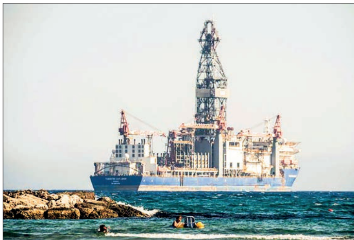
A drilling ship is seen off the Cypriot coastal city of Larnaca.

A new gas discovery off Cyprus could speed up exploitation of untapped resources and help se-