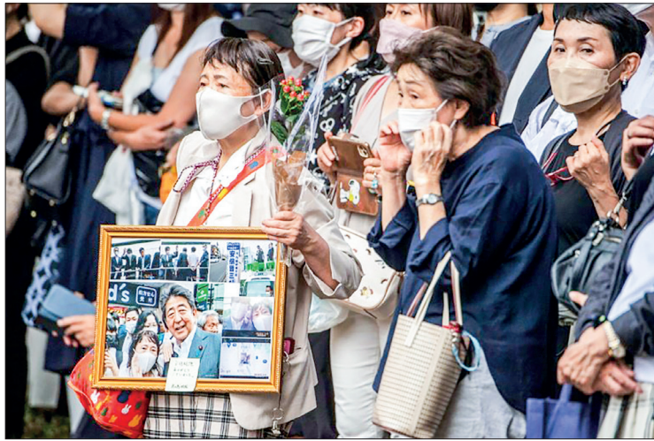
Shinzo Abe was Japan's longest-serving prime minister.

In announcing the results of its review of the case, the