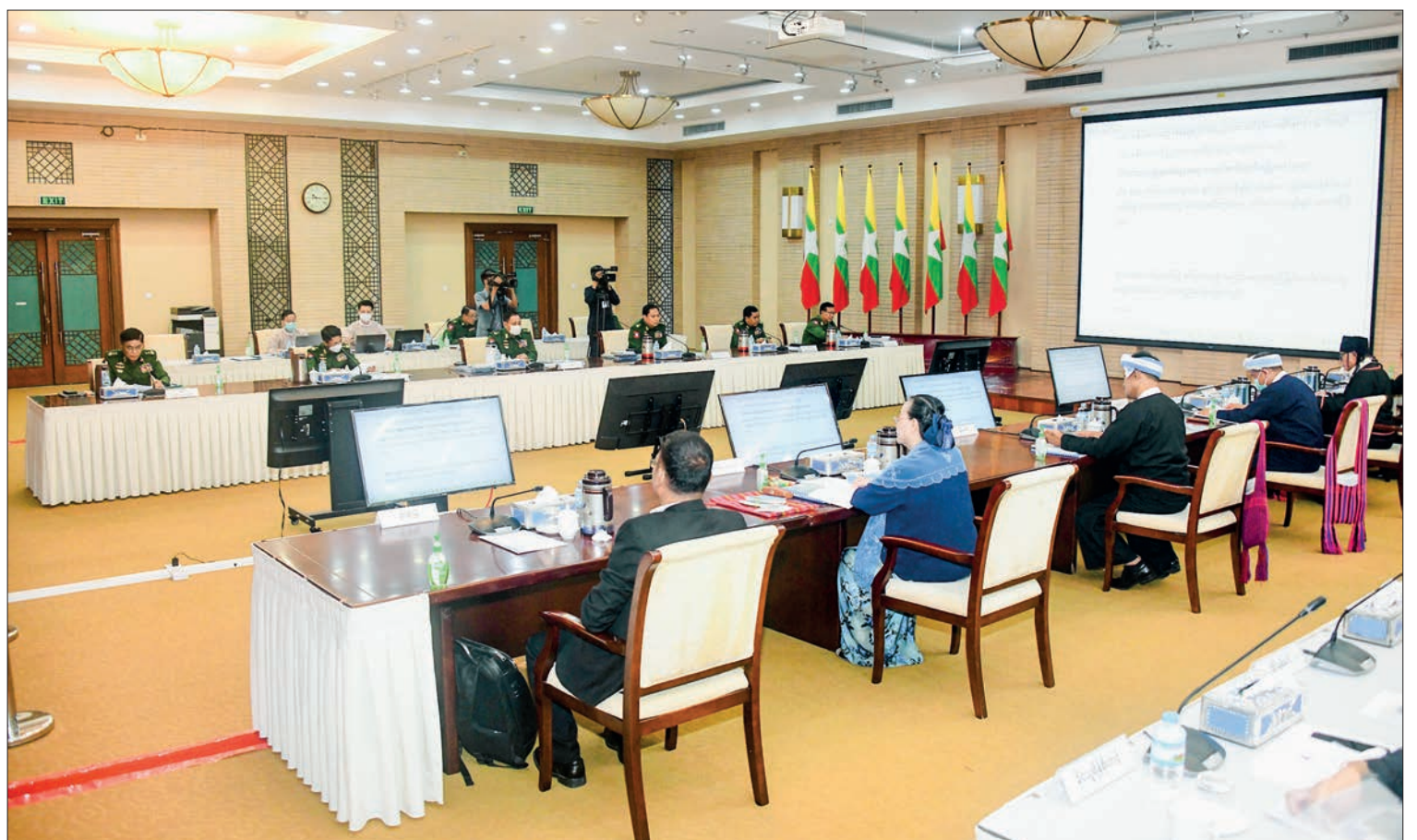
The third-day meeting between the State Peace Talks Team and the delegations from the PNLO, LDU and ALP is in progress yesterday.