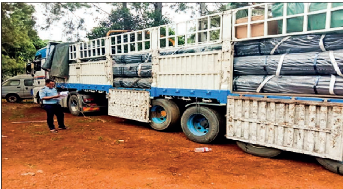
Confiscated illegal commodities in Shan State.

A combined on-duty team made inspections at the 16 th -Mile Kyaukchaw Checkpoint of Mandalay Region and captured 170 litres of restricted chemicals – suspected Toluene liquid – worth K2,380,000 from a Toyota HiAce car (approximately K35 million) and K12,500,000 worth of industrial materials and consumer goods that were not declared in the Import Declaration (ID) from a Nissan Diesel car (approximately K13 million). The action was taken under the Customs Procedures.