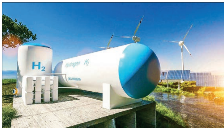
Hydrogen is an all-rounder and can be used in many different ways. It is not only an energy carrier, but also used as a raw material for industrial purposes.

"We cannot as a world continue to rely on authoritarian countries that will weaponize energy policy, as Russia is, that don't concern themselves