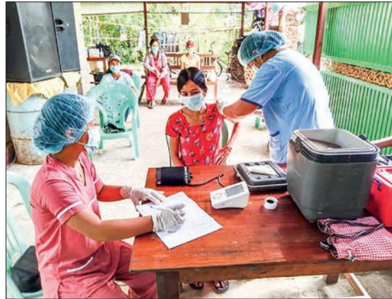
A local in Kangyidaunt Township, Ayeyawady Region receives a vaccine for COVID-19 on 25 August.

Similarly on that day, healthcare officials gave the vaccines