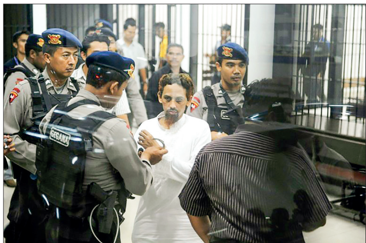
Umar Patek was sentenced to 20 years in jail over acts of terror related to the 2002 Bali bombings.

ALMOST two decades after the Bali bombings left Thiolina Ferawati Marpaung with permanent eye injuries, news that one of the masterminds could be released early has caused fresh trauma.