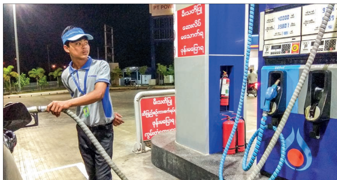
A petrol boy is pictured filling fuel oil into a vehicle.

The Central Bank of Myanmar raised the reference exchange rate for a dollar from K1,850 to K2,100, whereas the exchange rate against the US dol-