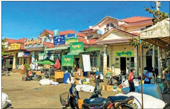
Highway bus ticket sale counters are seen in Nay Pyi Taw.

"We, gate officials fill the name of passenger and CSC no in the seating plan sheet and show it to officials along the trip. Now, we have to sell tickets after recording the personal data," said an in charge of the bus station.