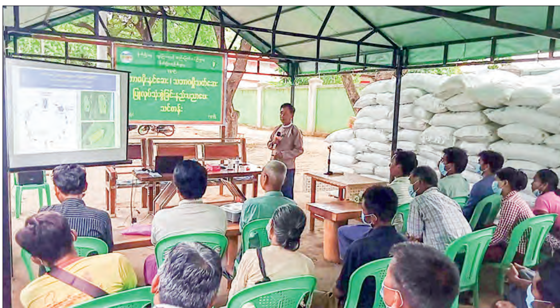
Farmers are pictured attending the fungicide-making training.

“The farmers are entitled to purchase two bags of urea fertilizer per paddy acre and half of the bag per acre of cotton and sunflower. The township