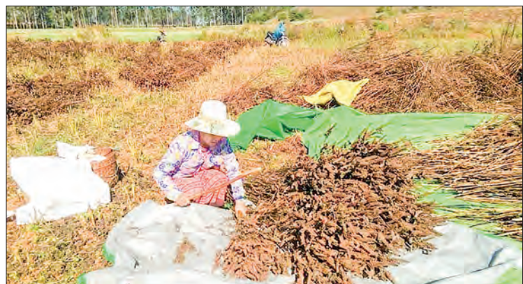
On 18 August, the sesame prices moved in the range of K75,600 and K92,300 per basket depending on varieties.

On 18 August, the sesame prices moved in the range of K75,600 and K92,300 per basket depending on varieties.