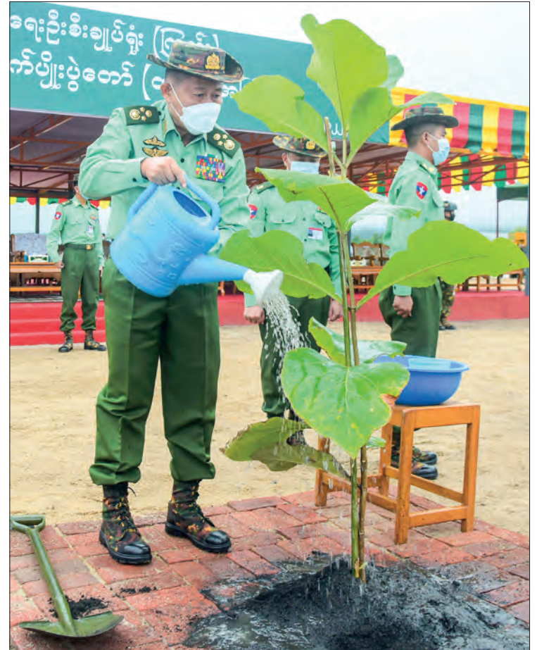
The Vice-Senior General waters onto the sapling.