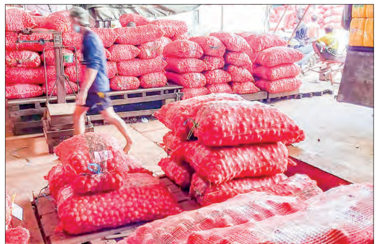
Stacked onion bags are seen at a warehouse in the Bayintnaung Commodity Wholesale Market.

About 100,000 visses of onions are daily supplied to Yangon markets. The highest prices of onions in regions and states other than Yangon is K2,500 per viss of onion from the Seikphyu area and K3,000 from the Pakokku area.