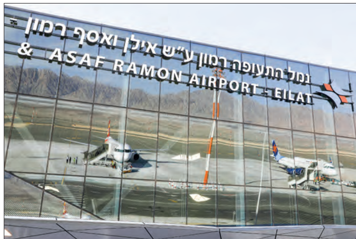
(FILES) A file photo taken on 21 January 2019 shows a partial view of the international Ramon Airport, located some 18 kilometres north of the southern Israeli Red Sea resort city of Eilat.

A spokeswoman for the Israel Airports Authority had earlier