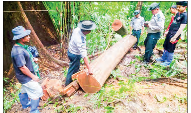
Officials check a teak log.

On 22 August, a combined on-duty team under the supervi-