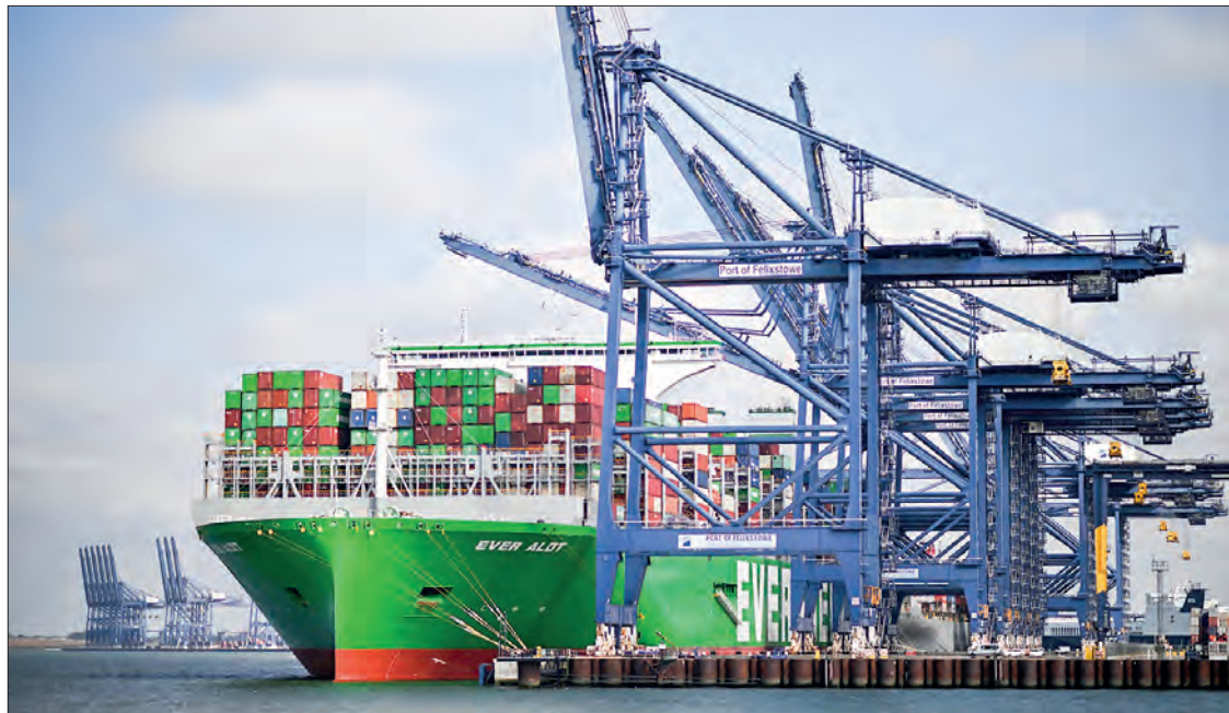
Piles of containers are pictured on the deck of the Ever Alot container ship docked at the empty UK's largest freight port, in Felixstowe, on 22 August 2022, during a dock workers eight-day strike over pay.

"We've been asking for a minimum of the rate of inflation," Morton said.