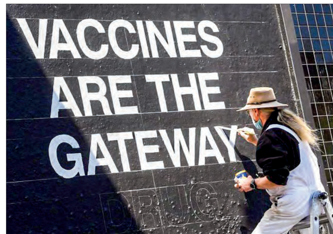
More than 95 per cent of people over the age of 16 are fully vaccinated in Australia, where few people now wear a mask or take measures to socially distance.

"So, rather than constantly developing variant specific vaccines, what we need is a 'universal' one which attacks essential, unchanging parts of the virus that exist in all those variants."