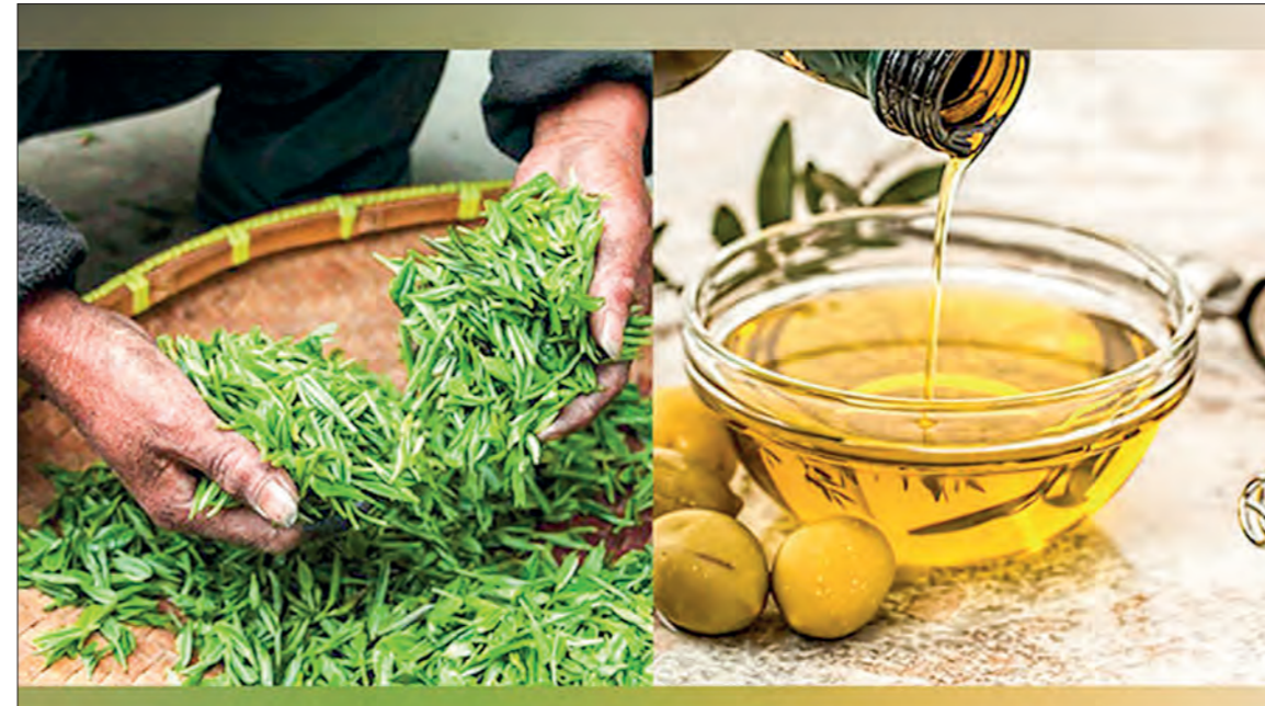
All three compounds are already used as active substances in existing drugs.

For the experiments, PLpro was mixed with each of the 500 natural substances in a solution, giving them the chance to bind to the enzyme. It is not possible to see if a substance binds to the enzyme with a conventional light microscope. Instead, tiny crystals were grown from the mixtures. When illuminated with the bright X-rays from PETRA III at the experimental station P11, the crystals produced a characteristic diffraction pattern from which the structure of the enzyme can be reconstructed down to the level of individual atoms.