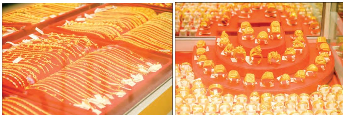
Varieties of gold jewellery are seen in the gold outlet in Yangon.

THE prices of pure gold gained over K2.65 million per tical (0.578 ounce or 0.016 kilogramme) in the markets although Yangon Region Gold Entrepreneurs Association set the price at K2.04 million per tical, gold traders said.