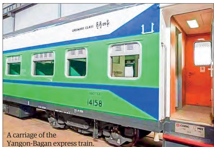
A carriage of the Yangon-Bagan express train.

Tickets are set at K6,450 for the upper class and K3,250 for the ordinary class and six up/down trains are running in the Yangon-Pyay section. — TWA/GNLM