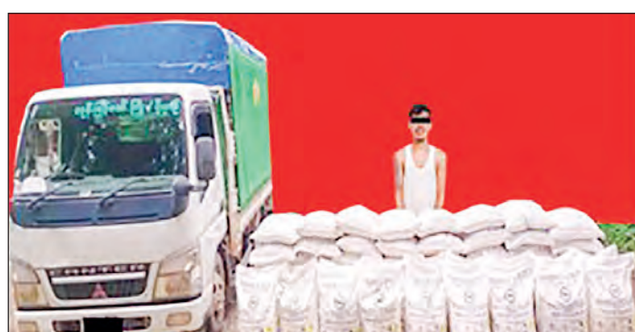
A arrestee is seen along with seized drugs and a vehicle.

They are prosecuted under the Narcotic Drugs and Psychotropic Substances Law, the Myanmar Police Force stated.