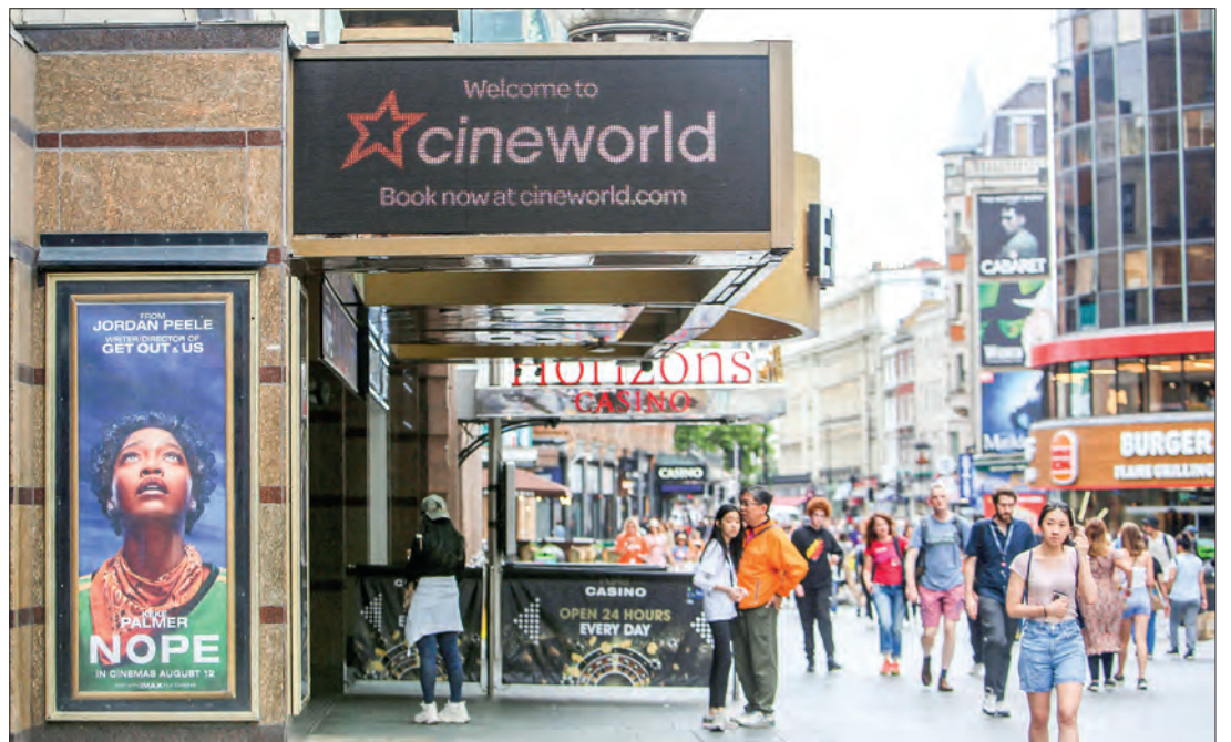
Pedestrians walk past the entrance of a Cineworld cinema in London, on 22 August 2022.

BRITISH-BASED cinema chain Cineworld confirmed Monday that a US bankruptcy filing is among options for the debt-laden group, which has been slammed by dwindling audience numbers.