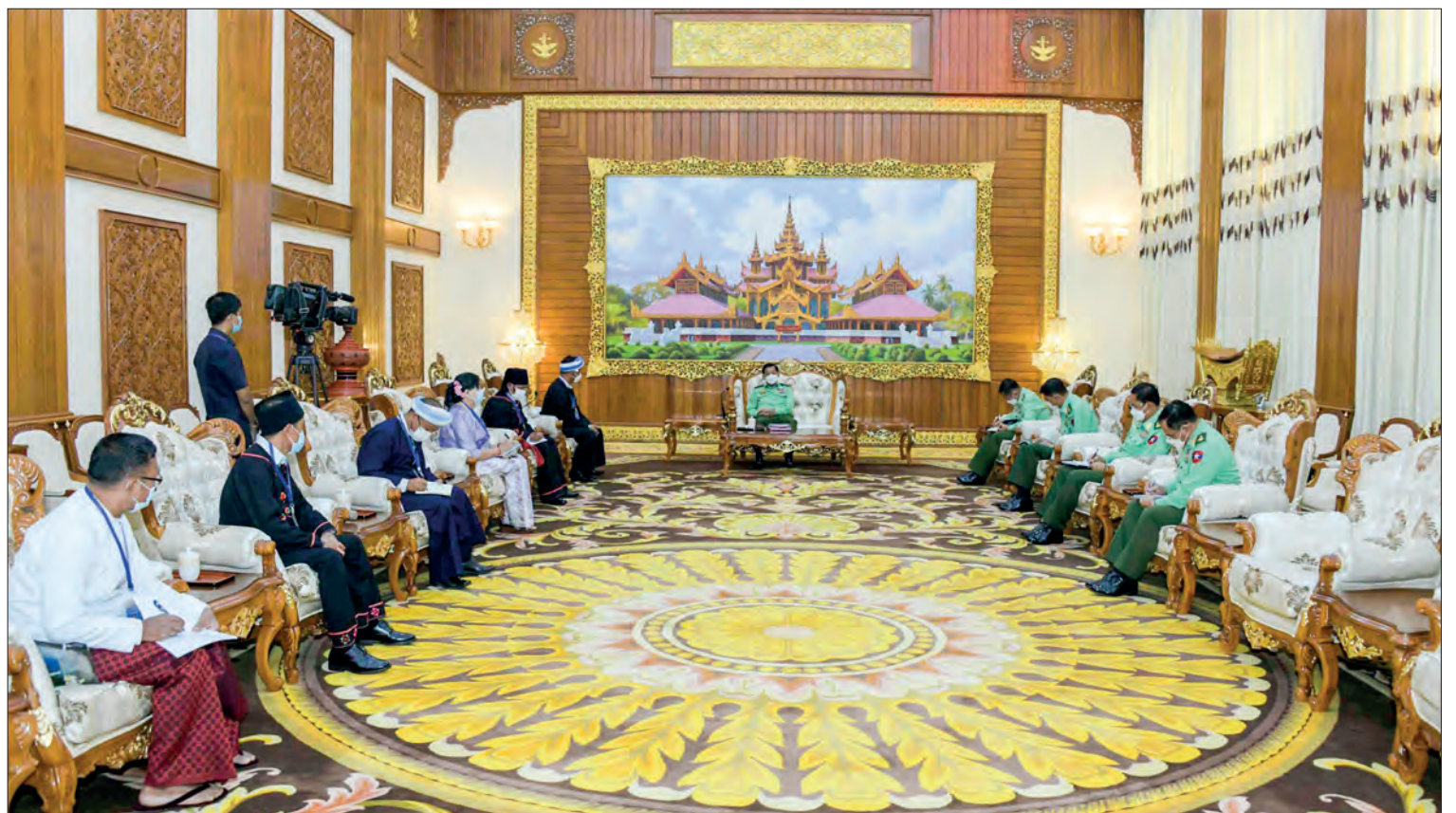
State Administration Council Chairman Commander-in-Chief of Defence Services Senior General Min Aung Hlaing receives the peace delegation represented by the leaders of the PNLO, LDU and ALP in Nay Pyi Taw yesterday.

At the peace talks, the Senior General explained exercising the genuine multiparty democratic system, efforts being made for building the Union based on democracy and federalism as the political vision, need for more ethnic representatives to join the political platform to demand and discuss regional and ethnic interests under the law, preparations for ethnics to join the political platform in the future and assistance of the government, situations of political parties depending on the various types for enabling