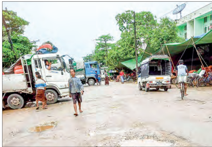
Cargo lorries are seen at the Bayintnaung wholesale market.

However, the rate remains unchanged at K750 per rice bag on the Hinthada-Yangon route, the GNLM quoted Ko Aung Thein, a truck owner, as saying.