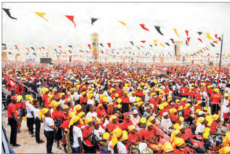
Supporters of Joao Lourenco, Angola's President and presidential candidate of the the Popular Movement for the Liberation of Angola (MPLA) gather during a campaign rally in Luanda on 20 August 2022, ahead of the Angola elections scheduled for 24 August 2022.

MILLIONS of Angolans will vote on Wednesday in polls expected to be the most competitive since the country's first multiparty vote in 1992 but with electoral fraud a concern among voters.