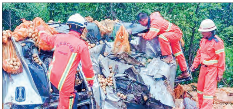
Rescuers are pictured clearing the wreckage.

A 22-wheeler truck plunged into the roadside cliff while coming down along the PyinOoLwin-Mandalay Road in PyinOoLwin Township, Mandalay Region on 22 August, the Fire Services Department stated.