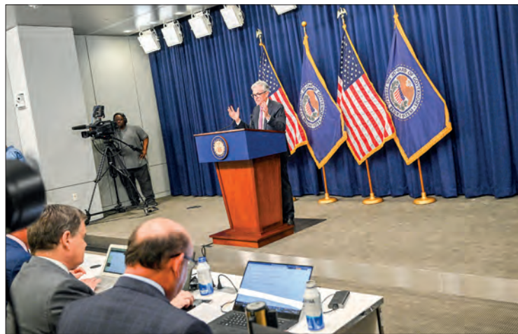
Federal Reserve Board Chairman Jerome Powell speaks during a news conference in Washington, DC, on 27 July 2022.

All eyes are on this week's symposium in Jackson Hole, Wyoming, where Fed boss Jerome Powell will deliver a speech that traders will follow for an idea