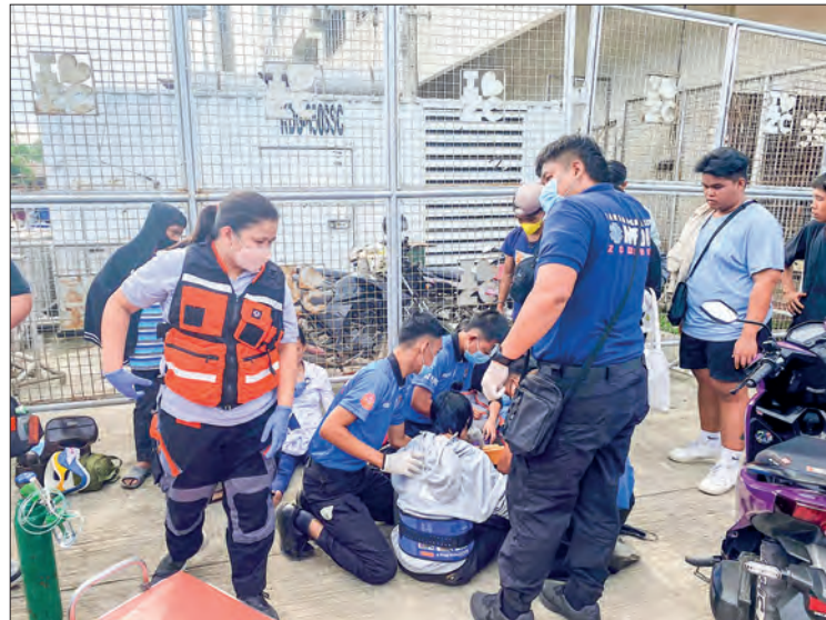
This handout photo taken and released on 20 August 2022 by the Philippine Quick Response System shows people receiving medical attention after getting hurt in a crush for educational cash aid ahead of the reopening of schools, in Zamboanga City.

Only 10 countries were worse off, including Afghanistan, Laos, Chad and Yemen.