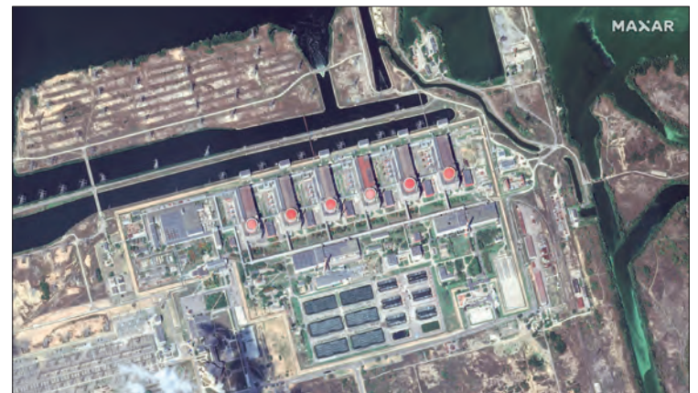
This handout satellite image released on 19 August 2022, shows the Zaporizhzhia nuclear power plant, situated in the Russian-controlled area of Enerhodar, eastern Ukraine.

French President Emmanuel Macron and British Prime Minister Boris Johnson also "agreed that support for Ukraine in its defence against Russian aggression would be sustained".—AFP