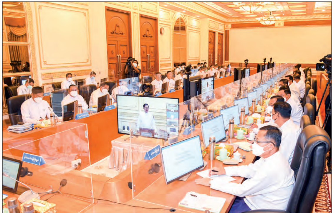
State Administration Council Chairman Prime Minister Senior General Min Aung Hlaing addresses the meeting 6/2022 of the Union government in Nay Pyi Taw on 22 August 2022.

THE proper education system needs to implement the teaching of good democratic practices but democratic politics, said Chairman of the State Administration Council Prime Minister Senior General Min Aung Hlaing at the meeting 6/2022 of