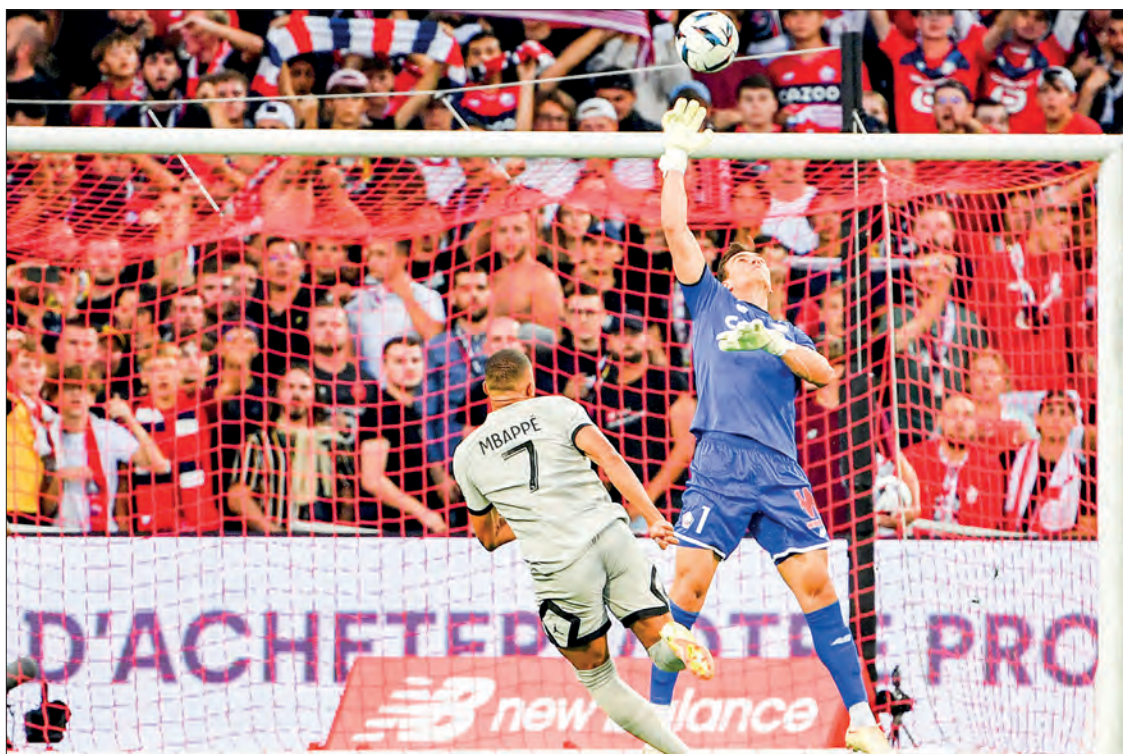
Paris Saint-Germain's French forward Kylian Mbappe scores his team's first goal during the French L1 football match between Lille OSC and Paris-Saint Germain (PSG) at Stade Pierre-Mauroy in Villeneuve-d'Asq, northern France on 21 August 2022.

The match ended a weekend when French football saw red, as referees applied a new "firmness order".—AFP