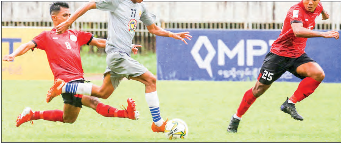
A Rakhine United player (white jersey) runs with the ball during the Myanmar National League Week 9 match against Maha United at Thuwunna Stadium on 22 August 2022.