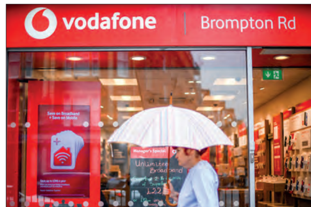
A pedestrian passes a Vodafone store in west London on 15 May 2022.

A Vodafone spokesman said proceeds will be used to deleverage its balance sheet, or cut debt, as it looks to build scale in other markets.