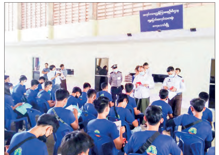
Officials make immigration process for MoU workers.

wthoung District Department of Labour, Kawthoung District Office of the Department of Immigration and Population and responsible organizations carried out the tests for them and the officials of the employment company properly transported them to the company where they will work in Thailand, it is learnt. — Kyaw Soe (Kawthoung)/GNLM