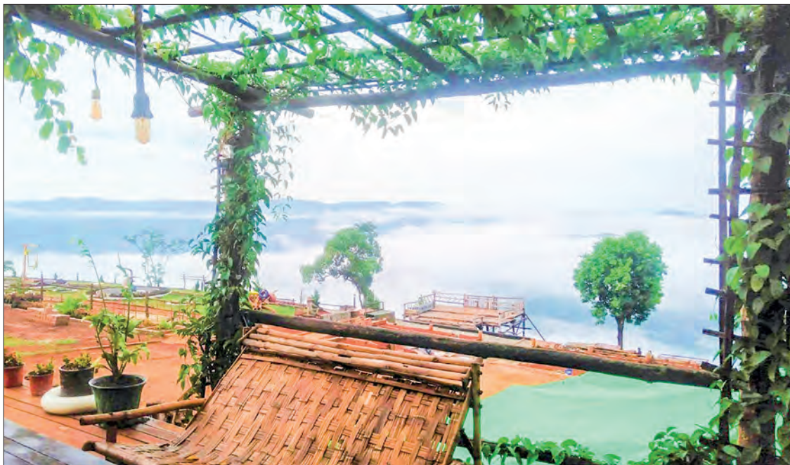
The picture shows the beauty of the cloud sea in the morning at the Nawngkhio Gyi resort.

PREPARATIONS are underway at the hotels and recreational areas to lure local and foreign travellers with the beauty of the cloud sea and the Dokhtawady river in Nawngkhio Gyi village of Nawngkhio Township in northern Shan State, and 90 per cent of