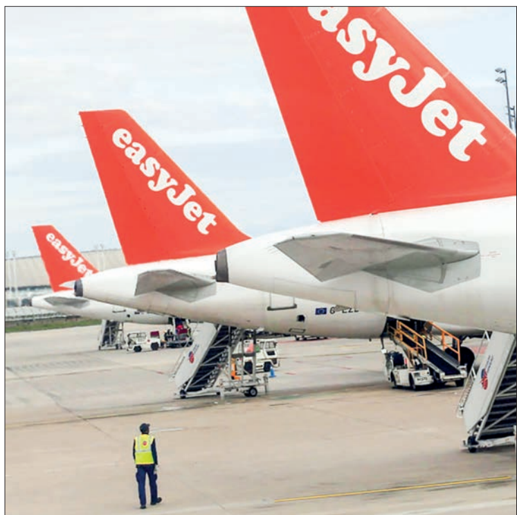
The fourth day of strike action in Spain by pilots working for the low-cost airline Easyjet on Friday led to the cancellation of 14 flights.