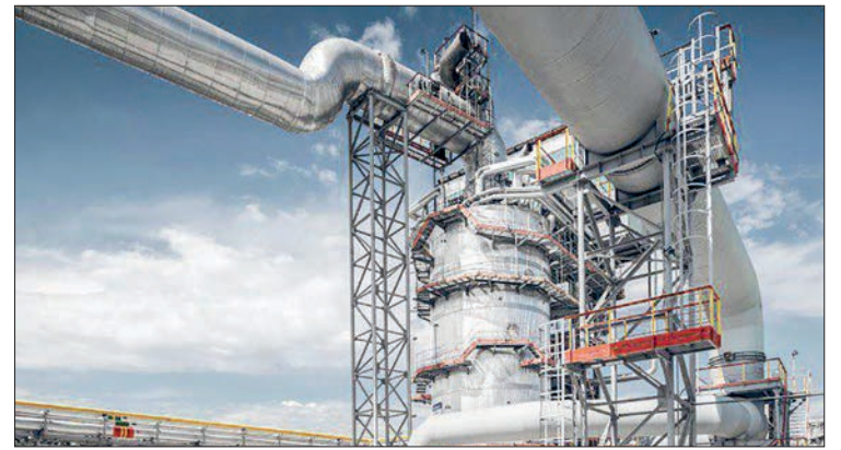
During their call, Putin tells Macron that Russia is facing obstacles in the export of its food products and fertilizer. PhosAgro-Cherepovets fertilizer plant operated by PhosAgro PJSC, in Cherepovets, Russia.

“There are still obstacles to the mentioned Russian exports that does not contribute to the solution of problems related to ensuring global food security,” the Kremlin says. Last month in Istanbul, Russia and Ukraine signed landmark deals with Türkiye and the United Nations that opened secure corridors for grain exports to leave Ukraine’s Black Sea ports. A similar agreement signed at the same time allowed Russia to export its ag-