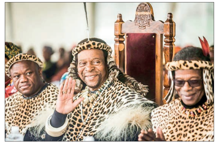
King Goodwill Zwelithini, centre, was one of the world's longest-reigning monarchs -- he died last year after half a century on the throne.

SOUTH Africa's largest ethnic group, the Zulus, will on Saturday crown a new king following a year of feuding over who should ascend to the throne of the country's most influential traditional monarchy.