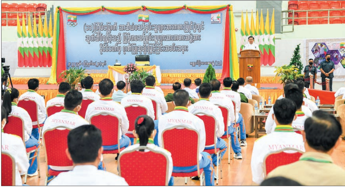
The Senior General gives the speech at the event.