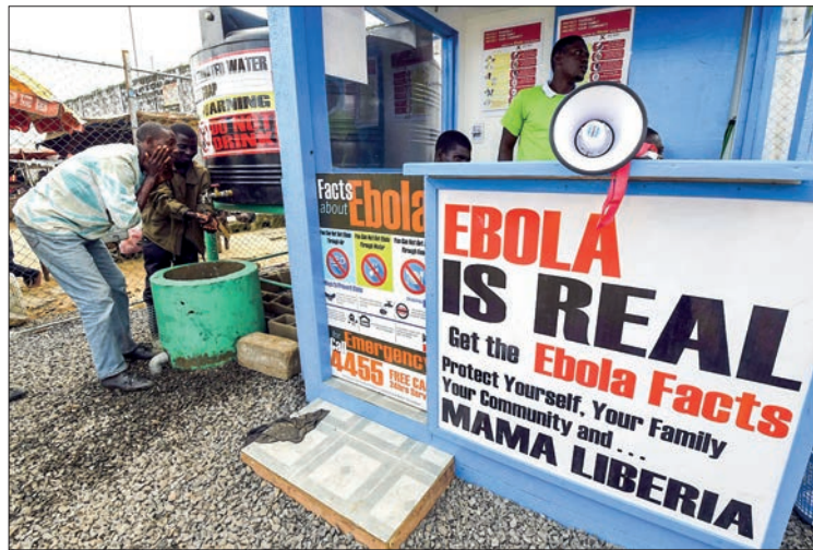
Liberians wash their hands next to an Ebola information and sanitation station, raising awareness about the virus in Monrovia in this 30 September 2014 file photo.

Studies had showed that the two treatments significantly “reduced mortality,” Janet Diaz,