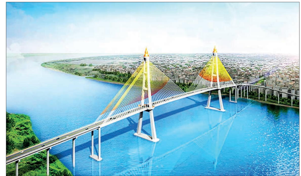
A miniature version of the Yangon-Dala Bridge under construction.

With the construction of the motor roads, there has been a decline in the water transport business. It has already been about five years since the Inland Water Transport stopped running Yangon-Pathein routes