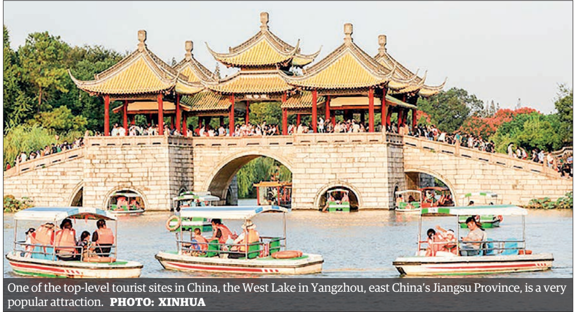
One of the top-level tourist sites in China, the West Lake in Yangzhou, east China's Jiangsu Province, is a very popular attraction.

A chair's statement was issued after the meeting, instead of a joint statement as economies were unable to reach consensus in one paragraph of the draft joint statement, he said without elaborating.—Xinhua