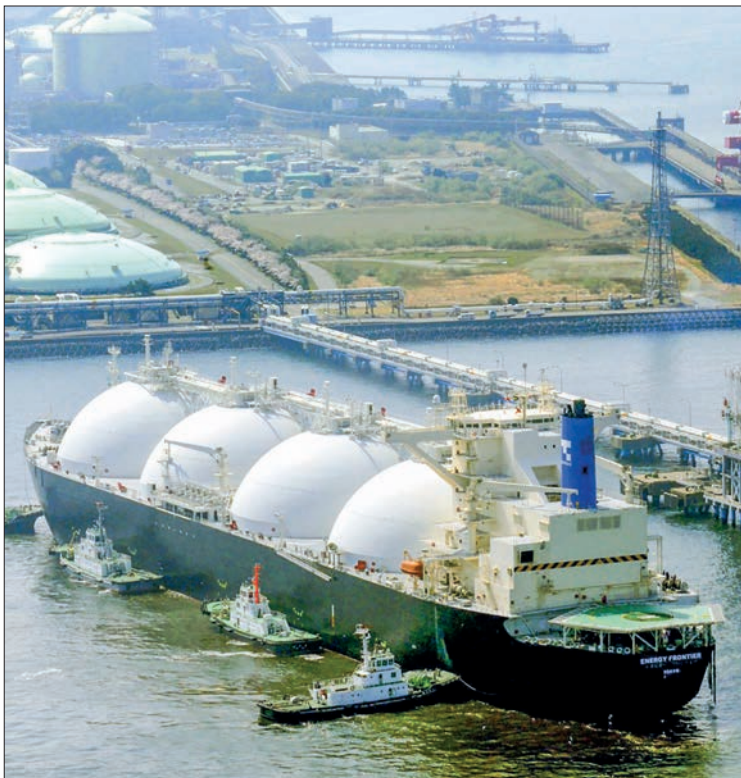
File photo shows a liquefied natural gas tanker that traveled from Sakhalin 2 arriving off Sodegaura, Chiba Prefecture in eastern Japan, in April 2009.

SOME of the Japanese utilities that have been purchasing liquefied natural gas from Russia'