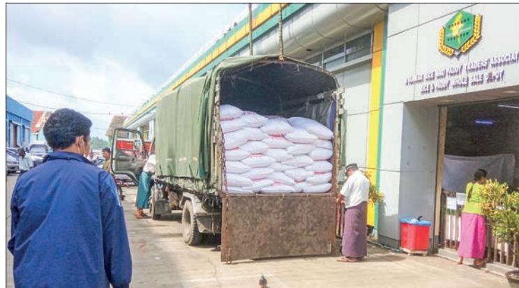
Rice selling takes place at the Wahdan rice wholesale centre.

“The people are happy as we sell the rice at cheap prices. The rice prices are not high but other prices are on the rise. We cannot say the price for the coming month. We sell 350/400 bags per day. It is important for the people to buy the rice at cheap prices and so we arrange further action