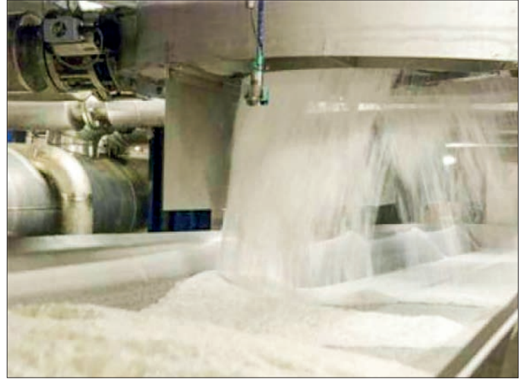
The production process is seen at one sugar mill.

440,000 acres of sugarcane plantation per year and nearly 20 sugar mills produce 500,000 tonnes of sugar per year. The sugar mills are run by the end of the year and operate four months a year.