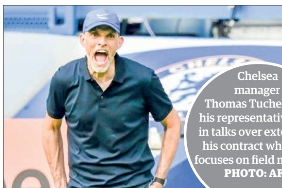
Chelsea manager Thomas Tuchel says his representatives are in talks over extending his contract whilst he focuses on field matters.

THOMAS Tuchel is in talks with Chelsea over extending his contract although the German says he is focusing on "my team... and on being competitive".