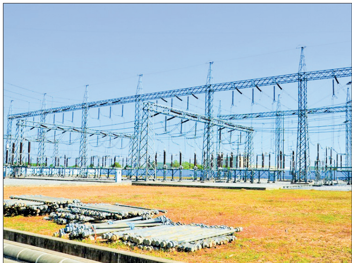
A power distribution sub-station.

MAINTENANCE work on the primary side and secondary side of Thakayta Power Plant 230/33/11 kV, (100) MVA Tr will be carried out from 10 am to 2 pm on 21 August, according to the Yangon Electricity Supply Cooperation.