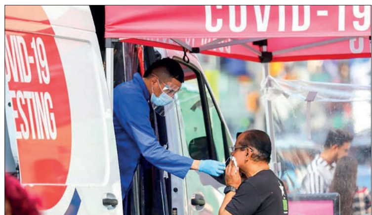
A medical worker collects a swab sample from a man at a COVID-19 testing site on Times Square in New York, the United States, 17 May 2022.

THE chief of the US Centres for Disease Control and Prevention (CDC) on Wednesday acknowledged that the agency had failed to respond effectively to the COVID-19 pandemic, and announced plans for extensive changes.