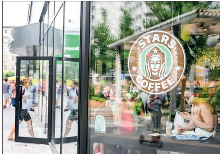
Pro-Kremlin rapper Timati and Russian restaurateur Anton Pinskiy rebranded former Starbucks cafes as Stars Coffee.

Starbucks temporarily closed its 130 coffee shops in Russia at the start of Moscow's February military intervention in Ukraine, later announcing that it will permanently leave the Russian market after nearly 15 years.—AFP