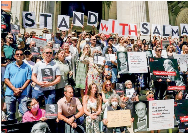
Writers gather in New York to read selected works of British author Salman Rushdie, one week after he was stabbed while on stage.

"No writer ever really wants to talk about censorship," she read. "Writers want to talk about creation, and censorship is anti-creation, negative energy, uncreation, the bringing into being of non-being." Rushdie spent years under police protection after Iranian leaders called for his killing over his portrayal of Islam and the Prophet Mohammed in his 1988 novel "The Satanic Verses". — AFP