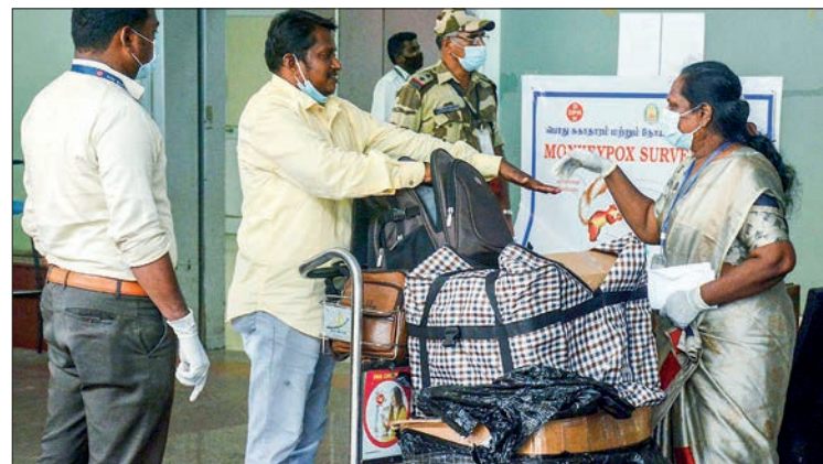
Health workers inspect passengers arriving from high-risk countries for MonkeyPox symptoms, at Chennai International Airport.

The test kit, which was developed by the Transasia Bio-Medicals Ltd, was launched at the Andhra Pradesh Medtech Zone. According to the report, the test kit enables an easy testing with uniquely formulated primer and probe for enhanced accuracy. “The kit would help in early detection and better management of the infection which the World Health Organization