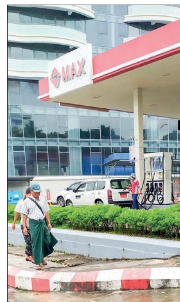
A fuel refilling station in Bahan Township.

The committee sets the prices based on the MOPS’ prices and the consumers can report to the committee if they are not satisfied with the operations. — TWA/GNLN