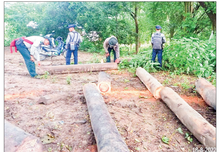
Officials check seized timbers.

They seized three unregistered motorbikes (approximately K2.6 million) in Thayetchaung,