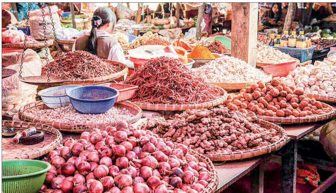
A retail outlet is pictured with kitchen goods.

On 20 August, the wholesale price of refrigerated Moehtaung