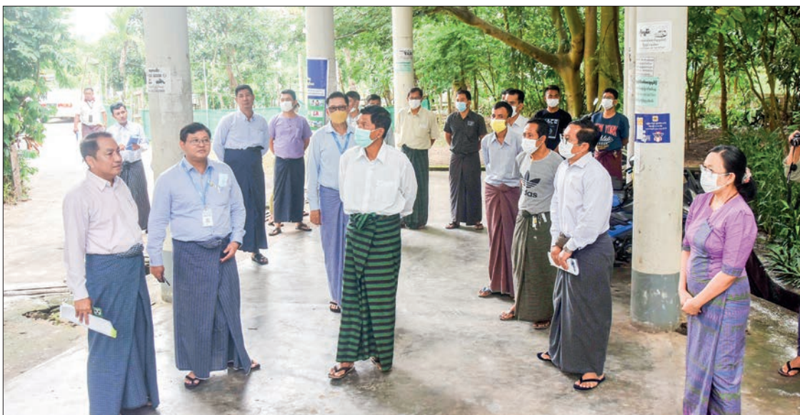
Information Deputy Minister U Ye Tint pays inspection tours round the staff housing in Nay Pyi Taw yesterday.

The deputy minister enquires about difficulties regarding social and health conditions of residents during the inspection and exhorts employees to follow housing rules and regulations, take security precautions and perform cleaning works of the environment in unity. — MNA