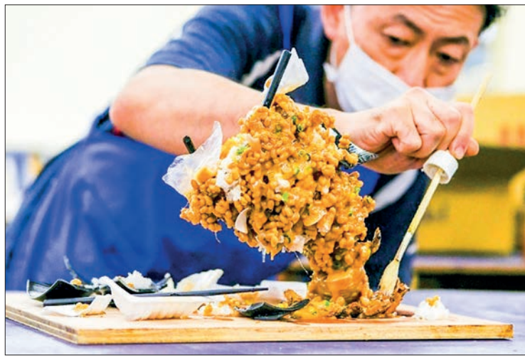
A worker applies the finishing touches on his plastic cyclone of fermented soybeans, aka the ‘nattornado’.

“Normally we have to follow orders from clients. We take