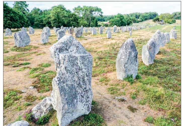
Carnac in northwestern France is one of the most famous megalithic sites in the world with some 3,000 standing stones. PHOTO: AFP/FILE

"It is a major megalithic site in Europe," he said. At the site, they found a large number of various types of megaliths, including standing stones, dolmens, mounds, coffin-like stone boxes called cists and various enclosures.—AFP