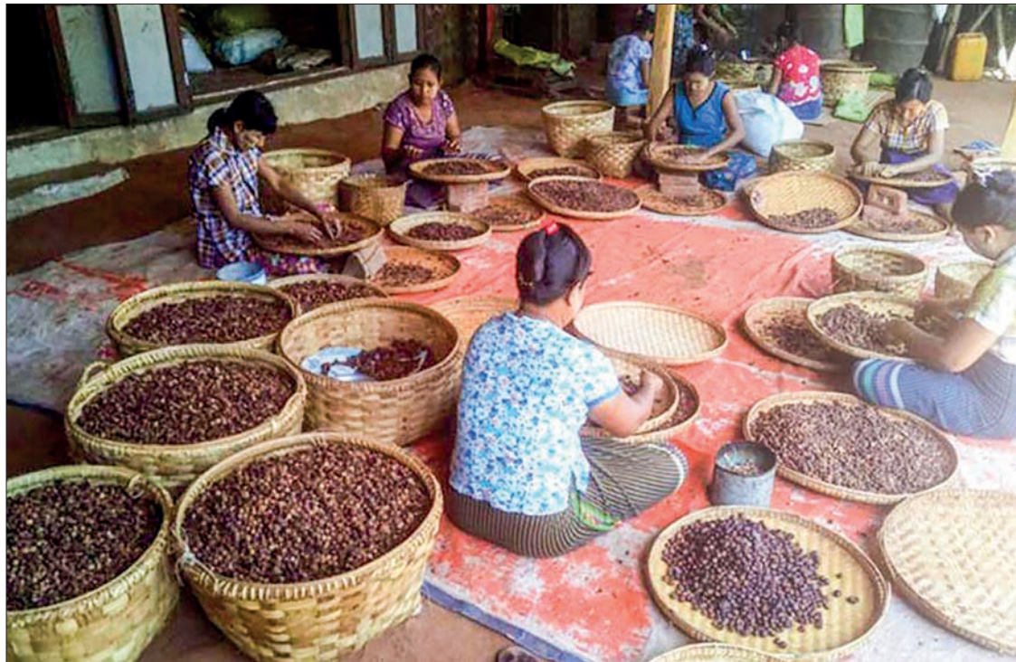
Female workers are pictured sorting out the plums.

“This year’s plum season saw a record high of plum seeds produced by mills due to China’s demand. It is not found that there is any useful application in the Myanmar market. I heard that these plum seeds are manufactured in the Chinese market