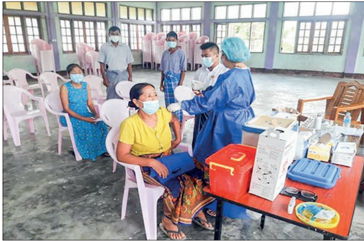
A local in Pauktaw Township, Rakhine State gets COVID-19 vaccine shot on 20 August.

Yesterday, doctors and nurses from public hospitals, medical teams from the Tatmadaw, relevant healthcare workers in collaboration with volunteers gave COVID-19 vaccines to 2,519 people from nine Townships in