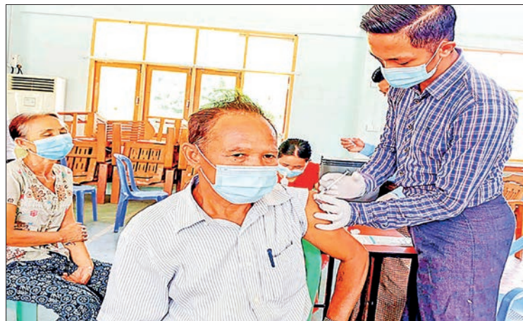
A local gets a booster jab in Kyaktaw in Rakhine State.

According to the Ministry of Health, a national total tally of 32 new cases was reported as of 19 August and out of it, 13 were imported and 19 were cases of domestic transmission. —TWA/GNLN