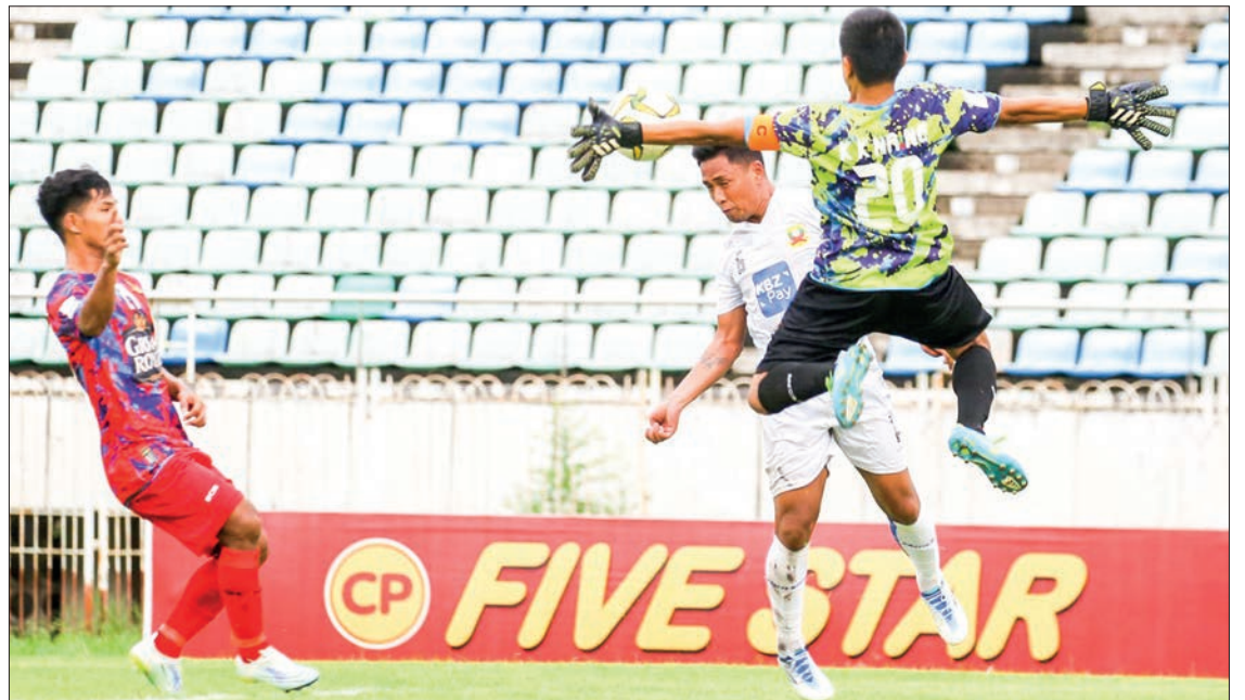
The Hanthawady United goalkeeper (green) attempts to block the header of a Shan United player during their Week 9 Myanmar National League match at Thuwunna Stadium in Yangon on 20 August 2022.