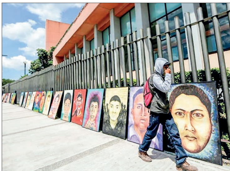
Portraits of some of the 43 students who disappeared in 2014 in one of Mexico's worst human rights tragedies.

They are accused of involvement in organized crime, forced disappearance, torture, homicide and obstruction of Justice, they said.—AFP