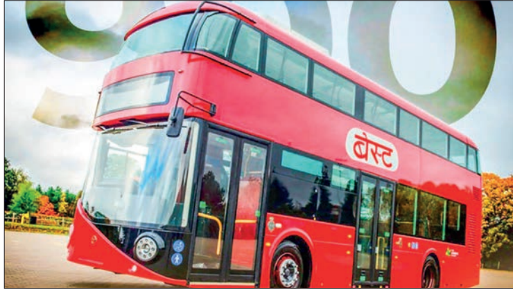
The first of 200 new buses are expected to start service on Mumbai's busy roads from December, joining nearly 400 single-floor EVs already in operation.

The electric bus was developed by Switch Mobility, an arm