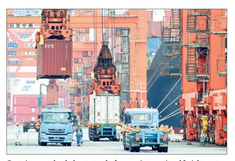
Containers are loaded onto trucks from an international freighter at Tokyo port.

The value of petroleum imports rose to 1.14 trillion yen in the reporting month from a year earlier, increasing for the 16<sup>th</sup> consecutive month, the ministry said.—Kyodo