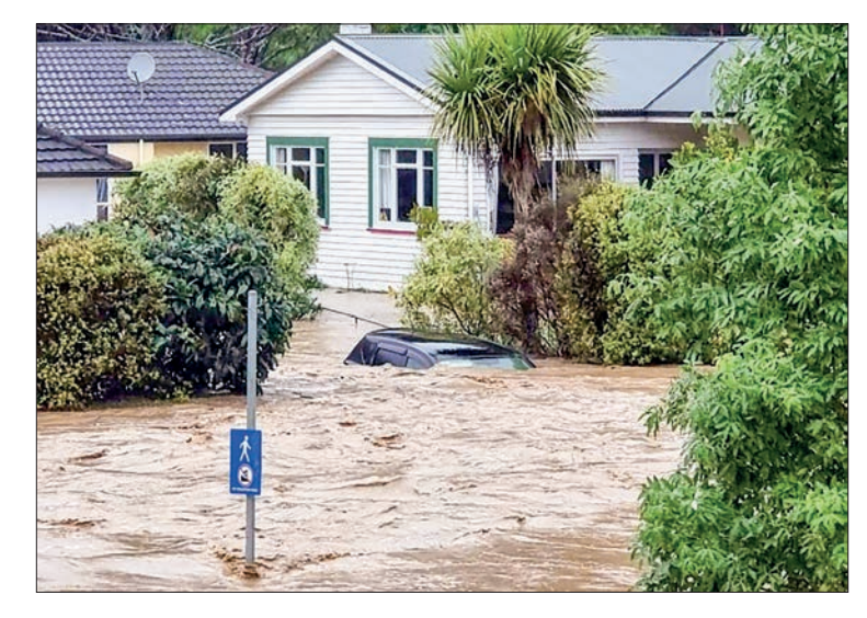
A submerged car stricken by the Maitai River.

HUNDREDS of families on New Zealand's South Island were forced to leave their homes on Thursday after dramatic flooding prompted a state of emergency in three regions.