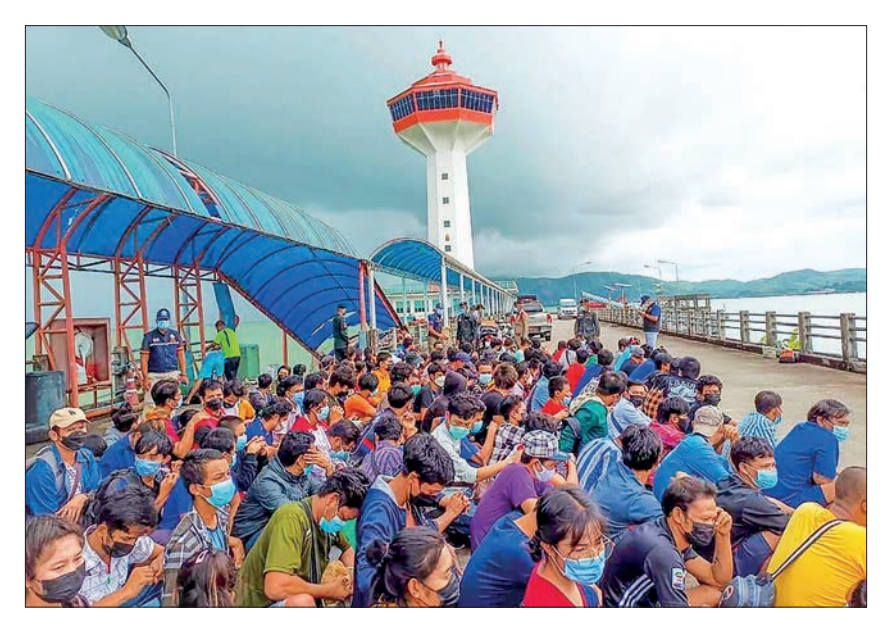
Freed Myanmar citizens are seen before being transferred to Myanmar.

The transferred Myanmar workers are the ones who were trapped in Thailand for various reasons during the outbreak of Covid-19 and those who were given punishment. Kawthoung District and Township Administration officials, Department of Health and other respective departments, and NGOs will check the returnees to confirm the involvement of people suspected of COVID-19 infection, non-Myanmar citizen and drugs. Then, they provided the necessary sup-