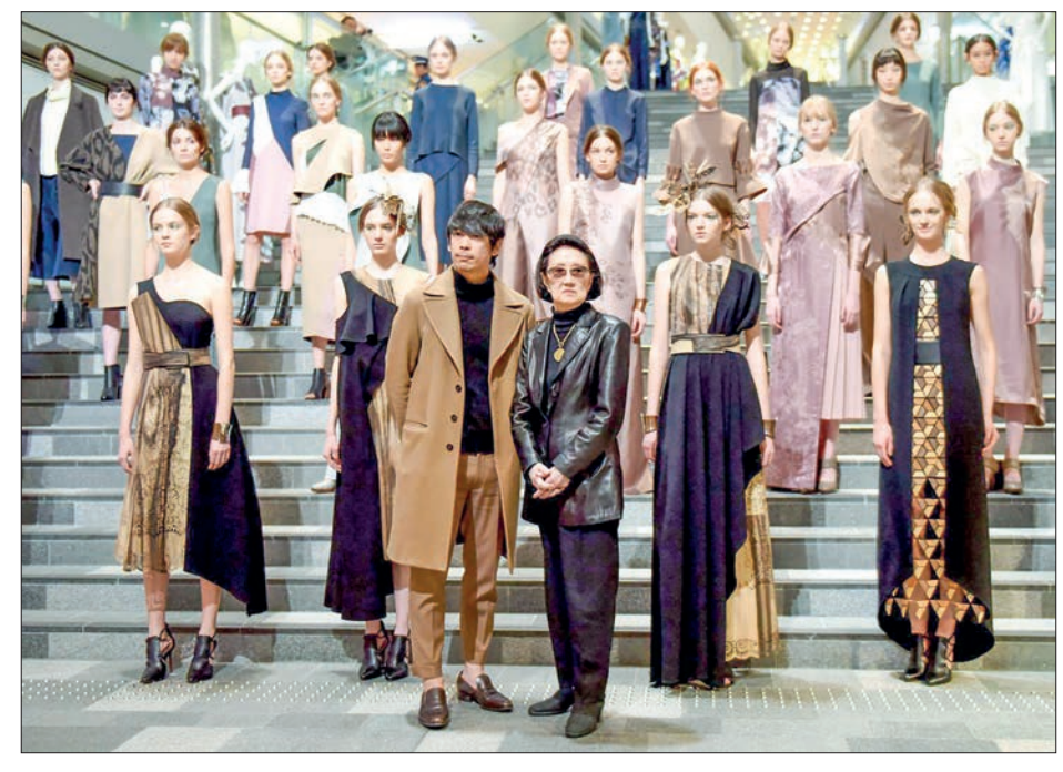
Japanese fashion designer Hanae Mori was also a pioneer for Japanese women as one of a tiny number to head an international corporation.

Public broadcaster NHK and other media outlets also reported the news, saying a private family funeral had already taken