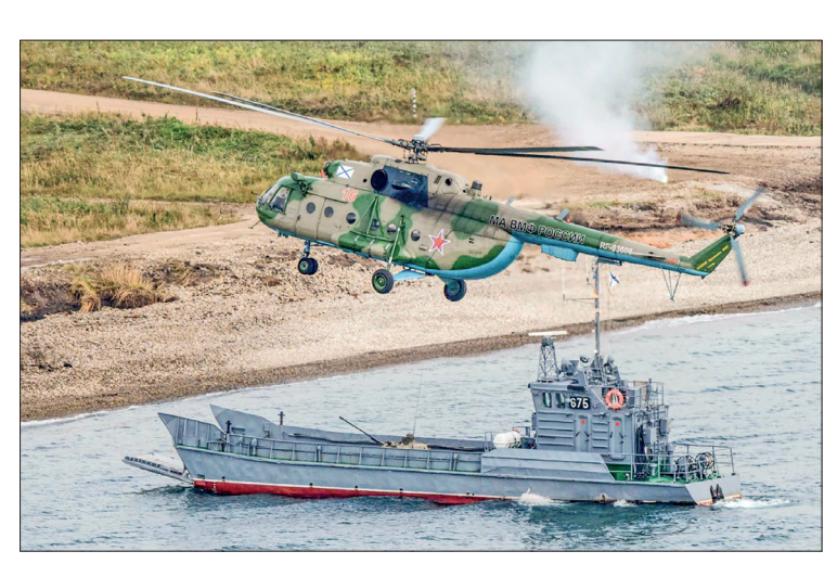
The annual "Vostok" exercises will take place from 30 August to 5 September 2022. Russian military forces perform a landing during the Vostok-2018 (East-2018) military drills at Klerka training ground on the Sea of Japan coast, outside the town of Slavyanka, some 100km south of Vladivostok, on 15 September 2018.

China's defence ministry said Wednesday its participation in the annual "Vostok" exercises — which Moscow has said will take place from 30 August to 5 September — is part of a bilateral cooperation agreement with Russia.—AFP