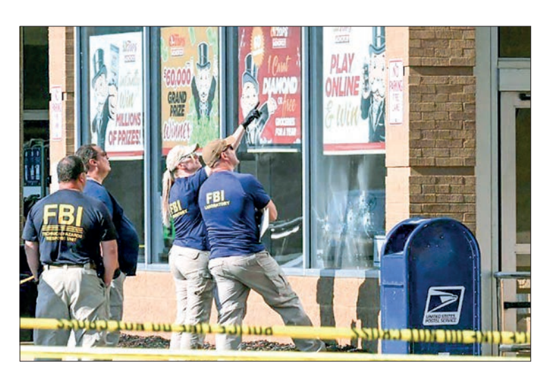
The US Federal Bureau of Investigation came under attack by conservatives after its agents raded Donald Trump's home.

Senator Marco Rubio, a Republican from Florida, compared the agency to secret police in a Marxist dictatorship, while Representative Paul Gosar declared: "We must destroy the FBI".— AFP