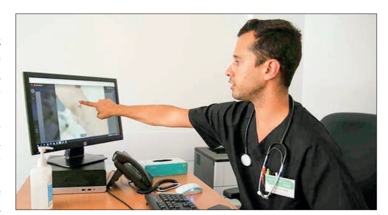
A doctor looks at an image of a monkeypox lesion on his computer screen at a sexual health clinic in Lisbon, Portugal.

nounced that the global monkeypox outbreak represents a