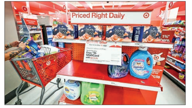
Americans continue to use their savings to spend, despite high inflation.

"Despite the flat headline reading, the core retail sales figures in July show the consumer has staying power," Kathy Bostjancic of Oxford Economics said.—AFP