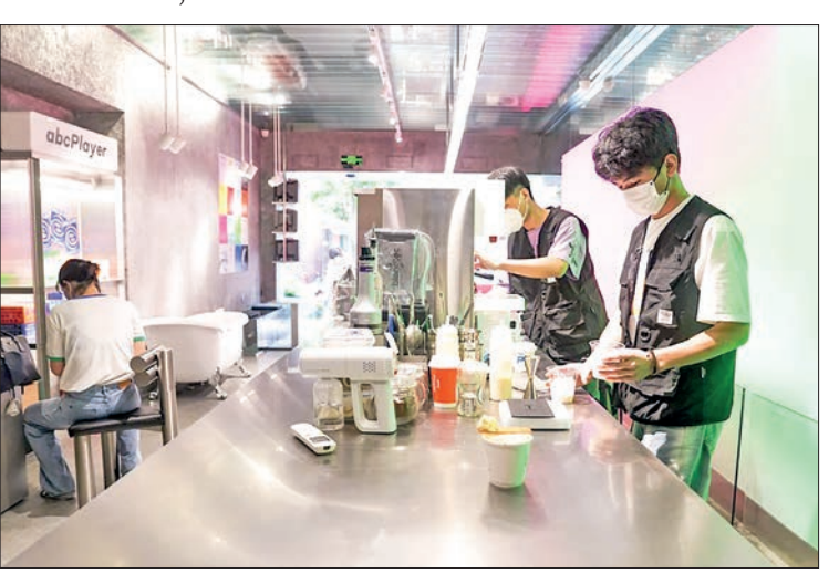
Baristas prepare coffee at a cafe in east China's Shanghai, 29 June 2022.

While stressing support from the modern service industries and stable expectations of most service companies, Fu said transportation and travel services have also improved as the targeted measures to contain the epidemic have allowed both goods to circulate at a faster pace and people to go out and travel more.— Xinhua