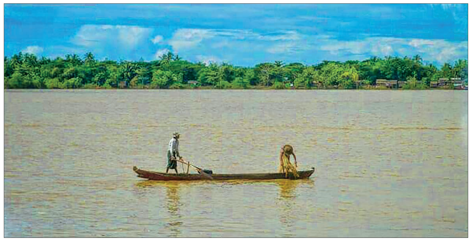
The picture shows a scenic view against the Mainmahla Kyun (Island) of the Ayeyawady Delta.

HE Mainmahla Kyun Wildlife Sanctuary in Bogale Township of Pyapon District, Ayeyawady Region, has been designated as a natural re-