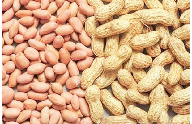
The prices of peanut and sesame seeds continued upward spiral. Peanut prices hit over K7,000 per viss (a viss equals 1.6 kilogrammes) in the domestic market, according to Mandalay's market price data.

soared to K160,000 for Niger seed, K227,000 for brown sesame, K280,000 for white sesame and K265,000 for black sesame on 18 August. The price of various sesame seeds showed a significant rise of K15,000 to 43,000 per bag in one month.