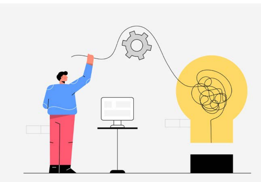
Creative thinking shows us that there are many solutions to any problem, and developing one's creative thinking skills helps them recognize innovative solutions more quickly.

ence. How could they employ their knowledge of eco-friendly products to make their marketing plans more respectful of the