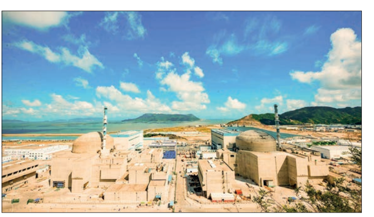
File photo of Taishan Nuclear Power Plant in south China's Guangdong Province.

The plant is operated in a partnership with French en-