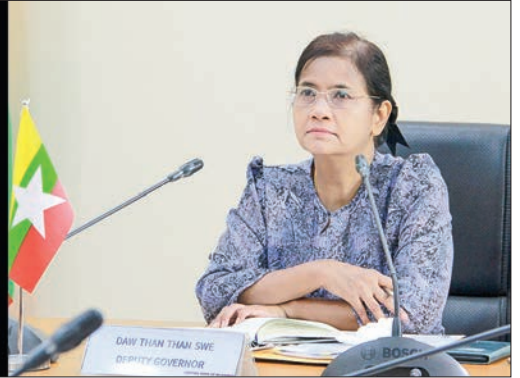
CBM Deputy Governor Daw Than Than Swe virtually joins the SEACEN High-Level Seminar and Meeting for Deputy Governors yesterday.