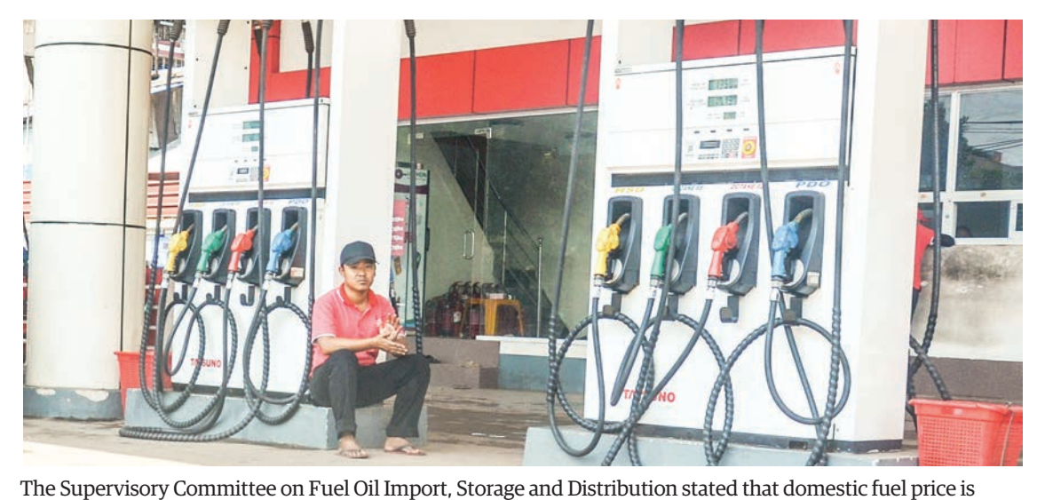
due to the price index set by Mean of Platts Singapore (MOPS), the pricing basis for many refined products in Southeast Asia.

FUEL prices dipped in the domestic market these days, according to the fuel price market.