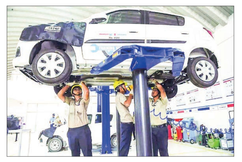
The production and sales of an increasing number of vehicles in the country indicate a rising purchasing power. Students attend a car workshop sponsored by Maruti Suzuki India Ltd at Ganpat University in Khenva, some 85 kms from Ahmedabad.

The production and sales of an increasing number of ve-