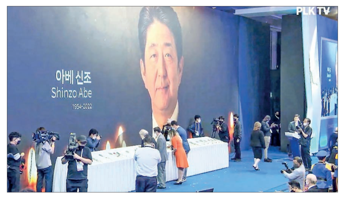
Participants of an international conference of the Universal Peace Federation pay tribute to slain former Japanese Prime Minister Shinzo Abe in Seoul on 12 August 2022.

JAPANESE opposition parties called Thursday for an extraordinary parliamentary session to be opened as soon as possible to examine the controversial links between members of Prime Minister Fumio Kishida's government and the Unification Church.