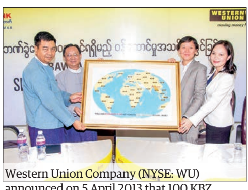
announced on 5 April 2013 that 100 KBZ Bank branches in Myanmar have remittance services.

THE Department of Revenue has announced that Myanmar citizens abroad should transfer money to the country