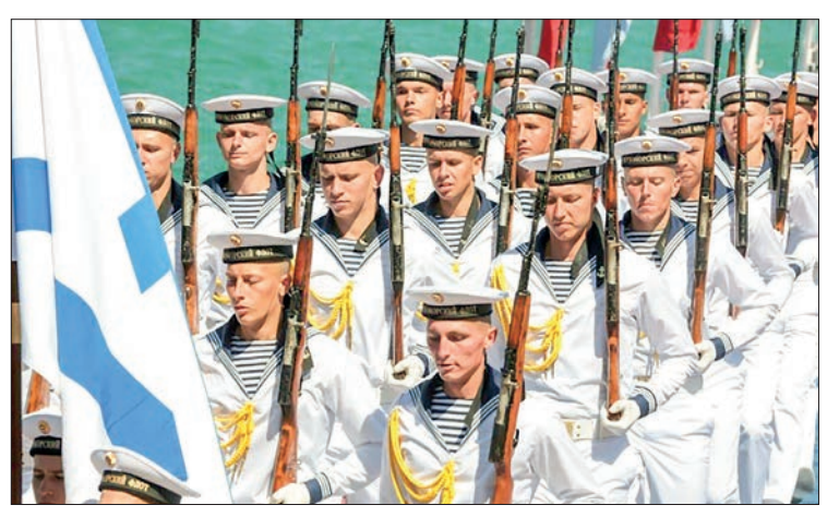
Russia annexed the Crimea peninsula from Ukraine in 2014.

The blasts came exactly a week after an attack on an air base which a senior Ukrainian official speaking on condition of anonymity described as a "well-prepared, special partisan job". —AFP