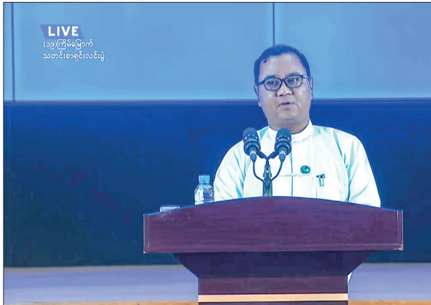
Maj-Gen Zaw Min Tun answers the question of a reporter.

THE State economic promotion funds (K400 billion) including the fund for agriculture are from the COVID-19 fund and not the newly printed banknotes, said Maj-Gen Zaw Min Tun, leader of the Information Team during the 19 th Press Conference of the State Administration Council.