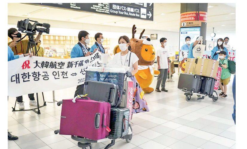
Passengers arrive at New Chitose Airport in Hokkaido, northern Japan, on 17 July 2022 as international flights resumed after a 28-month hiatus.