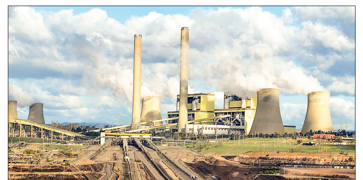
The Energy Legislation Amendment Bill 2022, announced on Monday, would bring forward the timeline for the closure of the state’s remaining coal plants.

The Greens remain a minor party in Australian politics. However, a swing of voters in the nation’s May federal election has increased their influence on Australia’s politics. The three coal plants are currently scheduled to close as late as 2048. The Greens said this is at odds with projections made by the United Nations that tackling the climate crisis would require the closure of all coal power stations by 2030.—Xinhua