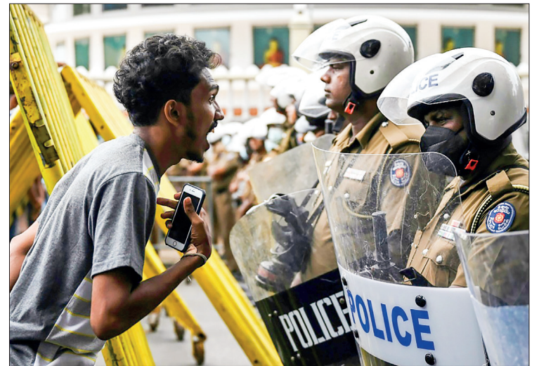
Emergency regulations allow troops and police to arrest suspects and detain them for long periods of time.

The country defaulted on its $51 billion foreign debt in mid-April and is in talks with the International Monetary Fund over a possible bailout.— AFP