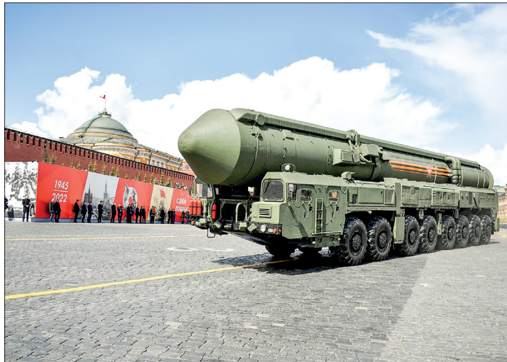
A Russian Yars intercontinental ballistic missile launcher parades through Red Square during the Victory Day military parade in central Moscow on May 9 2022.

Soot injections totalling more than five million tonnes would lead to “mass food shortages, and livestock and aquatic food production would be unable to compensate for reduced crop output, in almost all countries,” said the team that carried out the study, including Lili Xia of Rutgers university in the United