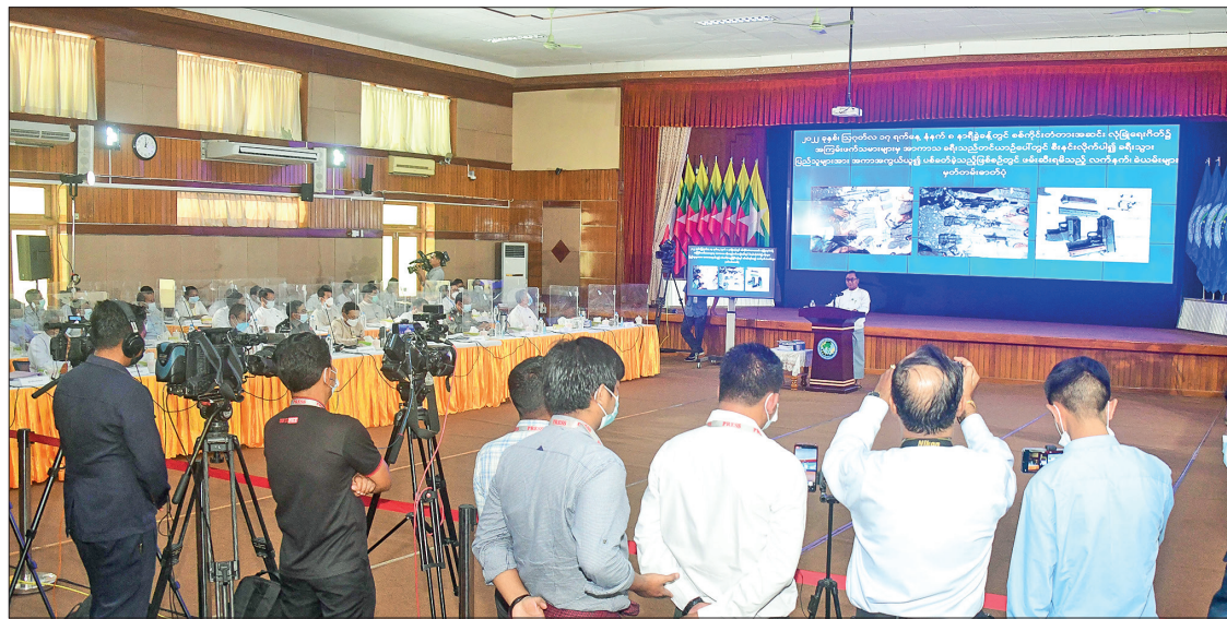
The 19 th Press Conference of the SAC Information Team is in progress yesterday.

First, Information Team Leader Maj-Gen Zaw Min Tun explained the holding of the National Defence and Security Council Meeting 2/2022 by SAC on 31 July 2022, undertakings of the tasks by SAC in accord with the adopted roadmap and future plans, implementation of two national visions and two political visions by the Council, holding of the coordination meeting on accomplishments of the Union government attended by Union ministers, region and state chief ministers and chairmen of self-administered zones, trans-