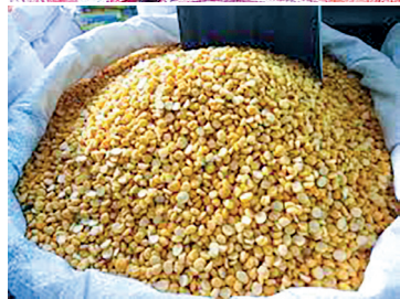
Potatoes and chickpeas are pictured being displayed in the market.

rose to K2,250 per viss in the last four months of 2000.