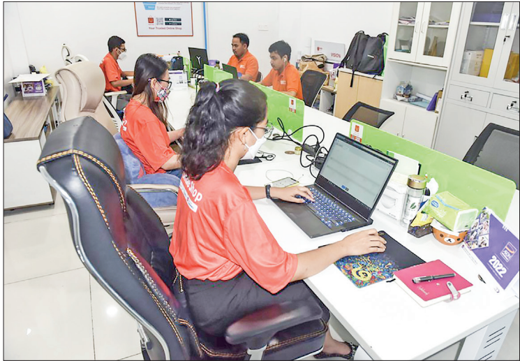
Employees work at online market Smile Shop in Phnom Penh, Cambodia, 21 Dec 2021.