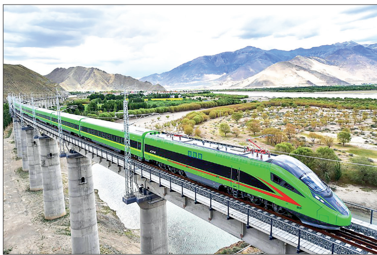
A Fuxing bullet train runs on the Lhasa-Nyingchi railway during a trial operation in Shannan, southwest China's Tibet Autonomous Region, 16 June 2021.

THE Tibetan Plateau will experience significant water loss this century due to global warming, according to research published Monday that warns of severe supply stress in a climate change “hotspot”.