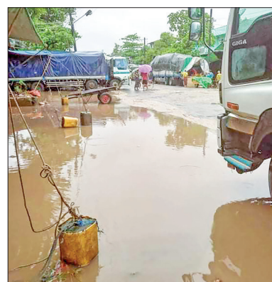
Flash floods hit warehouses and backstreets at the Bayintnaung market.

The freight forwarding service industry was unexpectedly hampered by heavy rainfalls and flash floods on 17 August. — TWA/GNLM