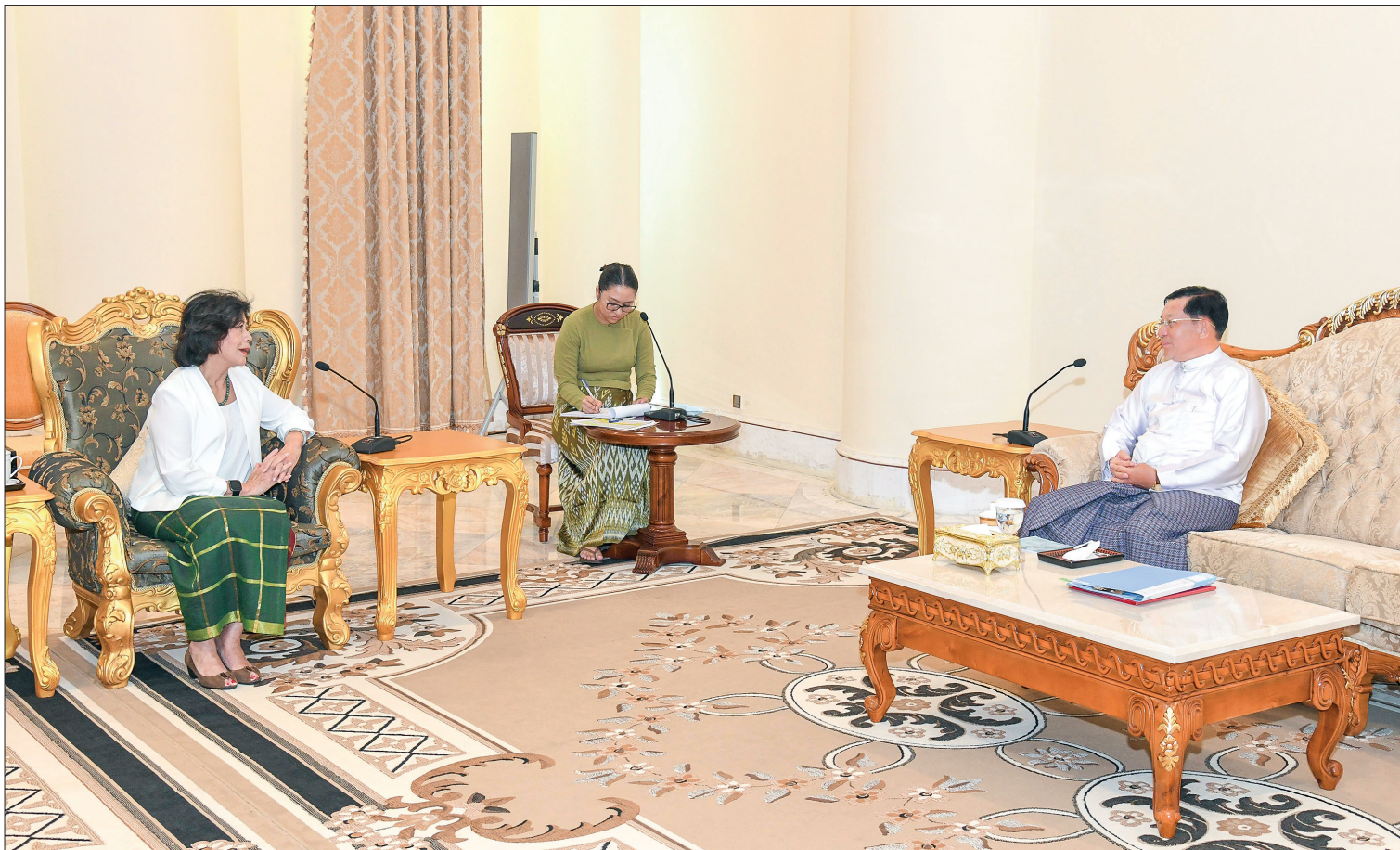
State Administration Council Chairman Prime Minister Senior General Min Aung Hlaing receives Special Envoy of the United Nations Secretary-General on Myanmar Ms Noeleen Heyzer in Nay Pyi Taw on 17 August 2022.

Chairman of the State Administration Council Prime Minister Senior General Min Aung Hlaing received Ms Noeleen Heyzer, Special Envoy of the United Nations Secretary-General on Myanmar, at the parlour of the SAC Chairman's Office in Nay Pyi Taw yesterday afternoon.