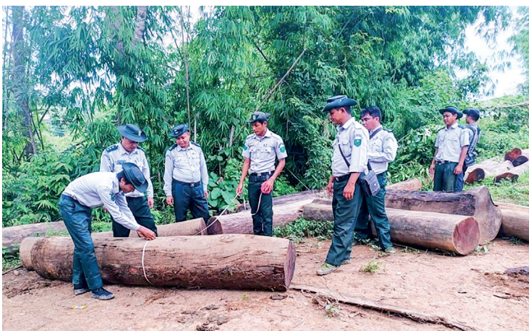
Officials check illegal teak logs in Bago Region.

SUPERVISED by the Anti-Illegal Trade Steering Committee, effective action is being taken to prevent illegal trade under the law.