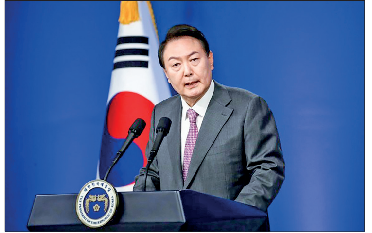
South Korea's President Yoon Suk-yeol is battling record-low approval ratings after just three months on the job.

"Personnel reshuffle should be carried out carefully rather than for political purposes to turn around... approval (ratings)," he said, adding that he wanted people to give his administration more time.—AFP