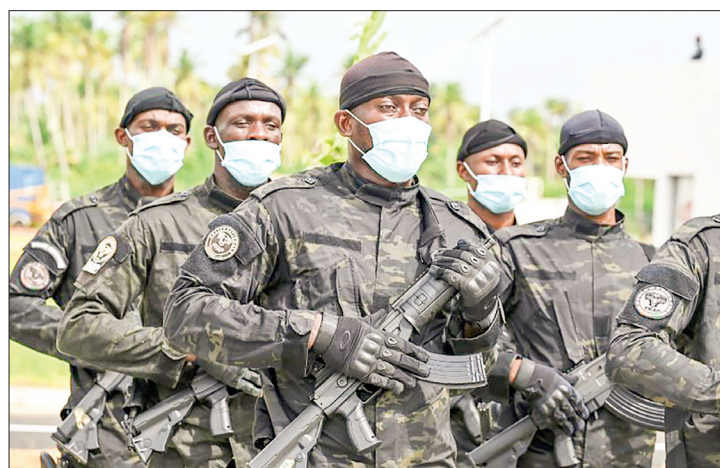
Ivory Coast last year inaugurated a training school for West African militaries fighting jihadism — the International Academy for Combatting Terrorism (AILCT).

"This test launch is part of routine and periodic activities intended to demonstrate that the United States' nuclear deterrent is safe, secure, reliable and effective," the Air Force said in a statement. "Such tests have occurred more than 300 times before, and this test is not the result of current world events."—AFP