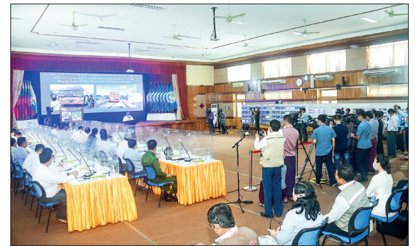
Maj-Gen Zaw Min Tun talks about the prices of basic foodstuffs.