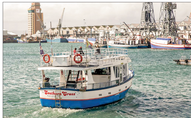
People enjoy a boat trip in Cape Town, South Africa, 30 June 2021.

interview with Xinhua that the department was concerned about the increasing number of monkeypox cases, but stressed there was no need to panic. According to him, a 28-year-old man from the Western Cape province has been identified as the fourth case of monkeypox. The patient returned to South Africa from Spain in the second week of August. “A polymerase chain reaction (PCR) test was performed in a private pathology laboratory. The samples were submitted to the National Institute for Communicable Diseases (NICD) for sequencing analysis,” Mohale said, noting the health department has instituted public health response measures including contact tracing to prevent the spreading of the monkeypox virus.—Xinhua