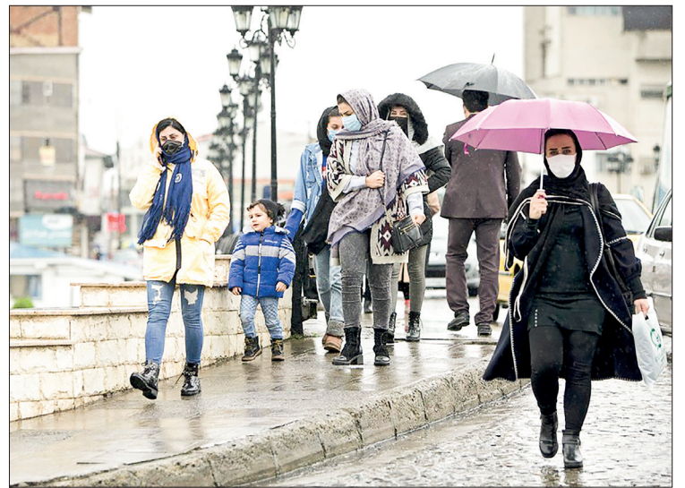
People wearing face masks walk on a street in Tonekabon, northern Iran, 6 Dec 2020.