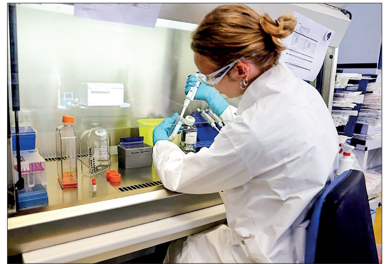
Britain has launched dispute procedures with the European Union over its exclusion from the bloc's scientific research programmes, using a mechanism set out in a post-Brexit deal.

The UK government said it has written to the European Commission to launch dispute resolution proceedings and expects “constructive engagement”.— AFP