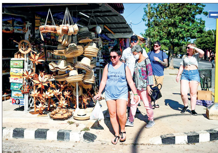
Tourists walk along a boulevard in Varadero, Matanzas province, Cuba, on 28 February 2022.

THE Cuban government has announced it will allow foreign investment in domestic wholesale and retail trade for the first time in 60 years, in a move aimed at addressing critical shortages of goods.