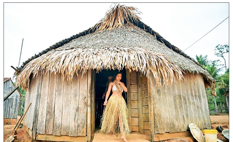
Fewer than 200 members remain of the Uru-eu-wau-wau tribe, traditionally hunter-gatherers who live in a protected area of Brazil's Amazon rainforest, surrounded and encroached upon by aggressive and illegal settlers, farmers and loggers.

“We had to have a conversation with him like, ‘Okay, are we done with the film? Do we have everything we need? Is there more? Should we start editing?’— AFP