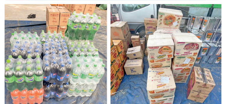
Confiscated items in Mandalay Region.