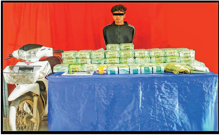
An arrestee is pictured along with seized drugs and a motorbike.

THE Myanmar Police Force stated that over K1.46 billion worth of Ice (Methamphetamine) weighing 120 kilogrammes and Ketamine weighing 59 kilogrammes were confiscated in Kengtung, Shan State (East).