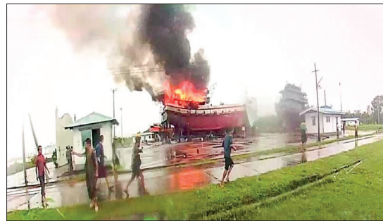
Fire brigade members are seen putting out the fire.

Fire brigade members from Kyimyindine Township on the Yangon side carried water pumps, generators and pipes by boats to the other side while putting out the fire.