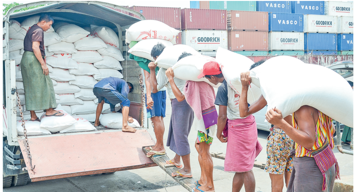
Prices of high-grade Pawsan rice variety from Shwebo Township rose by K24,000 per bag in domestic markets. Rice bags are loaded onto the lorry.

The prices will stand at K75,000-77,000 per bag of Shwebo Pawsan, K52,000-55,000 per bag of Ayeyawady Pawsan, K55,000-60,000 per bag of Kyapyan, and K35,000-37,000 per bag of short-matured rice varieties