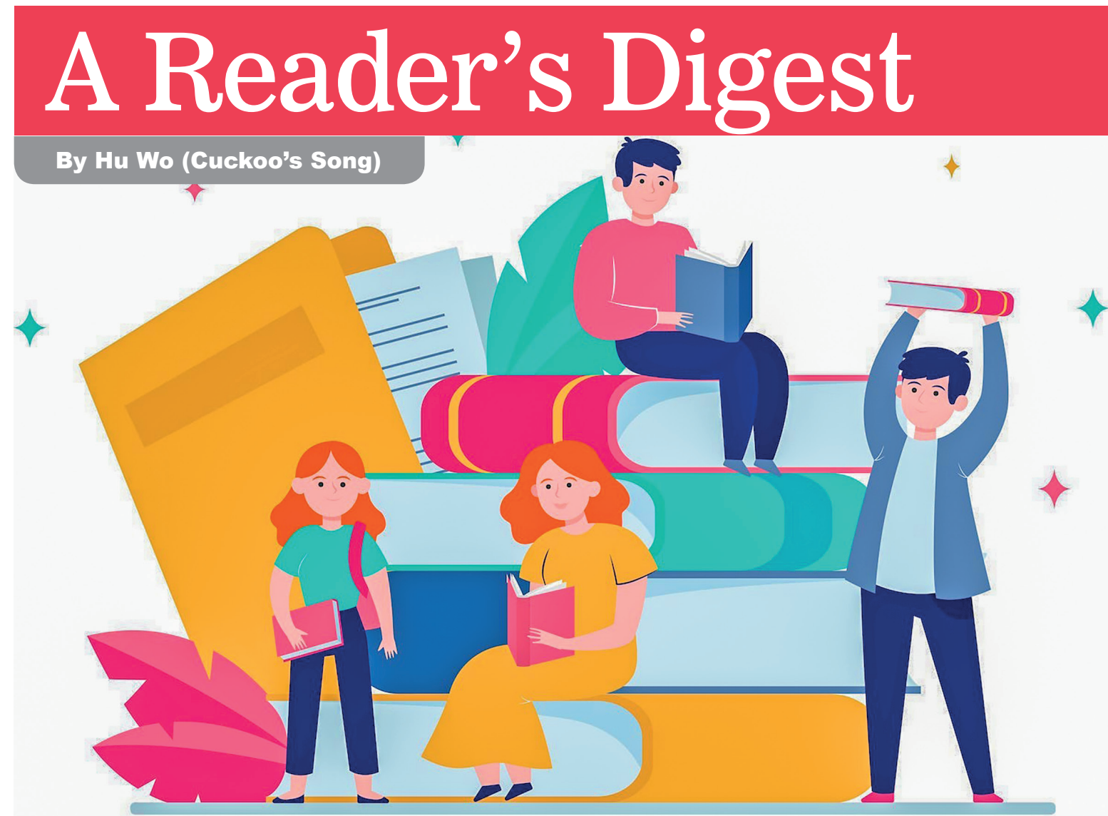
The effects of reading, or more specifically, digested reading, are enormous.

So, how to digest reading will be presented here as far as I am concerned. Firstly, by the time a book is read, readers should read the whole book, not excluding the writer's foreword, thanks, others' remarks, and further reading if they are included in the book. Such things may help the readers show the right way to read a book. Secondly, readers ought to take a look at the contents page. From the contents, they can not only guess which subject matter might be written in a book but also skim