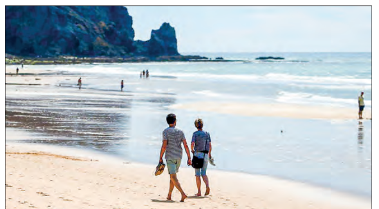
The number of tourists visiting Portugal recovered to 5.9 million in 2021.

Since 16 July, Portugal has started the vaccination for those who had contact with the confirmed monkeypox cases, and 70.2 per cent of the eligible contacts have been vaccinated so far.