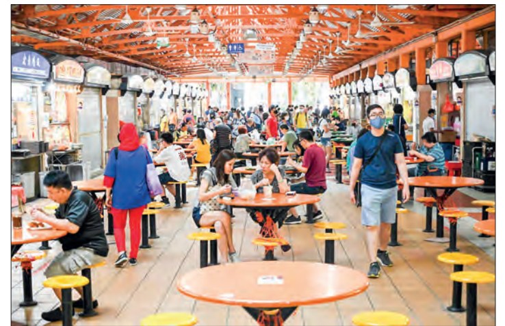
People have their lunch at the Maxwell market hawker centre in Singapore on 17 December 2020, a day after Singapore's street food culture was included on a United Nations Educational, Scientific and Cultural Organization (UNESCO) list of intangible cultural heritage.

"Since May, the global economic environment has deteriorated further," the ministry said.—AFP