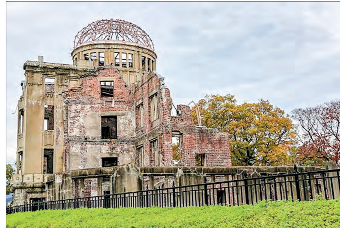
"Gembaku Dome (Atomic Bomb Dome)" was the building affected by the atomic bomb in Hiroshima. Hiroshima City decided to leave the Atomic Bomb Dome as an atomic bomb site.

It is widely known that the United States made the Manhattan Project to drop atomic bombs on Japan in consort with Britain and Canada, and used different types of atomic bombs on Hiroshima and Nagasaki. In order to measure the characteristics of the