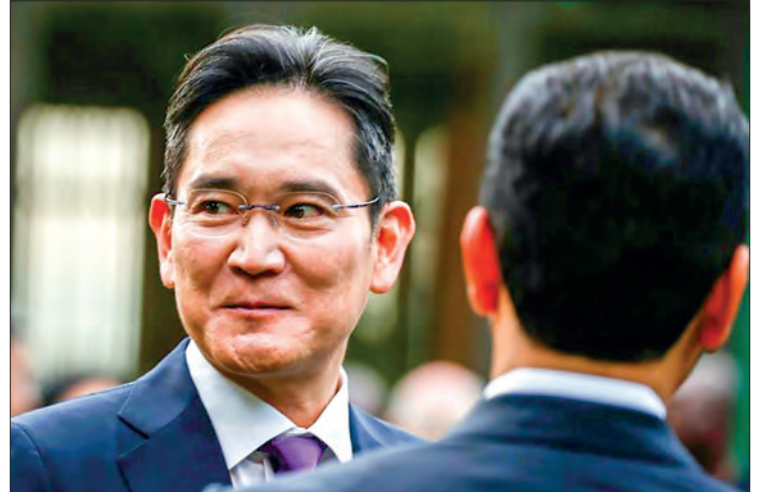
Samsung Electronics vice-chairman Lee Jae-yong, convicted of bribery and embezzlement in January 2021, was pardoned Friday.

A total of 1,693 people — including prisoners with terminal illnesses and those near the end of their terms — were on the pardon list, the ministry said, ahead of the annual Liberation Day anniversary Monday.—AFP