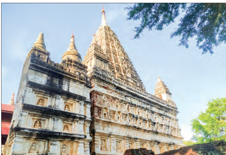
The Mahabodhi Pagoda.

PEOPLE can visit the Mahabodhi Pagoda in the Bagan-Nyaung-U Ancient Cultural Zone of old Bagan and explore the architectural works of Buddha images, Inwa-era mural plaques and the structure of the pagoda, according to the Mahabodhi Pagoda Trustees Board.