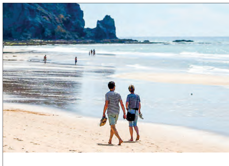
Vehicles to be shipped to Europe are moved onto a ship at a port in east China's Shanghai, 20 Oct 2020.