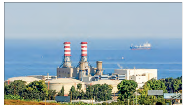
For the past year, Lebanon's power plants have depended on the deal with Iraq to produce one to two hours of electricity per day. PHOTO: AFP

For the past year, Lebanon's power plants have depended on the deal with Iraq to produce one to two hours of electricity per day.—AFP