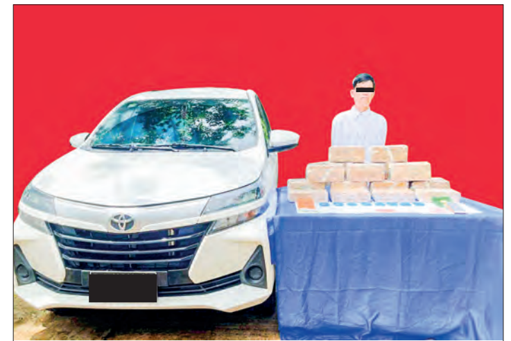
An arrestee is seen along with seized drugs and a saloon.

The suspects are prosecuted under the Narcotic Drugs and Psychotropic Substances Law. — MNA