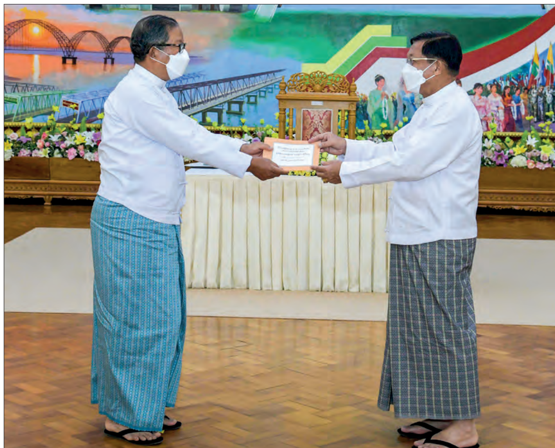
State Administration Council Chairman Prime Minister Senior General Min Aung Hlaing presents the fund from the State economic promotion fund.

THE Ministry of Planning and Finance set up a separate fund of K400 billion from the National Natural Disaster Management Fund in order to spend it on measures of developing State economy, with the aim of striving for rising socio-economic life of the people from regions and states as well as promoting their economy, said Chairman of the State Administration Council Prime Minister Senior General Min Aung Hlaing at the ceremony to hand over the fund from the State economic promotion fund at Bayintnaung Villa in Nay Pyi Taw yesterday morning.