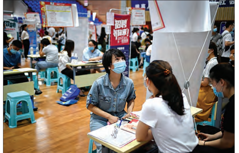
A job seeker (L) interacts with a hiring official of a company during a career fair in Zhengzhou, China's Henan province on 25 July 2020.

"What young people need most is well functioning labour markets with decent job opportunities for those already participating in the labour market, along with quality education and training opportunities for those yet to enter it."—AFP