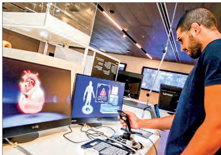
A visitor uses a joystick to navigate through a virtual heart at a display by RealView Imaging, at the Israeli Expo technology exhibit at the Peres Centre for Peace and Innovation in the Israeli coastal city of Tel Aviv on 3 September 2019.

Integrating Arab professionals into hi-tech meets both the needs for economic growth and the government's employment goals for 2030, it noted.—Xinhua