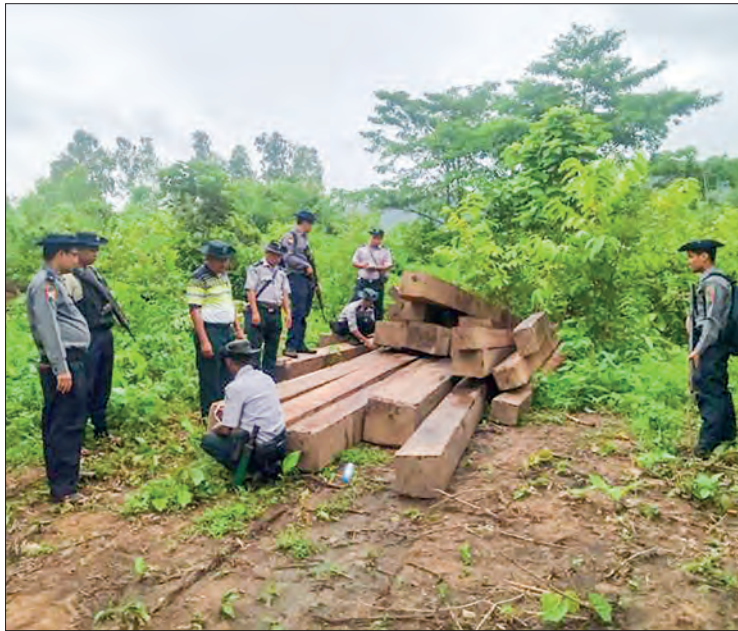
Officials check seized illegal timbers.

According to data collected by relevant forest departments, a total of 152.9236 tonnes of illegal timbers – 54.4870 tonnes of teak, 24.1132 tonnes of hardwood and 74.3234 tonnes of other woods — were caught in regions/states and Nay Pyi Taw between 1 and 7 August, and the department stated that they arrested 27 suspects along with 15 vehicles. — MNA