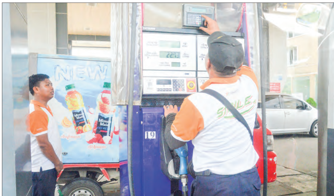
The fuel prices are moving onwards in the domestic markets and touching a high of over K2,200 per litre of Octane 92.

Furthermore, the Central Bank of Myanmar's recent foreign exchange policy is a contributing factor to the price rise.