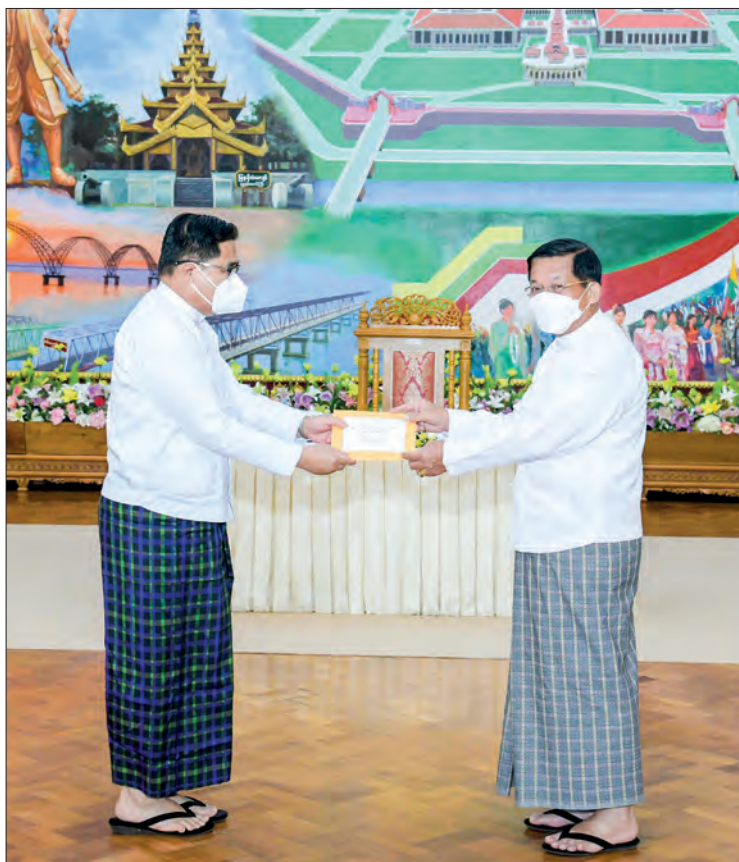
State Administration Council Chairman Prime Minister Senior General Min Aung Hlaing provides the fund from the State economic promotion fund.