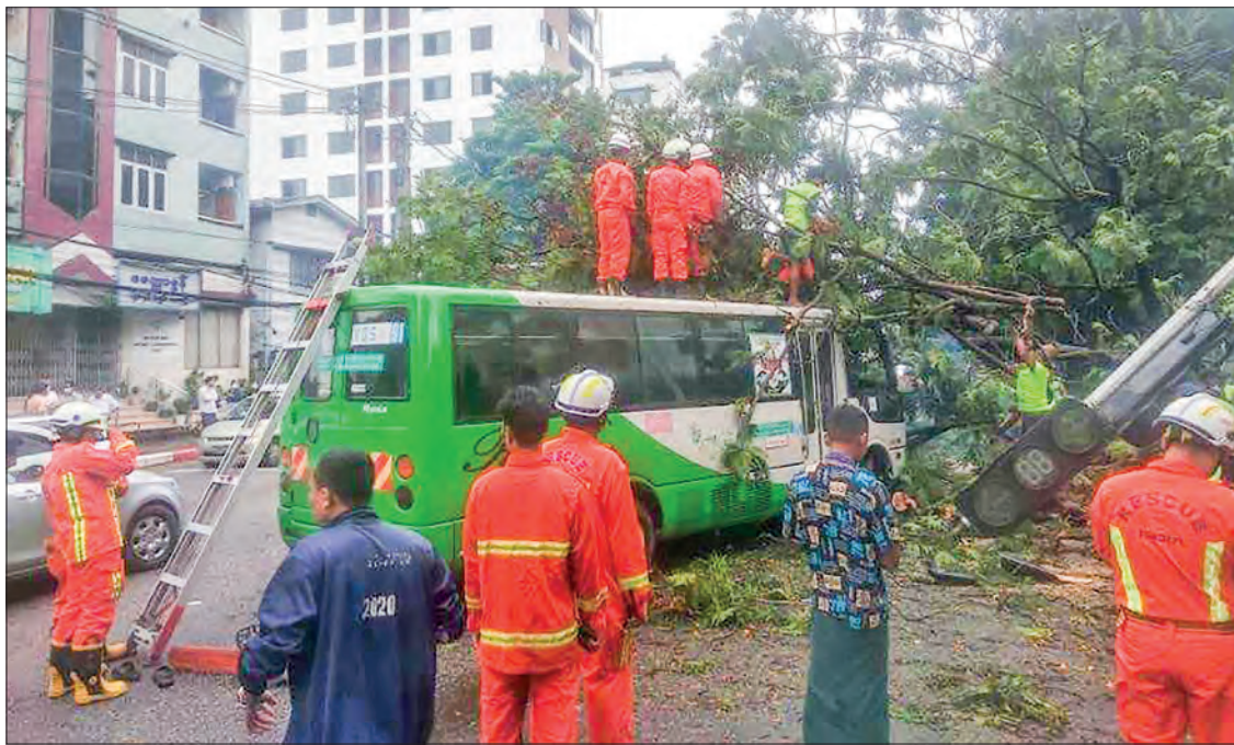
Responsible personnel are seen removing the fallen tree from the YBS bus.

The Fire Services Department declared that no one was getting hurt in the incident.