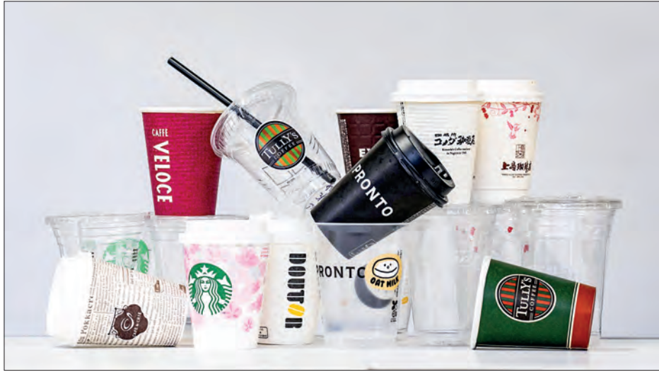
Photo shows disposable plastic and paper cups used to serve drinks by nine major coffee chains in Japan.

The group surveyed Starbucks, Tully’s Coffee, Pronto, Doutor, Caffe Veloce, Excelsior Caffe, Ueshima Coffee House,