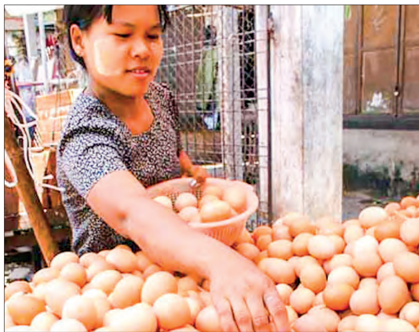
Some chicken and duck eggs were seen being sold in the market.

Afterwards, the meeting attendees coordinated the discussion and the Vice-Senior General concluded the meeting. — MNA