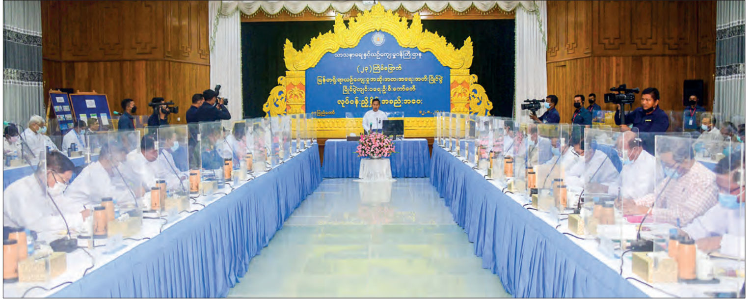
State Administration Council Vice-Chair Deputy Prime Minister Vice-Senior General Soe Win presides over the coordination meeting of the leading Organizing Committee on the 23 rd Myanmar Traditional Performing Arts Competition in Nay Pyi Taw yesterday.

The Vice-Senior General also talked about the same five musical instruments and basic dancing techniques, the suspension of the Myanmar Traditional Cultural Performing Arts Competitions in 2016, the consequences of such interruption, the relations between fine art culture and traditional customs and the side effects of disappearing these cultures and customs in daily life.