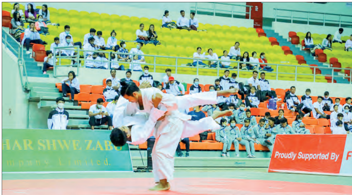
The 2022 Inter-State/Region Judo Tournament opens in Nay Pyi Taw yesterday.

Firstly, the Union minister expressed Judo is a Japanese traditional martial art and young people from Myanmar can catch