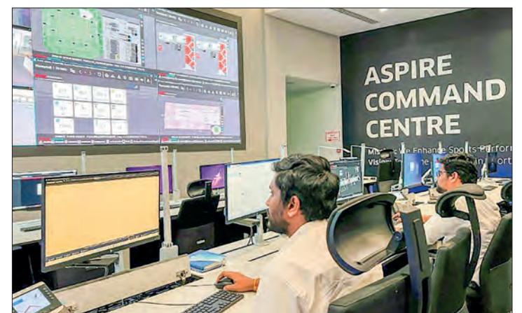
Ready for lift off: The Aspire control and command centre will monitor stadiums at the World Cup.

FACING a bank of screens that look like NASA mission command, technicians counting down to the World Cup in Qatar control the temperature, gates, 15,000 cameras and much more in the eight stadiums.