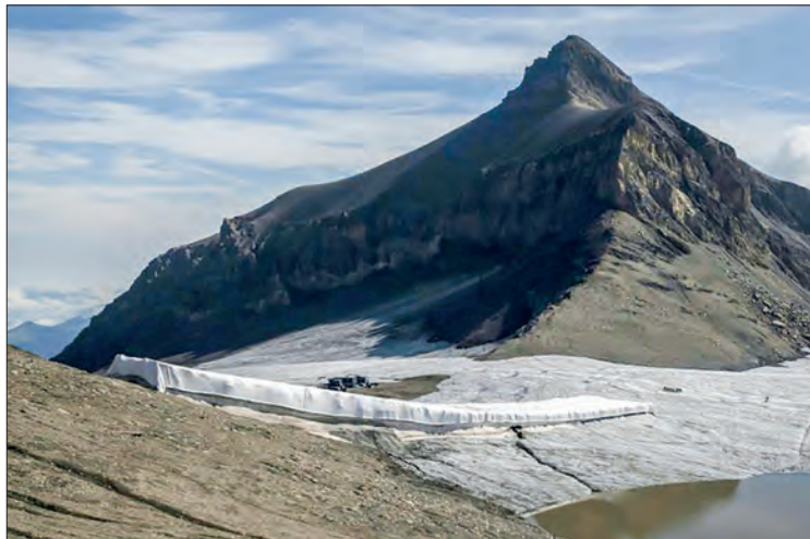
The pass between Scex Rouge and Tsanfleuron in western Switzerland has been iced over since at least the Roman era.

THE thick layer of ice that has covered a Swiss mountain pass for centuries will have melted away completely within a few weeks, a ski resort said Thursday.