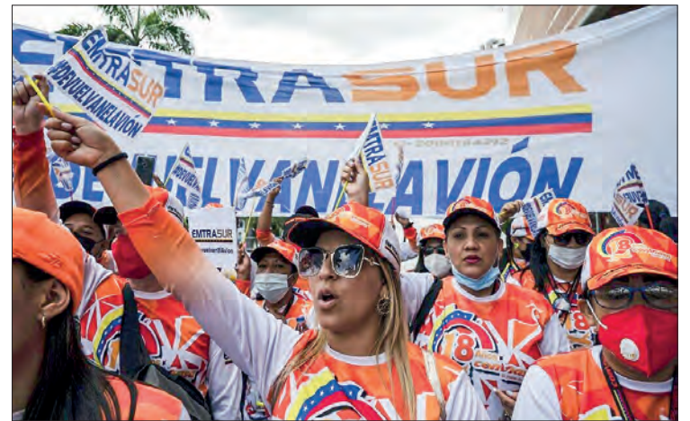
Workers of the Venezuelan airline Conviasa protest in front of the Argentine embassy in Caracas demanding the return of an Emtrasur cargo plane and its crew that were held in Argentina on 8 June under investigation, in Caracas, on 11 August 2022.