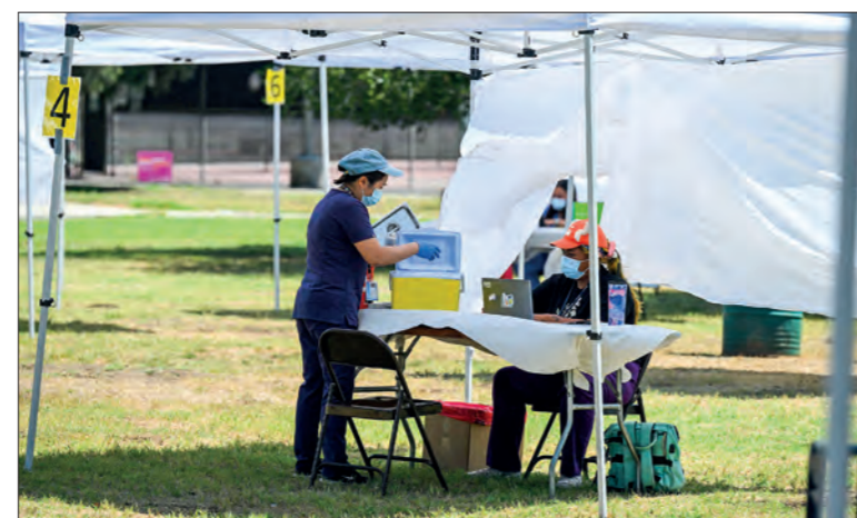
A public health worker delivers monkeypox vaccines in a yellow cooler at a vaccination site at the Balboa Sports Centre in the Encino neighbourhood of Los Angeles, California, on 27 July 2022.