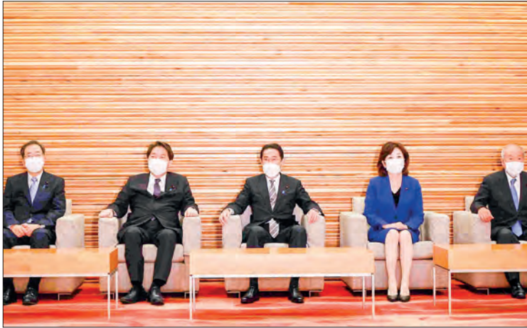
Japan's prime minister reshuffled his cabinet Wednesday.

JAPANESE business leaders hailed Prime Minister Fumio Kishida's Cabinet reshuffle on Wednesday as having an experienced lineup versed in policymaking, and they expressed hope the new team will quickly and effectively respond to key challenges such as energy supply concerns and rising prices.