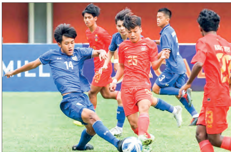
Myanmar players (red) battle for the ball against the Thai team during their 3 rd place match of the AFF U-16 Championship held in Indonesia on 12 August 2022.

In the first half, the Thai team was able to play more pressingly, but both teams failed to capitalize on their opportunities, resulting in a scoreless draw in the first half. In the second half, the Myanmar team changed tactics, but