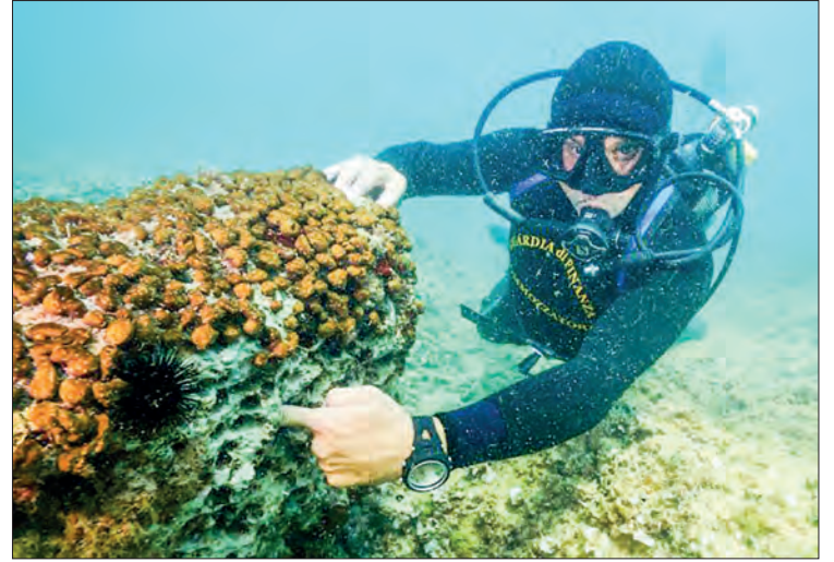
Calcareous rock is gutted by hundreds of holes chiselled by poachers to extract date mussels.

Fuelling the trade are the soaring black-market prices for the narrow brown "Lithophaga lithophaga", said to boast a delicate oyster-like flavour, which can cost nearly 200 euros ($205) per kilo. Poachers supply fish markets or restaurant owners who sell under the table to high rollers — including cash-rich mafiosi — flaunting their wealth at Sunday lunches with a raw seafood platter or extravagant spaghetti.— AFP