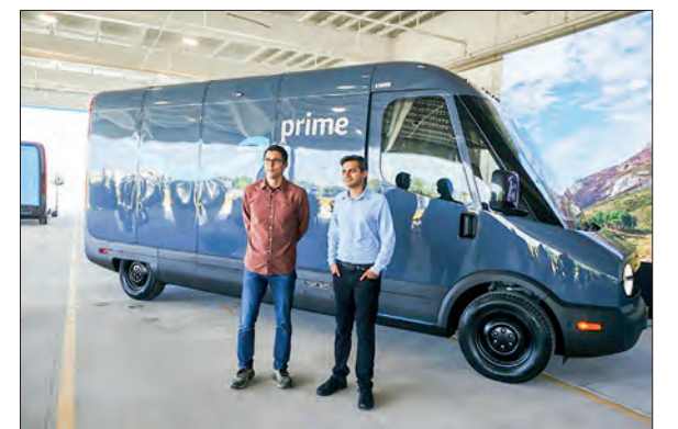
Rivian says it has rolled out specially designed electric delivery vehicles with Amazon in more than a dozen US cities as part of an effort by the e-commerce giant to be more climate friendly.

A supplier of networking equipment, phones, and other state-of-the-art gear, Huawei has struggled in the wake of a crackdown by the administration of former US president Donald Trump, which cited cybersecurity and espionage concerns.—AFP