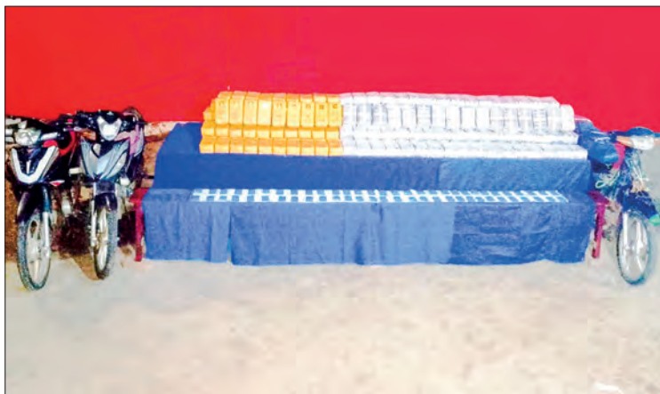
Seized stimulant tablets and motorbikes.

The police checked polypropylene (PP) bags and seized 2.42 million stimulant tablets worth K3.63 billion. The police have taken legal action against the suspects, and an investigation is underway to identify the perpetrators of the crime chain. — MNA