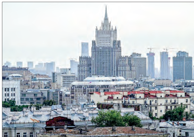
The Russian foreign ministry in downtown Moscow.

RUSSIA said on Thursday that Switzerland has lost its neutral status and cannot represent Ukraine diplomatically in Russia, blaming Bern's decision to impose sanctions on Moscow.