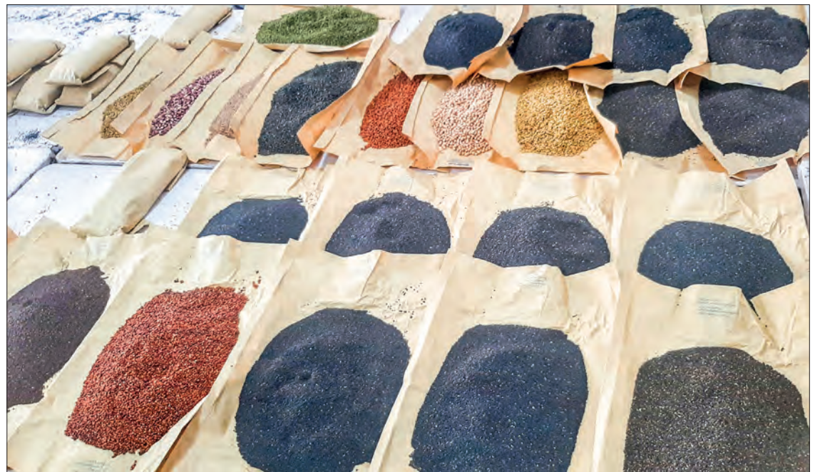
The prices of black gram increased rapidly to over K1,820,000 per tonne in the domestic pulses market... Various pulses and beans are pictured in the market.

Myanmar exported US$1.57 billion worth of over two million tonnes of various pulses to foreign trade partners last financial year 2020-2021. The country shipped 1.24