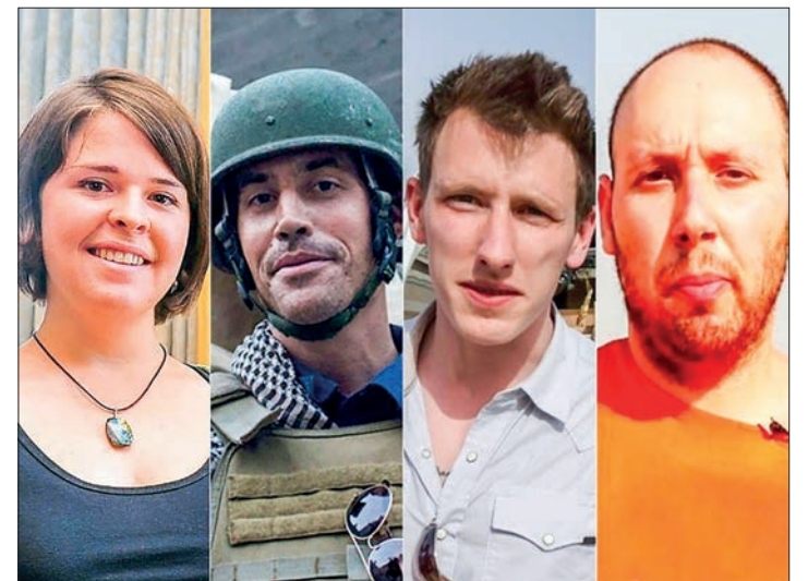
From left to right, Kayla Mueller, James Foley, Peter Kassig and Steven Sotloff.

The interior ministry said in a statement that a British national had been deported from Türkiye to the UK.—AFP