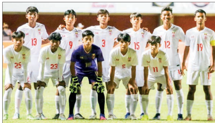
Myanmar U-16 boy's football team.

THE 2022 ASEAN U-16 Championship third-place match and the final will continue today, and the Myanmar team will play the third-place match against the Thai team.