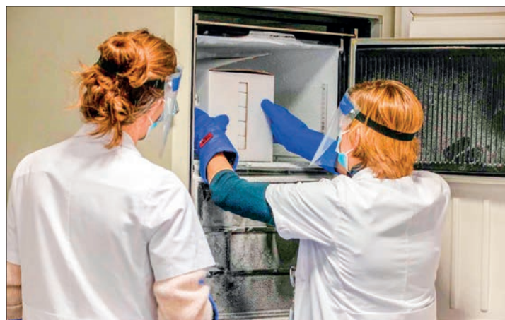
Medical staff place vaccines in an ultra-low temperature freezer after taking delivery of the first shipments of Pfizer-BioNTech vaccine at the UZ Leuven hospital in Leuven, Belgium.

The EMA, which oversees medicines for the 27-nation European Union, has previously said the first Omicron-adapted jabs could be approved as early as September.—AFP