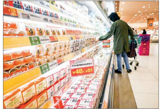
A shopper browses in the food section at a supermarket in Tokyo's Ota Ward in May 2022.

These items would bring the total number of products that have risen