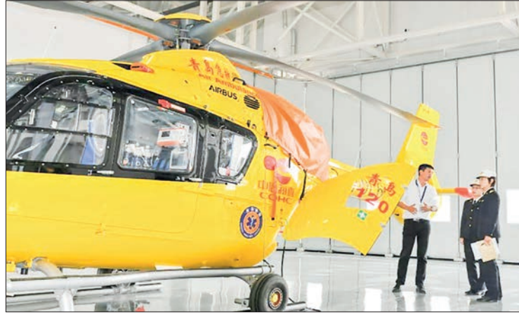
Customs officers research in the helicopter production enterprise in Qingdao, East China's Shandong Province, in October, 2020.

During the talks, the two sides agreed to accelerate the second-phase negotiation of the China-ROK free trade