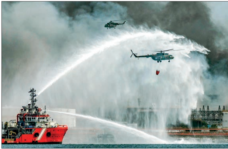
The Mexican firefighting vessel "Bourbon Artabaze" and helicopters battle to contain the days-old blaze at a fuel depot sparked by a lightning strike in Matanzas, Cuba.