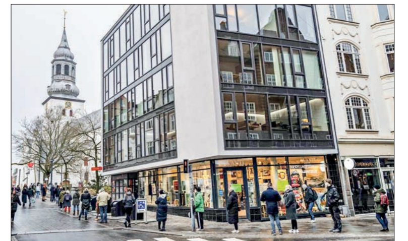
People queue for a rapid test at a test centre set up at Budolfi Church in the centre of Aalborg, Denmark on 23 December 2021, during the coronavirus (Covid-19) pandemic.