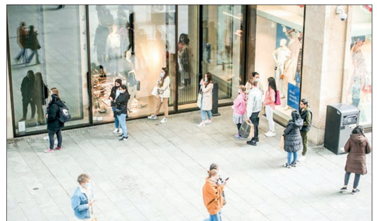
People stand distanced in line as they wait to enter a fashion store at a shopping mall in Berlin on 25 March 2021, amid the novel coronavirus / COVID-19 pandemic.

"Becoming a cloud region will mean New Zealand businesses will have a choice to keep their data onshore, and work with Google Cloud's domestic team to really drive digital transformation here," Clark said in a statement.—Xinhua