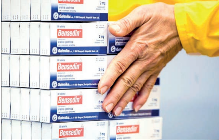
Anti-depressants are mostly developed to alter serotonin levels.

A controversy in the scientific community over recent claims anti-depressants can be ineffective at treating depression has highlighted the difficulties in understanding mental health conditions.