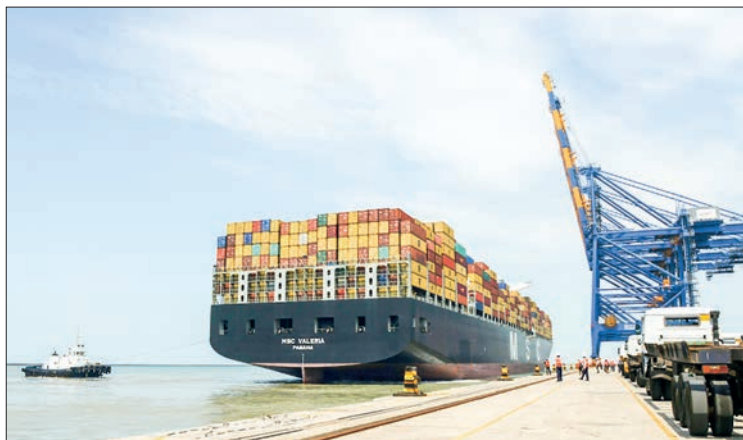
A European containership prepares to dock at Mundra Port in Gujarat, India.

BEFORE 2014, the Indian economy was considered to be fragile and investors had their doubts about doing business but now the developed countries are keen to sign trade deals with India as they see it as an engine of economic growth, Union Minis-