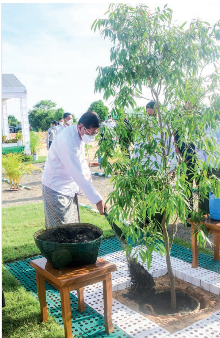
The Senior General plants the Gangaw sapling at the event.

Like Pakistan, Viet Nam and the Philippines, he said, Myanmar is launching green campaigns to help protect and conserve the natural environment, contribute to economic development and alleviate climate change and global