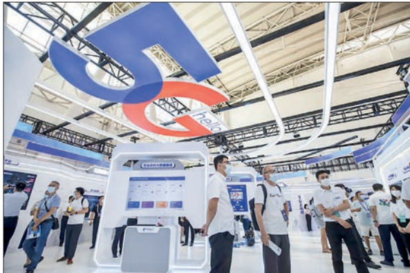
People visit the exhibition booth of China Telecom at the 2022 World 5G Convention in Harbin, capital of northeast China's Heilongjiang Province, 10 Aug 2022.