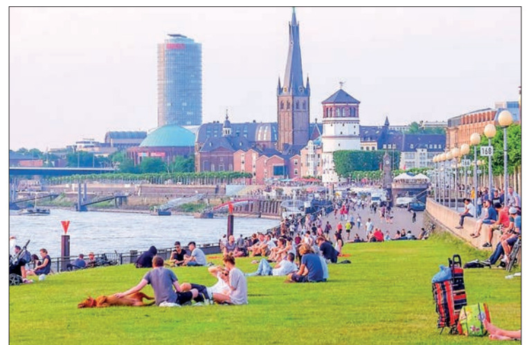
A 2018 drought, which saw the Rhine’s reference depth at Kaub fall as low as 25 centimetres in October, shaved 0.2 per cent off German GDP that year, according to Deutsche Bank Research. People enjoy a hot evening on the bank of river Rhine as the sun sets in Duisburg, western Germany.

“We supply factories on the Rhine with their raw materials. When that’s not possible any more – or less often – that’s a threat to German industry, too,” Spranzi says.—AFP