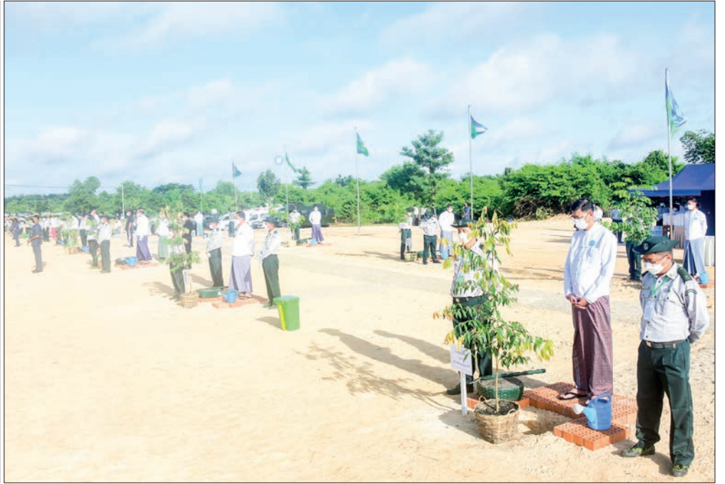
State Administration Council Chairman Prime Minister Senior General Min Aung Hlaing addresses the monsoon plant-growing ceremony in Nay Pyi Taw on 11 August 2022.

STATE Administration Council Chairman Prime Minister Senior General Min Aung Hlaing planted a Gangaw ( Mesua ferrea ) sapling at a monsoon plant-growing function held in the Union Territory, Nay Pyi Taw, yesterday morning.