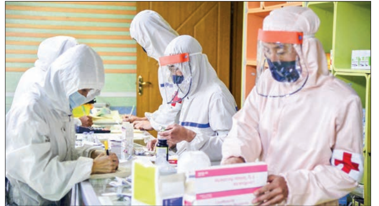
Members of the North Korean army supply medicines to residents at a pharmacy, amid growing fears over the spread of the coronavirus disease (COVID-19), in Pyongyang, North Korea, in this photo released by Kyodo on 18 May 2022.

The sister, who is vice department director of the Central Committee of the Workers' Party