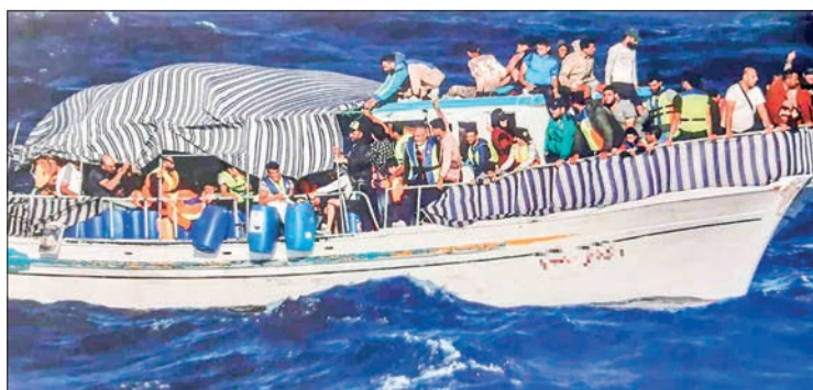
A handout photo released on 28 June 2022 by Hellenic Coast Guard shows migrants on a boat during a search and rescue operation off Karpathos island.

A video posted by the coastguard showed an army helicopter rescuing two survivors from the sea and transferring them to Karpathos.—AFP