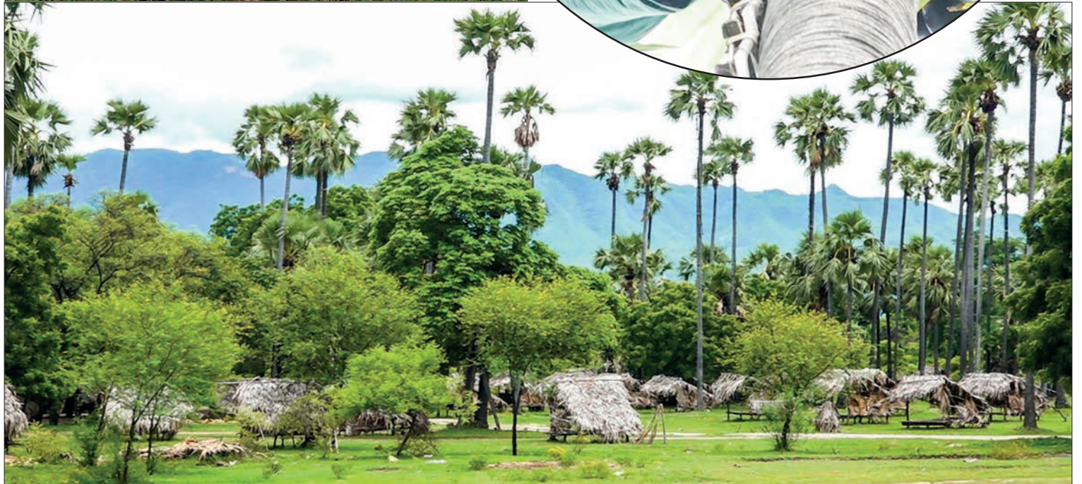
The undated photo shows a general view of the Eain Shae Min (Crown Prince) Toddy Land.

the Crown Prince's Toddy Land were analyzed and conducted the socioeconomic research, it is found that these plants are the ones from over 160 years (Yadanabon era), based on the facts: having no scar on the trunk due to the long lifespan of the plant, having double outer bark of the plants and having year rings (shows the age of a plant)