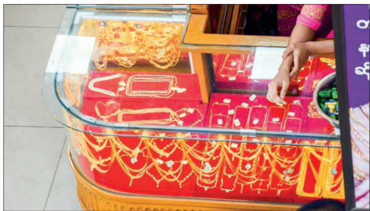
Gold jewellery is seen at one gold outlet in Yangon.

THE pure gold price jumped to a new record high at over K2.5 million per tical (0.578 ounce or 0.016 kilogramme), said gold traders.