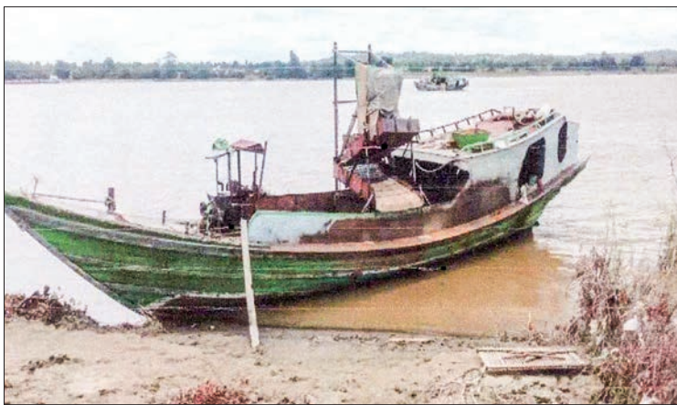
Seized motor craft.

Therefore, 17 arrests estimated at K360,830,360 were made on three consecutive days from 8 to 10 August, according to the Anti-Illegal Trade Steering Committee. — MNA