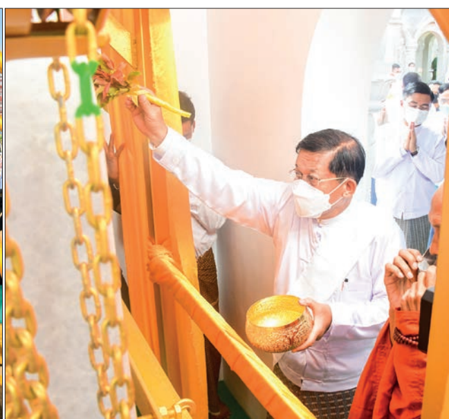
The Senior General sheds water into the sapling (left) and sprinkles scented water on the stone plaque(right).

gula plant and poured water into the sapling. Then, the Vice-Senior General and council members also grew saplings at the designated places.