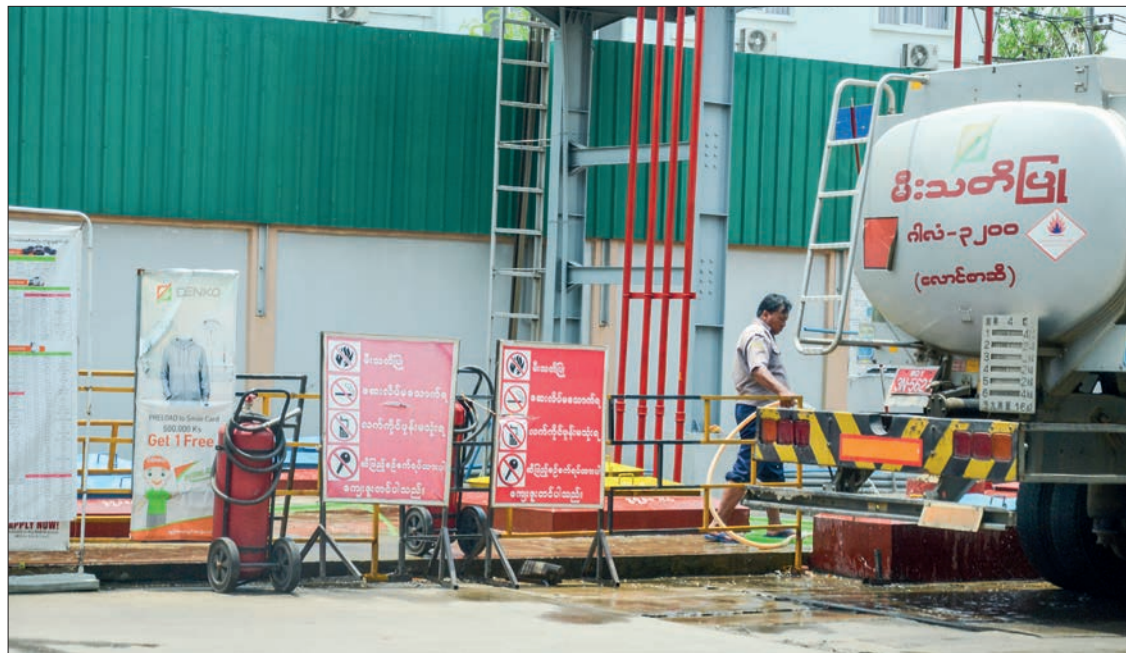
A fuel oil bowser is pictured filling fuel at one petrol outlet in Yangon.

Furthermore, the Central Bank of Myanmar's recent foreign exchange policy is another reason for the price hike. The CBM raised the reference exchange rate for a US dollar from K1,850 to K2,100 on 5 August.