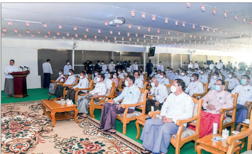
The Senior General hears the report on the carving of the Maravijaya Buddha Image at the event yesterday.