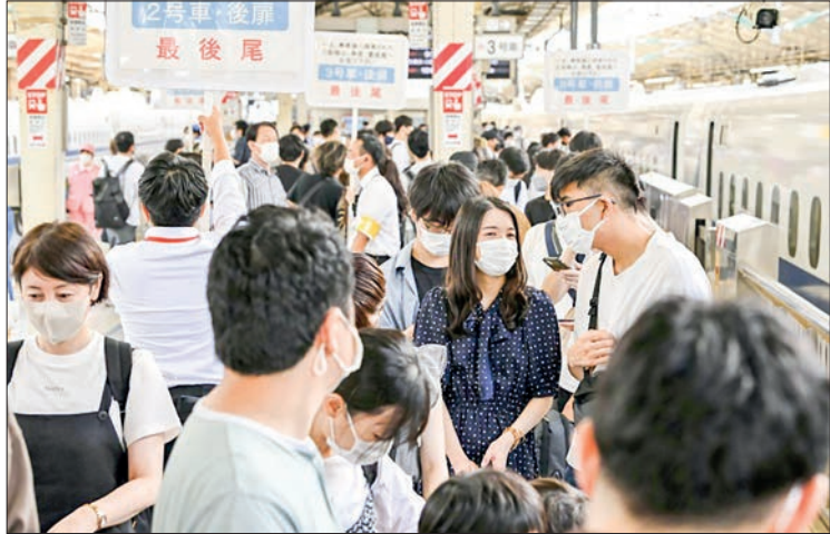
A platform at JR Tokyo Station is crowded on 11 Aug 2022, as many travellers head to their hometowns or resorts for Japan's "Bon" holidays in the first restriction-free summer since the start of the coronavirus pandemic.

JAPAN'S summer holiday season started in full swing on Thursday, with reservations for domestic trains and flights leaving Tokyo reaching a peak as travellers took advantage of a lack of coronavirus restrictions for the first time in three years.