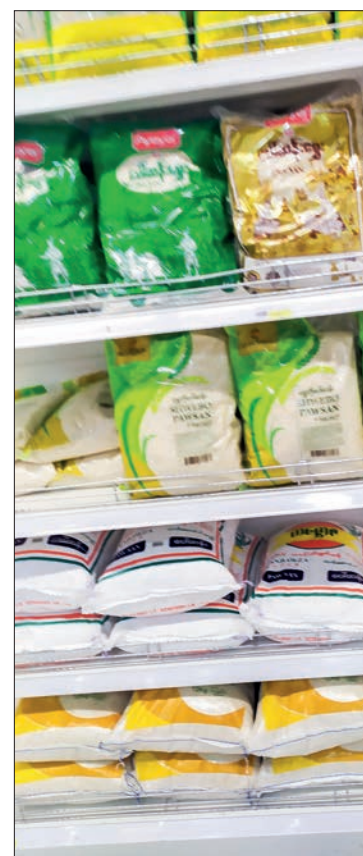
Rice for sale in a shopping mall.

The price of Shwebo Pawsan rice is usually higher than Patheingyi and Myaungmya rice by K5,000 per bag, but when the new Pawsan rice entered the market this year, it was sold at the same price at K43,000 per bag in January, which is unique this year, according to a shopkeeper of the Bayintnaung Rice Market. — TWA/GNLM