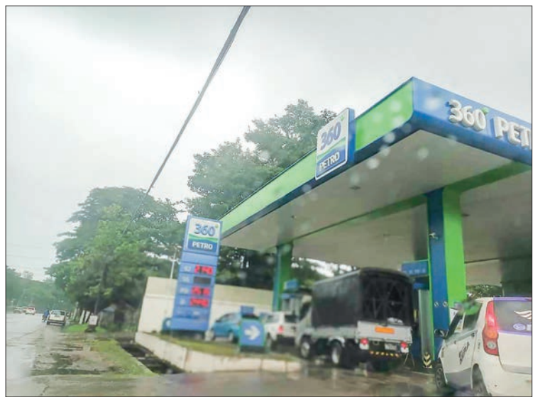
A sign is seen showing no display of prices at one petrol outlet in Yangon on the evening of 11 August.

Currently, fuel prices are calculated based on the MOPS price by the Fuel Import, Storage and Distribution Supervisory Committee, and if consumers are not satisfied, they can report to the committee. — TWA/GNLM