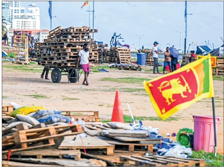
The protest camp is taken apart in Colombo.

PROTESTERS in Sri Lanka who brought down the previous government announced they were dismantling their main demonstration site near the president's office on Wednesday in the wake of a crackdown against their leaders.