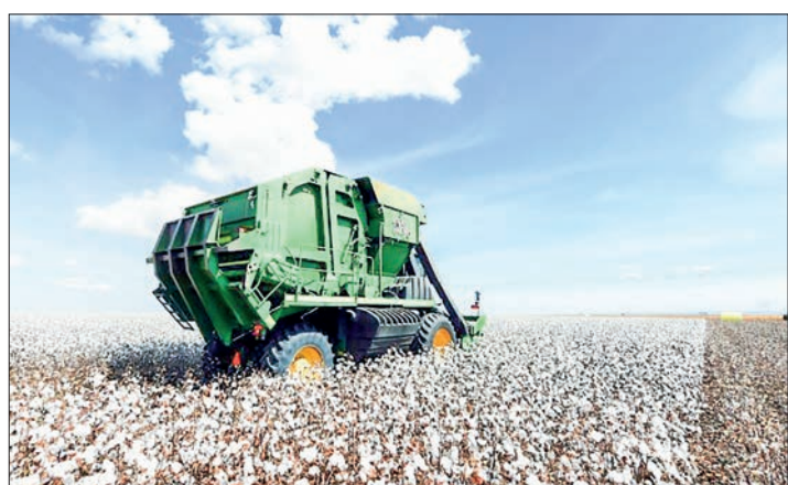
A combine harvests cotton in a field at Pamplona farm in Cristalina, Brazil on 14 July 2022.

The industry is trying to improve the international image of Brazilian farming, tarnished by a history of slave labor, heavy pesticide use and the destruction of the Amazon rainforest for agriculture, a trend that has accelerated under far-right President Jair Bolsonaro – an agribusiness ally.—AFP