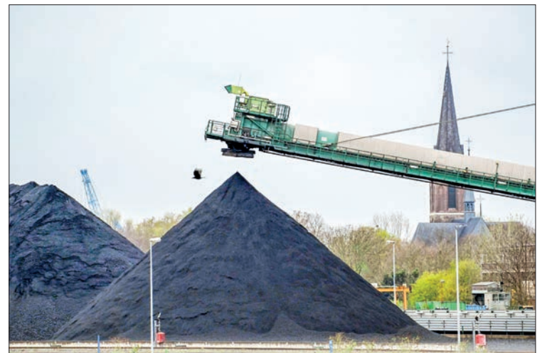
The EU ban on Russian coal will further tighten coal markets and could trigger a rise in energy prices beyond Europe.

In the face of cuts to Russian gas deliveries in recent months, EU members such as Germany, Austria, the Netherlands and Italy have stepped up their use of coal-fired power plants. — AFP