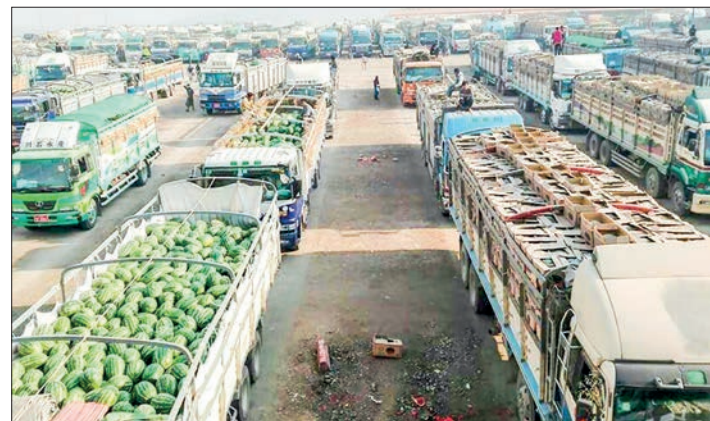
The file photo shows vehicles carrying watermelons to be exported to China last year.