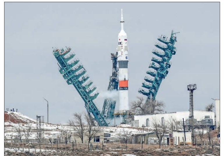
The Soyuz MS-20 rocket shortly before launch at Baikonur cosmodrome in December 2021.

As Moscow's international isolation grows under the weight of Western sanctions over Ukraine, Putin is seeking to pivot Russia towards the Middle East, Asia and Africa and find new clients for the country's embattled space programme.—AFP