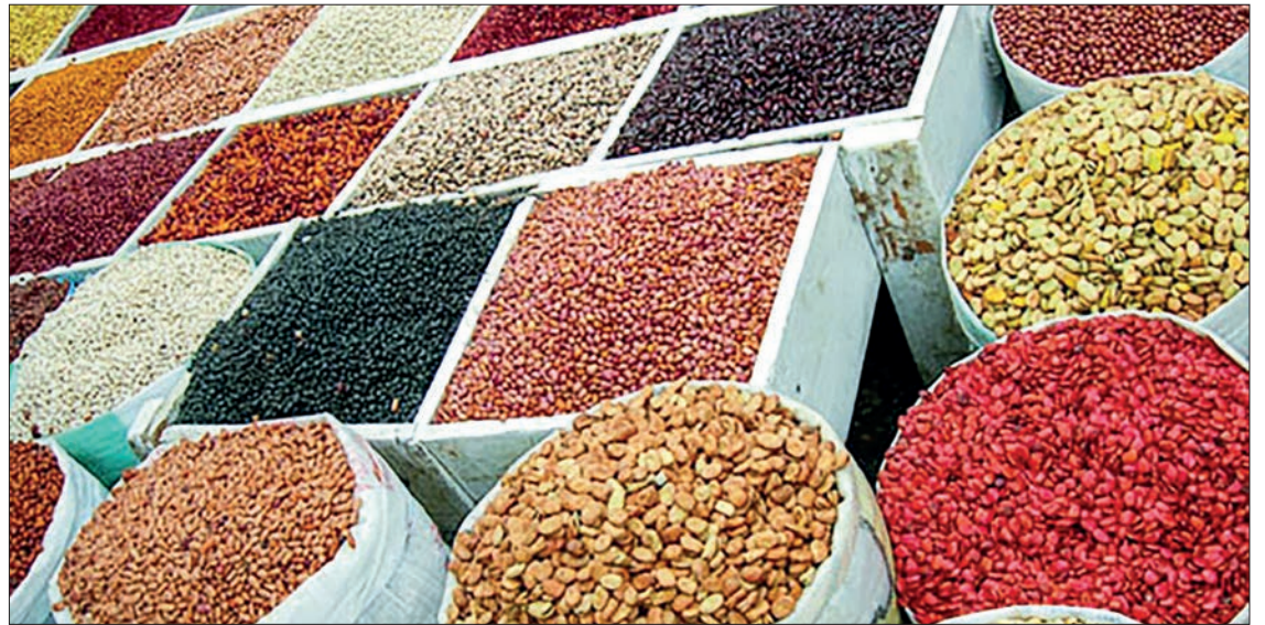
Beans and pulses are seen in the market.

In 2021, the country exported $1,324.27 million worth of 1.75 mil-