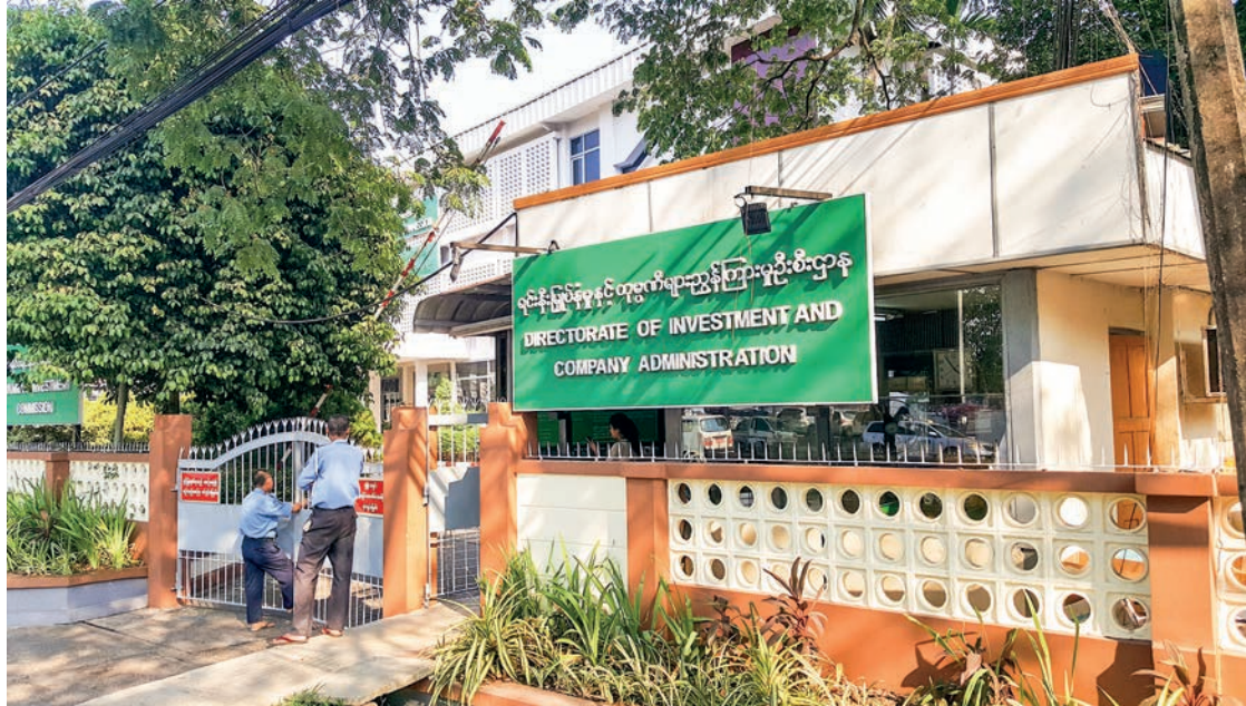
The office of the Directorate of Investment and Company Administration.

One enterprise each from Belize and Japan also made investments in the past four months respectively. The existing enterprises from China Taipei, China, Hong Kong SAR,