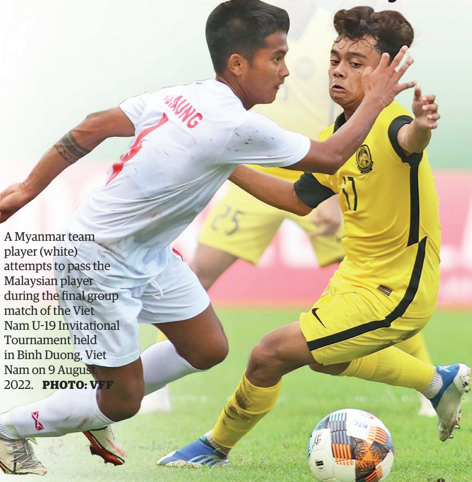
A Myanmar team player (white) attempts to pass the Malaysian player during the final group match of the Viet Nam U-19 Invitational Tournament held in Binh Duong, Viet Nam on 9 August 2022.

THE final day of the group matches in the Viet Nam U-19 Invitational Tournament was held on 9 August in Binh Duong, Viet Nam and Myanmar lost to the Malaysia team 0-2.