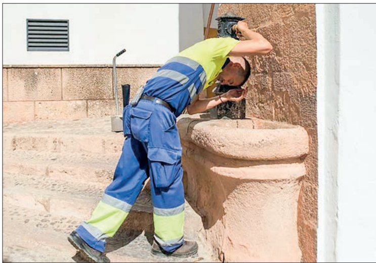
Outdoor workers are at risk during the heatwave gripping Europe.