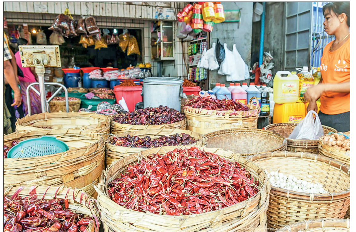
A vendor is pictured selling kitchen goods at one grocery outlet.

The price of rice rose this week. On 9 August, Shwebo Pawsan was priced at K80,000-K88,000 per bag while K61,000-K65,000 per bag of Pathein-Myaungmya rice, K59,000-K63,000 per bag of Pyapon Pawsan,