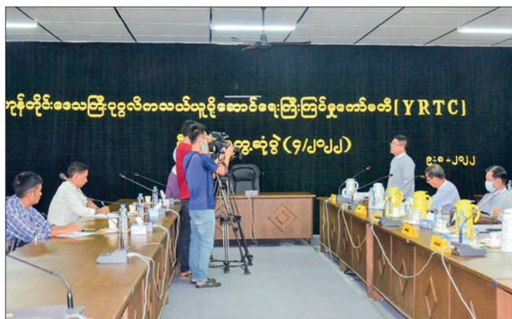
The Yangon Region Transport Committee-YRTC meets the media on lines.

They will select and reward K300,000 to a total of 60 drivers: three drivers per company from the well-disciplined bus lines, and 20 drivers who have good moral behaviour by returning lost expensive items and cash to passengers, on 26