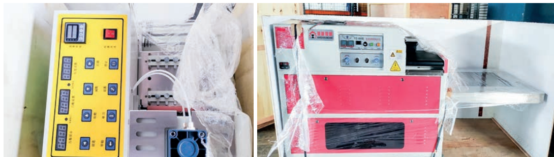
Confiscated illegal electronics at the Hteedan Port Terminal in Yangon Region.

SUPERVISED by the Anti-Illegal Trade Steering Committee, effective action is being taken to prevent illegal trade under the law.