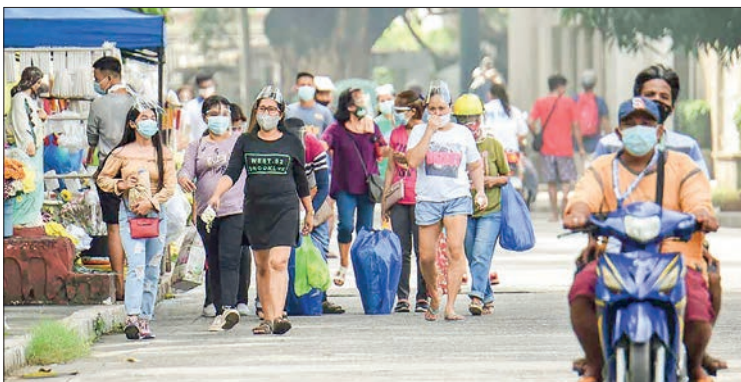
This file photo shows residents wearing government-imposed face masks and face shields to protect them from COVID-19 coronavirus disease in Manila.

THE Philippine economy expanded by 7.4 per cent year-on-year in the second quarter of 2022 as the country eased the COVID-19 mobility restrictions allowing more social and economic activities to thrive, the