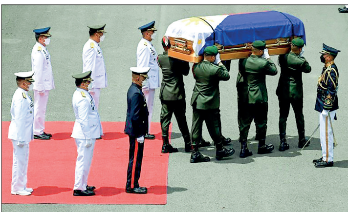
Former president Fidel Ramos oversaw a rare period of steady growth and peace in the turbulent years after the dictatorship of Ferdinand MARCOS

Known as "Steady Eddie" for his unflappable demeanour during the country's regular moments of upheaval, he was frequently pictured chewing unlit cigars as he guided the Philippines with a sure hand from 1992-1998.