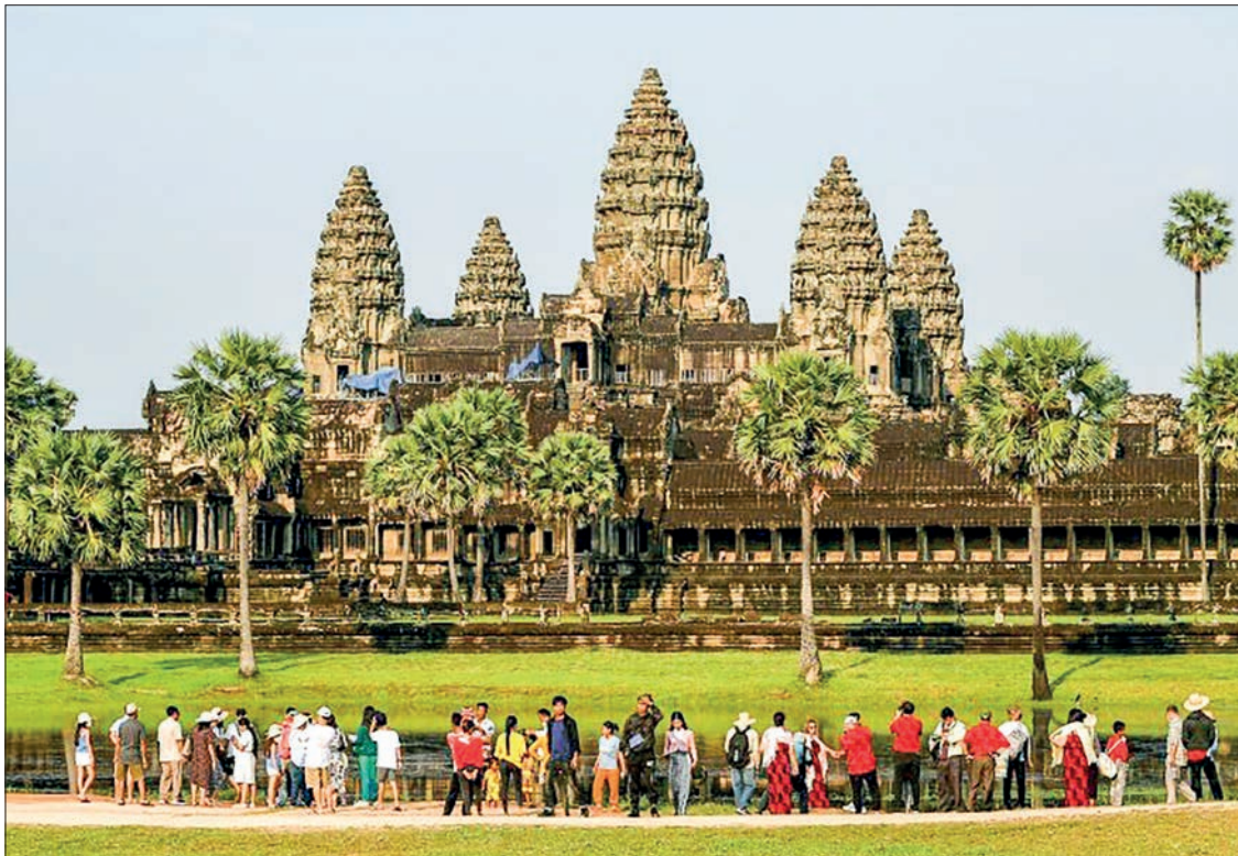
Some of the antiquities had been stolen from the temples of Angkor, such as the temple of Angkor Wat (pictured April 2022) in Cambodia.

THE United States on Monday returned 30 stolen works of art and antiquities to Cambodia that had been looted from the south-east Asian nation, including from an ancient Khmer city, and illegally trafficked around the world for decades.