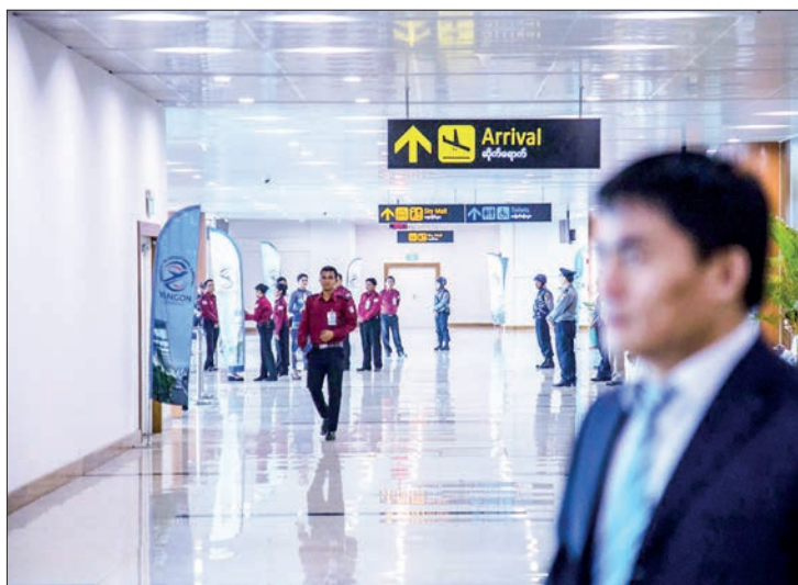
The arrival lounge of the Yangon International Airport.

THE Ministry of Foreign Affairs released the terms and conditions of tourist visas for entering Myanmar via Yangon International Airport. IT said if the decision is made to disallow entry, the passengers have to return by the same flight.