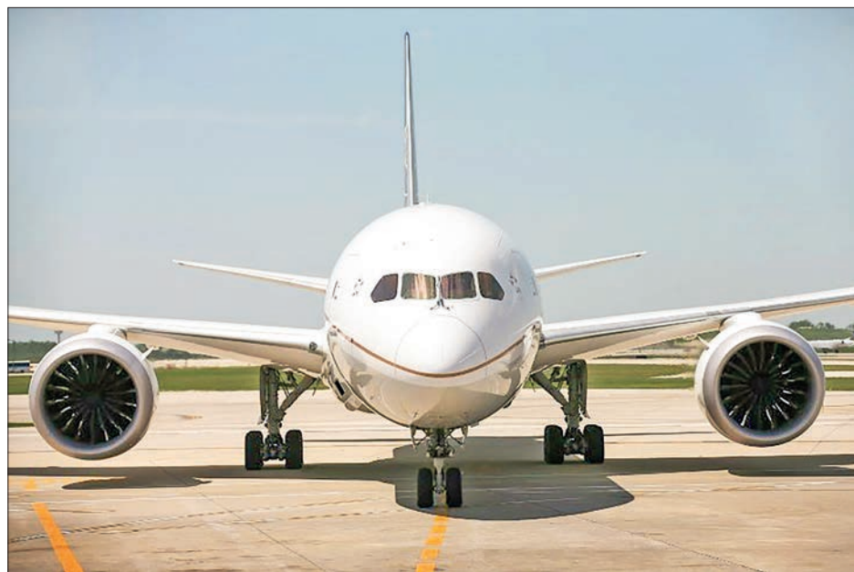
The FAA has approved changes Boeing made to production of its 787 Dreamliner which will allow deliveries to resume.

date to late summer 2020, when the company uncovered manufacturing flaws with some jets. Boeing subsequently identified additional issues, including with the horizontal stabilizer.