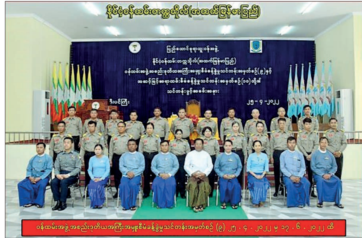
The trainees of the Management Course No 9 for Executive-Level Officials (25 April to 17 June, 2022) are pictured at the Civil Service Academy (Upper Myanmar).

Subjects imparted by the Department of Management Studies include: General Management, Leadership, Project Management, Office Work, Office Management, Financial Regulation, Departmental Accounting, Natural Disaster Management, Environmental Management, Ethics and Cooperate Social Responsibility, Human Resource Management, Supervision, Service Management, Total Quality Management, Knowledge Management, Learning Organization, International Organization for Standardization - ISO and Training and Development.