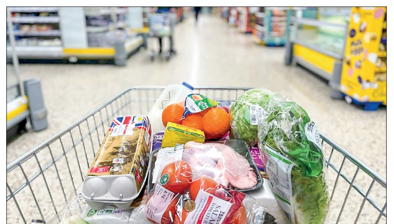
A shopper fills their basket in a Tesco supermarket: scientists have studied the environmental impact of 57,000 products sold in supermarkets in Britain and Ireland.

Researchers believe that in general, the more sustainable a food is, the better it is from a nutritional point of view.—AFP