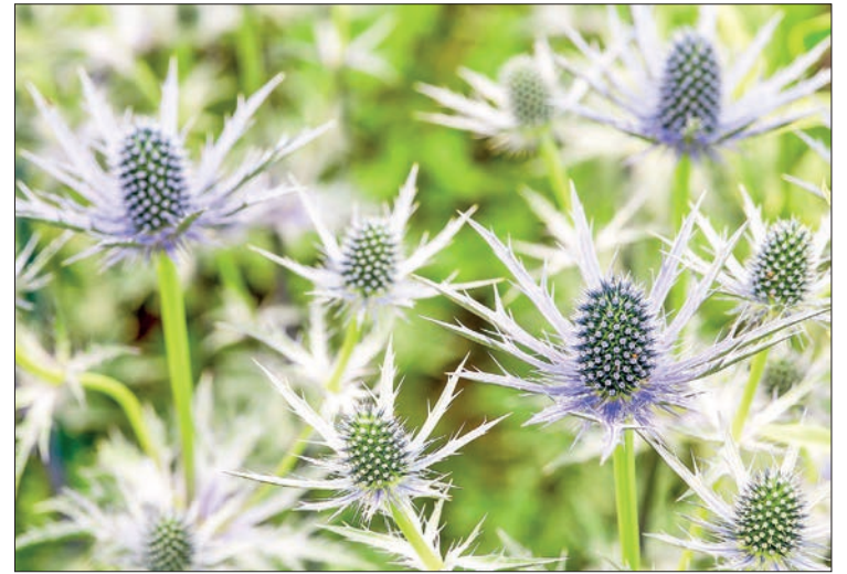
The system, which is activated when the environment is dry, allows a plant to reduce water loss from their pores while maintaining carbon dioxide (CO 2 ) intake. PHOTO: GARDENERS WORLD / PHOTO FOR REPRESENTATION PURPOSE ONLY

Diego Marquez, co-author of the study, said the next step for the team is identifying structures inside plants that control the mechanism.—Xinhua