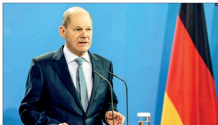
German Chancellor Olaf Scholz.

INVESTIGATORS have examined emails of German Chancellor Olaf Scholz over a widening probe related to a huge tax scandal that cost the government billions of euros, newspaper Hamburger Abendblatt report-