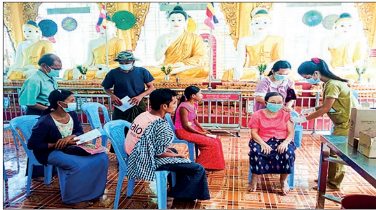
A local in Toungoo Township, Bago Region gets COVID-19 vaccine shot on 9 August.

DOCTORS and nurses from public hospitals, Tatmadaw medical teams, healthcare workers and volunteers are working hard to give COVID-19 vaccines in different states and regions as the vaccination programme is one of the most important activities in the prevention, control and treatment of COVID-19 disease.