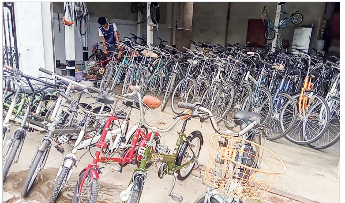
Various types of bikes are seen at one of the bike outlets in Yangon.