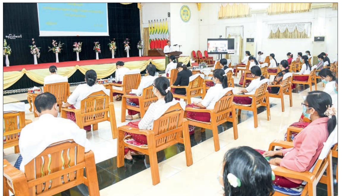
The closing event of the In-house Skill Development Training No 37 for Senior Auditors is in progress.

During the three-week face-to-face training, 107 trainees from the Head Office, the Union Territory and the Auditor-General's Offices of State/Region