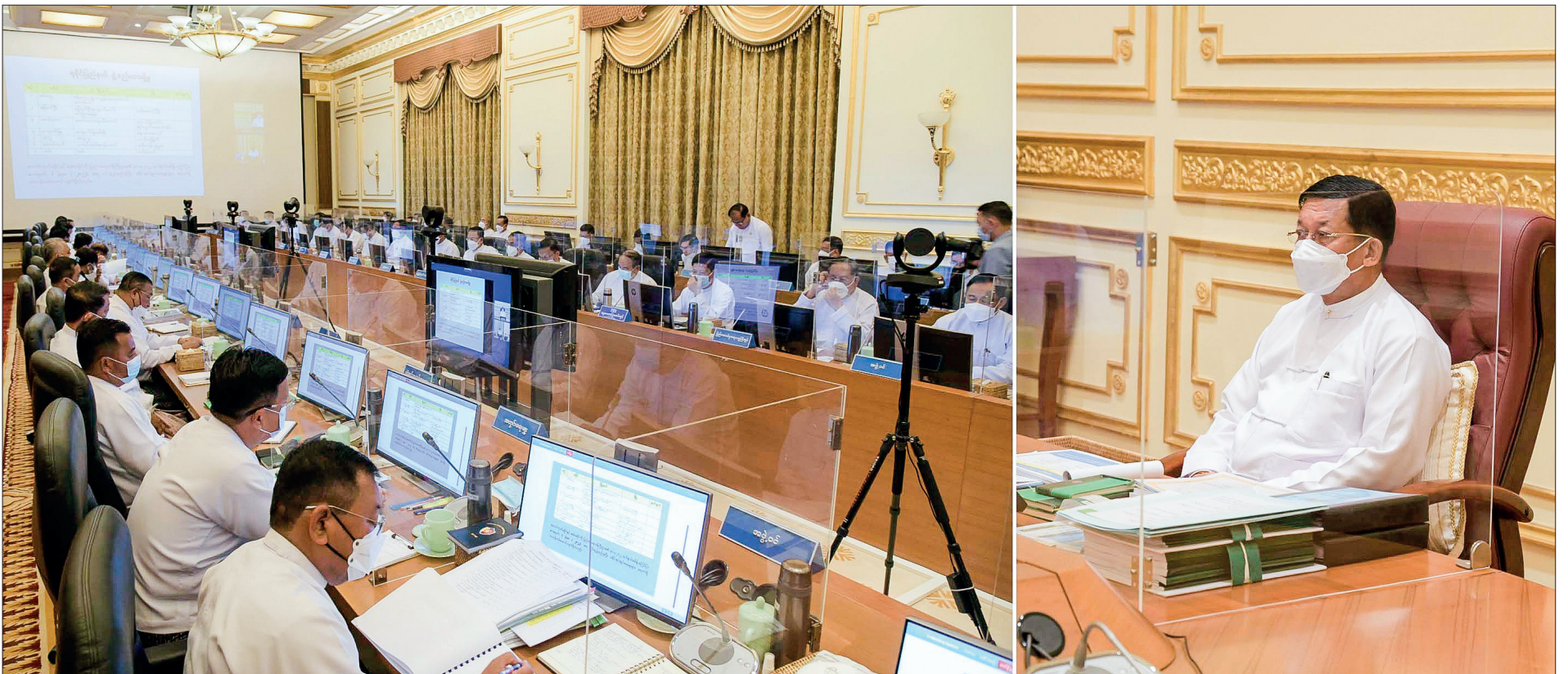
State Administration Council Chairman Prime Minister Senior General Min Aung Hlaing presides over the second-day coordination meeting of the Union government in Nay Pyi Taw on 9 August 2022.

A coordination meeting on undertakings of the Union government continued for the second day at the office of the State Administration Council Chairman yesterday morning with an address by SAC Chairman Prime Minister Senior General Min Aung Hlaing.