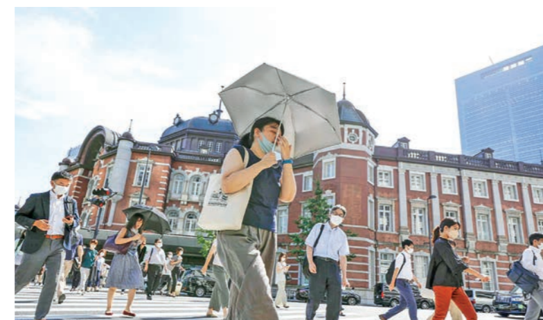
New COVID-19 vaccines considered effective against the omicron variant will be available to all people who have completed at least two inoculations from as early as mid-October, the government said Monday.

N EW COVID-19 vaccines considered effective against the omicron variant will be available to all people who have completed at least two inoculations from as early as mid-October; the government said Monday.