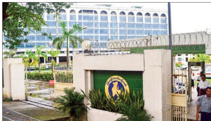
The Central Bank of Myanmar.

The prices of black gram in Myanmar are correlated with In-