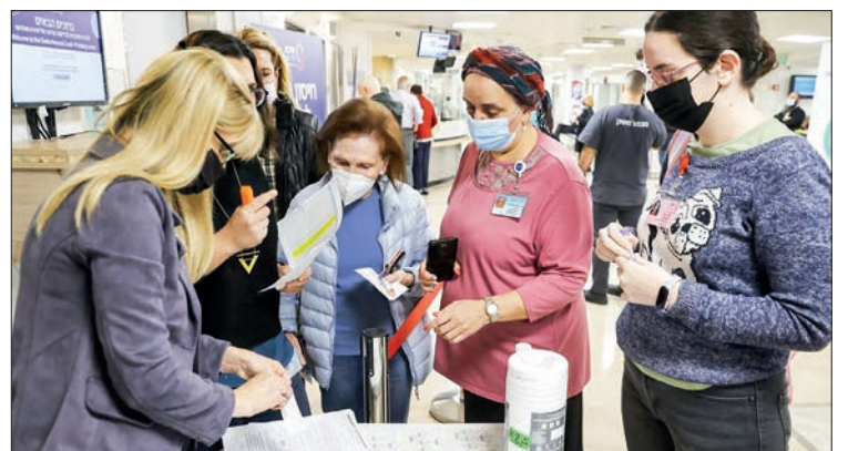
Staff volunteers queue to receive a fourth dose of the Pfizer-BioNTech COVID-19 coronavirus vaccine at the Sheba Medical Center in Ramat Gan near Tel Aviv, on 27 December 2021.

GERMAN vaccine developer BioNTech could deliver its COVID-19 vaccines adapted to the Omicron BA.1 and BA.4/5 sub variants in October if given regulatory approval. Together with its US partner Pfizer, BioNTech planned to "supply both vaccines in time for fall booster campaigns," the company said when presenting its figures for the first half of the year (H1) on Monday. BioNTech's net profit in H1 rose to 5.37 billion euros (5.48 billion US dollars), up from 3.92 billion euros in the same period last year, according to the company. Despite a sales slump in the second quarter, revenue in the first six months rose by 30 per cent year-on-year and reached 9.57 billion euros. BioNTech confirmed its guidance for the full fiscal year 2022, expecting sales of its COVID-19 vaccines to range