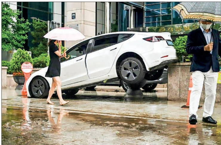
A car damaged by flood water is seen on the street after heavy rainfall at Gangnam district in Seoul.

SUBWAY stations and major roads were underwater in the South Korean capital Seoul after record-breaking rains caused severe flooding, with at least seven people dead and seven more missing, officials said Tuesday.