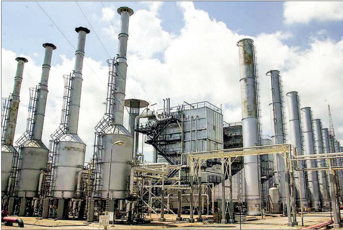
This photo shows the Brunei liquefied natural gas (LNG) processing plant located in Lumut, Brunei.