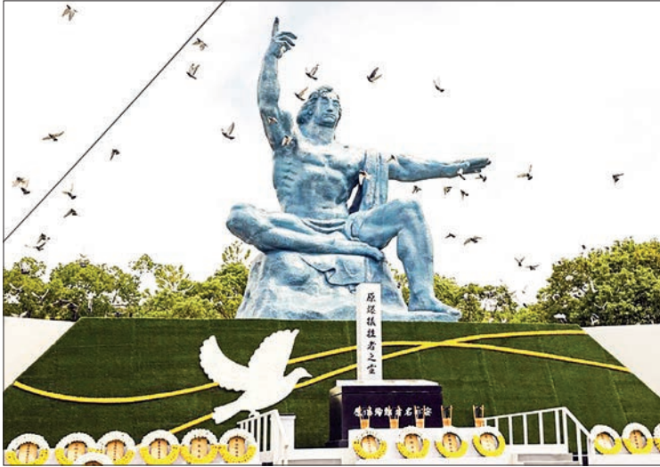
Doves are released at Peace Park in Nagasaki on 9 August 2022, during the memorial ceremony marking the 77th anniversary of the US atomic bombing of the city.