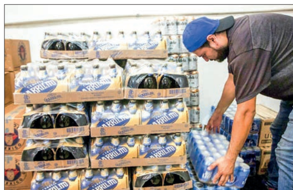
Mexico was the world’s largest beer exporter in 2021 with sales of around $5 billion, followed by the Netherlands with nearly $2.2 billion, according to United Nations data. A man stores beer in a shop in Monterrey, Nuevo Leon state, Mexico.

mains unchanged, though it warned of “considerable uncertainty owing to fragile macroeconomic developments, volatile capital markets and the unclear future of the pandemic”.—AFP