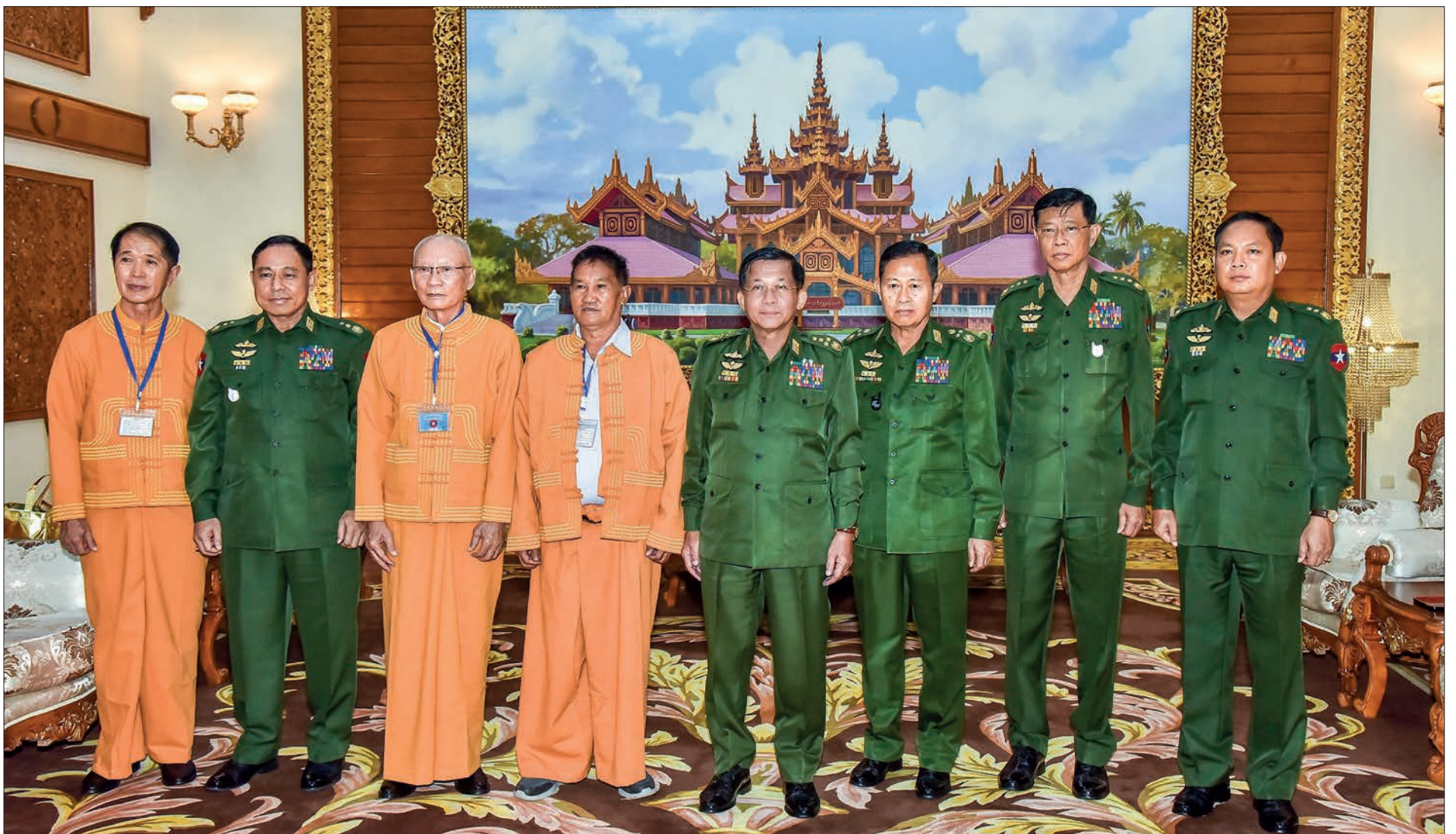
State Administration Council Chairman Commander-in-Chief of Defence Services Senior General Min Aung Hlaing poses for the documentary group photo with the Shan State Progress Party-SSPP peace delegation in Nay Pyi Taw on 4 August 2022.