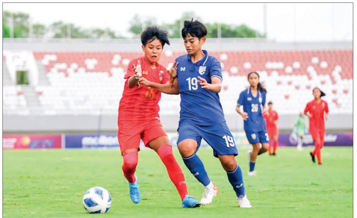
Myanmar team player (red) eyes on the ball during the match against the Thai team in the third place match of the AFF U-18 Women's Championship on 4 August 2022.