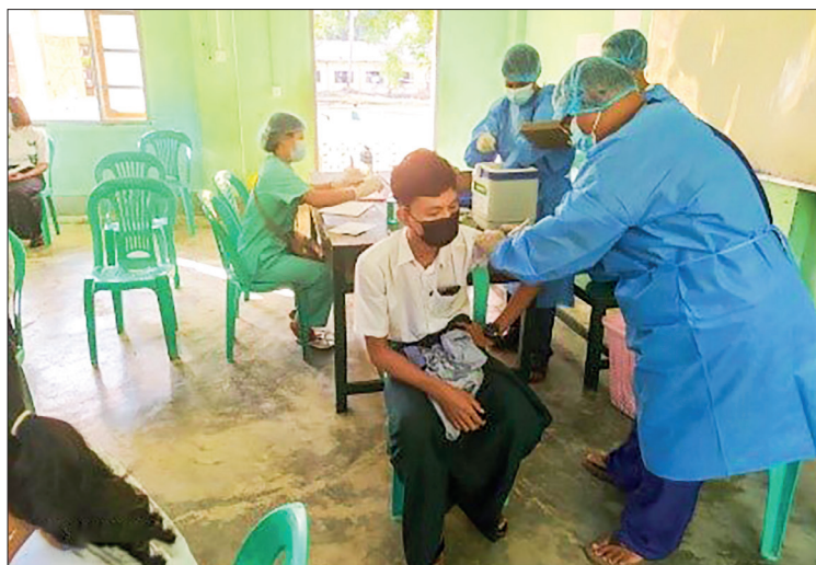
A student in Kyaukpyu Township, Rakhine State gets COVID-19 vaccine shot on 3 August.

DOCTORS and nurses from public hospitals, Tatmadaw medical teams, healthcare workers and volunteers are working hard to give COVID-19 vaccines in different states and regions as the vaccination programme is one of the most important activities in the prevention, control and treatment of COVID-19 disease.