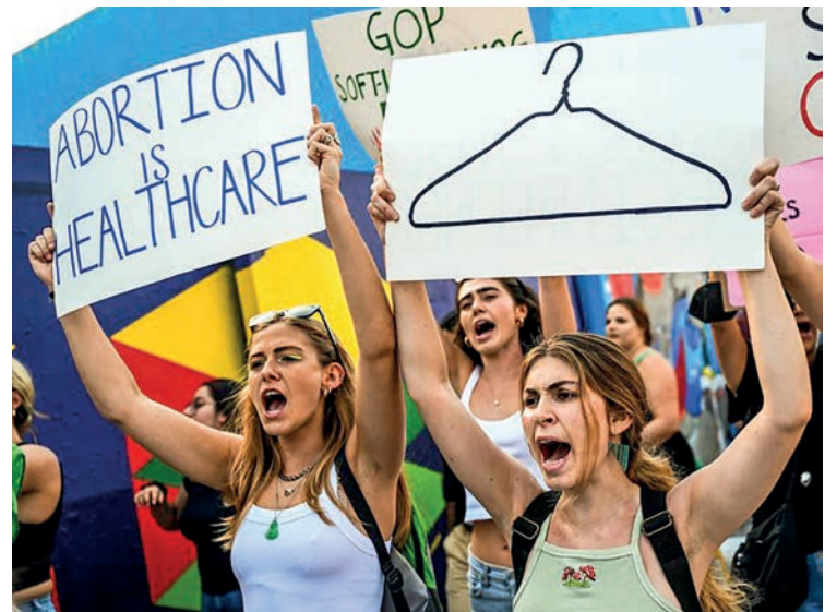
In the wake of the overturning of Roe v. Wade, abortion-rights activists continue to fight against laws restricting access to abortion.

Without Roe v. Wade, states are allowed to impose their own legislation on the medical procedure. At least ten states have banned abortion following the Supreme Court’s decision to strike down Roe v. Wade.—Xinhua