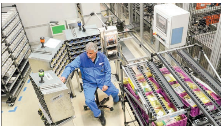
A BMW worker on a production line at Dingolfing, southern Germany.

Minister of Labour Hubertus Heil and Minister of the Interior Nancy Faeser plan to lower the income threshold for recent graduates applying for a blue card that allows working in the country, "making it easier for well-educated young people to start their careers in Germany".—Xinhua