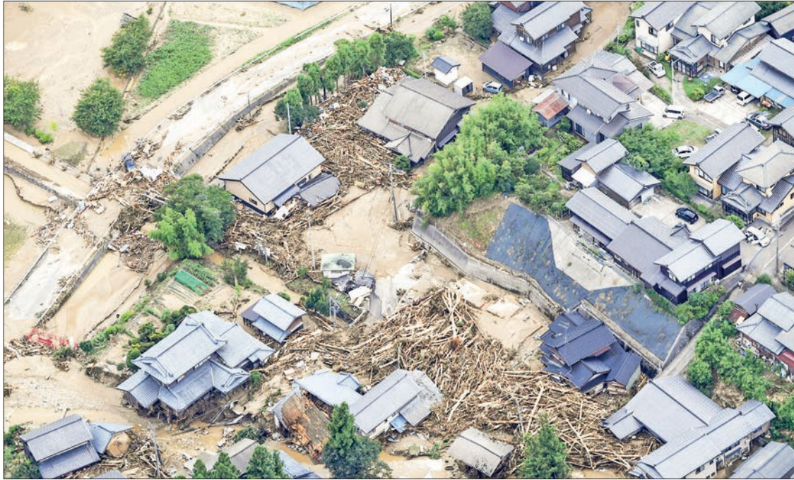
Photo taken from a Kyodo News airplane shows an area in Niigata Prefecture's Murakami affected by heavy rain on 4 Aug 2022.

TORRENTIAL rain continued in wide areas of Japan on Thursday, with more than 100,000 residents in northeastern and central parts urged to evacuate, several people unaccounted for, and reports of power and water supply cuts.