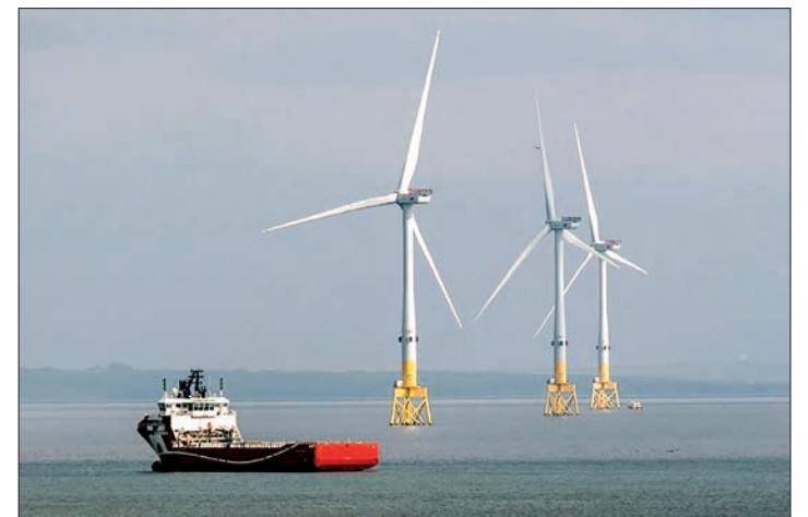
Britain plans a massive expansion of offshore wind farms.