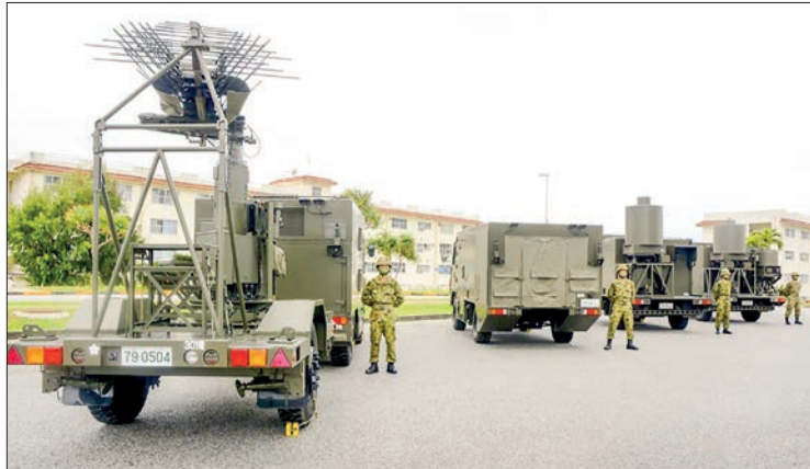
Photo taken on 27 March 2022, shows the Ground Self-Defence Force's cutting-edge "network electronic warfare system", dubbed NEWS, in Okinawa Prefecture.

The request, which could further balloon to 6 trillion yen once some unspecified costs are finalized, also reflects the ministry's desire to enhance its standoff defense capabilities and unmanned systems such as drones within the next five years, the sources said.