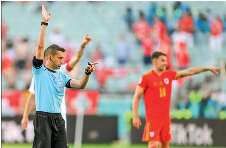
Offside decisions, the bane of many football supporters, are to get a dash of technology.

A form of "semi-automated offside technology" will be used from the group stage of this season's Champions League as well as in next week's Super Cup, UEFA announced on Wednesday. The optical tracking system was trialed at the FIFA Club World Cup in Abu Dhabi in February and last year's Arab Cup. FIFA has confirmed it will be in