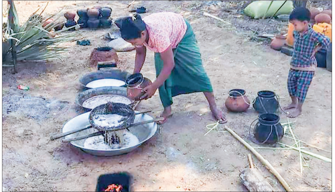
A toddy palm plant can produce up to four pots and a viss of jaggery can be produced if you boil eight pots. Two bundles of pigeon pea straw are used as fuel and it costs K5,000 per cart loaded with 25-30 bundles.

A toddy palm plant can produce up to four pots and a viss of jaggery can be produced if you