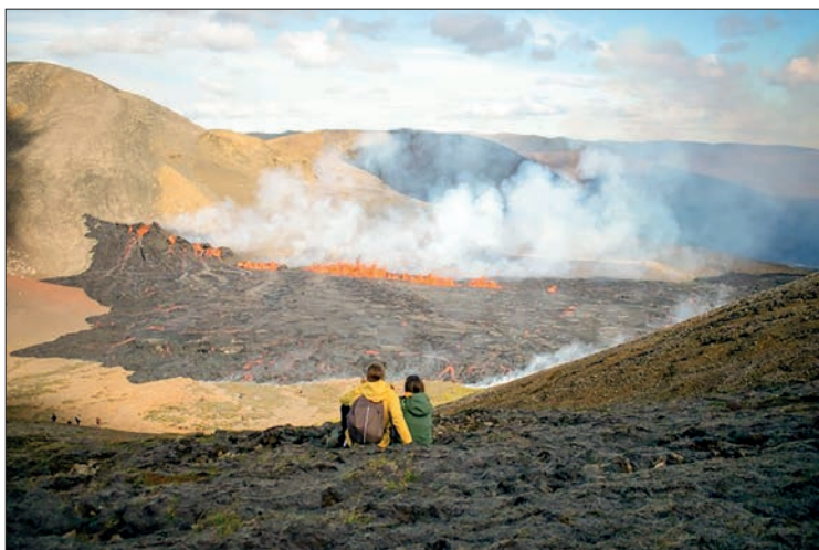
The eruption is tricky to access, requiring a strenuous 90-minute hilly hike from the closest car park.

CURIOUS onlookers made their way Thursday to the site of a volcano erupting near Iceland's capital Reykjavik to marvel at the bubbling lava, a day after the fissure appeared in an uninhab-