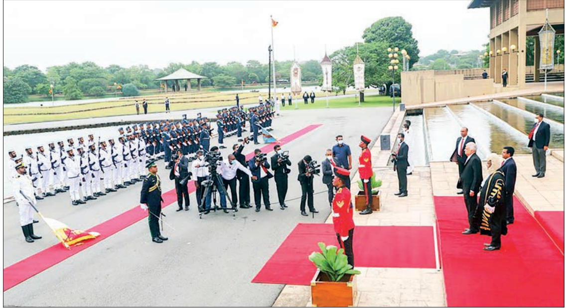
Sri Lankan President Ranil Wickremesinghe receives the guard of honour for the ceremonial opening of the third session of the 9th Parliament in Sri Jayawardenepura Kotte, Sri Lanka, 3 August 2022.

Sri Lanka can come to a staff-level agreement with the International Monetary Fund (IMF) by the end of August, he said.—Xinhua