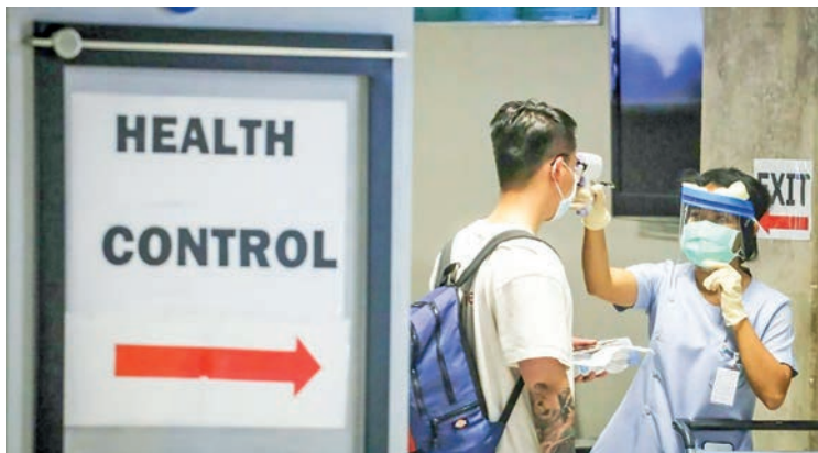
According to Department of Disease Control (DDC) chief Opas Karnkawinpong, the international disease control and quarantine office at Bangkok’s Suvarnabhumi airport has begun screening foreign visitors for monkeypox using the Thailand Pass system.

Thailand on Monday said it is expecting the first batch of monkeypox vaccines to arrive later this month. Opas said that the vaccines are likely to be administered to medical personnel and people who have close contact with the patients.—Xinhua