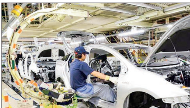
A Toyota production plant for hybrid electric vehicles in Toyota city in Aichi prefecture, Japan.