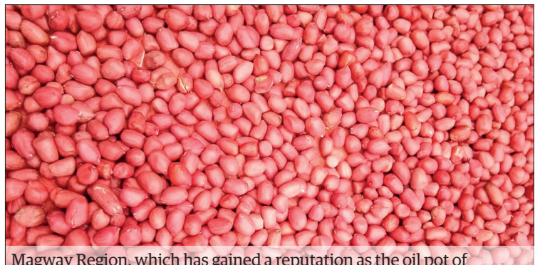
Magway Region, which has gained a reputation as the oil pot of Myanmar, is the main producer of beans and pulses including oil crops.

GROWERS from Htigyaing, Katha, Singu and Madaya areas cannot supply peanuts to the Mandalay market at present due to the Ayeyawady river floods. Consequently, low inventory pushed up the prices in early August.