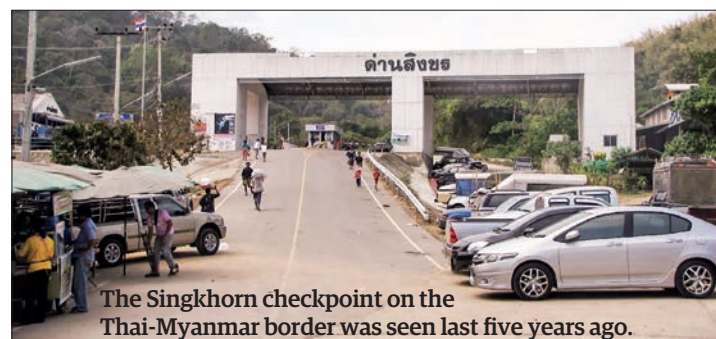
The Singkhorn checkpoint on the Thai-Myanmar border was seen last five years ago.

According to the COVID-19 health rules and statements of the Singkhorn post, the trade can be done from Monday to Saturday daily between 8 am and 4 pm. Every Sunday will be day-off for cleansing processes of the border crossing.—TWA/GNLM