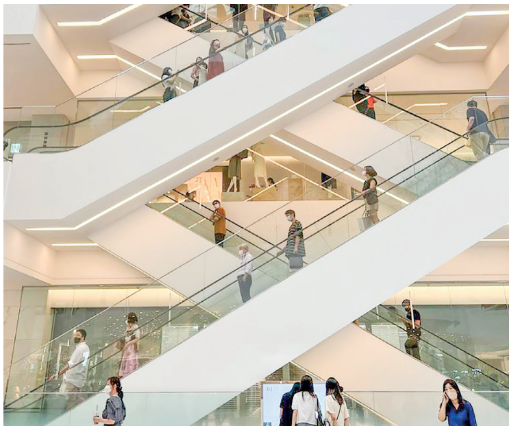
People wearing face masks are seen at a shopping mall in Seoul, South Korea, on 3 August 2022.