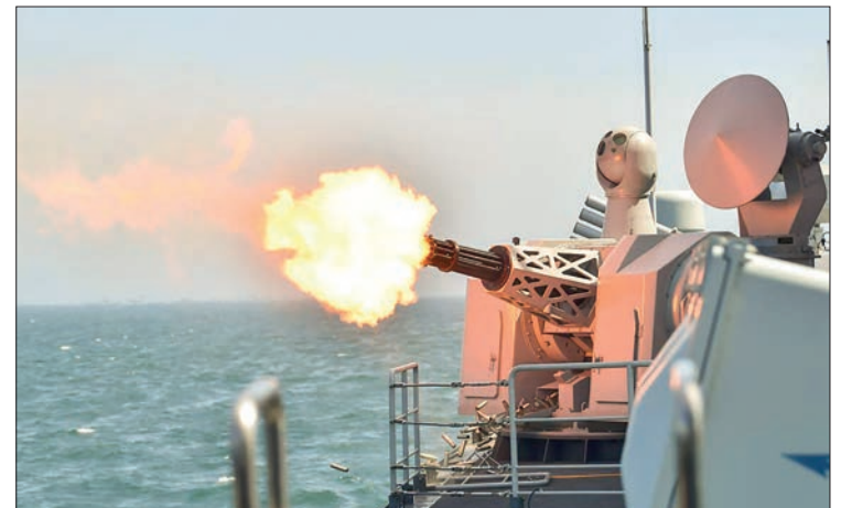
The PLA Eastern Theatre Command will stage joint training exercises in the maritime areas off the northern, southwestern and southeastern coasts of the island and their air space, conduct long-range live-fire drills in the Taiwan Strait and conventional missile tests in the waters off the eastern coast of the island.

The military operations are a stern deterrent against the recent major escalation of