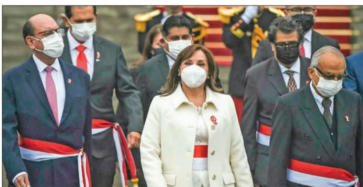
Peruvian Prime Minister Anibal Torres (R) is the fourth under President Pedro Castillo to resign.

PERU'S Prime Minister Anibal Torres resigned on Wednesday, becoming the fourth to step down in a year under embattled President Pedro Castillo.