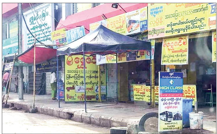
Product receiving counters of express lines are pictured around the Aung San Stadium.

THE authorities no longer permit cargo services of highway bus lines at Aung San Stadium in Mingala Taungnyunt Township, according to the bus line and cargo transport counters.