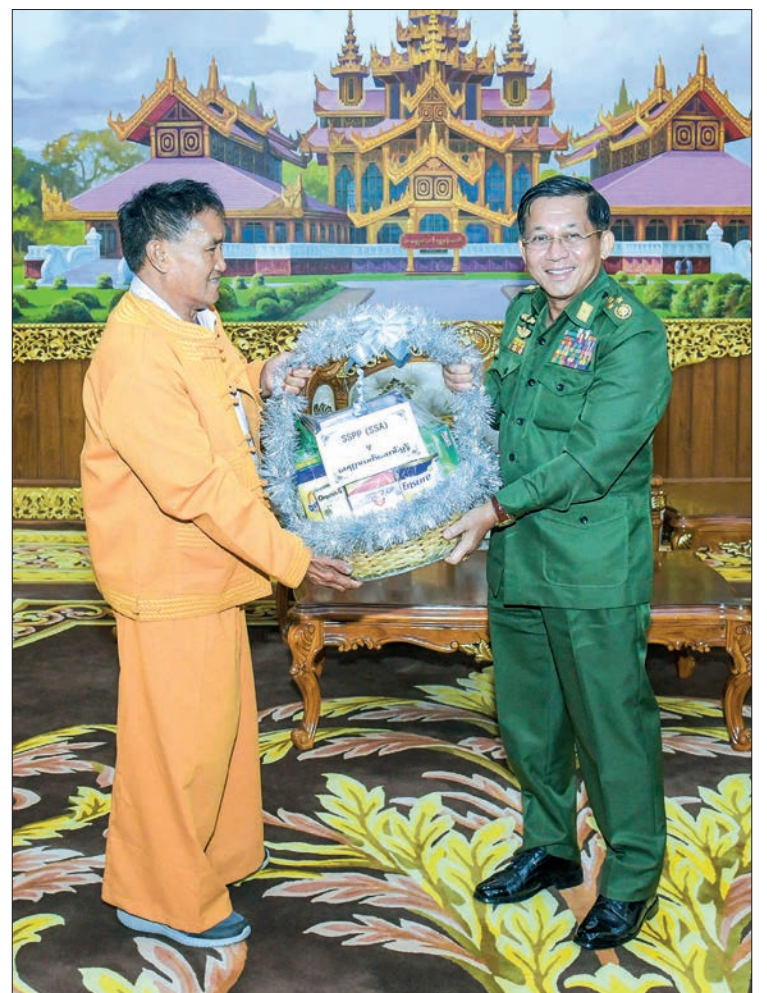
The Senior General and the SSPP Vice-Chair 1 exchange gifts at the event.

The Vice-Chairman (1) and party of the Shan State Progress Party (SSPP) will continue peace talks with the Peace Talks Committee and the National Solidarity and Peacemaking Negotiation Committee formed with Council members by the State Administration Council. —MNA