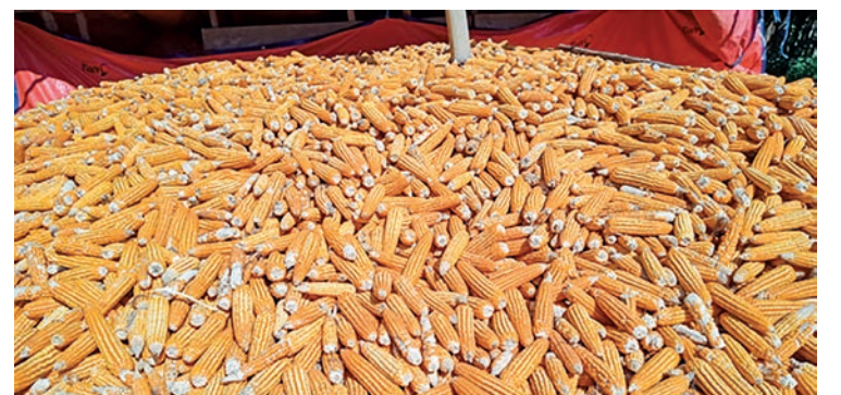
Although Myanmar earlier exported 150,000 tonnes of corn per month, only 30 per cent of that volume was delivered in July.

At present, corn is cultivated in Shan, Kachin, Kayah and Kayin states and Mandalay, Sagaing and Magway regions. Myanmar has three corn seasons – winter, summer and monsoon. The country produces 2.5-3 million tonnes of corn every year.