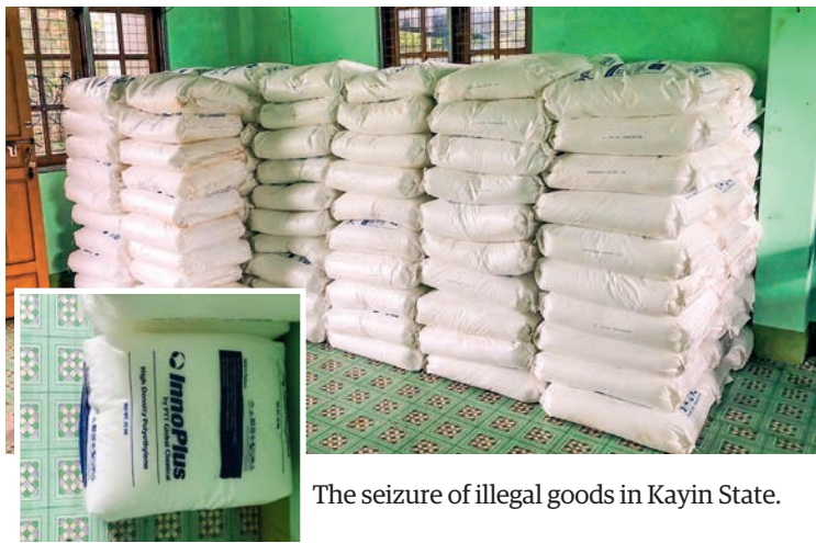
The seizure of illegal goods in Kayin State.

SUPERVISED by the Anti-Illegal Trade Steering Committee, effective action is being taken to prevent illegal trade under the law.