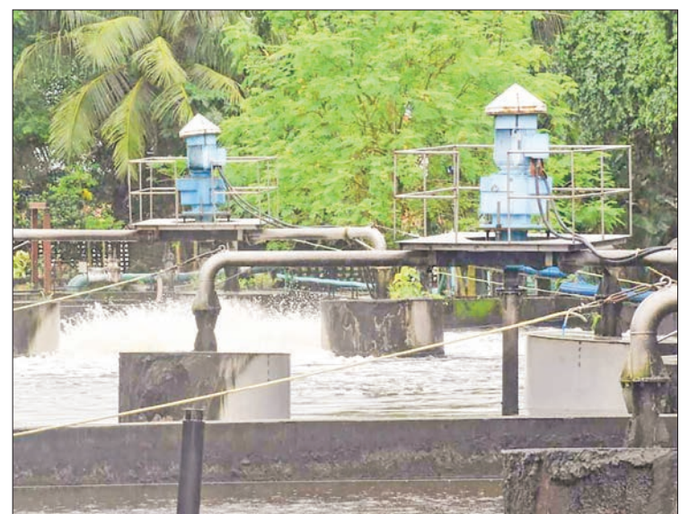
The wastewater treatment plant in Thanhlyetsoon of Botahtaung Township.

Since 2005, in addition to 24-inch and 36-inch diameter sewage pipes from six townships in the city, sewage is being cleaned daily by more than 100 septic tankers. — TWA/GNLM