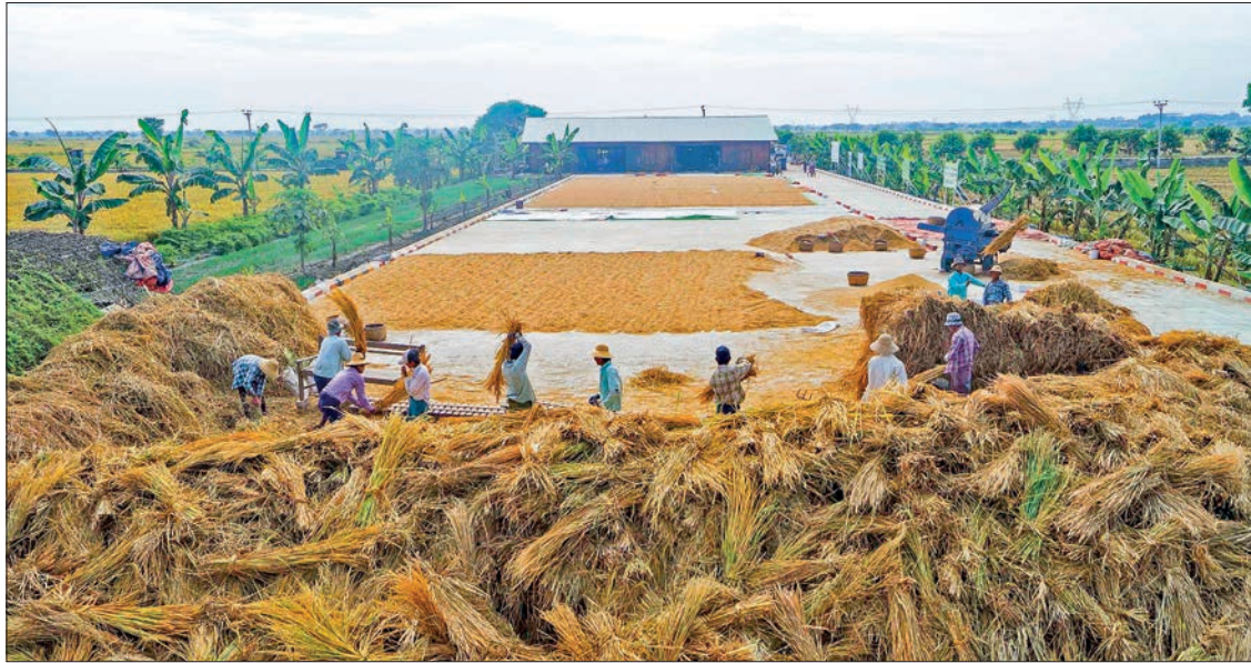
In early July, Ayeya Pawsan's rice price was only K1,227,000 per 100-basket. The price climbed up to K1.3 million per 100-basket in August.

Tracking high paddy prices, rice prices have also gained. On 4 August, Pawsan rice prices reached a mini-