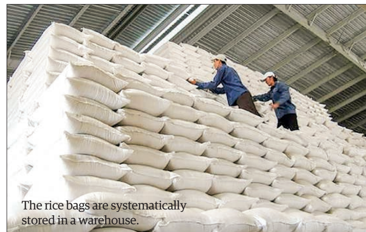
The rice bags are systematically stored in a warehouse.

It is reported that Myanmar Rice Federation is selling the joint stock with Myanmar Rice Traders Association, Myanmar Rice Millers' Association, Myanmar Rice Growers Association, Rice Commodity Depot (Wadan), and Rice Commodity Depot (Bayintnaung). — TWA/GNLM