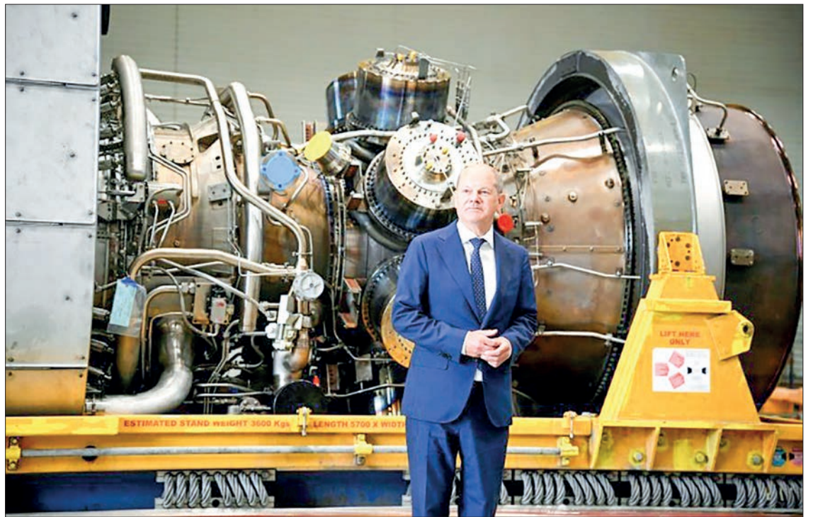
German Chancellor Olaf Scholz said transferring the missing turbine to Russia was 'really easy'.

Pipeline operators only needed to say that "they want to have the turbine and provide the necessary customs information for transport to Russia", Scholz said, adding that the transfer was "really easy". Russian energy giant Gazprom has blamed the delayed return of the unit from Canada, where it was being serviced, for the initial reduction in deliveries of