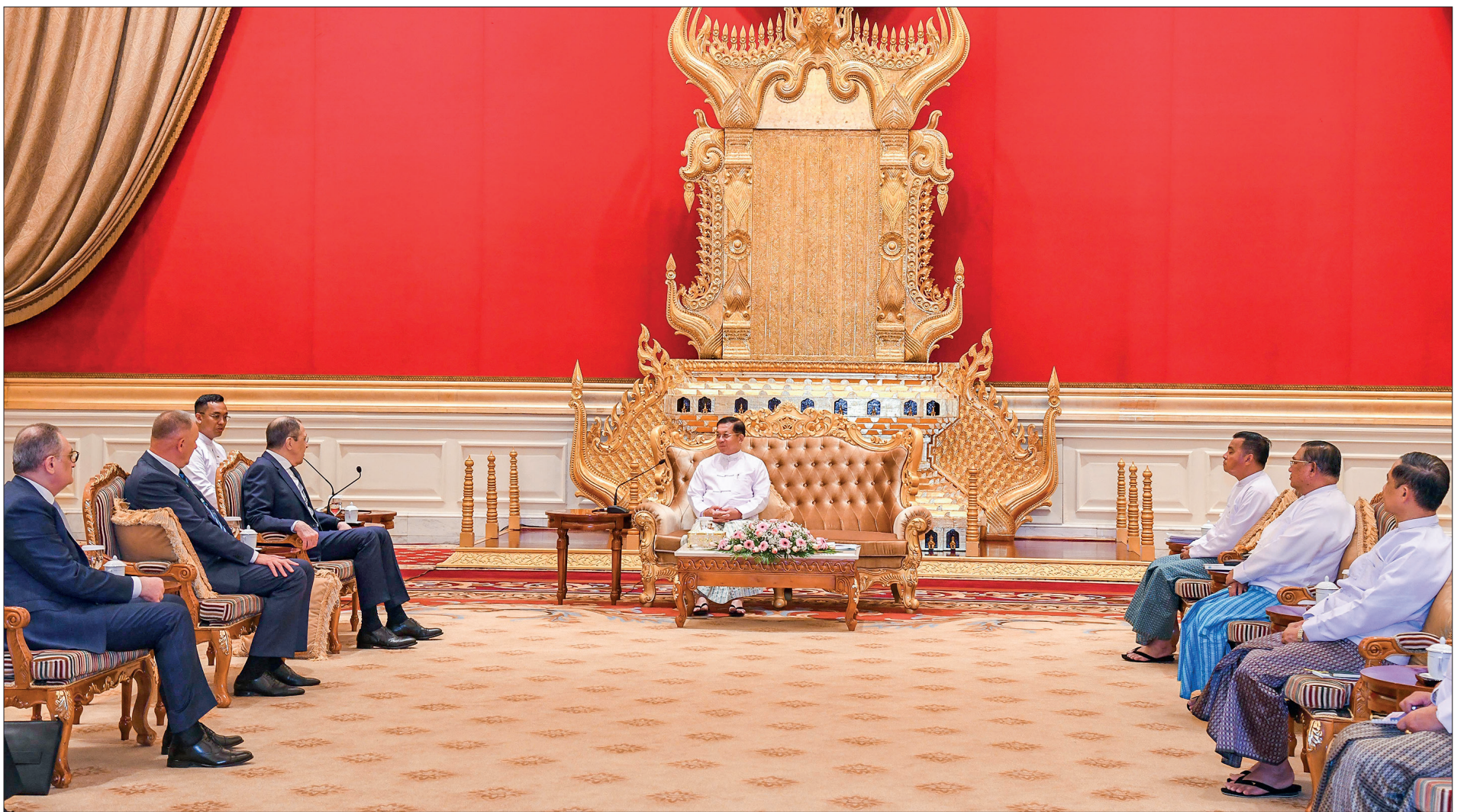
State Administration Council Chairman Prime Minister Senior General Min Aung Hlaing receives Mr Sergey Lavrov, Minister of Foreign Affairs of the Russian Federation in Nay Pyi Taw on 3 August 2022.

C HAIRMAN of the State Administration Council Prime Minister Senior General Min Aung Hlaing