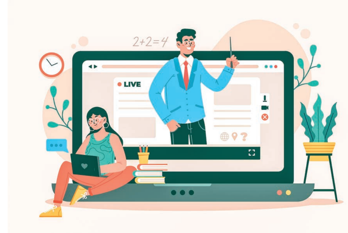
As an online student, you can choose to access your course information and complete your assignments at any time.

To keep your online learning from becoming stale, incorporate