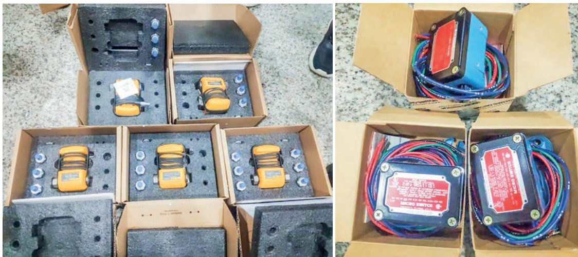
Seized electronics at Yangon International Airport.

SUPERVISED by the Anti-Illegal Trade Steering Committee, effective action is being taken to prevent illegal trade under the law.