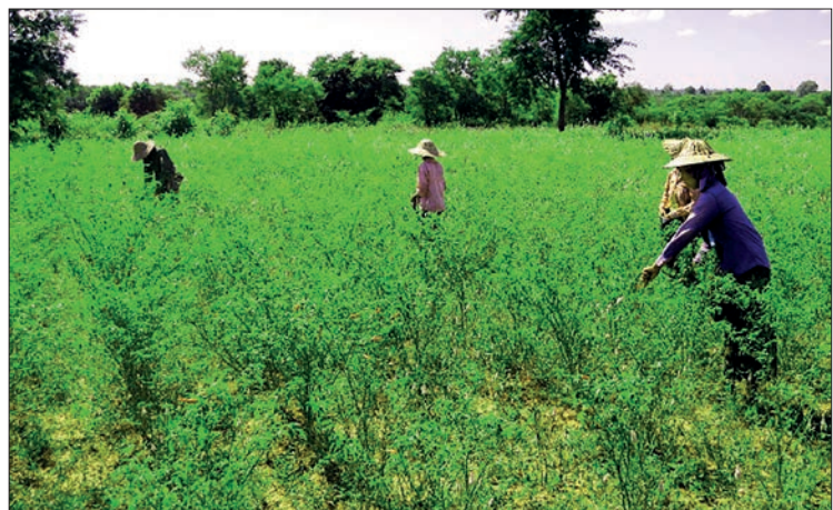
Chilli farmers were pictured in Theetattkan (North) Village in Meiktila Township last year.

THE new Moe Htaung chilli from Thaedaw, Kyaukse and Thazi fetches good prices in the Yangon market making profits for