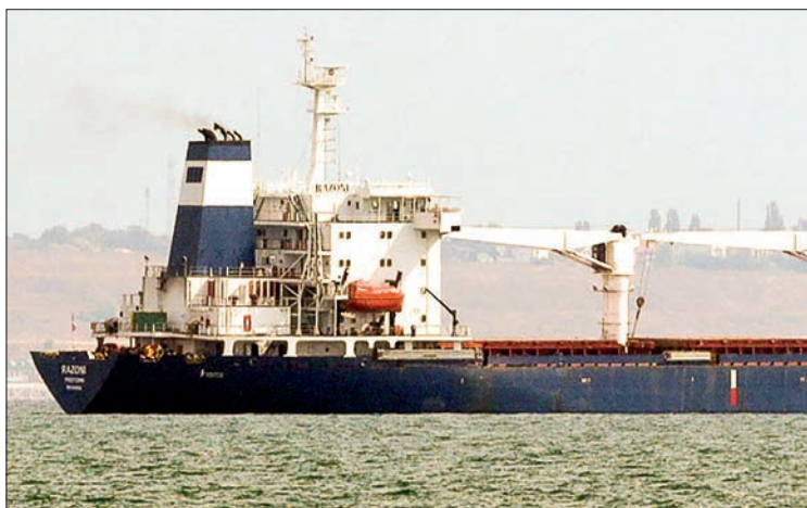
Bulk carrier M/V Razoni, carrying a cargo of 26,000 tonnes of corn, leaves Ukraine's port of Odessa, en route to Lebanon, on Monday.