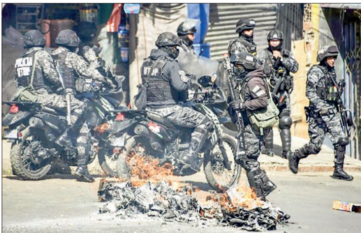
Riot police clash with coca leaf growers during a protest march in La Paz, on 2 August 2022.

The workers complained of nausea and vomiting at a plant in the Atchutapuram district of the southern state of Andhra Pradesh on Tuesday night. "The women are all stable. There are no deaths. Investigations are going on," senior police official M. Upendra told AFP. The hospitalizations follow a similar accident in June when around 200 women fell unconscious after a gas leak in the same area, broadcaster NDTV reported.— AFP