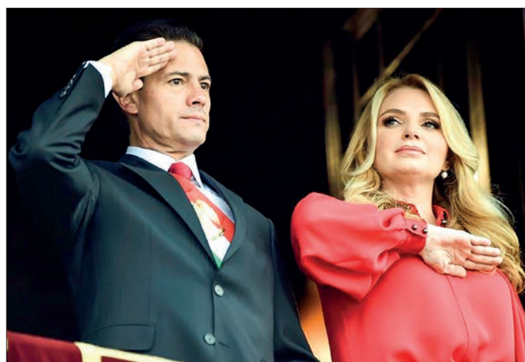
Enrique Pena Nieto and his wife, soap opera star Angelica Rivera married in 2010.

MEXICO'S Attorney General's Office said Tuesday that it was investigating former president Enrique Pena Nieto for suspect-