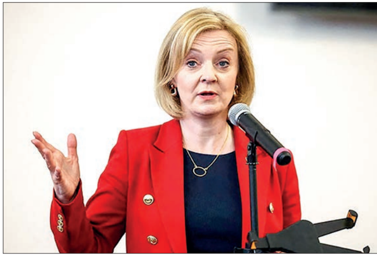
British Conservative frontrunner Liz Truss won further heavyweight endorsement Monday as party members began a month of voting to decide the next occupant of 10 Downing Street.

party had acted on advice from the National Cyber Security Centre (NCSC), which it said feared the potential for hackers to alter a large number of votes online late in the race.