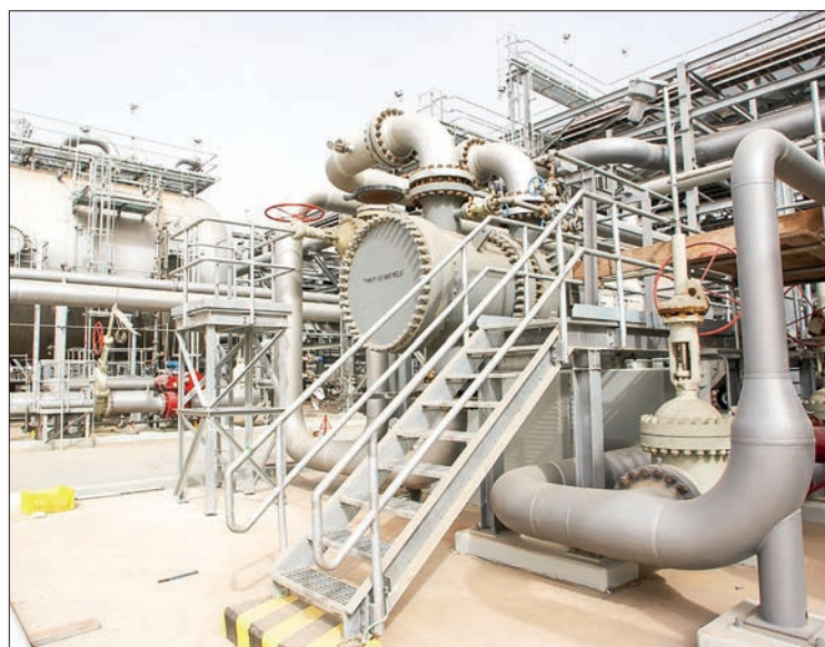
A general view shows an oil plant in Haradh, about 280 kms (170 miles) southwest of the eastern Saudi oil city of Dhahran.

French President Emmanuel Macron also reached out to bin Salman, hosting him last week in Paris, with Macron's office saying the two leaders agreed to work "to ease the effects" of the Ukraine war.—AFP