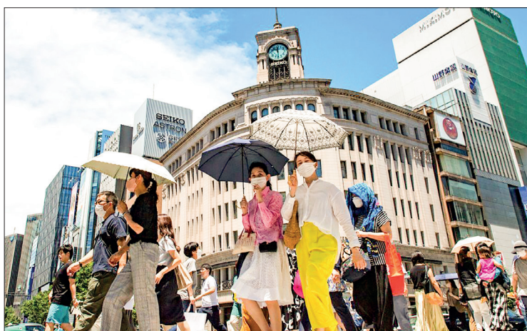
People walking on the street of Tokyo Ginza District.

JAPAN’S health ministry has approved the use of a smallpox vaccine believed to be effective against monkeypox. The smallpox vaccine approved by the ministry is thought to be 85 per cent effective against monkeypox, health officials said. The move came after Japan confirmed two cases of the disease in late July in men in their 30s, who had both travelled overseas, and the government announced preemptive measures to prevent the spread of the disease. As for treatment, the health ministry is looking into a medication called tecovirimat, which is an oral medication also used to treat smallpox. Symptoms