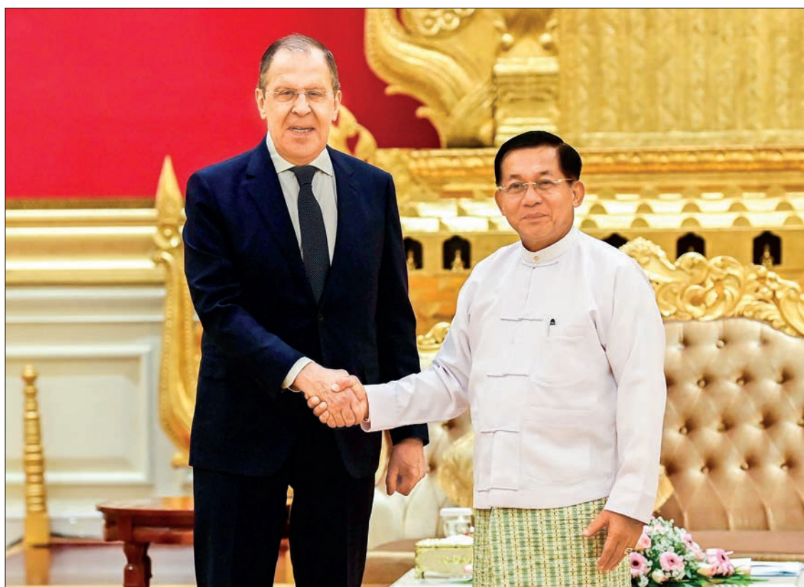
The Senior General cordially greets the Minister of Foreign Affairs of the Russian Federation at the event.