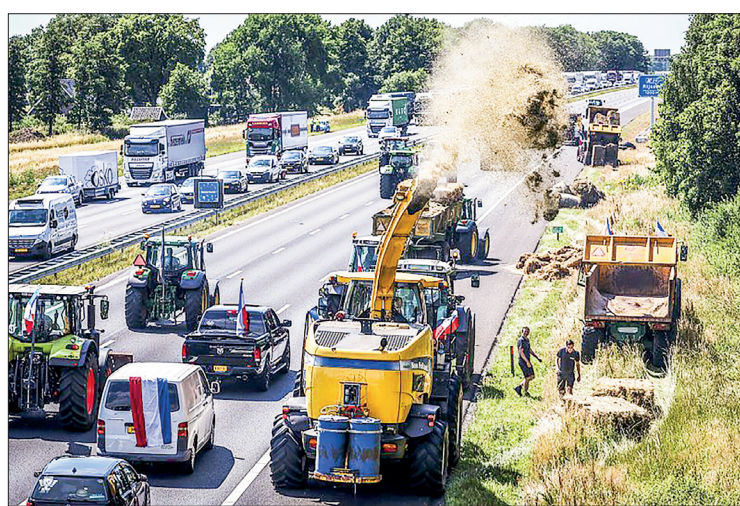
The farmers have wreaked havoc for weeks, dumping manure and garbage on motorways, blockading supermarket warehouses with tractors and rallying noisily outside politicians' houses.

They oppose plans to cut emissions of nitrogen in the Netherlands — the world's sec-