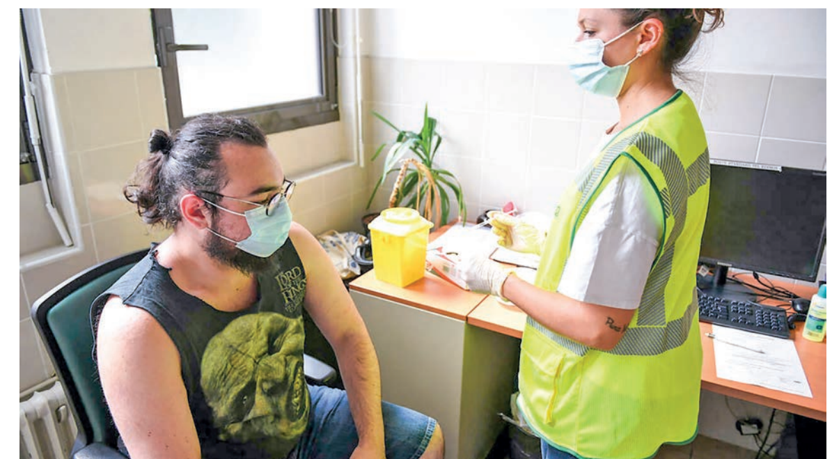
A man waits to receive a dose of the Monkeypox vaccine at the Edison municipal vaccination centre in Paris on 27 July 2022.