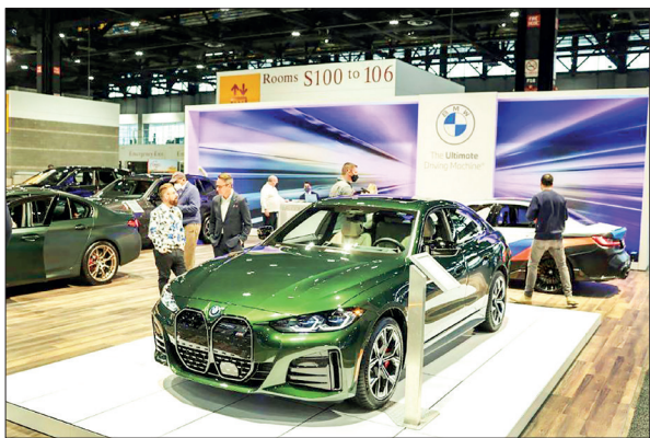
BMW's on display at a car show in Chicago, USA.

GERMAN auto manufacturer BMW said Wednesday its profits dipped in the second quarter as supply bottlenecks and Chinese lockdowns knocked production. The carmaker's profits for the period between April and June fell to three billion euros ($3.1 billion) from 4.8 billion euros in the same period last year. BMW CEO Oliver Zipse recognized "unfavourable conditions" but said in a statement the Munich-based group had shown "a high degree of resilience". "Ongoing semiconductor supply issues and supply chain disruptions following Covid lockdowns in China", a key market for automakers,