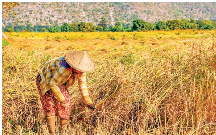
Myanmar also generated an income of $700 million from two million tonnes of rice exports to foreign countries in the past 2020-2021 financial year.

MYANMAR delivered 733,098 metric tons of rice and broken rice in the past four months this year (April-July), with an estimated income of US$249 million, according to the Myanmar Rice Federation (MRF).