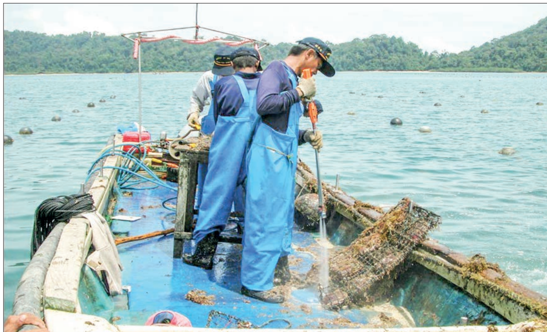
Over 15,000 more oyster farming blocks are added in Rakhine State despite it is yet to penetrate export markets, according to the Rakhine State Fisheries Department.

At present, oysters from Rakhine State are still not