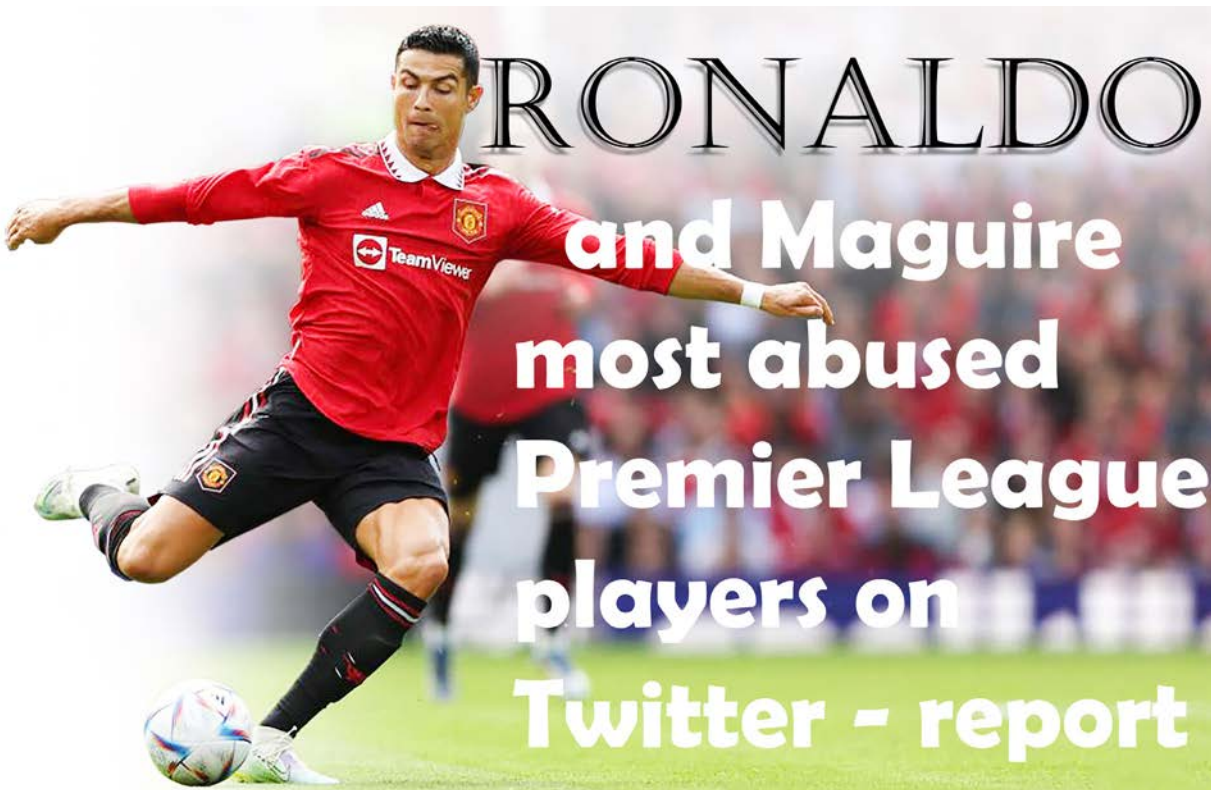
Manchester United's Cristiano Ronaldo and Harry Maguire have received the most Twitter abuse of any Premier League players, a report published Tuesday has found.

MANCHESTER United's Cristiano Ronaldo and Harry Maguire have received the most Twitter abuse of any Premier League players, a report published Tuesday has found. Analysis by British media regulator Ofcom of 2.3 million tweets in the first half of last season found nearly 60,000 abusive posts, affecting seven in 10 top-flight players.