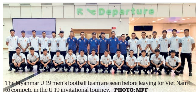
The Myanmar U-19 men's football team are seen before leaving for Viet Nam to compete in the U-19 invitational tourney.

THE Myanmar U-19 team left for Viet Nam on the morning of 3 August to compete in the Viet Nam U-19 invitational tournament to be held from 5 to 11 August in Binh Duong, Viet Nam.