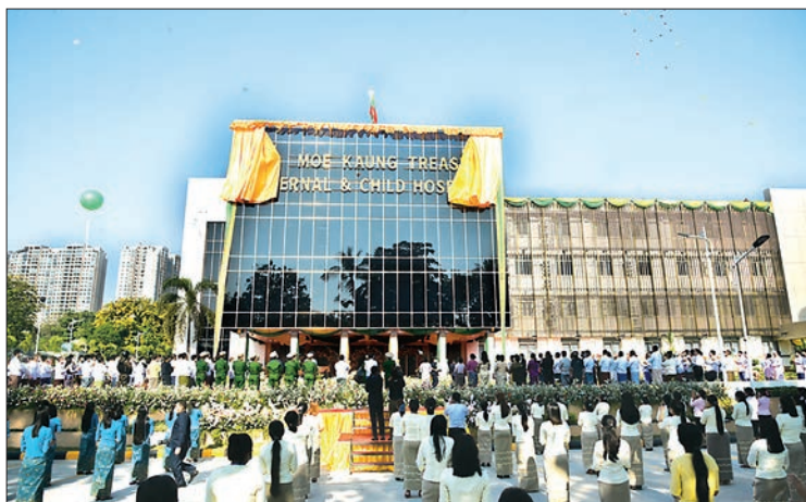
The Moe Kaung Treasure clinic in the Baukhtaw, Yangon Region.

The list of the clinics in other regions and states is Myittashin Clinic (Mandalay), Dekkhina Dipa Clinic (Myeik), Myat Roy-