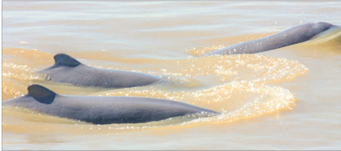
A total of 79 dolphins living in Ayeyawady River in Mandalay-Kyaukmyaung sections between Bhamo and the second defile are spotted near the Mingun Stupa this rainy season.

"According to our regular data, one or seven new dolphins are born per year. Currently, they are breeding. As