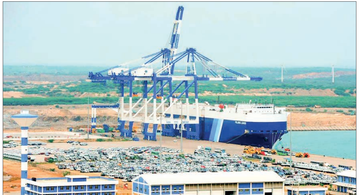
Sri Lanka's government handed over the running of Hambantota port to China Merchants Port Holdings in December 2017.

SRI Lanka on Tuesday brushed aside Indian concerns over a scheduled visit by a Chinese ship, saying it was coming only to refuel and replenish supplies.