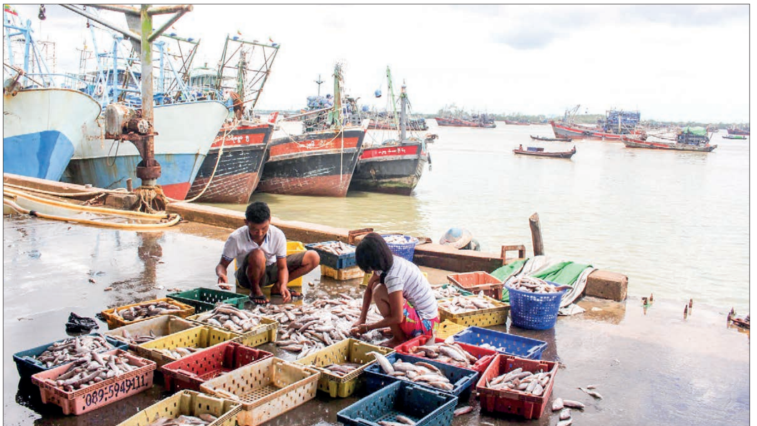
Myanmar secures $119.351 million via sea and air routes and $62.545 million via land borders. Fish workers are pictured sorting the fish at the port.

The marine products are normally exported to Japan and EU countries, and fish, prawns and crabs to China, Thailand and neighbours via the Muse, Myawady, Kawthoung, Sittway, Myeik and Maungtau border