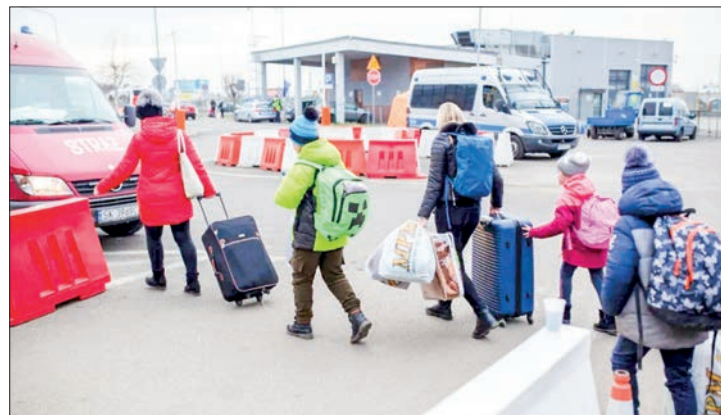
The Polish minority in Ukraine officially numbers about 144,130 (according to the 2001 census), of whom 21,094 (14.6%) speak Polish as their first language. The history of Polish settlement in current territory of Ukraine dates back to 1030–31. Refugees from Ukraine enter Poland at the Medyka border crossing.

THE Ukrainian parliament on Thursday adopted a draft law to grant special status to Polish citizens in Ukraine, a parlia-