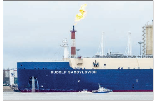
LNG (Liquefied natural gas) tanker Rudolf Samoylovich, sailing under the flag of Bahamas, moors at the dock of the Montoir-de-Bretagne LNG Terminal near Saint-Nazaire, western France, on 10 March 2022.

Meanwhile, Baerbock said it is crucial that the European Union should ensure that human rights are guaranteed at borders, acknowledging Greece's contribution in offering shelter to thousands of migrants.—Xinhua