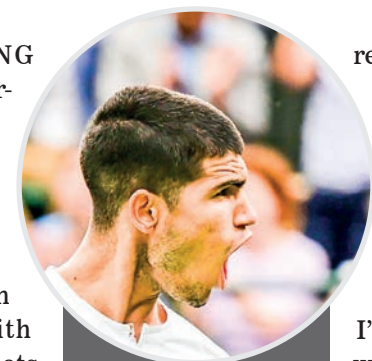
Seventh semi-final of 2022 for Carlos Alcaraz.

reach the number four ranking, to have a chance to do it," Alcaraz said after Friday's match.