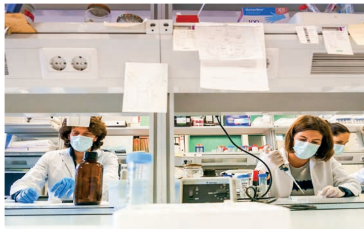
Researchers at the Institute of Molecular Biology and Genetics (IBGM) of the University of Valladolid (UVA) work on searching a vaccine against COVID-19, at a laboratory in Valladolid on 10 November 2020.