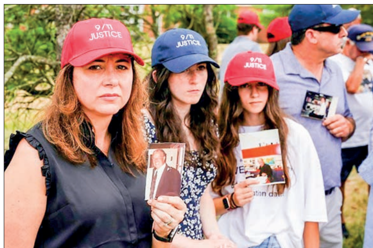
A few dozen relatives of victims and survivors of the 9/11 attacks, which killed 3,000 people, gathered near Donald Trump's golf course in Bedminster, New Jersey, ahead of the LIV Golf tournament.