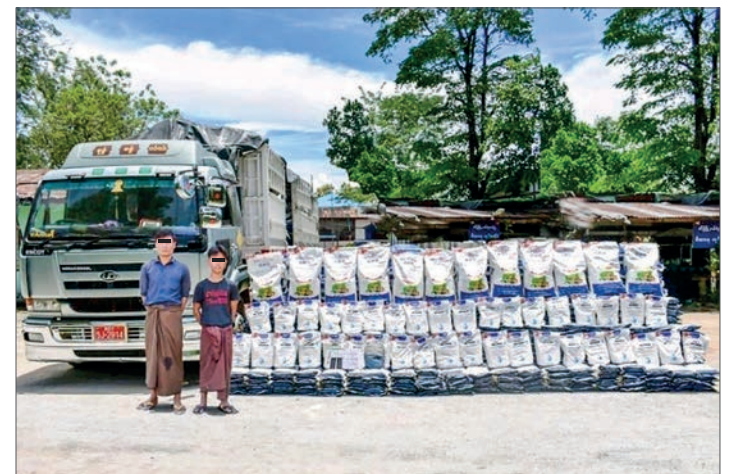
Two arrestees are seen together with seized chemicals and a lorry.

K320 million worth of 35.95 tonnes of restricted chemicals – Ammonium Nitrate – were seized in Hsenwi township of Shan State (North), Myanmar Police Force stated.