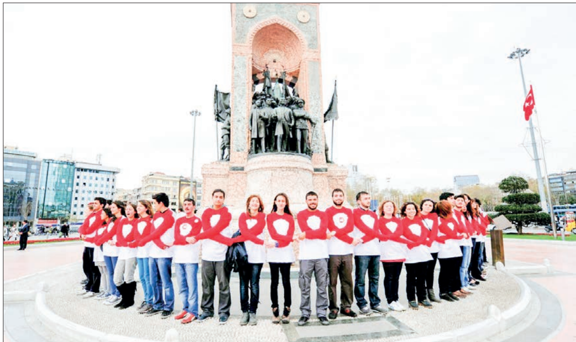
Turkish activists stage a demonstration on World Aids Day on 1 December 2010 at the Ataturk monument, Istanbul.

"Efforts to increase access to Cabotegravir LA for PrEP will be especially impactful for groups that experience particularly high rates of infection, such as men who have sex with men and sex workers," he added.—AFP