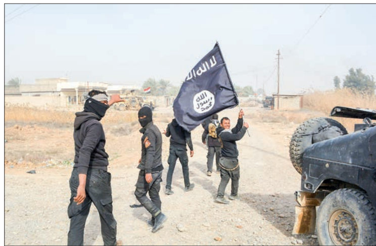
Iraqi government forces celebrate while holding an Islamic State (IS) group flag after they claimed they have gained complete control of the Diyala province, northeast of Baghdad, on 26 January 2015 near the town of Muqdadiah. Iraqi forces have "liberated" Diyala province from the Islamic State jihadist group, retaking all populated areas of the eastern region.

Mohammed Khalifa, who was born in Saudi Arabia, pleaded guilty in December to conspiring to provide material support to IS resulting in death. According to the Department of Justice (DOJ) indictment, he left Canada in 2013 to join the IS group in Syria, where he quickly took on a leading role in the self-proclaimed "caliphate" that straddled that country and Iraq. Khalifa, now 39, quickly began serving in "prominent roles" within the IS group and by 2014 had become a key