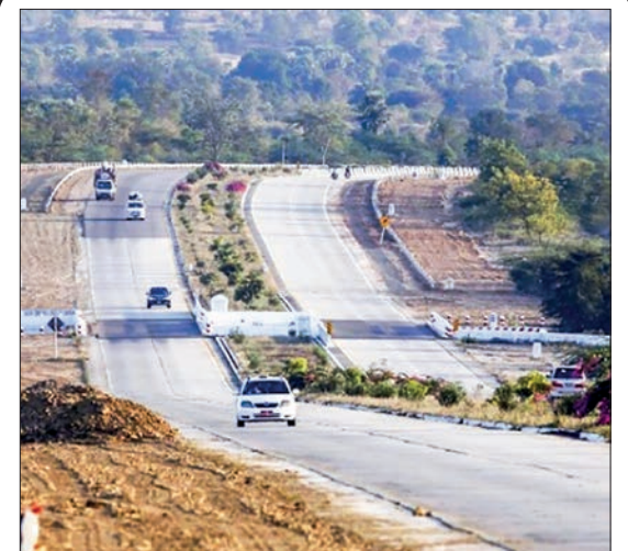
One section of the Yangon-Mandalay Expressway.