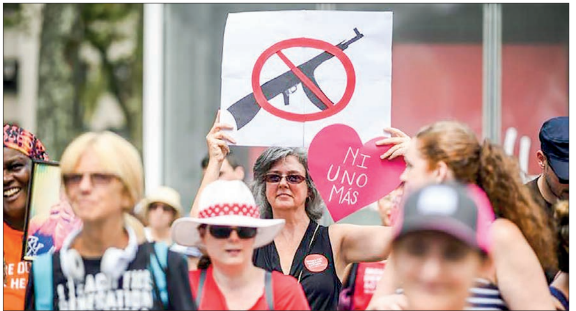
Protestors take part in a rally against gun violence and calling for Federal Background Checks on 18 August 2019 in New York City.

Assault weapons and high-capacity magazines have been frequently used in the violence that plagues the United States.—Xinhua