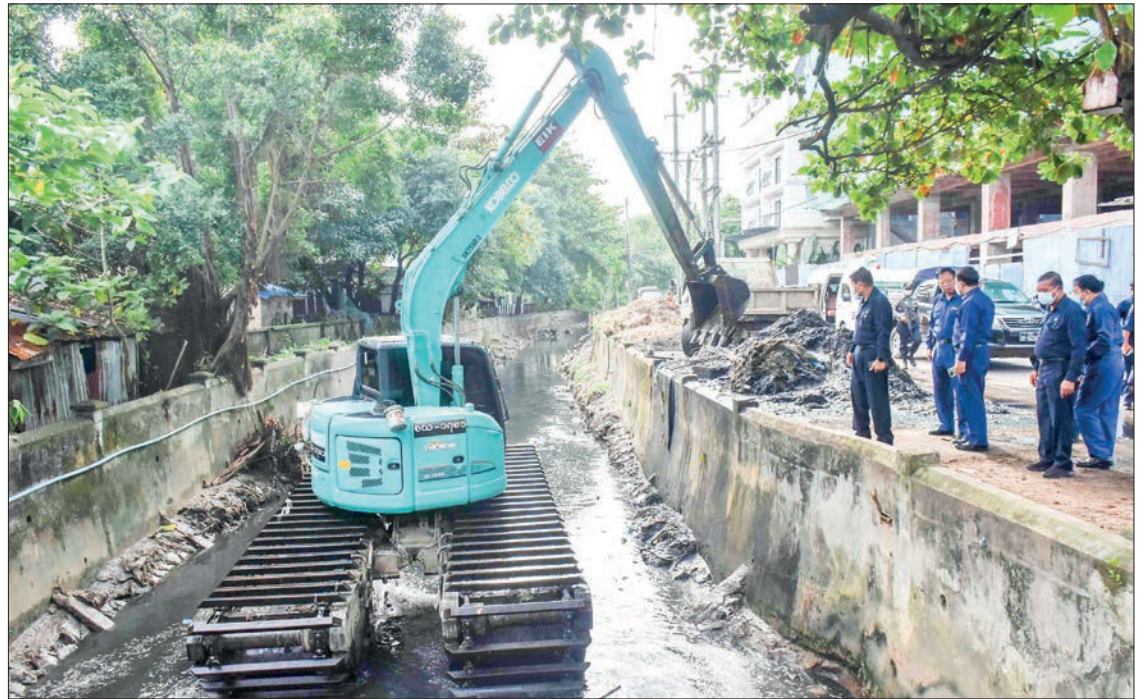
YCDC Chair Yangon Mayor U Bo Htay and party inspect cleaning work of the drainage canal in Yangon yesterday.

Afterwards, the mayor inspected the repairing of the ground and fence of the Inner-Shukhintha staff housing in 10/South Ward of Thakayta Township, the construction of brick drainage retaining wall, cover slabs with manholes, road extension of the Engineering Department (Roads and Bridges) along the Shukhintha Road and cleaning activities on Shukhintha Road. —MNA