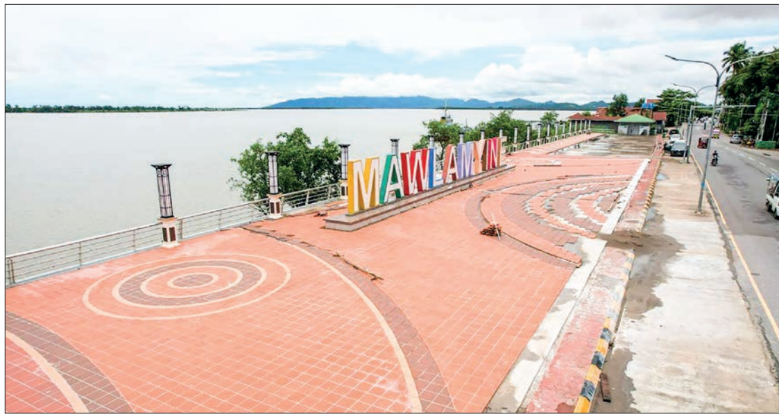
The photo shows the slab landscaping on Strand Road in Mawlamyine.

The committee will upgrade the construction of a platform (drainage), free lane and landscape at Hintha roundabout, the entrance of Mawlamy-