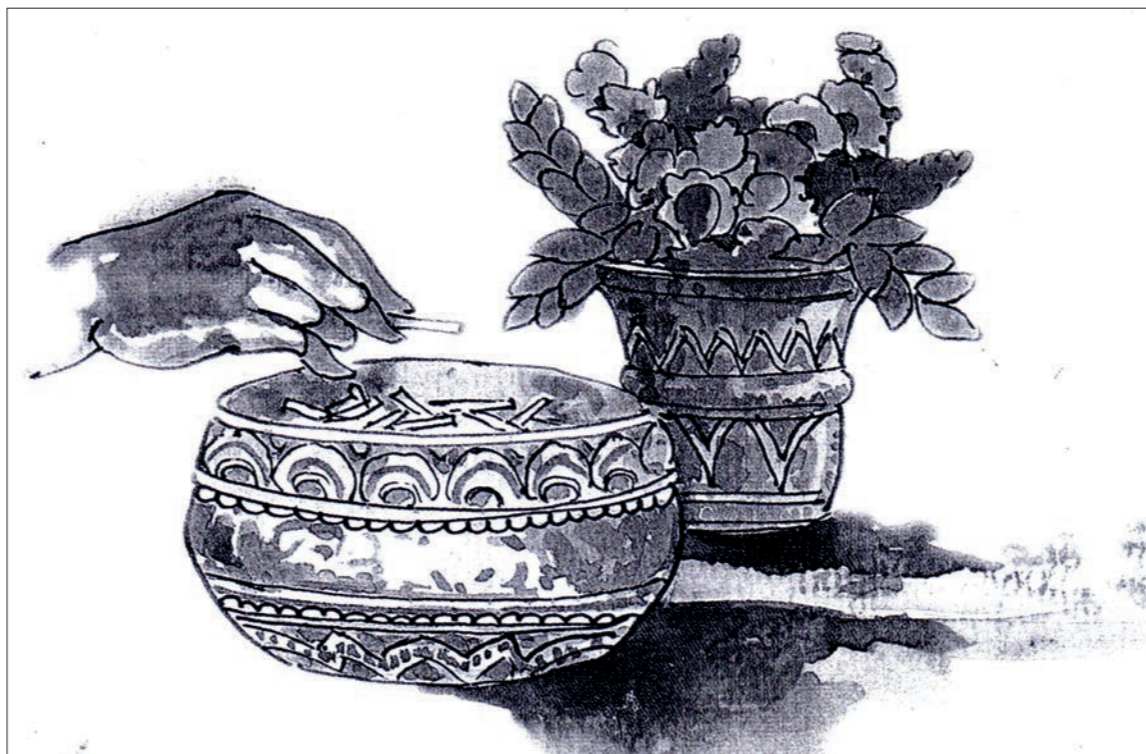
marked as the flower of Wakhaung. Sayey Tan Pwe which may best be rendered in English as "Casting lots Festival" was the traditional festival held in Wakhaung in the days of yore. Sayey Tans are lots to decide to choose the recipient of food or gift or alms in a religious offering. The custom Whereupon the Lord Buddha

နံကာလ which means the time for ploughing or the planting season or the month for agricultural activities. There is a Myanmar folk rhyme which aptly describes this Season ဝါဆို ဝါခေါင် ရေတောင်တောင် (In Waso and Wakhaung there are billows of rainwater). As these two months are the peak of the rainy season the countryside is inundated with rainwater. The astrological name of Wakhaung is Simha သီဟံ (Leo) and its zodiacal sign is the lion. During this month in the daytime the Sun and the Hpou Sha stars and at night the Moon and the Tharawun stars rival in their radiance. Although all lilies and most trees and plants burst forth into bloom, Khatta or land lily (Crimum amoenum) is traditionally