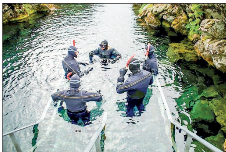
The fissure and the entire surrounding valley lie on the Mid-Atlantic Ridge, which runs through the island, making it one of the most active volcanic areas on Earth.

IN between North American and Eurasian tectonic plates, Iceland's Silfra fissure is one of the world's most famous dive sites, popular with tourists who venture into its icy waters.