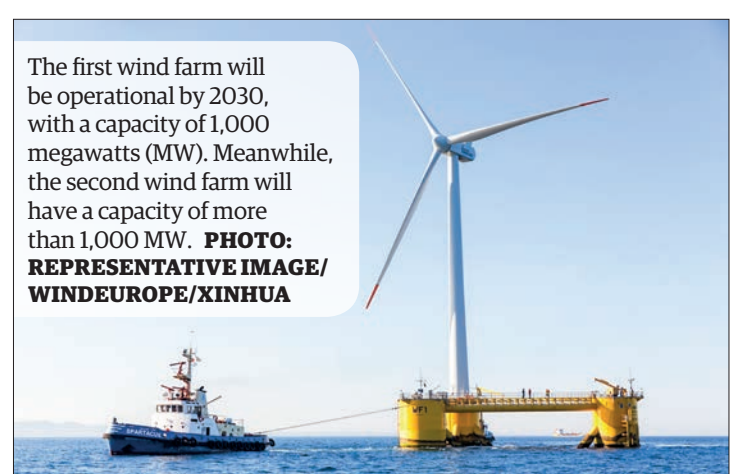
The first wind farm will be operational by 2030, with a capacity of 1,000 megawatts (MW). Meanwhile, the second wind farm will have a capacity of more than 1,000 MW.