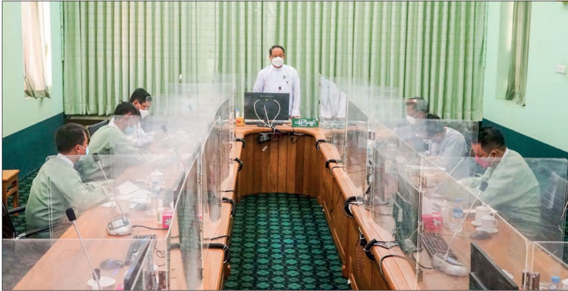
Kayin State Investment Committee Chair Chief Minister U Saw Myint Oo presides over the coordination meeting 5/2022 on 29 July.

A coordination meeting 5/2022 of the Kayin State Investment Committee was held at 2 pm on 29 July at the meeting hall of the Kayin State Government Office.