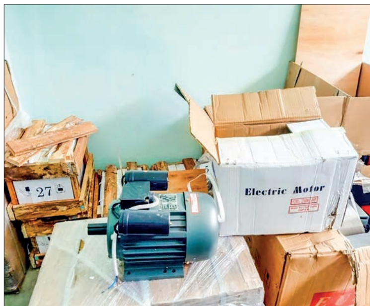
Confiscated illegal goods in Bago Region.

Thus, seven arrests worth approximately K155,375,570 were made on 28 and 29 July, according to the Anti-Illegal Trade Steering Committee.—MNA