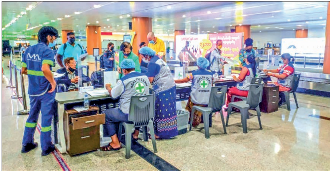
The Rapid Diagnostic Test-RDT is underway for the commercial flight passengers.

Upon arrival at the airports in Myanmar, they will be checked by the airport health department