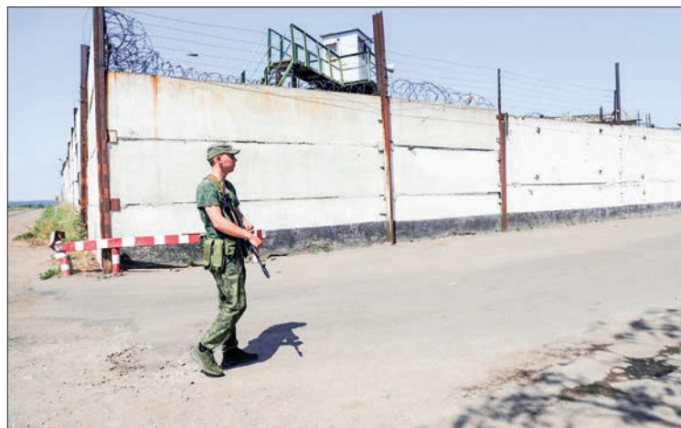
A soldier stand guard next to a wall of a prison in Olenivka, in an area controlled by Russian-backed separatist forces, eastern Ukraine, Friday, 29 July 2022. Russia and Ukraine accused each other Friday of shelling a prison in a separatist region of eastern Ukraine, an attack that reportedly killed dozens of Ukrainian military prisoners who were captured after the fall of a southern port city of Mariupol in May.

Following the strike on the prison, Russian state-television showed what appeared to be destroyed barracks and tangled metal beds but no casualties could be seen. Ukraine's military denied carrying out the attack saying its forces “did not launch missile and artillery strikes in the area of Olenivka settlement.”—AFP