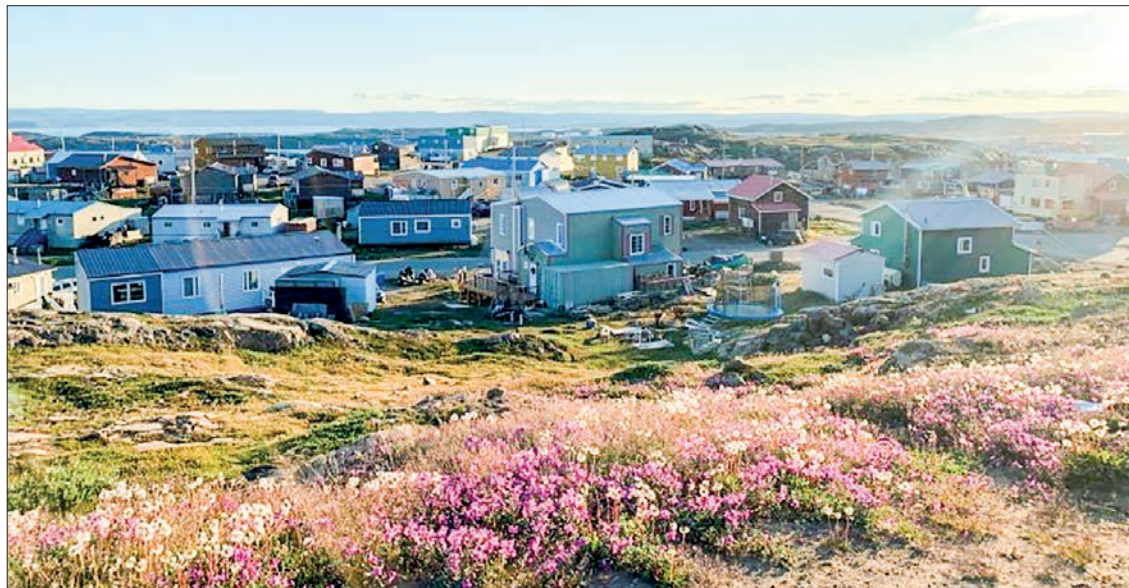
The town of Iqaluit, in the vast territory of Nunavut, Canada, on 28 July 2022, ahead of a visit by Pope Francis.

From the late 1800s to the 1990s, Canada's government sent about 150,000 children into 139 residential schools run by the Catholic Church. Many were physically and sexually abused, and thousands are believed to have died of disease, malnutrition or neglect. The pope kicked off his trip to Canada on Monday with an apology for the abuse. — AFP