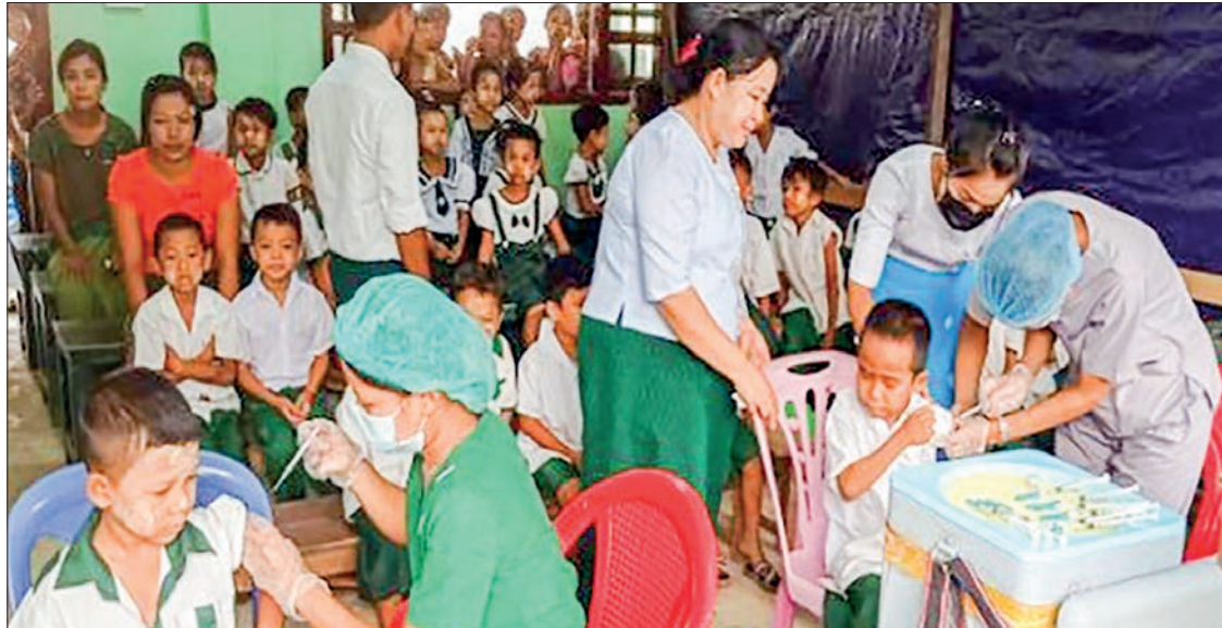
Students get jabbed against COVID-19 in Kyauktaw, Rakhine State.

COVID-19 vaccine is administered daily to target groups regardless of race or religion, including Buddhist monks and nuns, local people over the age of 40, students, religious leaders, prisoners, people with disabilities, ethnic armed groups, people with chronic diseases, people in