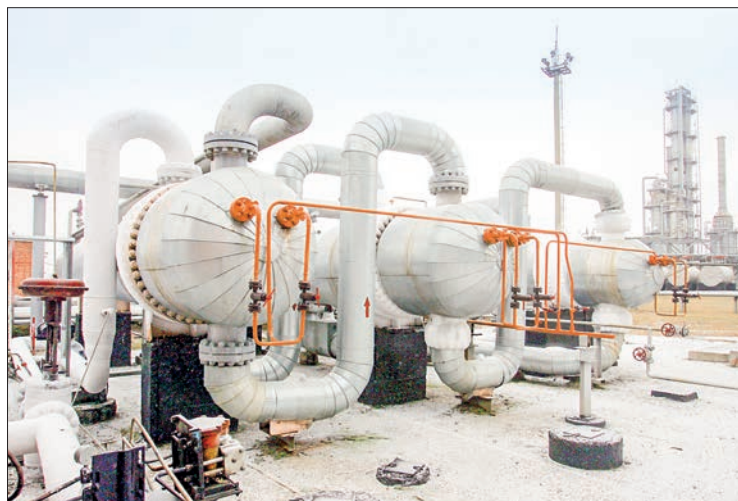
A general view of the gas production and transporting station on a gas field near the Ukrainian city Poltava, some 330 km east of the capital Kyiv.

Ukraine's economy is expected to drop 37.5 per cent year-on-