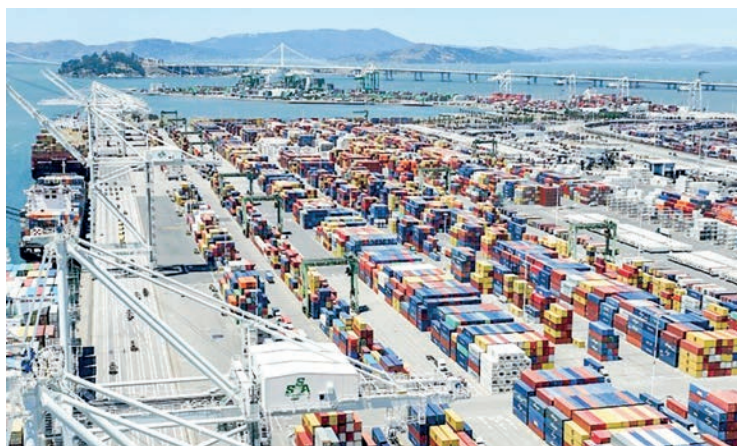
Inflation and higher interest rates are already leading to a contraction in the US economy.

"The real catalyst ... is a belief that bad news (earnings disappointments and weak data) is good news (fewer rate hikes from the Fed)," Briefing.com said in an analysis.—AFP