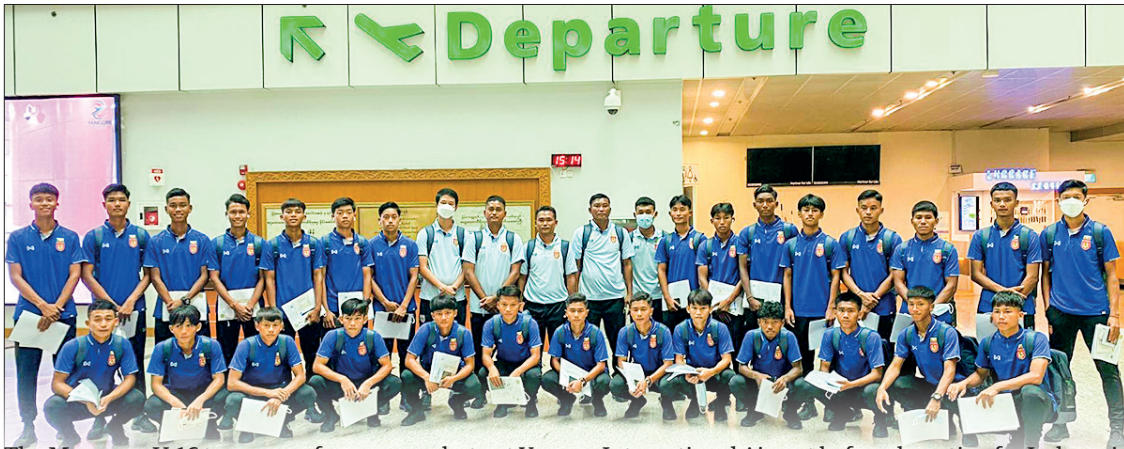
The Myanmar U-16 team pose for a group photo at Yangon International Airport before departing for Indonesia on 30 July.