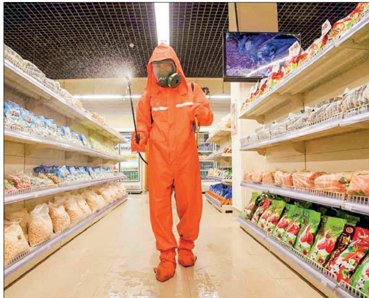
A health official sprays disinfectant as part of preventative measures against Covid-19, in the Daesong Department Store in Pyongyang on 27 September 2021.

The anti-epidemic agency is still intensifying operation and command to stamp out the spread of the malignant epidemic, strengthen liaison, assistance and cooperation between sectors in the anti-epidemic campaign