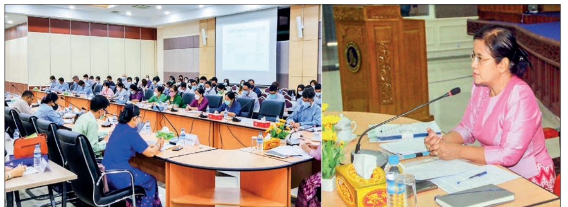
CBM Deputy Governor Daw Than Than Swe delivers the opening speech at the workshop.

Then, they discussed the weaknesses found in Onsite and Offsite inspections on AML/CFT, proper amendments, facts to be aware of by the banks to ensure quality reports and weapons of mass destruction (WMD). — MNA