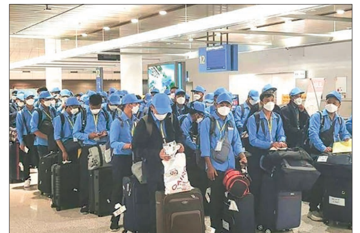
MoU workers are pictured departing for S Korea in July.

In the last year, 42,832 workers who passed the EPS-TOPIK exam, were legally sent to South Korea. Around 27,000 Myanmar workers are currently working in South Korea. — TWA/GNLM