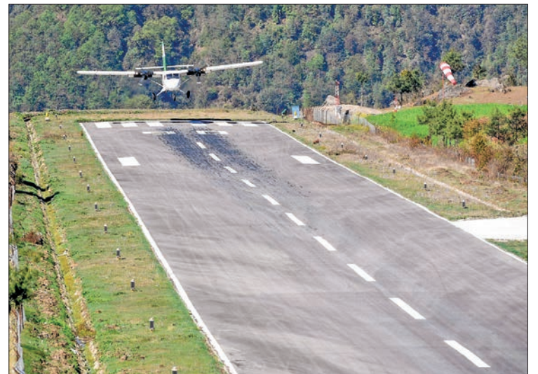
As per the action plan, the Visit Nepal Decade is expected to come out within the next three months. A private aircraft prepares to land at the Tenzing-Hillary airport in Lukla, a small town in the Khumbu Pasanglhamu rural municipality of the Solukhumbu District, Nepal on 23 April 2021.

Nepal received 1.19 million foreign visitors in 2019 and sought to attract 2 million in 2020 when Visit Nepal 2020 was launched, but COVID-19 forced the government to call off the campaign. As the pandemic persisted, the tourism sector fared poorly in 2020 and 2021.—Xinhua