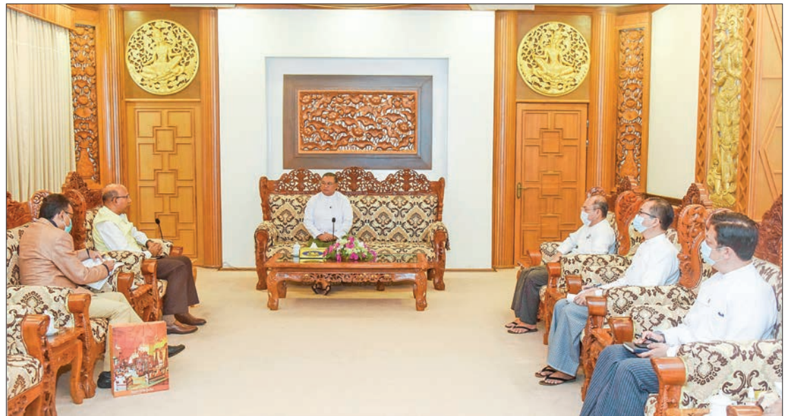
Indian Ambassador Mr Vinay Kumar calls on MoFA Union Minister U Wunna Maung Lwin in Nay Pyi Taw on 26 July 2022.

During the call, they cordially exchanged views on matters pertaining to the promotion of bilateral relations, enhancement of mutually beneficial cooperation as well as close collaboration in the international fora. — MNA