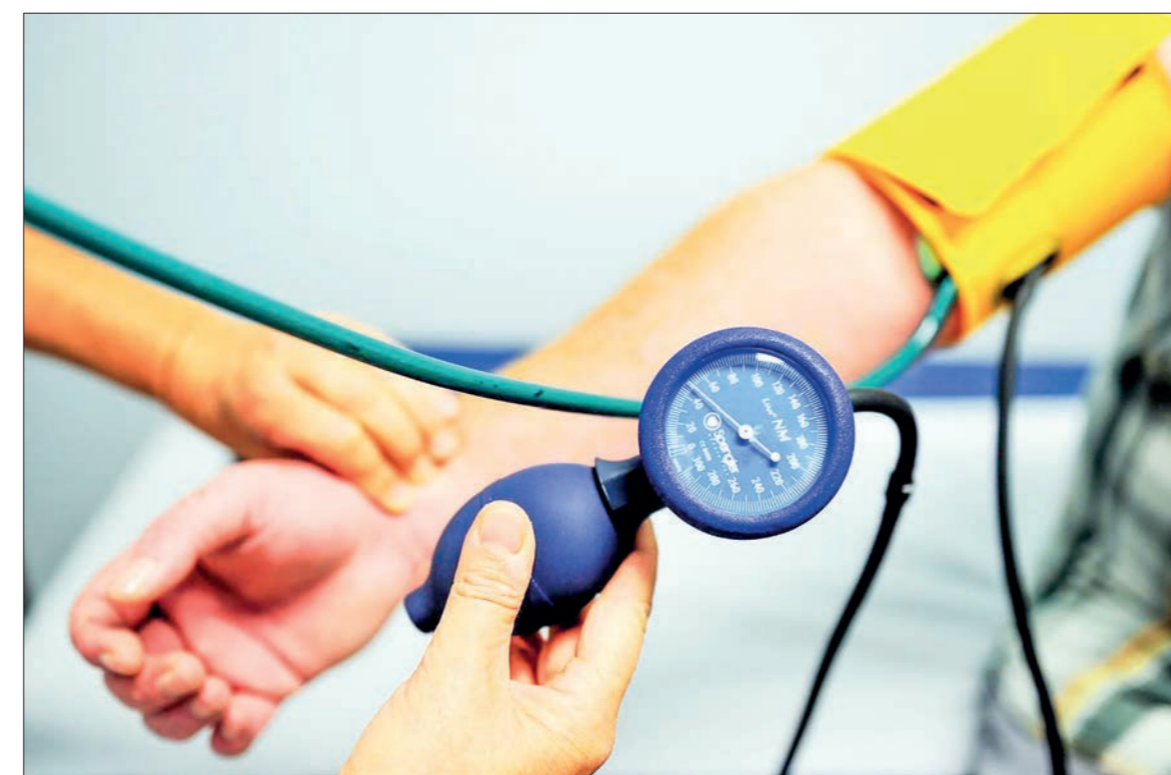
High blood pressure more than doubled a person's risk for hospitalisation from an Omicron-variant COVID-19 infection — even in the presence of full vaccination including a booster dose of the COVID-19 vaccines.

Early in the pandemic, COVID-19 vaccinations assisted in reducing mortality as well as some