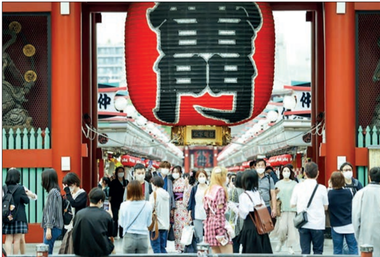
People walk in Tokyo's Asakusa area on 6 May 2022.

THE Japanese government on Tuesday upgraded its key economic assessment for the first time in three months, reflecting a recovery in personal consumption as economic activities continue to return to normal from coronavirus restrictions.