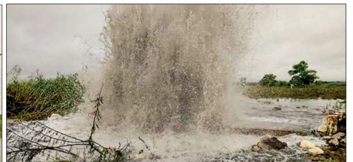
The natural gas pipelines were blown up and destroyed.