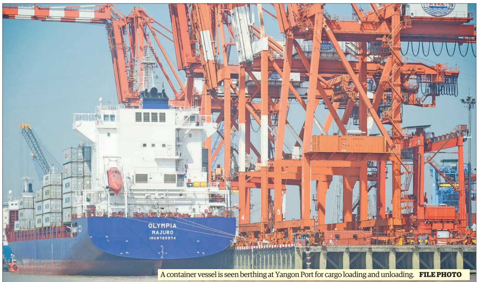
A container vessel is seen berthing at Yangon Port for cargo loading and unloading. FILE PHOTO

In world trade, the maritime route is becoming more beneficial during the global pandemic as it is cheaper than other freight