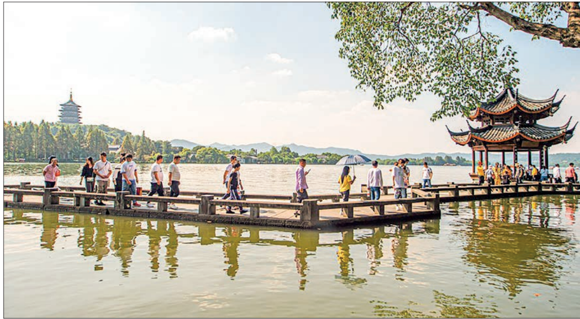
Tourists visit the West Lake scenic area in Hangzhou, east China's Zhejiang Province, 1 October 2020.

FROM lofty mountains in Xinjiang to the courtyard of Naxi culture in Yunnan, tourism in many parts of China is seeing rebounds and looking to upgrade the market.