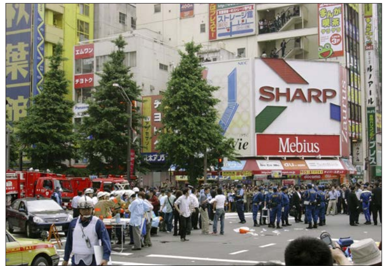
Photo taken 8 June 2008, shows the site of a stabbing rampage at an intersection in Tokyo's Akihabara district. PHOTO: KYODO

The Akihabara district, once known primarily as an electronics mecca, is now better known as a hotspot for Japanese youth culture, drawing fans of manga and anime in particular. The vehicle-free pedestrian zone was suspended for more than two years after the rampage.—Kyodo