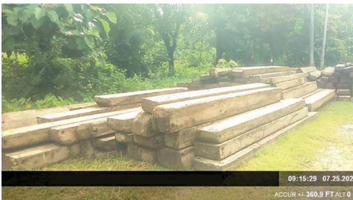
Confiscated illegal timbers.

THE Forest Department of the Ministry of Natural Resources and Environmental Conservation adopts various ways and means, including the Community Monitoring and Reporting System (CMRS), to curb illicit timbers and forest products.