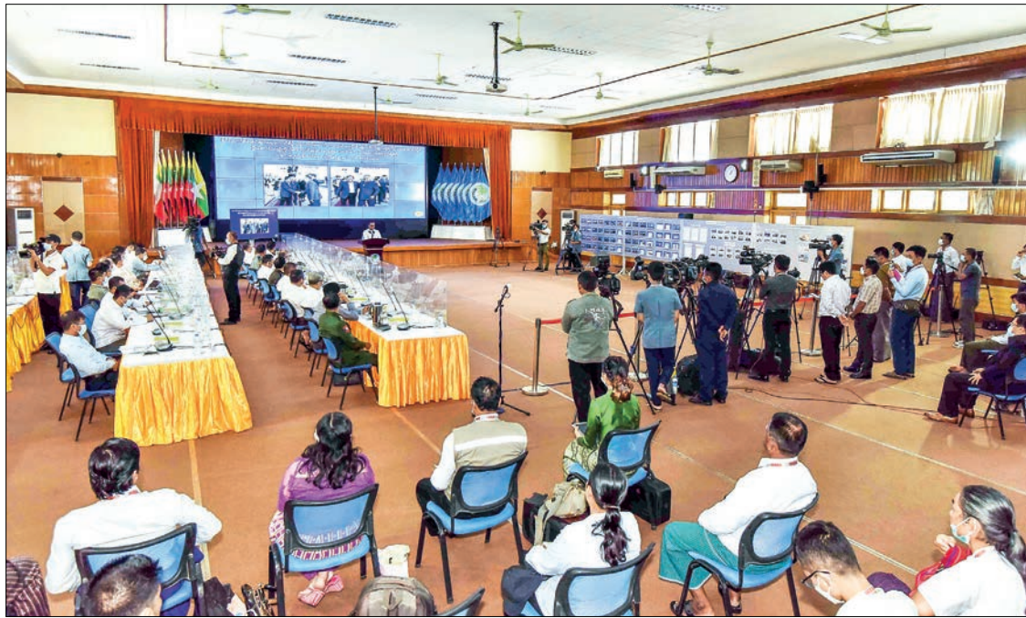
The eighteenth Press Conference of the SAC Information Team is underway in Nay Pyi Taw yesterday.

First, Maj-Gen Zaw Min Tun explained the situation of diplomatic relations between Myanmar and the Russian Federation, the visit of the Myanmar delegation led by the Prime Minister to the federation from 10 to 16 July, and discussions and negotiations