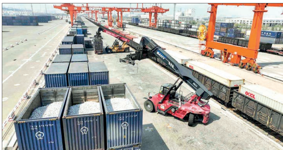
Machinery is seen moving containers at a port in Qinzhou, Guangxi Zhuang autonomous region, in March.

"It used to take about a month for commodities