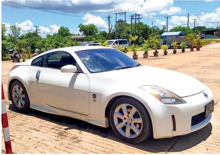
A seized race car in Bago Region.

In addition, on 24 July, a combined team conducted inspections and seized 850 gallons of illegal crude oil worth K1,442,110 in Chauk township. The action was taken under the Myanmar Petroleum and Petroleum Products Law.