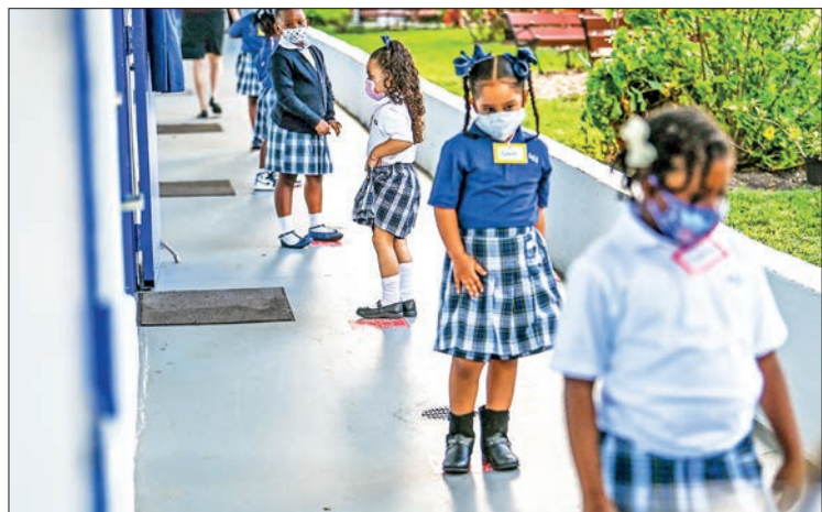
British researchers reported a breakthrough Monday in mysterious hepatitis cases affecting young children, finding the serious liver condition was linked to co-infection of two common viruses, but not the coronavirus.

BRITISH researchers reported a breakthrough Monday in mys-