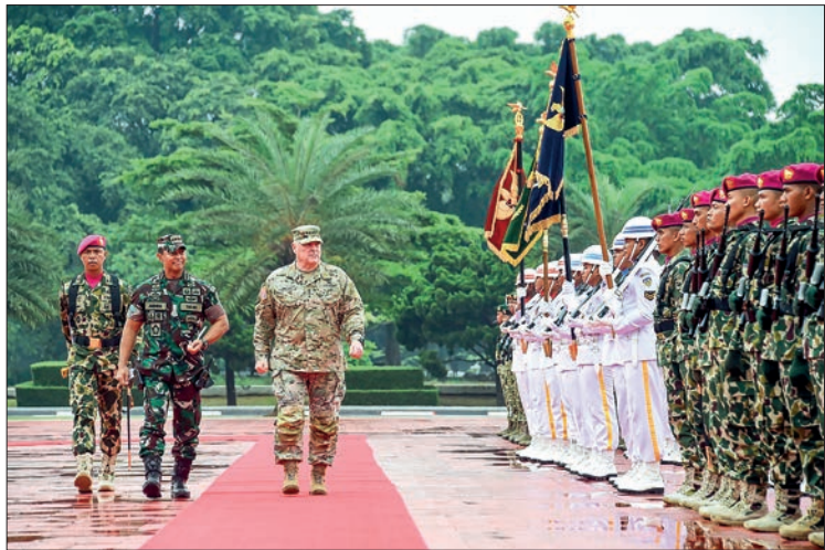
This handout photograph taken on 24 July 2022 and released by the Indonesia Military shows US Chairman of the Joint Chiefs of Staff, General Mark Milley (centre) inspecting the troops in Jakarta.

OVER 4,000 troops from a dozen countries will join an annual joint military exercise between Indonesia and the United States next month amid simmering tensions in the South China Sea, according to Indonesian officials.