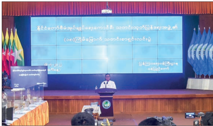
The SAC Information Team leader gives information and facts at the 18 th Press Conference.

In addition, in the case of foreign loan suspension, he said, it is important to have capital and labour availability for the economic recovery in the post-COVID-19 period. A