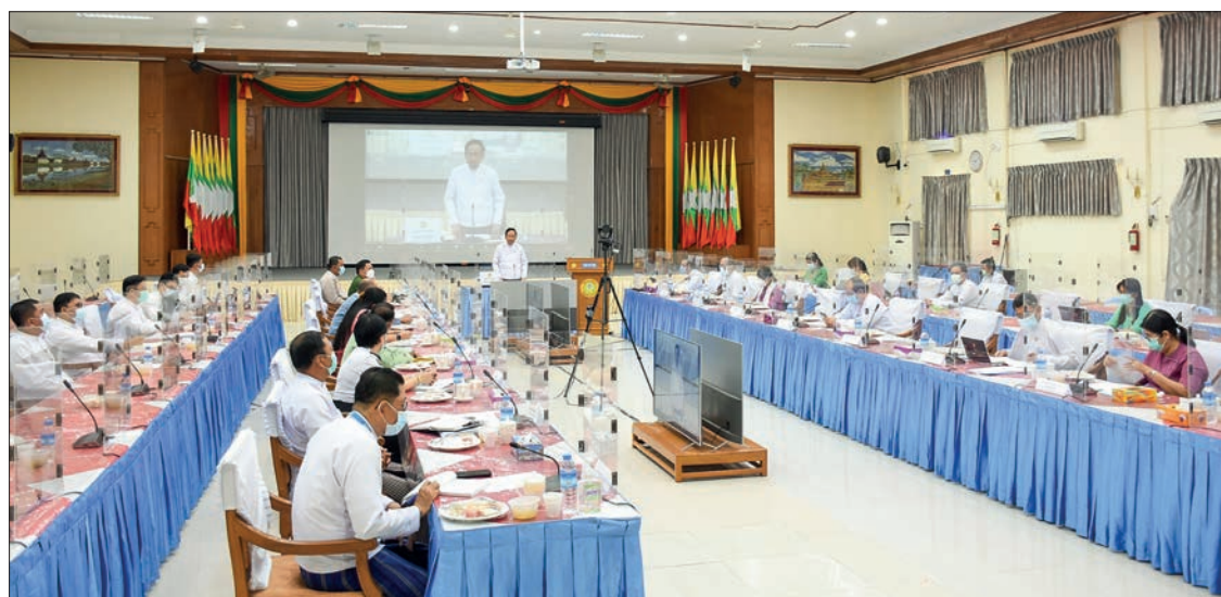
Union Health Minister Dr Thet Khaing Win chairs the coordination meeting on COVID-19 and Monkeypox, which is declared a Public Health Emergency of International Concern by WHO on 23 July.

At this time, as the rate of infection among those returning from foreign countries is increasing, it is necessary to prepare