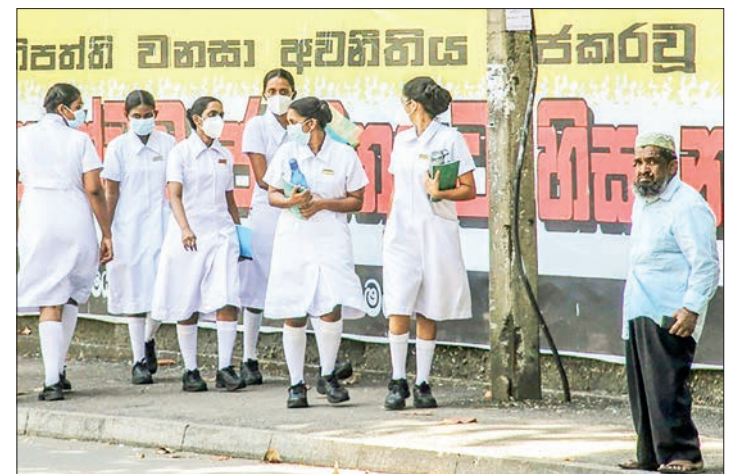
Nurses walk outside the National Hospital in Colombo, where many of its 3,400 beds are lying unused.

"My knees are still swollen. I don't have a home in Colombo. I don't know how long I have to walk." The National Hospital normally caters to people all over the island nation in need of specialist treatment, but it now runs on reduced staff and many of its 3,400 beds are lying unused. Supplies of surgery equipment and life-saving drugs have been almost exhausted, while chronic petrol shortages have left both patients and doctors unable to travel for treatment.—AFP