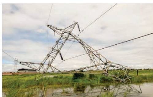
The 132-kV Shwesayan-Tagundine power line was mined down to the ground.