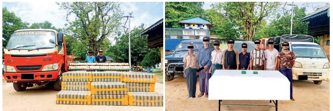
Arrestees are pictured along with seized heroin and vehicles.

heroin, a Hijet vehicle, a Surf vehicle, and a four-wheel double-cab. The total weight of the seized heroin was 77.52 kg and worth K1.93 billion. According to the examination, stockpiled heroin will be carried from Shan State (South) to Mandalay Region and they are prosecuted under respective laws and perpetrators of the crime chain are being investigated and identified, it is learnt. — MNA