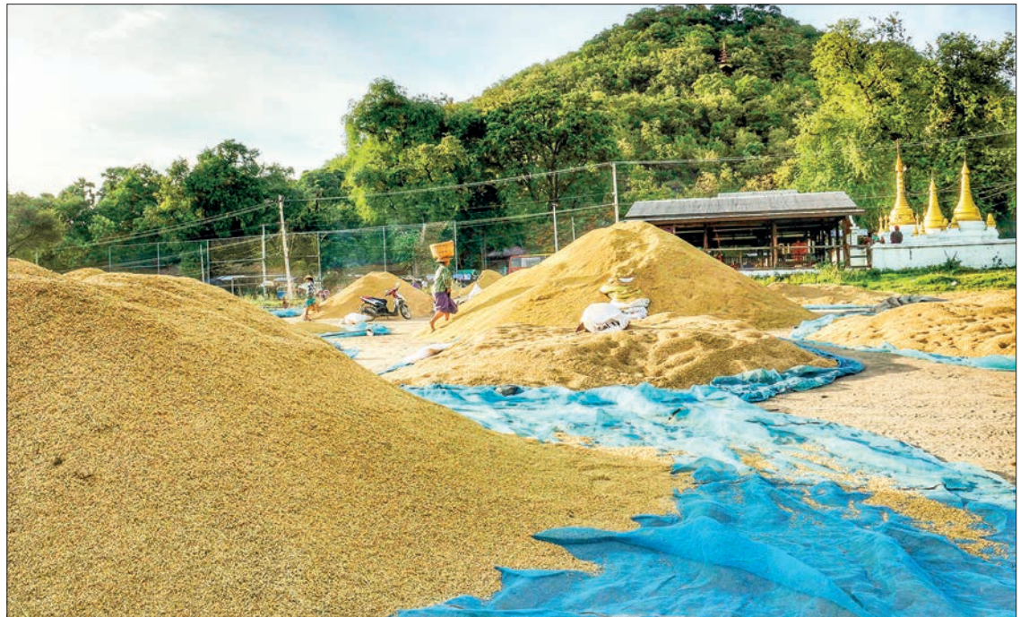
Farmers are pictured drying the harvested paddies.

Each consumer can purchase one to five bags of some rice varieties at the Wadan Rice Wholesale Centre (contact number 09421167474, 01218266-68) every day between 9 am and 3 pm in Lanmadaw Township. This scheme commenced on 14 September last year. — NN/GNLM