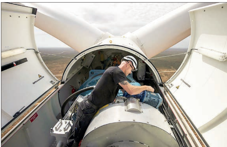
The Sere Wind farm, close to Vredendal, about 350 km from Cape Town.

Ramaphosa said beleaguered public utility firm Eskom, which generates more than 90 per cent of the country's energy will increase the budget for critical maintenance and add new capacity to the grid "on an urgent basis".—AFP