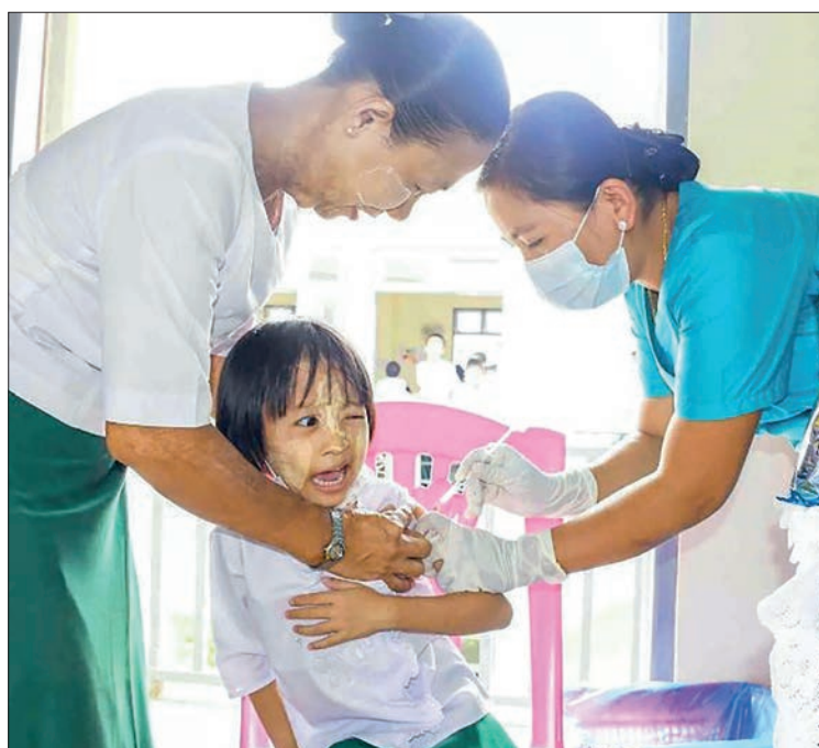
A student in Kyaukpyu Township in Rakhine State gets COVID-19 vaccine shot on 26 July.

Ministry of Foreign Affairs Nay Pyi Taw Dated, 26 July 2022