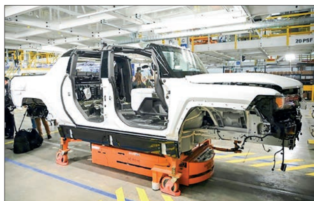
A GMC Hummer EV seen on an assembly line in Michigan is part of the new electric fleet being developed by General Motors, which reported lower profits due to the semiconductor shortage.

GENERAL Motors reported a big drop in second-quarter profits Tuesday due to the grinding