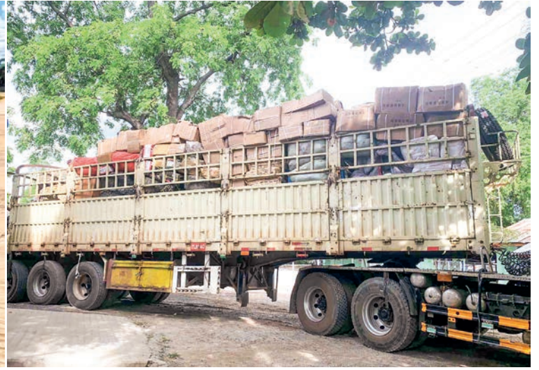
Seized goods on the lorry in Mandalay Region.

In addition, a total of 7.7374 tonnes of illegal timbers worth