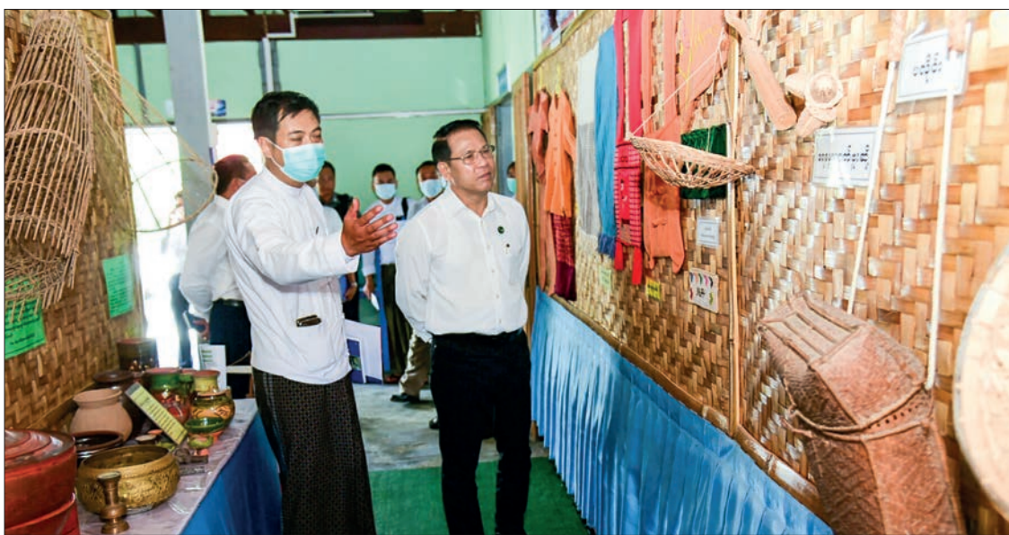
Union Information Minister U Maung Maung Ohn looks into the inside display of IPRD office in Nyaungshwe Township.

THE vocational education books, knowledge books and journals should be kept on priority at the library for the youths, said Union Minister for Information U Maung Maung Ohn during his visit to the IPRD office in Nyaungshwe Township yesterday.