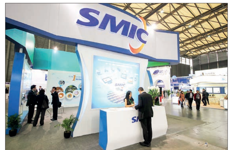
SMIC, China's largest chipmaker, is among Chinese firms banned from receiving US investment due to suspected ties to defence or surveillance technology

US importers are "utterly dependent on Taiwan for the leading edge chips," she said, while China is already investing heavily in its state-sponsored semiconductor industry.—AFP