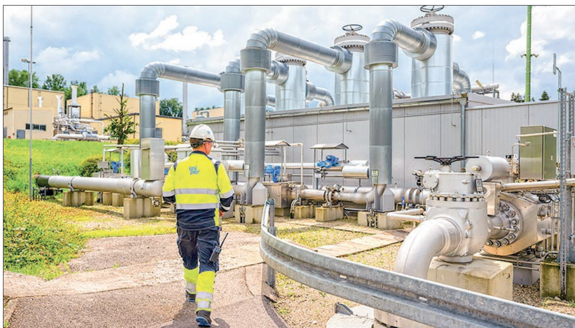
An employee of Uniper Energy Storage walks through the above-ground facilities of a natural gas storage facility at the Uniper Energy Storage facility in Bierwang, southern Germany.

UKRAINIAN President Volodymyr Zelensky on Monday called on Europe to retaliate against Russia's "gas war" by boosting its sanctions against Moscow.