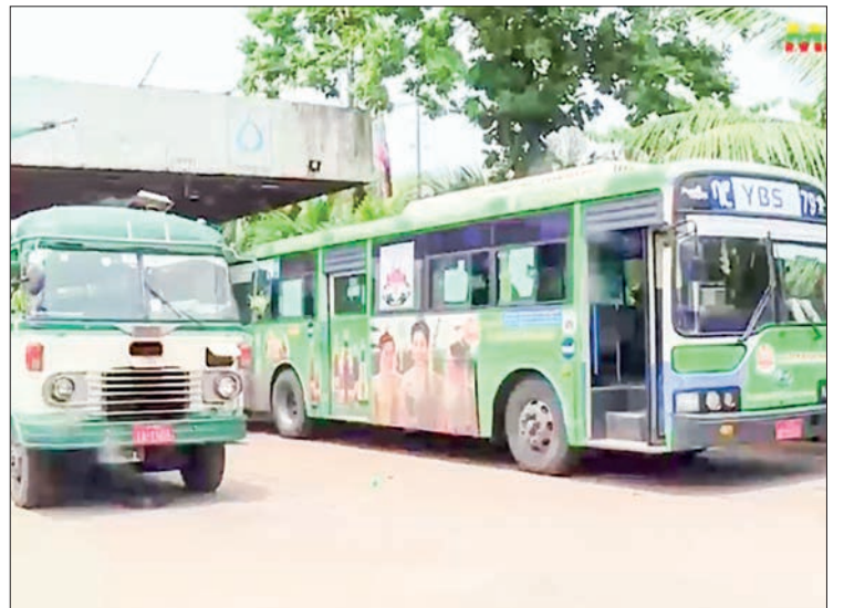
YBS buses are pictured at the CNG filling station.

"I did not see so many buses at the bus stop this morning. The buses run every five or 10 minutes. There would be few buses as they do not get gas today," said Ko Myo Oo from Thingangyun township. The YBS companies also announced that they will reduce the number of buses due to CNG shortages. The number of YBSs between 2,700 and 2,800 are in operation daily in Yangon Region and it distributes 16 million cubic feet of natural gas for these buses. —TWA/GNLM