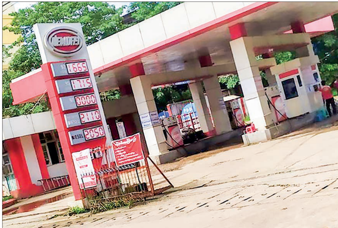
The Newday petrol sign shows fuel prices on 23 July in Sangyaung Township.

Moreover, the Petroleum Products Regulatory Department released the daily fuel ref-