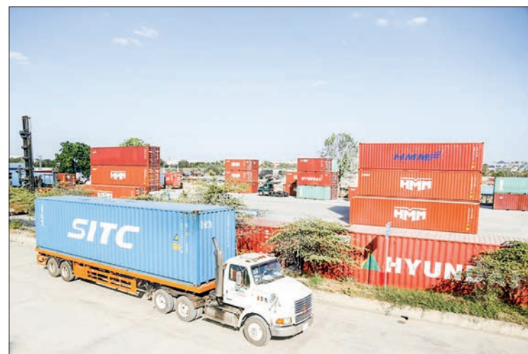
A lorry drives out of the Hong Leng Huor Dry Port on the western suburb of Phnom Penh, Cambodia on 13 January 2022.

CAMBODIA'S total export to other member countries of the Regional Comprehensive Economic Partnership (RCEP) totalled 3.28 billion US dollars in the first half of 2022, up 10 per cent year-on-year, a report of