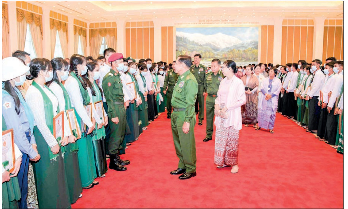
The Senior General and his wife warmly greet Tatmadaw members, students and parents at the event.