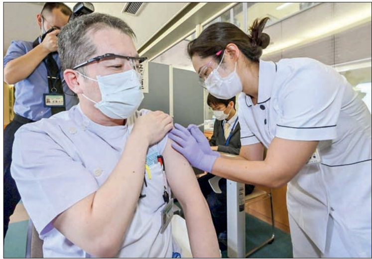
A doctor receives a COVID-19 vaccine shot in the city of Fukui in March.

MEDICAL staff and elderly care workers in Tokyo began to receive their fourth COVID-19 vaccinations on Saturday after the government expanded its eligibility criteria in response to Japan's seventh wave of infections.