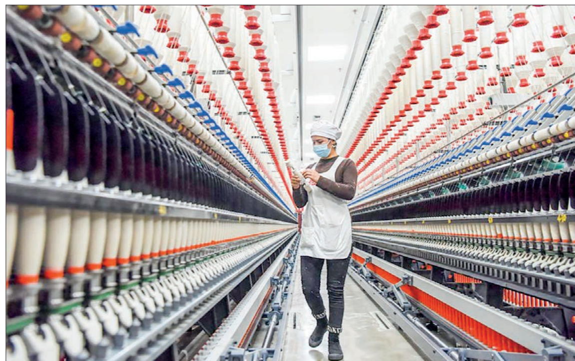
A staff member works in a textile factory at the integrated industrial park in Moyu county of Hotan, Northwest China's Xinjiang Uygur autonomous region, 11 January 2022.

An index tracking the country's logistics market performance stood at 52.1 per cent in June, climbing above the boom-bust line of 50 per cent for the first time after staying in the contraction zone for three months, according to the China Federation of Logistics & Purchasing (CFLP).