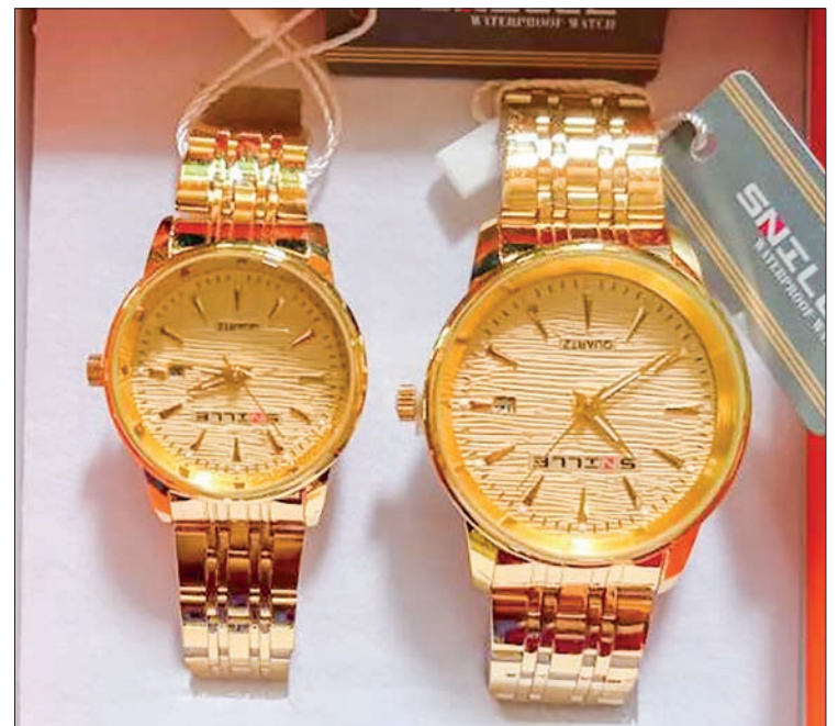
Seized illegal watches in Kawkareik.

Afterwards, the combined on-duty team of the Kayin