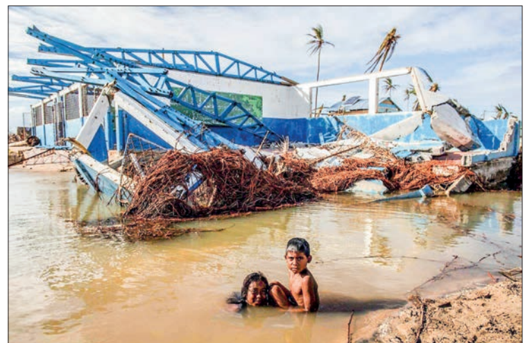
Hurricane Iota caused widespread devastation in Nicaragua in 2020.

The report also documented the third-highest number — 21 — of named storms on record for the 2021 Atlantic hurricane season, and extreme rainfall that caused hundreds of fatalities and destroyed or damaged tens of thousands of homes.—AFP