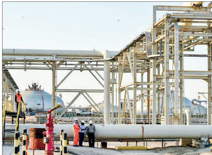
This 20 September 2019 file photo shows a partial view of Saudi Aramco's Abqaiq oil processing plant.

The Saudi-led OPEC oil cartel has been cooperating with a number of other oil-exporting nations including Russia for several years to better control the oil market. The group, called OPEC+, introduced production cuts during the coronavirus pandemic that helped the oil market to recover from a crash in prices