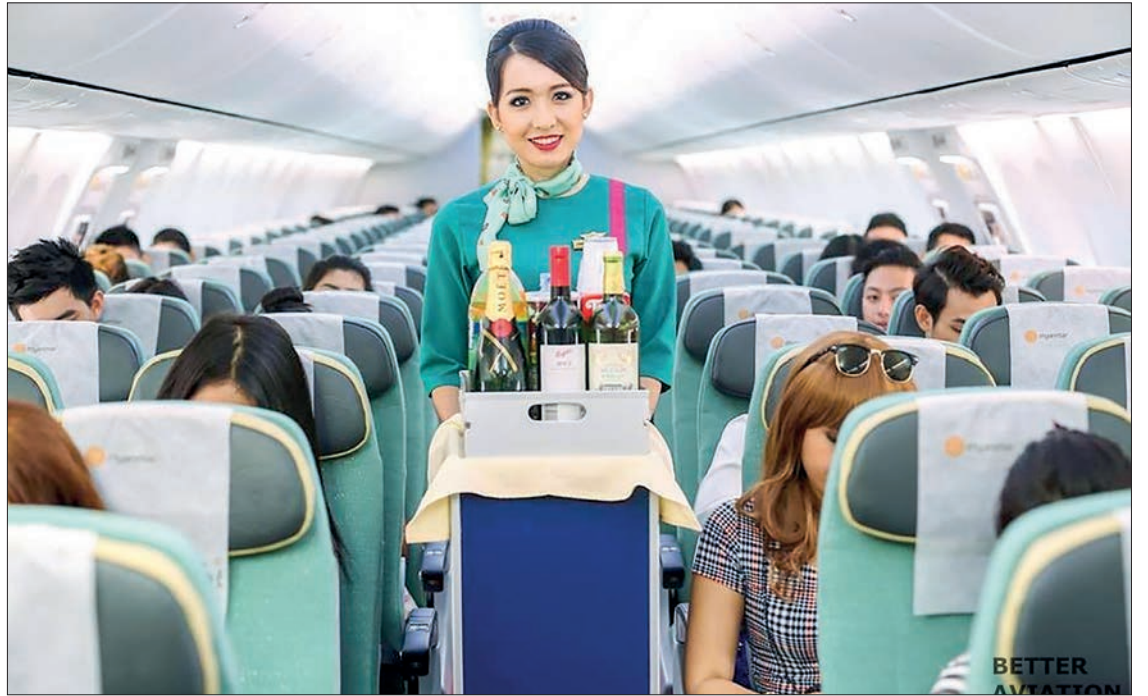
An MNA flight attendant is pictured serving passengers.

Mobile Application Purchases can be made in USD and MMK currencies at MNA Ticketing Counters and Authorized Travel Agents. —TWA/GNLM