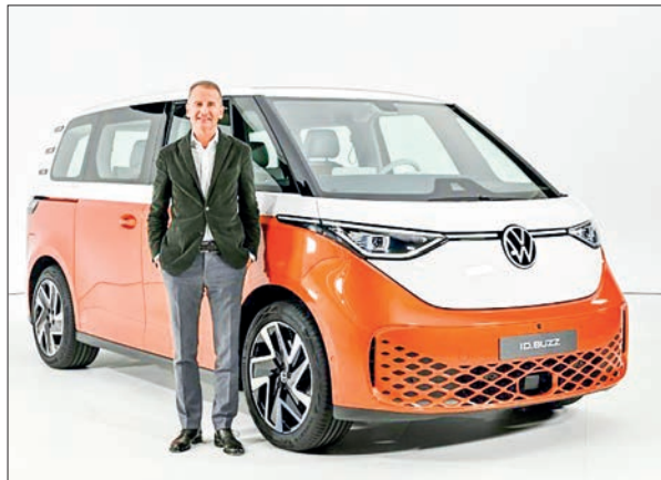
Diess aimed to make Volkswagen the world's biggest manufacturer of electric cars by 2025, but the effort has been slowed by software problems and production delays.

will be made with them individually. The outage beginning 2 July disrupted banking systems, the transmission of weather data, parcel deliveries and network-connected cars, among other things, and prevented users from dialling emergency numbers such as 110 or 119.—Kyodo