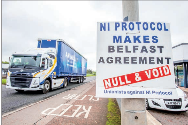
A lorry passes an anti 'Northern Ireland Protocol' sign as it is driven away from Larne port, north of Belfast in Northern Ireland.

THE European Commission on Friday launched four new legal proceedings against Britain over London's failure to implement Brexit divorce terms to govern trade with Northern Ireland.