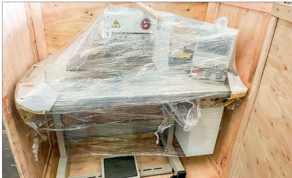
Confiscated items at Myanmar Industrial Port.

State Anti-Illicit Trade Task Force made inspections at the