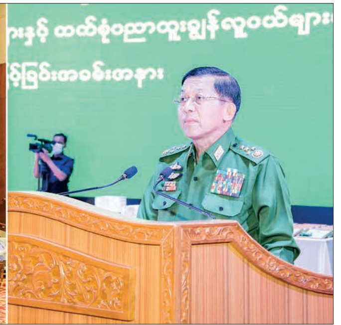
State Administration Council Chairman Commander-in-Chief of Defence Services Senior General Min Aung Hlaing speaks on the occasion of the award-giving event to offspring of military personnel, war veterans and military-substitute civilian servants in Nay Pyi Taw on 23 July 2022.

STUDENTS must try their best to become Myanmar youths who can uplift the prestige of their families and their school as well as the State. They have to try hard to become good students in the student life and good teach-