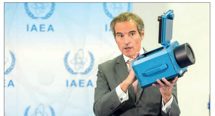
Rafael Mariano Grossi, Director-General of the International Atomic Energy Agency (IAEA), displays a surveillance camera during a press conference in Vienna, Austria, 17 December 2021. Iran is removing 27 surveillance cameras at nuclear facilities, the International Atomic Energy Agency (IAEA) head Rafael Grossi said, calling it a "serious challenge" to the agency's work in the country.

BRITAIN'S spy chief voiced doubt Thursday that a landmark 2015 nuclear accord with Iran can be revived, saying Supreme Leader Ayatollah Ali Khamenei remained opposed despite marathon diplomacy with the United States.