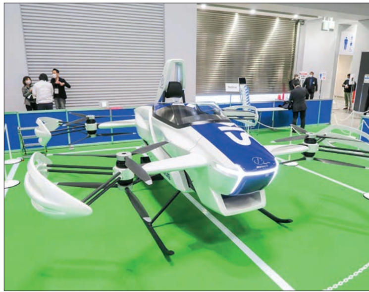
Japan startup SkyDrive is planning to introduce flying cars to transport people for the 2025 World Exposition in the western city of Osaka.