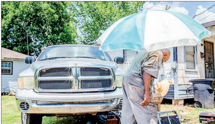
The heatwave, stretching across both sides of the Atlantic, has compelled state leaders to urge people to reduce power consumption. Temperatures in parts of the US have soared to over 100 degrees Fahrenheit (38 degrees Celsius), topping 110 degrees in some areas.

The NWS tweeted Tuesday that 100 million people were under heat-related warnings and advisories, and said on Thursday that a “significant portion of the population” would remain under such warnings over the weekend. Already high temperatures were set to rise further this weekend across the east coast of the United States, where high humidity could push “feels-like” temperatures well above 100 degrees.—AFP