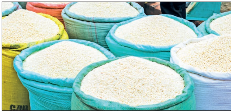
Shwebo Pawsan and other rice varieties are seen at one rice outlet.

It was K54,000-55,000 per bag of Pathein-Myaungmya Pawsan at the wholesale centre while K51,000 per bag of Pyapon Pawsan and K49,000 per bag of Bogale Mawkyun Pawsan.