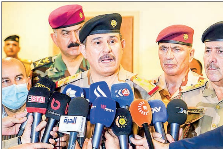
General Mohammed al-Bayati speaks at a hospital in Zakho, Iraq, on Wednesday after a strike killed people at a park in the autonomous Kurdistan region.

"Since 2020, Türkiye's air strikes and military ground operations against the PKK in northern Iraq have intensified," said Shivan Fazil, of the Stockholm International Peace Research Institute. Figures are hard to verify but open sources indicate Türkiye has "a permanent deployment of 5,000-10,000 soldiers in Iraqi territory," according to analysis by Salim Cevik published by the German Institute for International and Security Affairs. —AFP