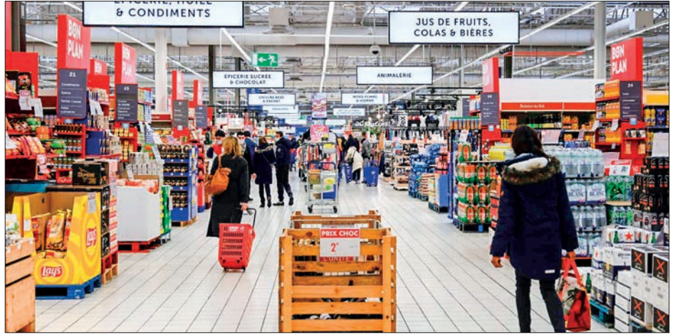
Purchasing power is a major concern for French households, a hot topic that is currently acute.

for projects to provide real solutions to the French people: we succeeded," Prime Minister Elisabeth Borne wrote on Twitter.