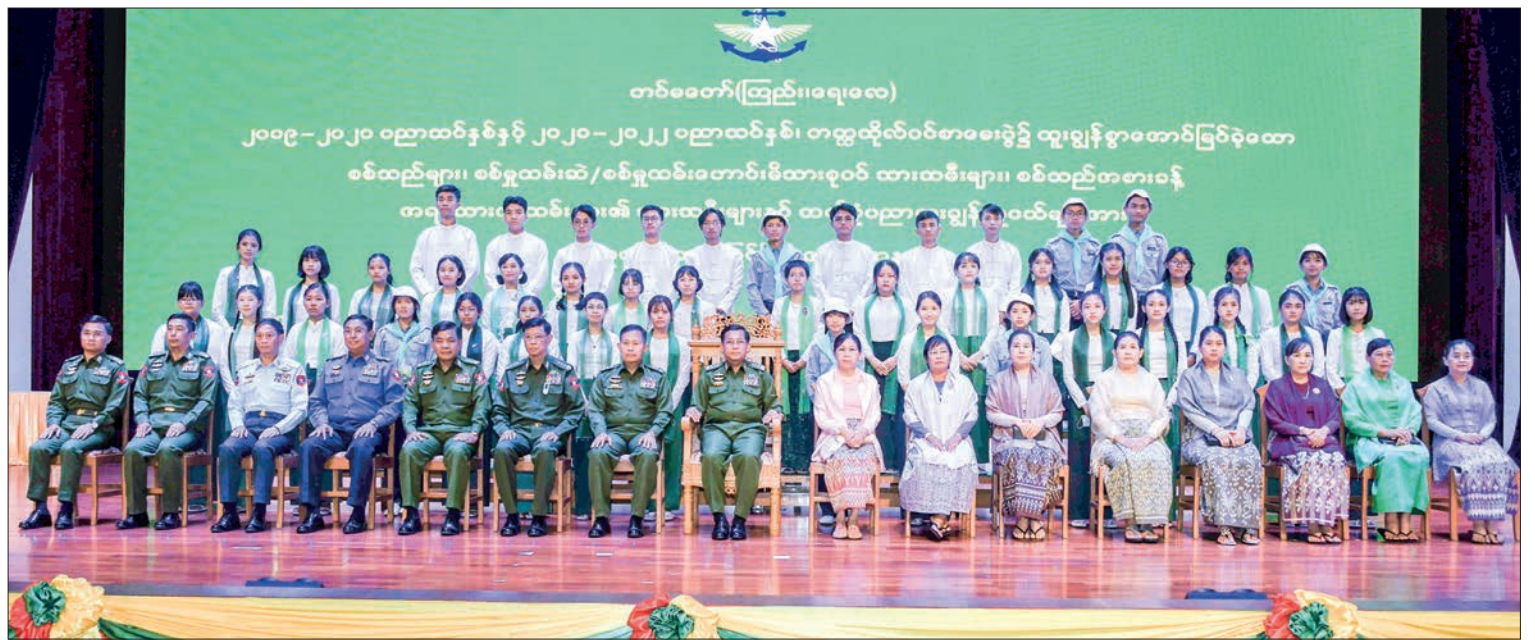
The Senior General and his wife take the documentary group photo at the event.

From 2013-14 AY to 2018-19 AY, a total of 489 students with high marks have been given scholarship awards for learning university education including medical universities, universities of dental medicines, technological universities, universities of computer studies, universities