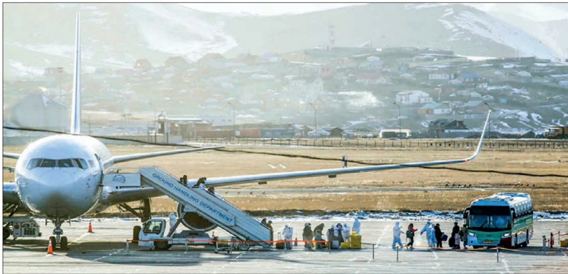
Mongolia reopened its borders to fully vaccinated international travellers on 15 February 2022.

So far, almost 70 per cent of the Mongolian population of 3.4 million has received two COVID-19 vaccine doses, while 32 per cent have received a booster or third dose.—Xinhua