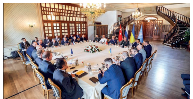
Military delegations from Türkiye, Russia, Ukraine and UN officials attend a meeting to discuss shipment of Ukrainian grain stuck due to blockade of Black Sea ports, on 13 July 2022, at Kalender Pavilion in Istanbul, Türkiye.

The centre will ensure safety in the entryways of Ukraine's harbours and check ships travelling through Turkish ports for weapons, while Russia and Ukraine are barred from attacking any commercial or private sector vessels travelling through the Black Sea. —Kyodo