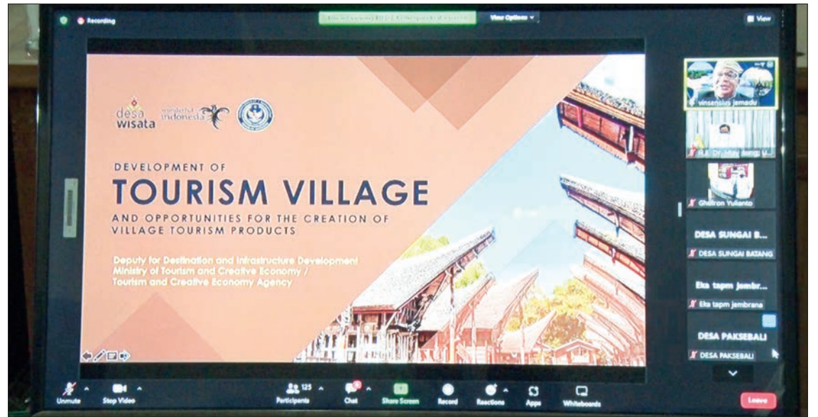
The MoHT Union Minister joins the ASEAN Regional Forum on Village Resource Management for Rural Development and Poverty Alleviation, held with a hybrid system by Indonesia yesterday.

The forum was attended by representatives from ASEAN member countries, the Directors-General and officials from the Ministry of Hotels