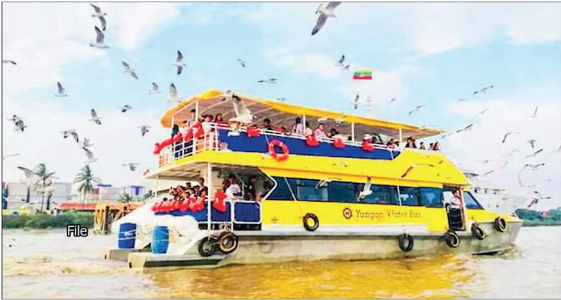
A Yangon water bus is seen in the Yangon River.

THE Yangon Water Bus will resume its services including a budget sunset boat trip, said founder Daw Tint Tint Lwin during a press conference held in Yangon yesterday.