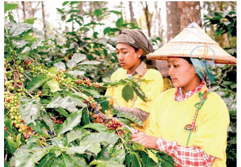
Young female workers are seen plucking coffee fruits on a coffee farm.

The country grows 80 per cent of Arabica and 20 per cent of Robusta. Although the coffee