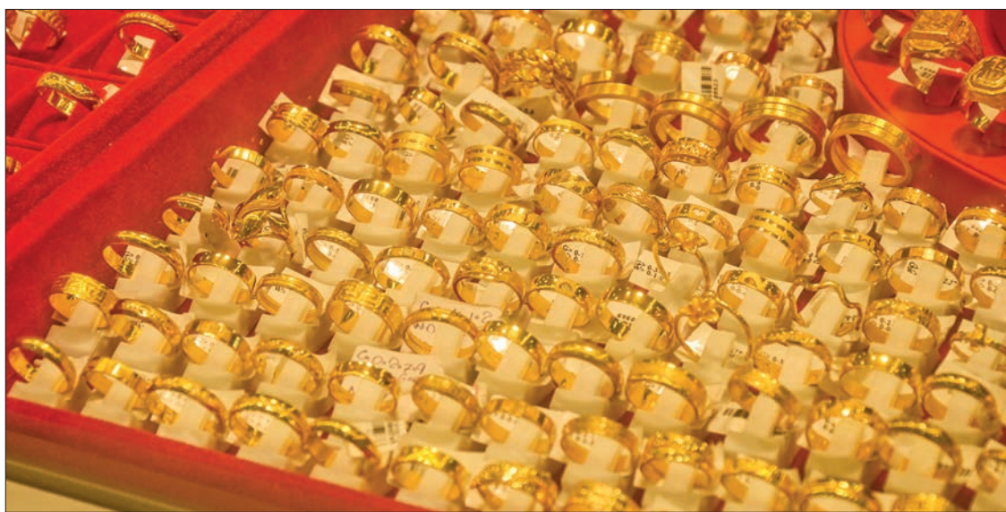
Gold jewellery is pictured at one gold outlet.

DESPITE gold price dip to US$1,700 per ounce in global markets, the price of pure gold continues its gains at K2,060,000 per tical (0.578 ounce, or 0.016 kilogramme), according to Yangon Region Gold Entrepreneurs