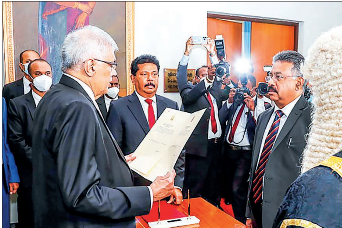
Sri Lanka's six-time prime minister Ranil Wickremesinghe sworn in as president on 21 July with officials saying he would set up an all-party unity cabinet to confront the country's economic crisis.

Public anger boiled over when tens of thousands of protesters stormed the home of then-president Gotabaya Rajapaksa, forcing him to step down and clearing the way for Wickremesinghe's election.— AFP