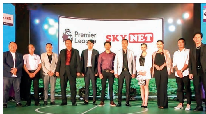
Skynet holds its programme introduction event to broadcast all Premier League matches for the 2022-23 season.

ALL the English Premier League matches of the 2022-2023 football season will be broadcast live by the Skynet TV channel with exclusive rights.