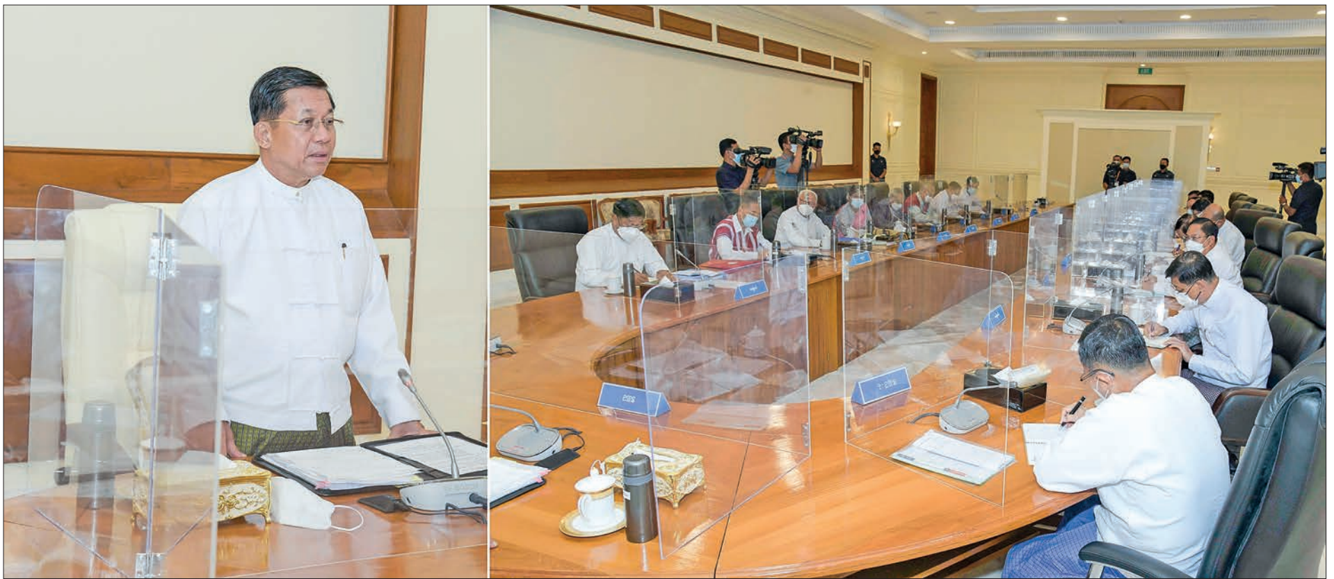
State Administration Council Chairman Prime Minister Senior General Min Aung Hlaing presides over the SAC meeting 6/2022 in Nay Pyi Taw on 21 July 2022.

N O matter what students learn in education at any school, they must have the knowledge to be able to stand on their own after completion of learning, said Chairman of the State Administration Council Prime Minister Senior General Min Aung Hlaing at the SAC meeting 6/2022 at the SAC Chairman Office yesterday.