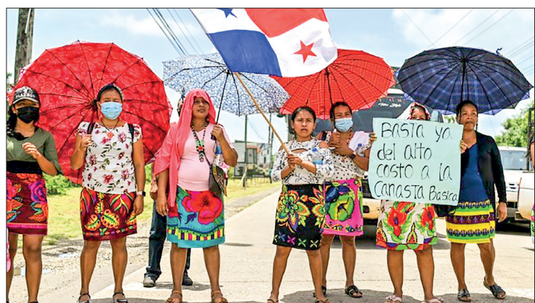
Panamanians are protesting against rising fuel and food prices and government corruption.

The former European Central Bank chief, who was parachuted into the PM's seat in 2021 as Italy wrestled with a pandemic and ailing economy, reprimanded his squabbling national unity coalition on Wednesday and urged them back into line before it was too late.—AFP