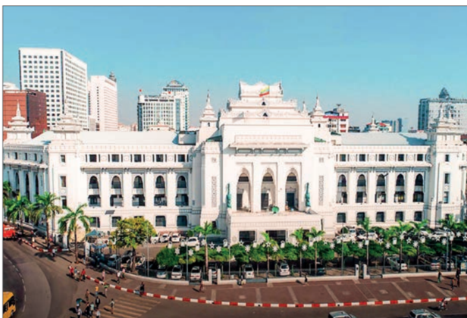
Yangon City Hall or Office of the Yangon City Development Committee.

The Maungtaw and Sittway border camps of Rakhine State export rohu, snapper, black pomfret, ilish, lobster, various dried fish, saltwater fish/prawn, mud crab, soft-shell crab and clams.