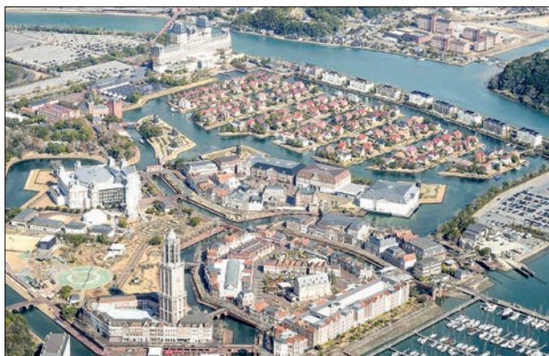
Photo taken in February 2022 shows an aerial view of Huis Ten Bosch theme park, modelled after a Dutch town, in Sasebo, Nagasaki Prefecture.

Meanwhile, the Nagasaki prefectural government has plans to turn the area into a so-called integrated resort, which would include a casino.—Kyodo