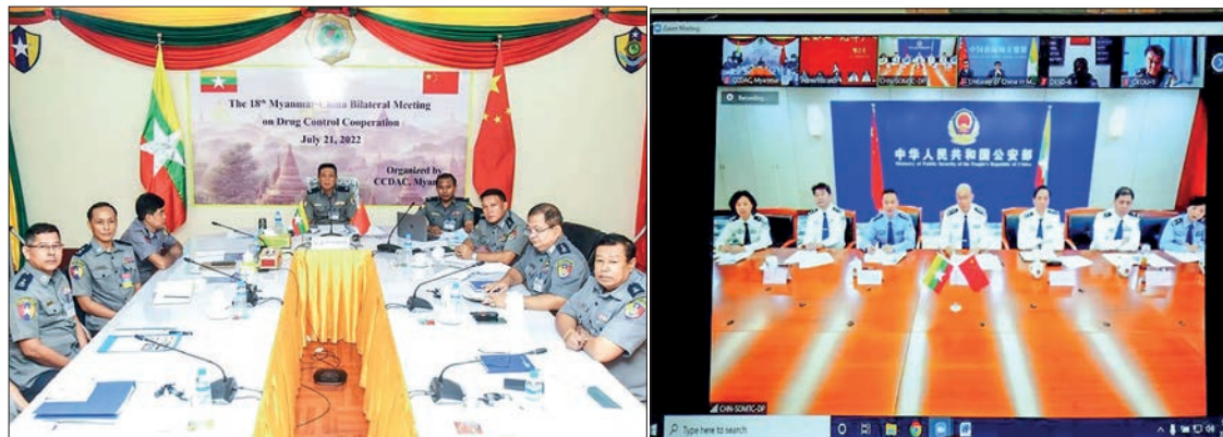
The eighteenth Myanmar-China Drug Control Cooperation meeting is in progress online.