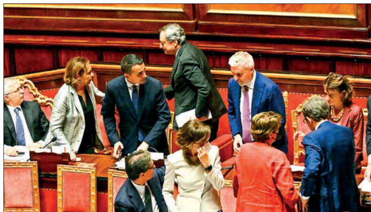
Draghi may stay on at head of the government.

ITALIAN Prime Minister Mario Draghi was expected to resign Thursday after efforts to bring the country's fractious parties to heel failed, kicking off a snap