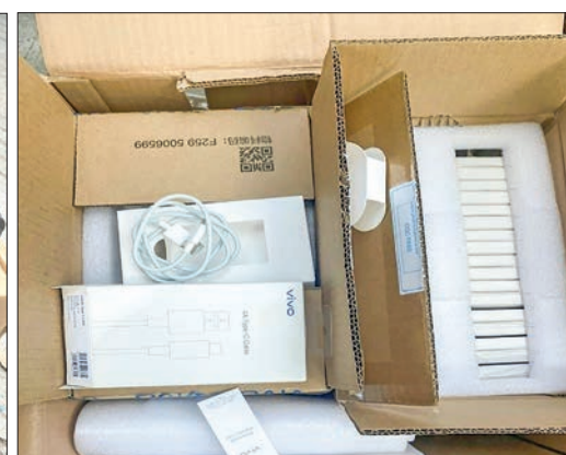
Seized electronics and goods in Mandalay Region.