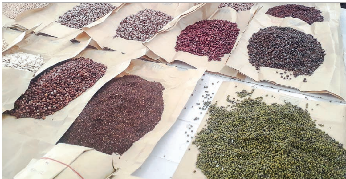
Myanmar conveyed $395.703 million worth of over 522,332 tonnes of beans and pulses to foreign trade partners between 1 April and 8 July 2022 in the current financial year 2022-2023.

Moreover, India agrees to purchase 250,000 tonnes of black gram and 100,000 tonnes