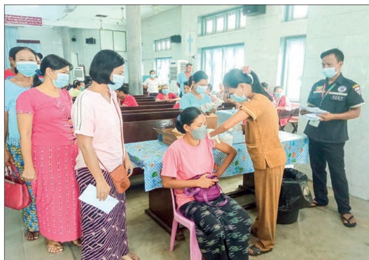
A local in Toungoo Township in Bago Region gets COVID-19 vaccine shot on 21 July.

DOCTORS and nurses from public hospitals, Tatmadaw medical teams, healthcare workers and volunteers are working hard to give COVID-19 vaccines in different states and regions as the vaccination programme is one of the most important activities in the prevention, control and treatment of COVID-19 disease.