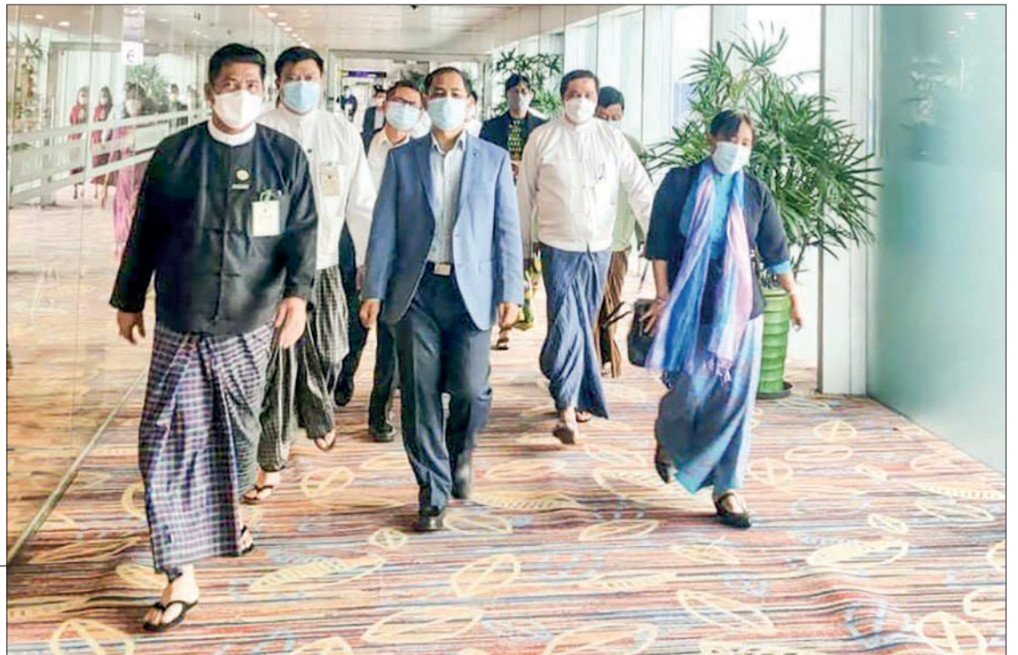
Myanmar delegation are seen off at Yangon International Airport before departing for the Netherlands on 20 July.

It is learned that the Myanmar delegation arrived at the Amsterdam International Airport at 06:35 am on 21 July 2022 and Ambassador U Soe Lynn Han and officials from the Myanmar Embassy in Brussels welcome the delegation at the airport. — MNA