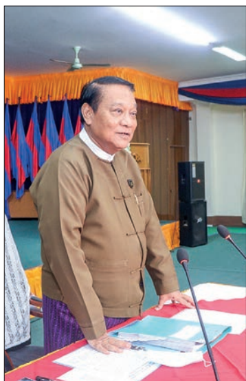
MoIP Union Minister chairs the coordination meeting to grant permanent resident permits yesterday.