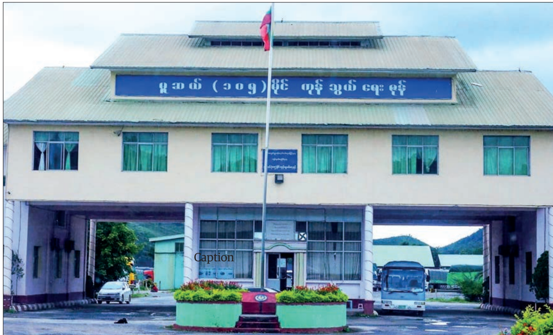
The Muse 105 th -Mile Trade Zone on the Sino - Myanmar border.

Prior to 16 May, China banned Myanmar trucks and drivers to enter its side owing to the COVID-19 restrictions and only Chinese short-haul drivers were allowed to transport the goods. This causes the problem of delays and bulk supply owing to the lack of Chinese short-haul truckers, prompting the operators to charge the transporta-