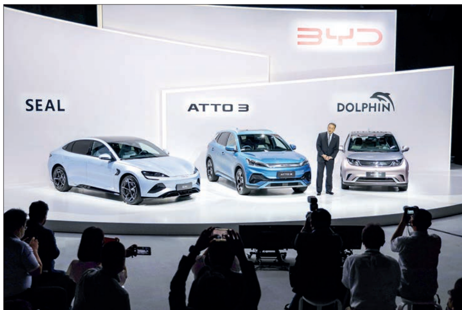
The Japanese unit of Chinese electric vehicle maker BYD Co. holds a press event in Tokyo on 21 July 2022, to announce its entry into the Japanese vehicle market.

sedan, to become available in 2023 or later, both have cruising ranges of around 500 km. The announcement comes on the heels of Mercedes-Benz Japan Co. announcing it will increase its EV models from two to five this year, while Audi Japan, the Japanese unit of German luxury automaker Audi AG, has doubled the number of models to eight from the previous year.—Kyodo