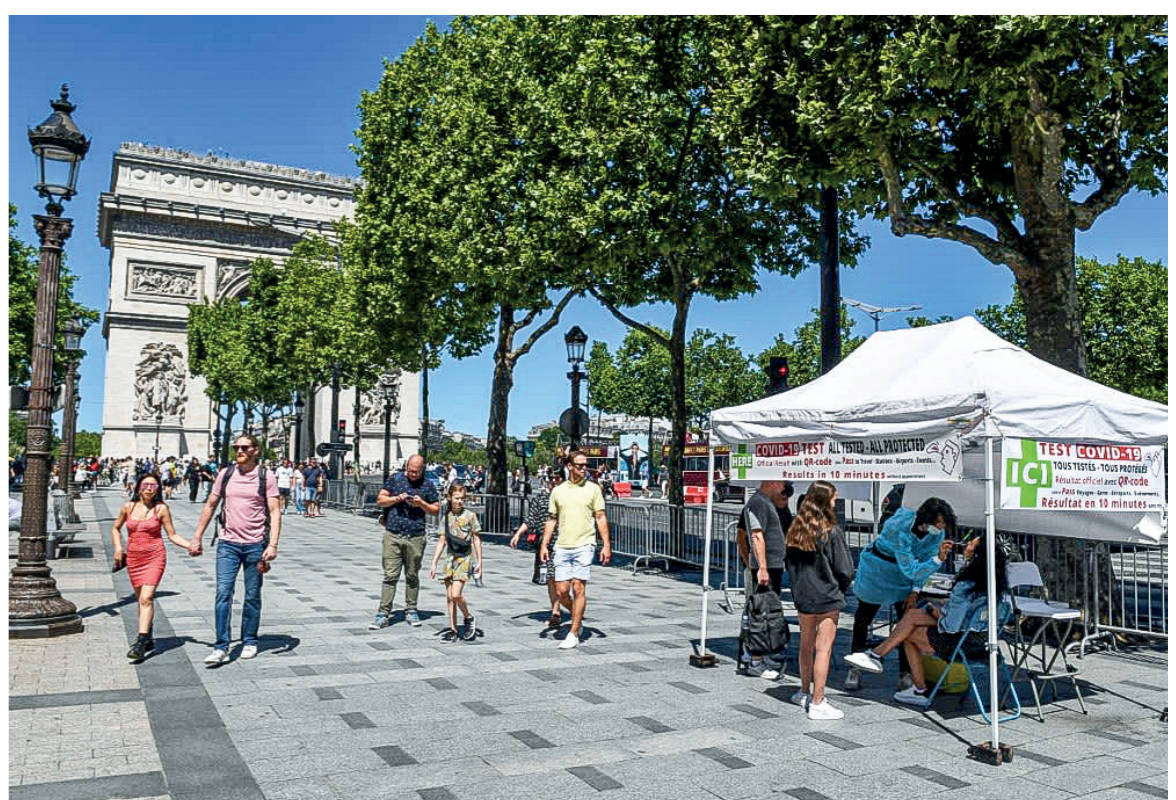
Tourists get tested with an antigenic test for Covid-19 near the Arc de Triomphe in Paris on 10 July 2022.